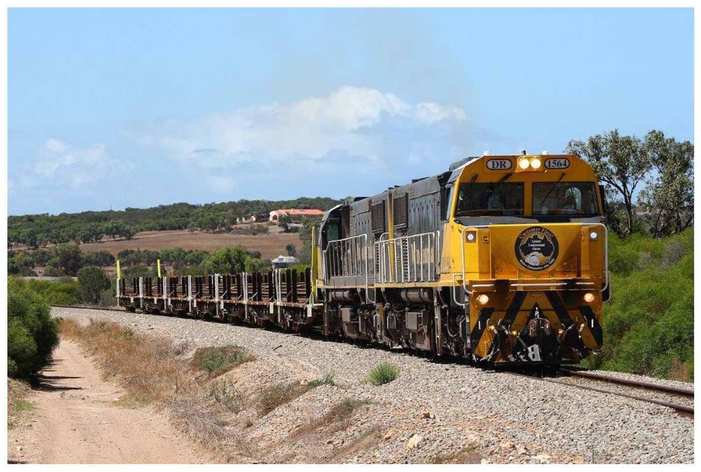
5RT1 rolls through Bonniefield behind DRs 1564 & 1565, 30^{\rm th} January.