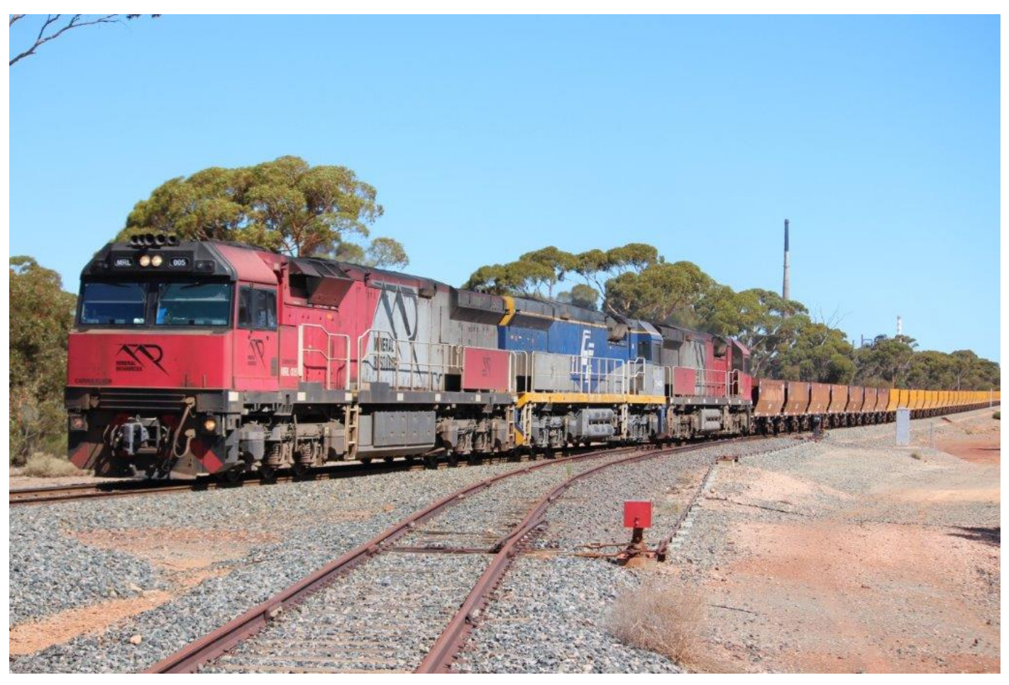
MRLs 005 & 001 sandwich CF4405 on 2036 empty ore departing Hampton, 27/1.