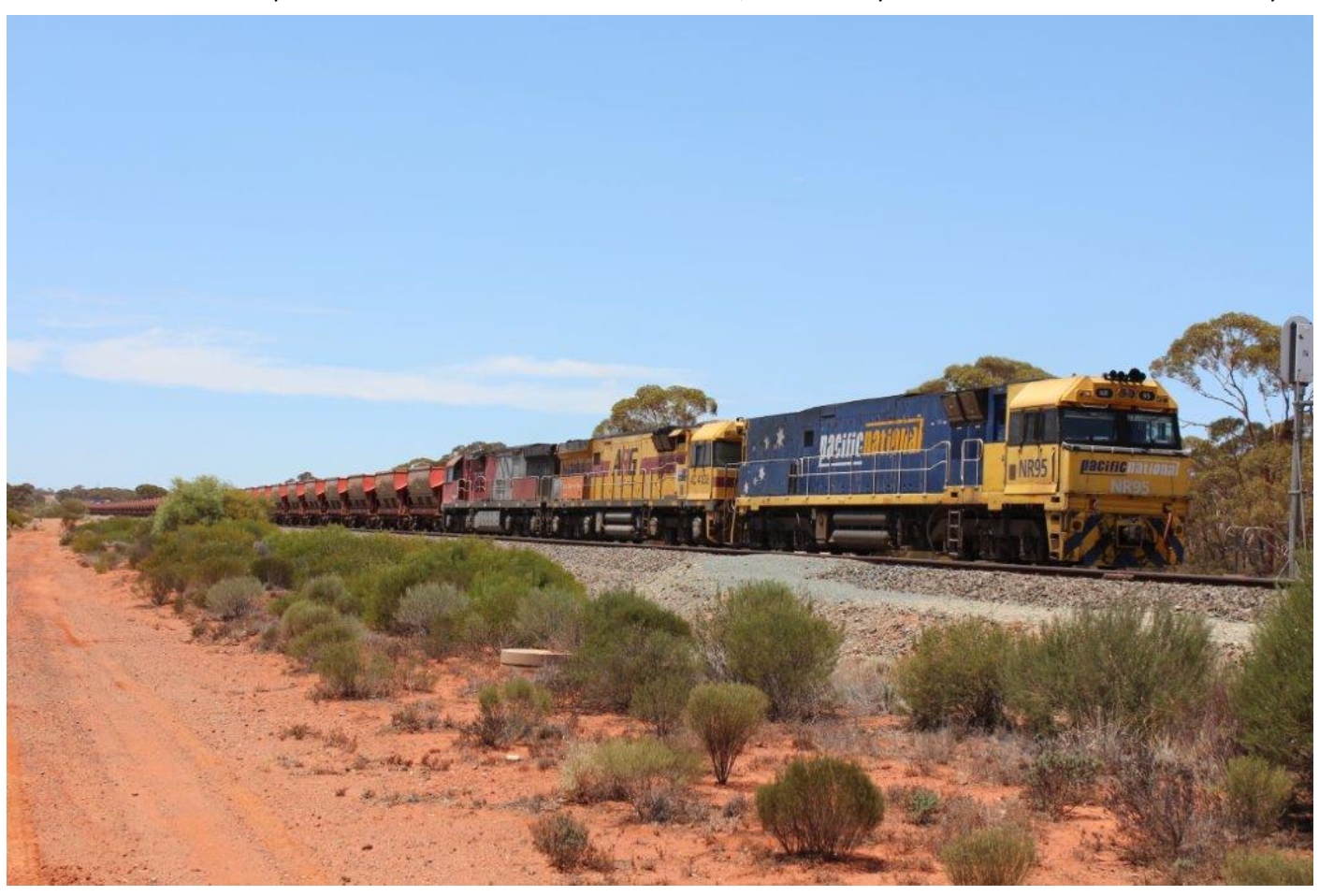
NR95, AC4308 & MRL003 arrive at Binduli with 7030, empty MHPYs.