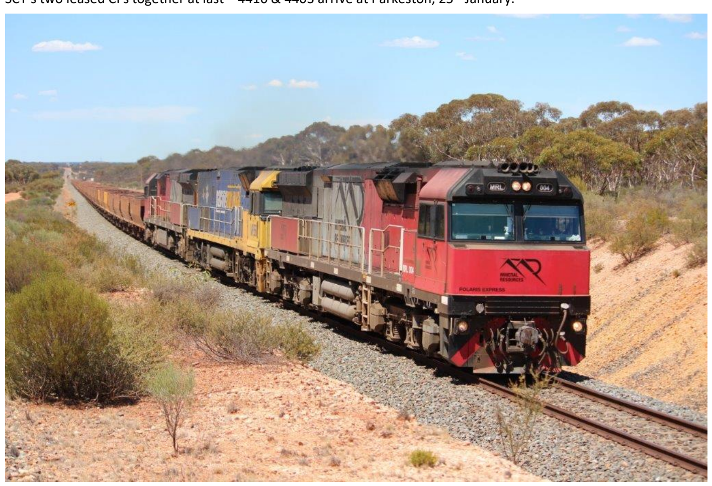
1030 empty ore departs Binduli behind MRL004, NR56 & MRL006, 26^{th} January. Page 5 of 12