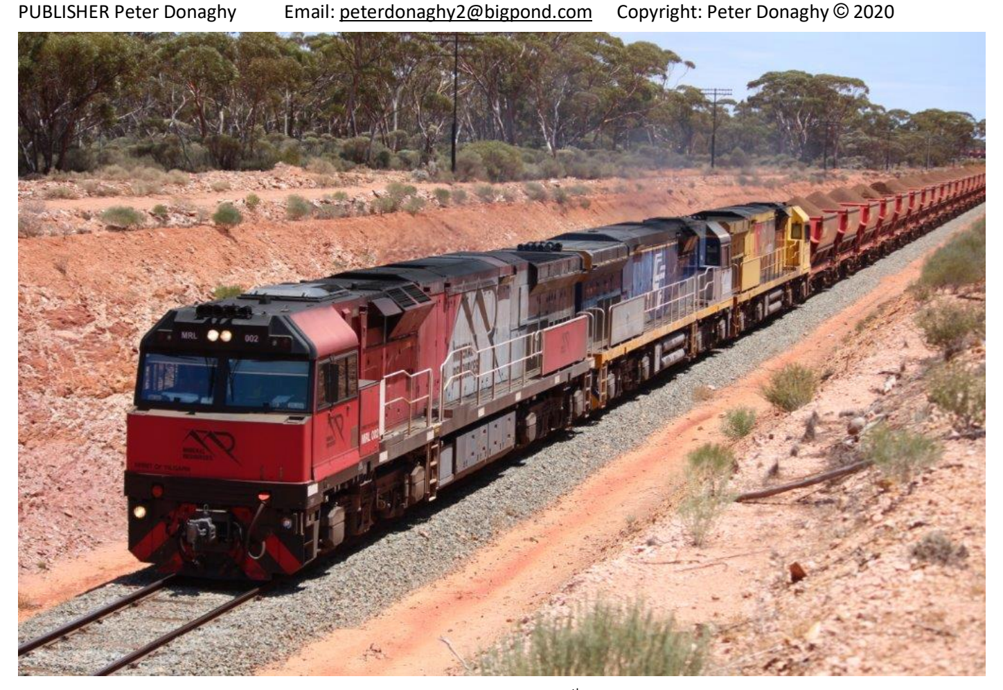
MRL002, CF4406 & ACC6032 depart Binduli on 1033 loaded ore, 19th January.

NUMBER 1_2 A free monthly photo e-Mag of railway happenings in WA during January 2020