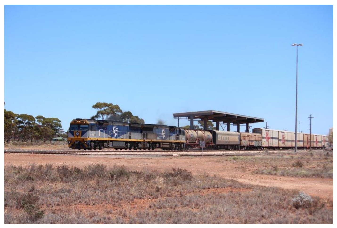
CFs 4403 & 4410 enter Parkeston with 1PM9, 27<sup>th</sup> January.