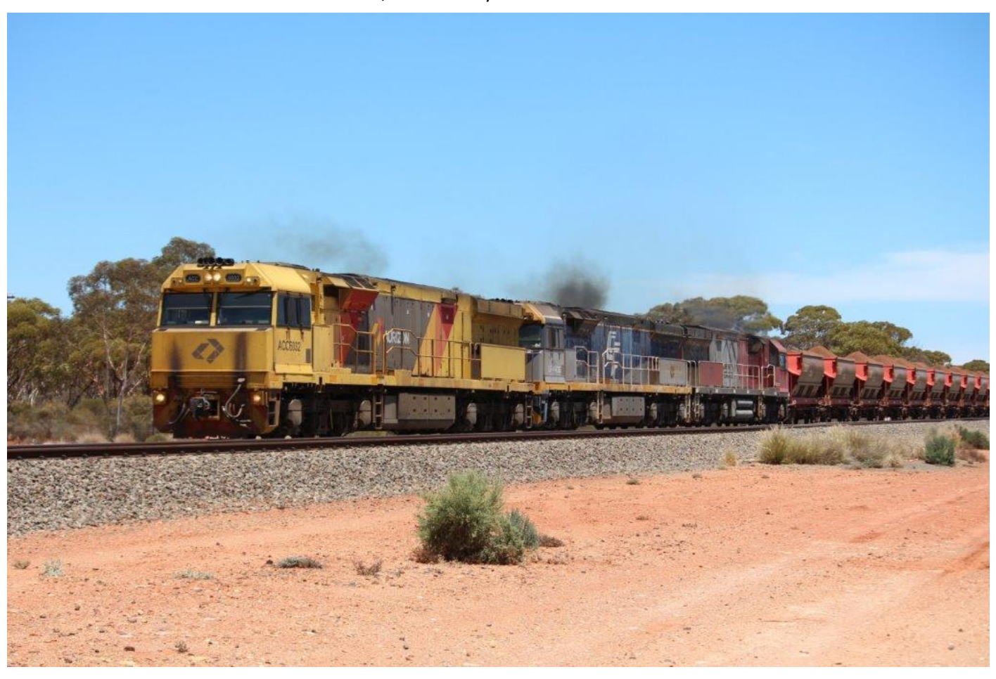
ACC6032, CF4406 & MRL002 enter Binduli west leg with 2033 loaded ore, 27^{th} January. Page 7 of 12