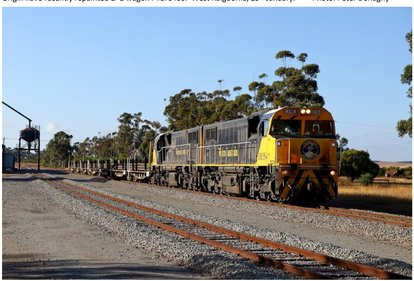
DRs 1564 & 1565 on 5RT1 rail train, Arrino, 30<sup>th</sup> January.