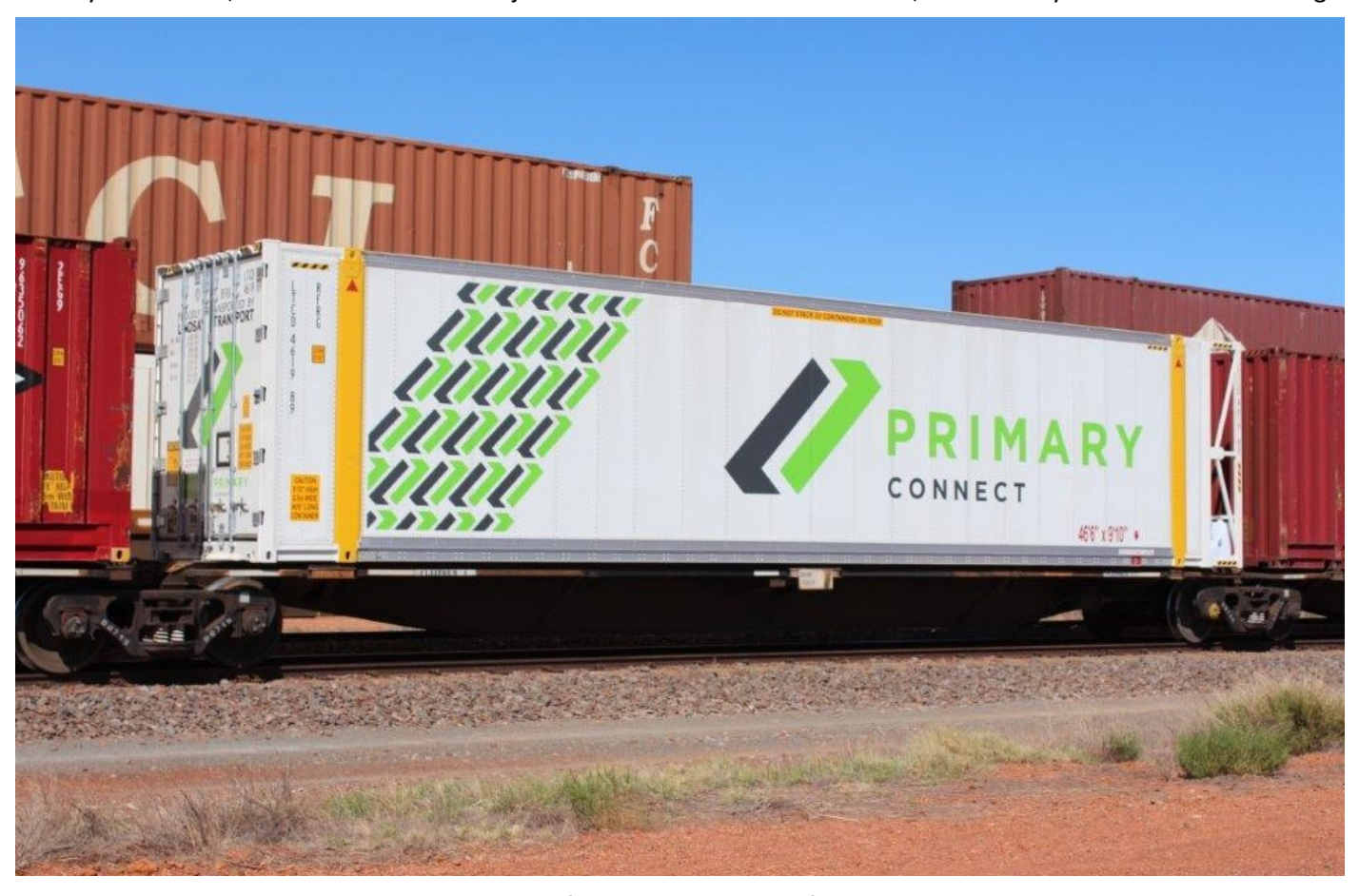
Lindsay Transport commissioned ninety new reefers during 2019, the final two painted in an eye-catching special livery for Primary Connect, a division of Woolworths. Parkeston, 25<sup>th</sup> January. Page 4 of 12