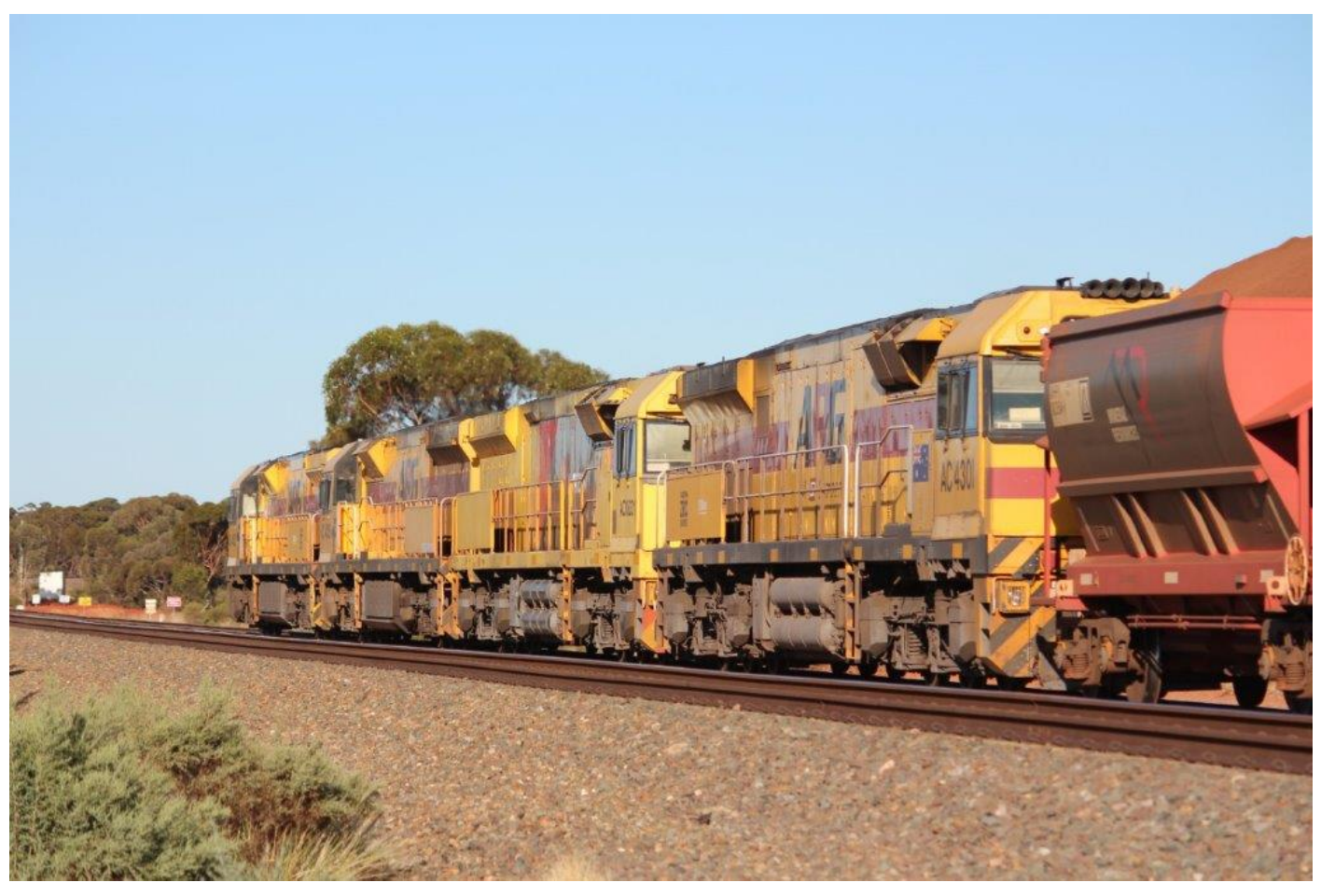
2AU1 Aurizon ore service enters Binduli (above) and departs (below) behind AC4306, AC4305, ACC6031 & AC4301 near sunset on 27<sup>th</sup> January. This was the second trip by Aurizon.