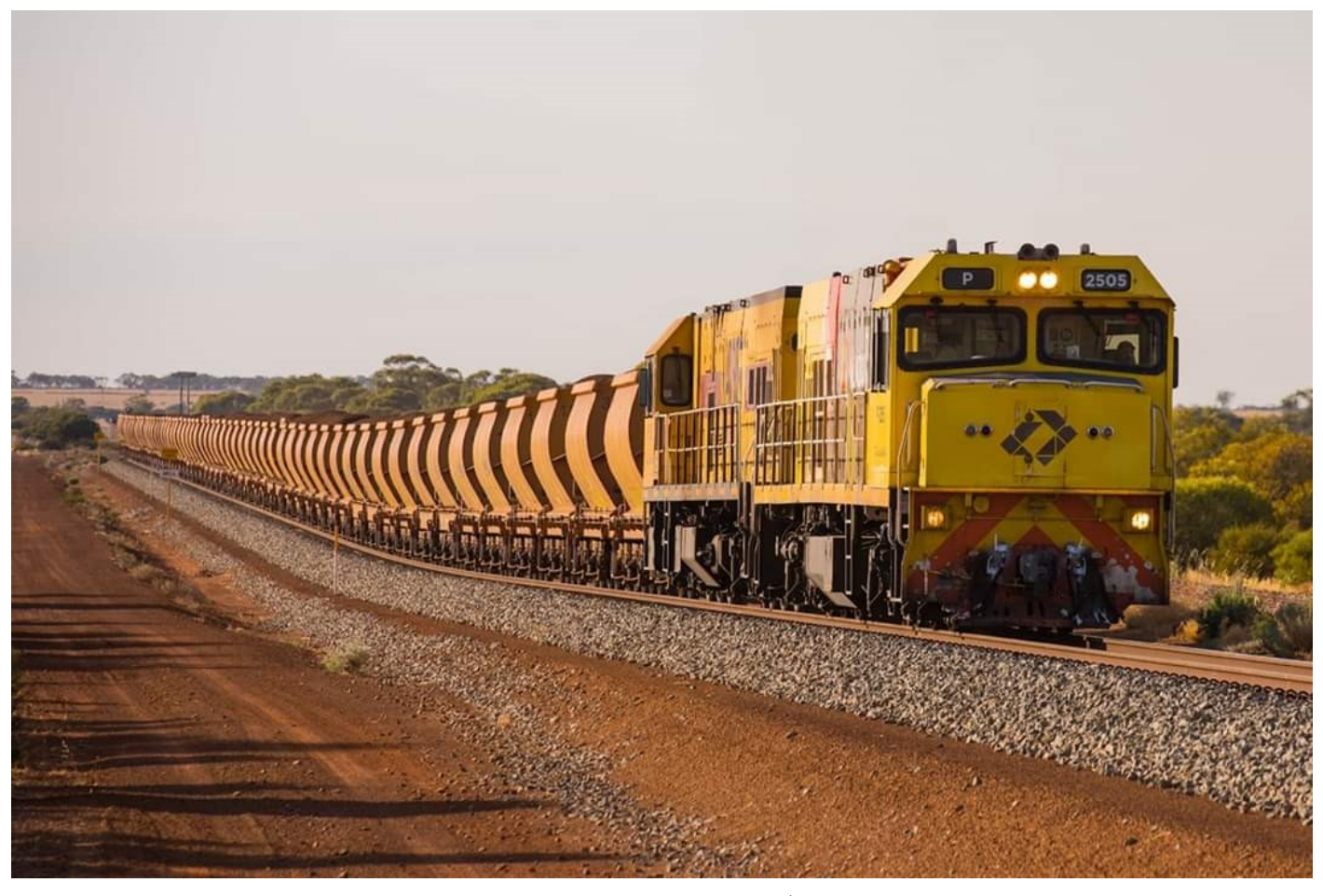
7721 loaded Mt Gibson powers out of Bell behind Ps 2505 & 2502, 25<sup>th</sup> January.