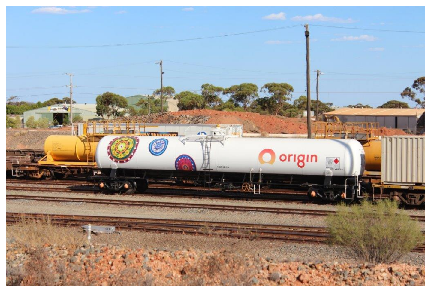
Origin have recently repainted LPG wagon PTLY6406. West Kalgoorlie, 29<sup>th</sup> January.