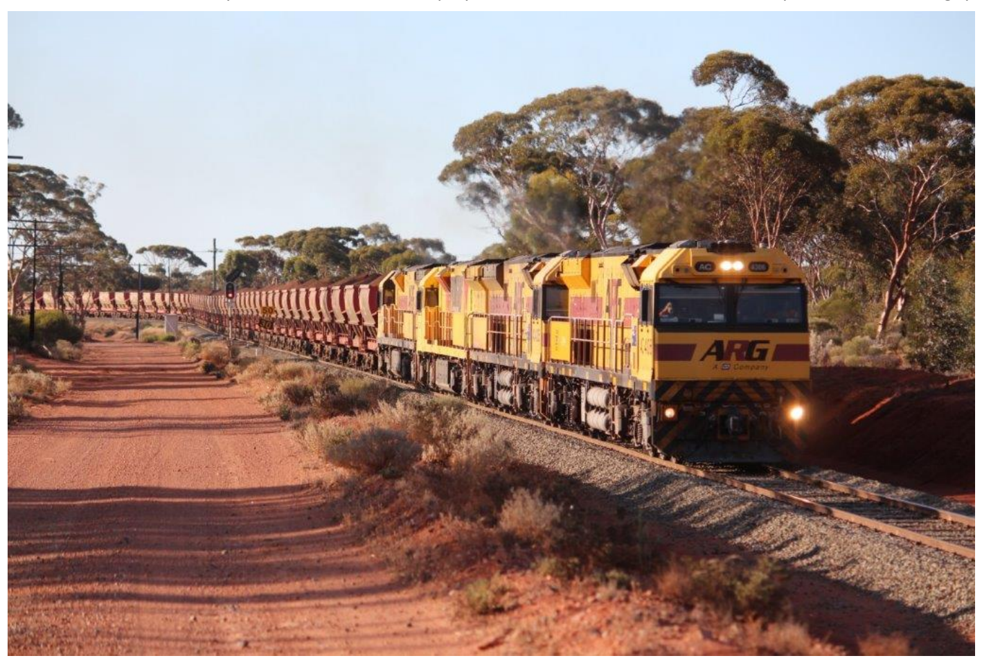
Page 9 of 12