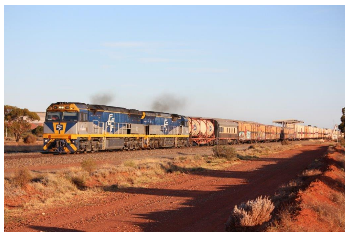
SCT's two leased CFs together at last – 4410 & 4403 arrive at Parkeston, 25<sup>th</sup> January.