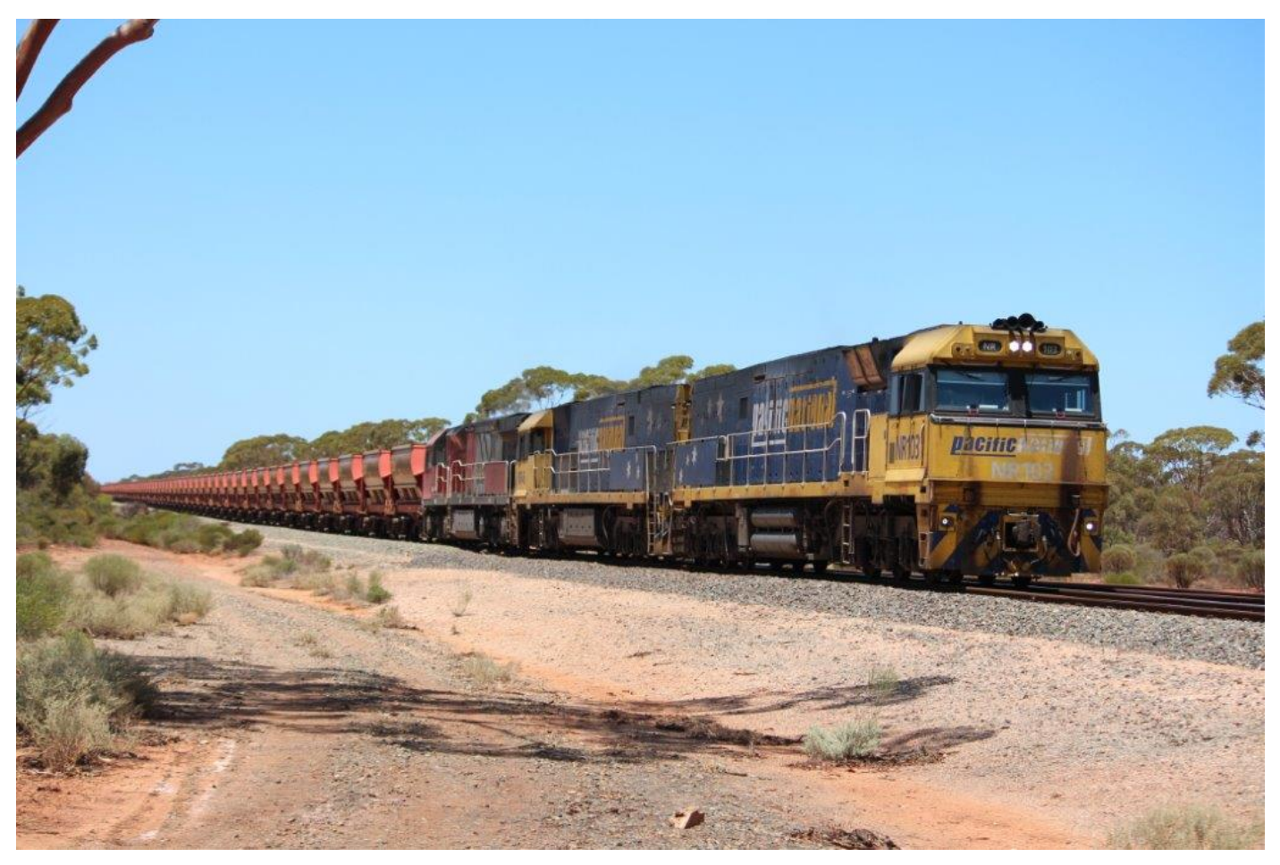
NRs 103 & 46 lead MRL003 and an empty MHPY rake as 1030 away from Hampton, 19/1.