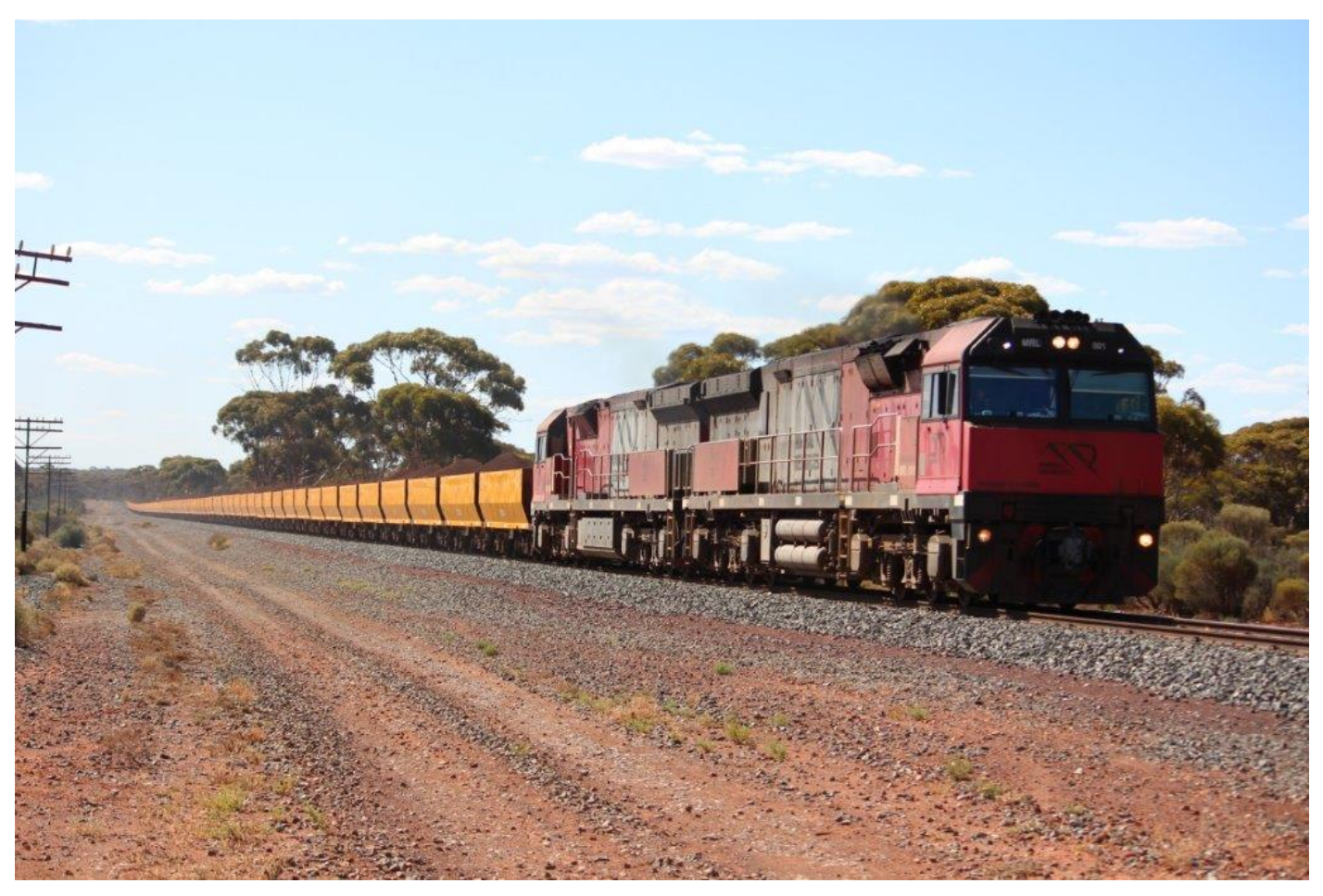
MRLs 001 & 005 lead a shortened WOE rake as 1033 between Binduli and Hampton, 26/1.