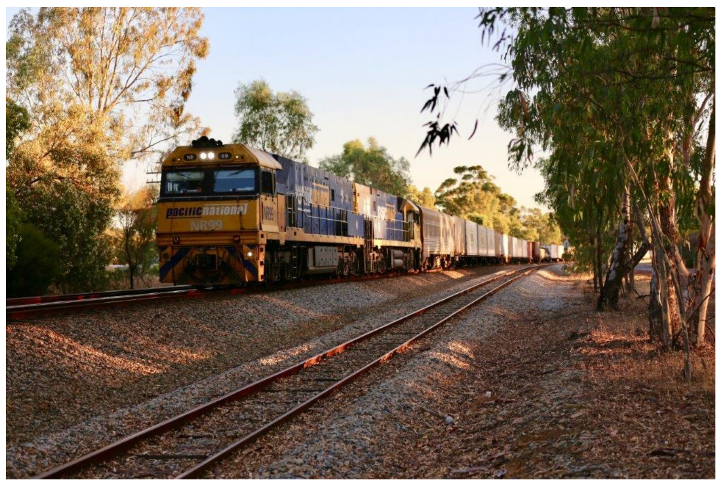
2PM5 passes through Millendon Junction behind NRs 99 & 23 on 27<sup>th</sup> January. Page 10 of 12