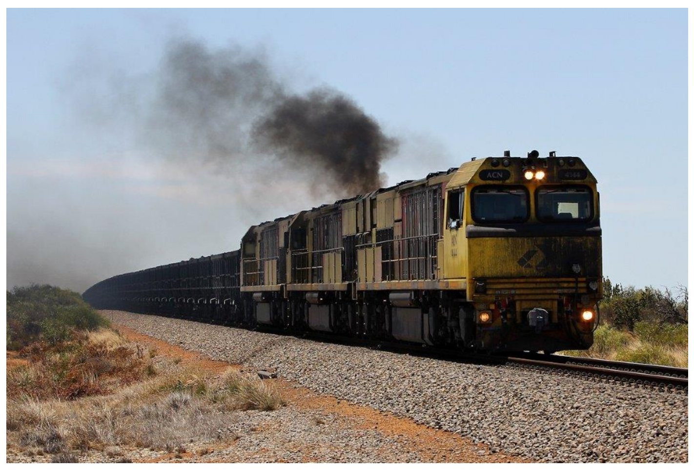
Grubby ACNs 4144, 4172 & 4171 crest at Kojarena with 7761 loaded Karara ore, 25<sup>th</sup> January.