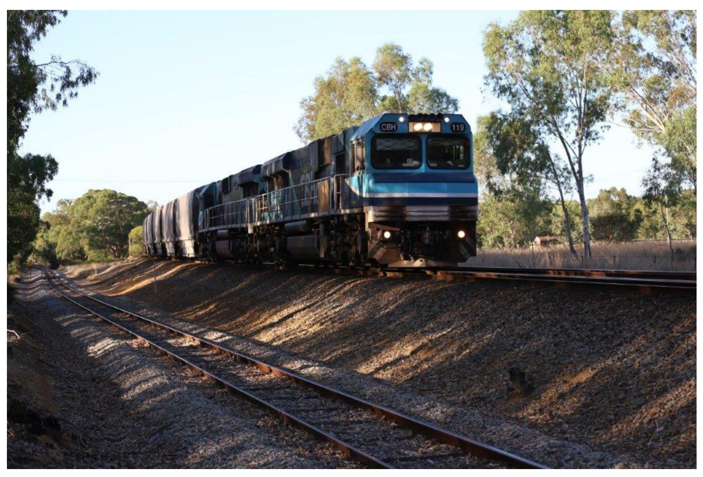
CBHs 119 & 121 run wrong line through Millendon Junction, 27^{\text{th}} January.