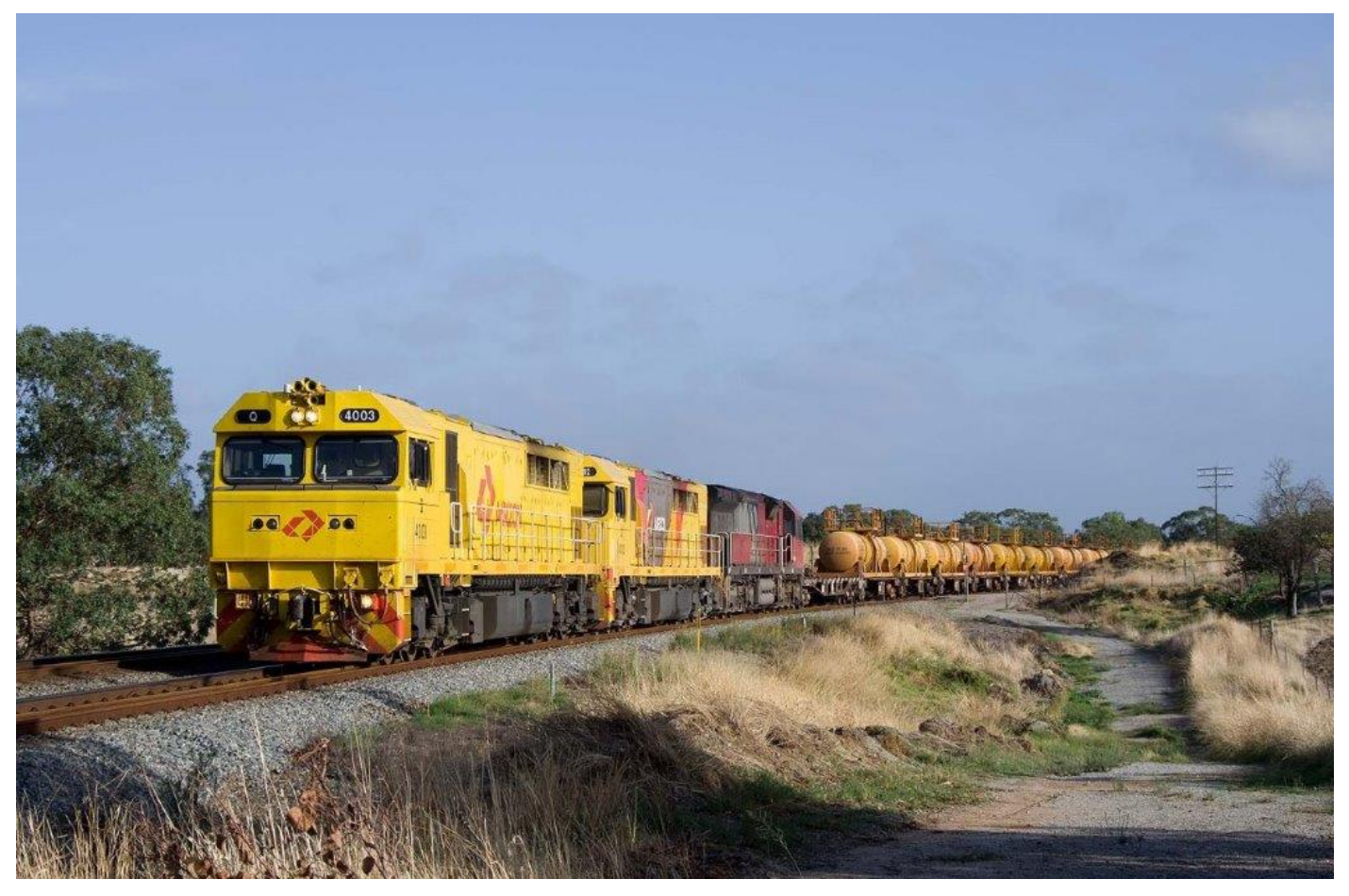
6426 passes through Middle Swan behind Qs 4003 & 4002 hauling MRL003, 28<sup>th</sup> March.