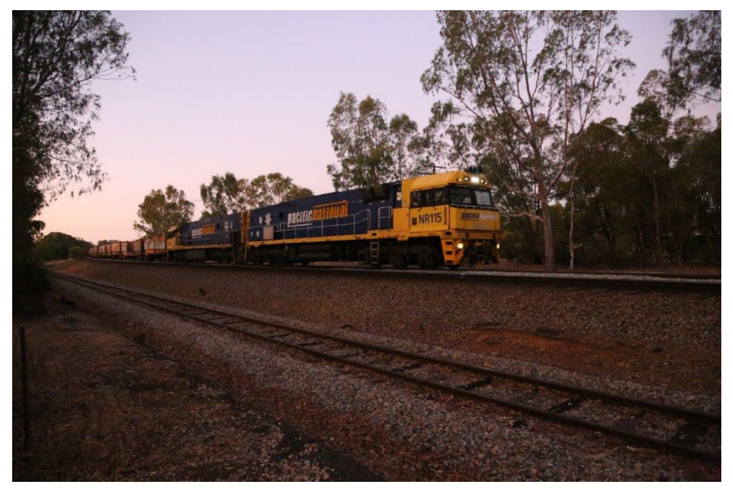
NRs 115 & 21 haul 5MP2 through Millendon on sunset, 22<sup>nd</sup> March.