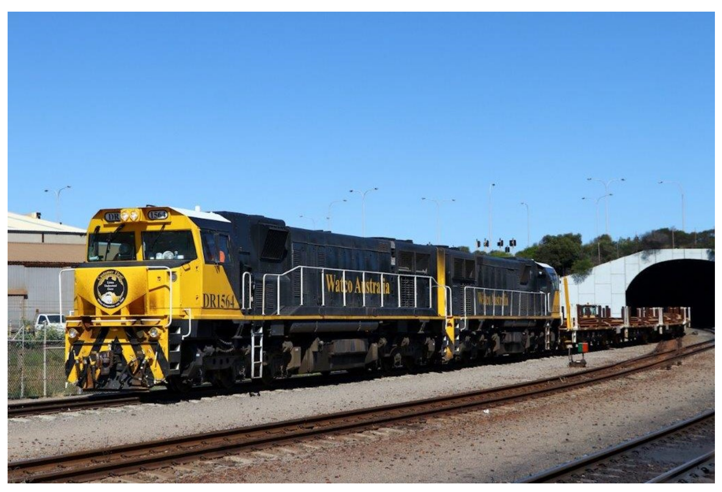
DRs 1564 & 1565 arrive at Geraldton Port with 3RT3 on 30^{\text{th}} March.