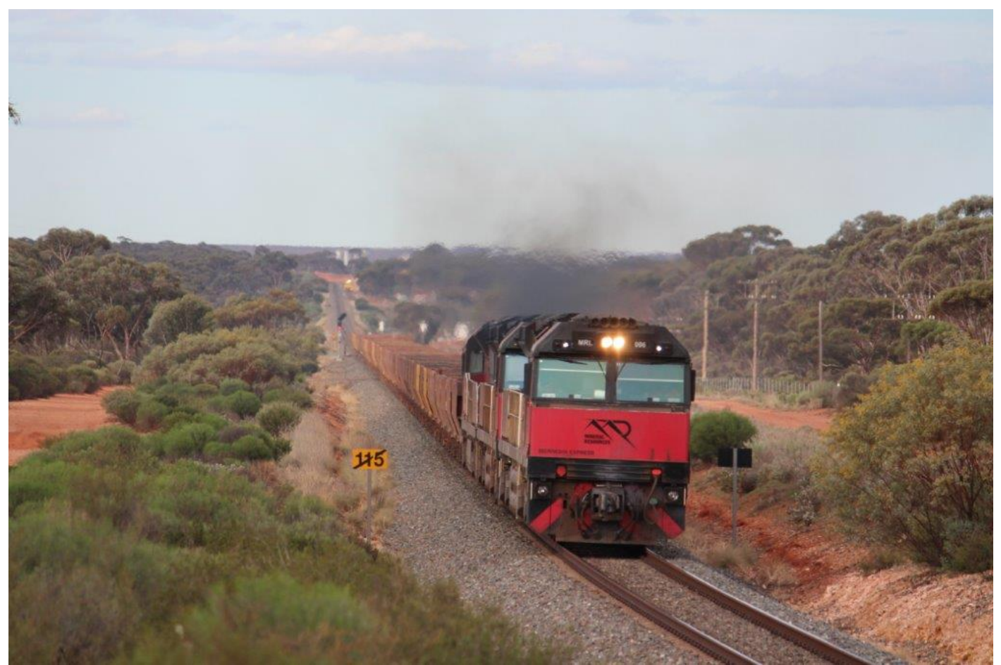
MRLs 6, 1 & 4 depart Binduli on 7030 PN empty, ACB4404 on 7404 to Hampton behind, 28/3. Page 13 of 17