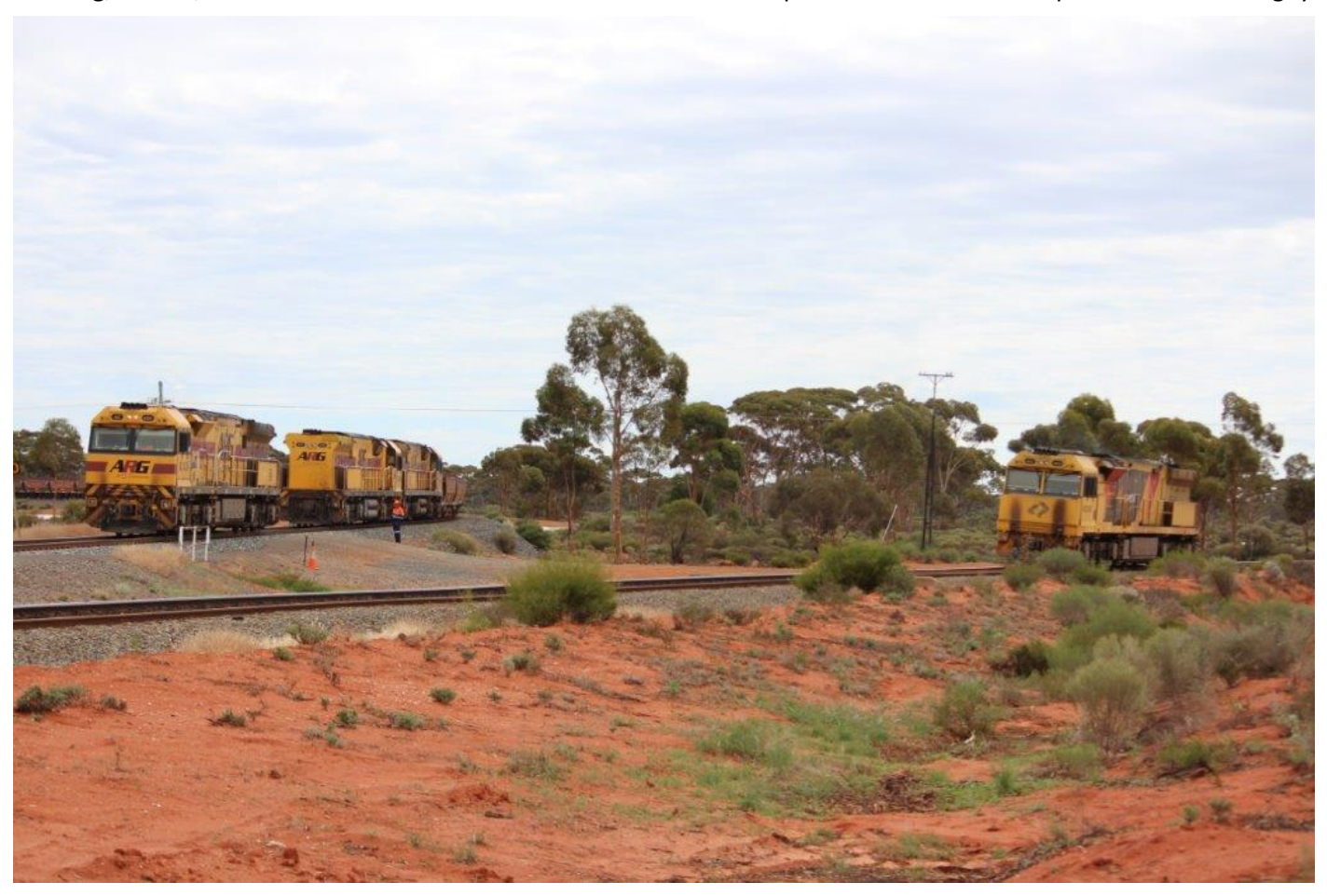
Page 7 of 17