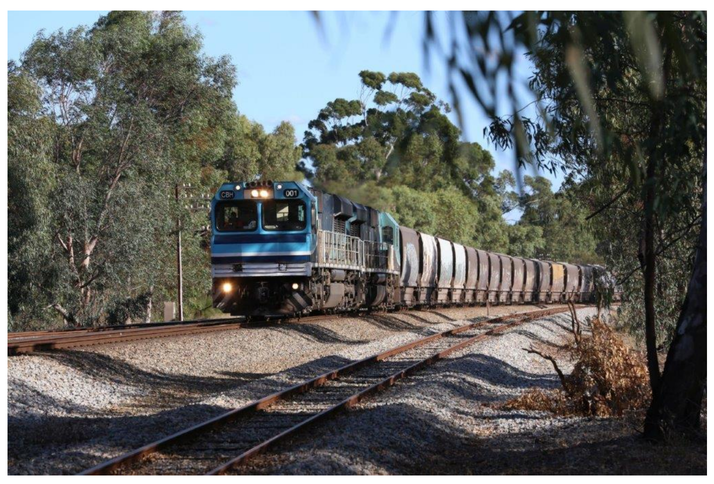
CBHs 001 & 008 lead 1K03 Kwinana-Brookton empty grain, Millendon, 22^{nd} March.