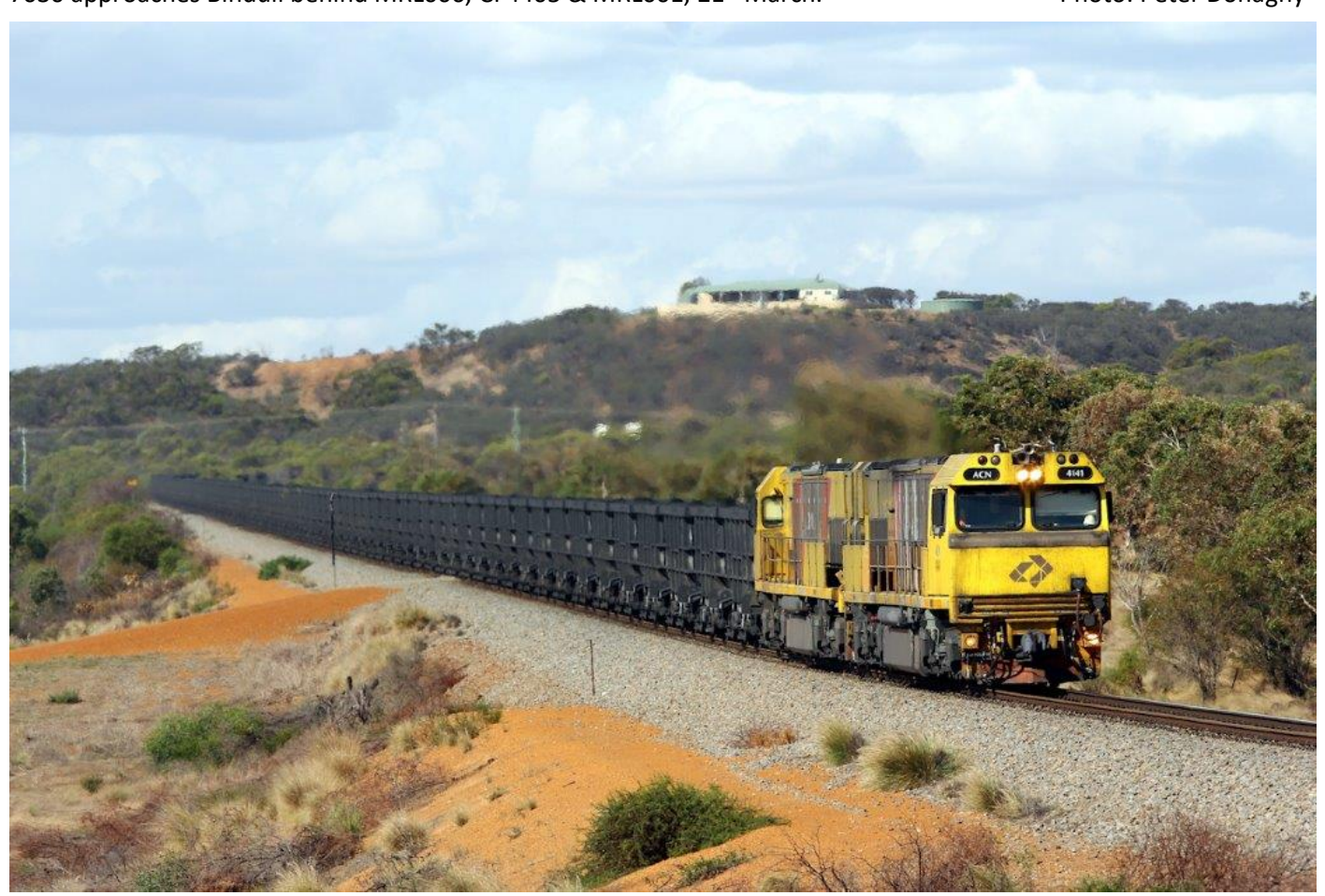
ACNs 4141 & 4175 hurry 7763 loaded Karara ore through Bringo West, 21st March.