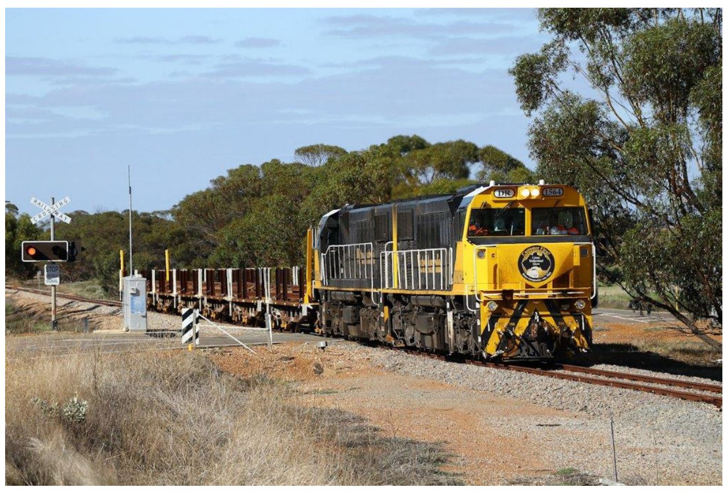
7RT1 railset arrives at Marchagee behind DBZs 1564 & 1565, 29^{\text{th}} March.