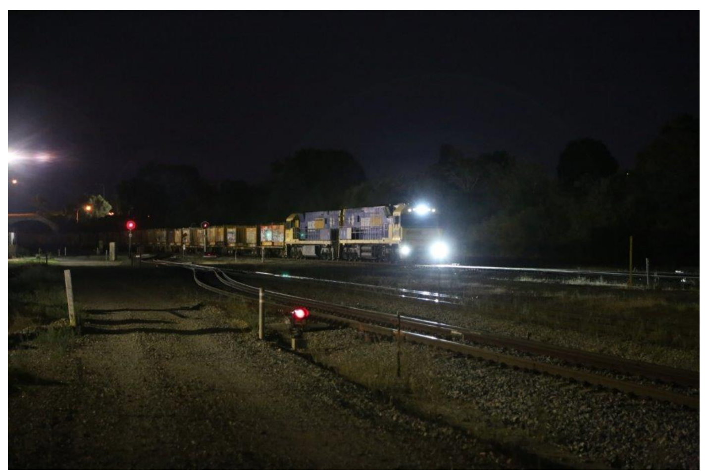
5MP2 rolls into Forrestfield behind NRs 115 & 21, 22<sup>nd</sup> March.