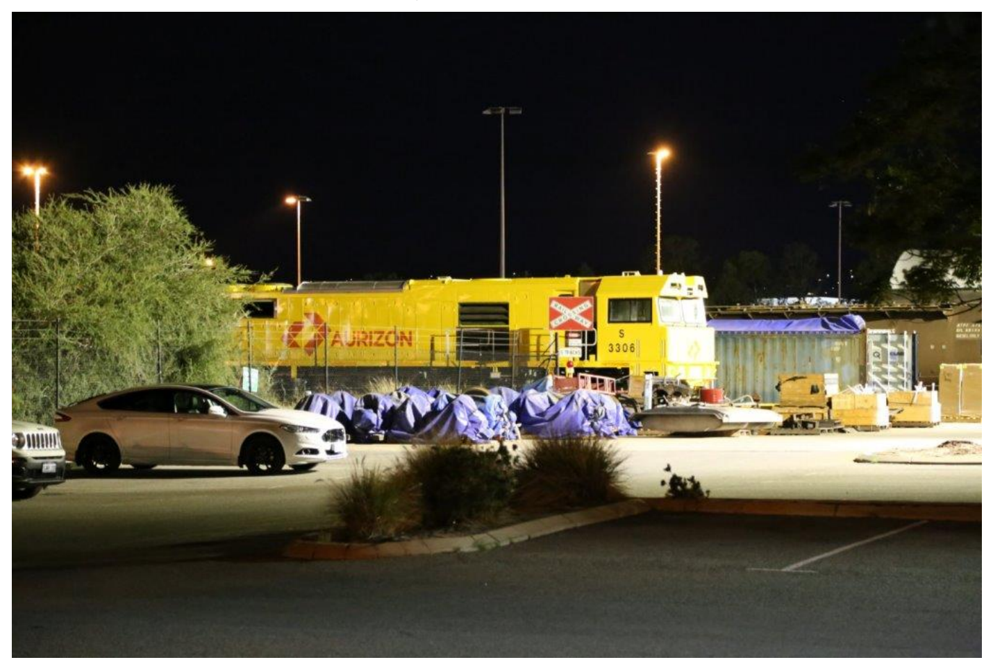
S3306 sits outside Gemco workshops, Forrestfield, 22^{nd} March. Page {\bf 10} of {\bf 17}