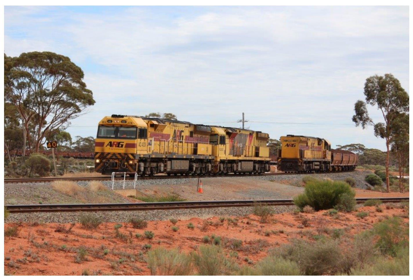
AC4301 & ACC6032 are removed from AC4306 on 1041 (above) and AC4304 is slotted in (below), Binduli, 22<sup>nd</sup> March.