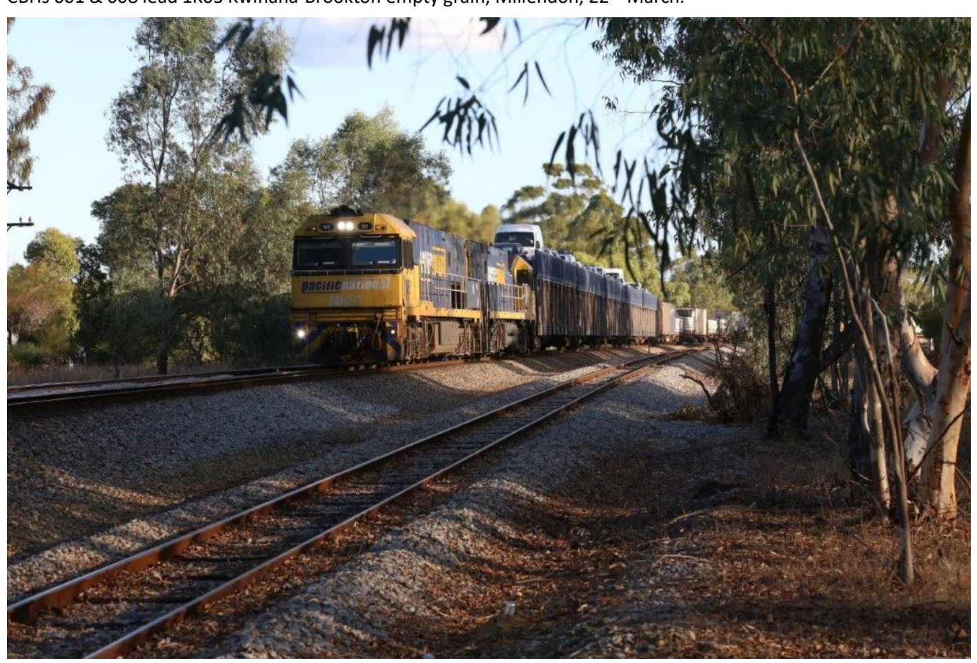
1PM5 rolls through Millendon behind NRs 51 & 107, 22^{nd} March.