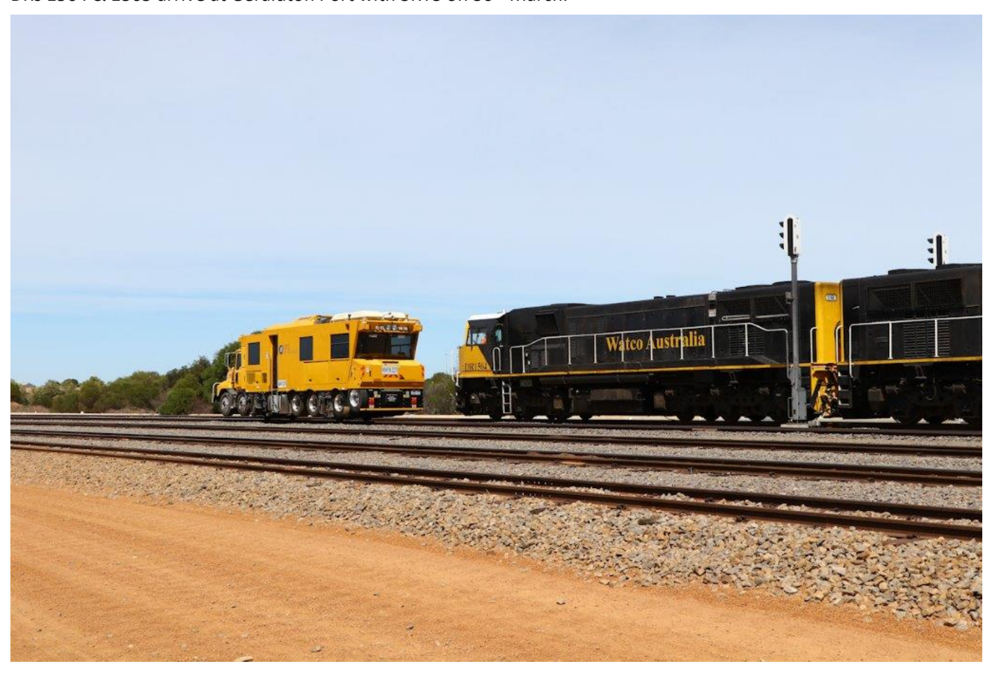
DRs 1564 & 1565 accompany MMY29 at Narngulu, 31^{\text{st}} March. Page 17 of 17