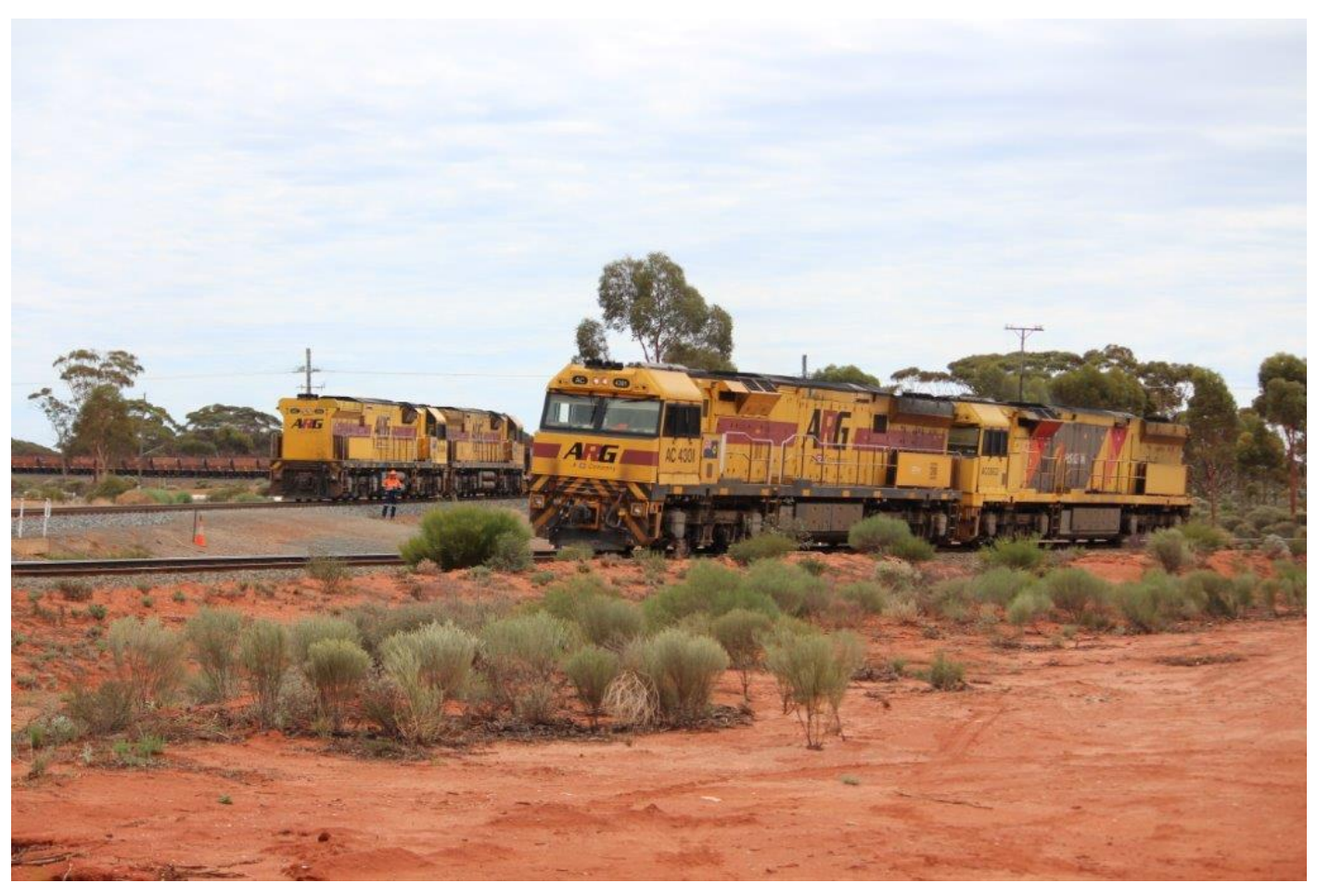
AC4301 drops ACC6032 onto the east leg of Binduli triangle (above) then moves back to the head of 1041 ore on the west leg, Binduli, 22<sup>nd</sup> March. The ACC was sent to Perth for workshops attention.