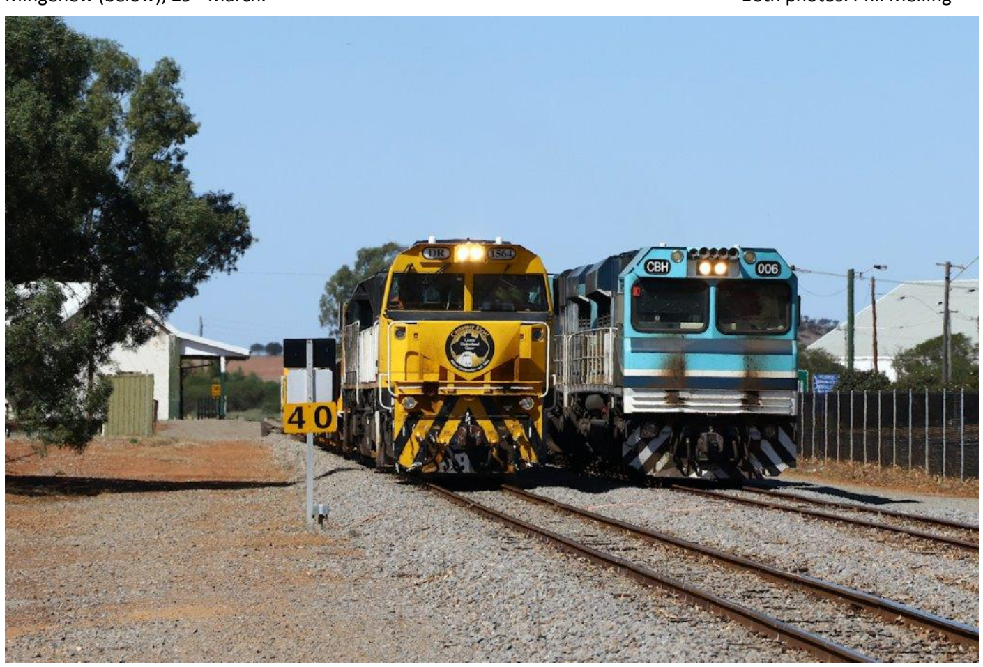
Page 15 of 17