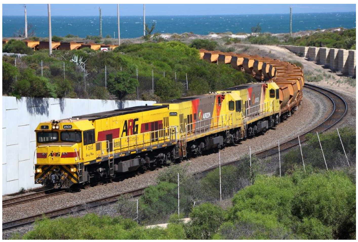
Ps 2502, 2504 & 2505 ease 7721 loaded Mt Gibson ore into Geraldton Port, 21st March.