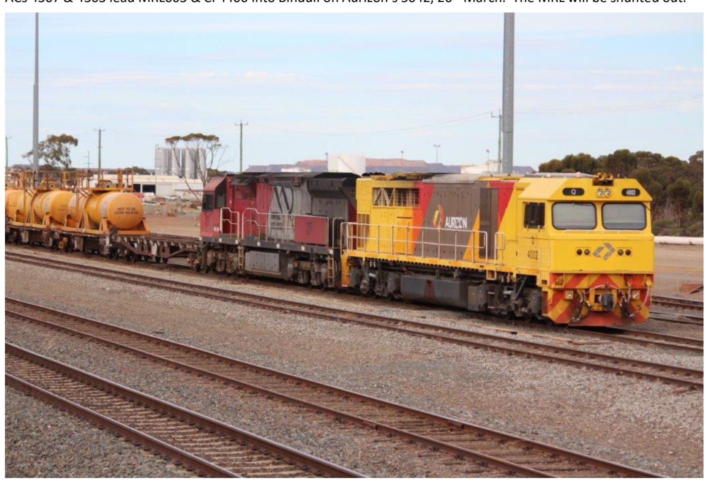
Q4002 & MRL003 head 6426 to Perth, 27<sup>th</sup> March. Q4003 was added before departure. Page 12 of 17