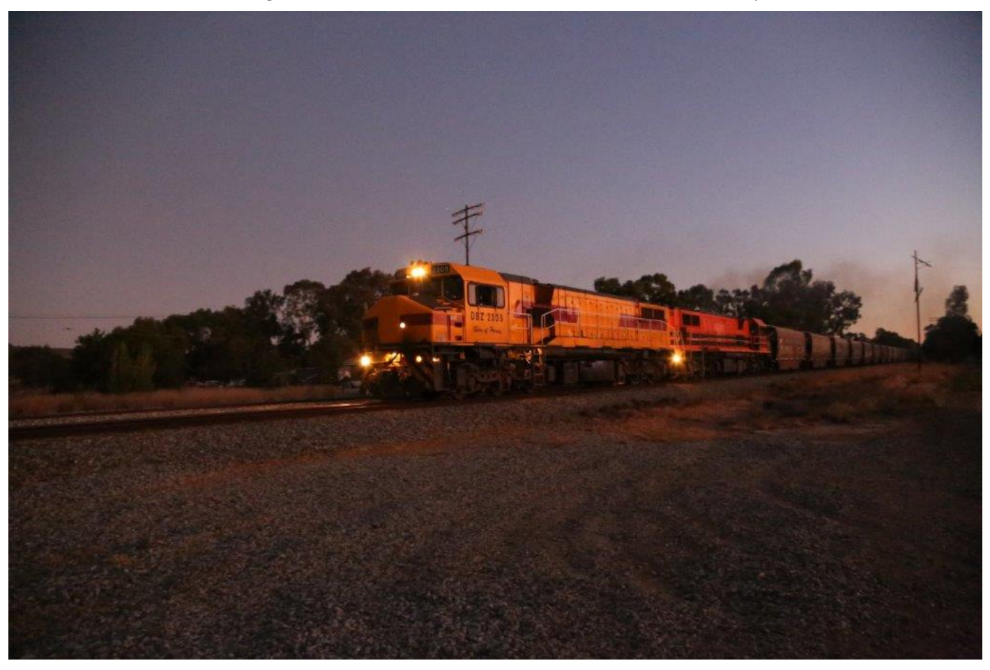
Daylight fades as DBZs 2305 & 2302 lead another grain rake through Millendon, 22^{nd} March.