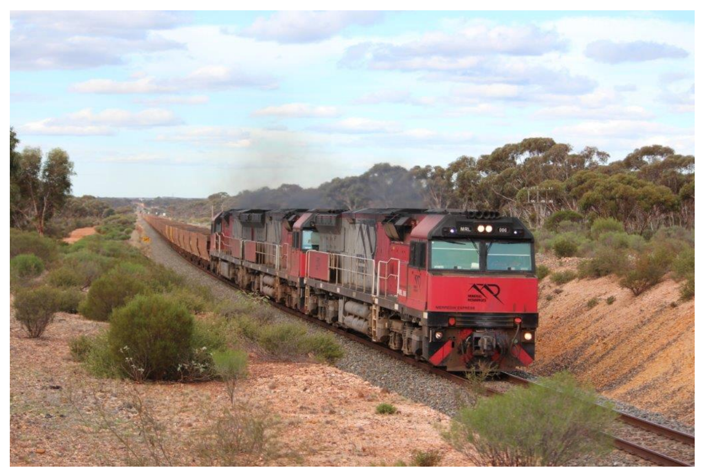
7030 empty ore climbs away from Binduli behind MRLs 006, 001 & 004, 28<sup>th</sup> March.