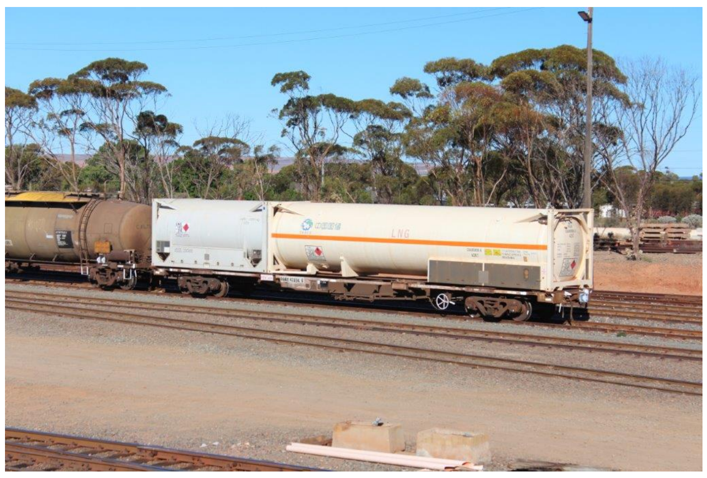
Rail transport of liquified natural gas to Kalgoorlie commenced in mid March, 20' and 40' tanks paired up, 24/3. Page 11 of 17