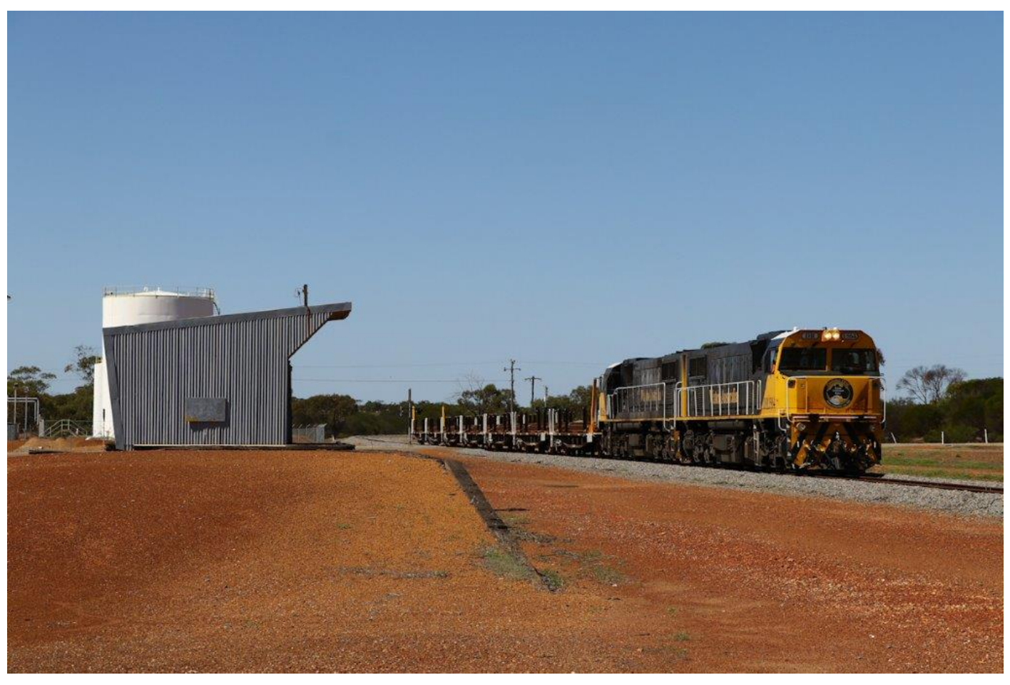
7RT1 hauled by the DRs passes through Carnamah (above) and poses beside CBHs 006 & 023 on a grain train at Mingenew (below), 29<sup>th</sup> March.