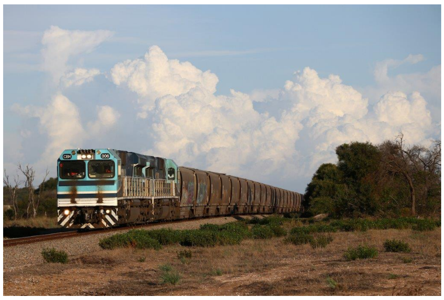
Clouds billow as CBHs 006 & 023 haul 7G51 loaded grain through Bookara, 21st March.