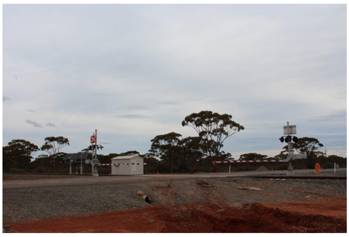
The new KCGM haul road crossing near Parkeston is now complete, with boom gates fitted. Solar panels and a wind turbine power this crossing. 21st March.