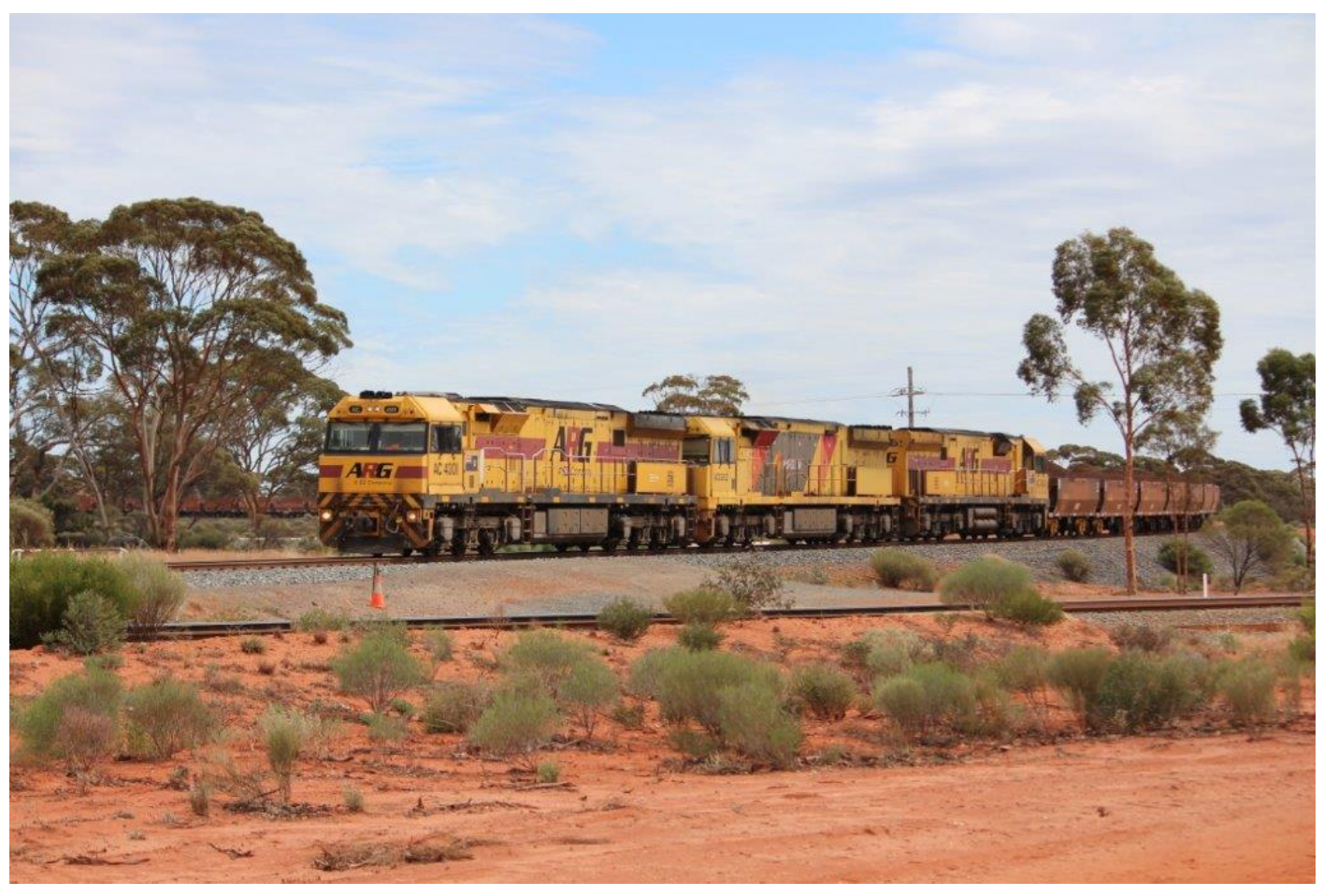
AC4301, ACC6032 & AC4306 head Aurizon's new train number 1041 at Binduli, 22<sup>nd</sup> March. Page 5 of 17