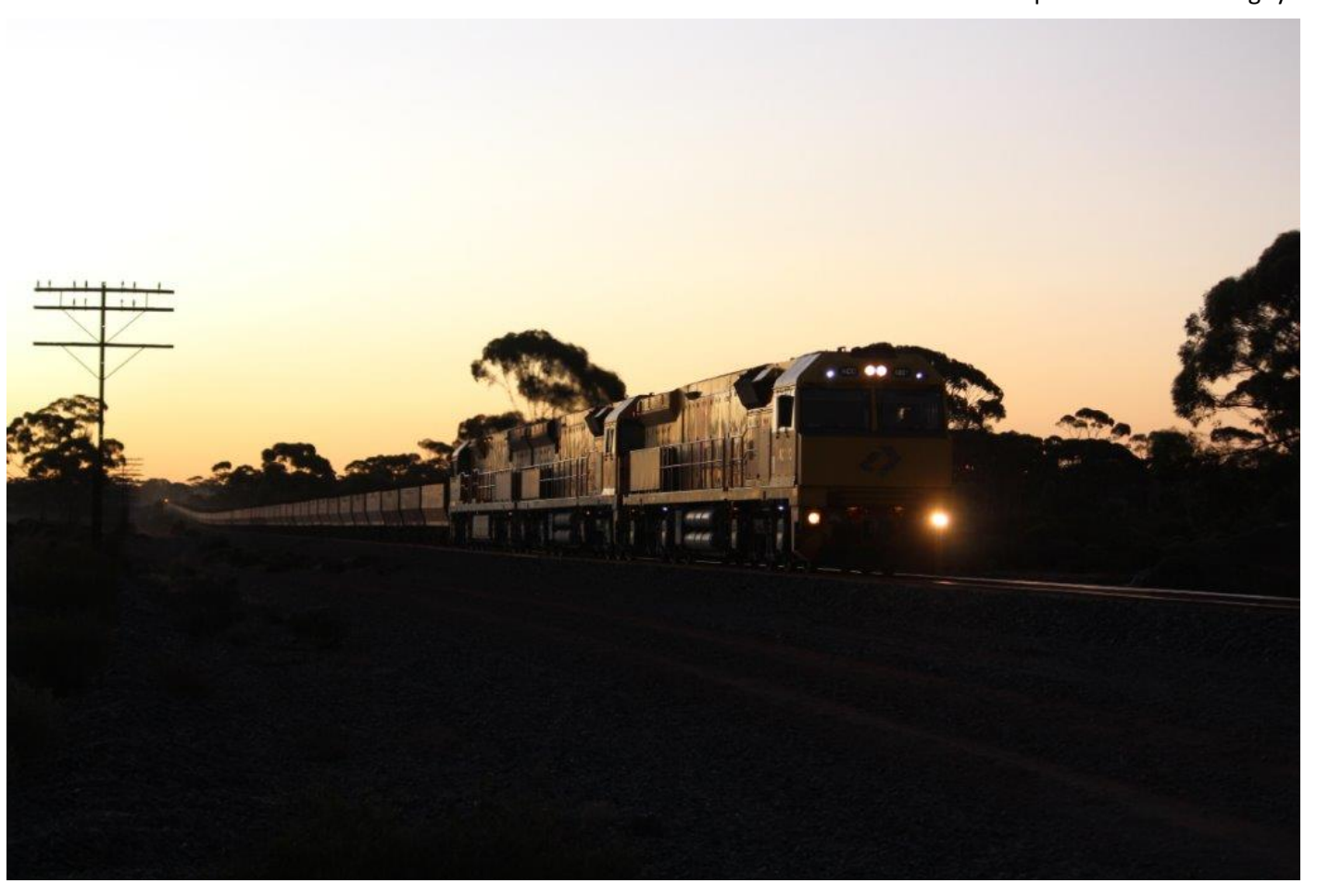
Page 16 of 17