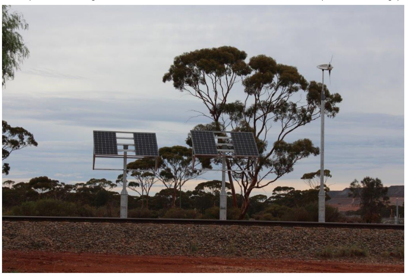
Page 3 of 17