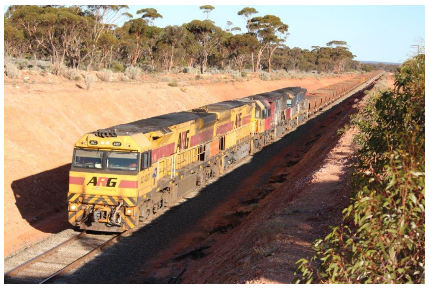
ACs 4307 & 4303 lead MRL003 & CF4406 into Binduli on Aurizon's 5042, 26<sup>th</sup> March. The MRL will be shunted out.