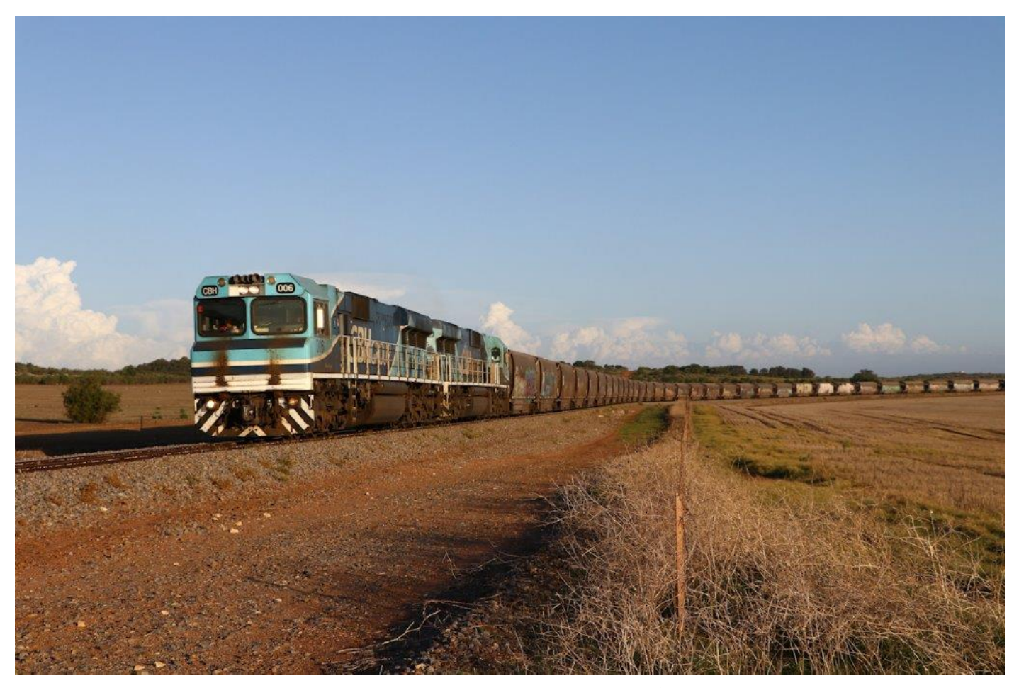
7G51 grain rounds the curve at Greenough Flats behind CBHs 006 & 023, 21st March.