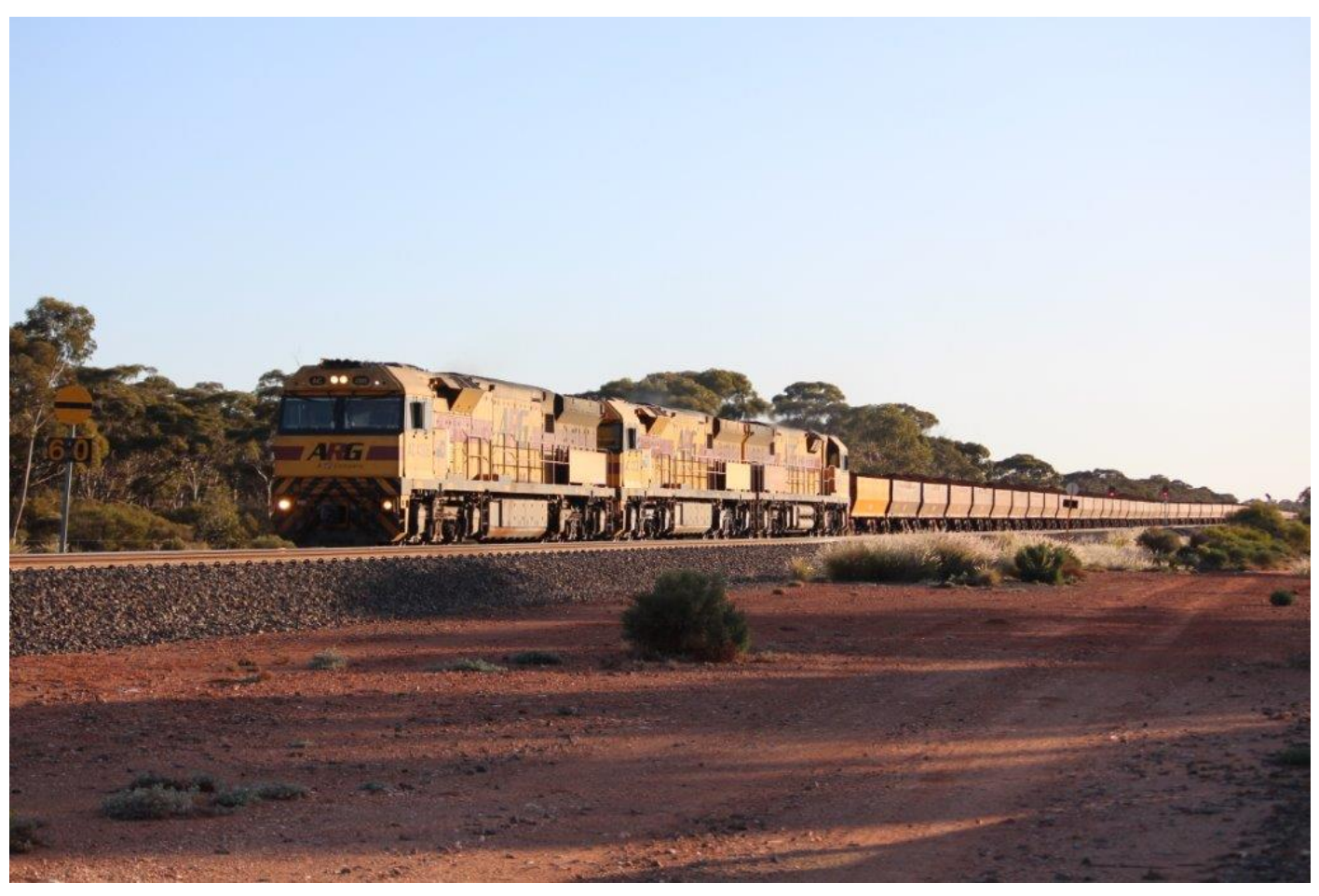
ACs 4305, 4303 & 4307 ease PN 1031 ore into Binduli (above) then race towards Hampton after sunset (below), 29<sup>th</sup> March.