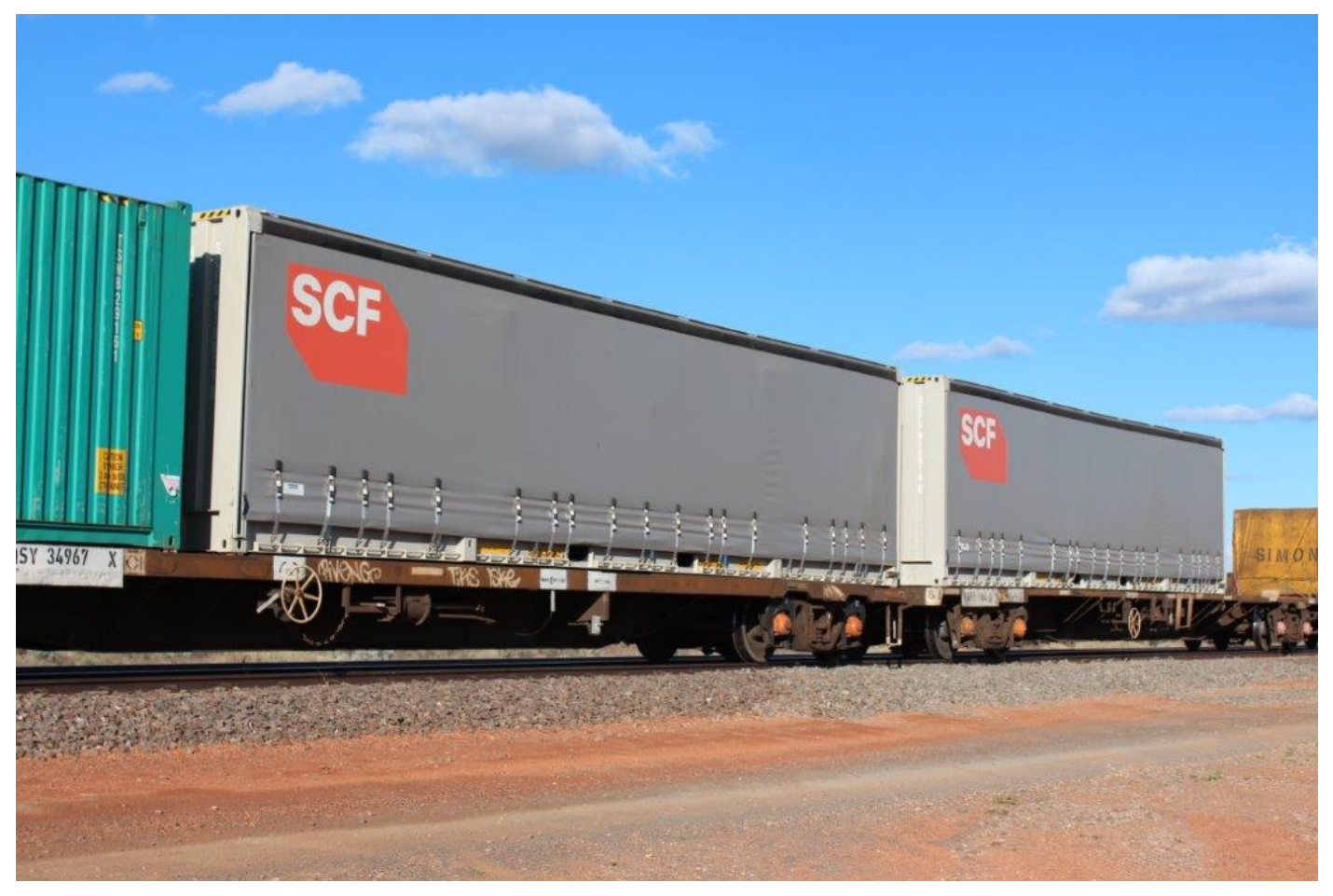
Two new SCF 40' curtainsiders on 7MP5, Parkeston, 23<sup>rd</sup> March.