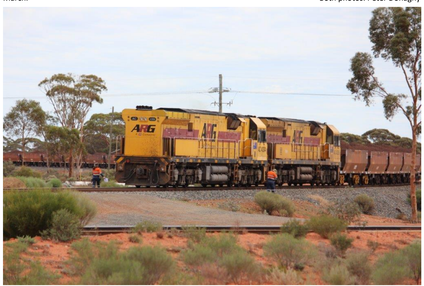
Page 6 of 17