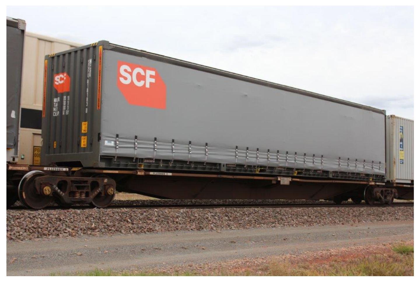
SCF have bought more 48' curtainsiders, unusually continuing their 2018 818xxx series.