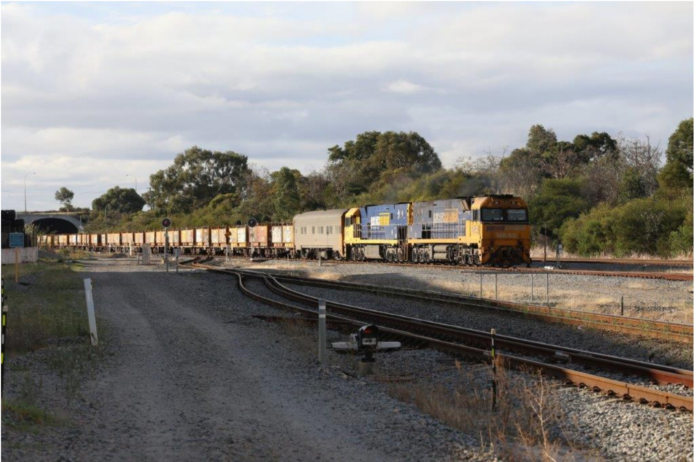
NRs 55 & 79 entering Forrestfield with 5MP2, 12 th April.