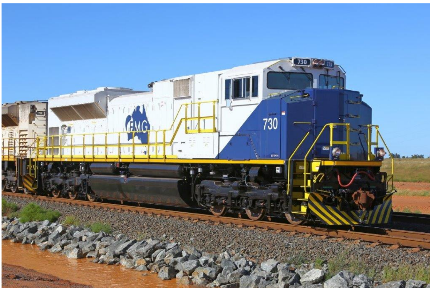
730 is ninth of a 10-unit order; standard US domestic locos on HTCR-4 bogies rather than the low clearance version.