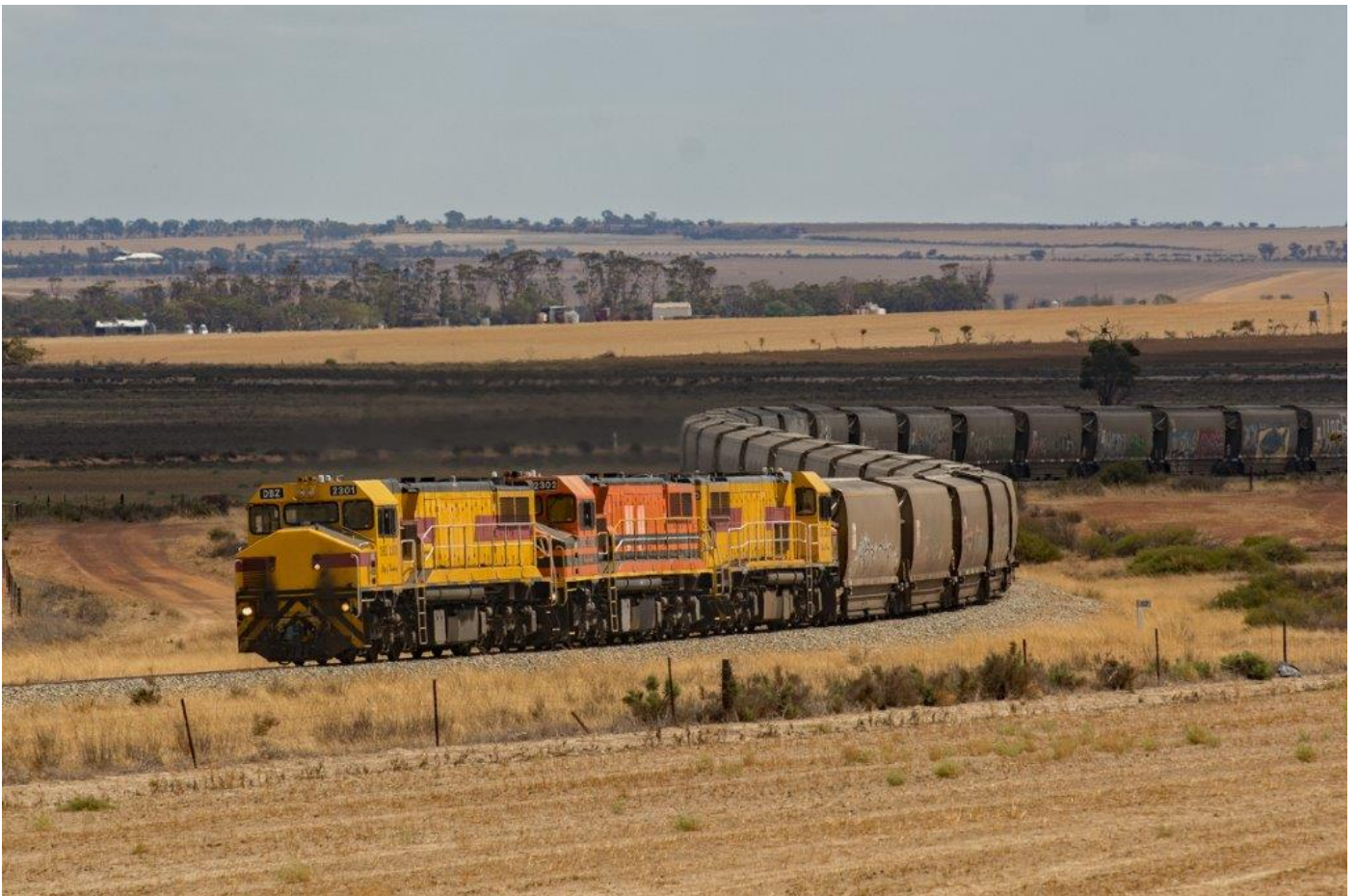
DBZs 2301, 2302 & 2305, 3K44 loaded grain ex Cadoux, Koomburkine, 25 th Feb.