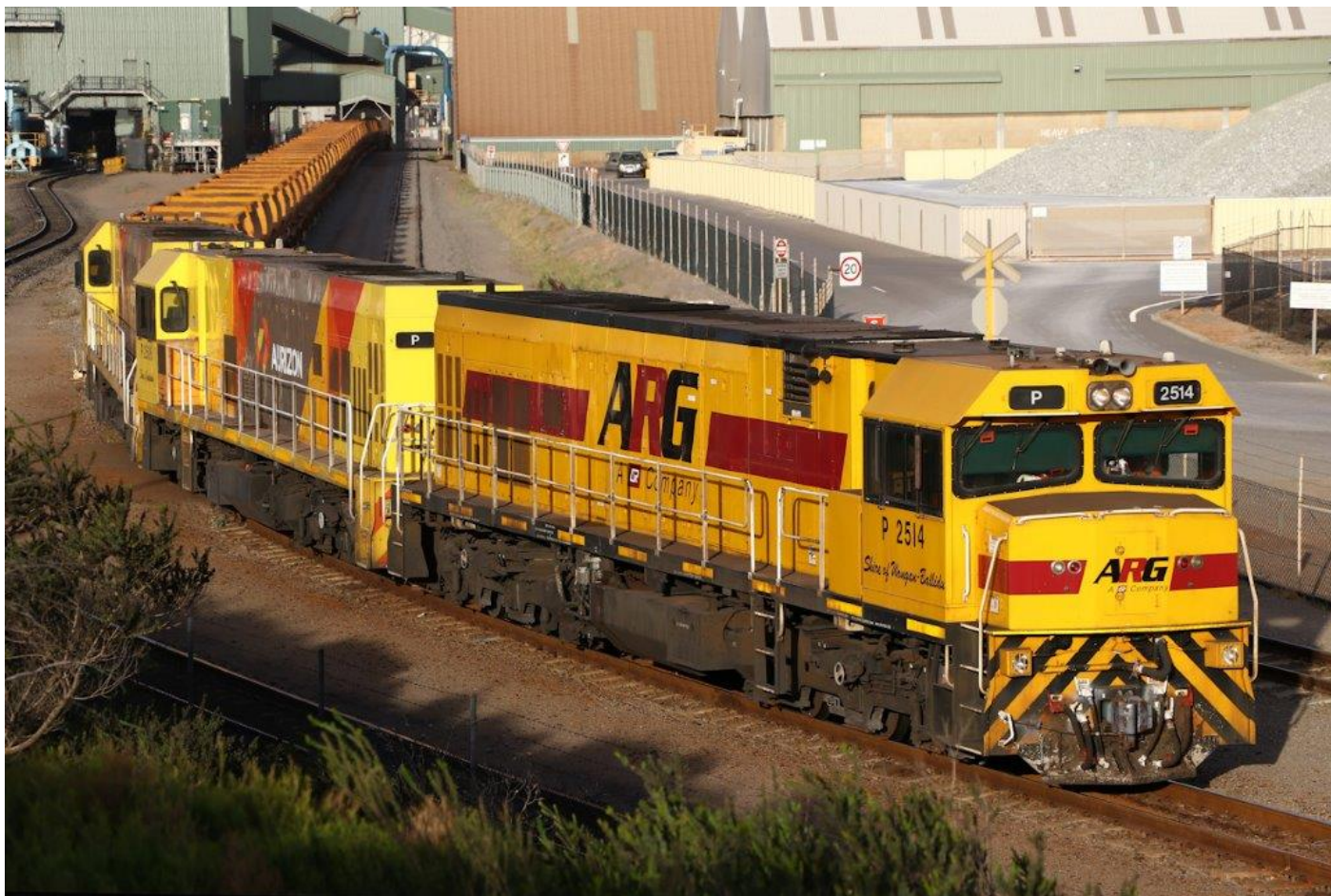
Ps 2514, 2505 & 2506 unload 6721 Mt Gibson ore to form 6722, Geraldton Port, 3 rd April.