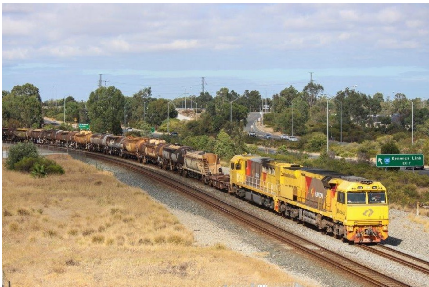
ACB4402 & Q4009 shuttle 1157 fuel/workshop transfer through Kenwick, 16 th February.