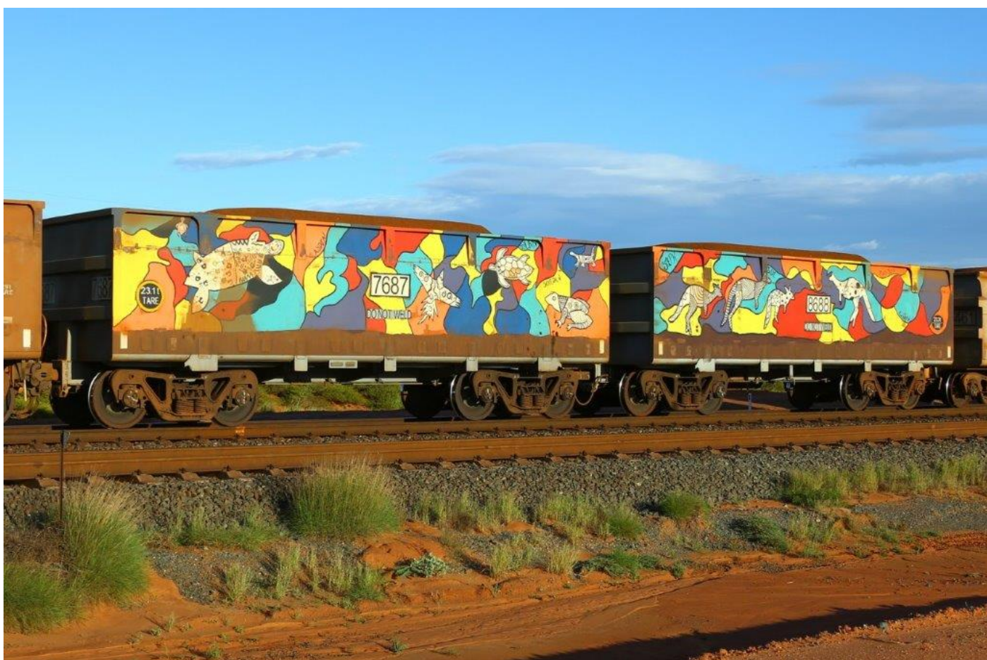
Slave 7687 and control 8688 painted by South Hedland High School students in Aug 2018, photographed 12/4.