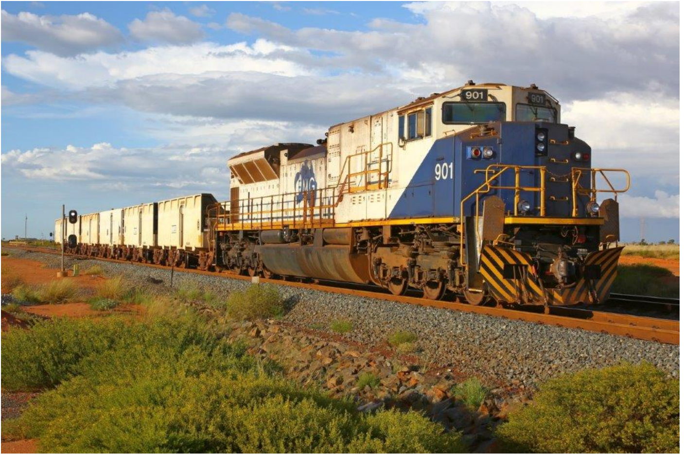
Re-engined SD90MAC 901, Anderson Point with compressor sets 4, 1 & 8, 9 th April.