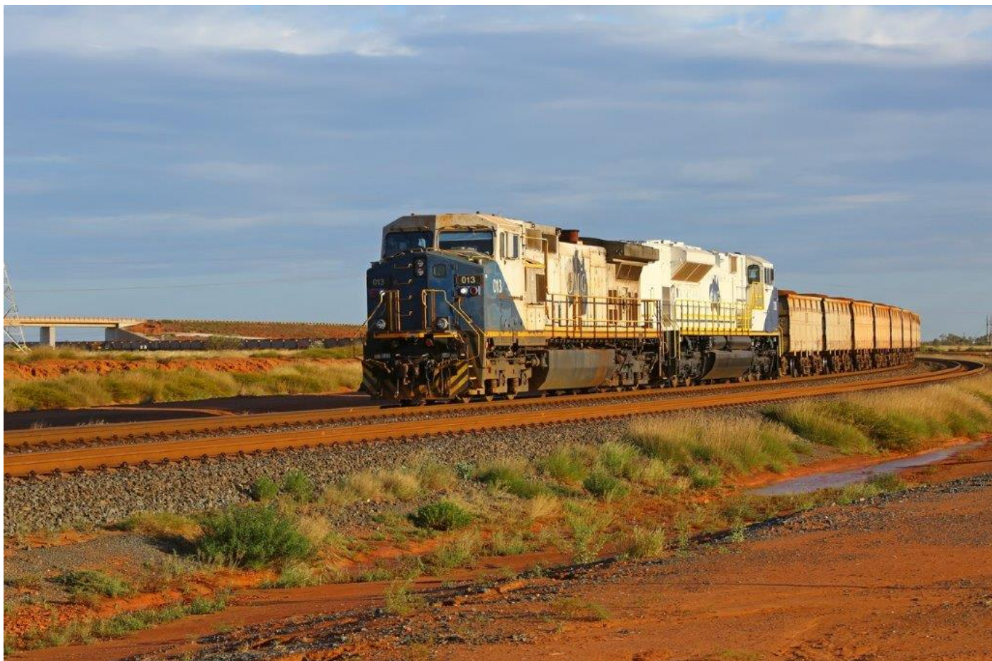
013 and new 726 bring a loaded ore around the 5km curve, 12 th April.