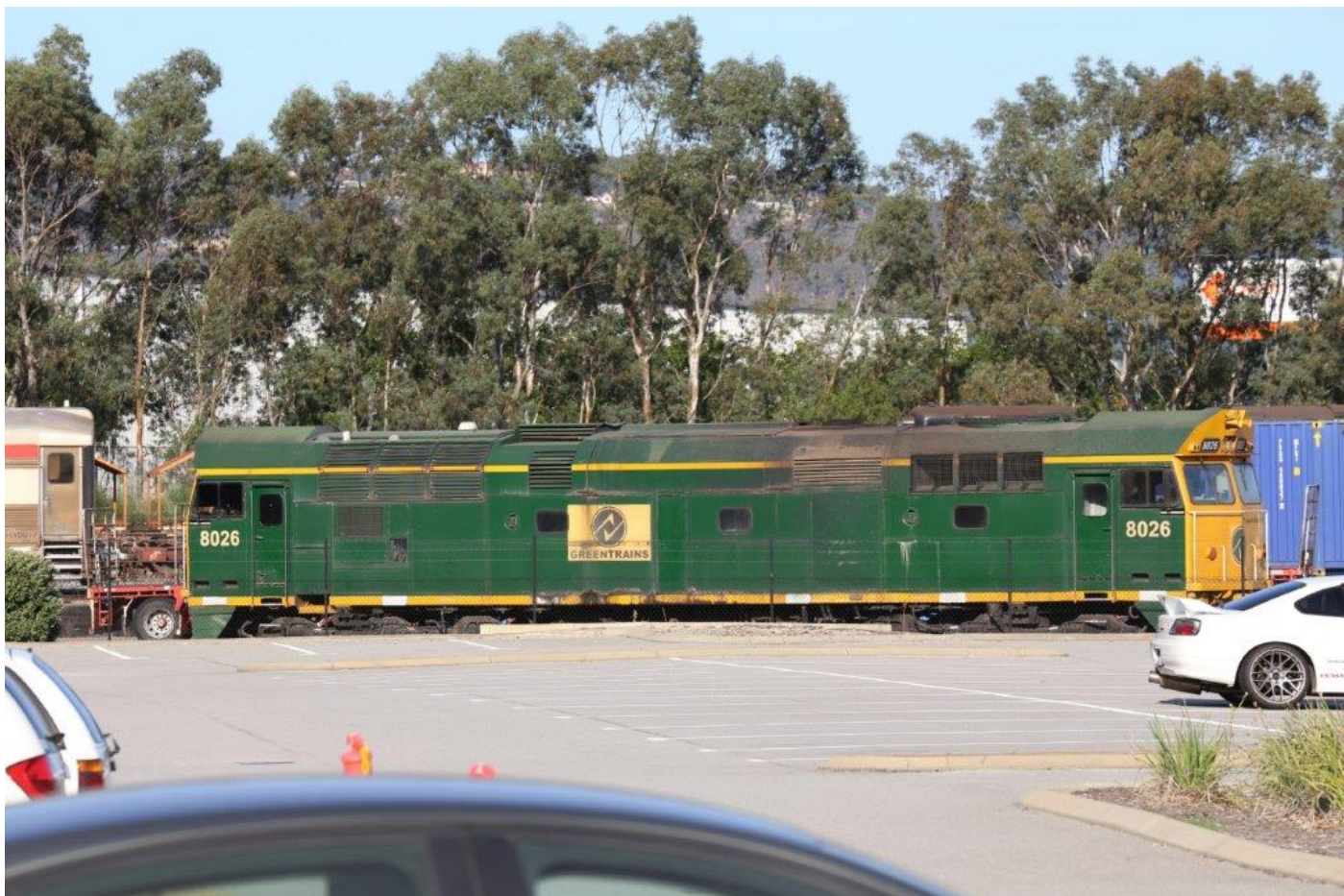
Leased replacement shunter 8026, SCT Forrestfield, 13 th April.