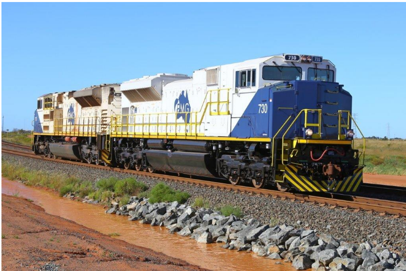
Brand new 730 leads 717 to Kanyirri Yard for servicing, 10 th April.