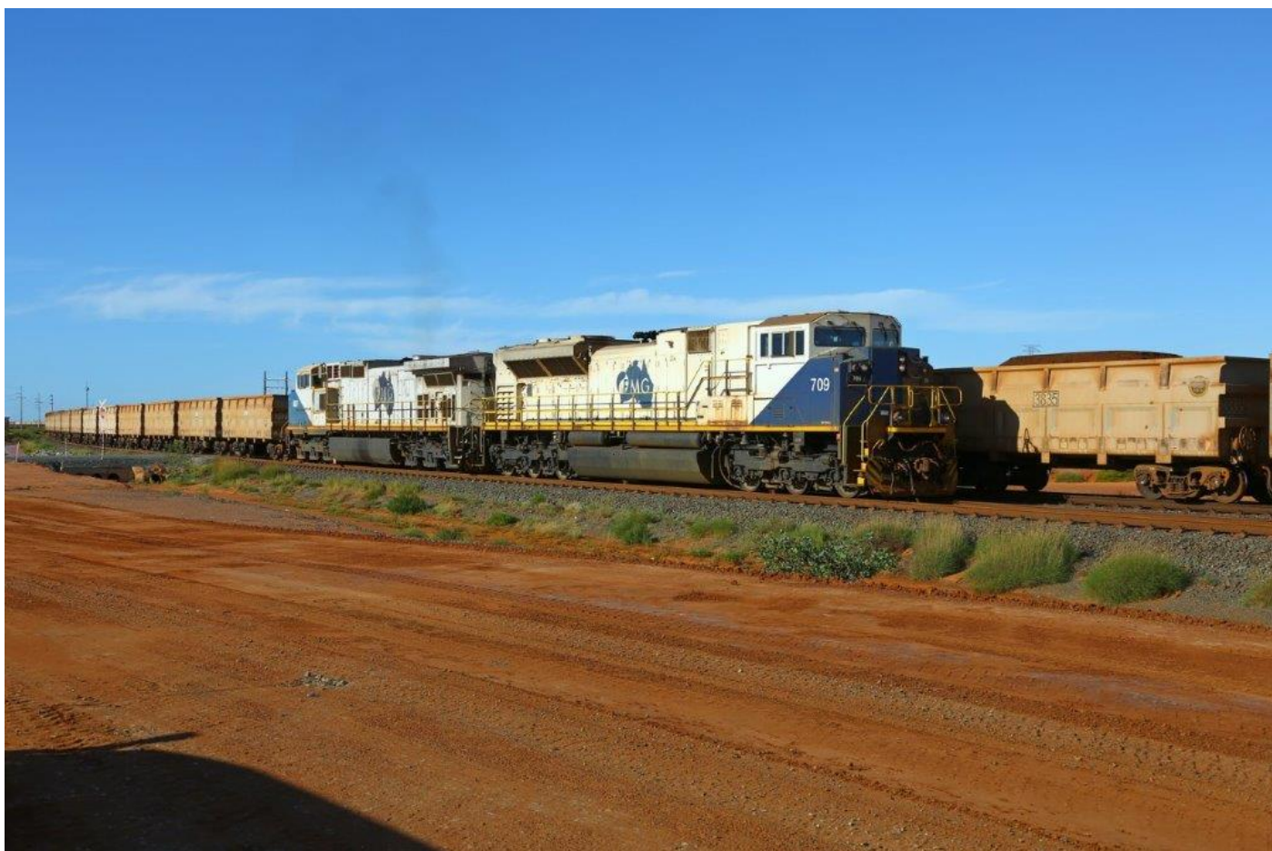
As a loaded rake arrives at the port, 709 & 007 depart with an empty rake, 12/4.