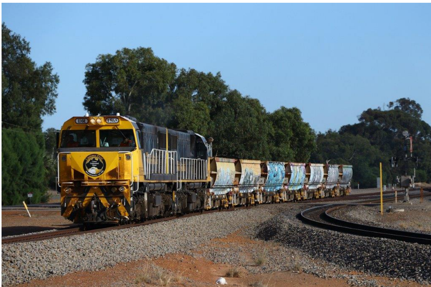
DRs 1565 & 1564 depart Narngulu with 7BT2 ballast, 18 th April.