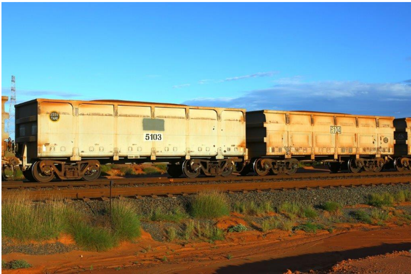
Slave 5103 (CRRC Yangtse) and control 6104 (CNR QRRS) mismatch pair, 12 th April.