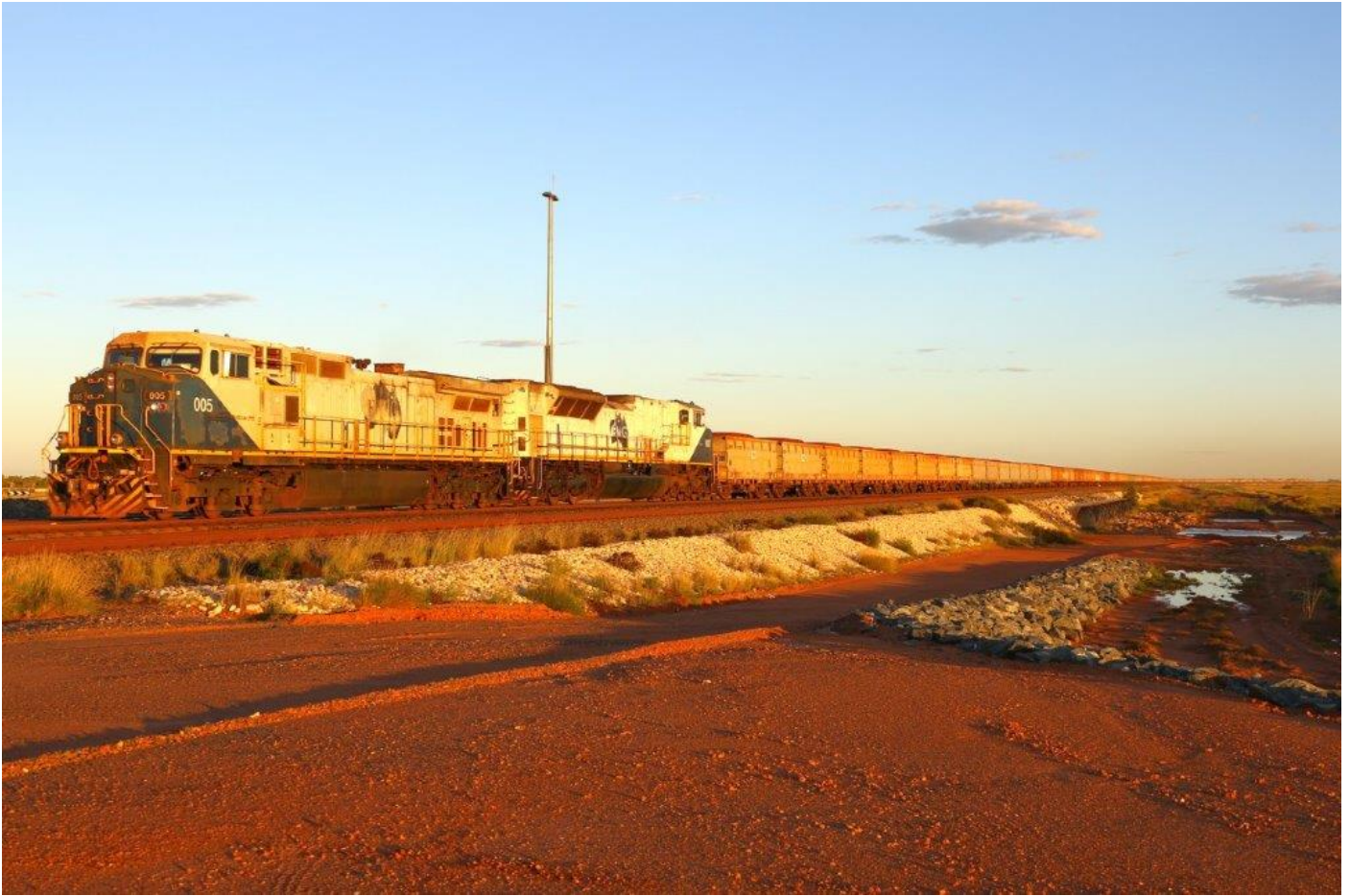
Tatty GE C44-9W 005 and SD9043MAC 907 await a slot through the unloaders, 10/4.