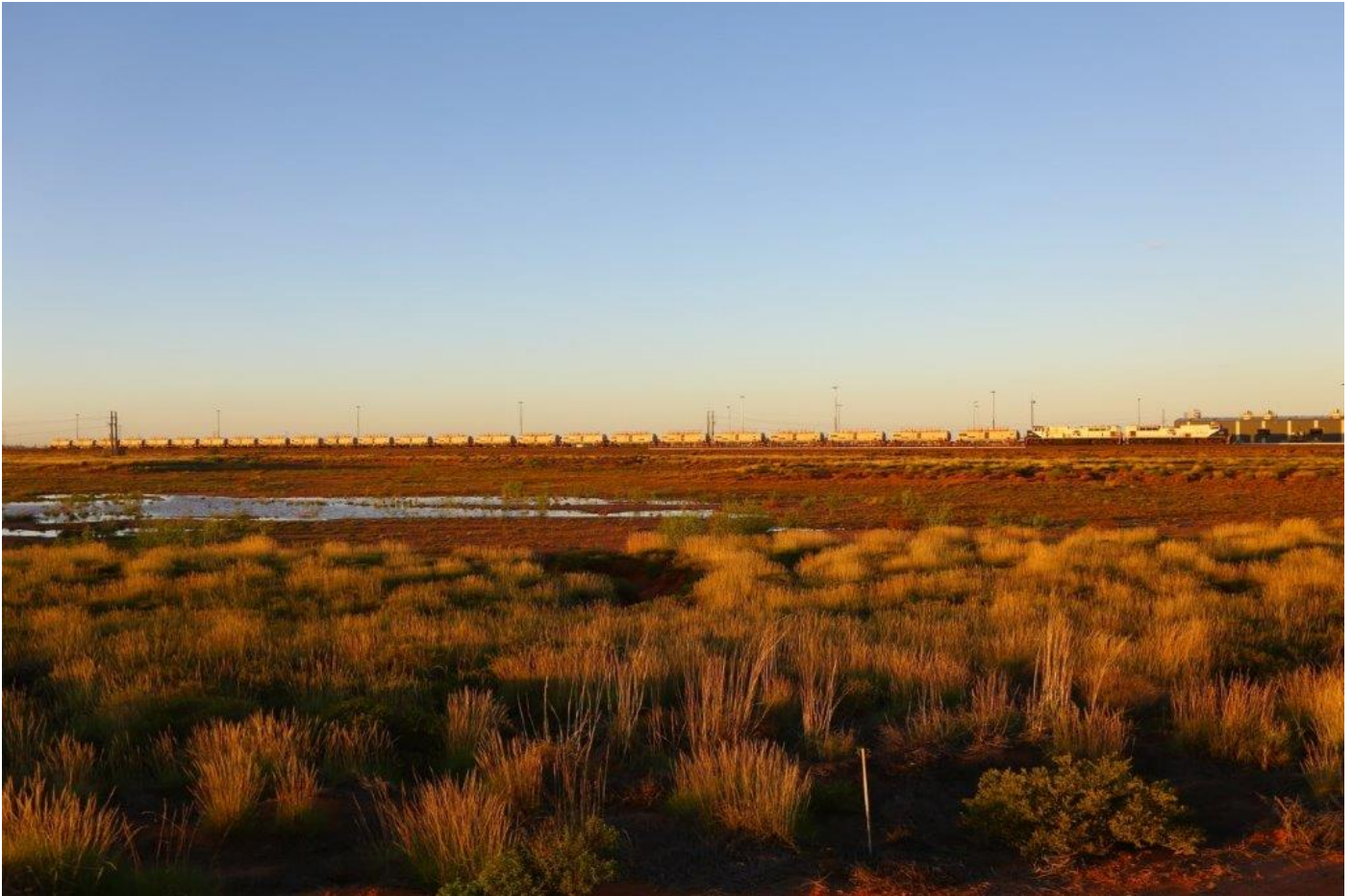
903 & 905 on FMG's loaded 24-tank fuel train, 10 th April.