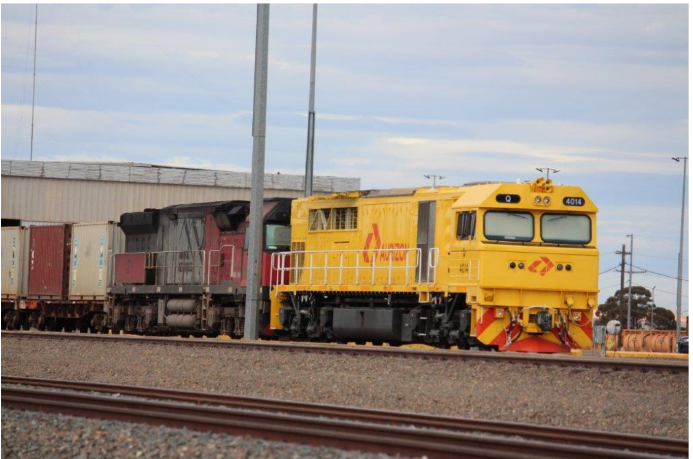
Awaiting lead unit Q4010, Q4014 on 426 to Perth, with MRL004 for UGL Bassendean, 14/4.