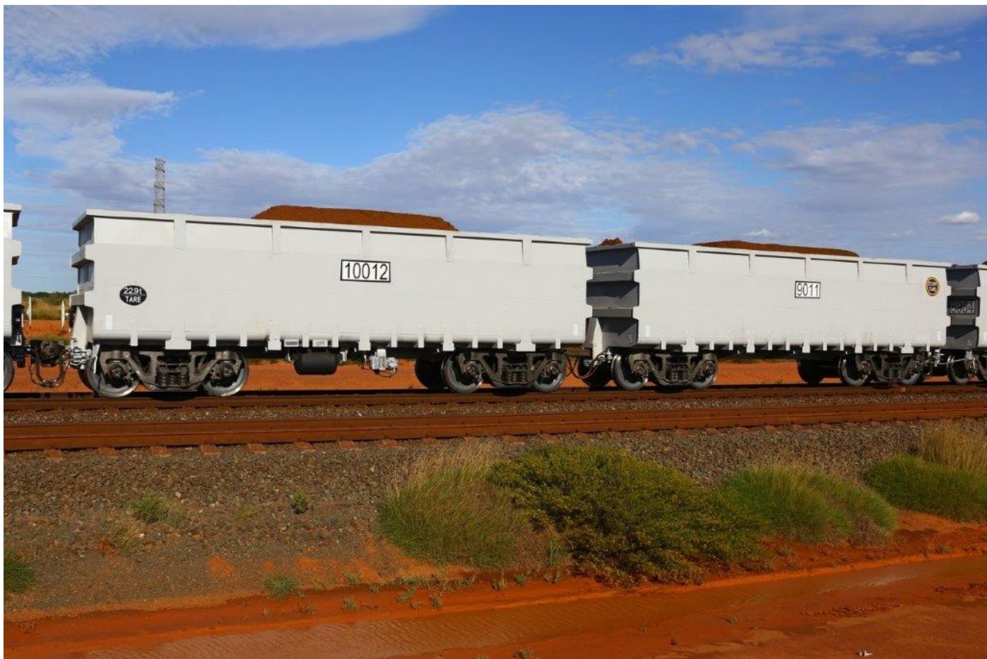
FMG's new CRRC Yangtze wagon pair - 9011 slave and 10012 control – loaded with fines, 12 th April.