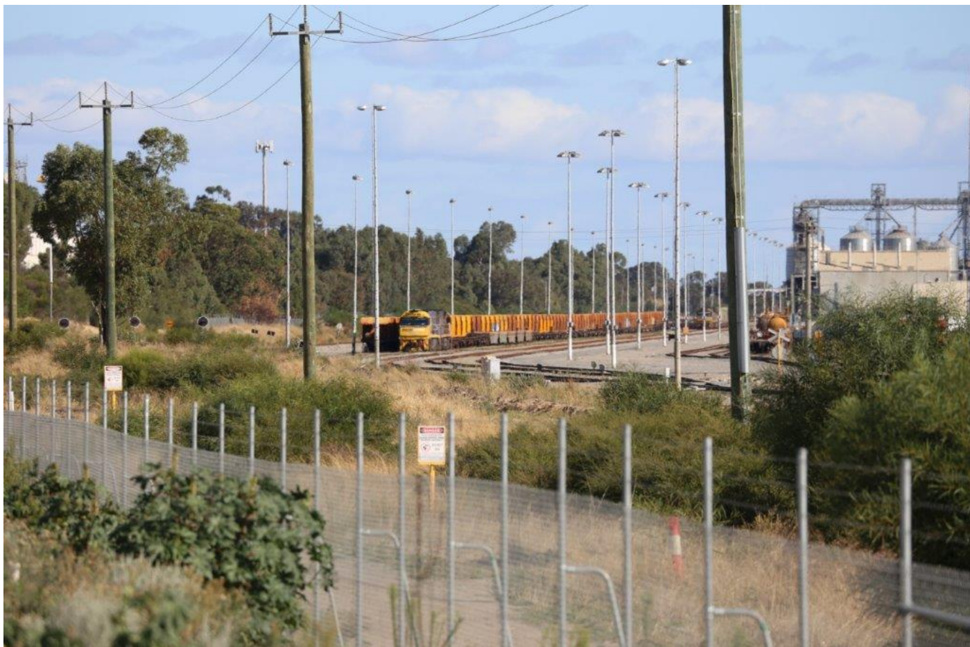
NRs 70 & 55 stabled on an empty intermodal, with another pair of NRs in the distance, 13 th April.