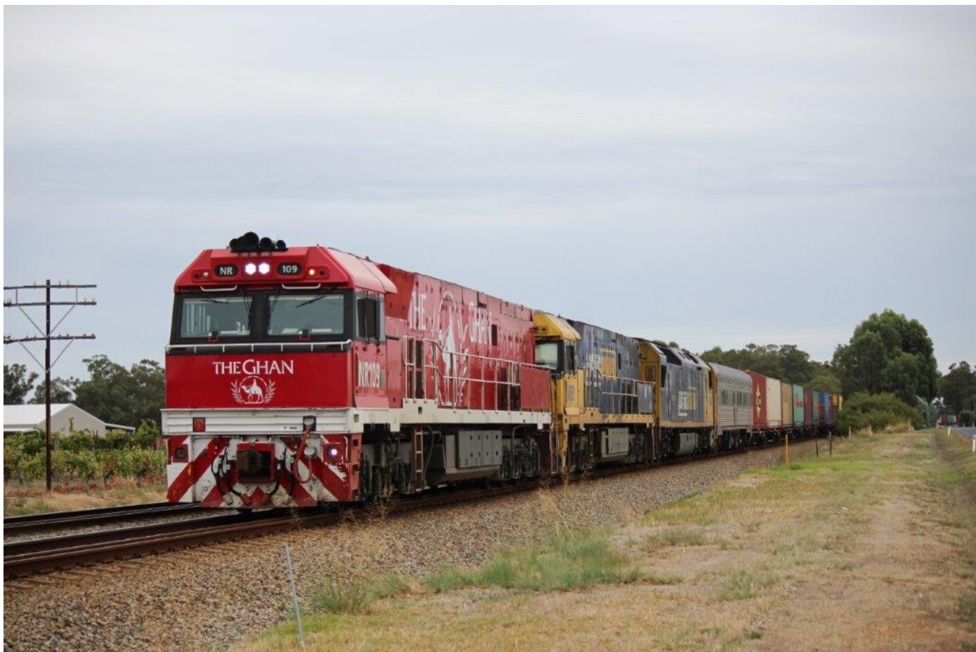
NRs 109 & 51 lead AN2 on 6MP1 (additional COVID service) through Herne Hill, 5 th April.