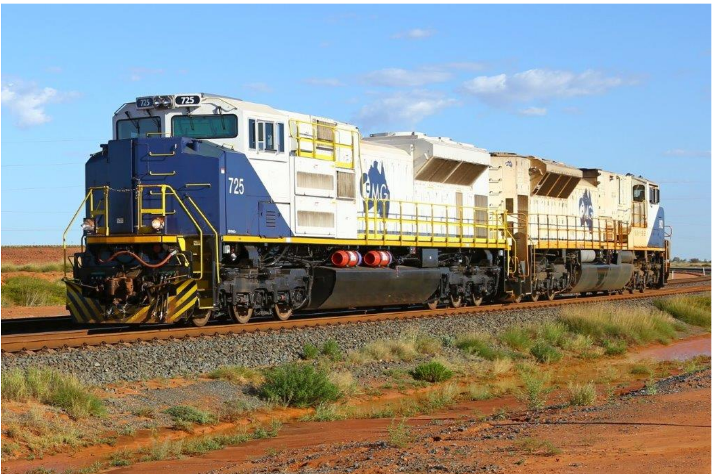
New SD70ACe 725 and former 6000hp SD90MAC 902 run to port to collect an empty train, 10 th April.