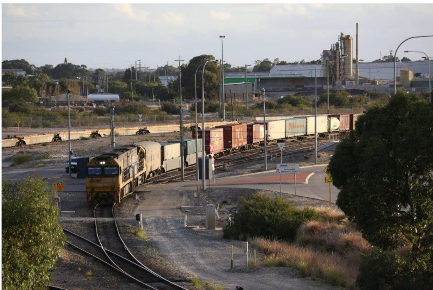
1PM5 prepares to depart Kewdale behind NRs 19 & 100, 12 th April.