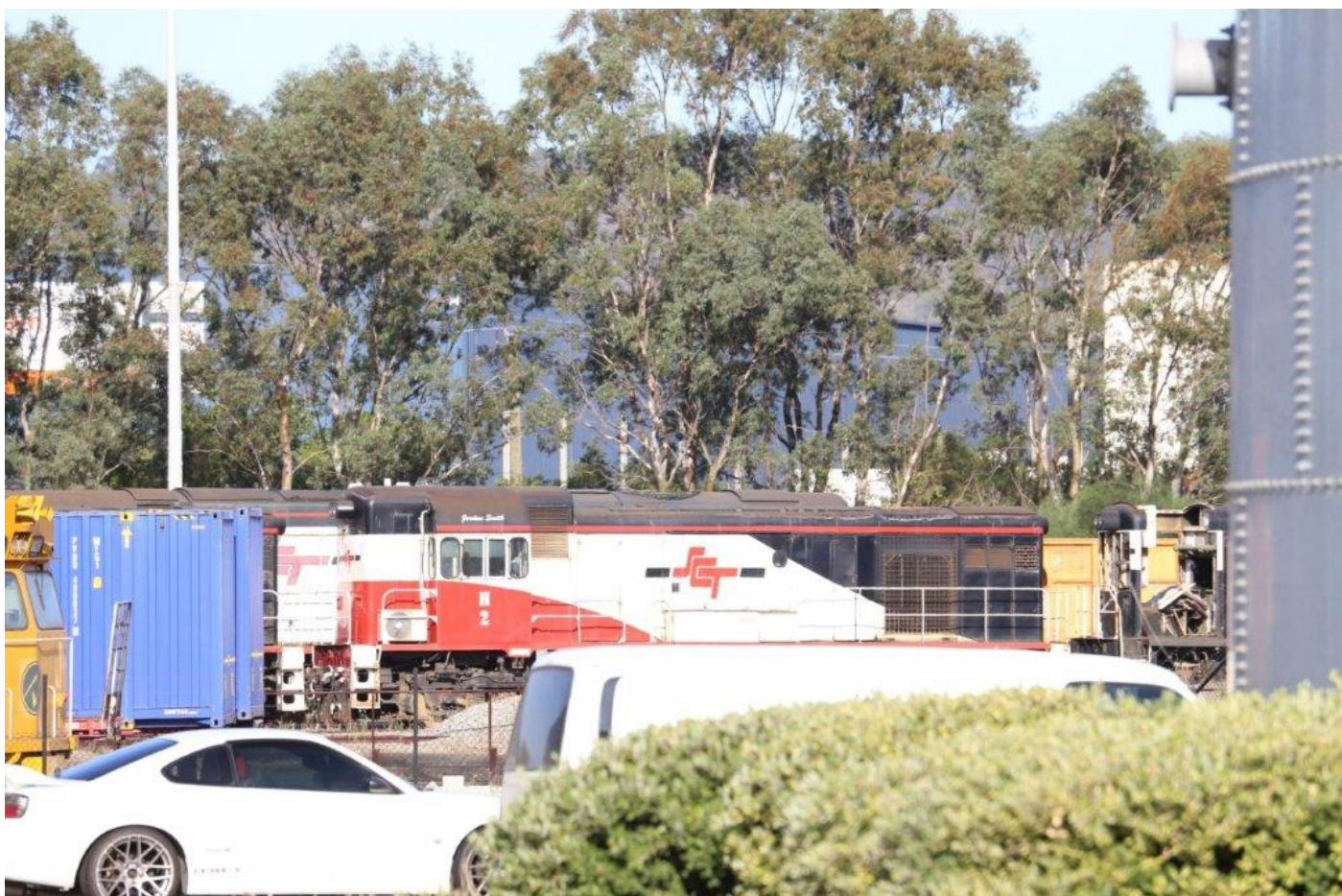
Cannibalised and stored H & K class locos, SCT Forrestfield, 13 th April.