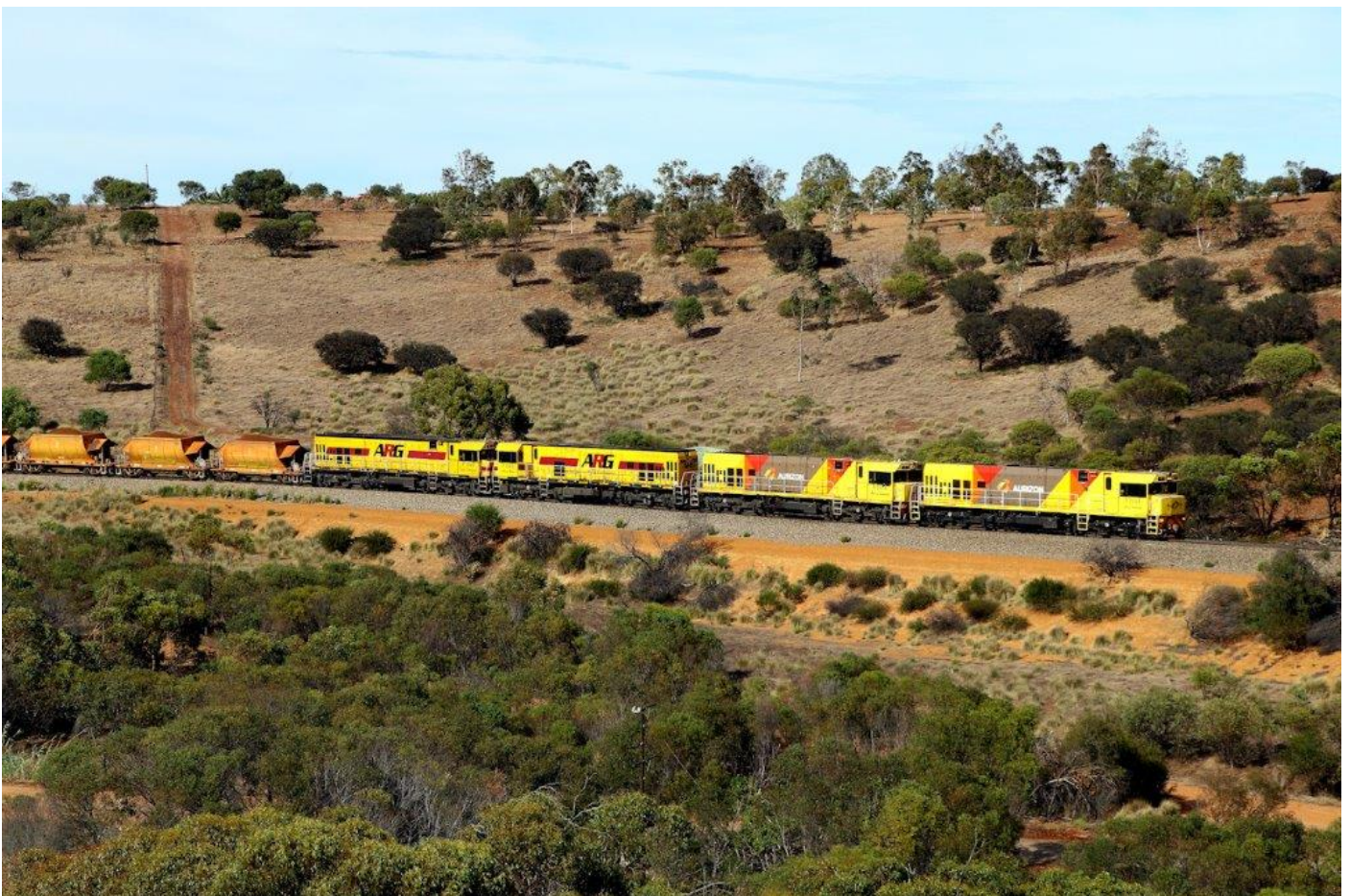
Ps 2506, 2504, 2502 & 2508 haul 6723 loaded Mt Gibson ore through Bringa, 4 th April.