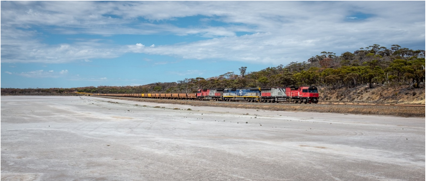
MRL005, CF4405 & MRL001 skirt the shore of Lake Cowan with 4030 empty ore, 5 th February.

The anticipated shortfall in April photos didn't eventuate; some amazing loco combinations late in the month (particularly over the Anzac Day long weekend – see part 2) brought the photographers out, and a few semi-regulars also dusted off their cameras (appreciated, guys!). Excellent news is that we now have a contributor in Esperance so hopefully we will start seeing regular coverage from that region (thanks, Phillip – no pressure!).