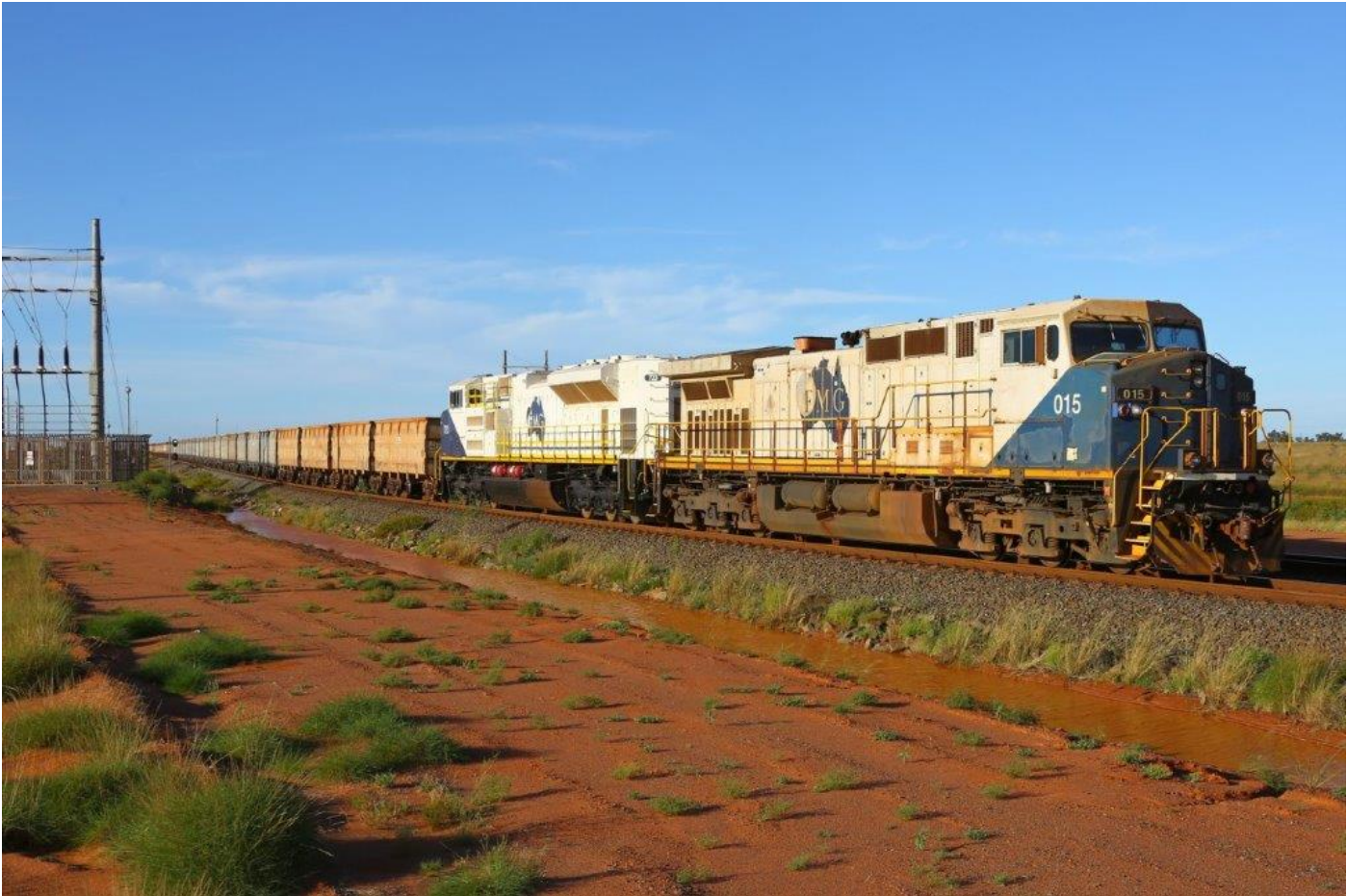
Third empty of the afternoon departs port behind 015 (handrail mods) & new 723, 12/5.