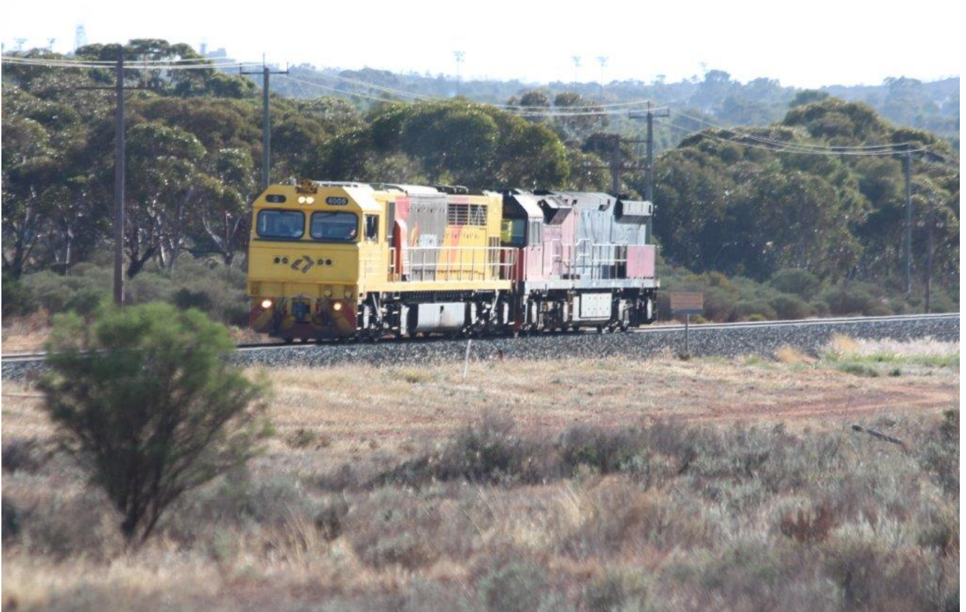
After running 7C71 Parkeston shuttle, Q4006 and MRL003 return to West Kal as 7C72, 11/4.