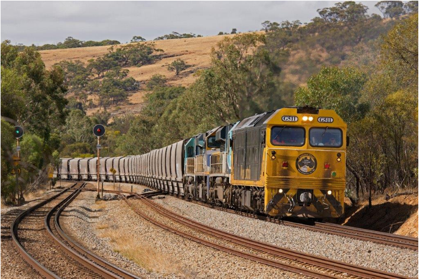
G511, CBH122, VL357 & CBH119, 2S58 loaded grain from Avon Yard, Toodyay West, 24/2.