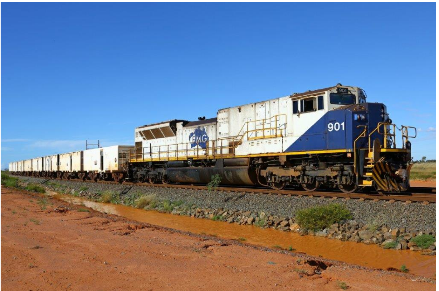
901 shunts four compressor sets at the port, 12 th April.