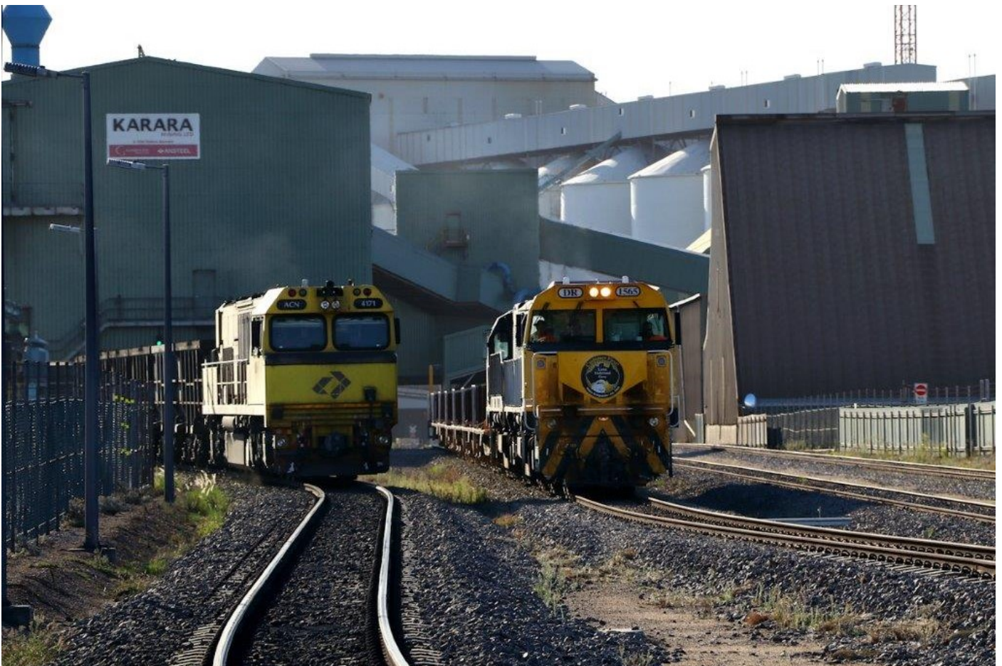
Rear DPU unloading Karara ore, ACN4171 passes DRs 1565 & 1564 on a rail rake, Geraldton, 1/4.