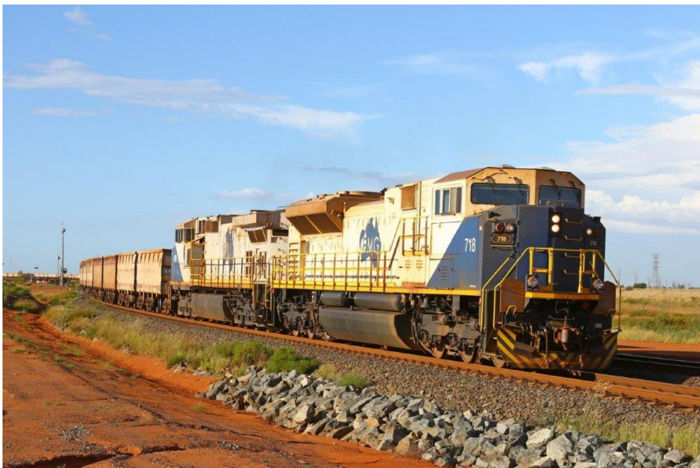
FMG's SD70ACe/LCi 718 leads C44-9W 010 and an empty rake out of the port, 9 th April.