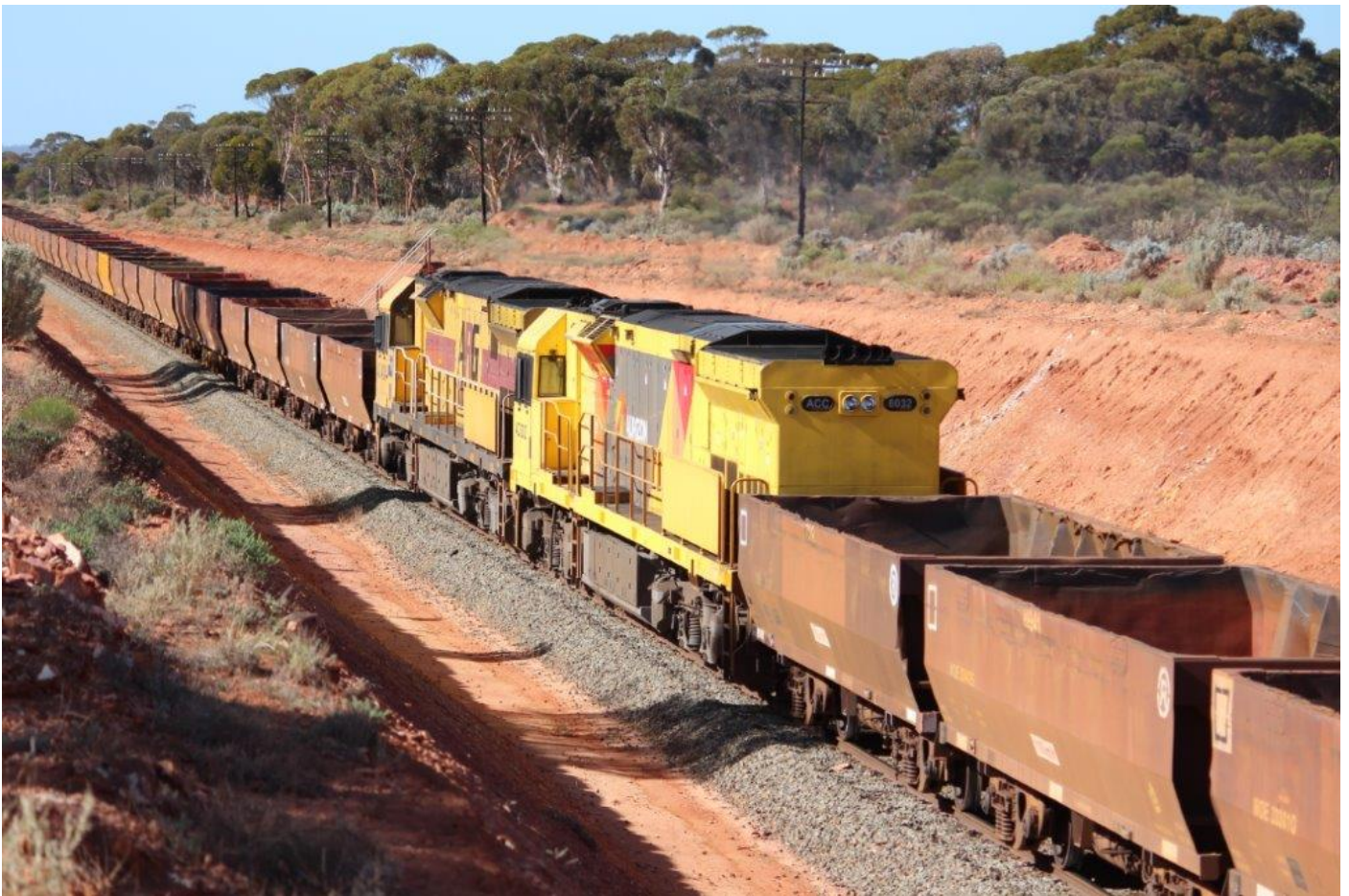
DP locos ACC6032 & AC4304 on 7044 ore, Binduli, 4 th April.