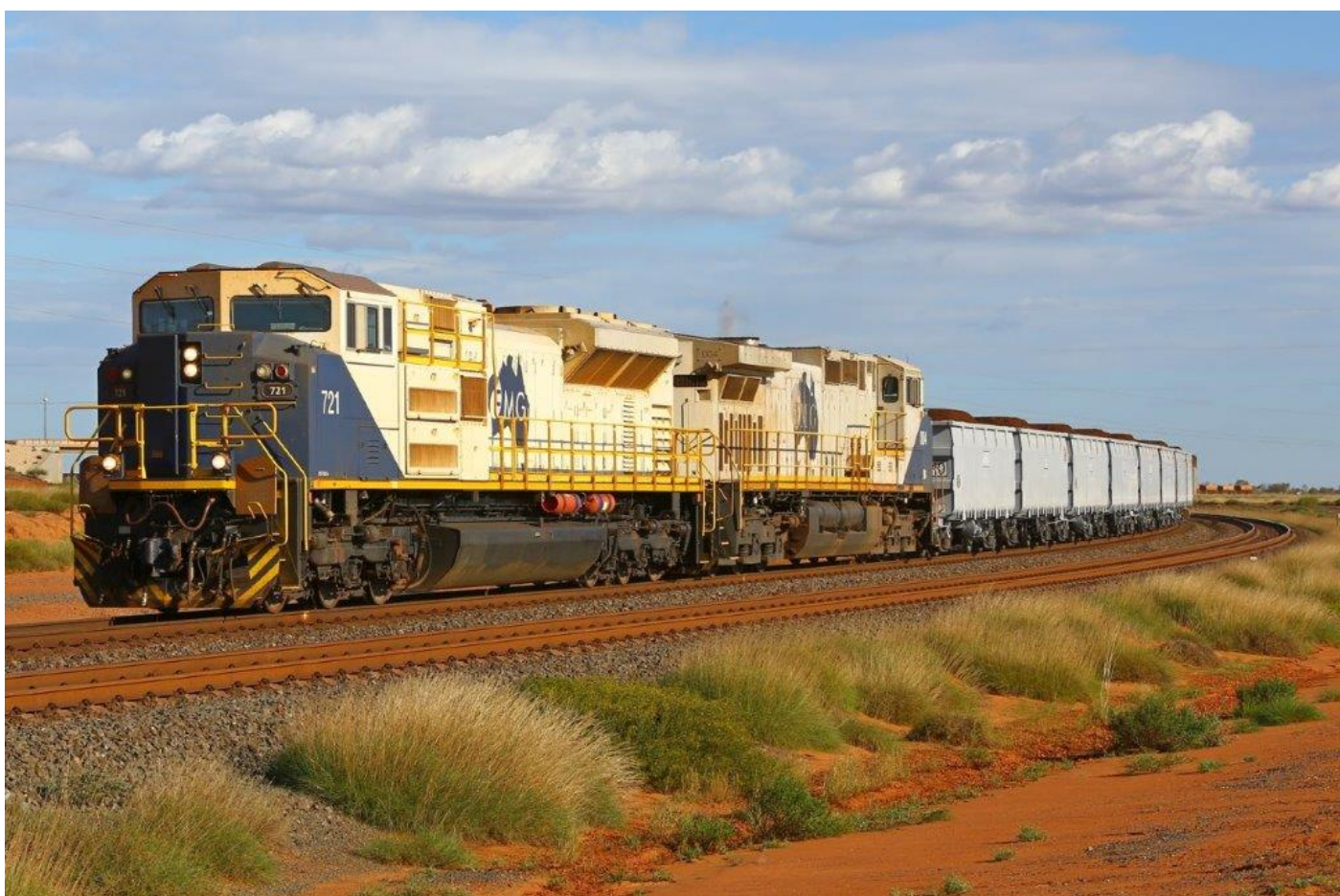
New ore hoppers trail 721 & 004, 12 th April.