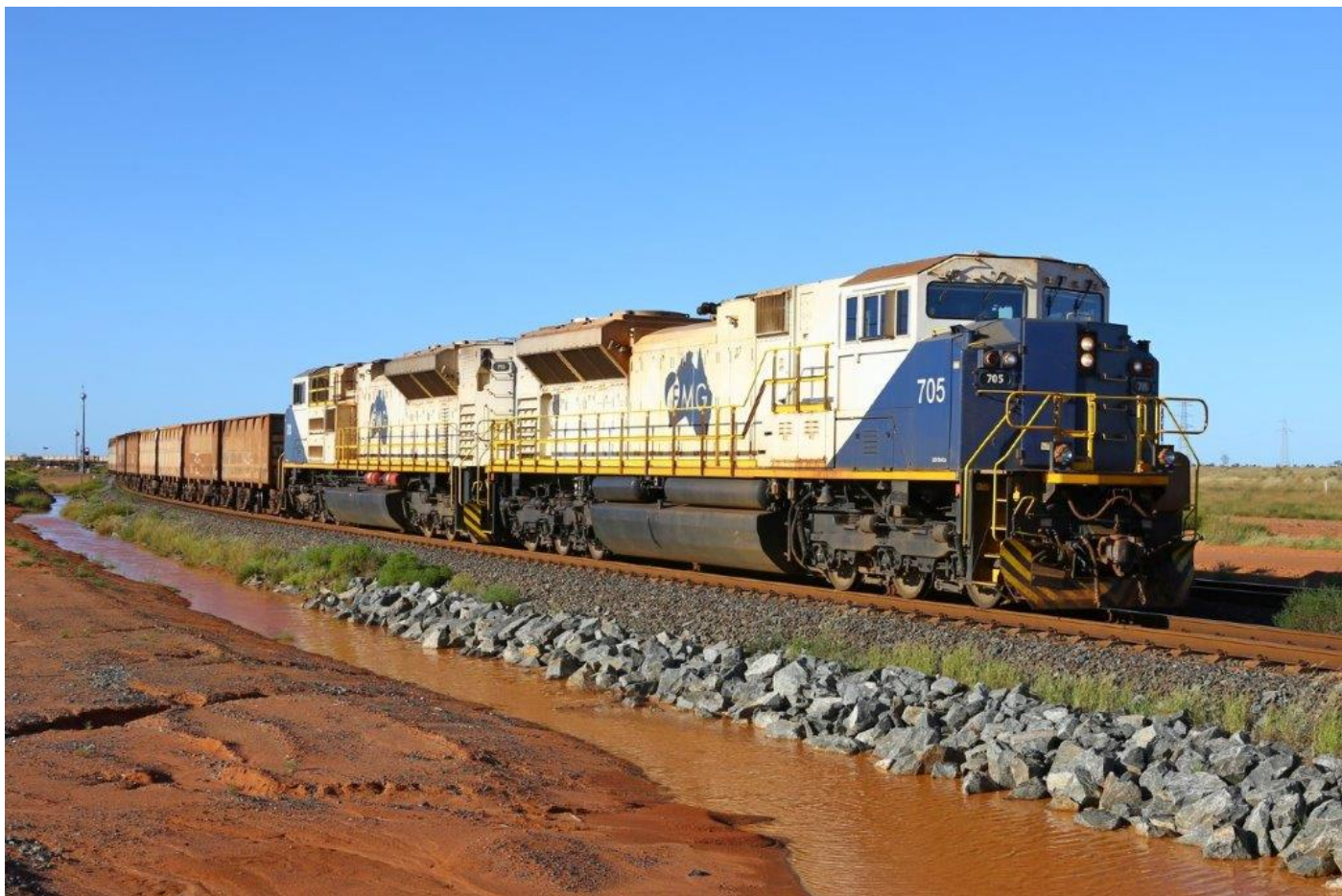
705 with BHP-style handrails & 713 accelerate an empty rake away from port, 10/4.