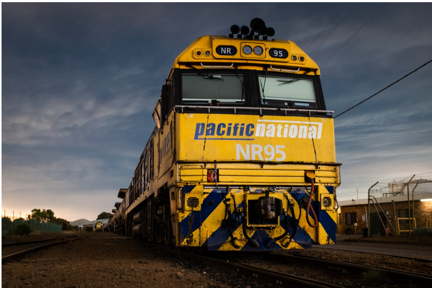
NR95 stands in Viva's fuel yard at Esperance, mid February – NR47 in the background.