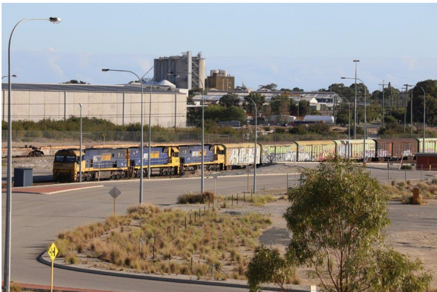
NRs 113, 50 & 72 on the Sadleirs shunt, Forrestfield, 13 th April.