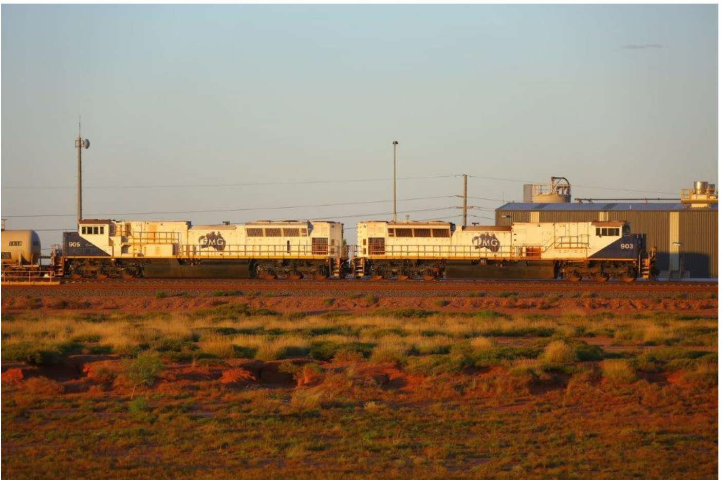
Another re-powered unit, 903 waits with 905 on the loaded fuel train, 10 th April.