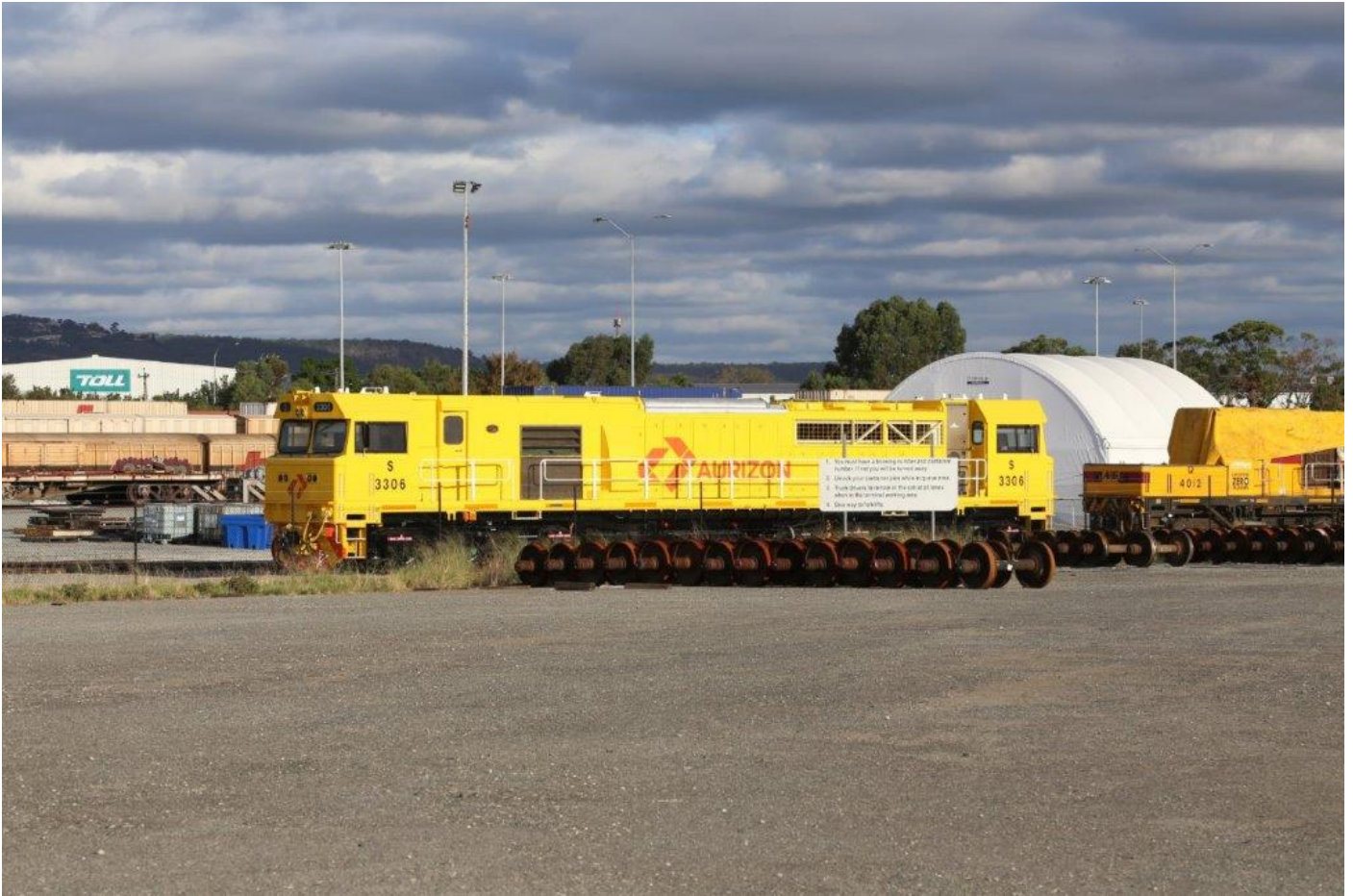
Fresh S3306 and stripped Q4012 outside Gemco Rail, Forrestfield, 12 th April.