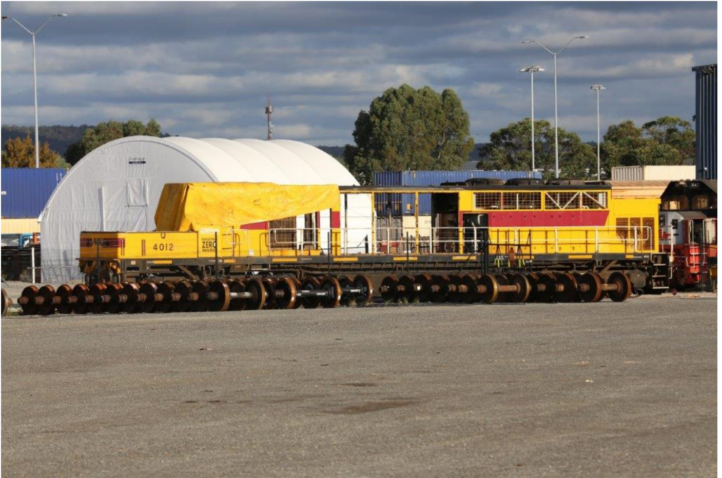
The shell of Q4012, stripped for overhaul, Gemco Forrestfield, 12 th April.