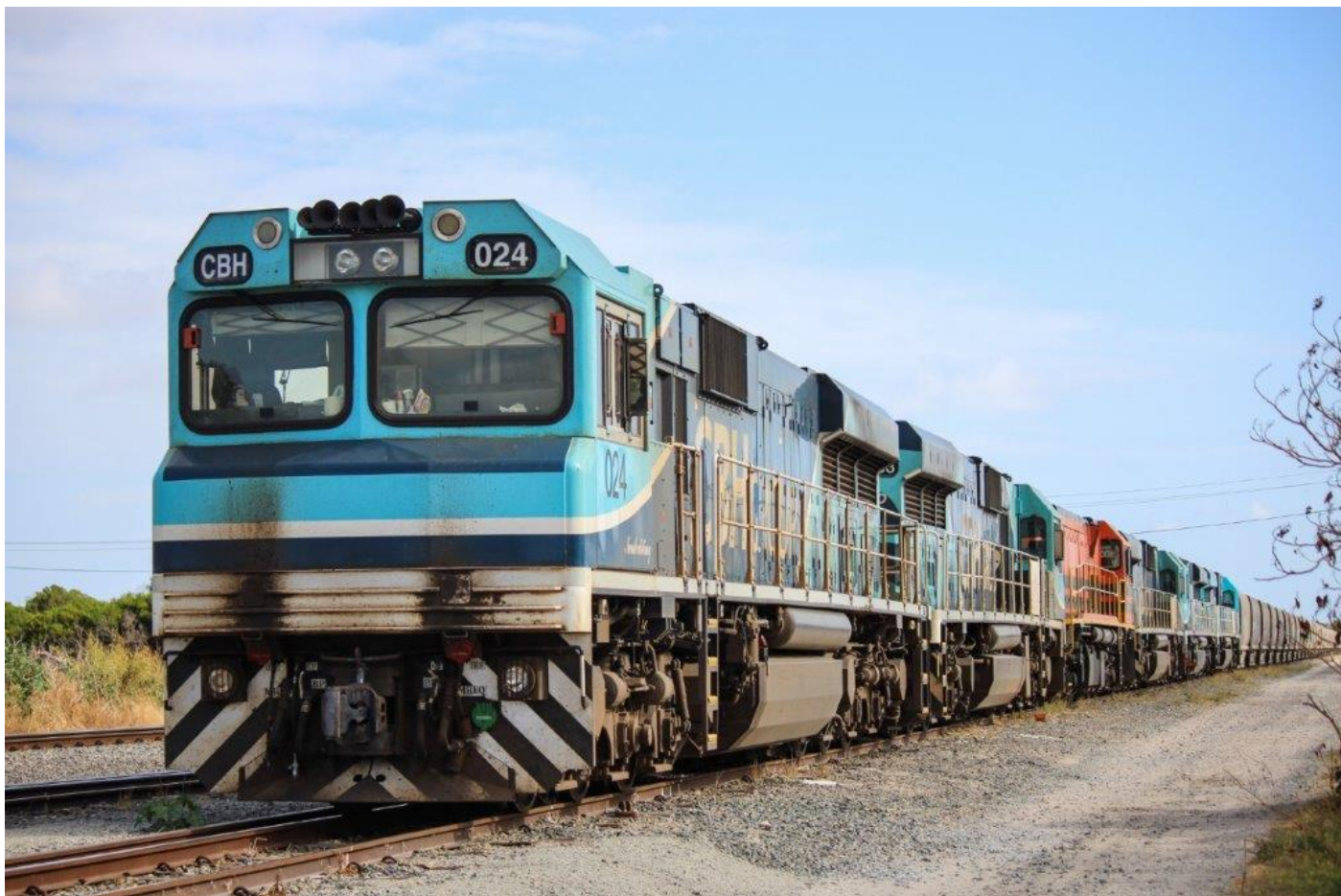
CBHs 024 & 003, DBZ2305 & CBHs 008, 025 & 007 await their next duty at CBH Kwinana, 7 th March.