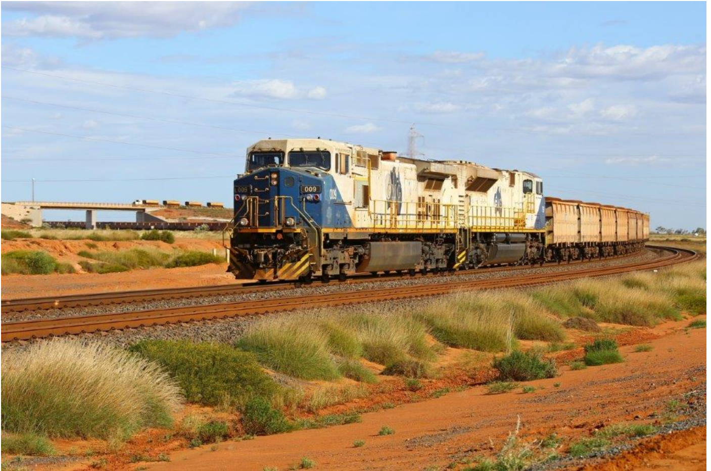
009 & 719 with a loaded iron ore on the 5km curve as a road train of iron ore crosses the bridge, 12 th April.