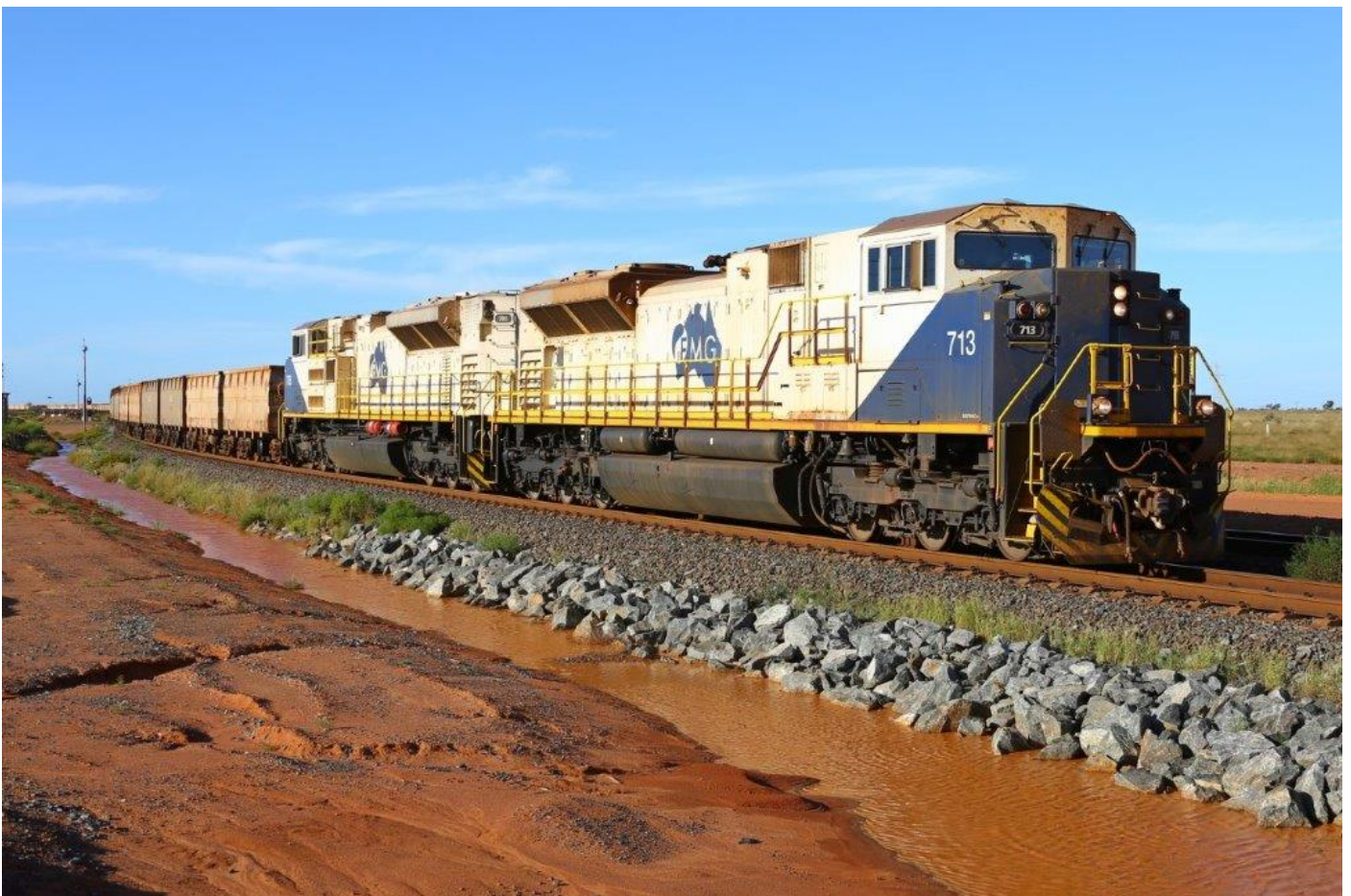
713 & 705 depart the port with another empty rake, 12 th April.