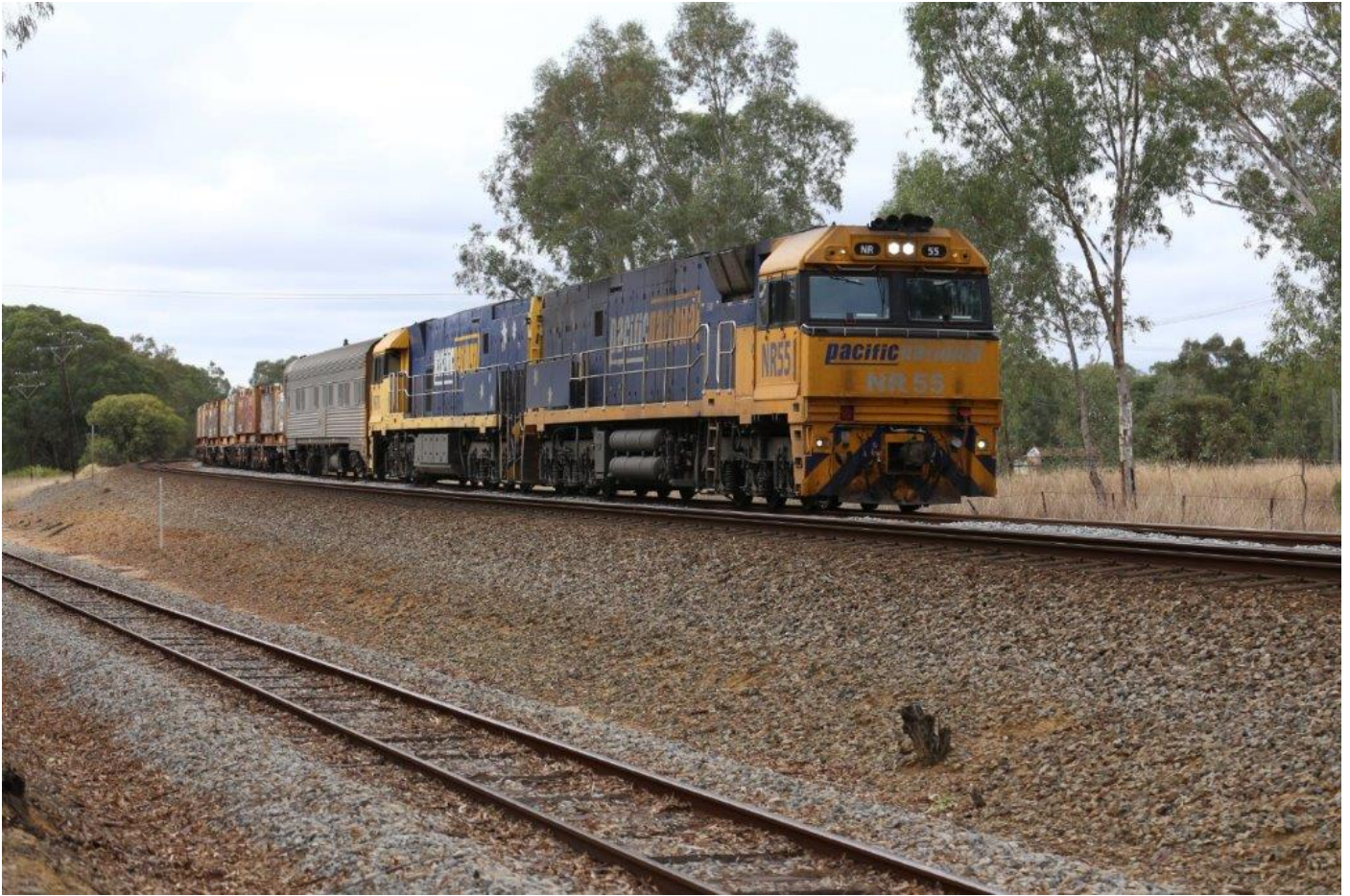
Large-numbered NR55 leads NR70 through Millendon Junction on 5MP2, 12 th April.