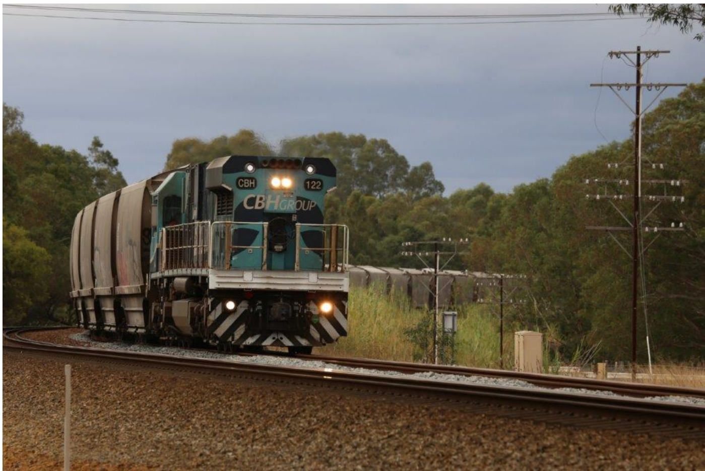
CBH122 eases 1S56 West Merredin – Kwinana grain through Millendon Junction, 12/4.