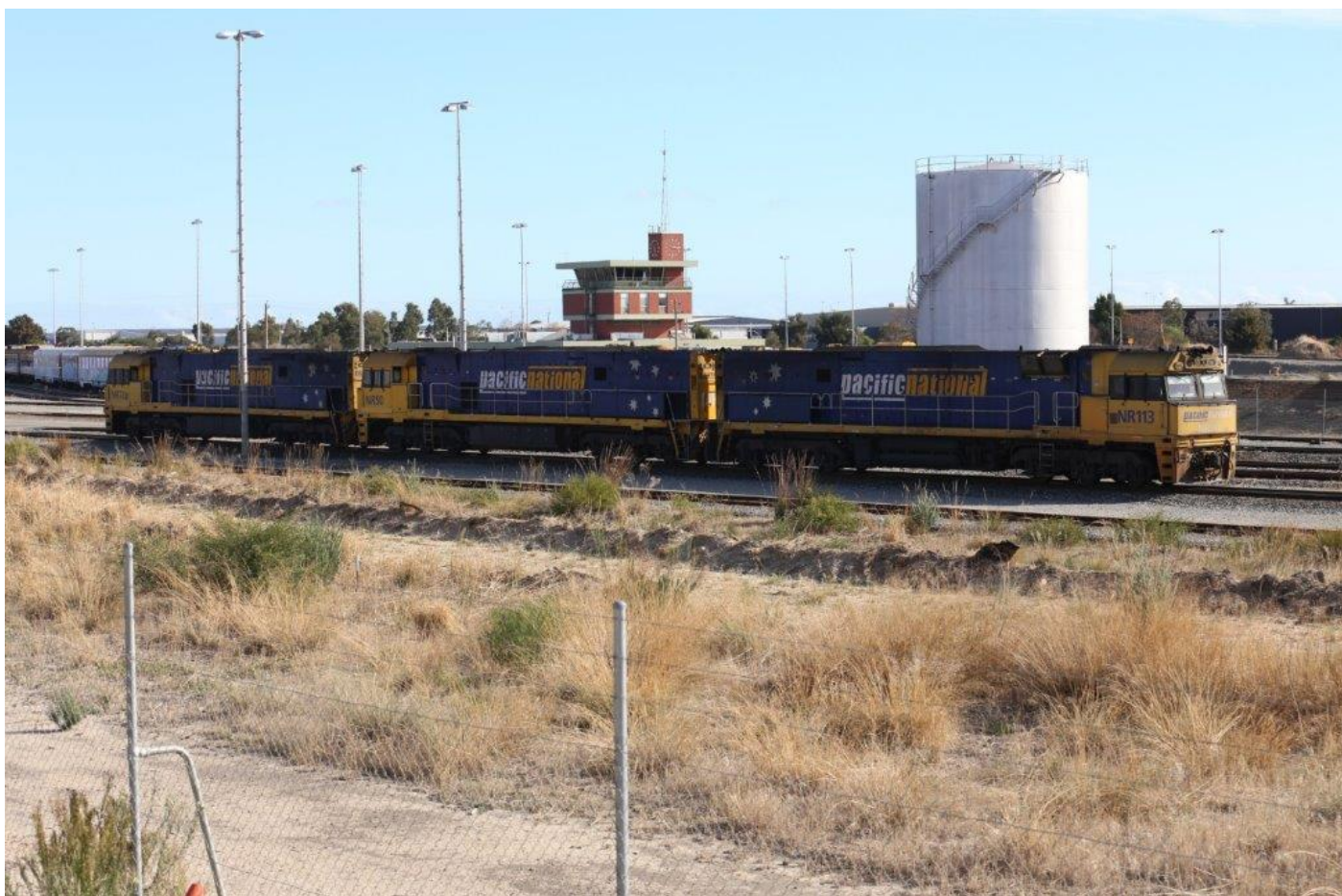
NRs 113, 50 & 72 run around a rake of Sadleirs vans, Forrestfield, 13 th April.