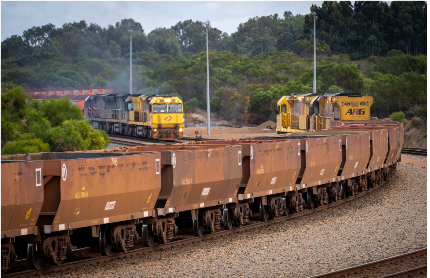
ACC6032, CF4405 & MRL001 enter Esperance yard with PN's 7037 loaded ore, as ACC6031 & AC4306 (with AC4303 & CF4406 DPU) prepare to depart with Aurizon's 1044 empty ore, 19 th April.