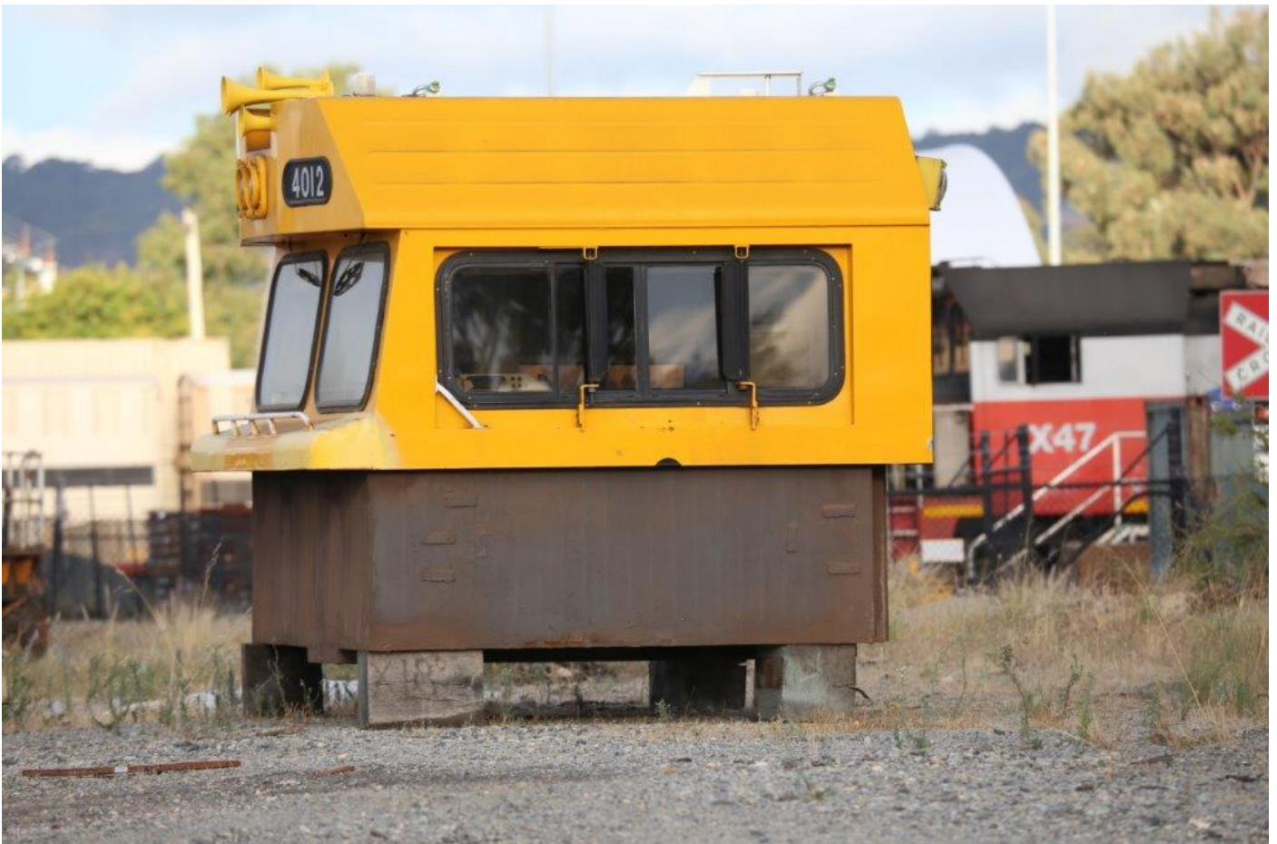
The driving cab module removed from Q4012, Gemco Forrestfield, 12 th April.