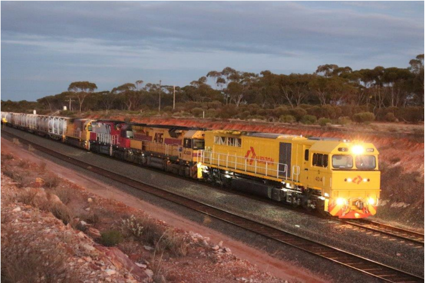
Before sunrise, 7025 approaches West Kal behind Q4014, AC4304, MRL002 & Q4008, 19/4.