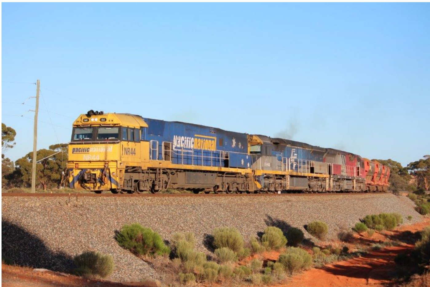
NR44 (at that time the only MinRes NR), CF4406 & MRL005, 7041 ore, Binduli, 4 th April.