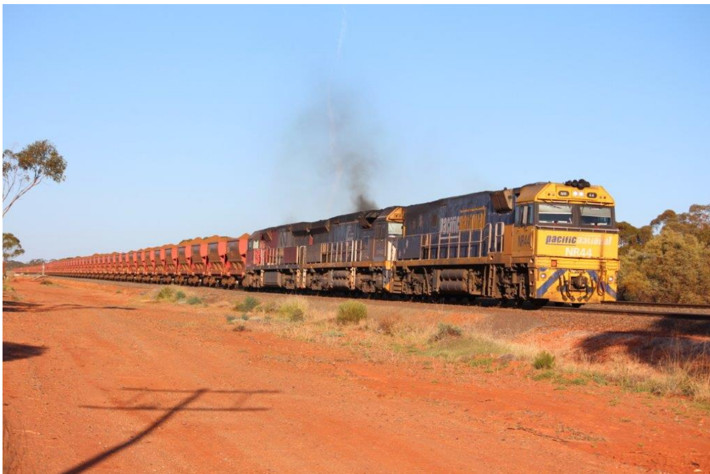
Aurizon's 7041 enters Binduli behind NR44, CF4406 & MRL005 – note no Aurizon loco, 4/4.