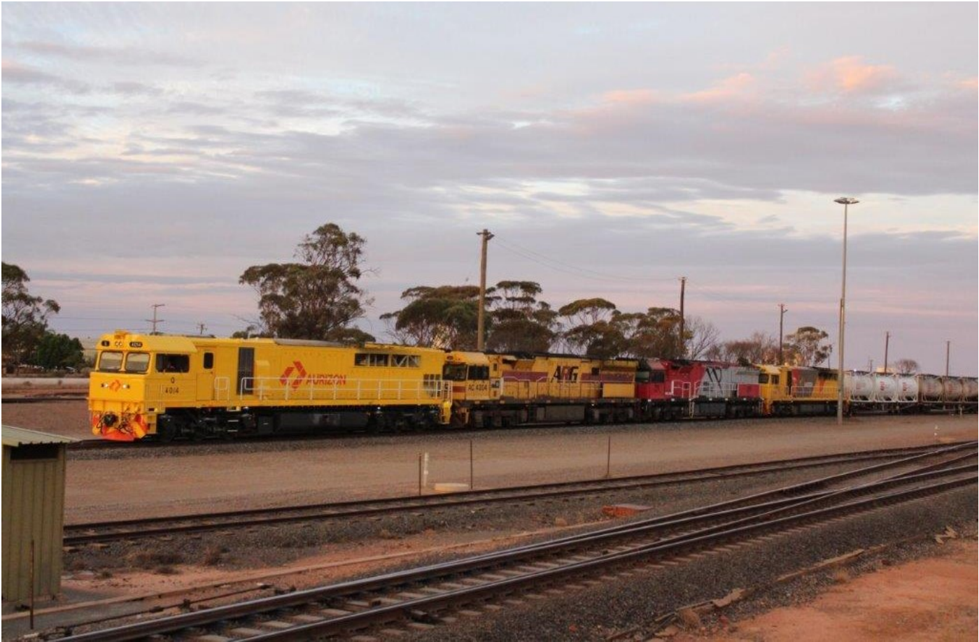
Q4014, AC4304, MRL002 & Q4008 shunt 7025, West Kal, 19 th April.