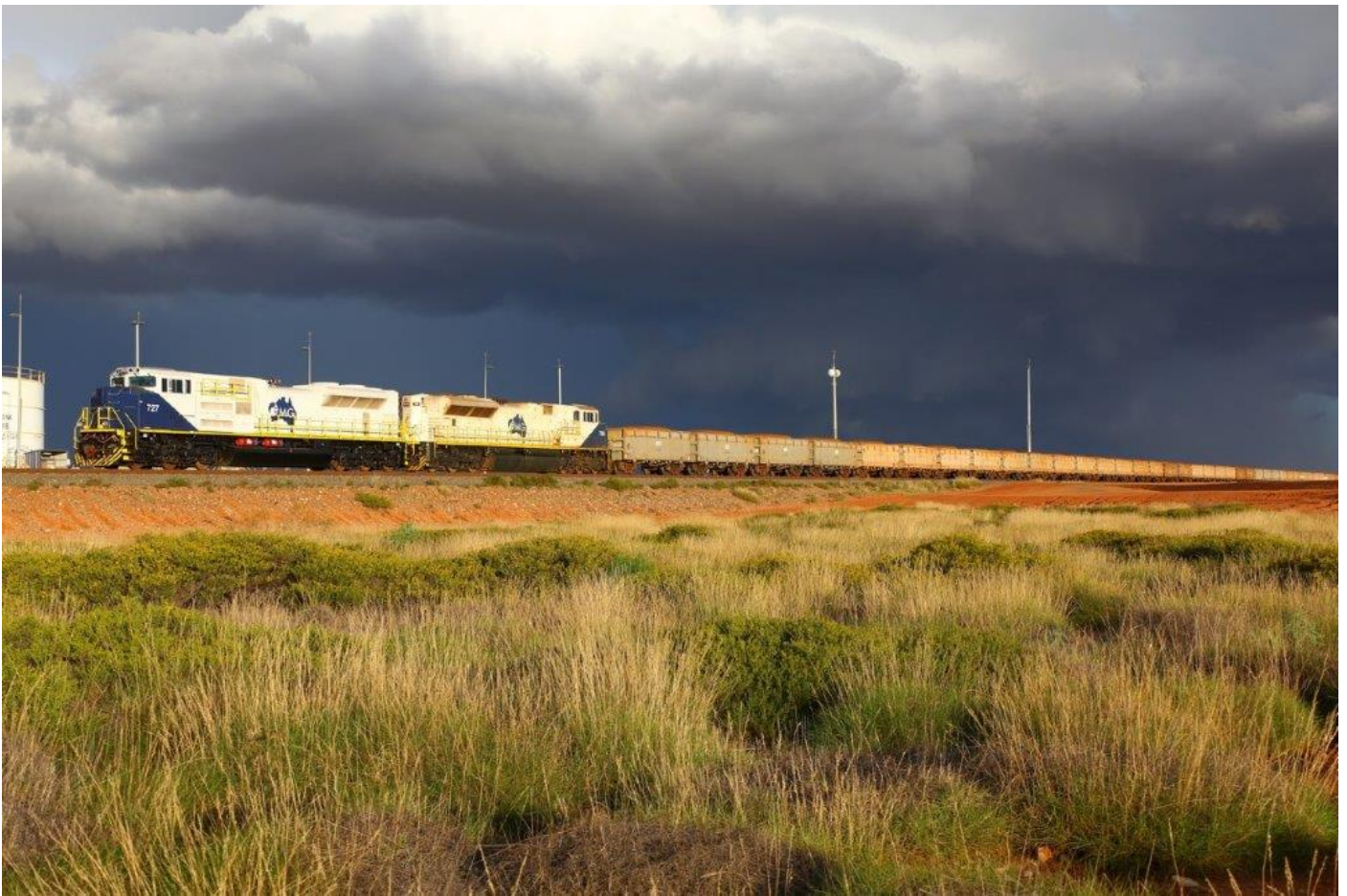
FMG loaded ore waits outside Kanyirri Yard behind new SD70ACe 727 and old SD70ACe/LCi 706, 9 th April.