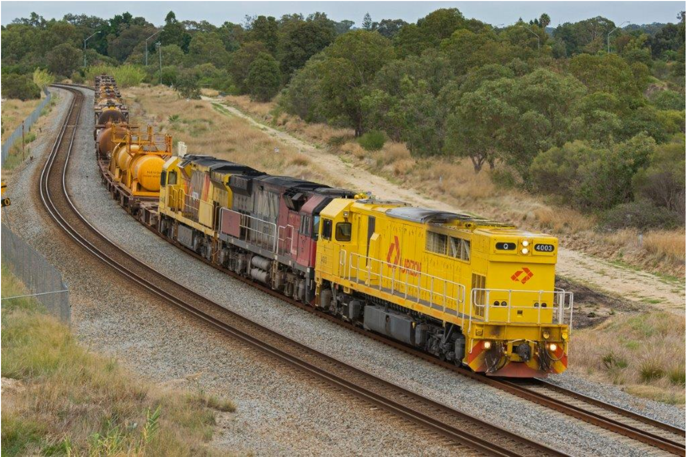
Q4003, MRL003 & ACB4402 on BP & maintenance shuttle, Wattle Grove, 29 th March.