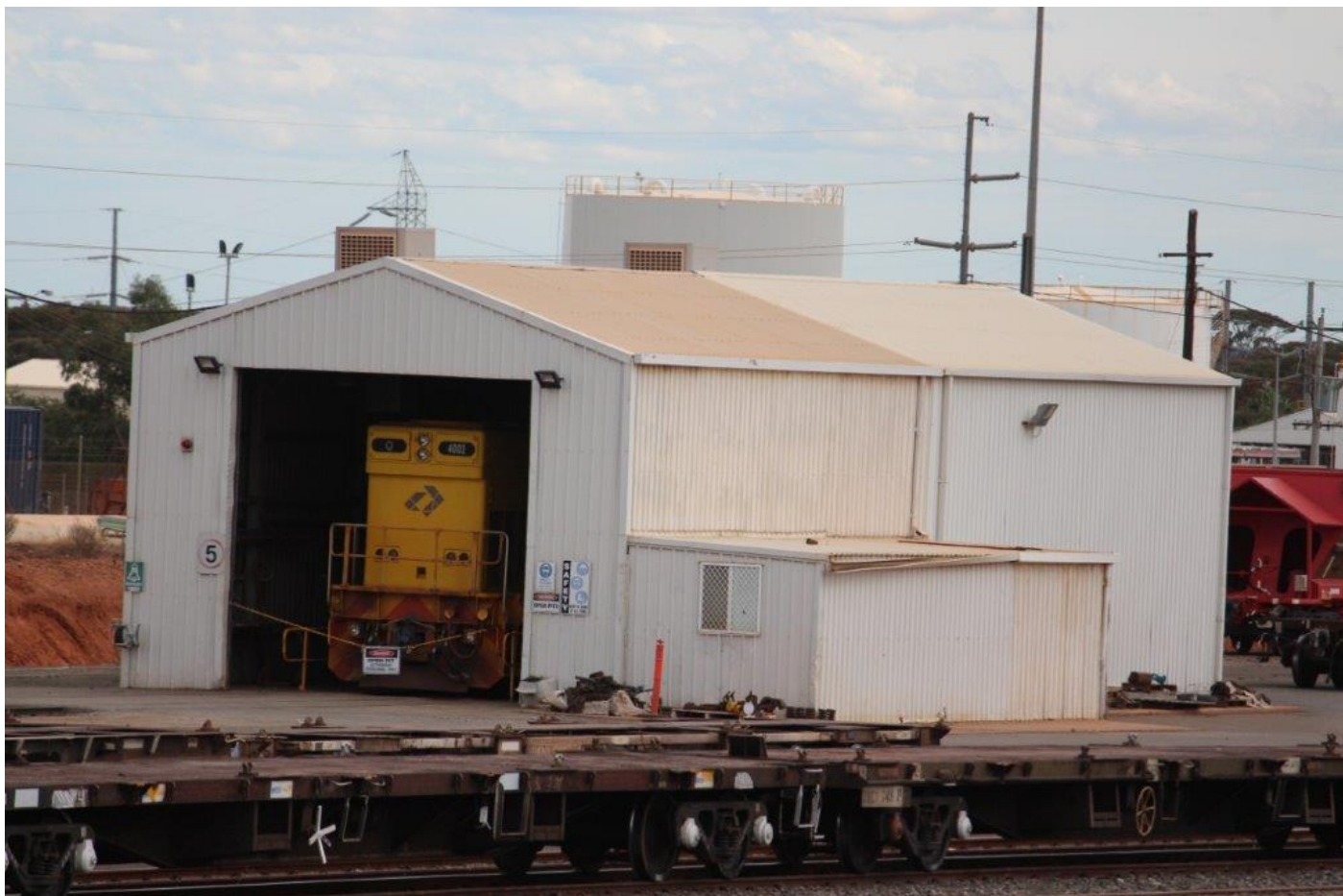
After a minor derailment at Hampton 10 days earlier, Q4002 receives attention, 14/4.