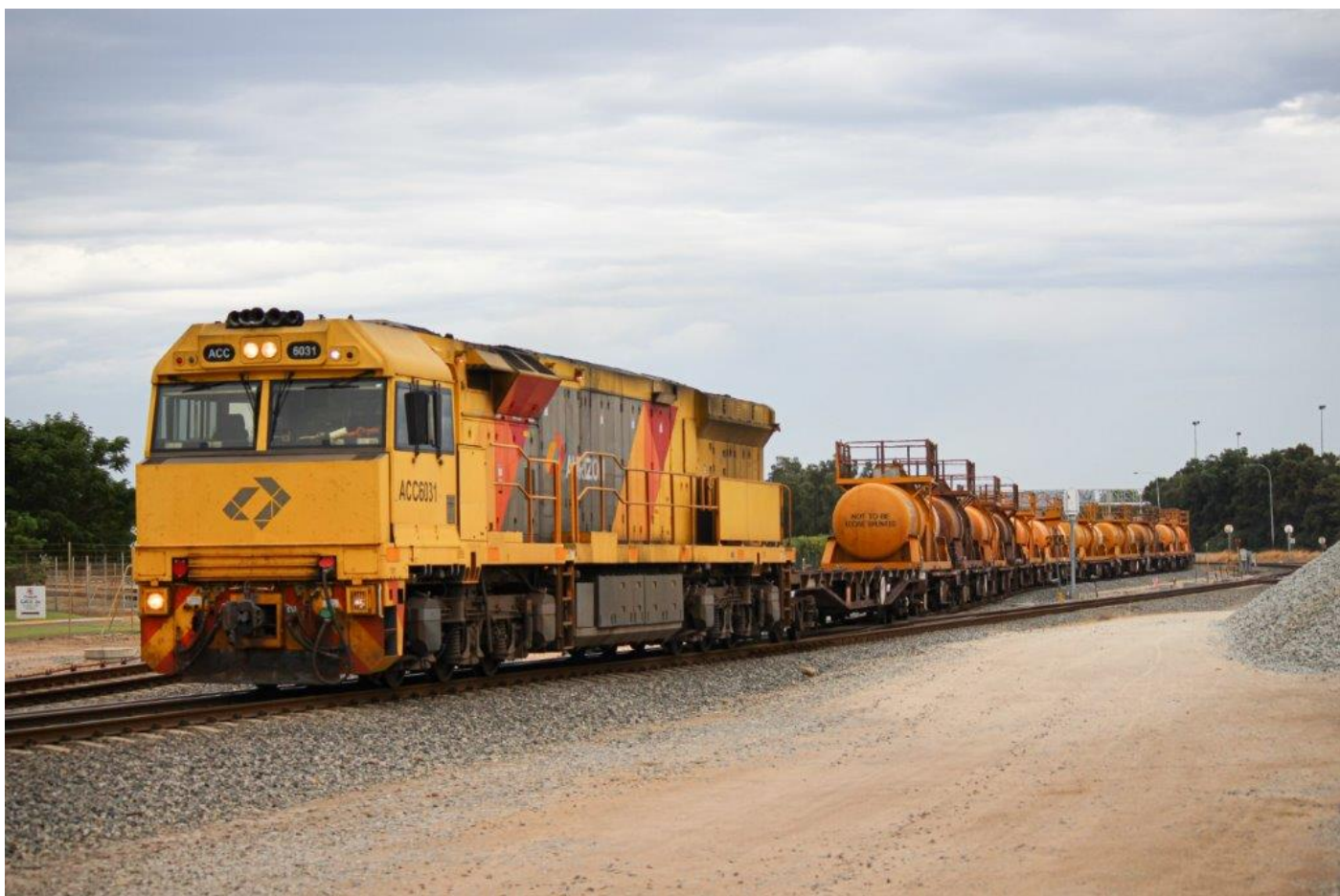
ACC6031 shunts sulphuric acid tanks at Kwinana, 14 th March.