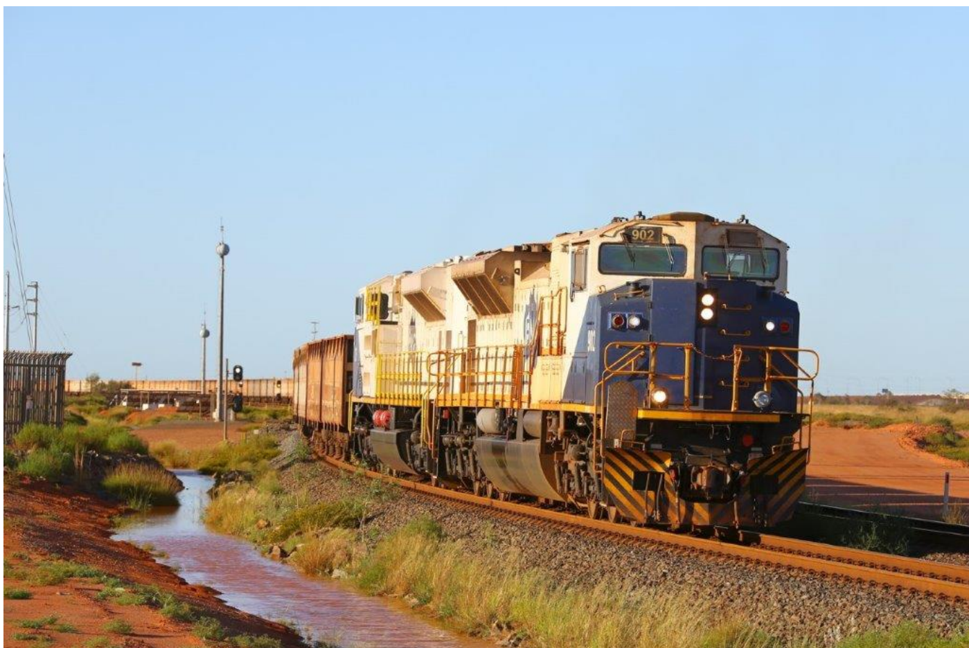
Originally 6000hp but repowered locally to 4300hp, 902 leads new 725 away from port with empties, 10 th April.