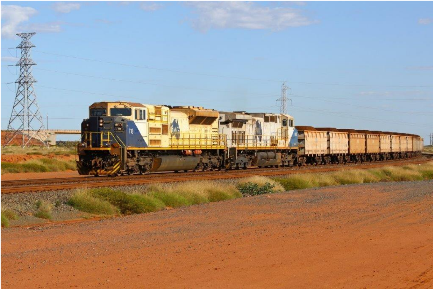
A loaded FMG ore rounds the 5km curve behind 718 and 010, 10 th April.