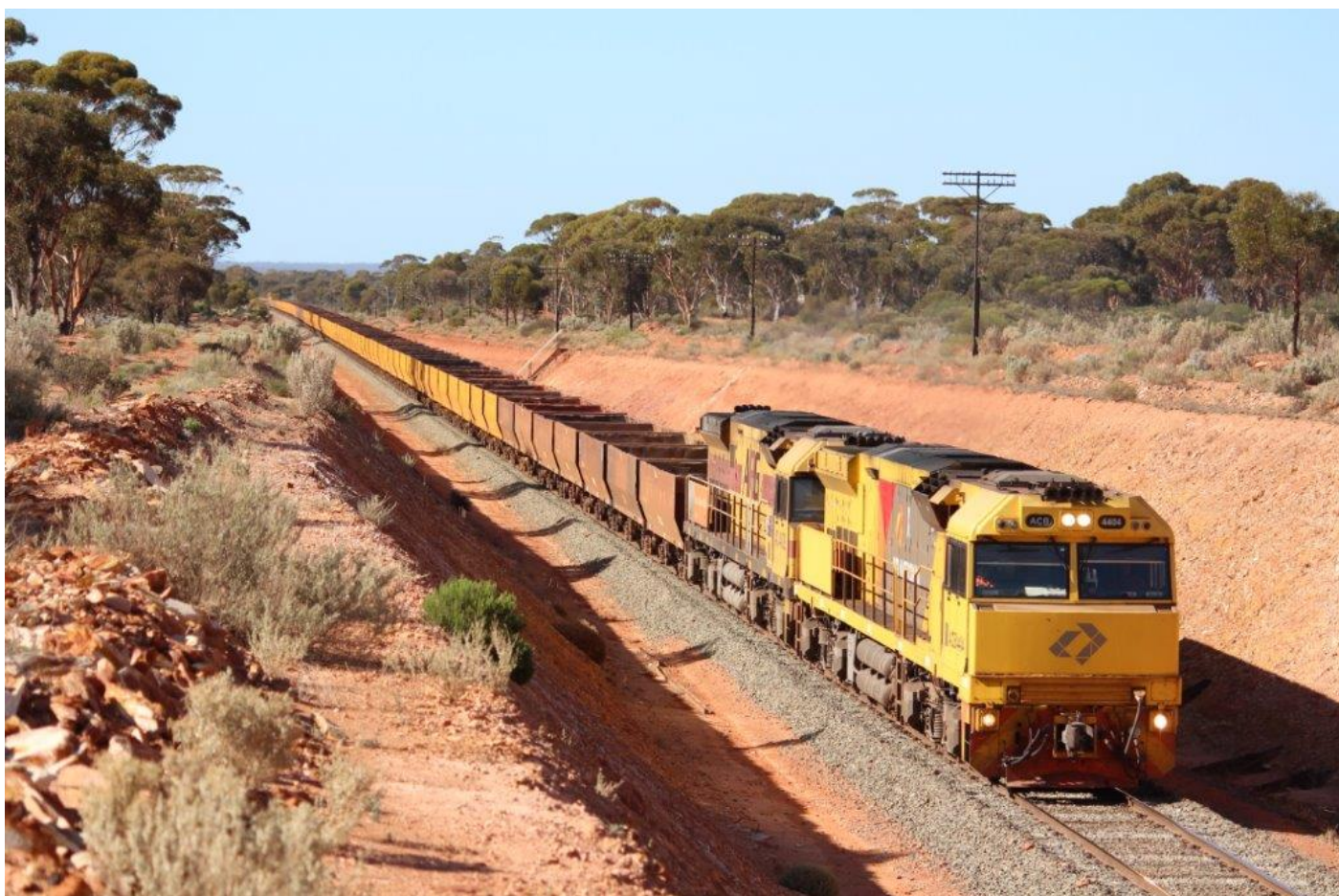
Aurizon's 7044 approaches Binduli behind ACB4404 & AC4308, 4 th April.