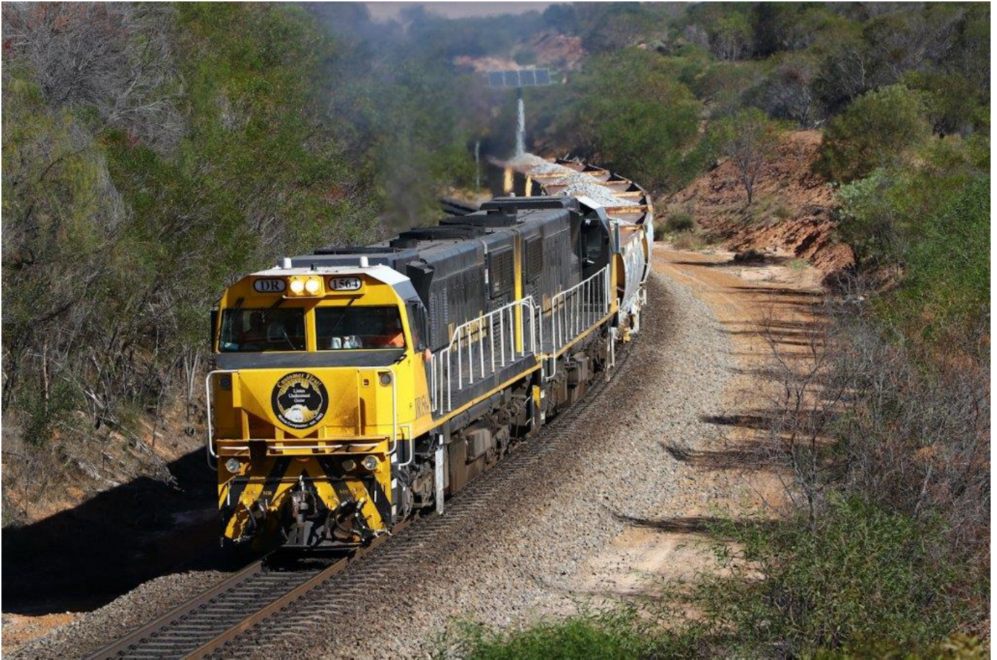
DRs 1564 & 1565 chug through Bringo on 3BT2 ballast, 14 th April.