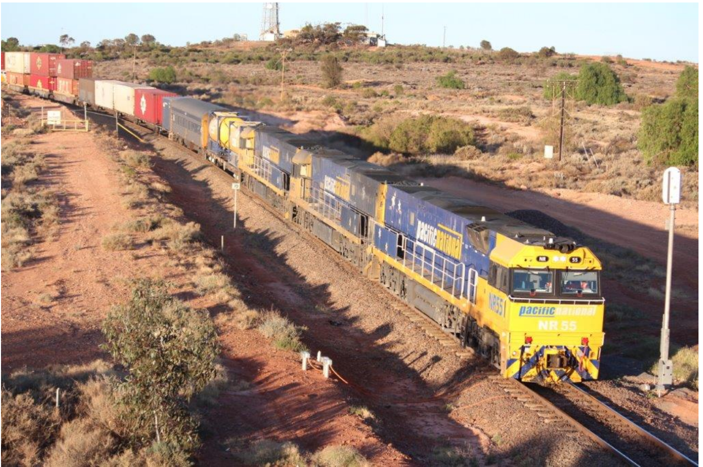
PN are trialling in-line fuelling again – NRs 55, 92 & 94 lead two tanks on 2MP5 approaching Kalgoorlie, 29 th April.