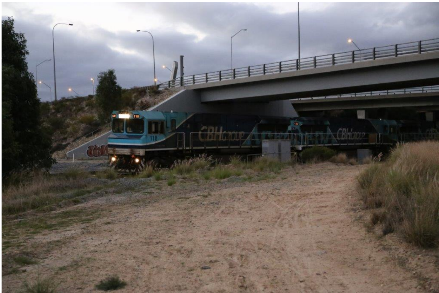
CBHs 118, 122 & 119 bring 2S56 ex West Merredin under Tonkin Hwy, 27/4.