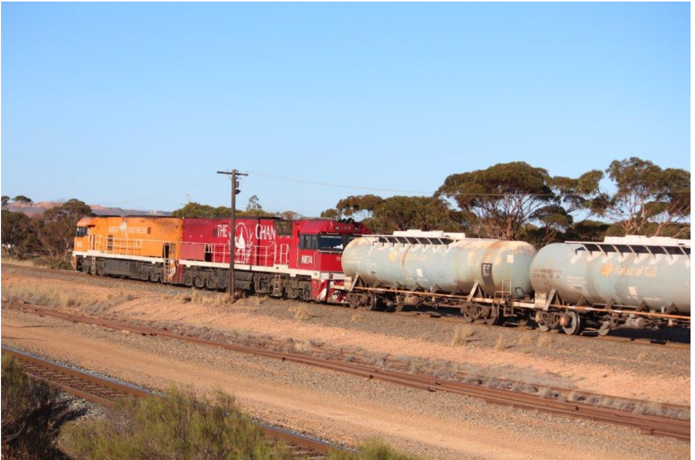
NRs 30 & 74 shunt tanks at West Kalgoorlie in preparation for 5445 empty fuel to Esperance, 30 th April.