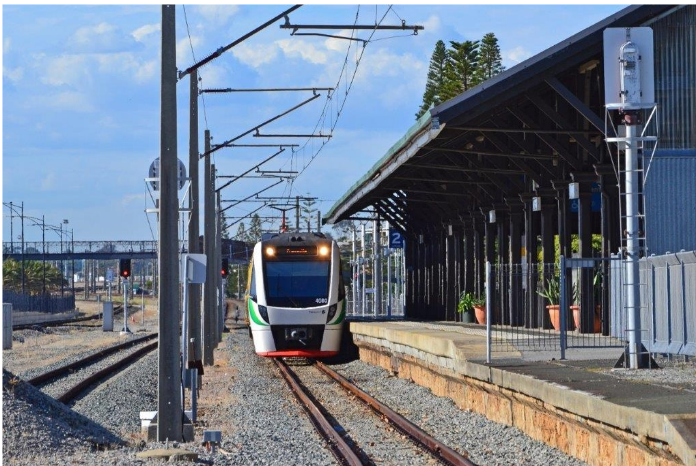
EMU set 80 at Fremantle, 26 th April.