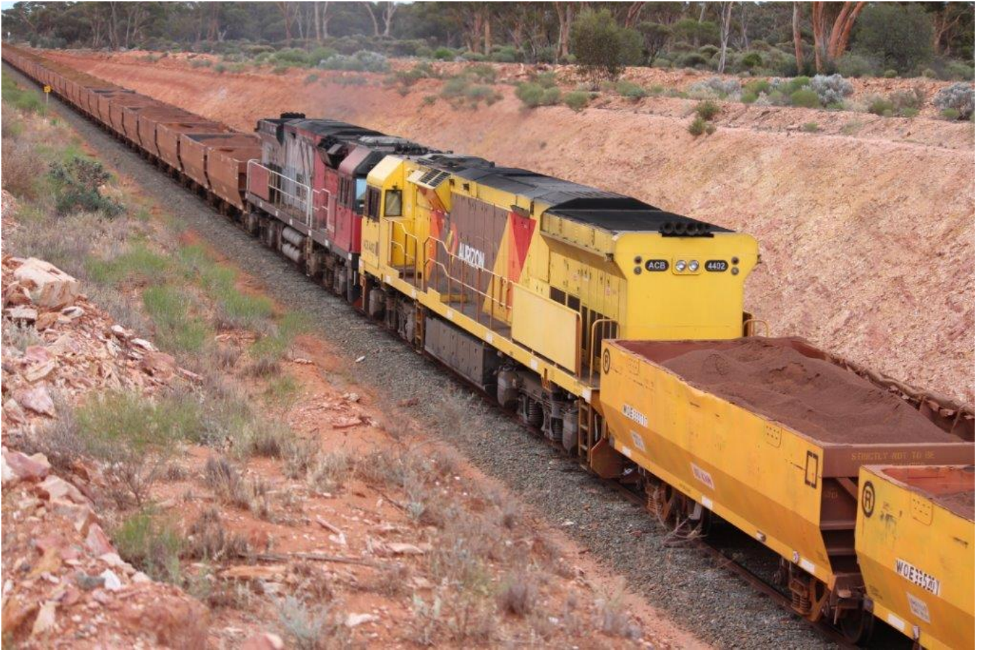
ACB4402 & MRL003 give 7043's 14,000 tonnes a helping hand away from Binduli, 25 th April.