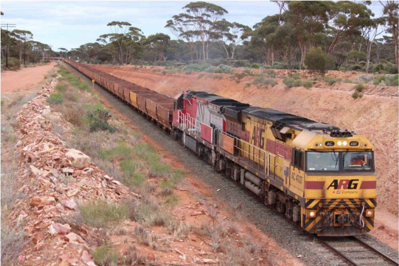
The fresh Esperance crew power 7043 away from Binduli, 25 th April.