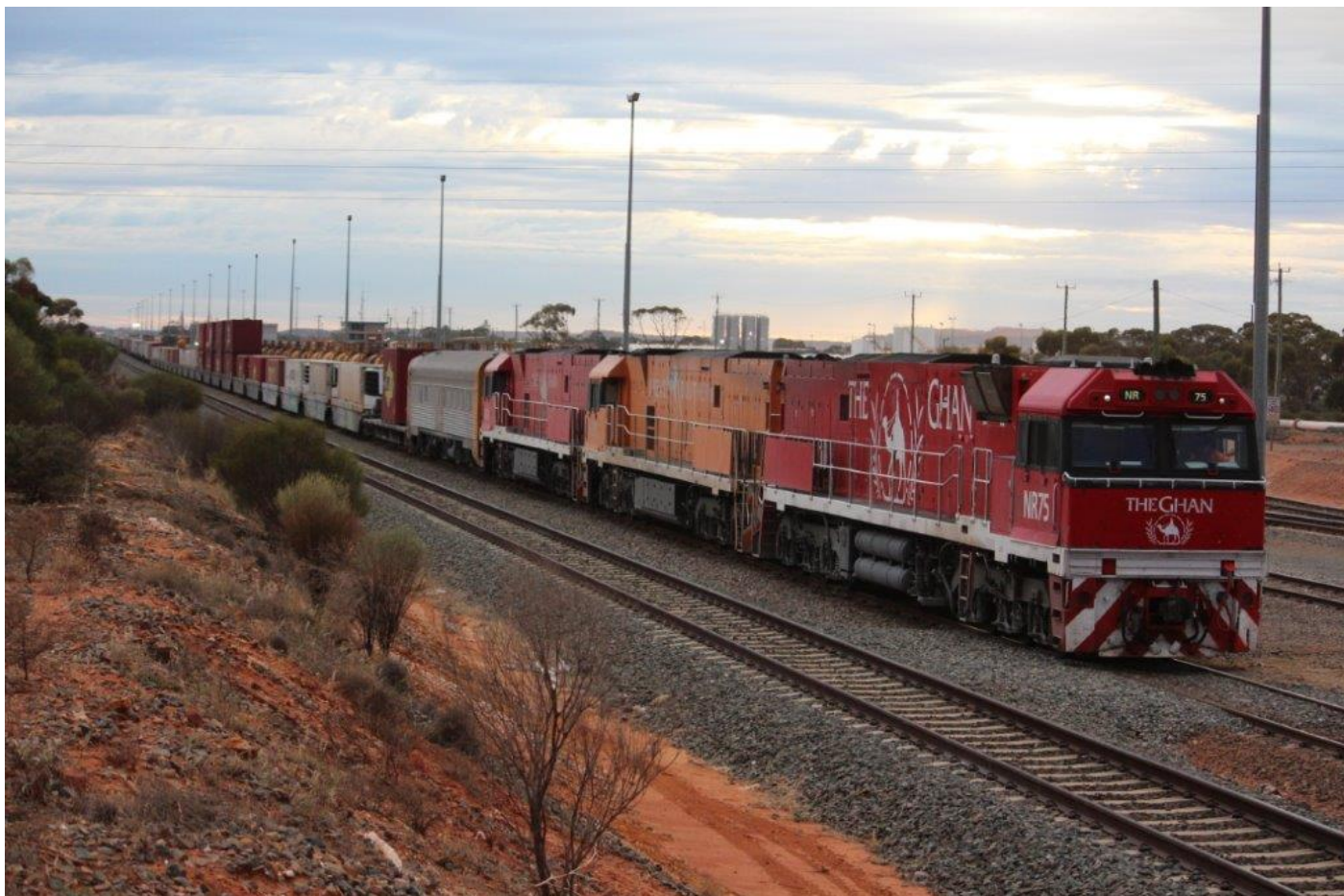
NRs 75, 31 & 18 on 5SP5 at West Kal, 25 th April.