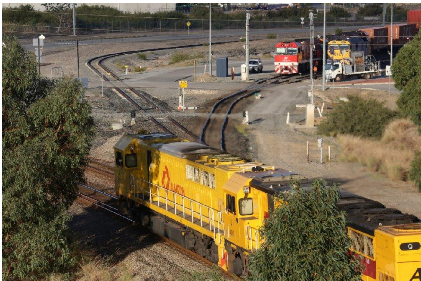
Qs 4013 & 4003 lead 7426 ex Kalgoorlie past 1PS6 and 8121 at Kewdale, 26 th April.