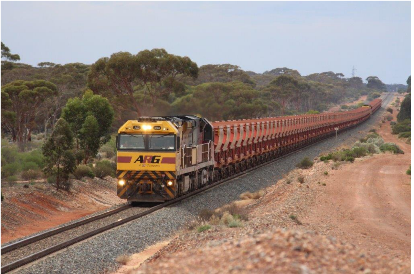
AC4304 & MRL006, ACC6032 & CF4406 DP, Aurizon's 7044 at 628km; one of the first MHPY DP runs, 25 th April. Note the damaged MRL steps taped off, following a level crossing collision a week earlier.