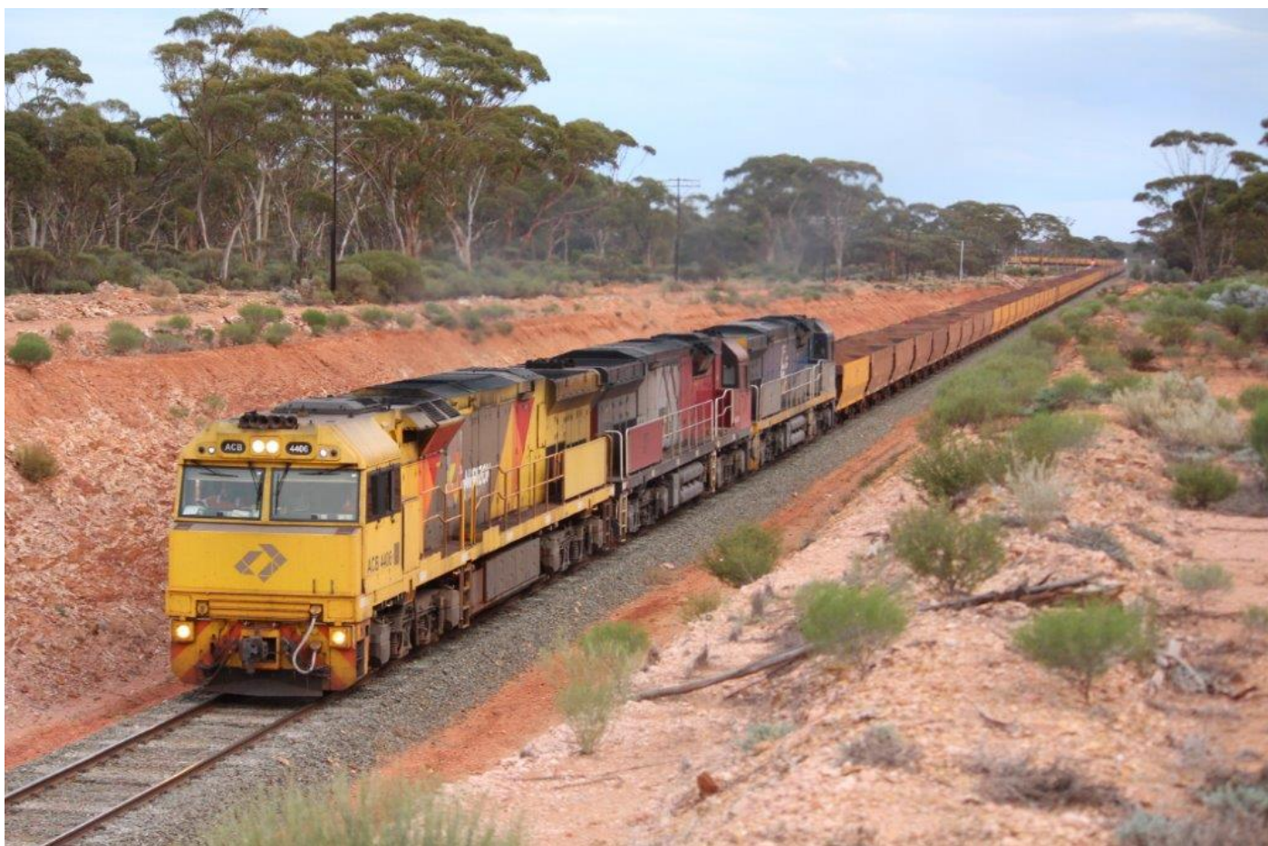
ACB4406, MRL005 & CF4405 depart Binduli on 7031 ore (PN service), 25 th April.