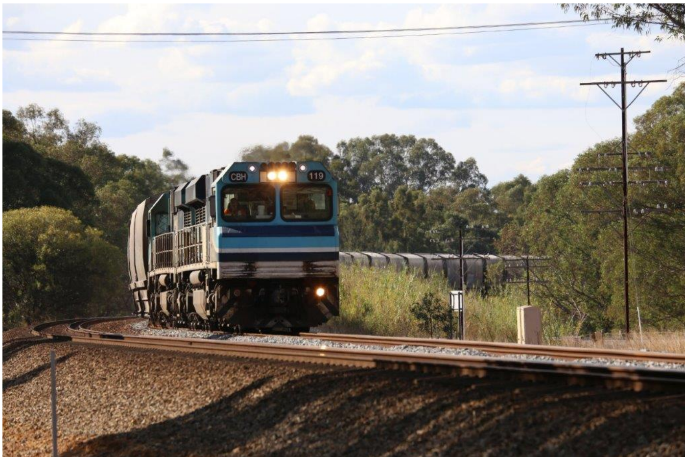
Standard gauge CBHs 119 & 118 run 1S56 grain through Millendon Junction, 26 th April.