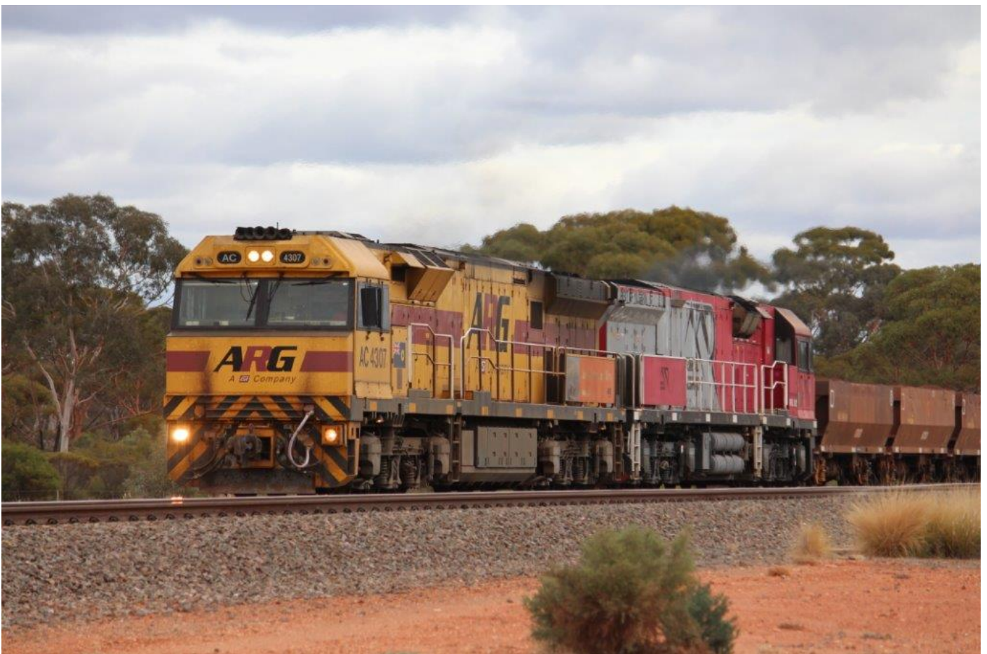
AC4307 & MRL002 scream into Binduli with Aurizon's 7043 loaded ore, 25 th April.