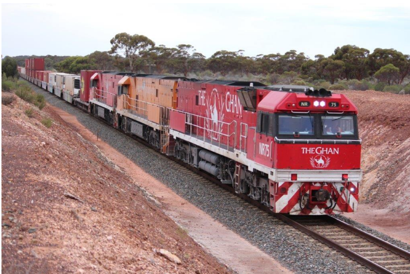
NRs 75, 31 & 18 slow 5SP5 on approach to the weighbridge, 628km, 25 th April.