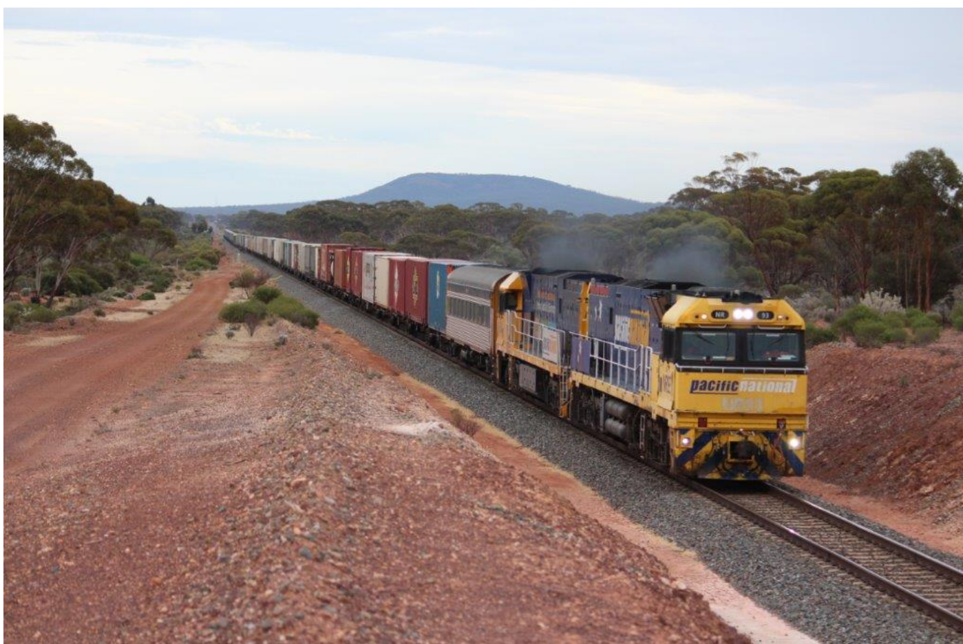
Mt Burges looms behind NRs 93 & 34 as they accelerate 6PS7 away from the Bonnie Vale weighbridge, 25 th April.