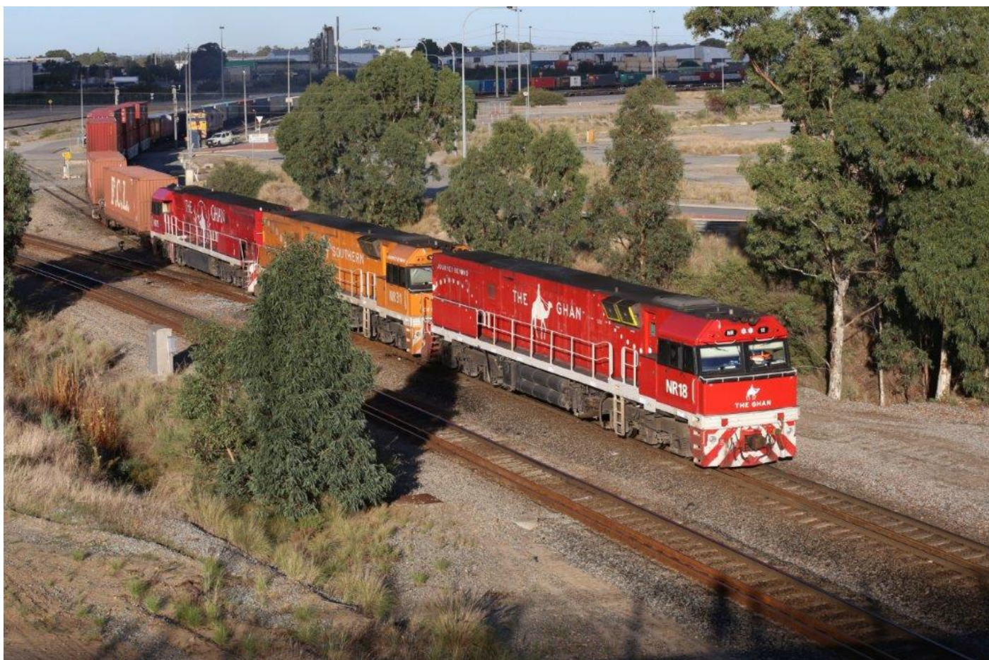
1PS6 departing Kewdale, 26 th April.