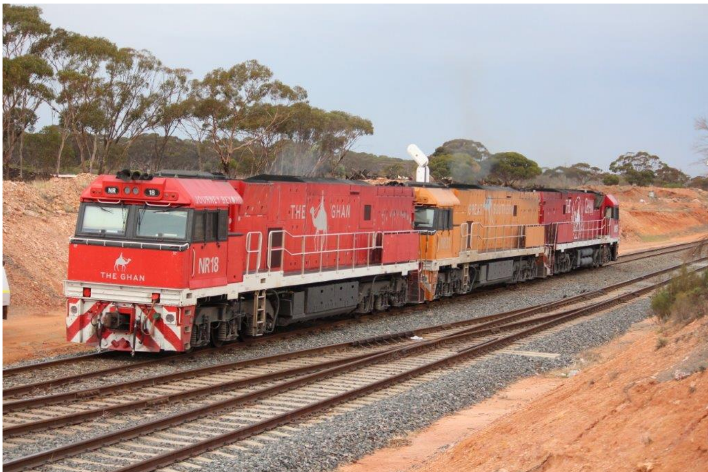
5SP5's locos have just shunted off the crew coach, West Kal, 25 th April.