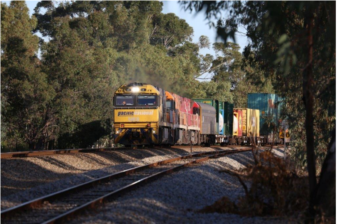
NRs 8, 30 & 109 work 1PM5 through Millendon Junction, 26 th April.