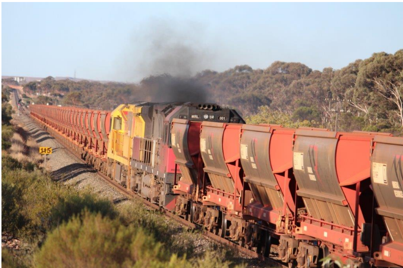
MRL001 & ACC6032 provide extra grunt two-thirds of the way along 2042, Binduli, 20 th April.