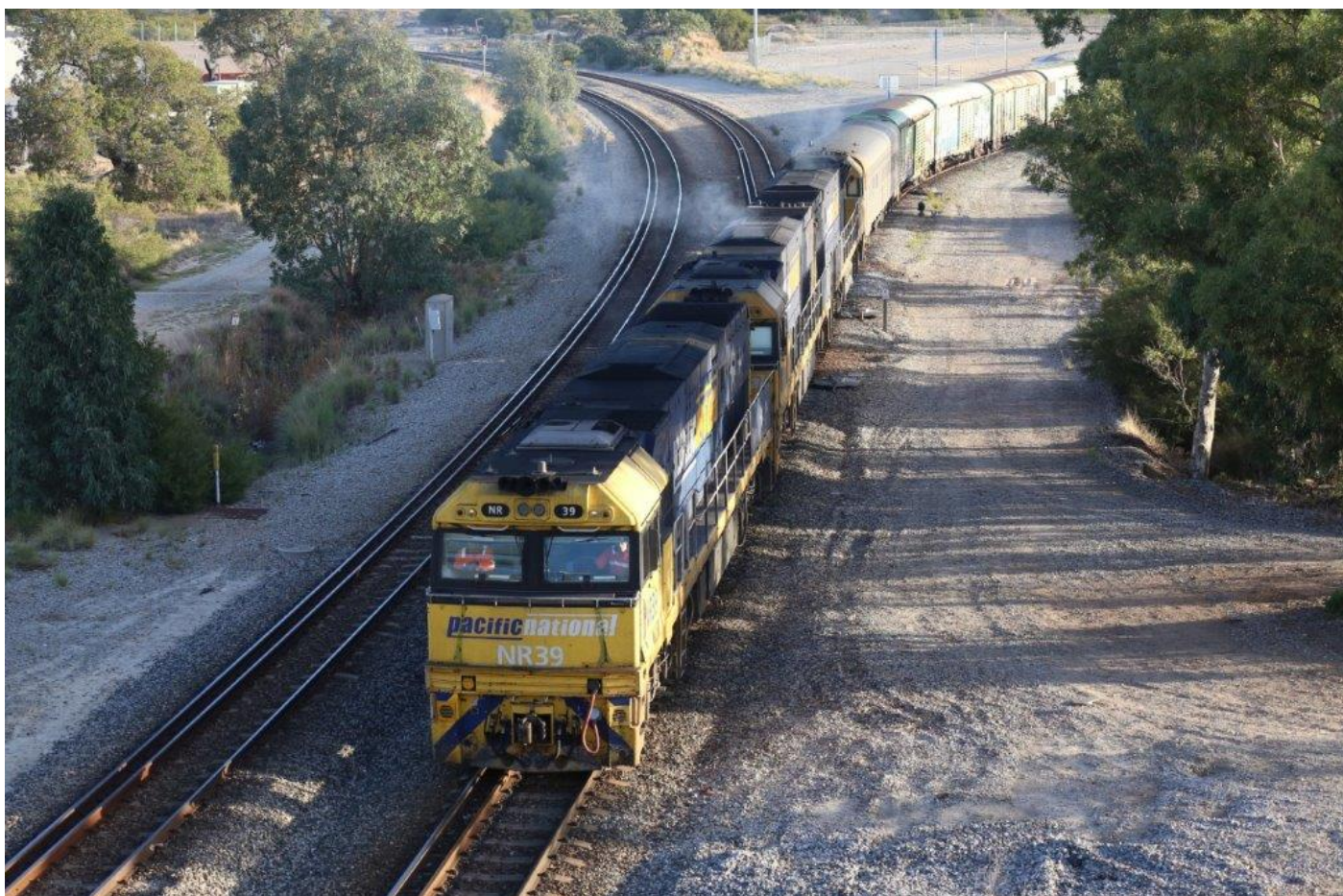
NRs 39, 50 & 19 on 2PM5 departing Kewdale, 27 th April.