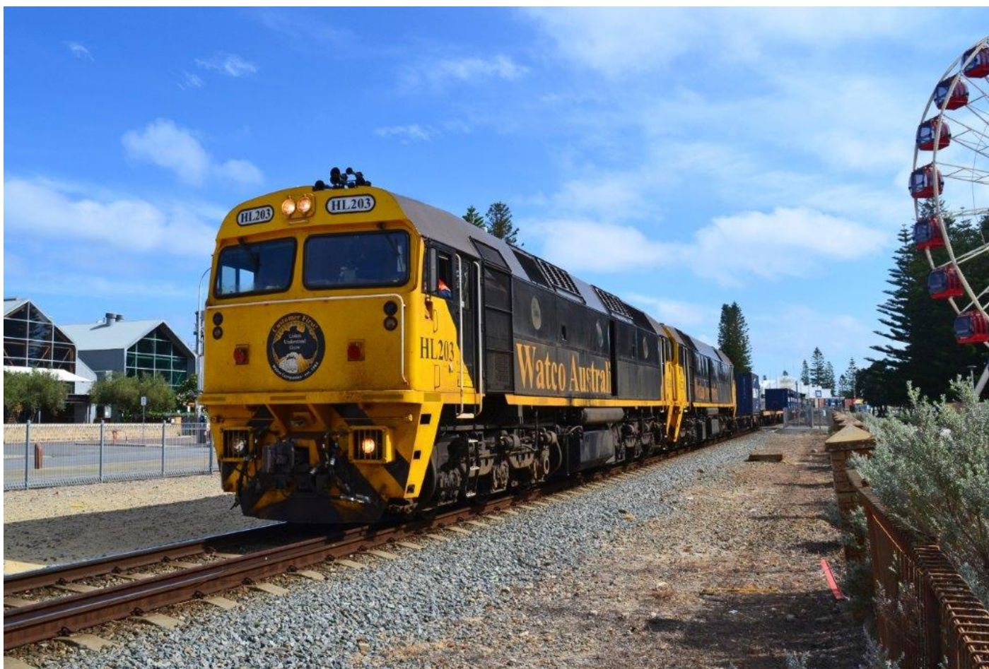
HL203 & FL220 Forrestfield-bound, Fremantle, 27 th April. Page 23 of 30