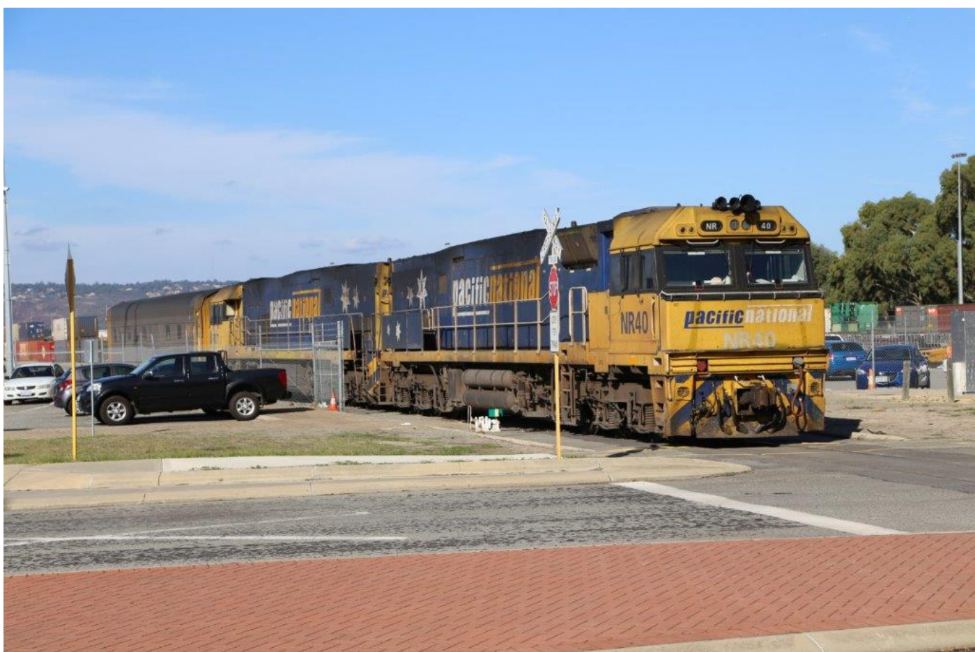
NRs 40 & 71 at the western end of Kewdale ex 6MP5 arrival, 27 th April.