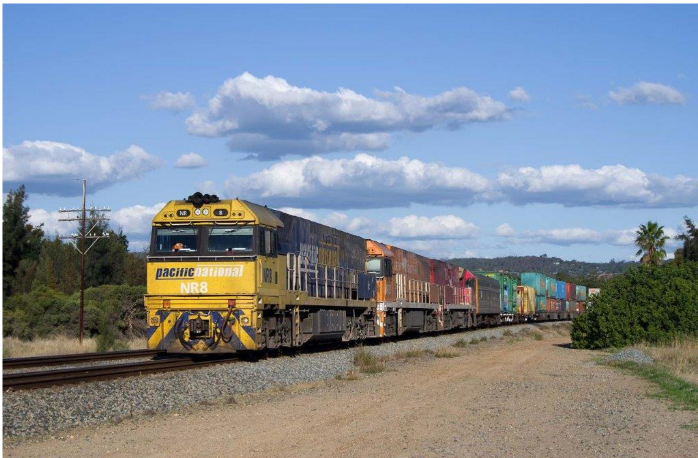
NRs 8, 30 & 109 lead 1PM5 through Stratton, 26 th April.