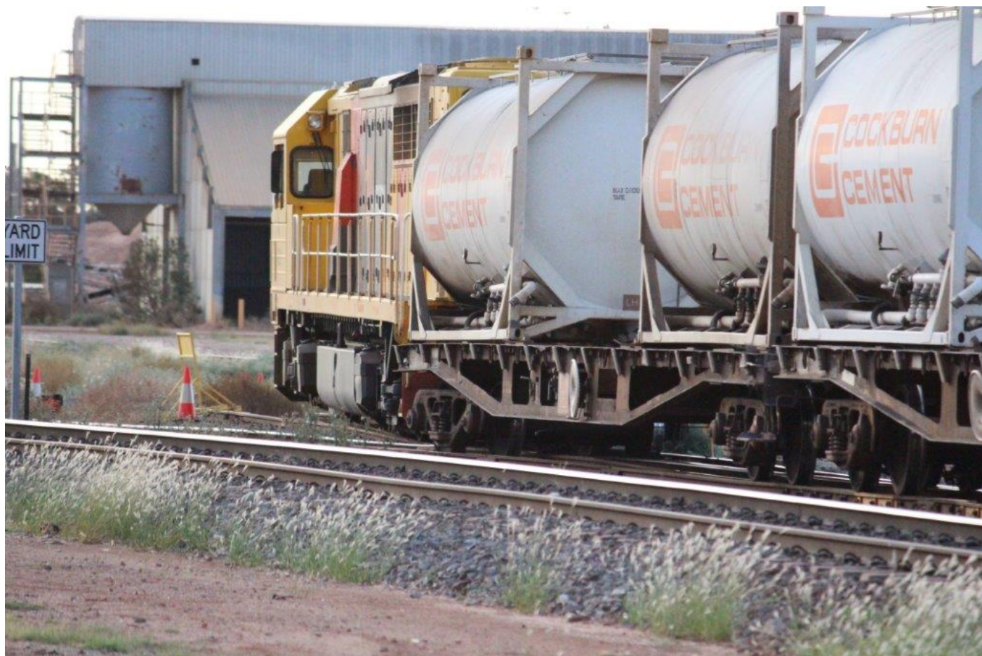
Derailed wagon bogie, 4C74, Parkeston, trapping Q4008 in the lime works, 22 nd April.