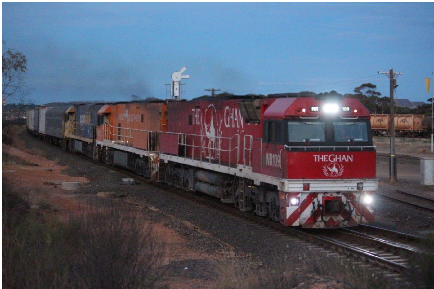
The day ends as it beGhan: NRs 109, 30 & 8 bring 5MP5 into West Kal after sunset, 25 th April.