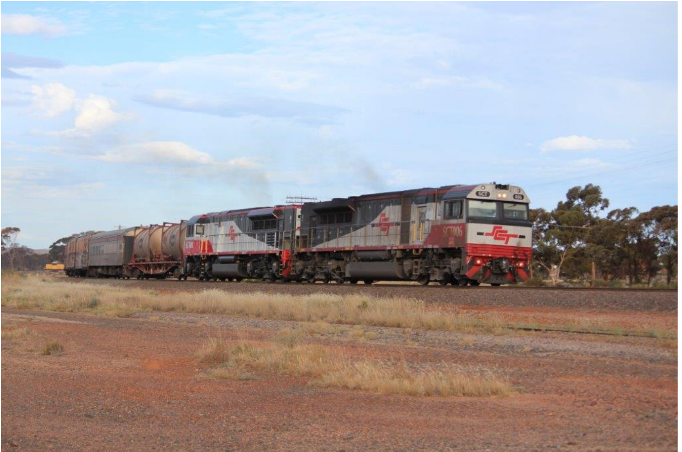
SCT006 leads freshly overhauled and repainted SCT008 away from Parkeston on 2MP9, 22 nd April.