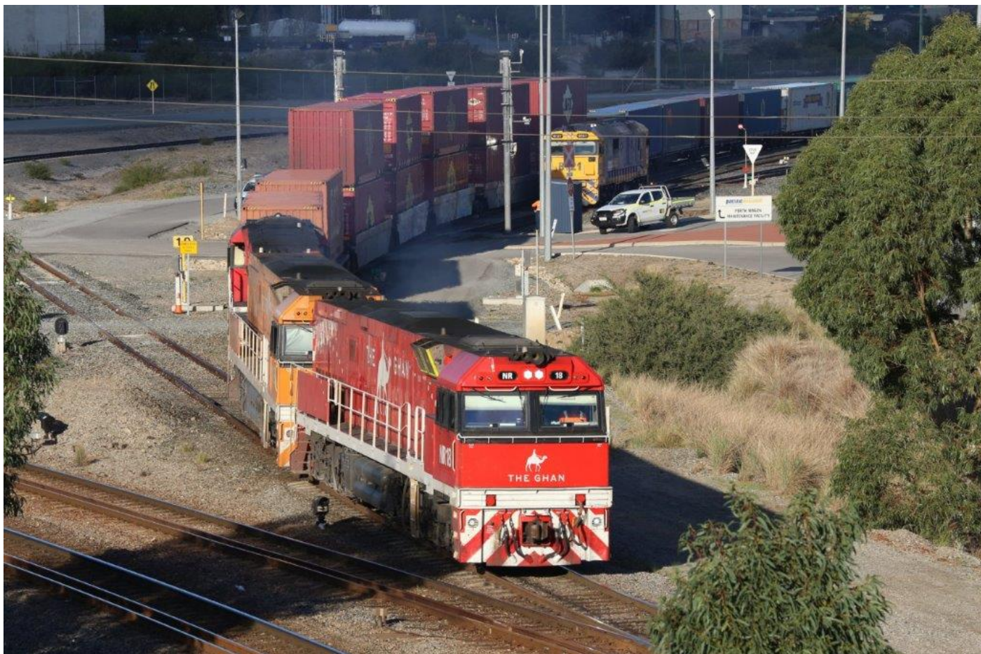
NRs 18, 31 & 75 ease 1PS6 out of Kewdale as shunt unit 8121 stands by, 26 th April.