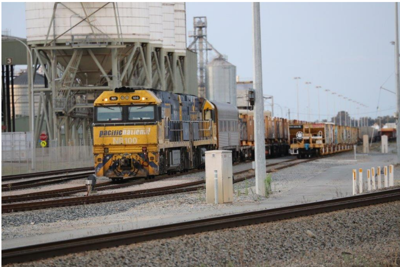
NR100 & NR27 stabled at the south end of Forrestfield, beside the CBH terminal, 26 th April.