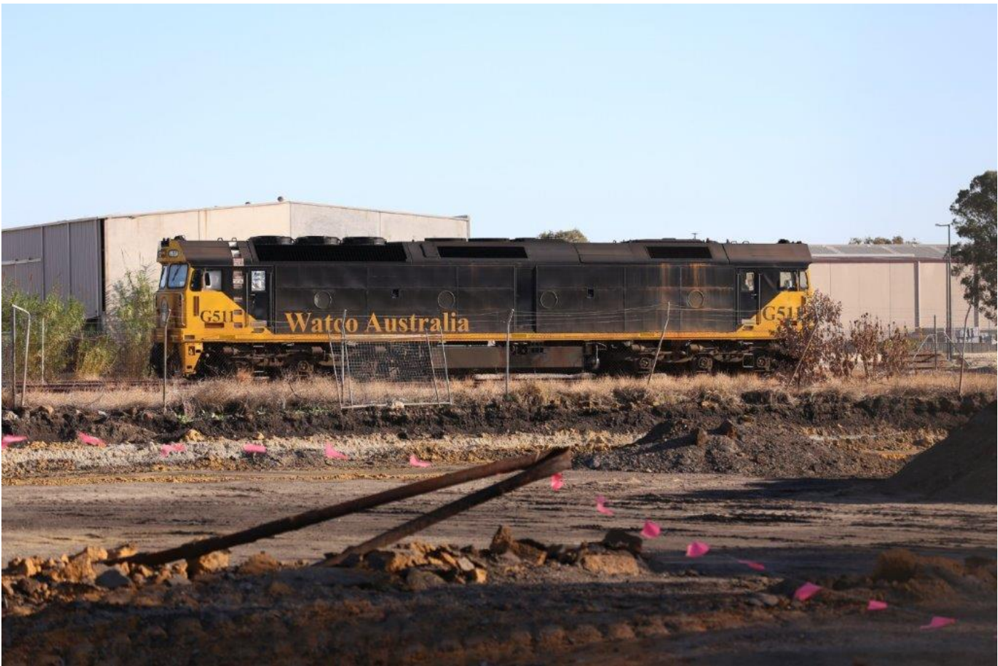
G511 parked at Flashbutt, Midland, 27 th April.