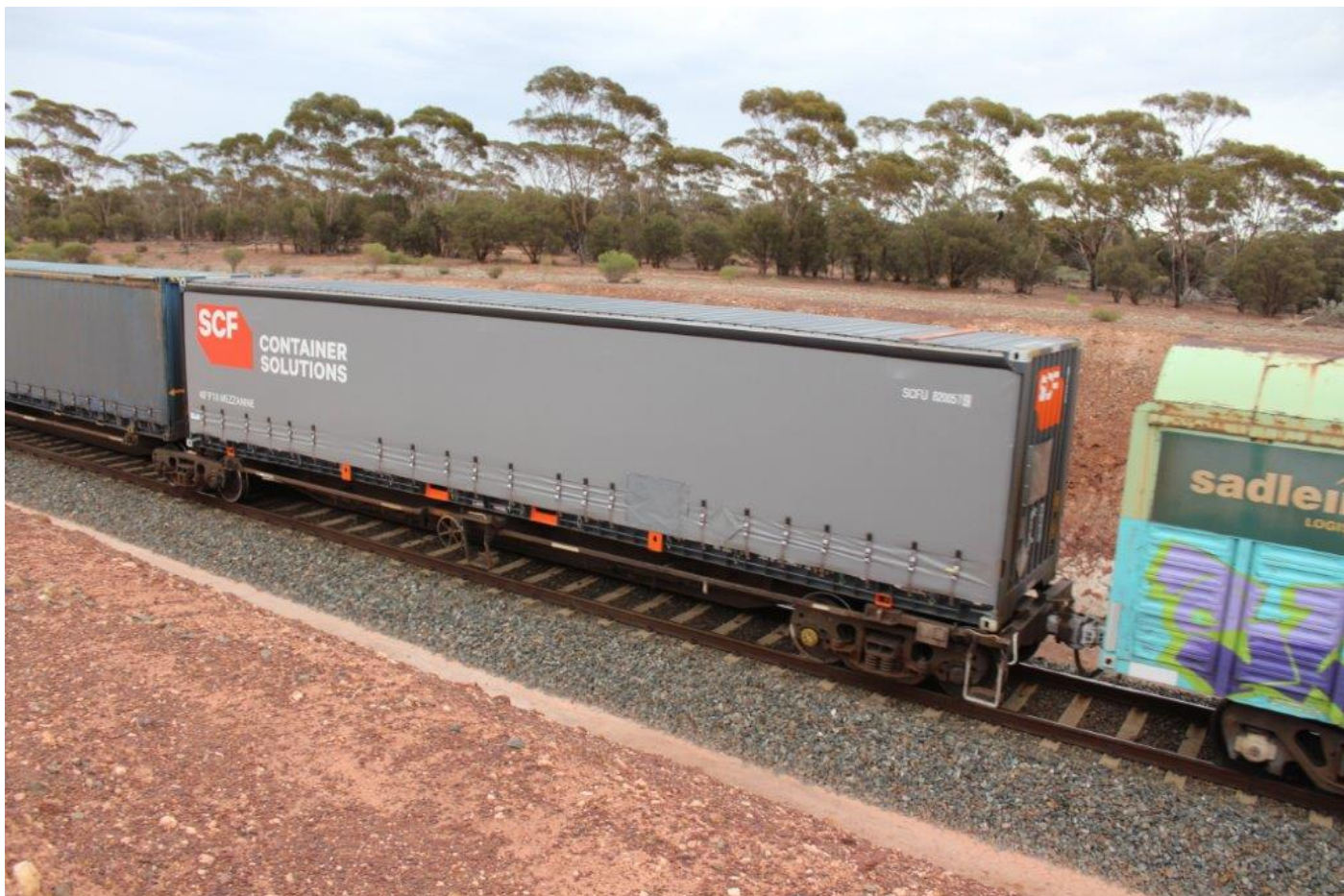
SCF recently introduced 20-odd new 48' curtainsiders with mezzanine deck. 6PS7, 25 th April.