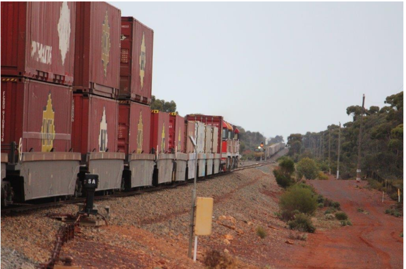
6PM7 waits outside Bonnie Vale for 5SP5 to tuck away on the loop, 25 th April.