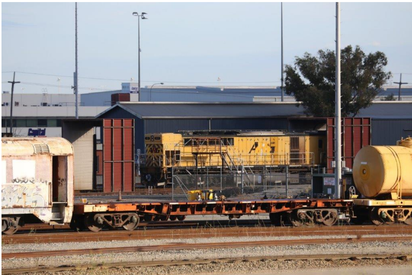
The last remaining yellow Q, 4017, has been stabled at Forreestfield for several months, 26 th April.