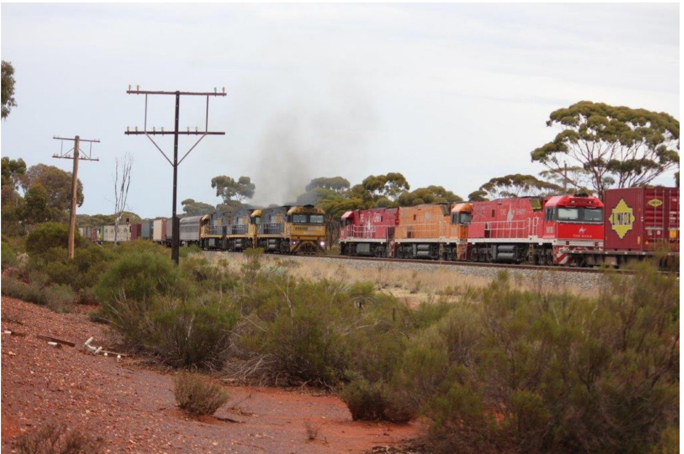
NRs 10, 57 & 97 power 6PM7 onto Bonnie Vale main, crossing 5SP5, 25 th April.