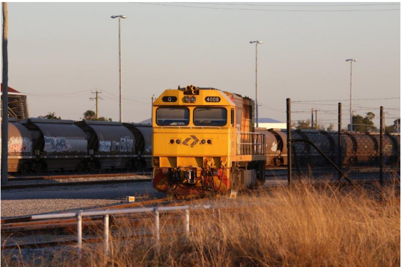
Q4008 stabled at Aurizon Forrestfield, 26 th April.