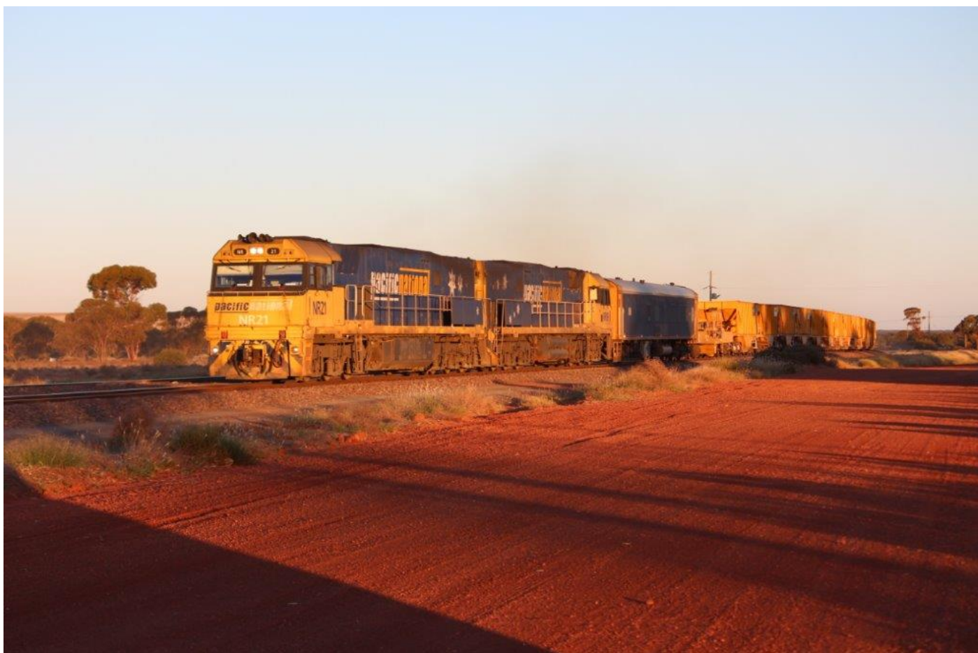
NRs 21 & 99 arrive at Parkeston on 8M31 ARTC ballast, 21 st April.