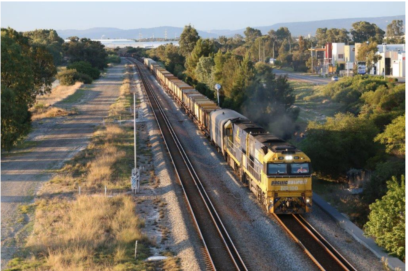
5MP2 behind NRs 100 & 27 approaches Forrestfield, 26 th April.