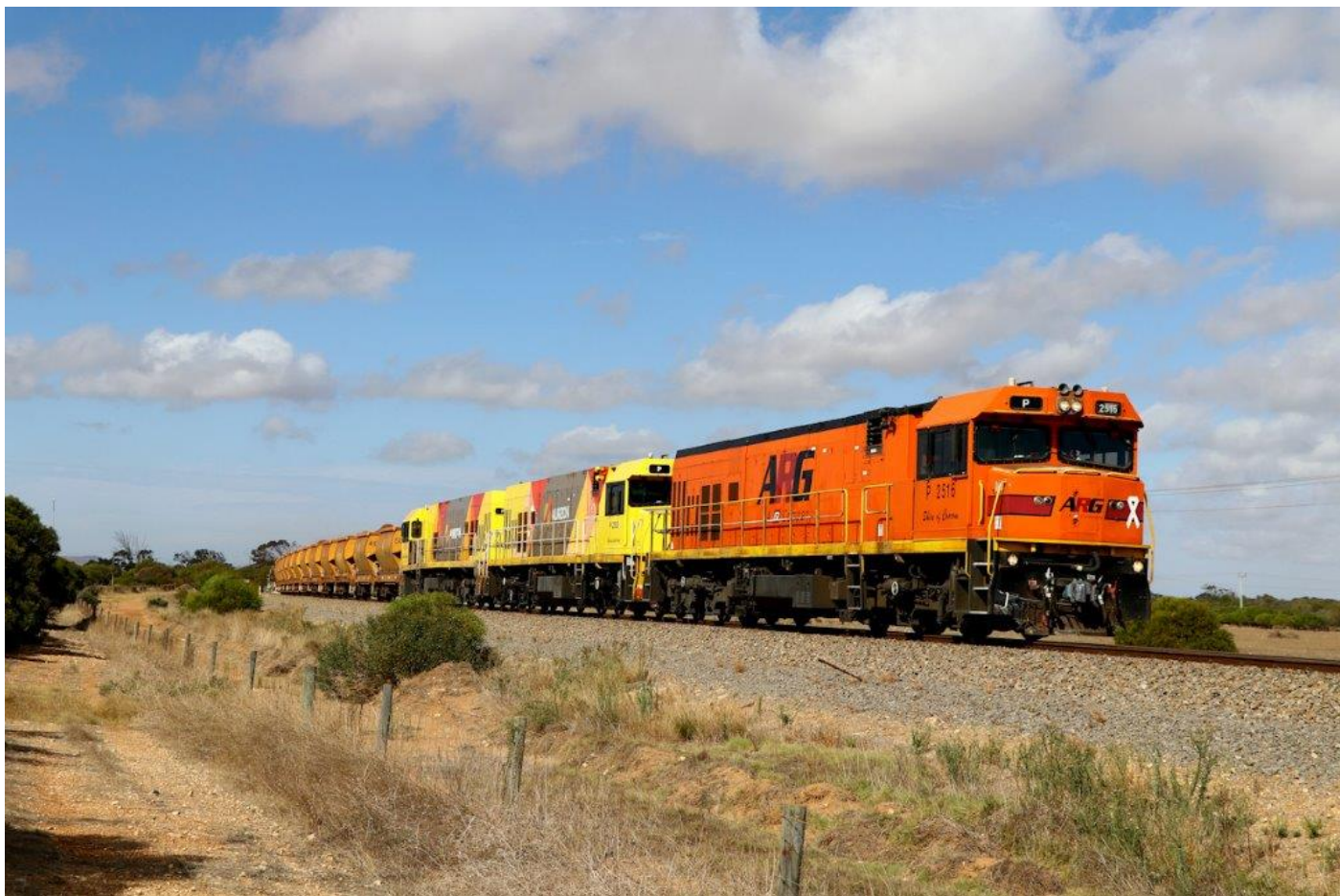
Ps 2516, 2505 & 2504 race 2721 loaded Mt Gibson ore through Narngulu West, 27 th April.