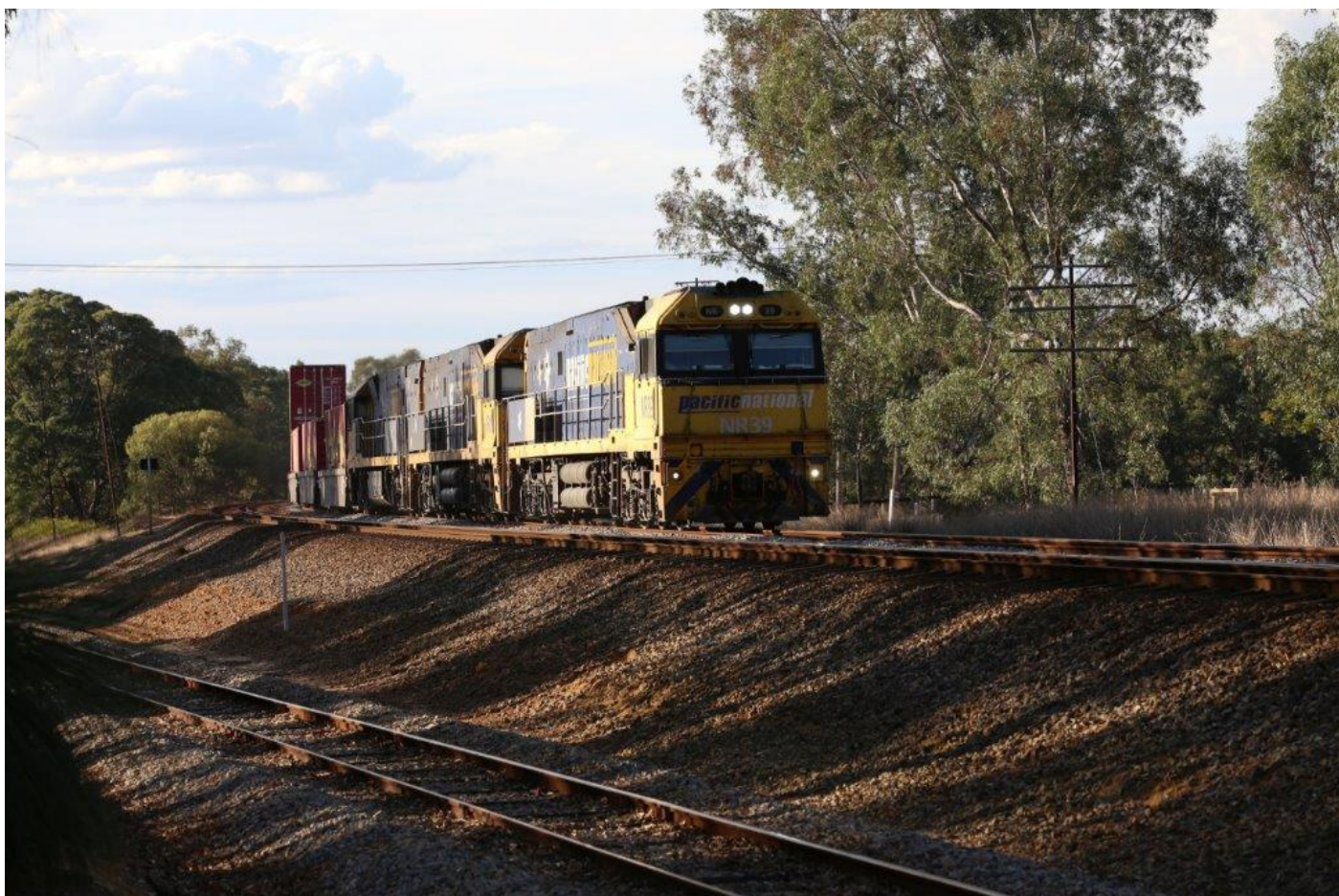
6SP5 races through Millendon Junction behind NRs 39, 19 & 50, 26 th April.