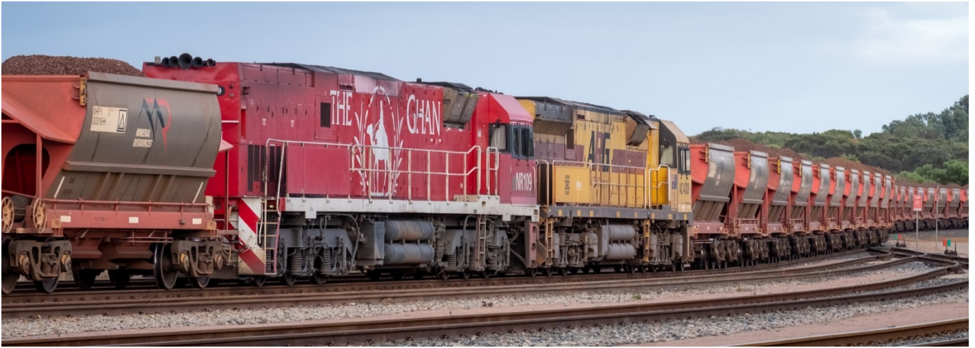
NR109 & AC4301 are the DP units on 4033 ore arriving into Esperance, 30 th April.