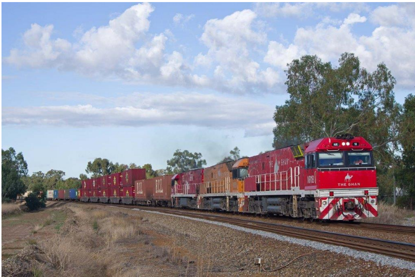
NRs 18, 31 & 75 lead 1PS6 through Millendon Junction, 26 th April.