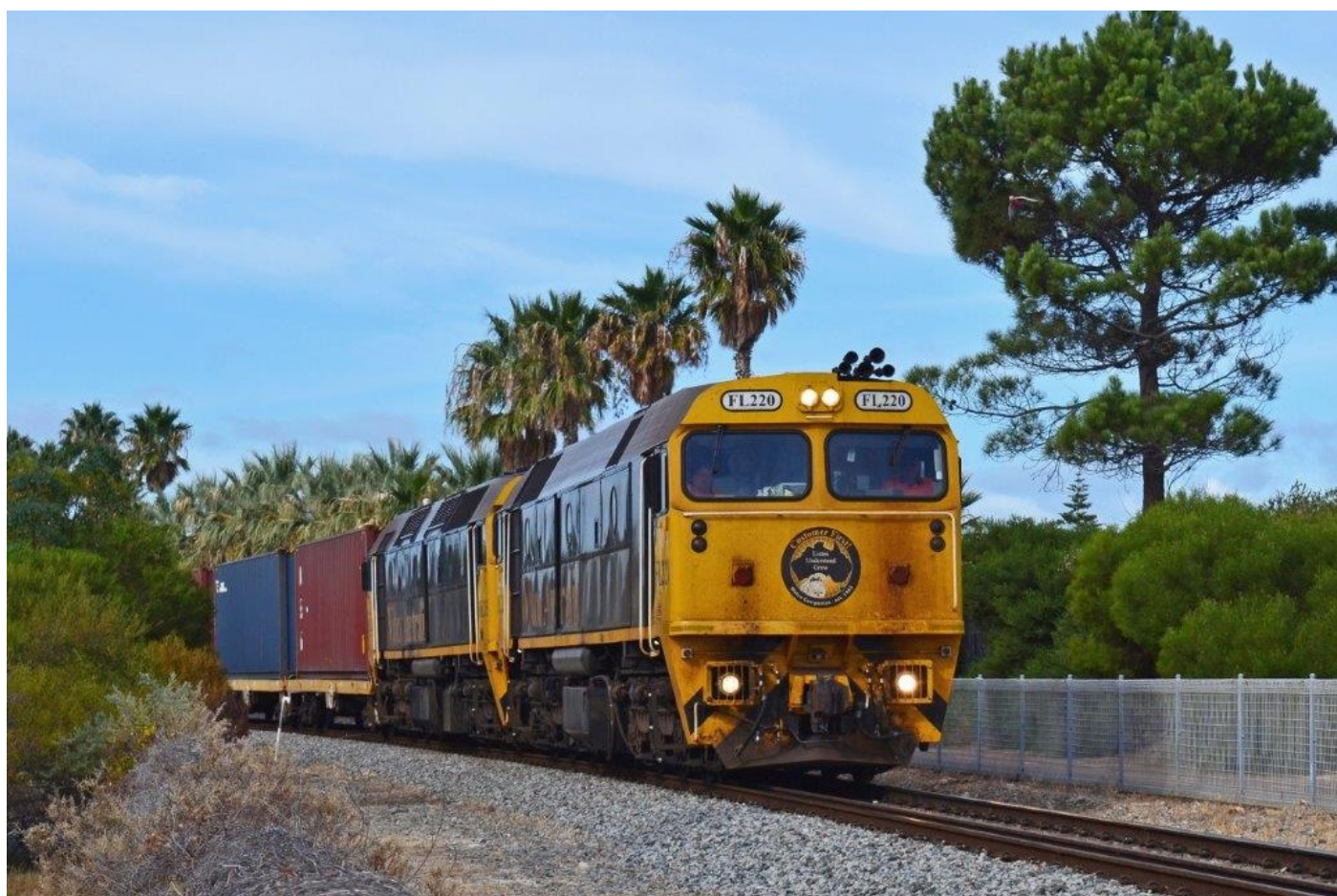
FL220 & HL203 chatter through South Fremantle with 6142 container shuttle, 24 th April.