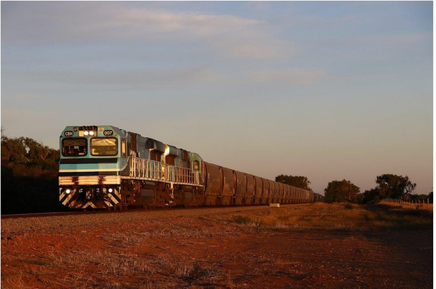
The sun sets on April 2020, and also on CBHs 007 & 023 on 5G51 loaded grain at Walkaway North, 30 th April.