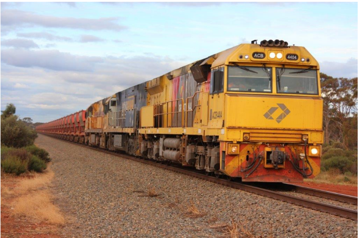
ACB4404, NR44 & AC4301 head PN's 7030 between Hampton and Binduli, 25 th April.