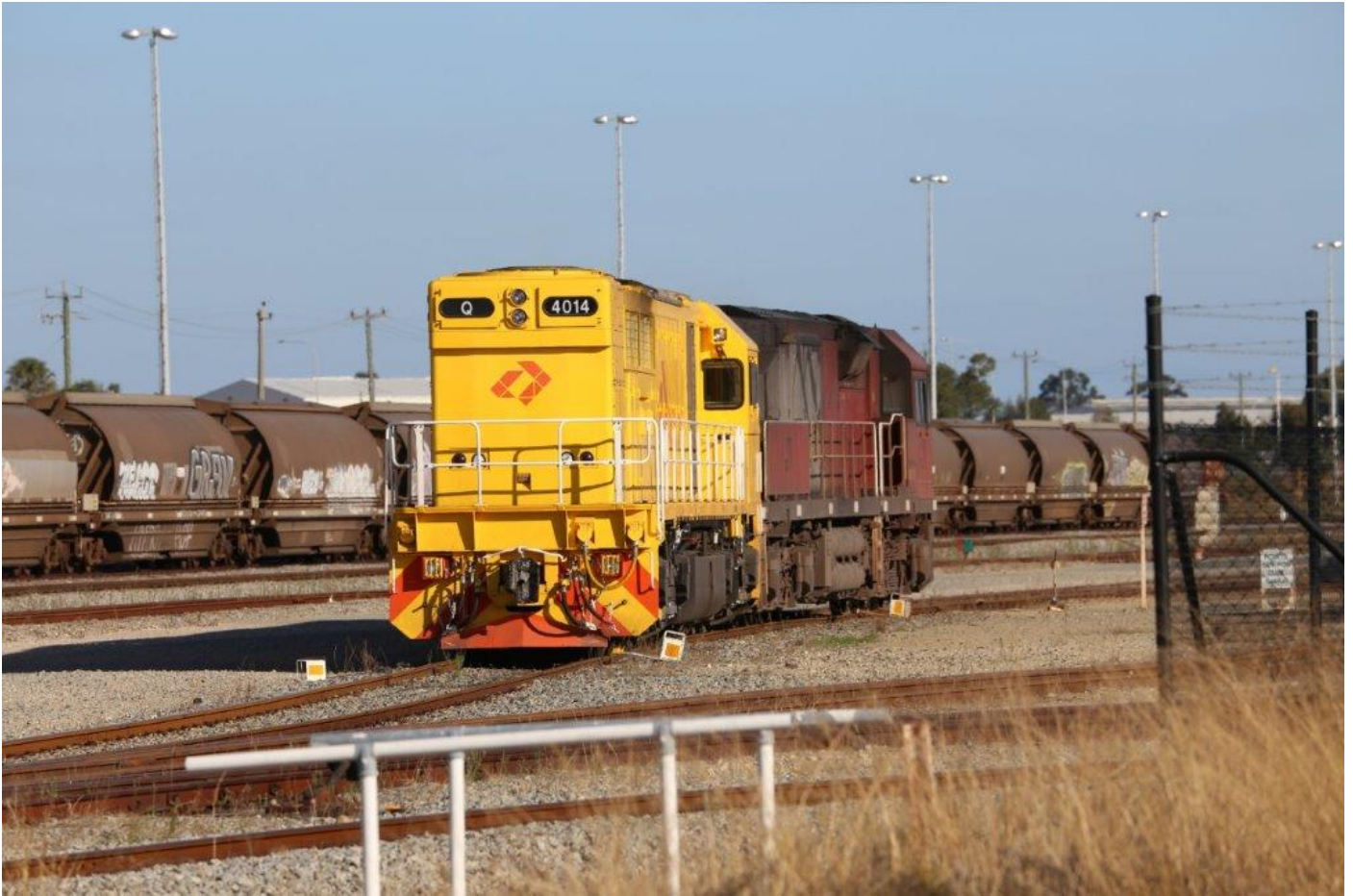
Q4014 & MRL001 stabled at Aurizon Forrestfield, 27 th April – MRL for Gemco workshops.