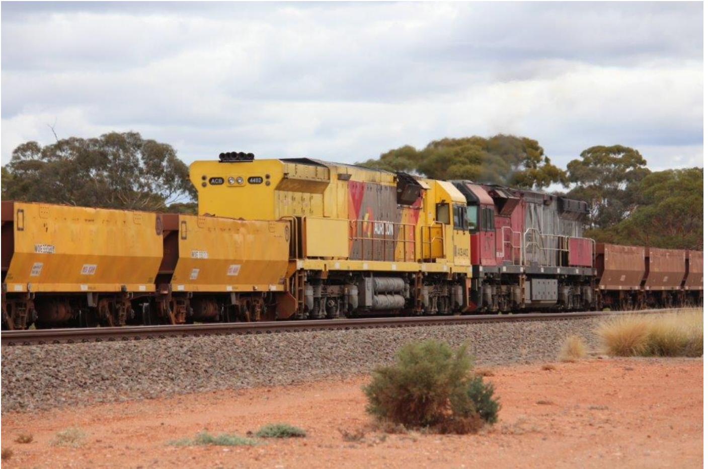
DPU on 7043 were ACB4402 & MRL003, Binduli, 25 th April.