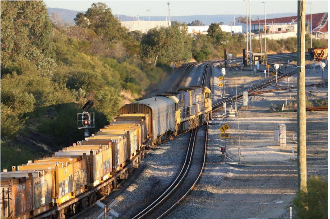
5MP2 crosses over at the entrance to Forrestfield, 26 th April.