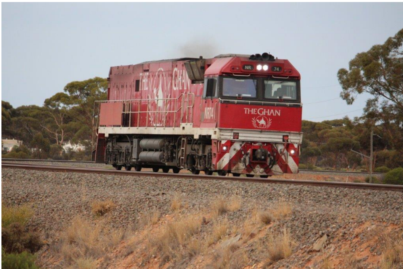
NR74 ex 7SP5 being turned on Binduli triangle to lead 2445 Esperance fuel, 27 th April.