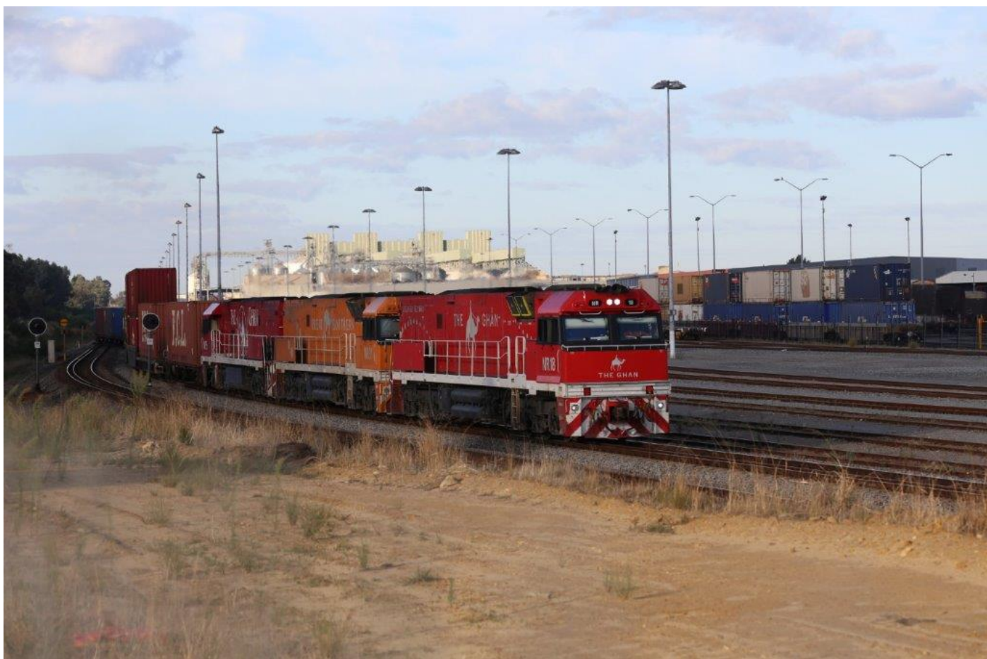
1PS6 passes Forreestfield behind NRs 18, 31 & 75, 26 th April.