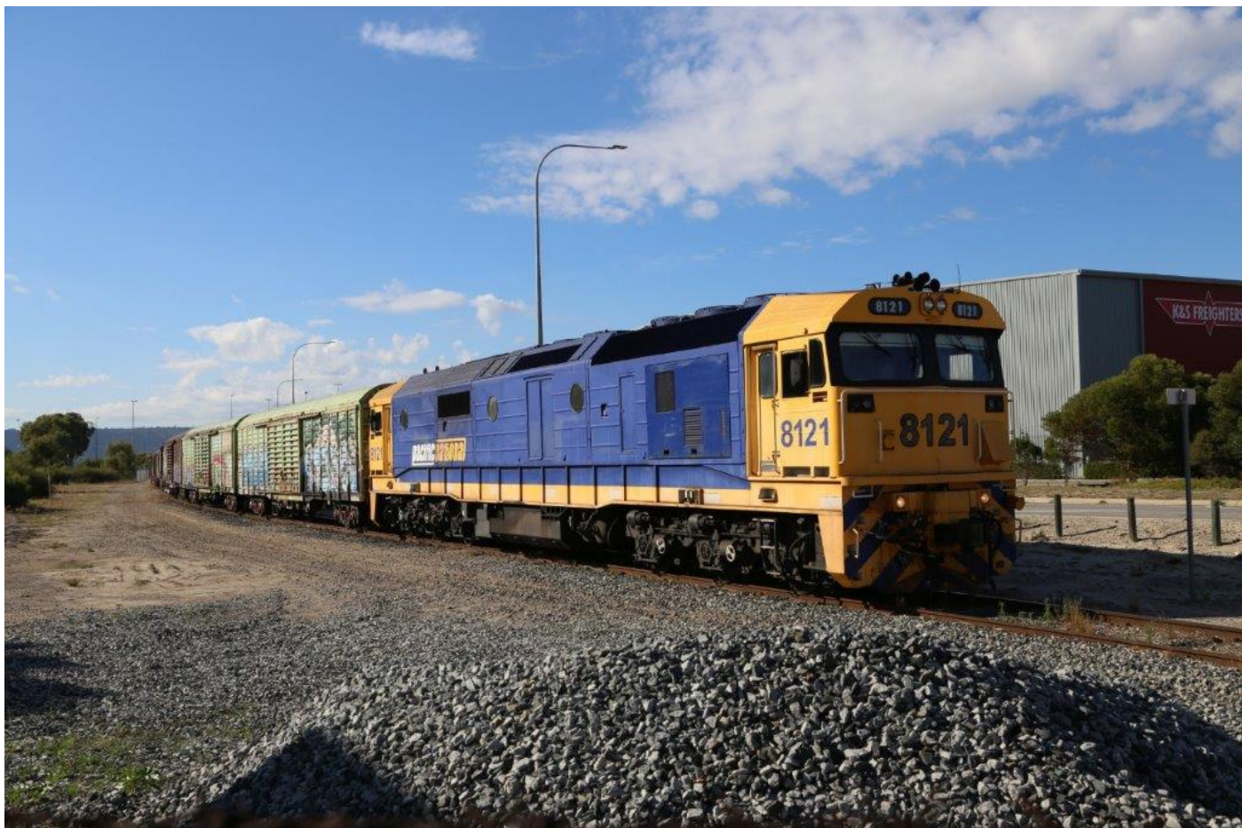
8121 works 1P56 Sadleirs trip train, Kewdale, 26 th April.