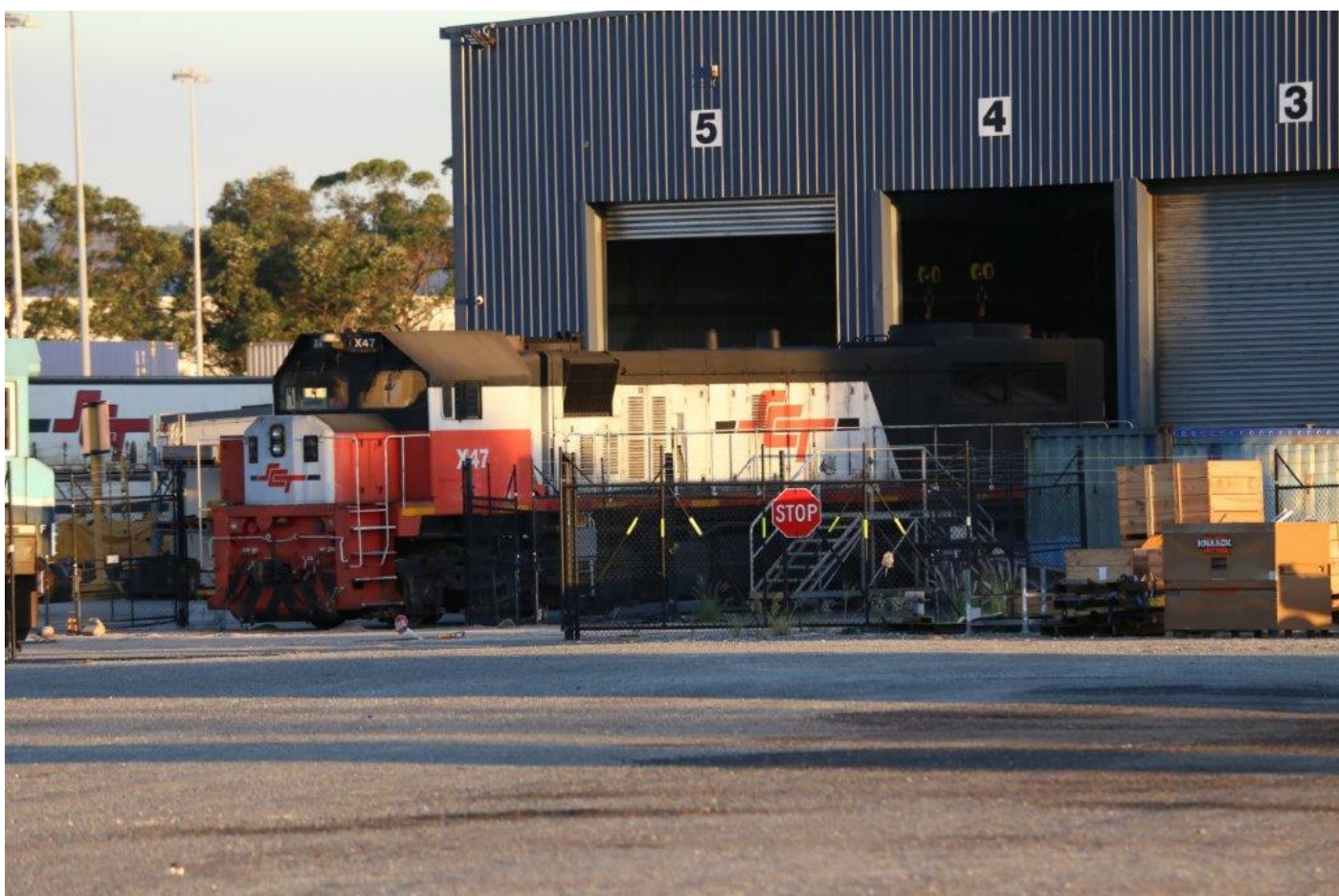
X47 still under repair at Gemco Forrestfield, 26 th April.