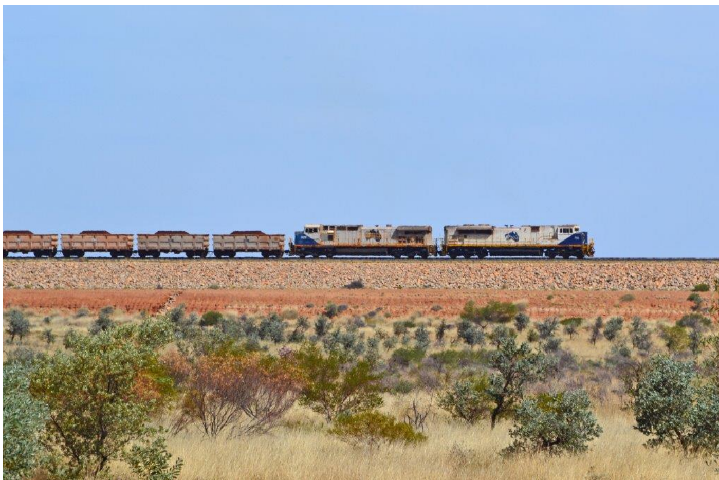
719 & 009 haul another loaded FMG ore train through Woodstock, 29 th April.