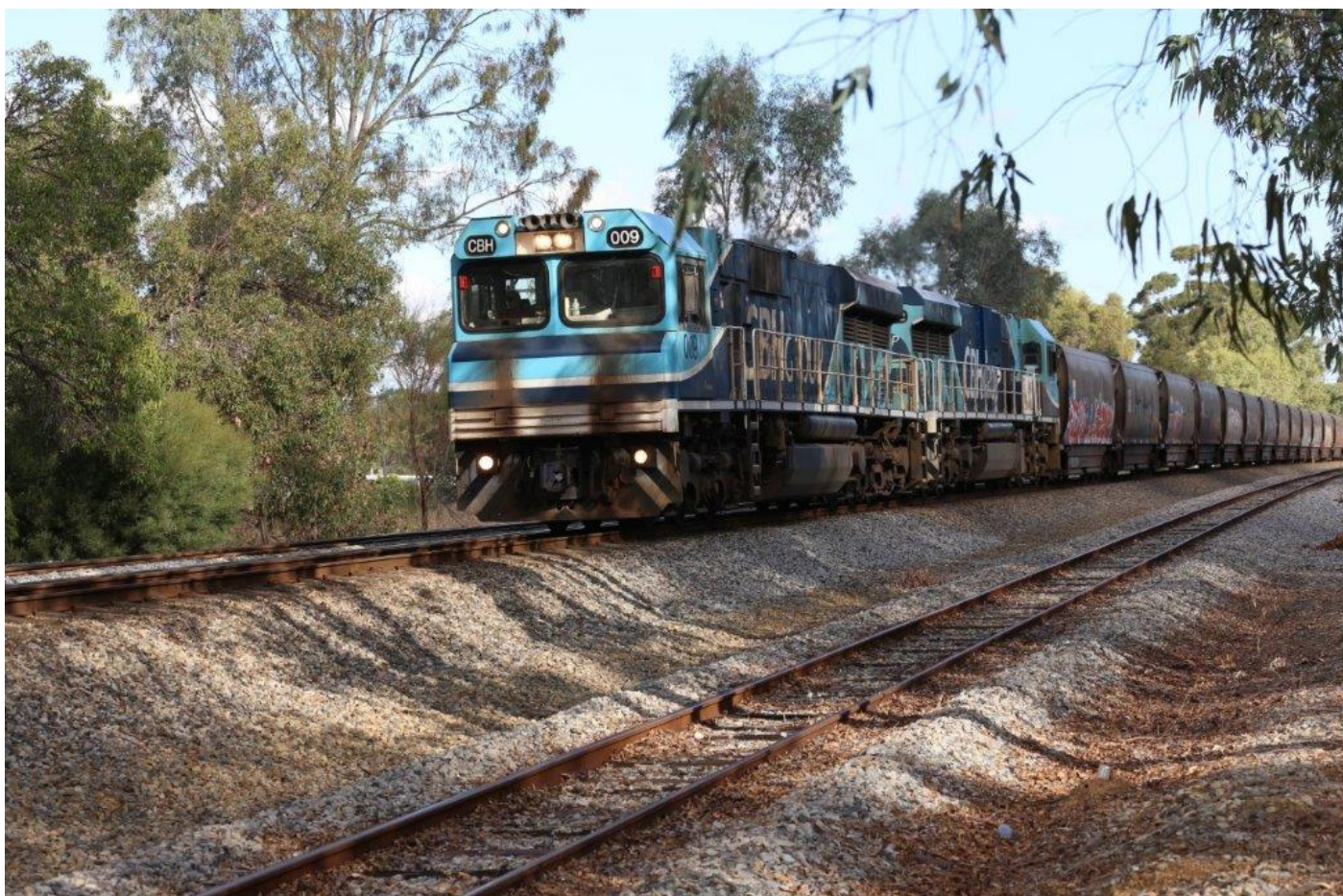
Narrow gauge grain 1K11, Millendon Junction behind CBHs 009 & 002, 26/4.