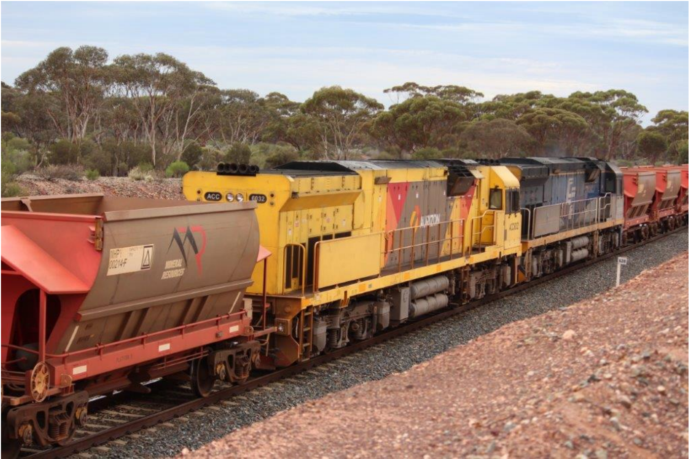
ACC6032 & CF4406, DPU on 7044, 628km, 25 th April.