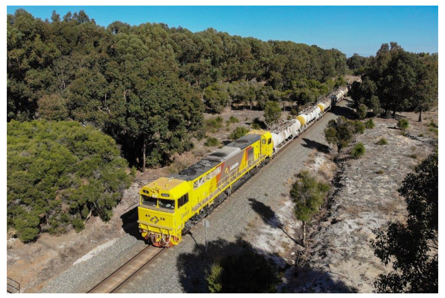
S3302 leads 7238, empty caustic tanks, at Mundijong on 2<sup>nd</sup> May.