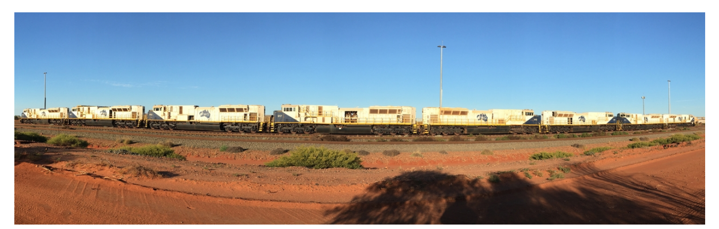
Stored FMG SD90MAC units still with their original 265H engines – 910, 911, 912, 917, 913, 914, 915 & 916, 5<sup>th</sup> May.