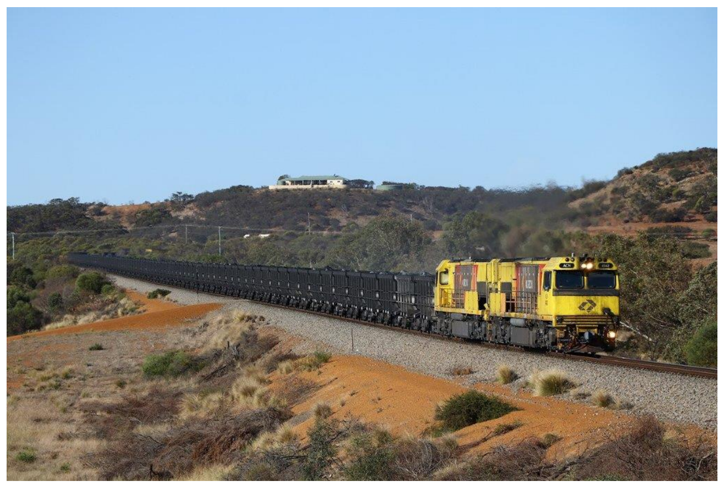
1763 loaded Karara ore is powered near Bringo by ACNs 4142 & 4174, 3<sup>rd</sup> May. Page 4 of 26