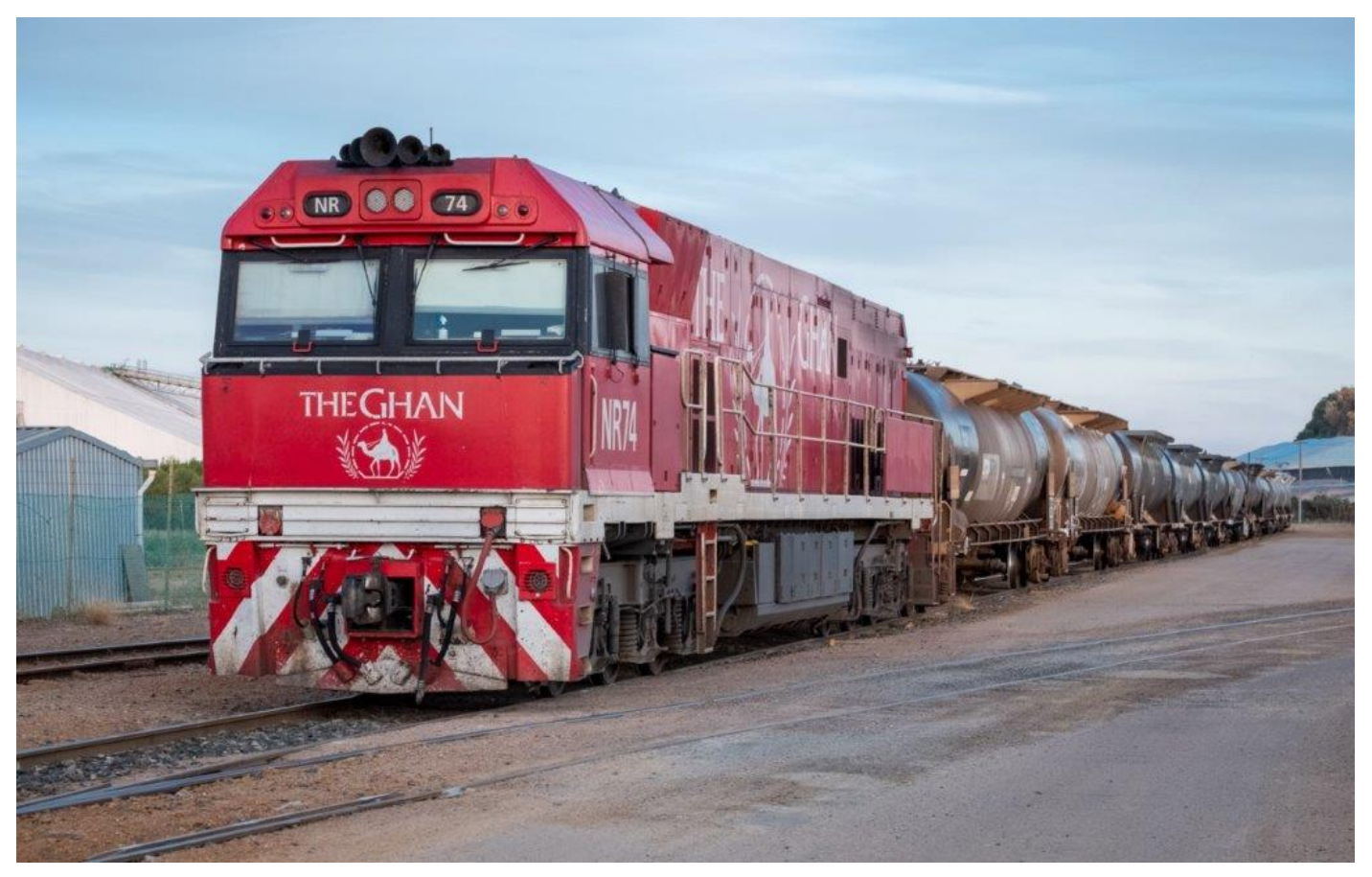
NR74 and NR30 parked on the Viva sidings, 2^{nd} May.