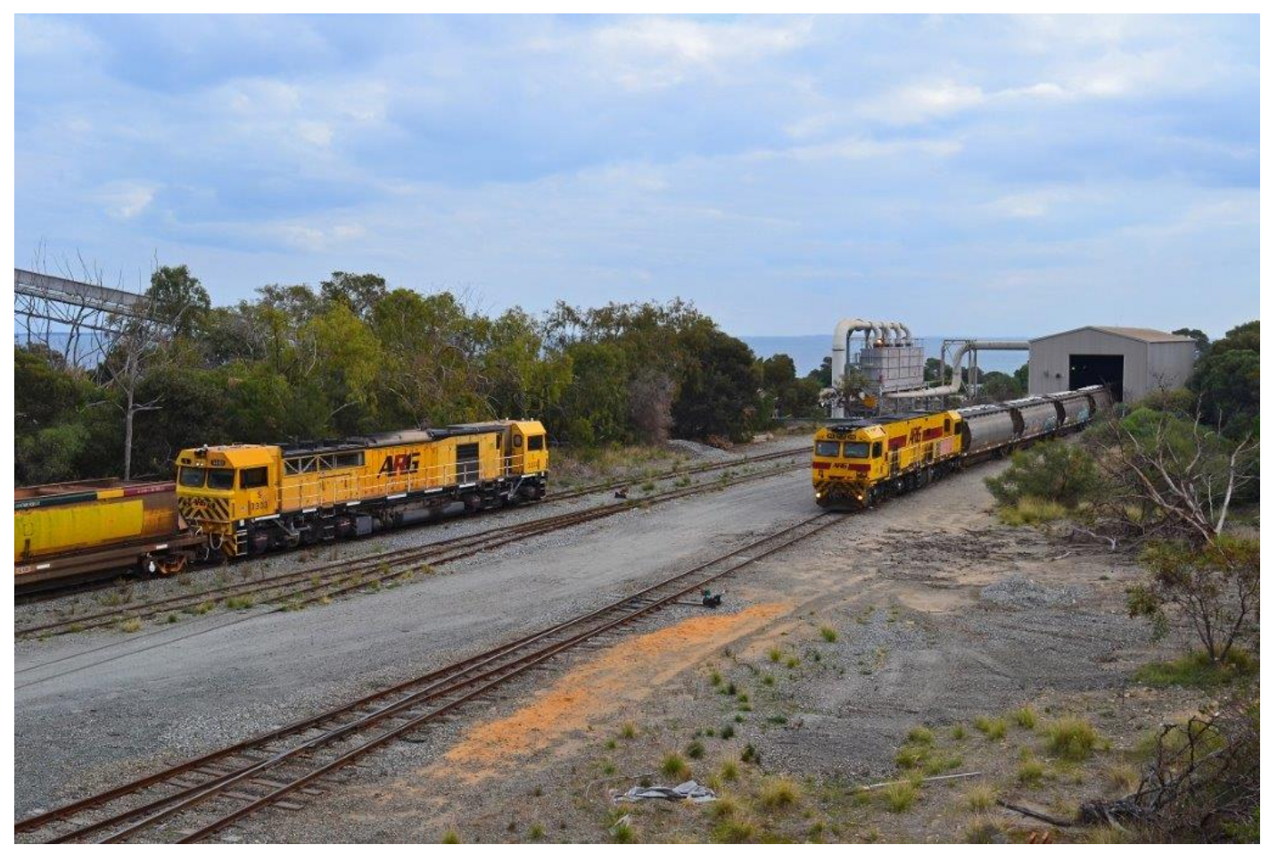
S3303 stands by as PA2819 unloads 7222 alumina at Kwinana, 16<sup>th</sup> May. Page 22 of 26