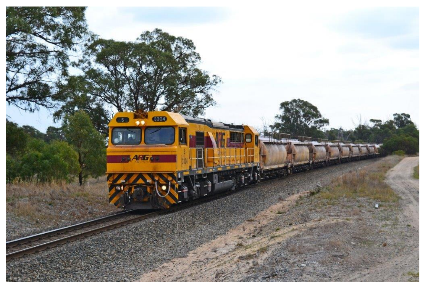
7271 lime near Wellard, hauled by S3304, 16<sup>th</sup> May.