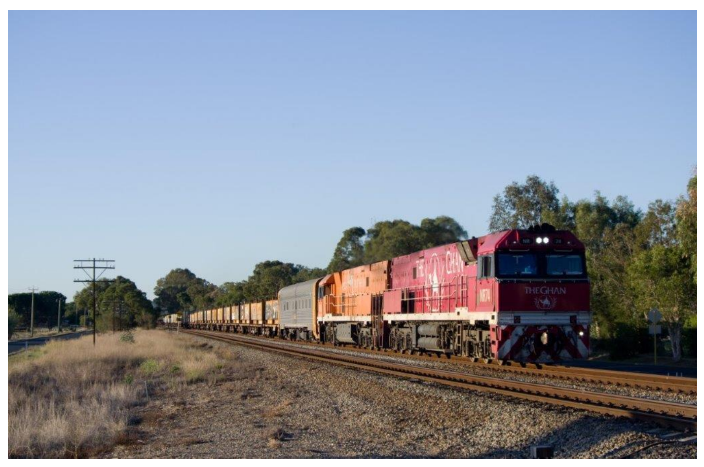
Colourful NRs 74 & 30 lead 5MP2 through Herne Hill, 10<sup>th</sup> May.