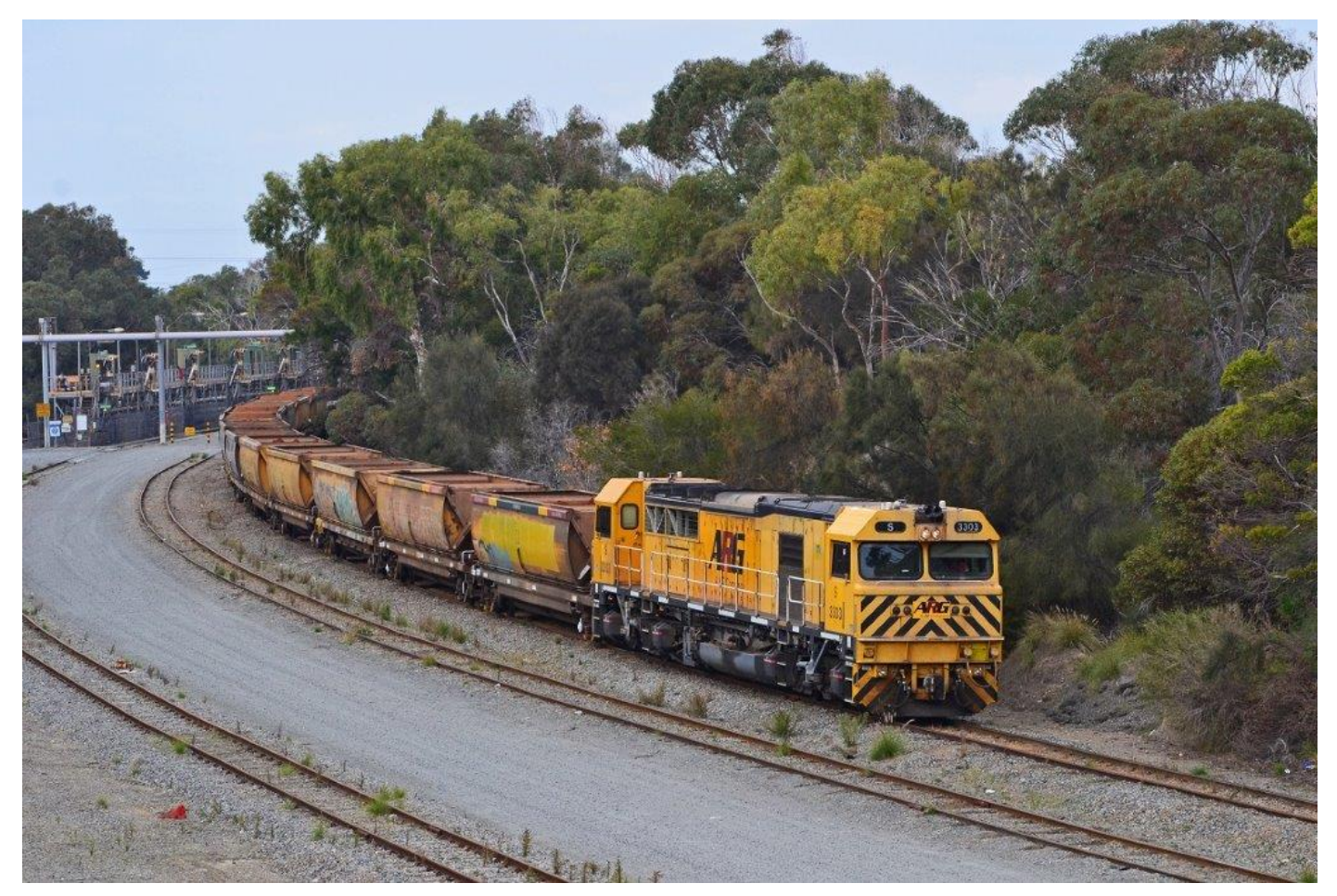
S3303 arrives into Kwinana on 7968 loaded bauxite, 16<sup>th</sup> May.