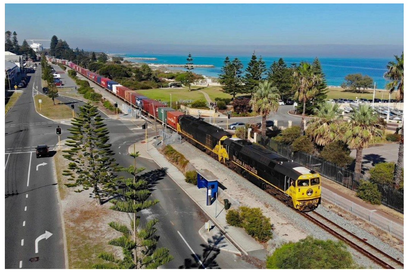
HL203 & G511 skirt the shore at South Fremantle with 6142 ILS Port Shuttle, 15<sup>th</sup> May.