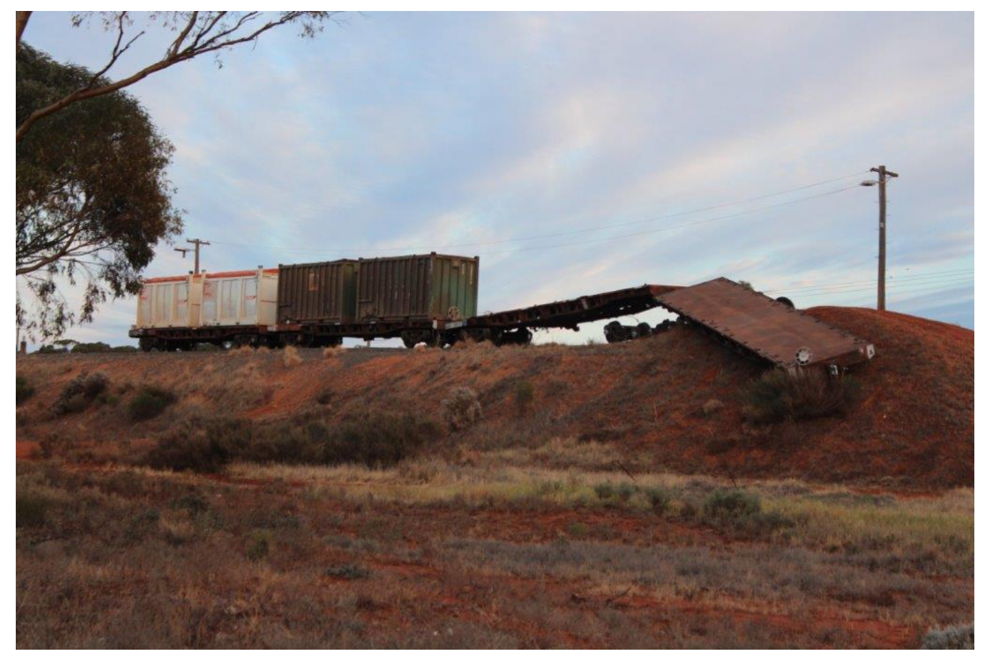
AQRY1001 has over-run the end of the shunt neck, West Kalgoorlie, 10<sup>th</sup> May.