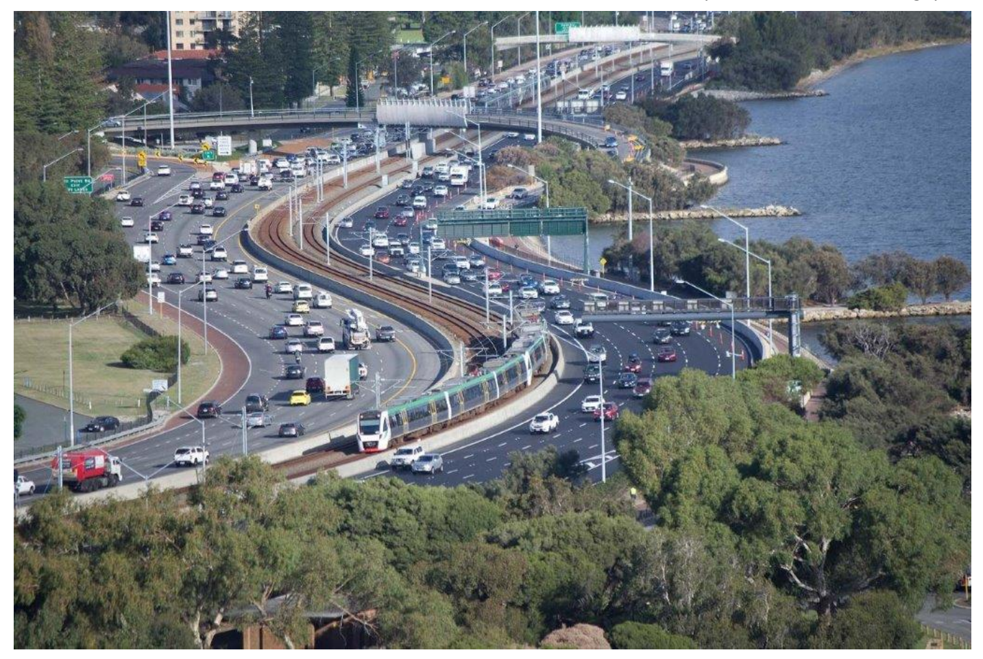
TransPerth B set 62 runs along the Kwinana Freeway median, South Perth, 15<sup>th</sup> May. Page 18 of 26