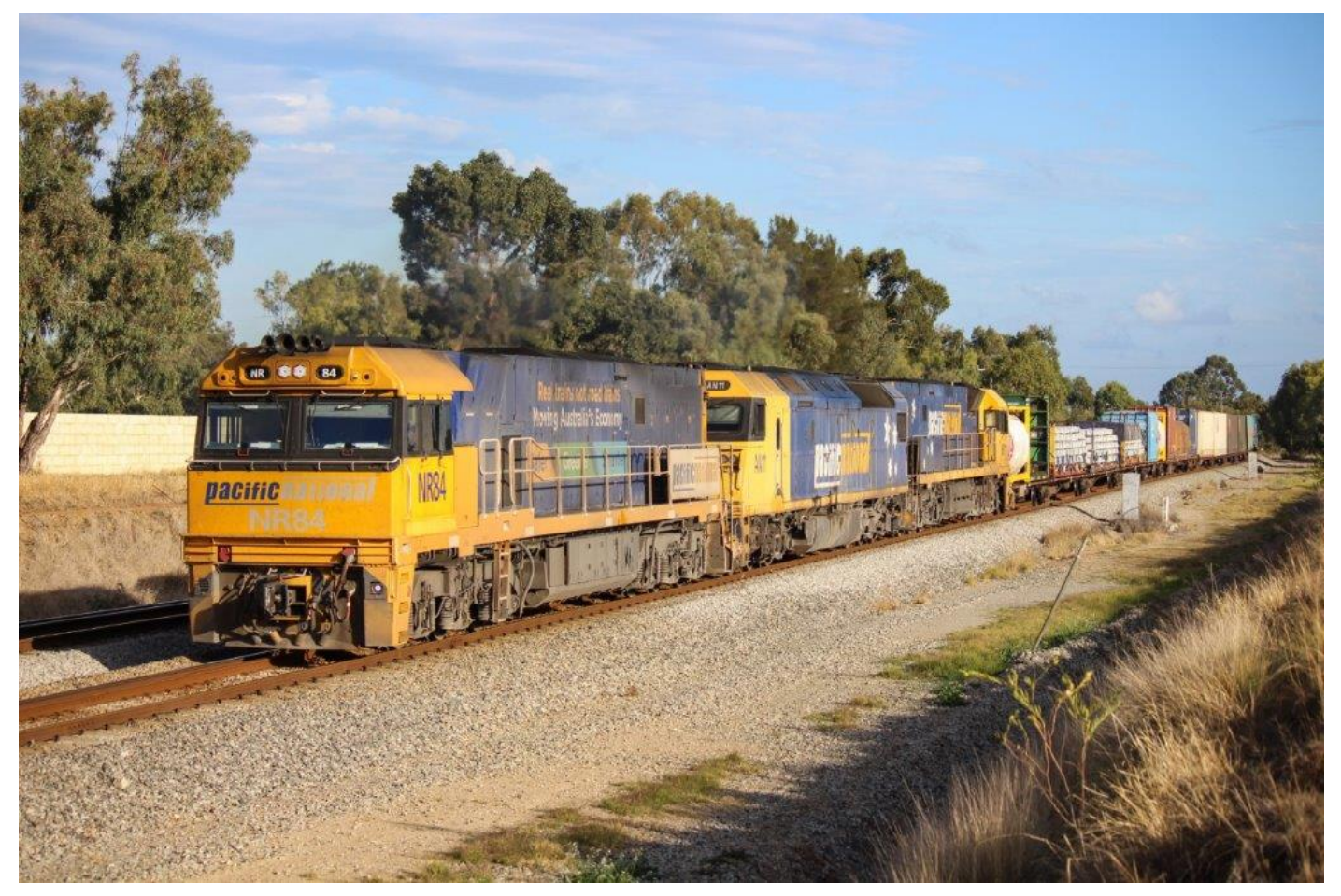
NR84, AN11 & NR111 hustle through Hazelmere on 1PM5, 3<sup>rd</sup> May.