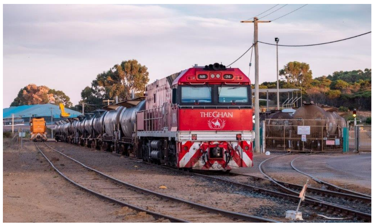
NR74 and NR30 stabled on the Viva sidings at Esperance, 2<sup>nd</sup> May.