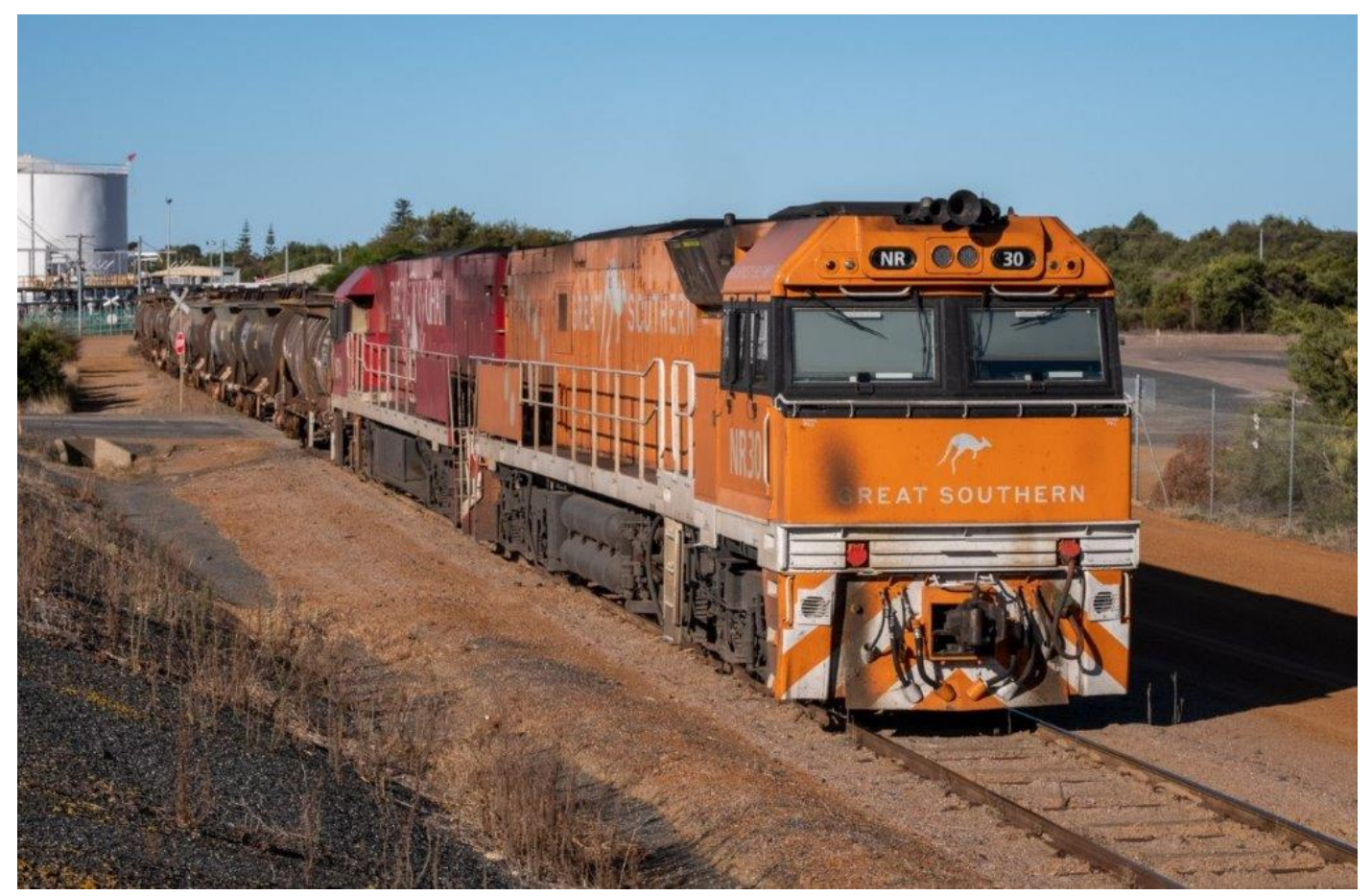
NRs 30 & 74 wait to haul 1446 fuel from Esperance Viva yard to West Kalgoorlie, 3<sup>rd</sup> May.