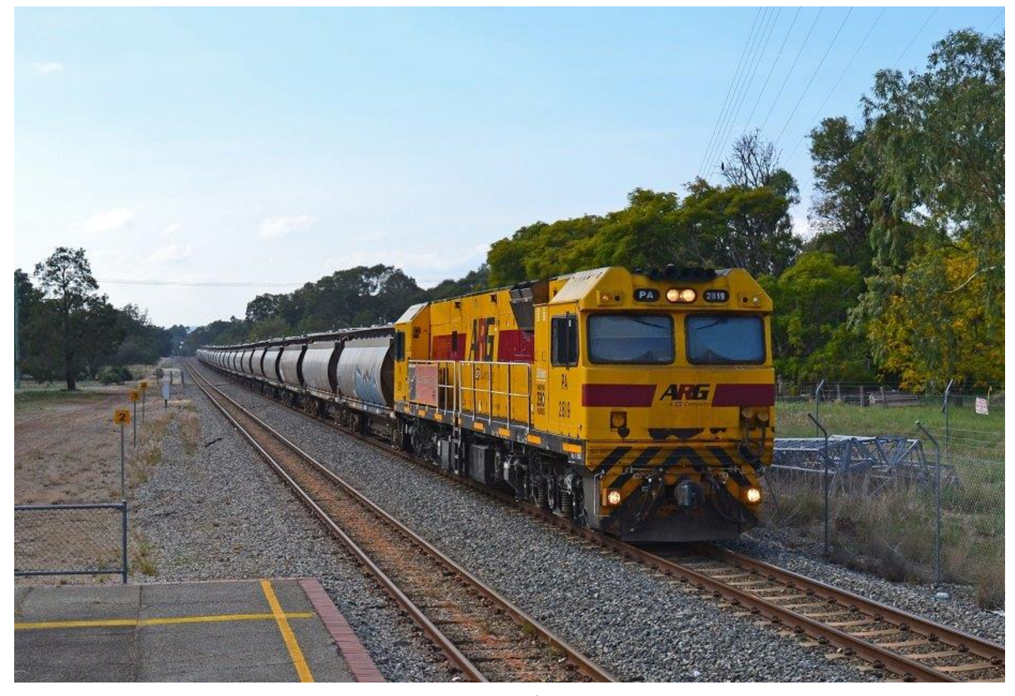
7223 empty alumina is led through Mundijong by PA2819, 16<sup>th</sup> May.