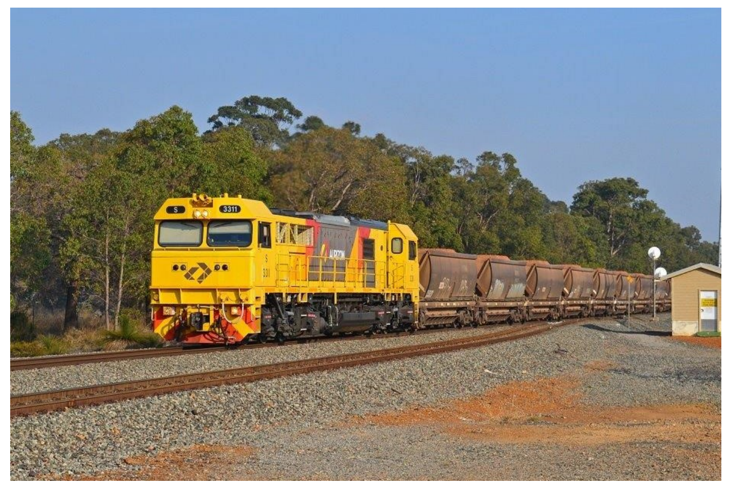
S3311 passes through Keysbrook on 7972 loaded bauxite, 16<sup>th</sup> May. Page 26 of 26