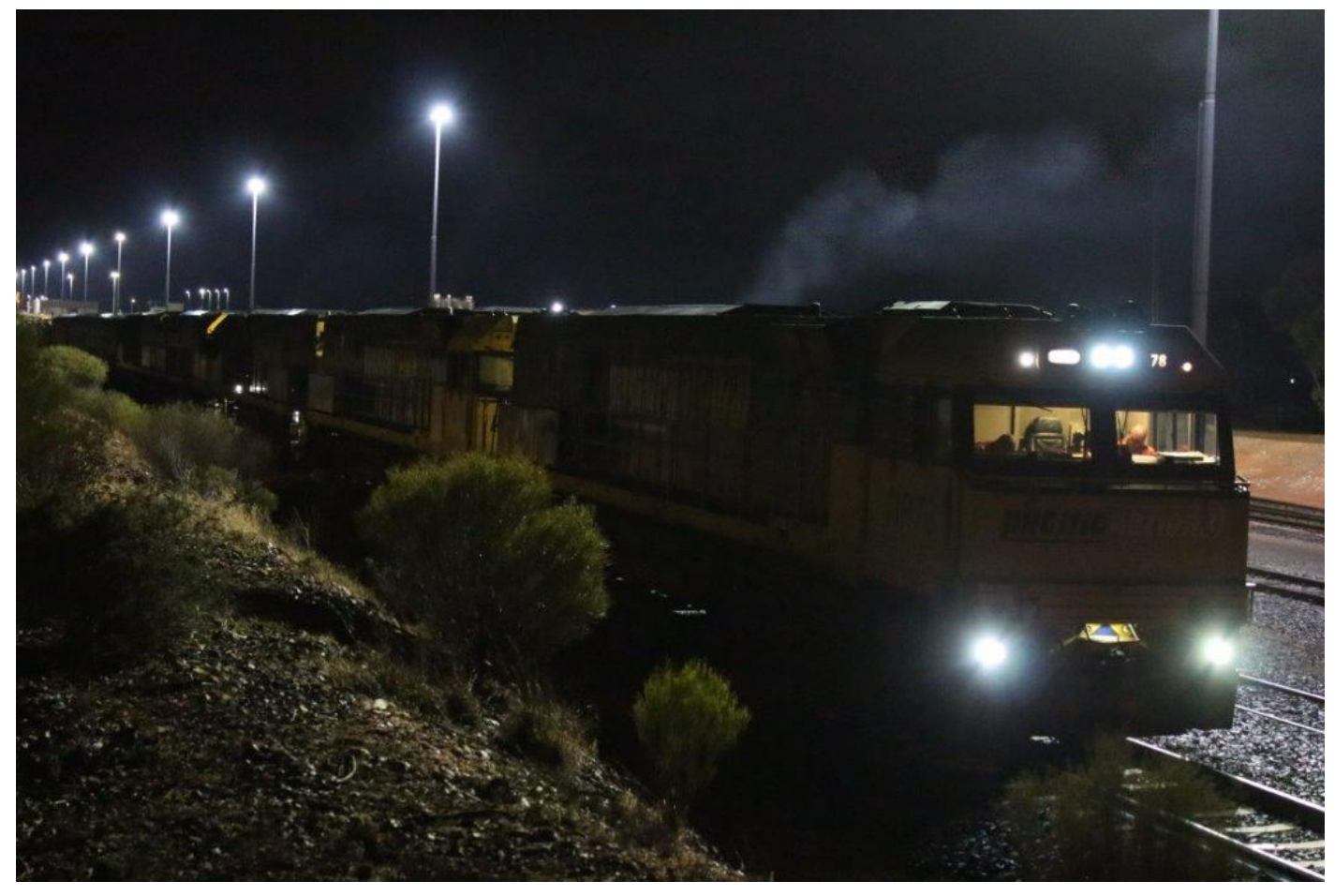
1MP2 with NRs 78, 35 & 50 hauling CFs 4408 & 4407, just arrived, West Kalgoorlie, 5<sup>th</sup> May.