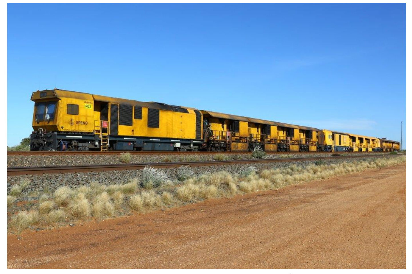
Speno rail grinders RR48 #RG3, RR36 #RG05 (being commissioned), RR36 #RG04, 5<sup>th</sup> May. Page 6 of 26