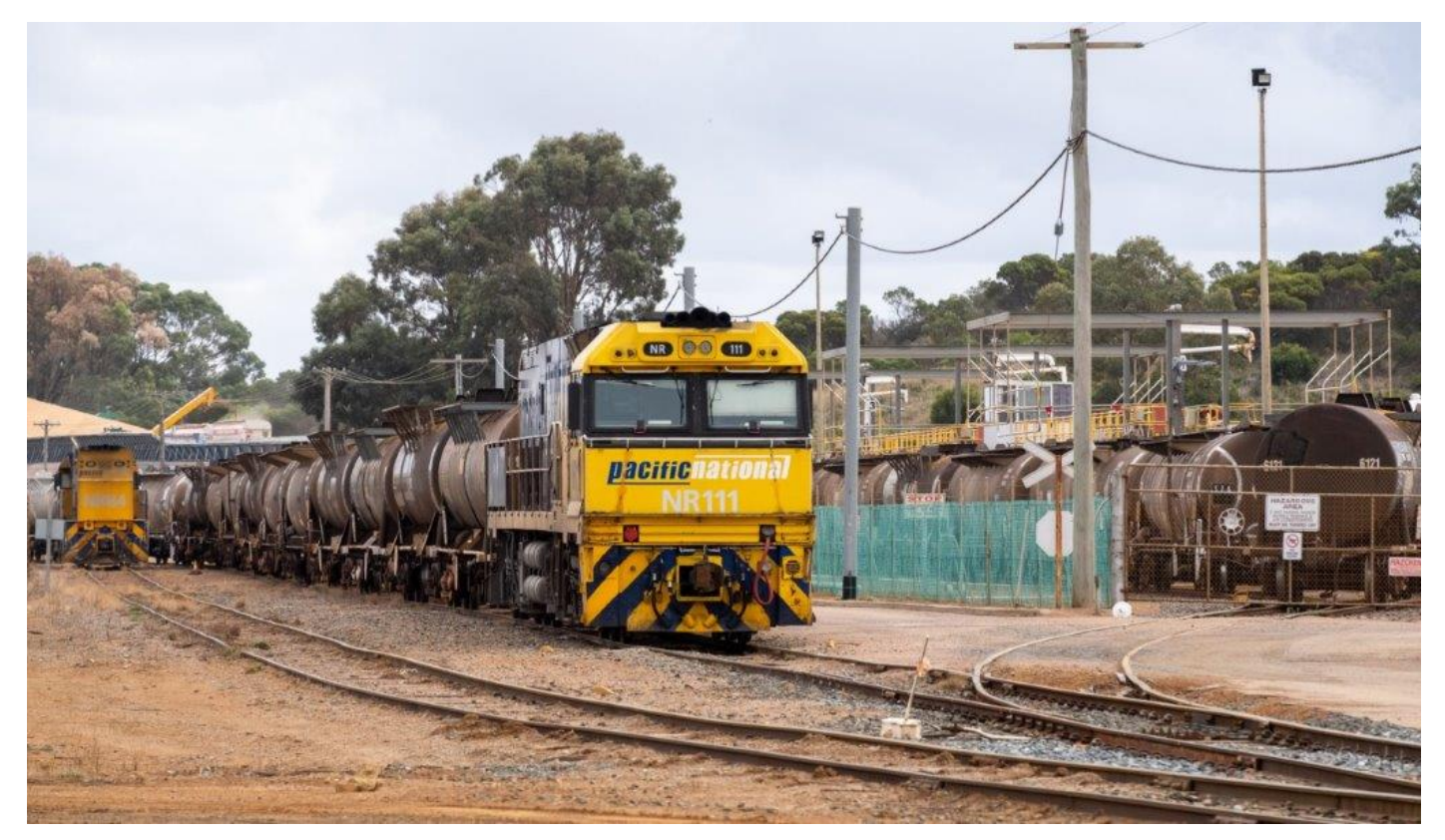
NRs 111 & 84 parked on the Viva sidings at Esperance, 9<sup>th</sup> May.