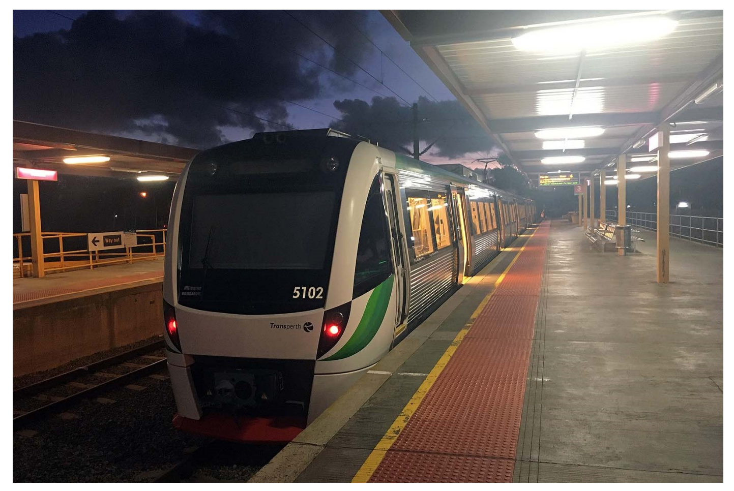
The sun sets as TransPerth B set 102 waits at Midland, 15<sup>th</sup> May.