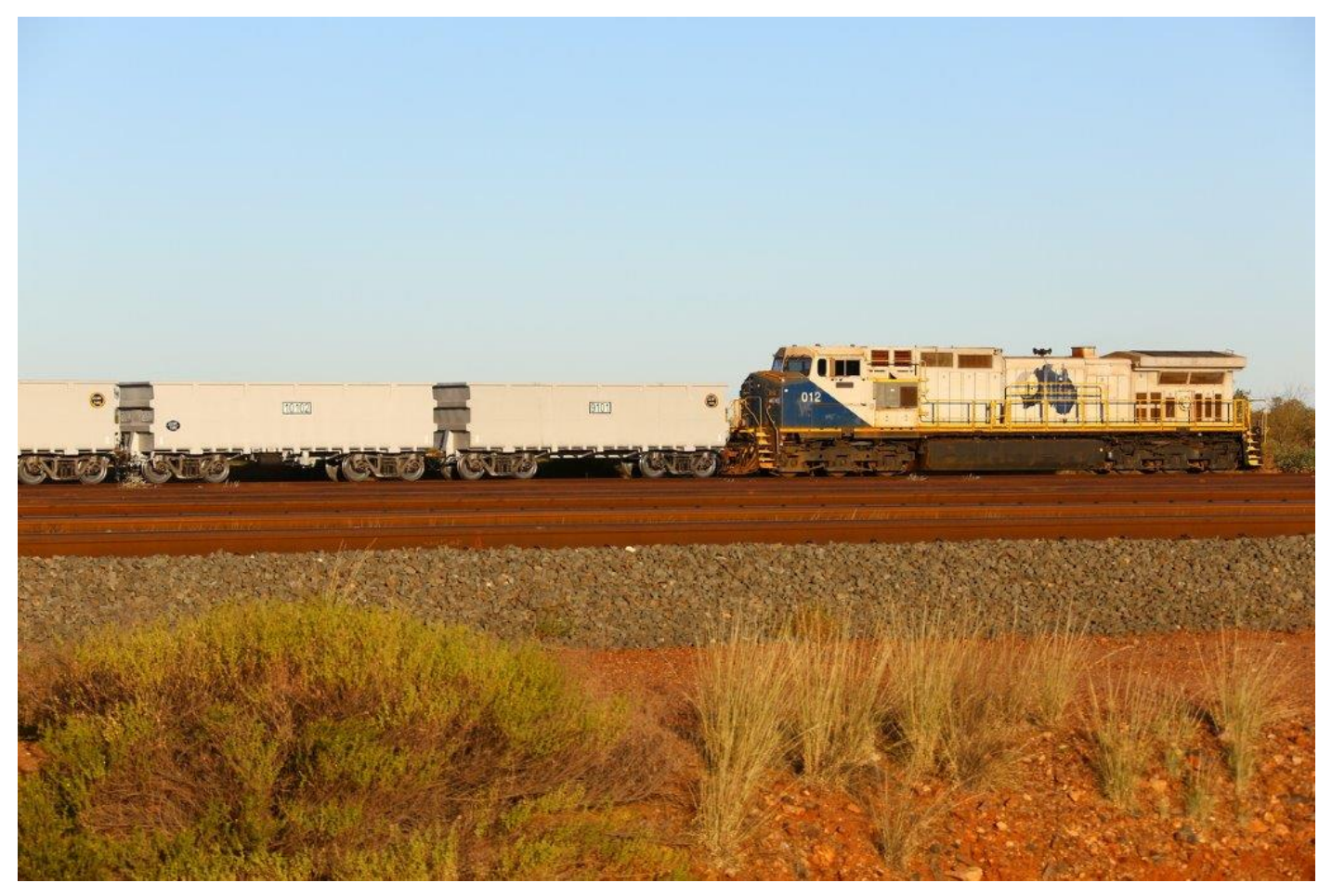
FMR's 012 shunts new wagons undergoing commissioning and leak testing, 5<sup>th</sup> May.