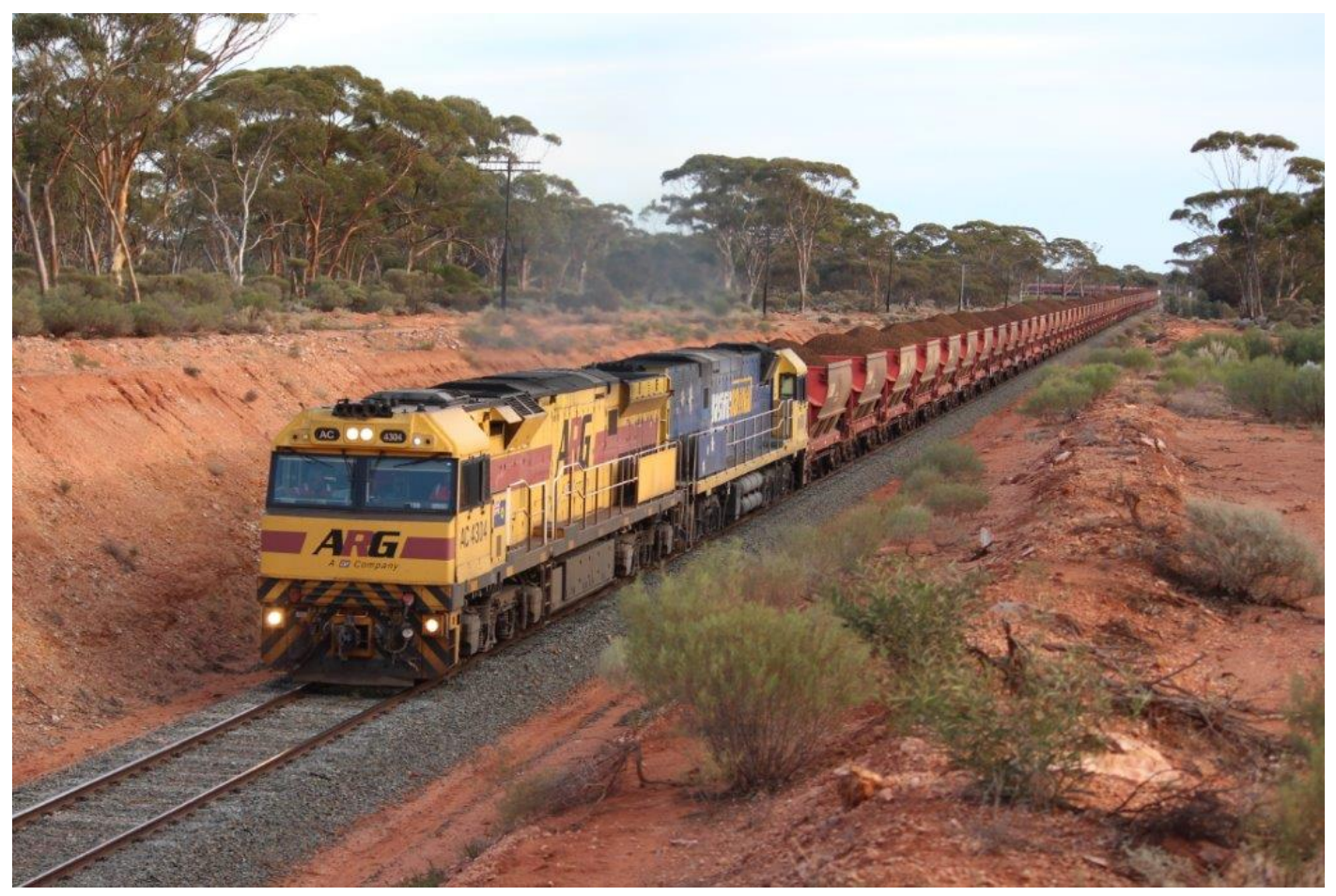
Following crew change, AC4304 & NR8 depart Binduli with Esperance drivers on PN's 7037 loaded ore, 10<sup>th</sup> May. Page 12 of 26