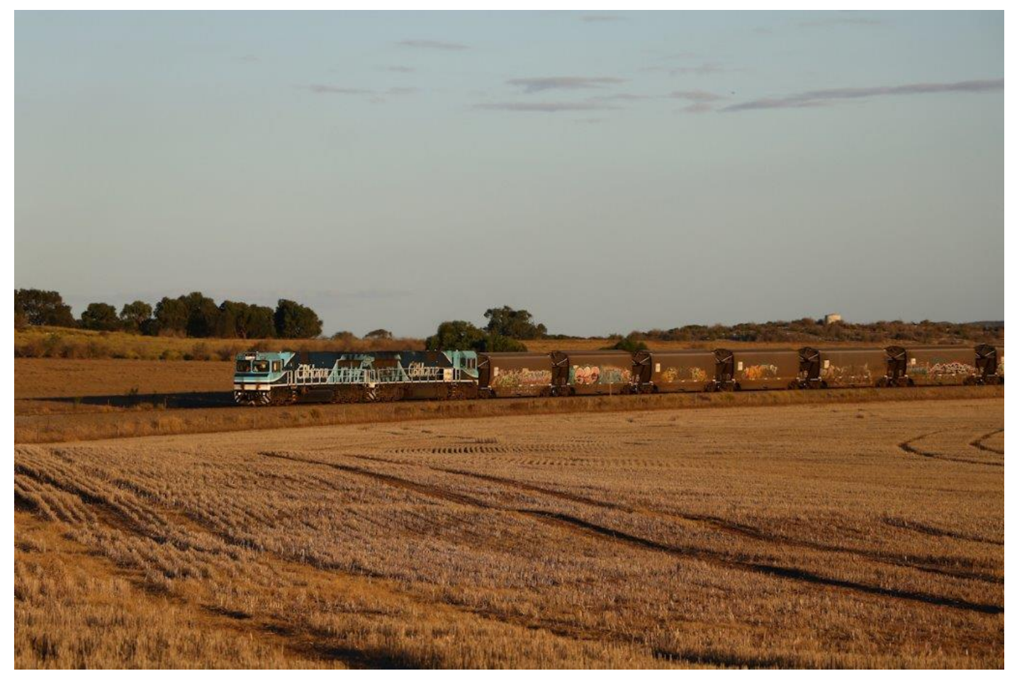
6G51 loaded grain ex Mingenew rolls through South Greenough behind CBHs 007 & 006, 8<sup>th</sup> May. Page 10 of 26