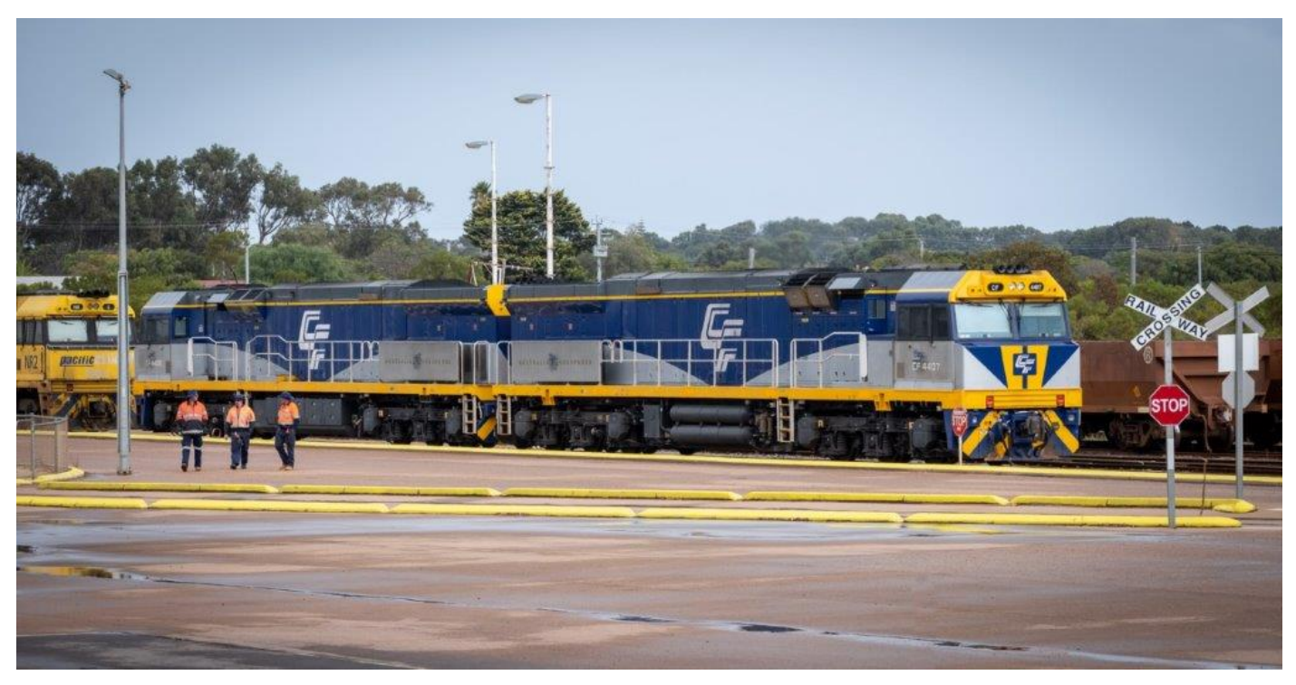
CFs 4407 & 4408 sit with NR2 in Esperance yard, 9^{\rm th} May.