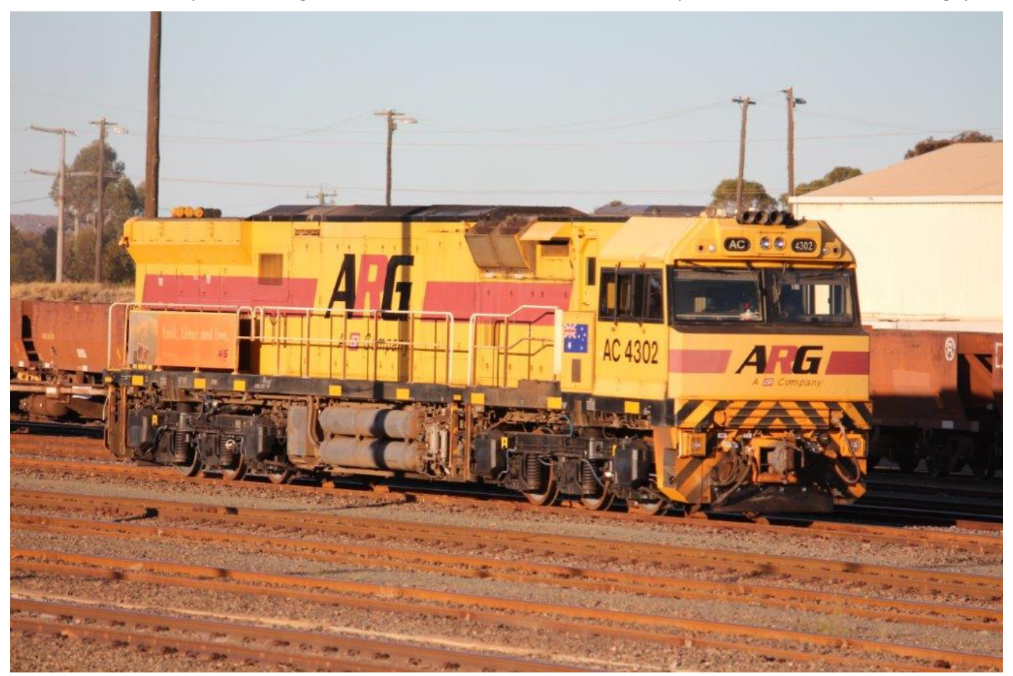
After 2½ years in storage, AC4302 has been repaired and reactivated. West Kal, 14/5. Page 17 of 26