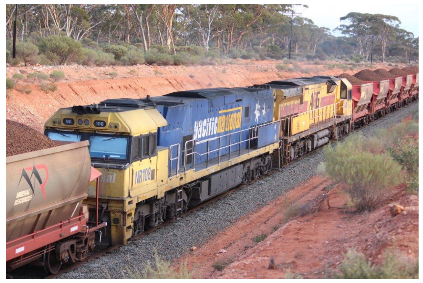
NR108 & AC4301 are the distributed power units on 7037 loaded ore, Binduli, 10<sup>th</sup> May.