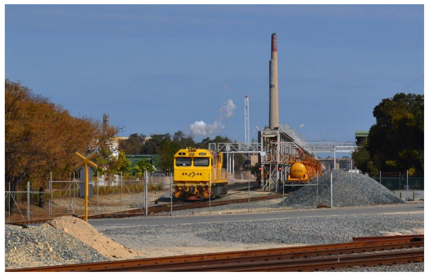
Q4009 stables while sulphuric acid from Hampton smelter is unloaded at Coogee terminal, 16<sup>th</sup> May.