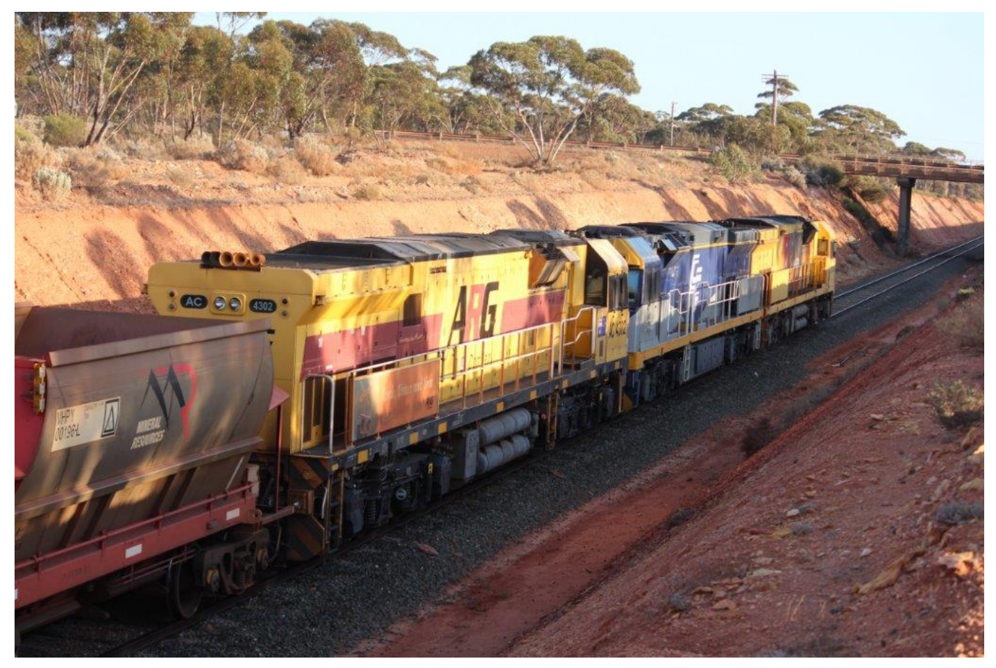
ACC6032, CF4408 & AC4302 with DPU ACB4402 & MRL006 approach Binduli with 6044 empty ore from Esperance to Koolyanobbing, note fresh horns and bogies in recently-reactivated AC4302.