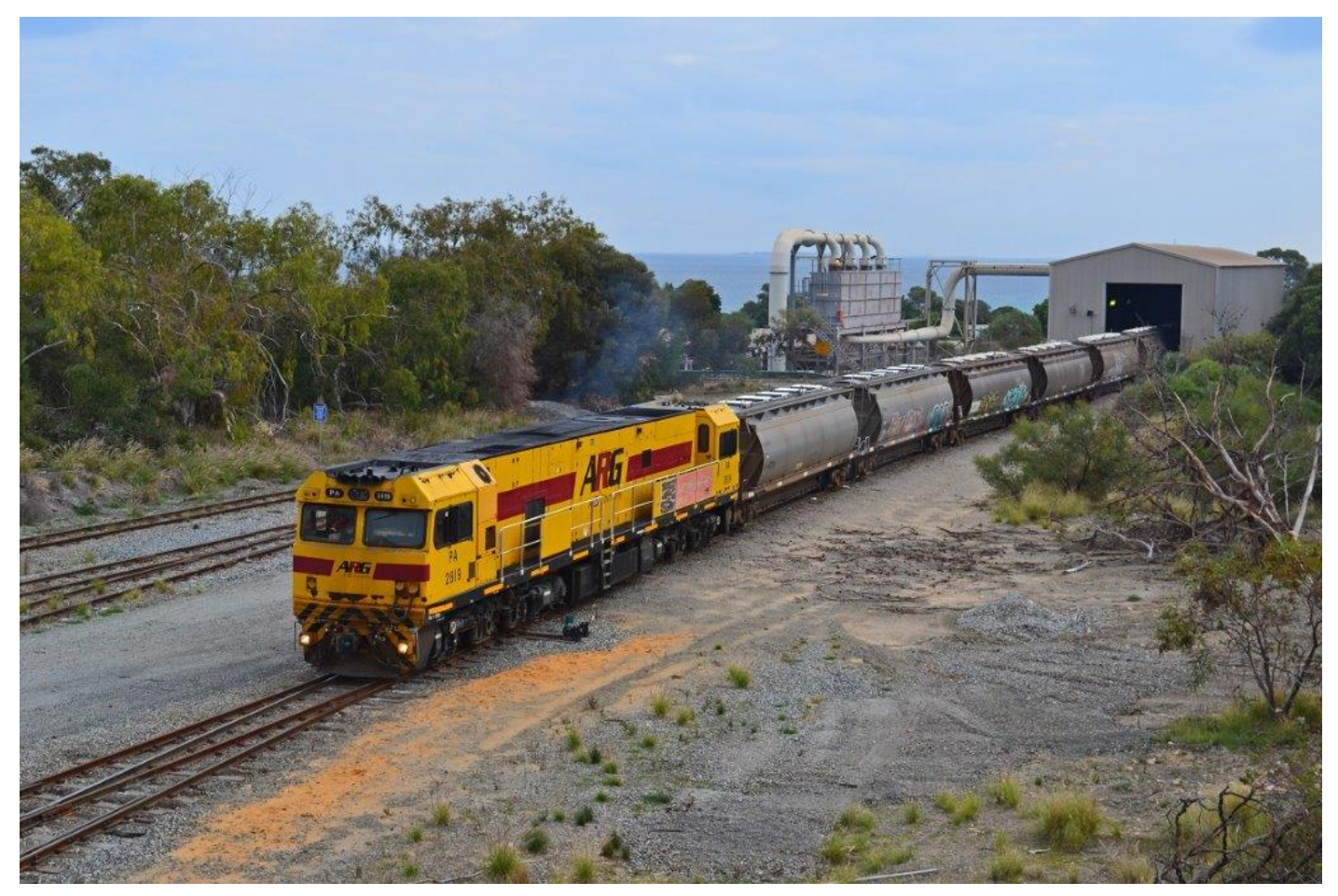
7222 alumina is unloading at Kwinana, 16<sup>th</sup> May.