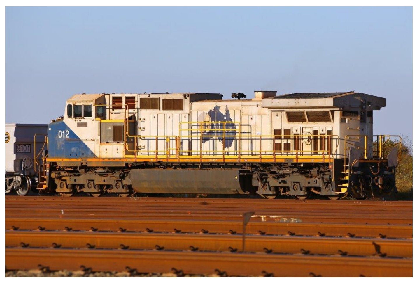
C44-9W 012 "Peter Tapine" sports modified handrails, kick rail and steps, 5<sup>th</sup> May.