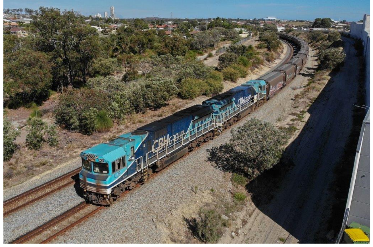
CBHs 009 & 002 pass through Cockburn on 7K07 empty grain to Wagin, 2<sup>nd</sup> May. Photo

NUMBER 5A free monthly photo e-Mag of railway happenings in WA during May 2020PUBLISHER Peter DonaghyEmail: <a href="mailto:peterdonaghy2@bigpond.com">peterdonaghy2@bigpond.com</a>Copyright: Peter Donaghy © 2020