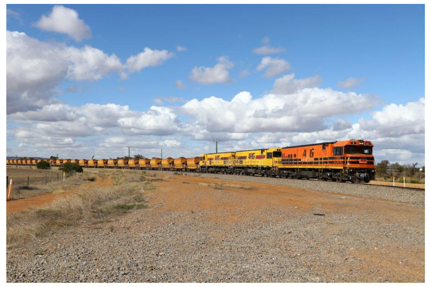
Ps 2503, 2502 & 2514 ease 6721 loaded Mt Gibson ore through Narngulu, 8<sup>th</sup> May.