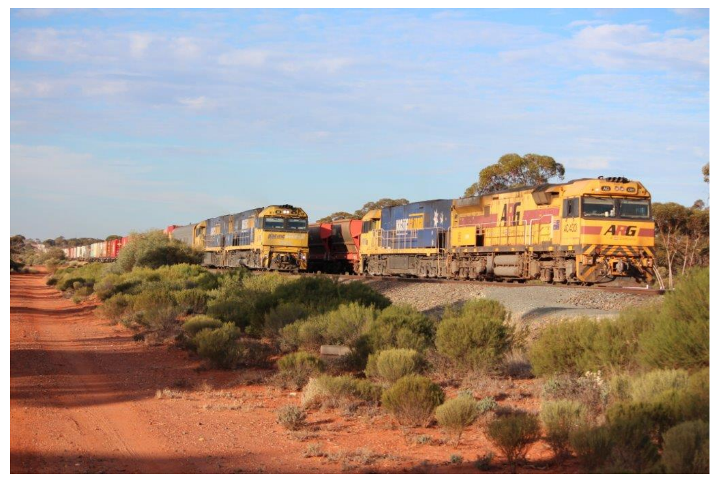
NRs 16 & 64 on 7SP5 overtake AC4301 & NR108 on Aurizon's 2040 empty ore, Binduli, 11<sup>th</sup> May.