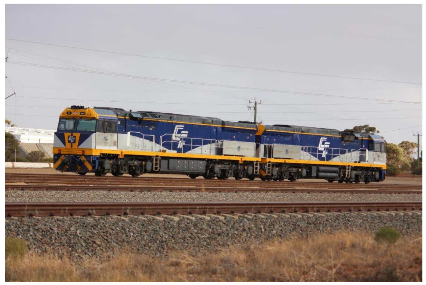
CFs 4407 & 4408 await transfer to Esperance, West Kalgoorlie yard, 6<sup>th</sup> May. Page 8 of 26