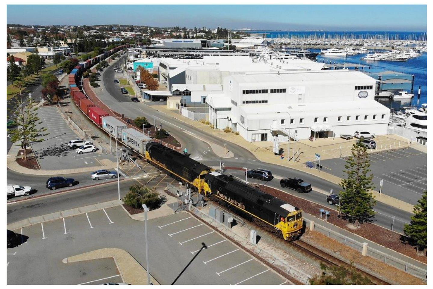
5142 ILS Port Shuttle passes through Fremantle behind HL203 & G511, 14<sup>th</sup> May.