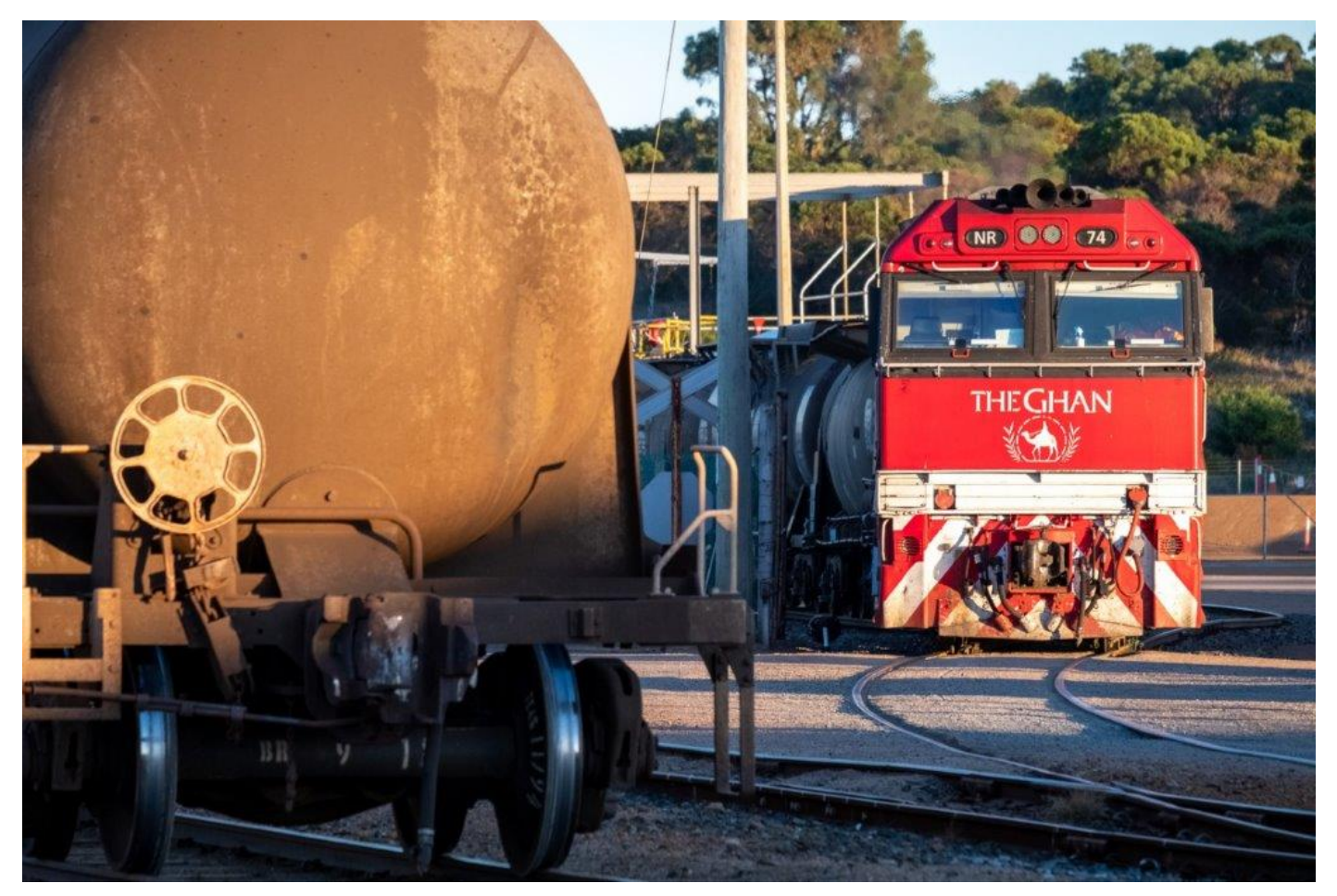
NR74 shunts tanks in the Viva compound, Esperance, 2<sup>nd</sup> May.