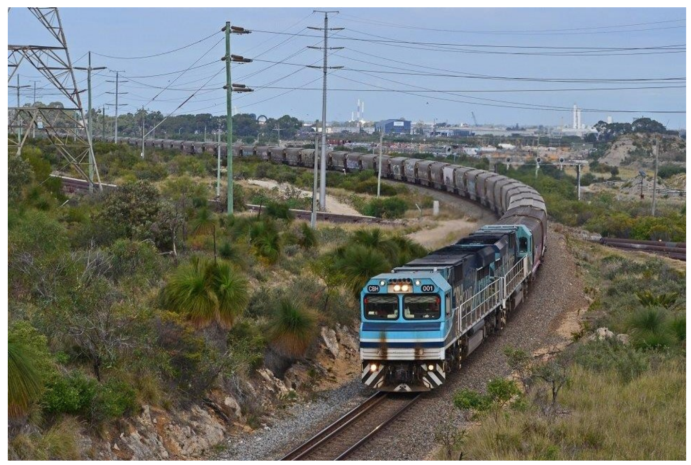
CBHs 001 & 009 depart Kwinana terminal with 7K25 empty grain. Page 23 of 26