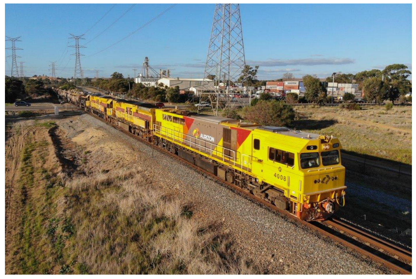
Q4008 leads ACs 4305 & 4302 on the BP & Maintenance shuttle, Hope Valley, 8th May.