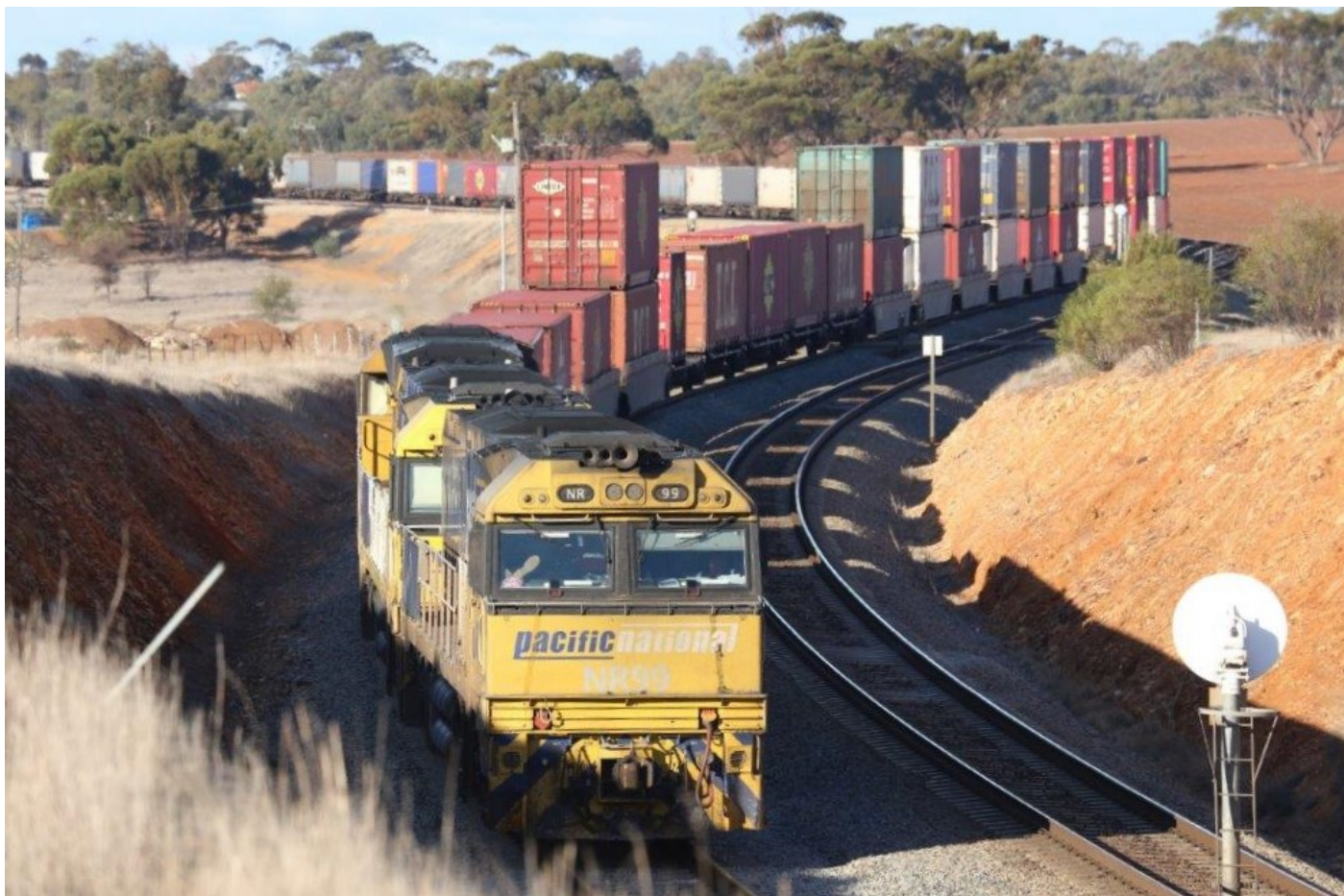
NRs 99, 81 & 50 wait at Grass Valley on 6SP5, 31 st May.