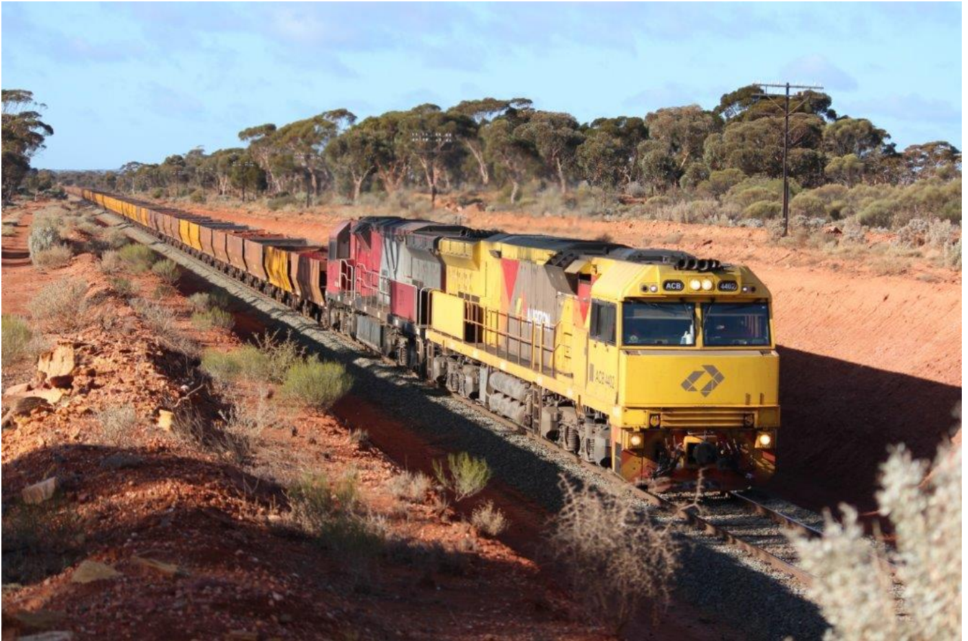
ACB4402 & MRL005 with DPU CF4407 & AC4302 pass under the Great Eastern Highway as they lead 6044 empty ore into Binduli, 30 th May.