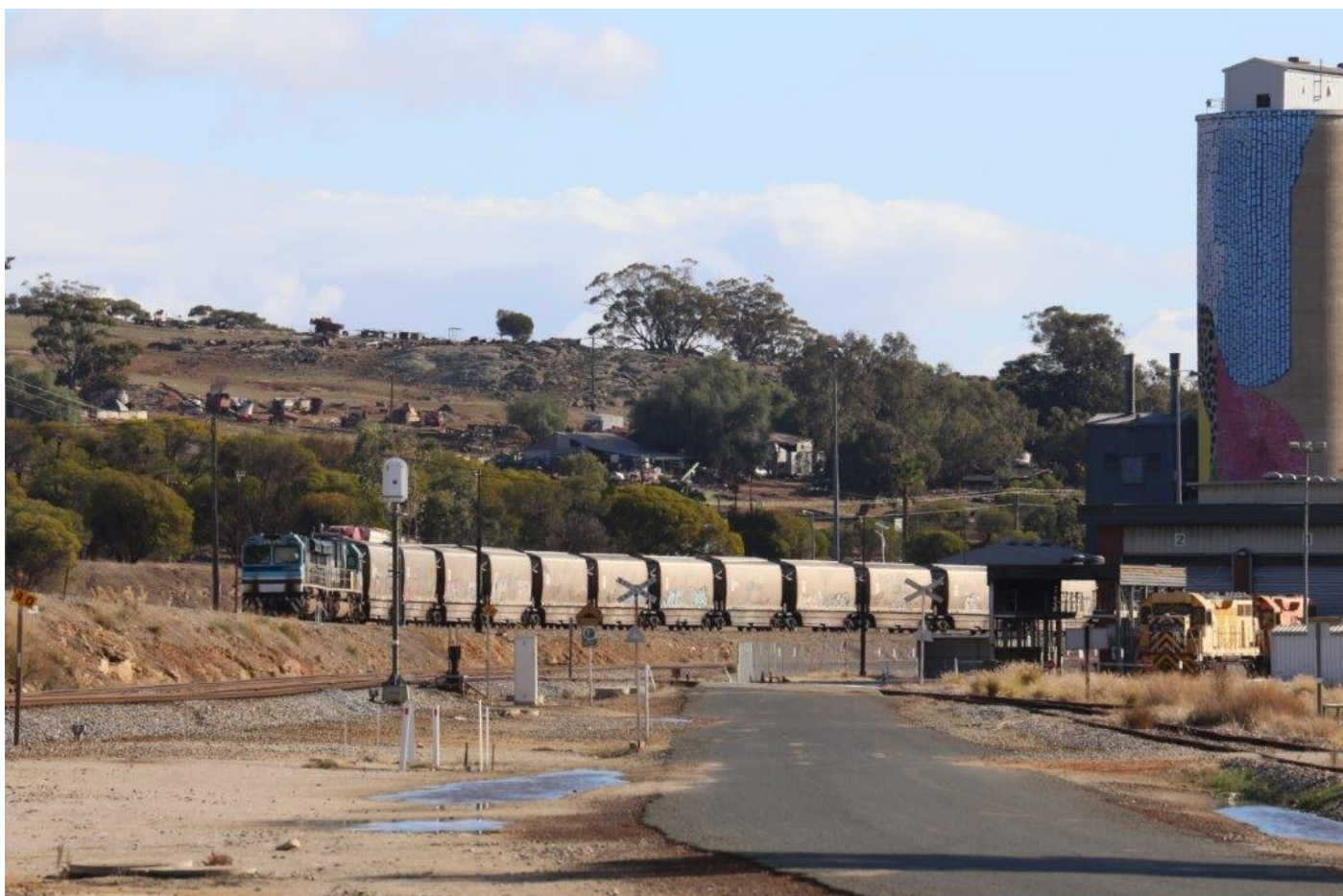
CBHs 122 & 119 on 7S53 in Avon yard, with stabled L3115 & a sister unit, 31 st May. Page 16 of 20