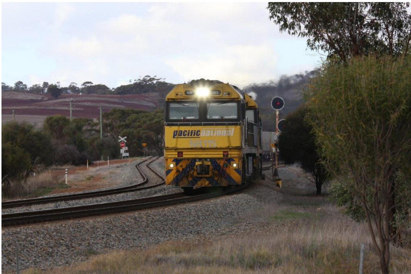
NRs 115, 116 & 85 pass through Northam East Junction (above) and approach Racecourse Road crossing, near Toodyay (below) with 5MP2 steel service, 31 st May.