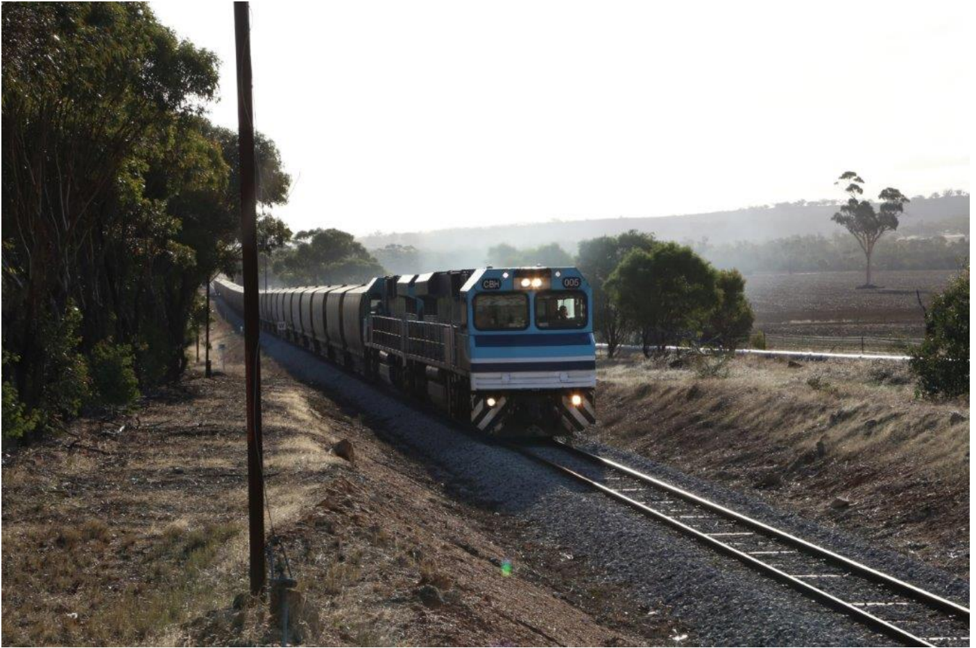
CBHs 005 & 017 lead 7K05 through Burgess (above) and Mackie Siding (below) en route to York, 30 th May.