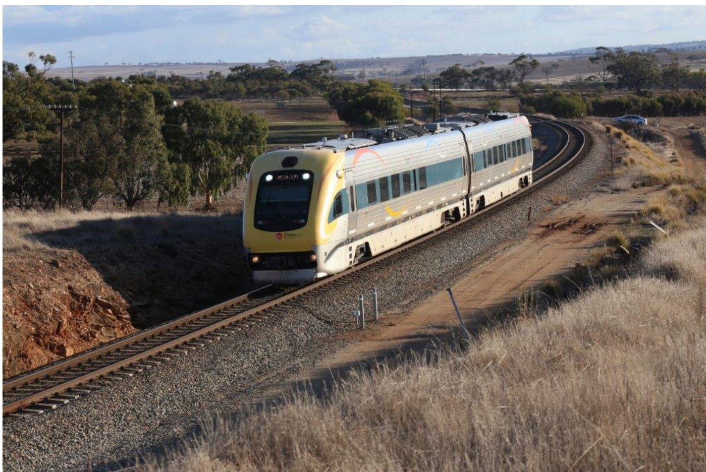
WDA001 & WDB011 hustle towards Grass Valley on 1085 Prospector to Kalgoorlie, 31 st May.