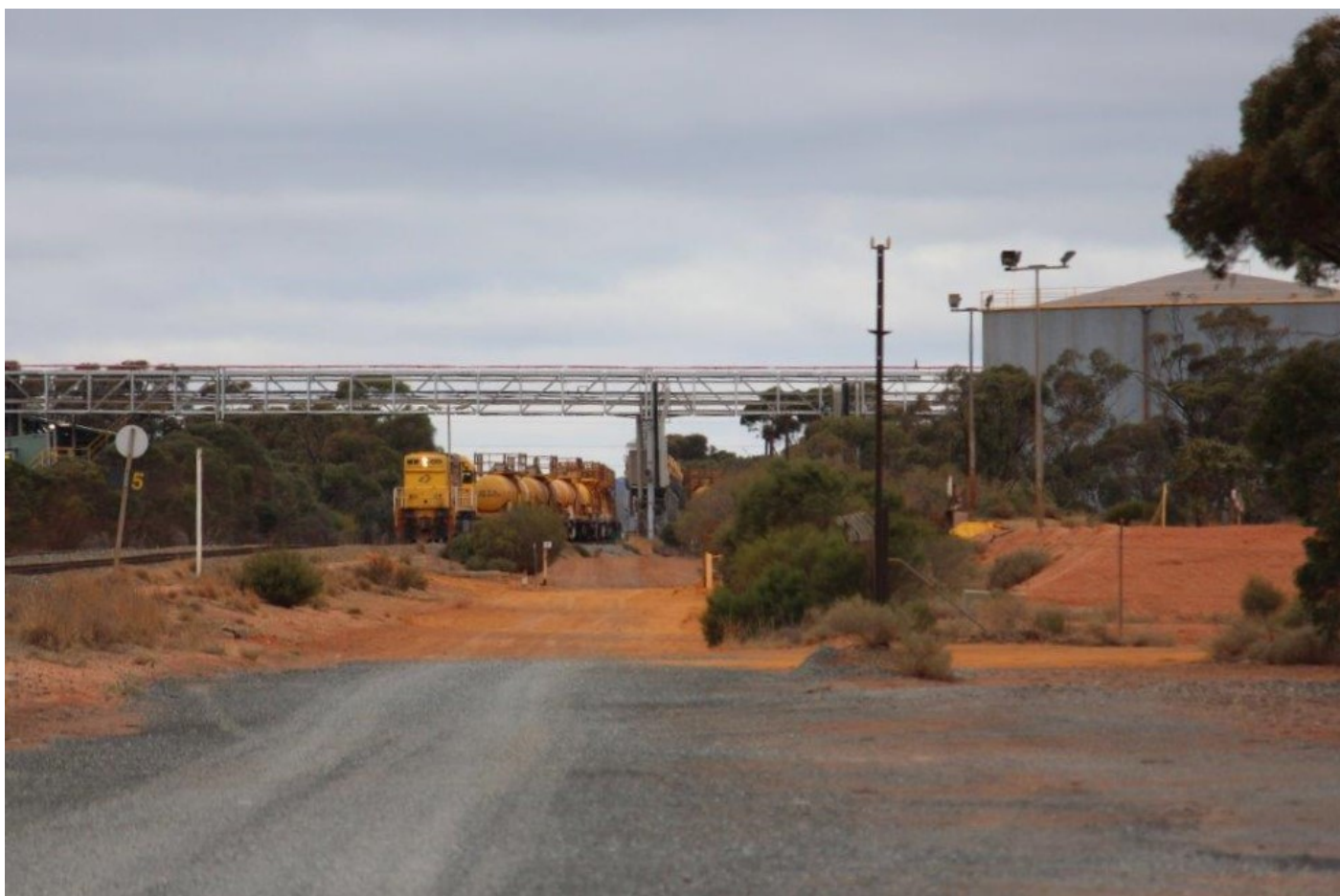
Q4008 shunts the acid siding at Hampton, 31 st May.