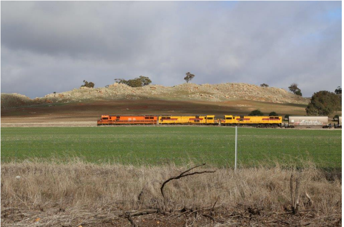
1K03 empty grain rolls past Balladong (above) and Ovens Rd crossing (below); the three DBZs with their previous owner's signage painted out. 31 st May.