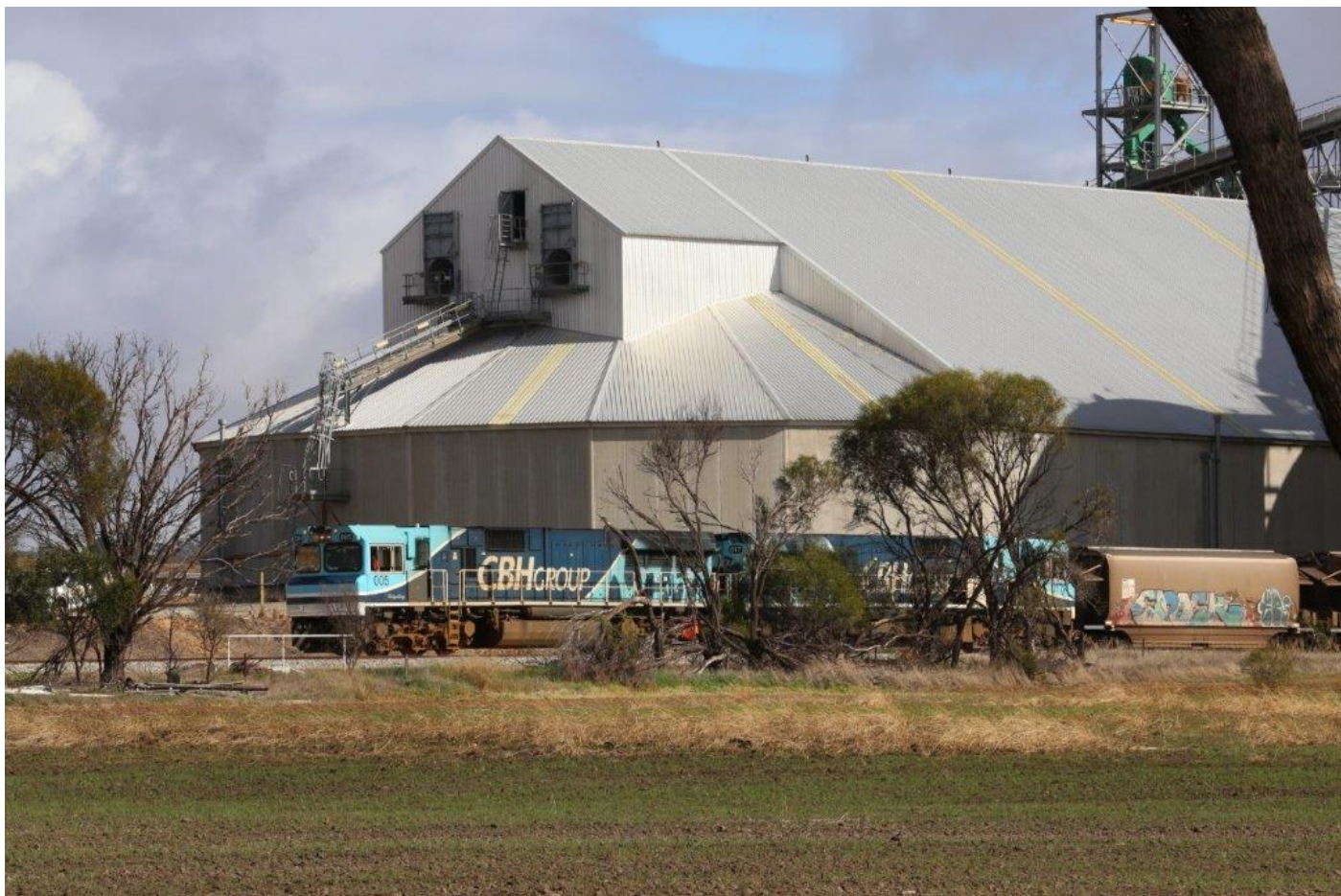
CBHs 005 & 017 on 1K05 load hoppers at CBH York, 31 st May.