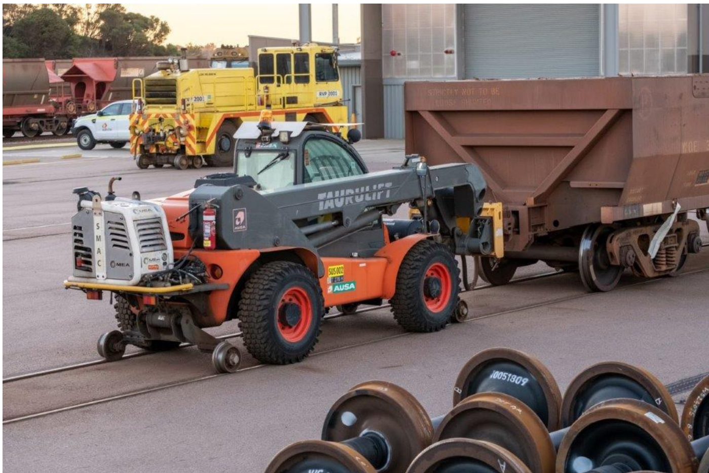
SUS002 moves wagons in and out of the workshops, 23 rd May.