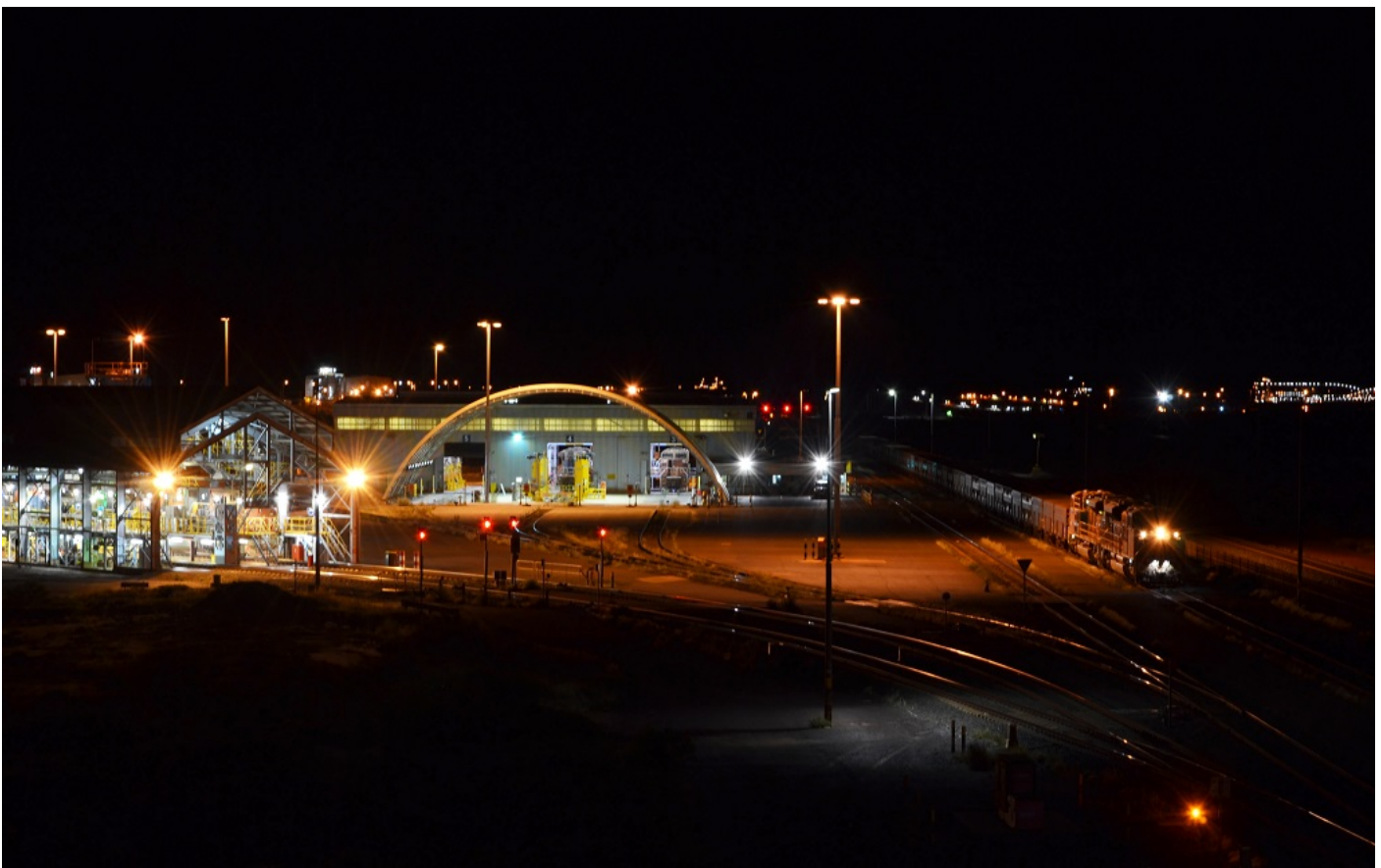
Boodarie at night, 29 th May – 4360 & 4450 on empty rake on 1 road (right of shot), and in the shed are 4335 on 3 road and 4355 on 4 road (numbering right to left from empty train).