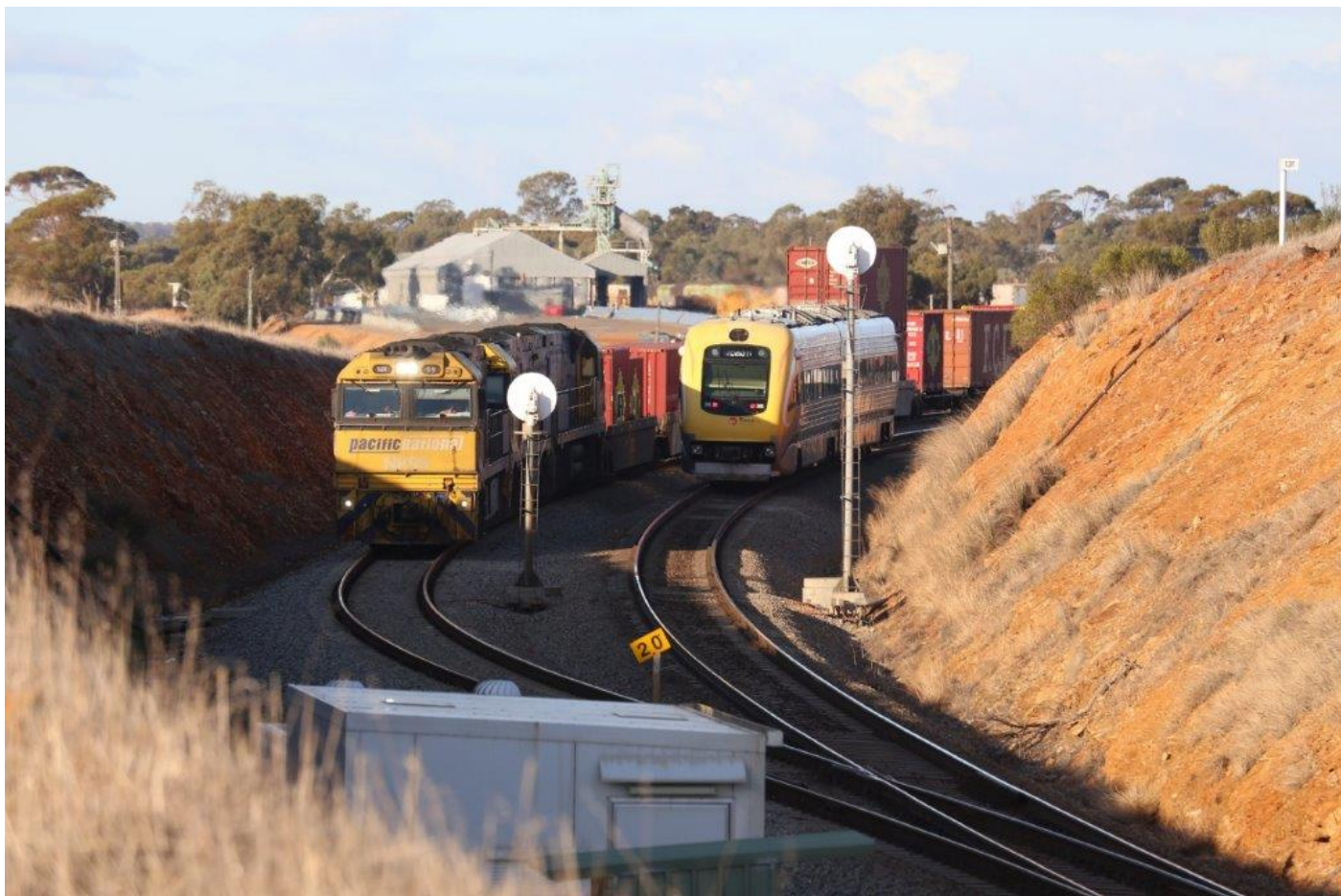
1085 crosses 6SP5 at Grass Valley, 31 st May.