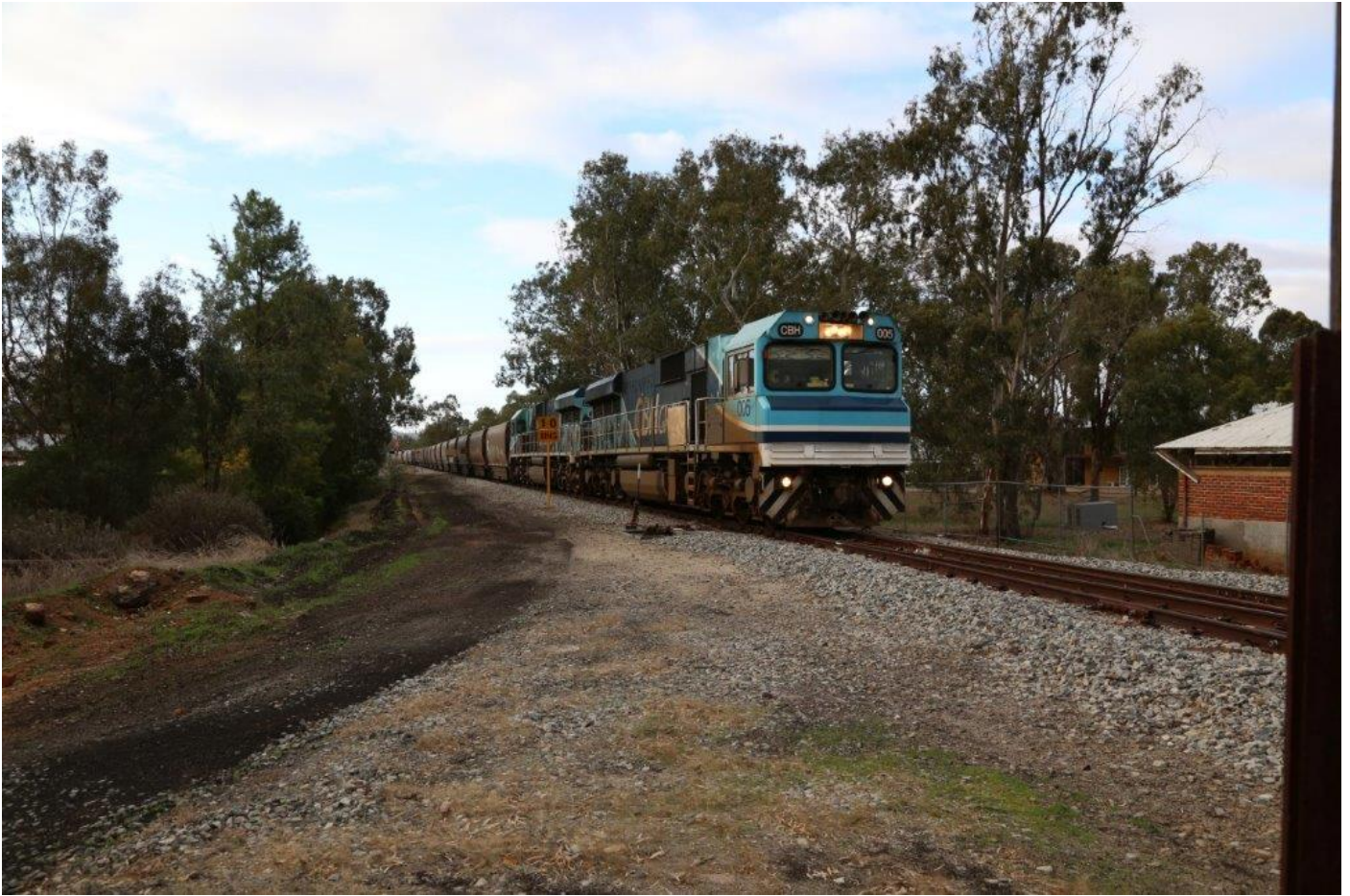
7K05 passes through York (above) and pulls up at York CBH grain silos (below), led by CBHs 005 & 017, 30 th May.