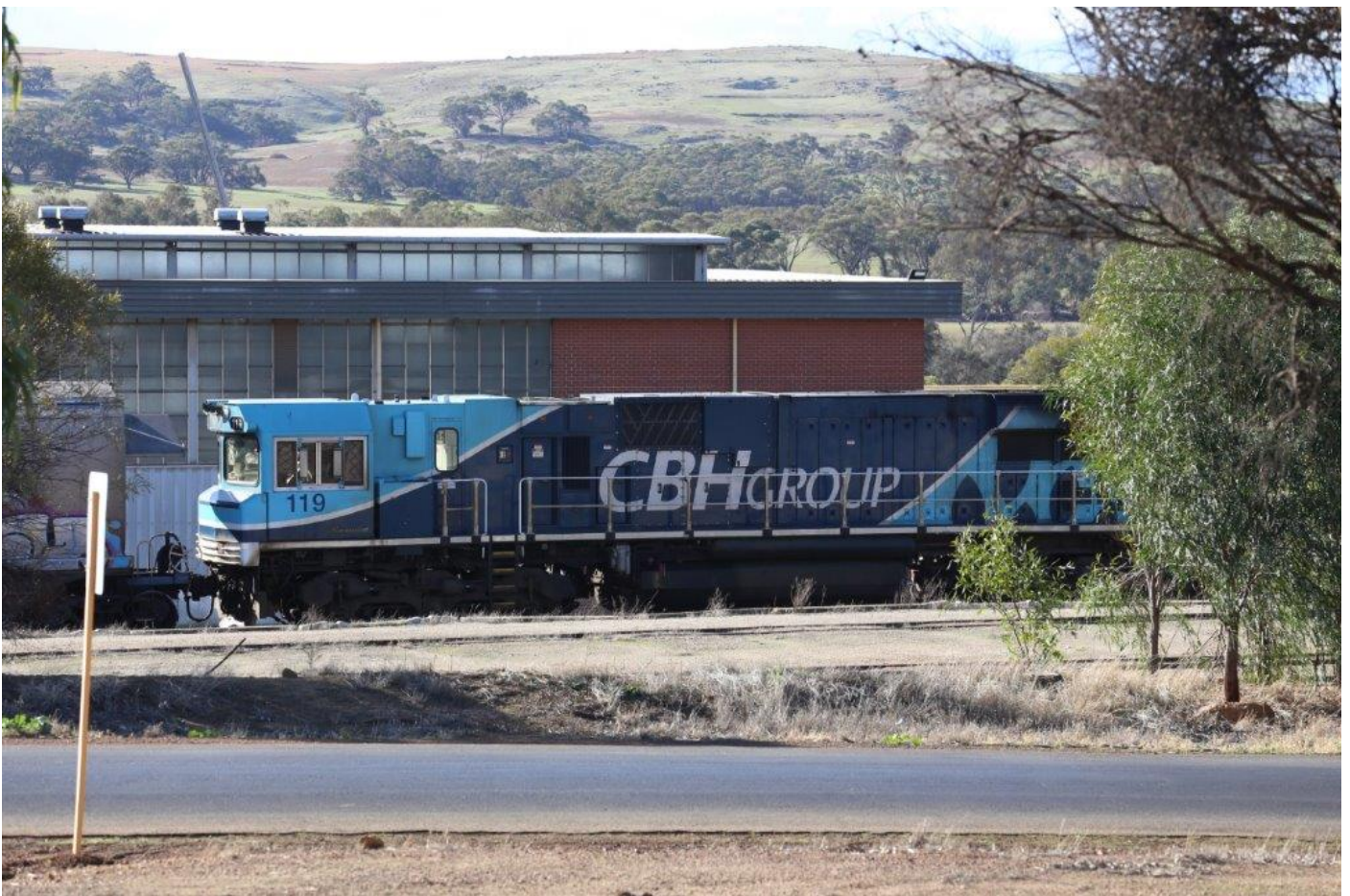
CBH119 stands on stabled 7553 empty grain at Avon Yard, 31 st May.