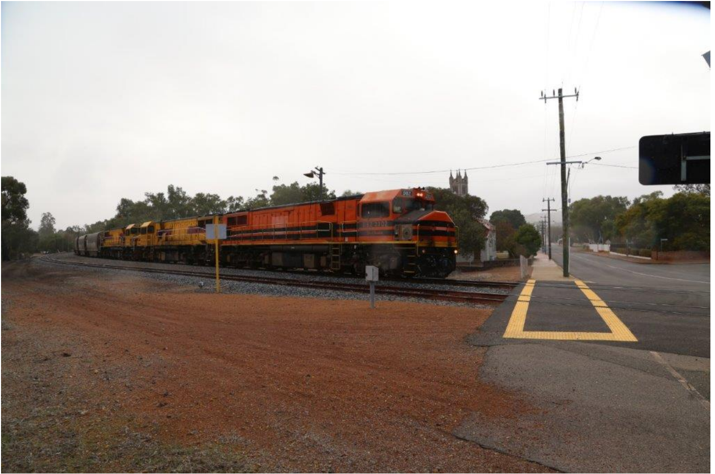
South St crossing at York is temporarily blocked as DBZs 2302, 2305 & 2301 lead 1K03 into town (above), passing the old railway station (below), 31 st May.