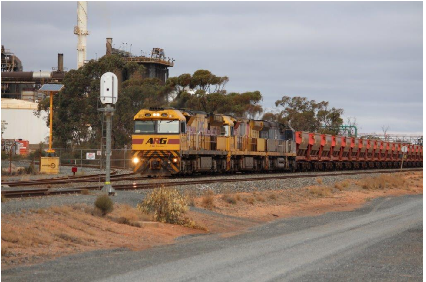
AC4304, ACB4404 & CF4405 with DPU AC4305 & MRL001 out of Hampton loop with 1040 empty ore, 31 st May. The ACB & CF would be swapped for CF4406 at Binduli. The nickel siding is visible at left above.