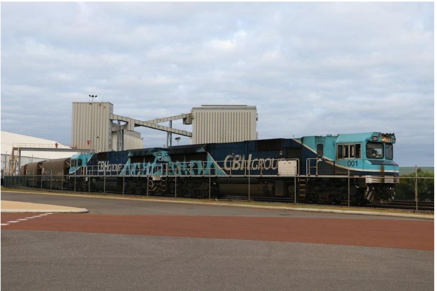
4G31 grain from Perenjori is being unloaded at Geraldton Port by CBHs 001 & 025, 28 th May.