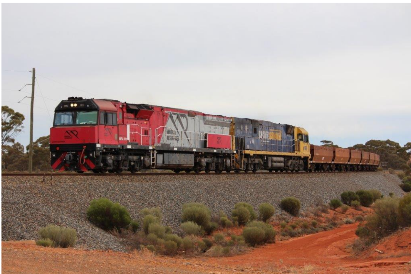
MRL001 & NR8 arrive at Binduli with 1MR1 short ore train, 24 th May, head-end power only.