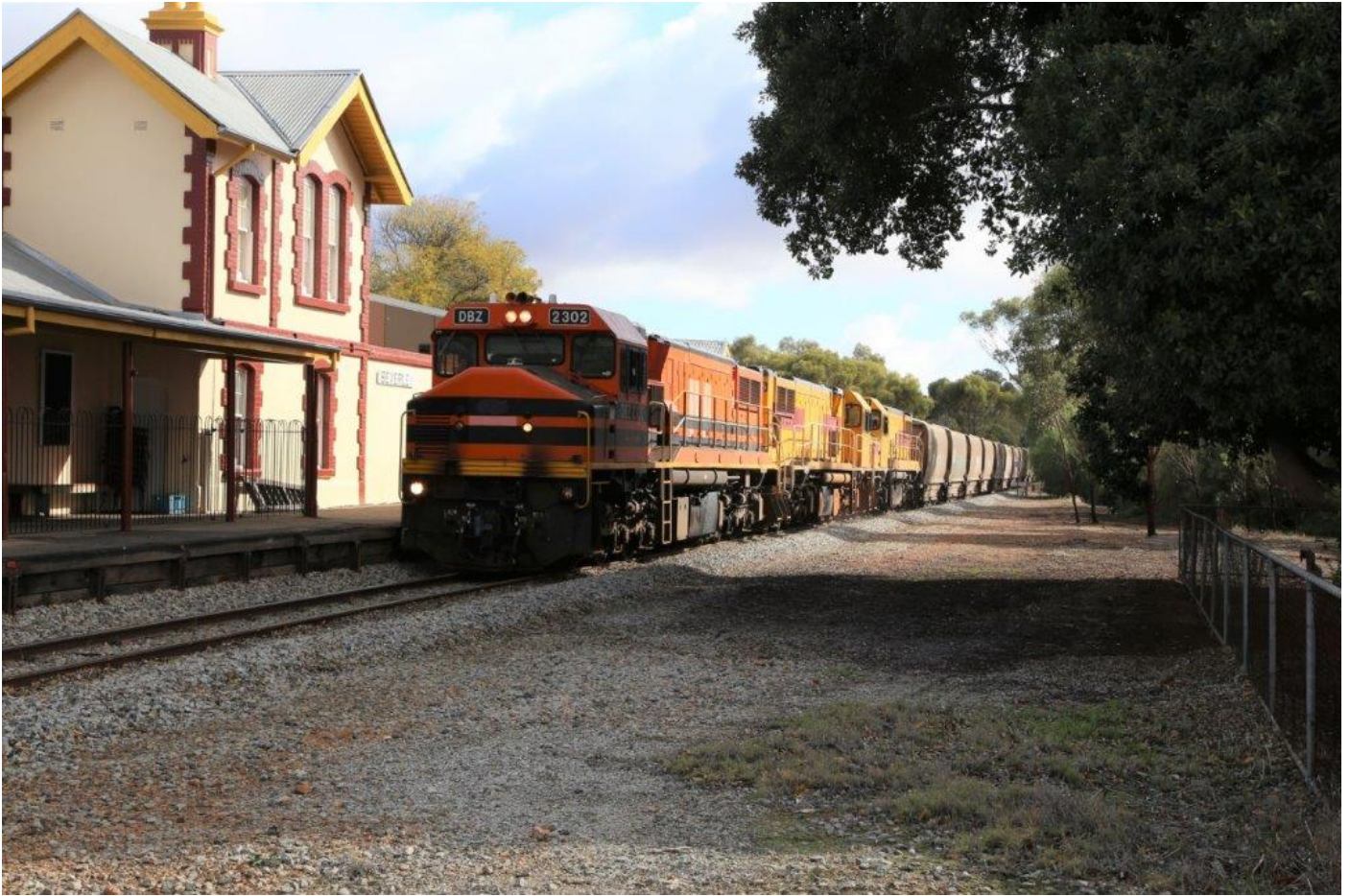
DBZs 2302, 2305 & 2301 roll through Beverley station with 1K03, 31 st May.