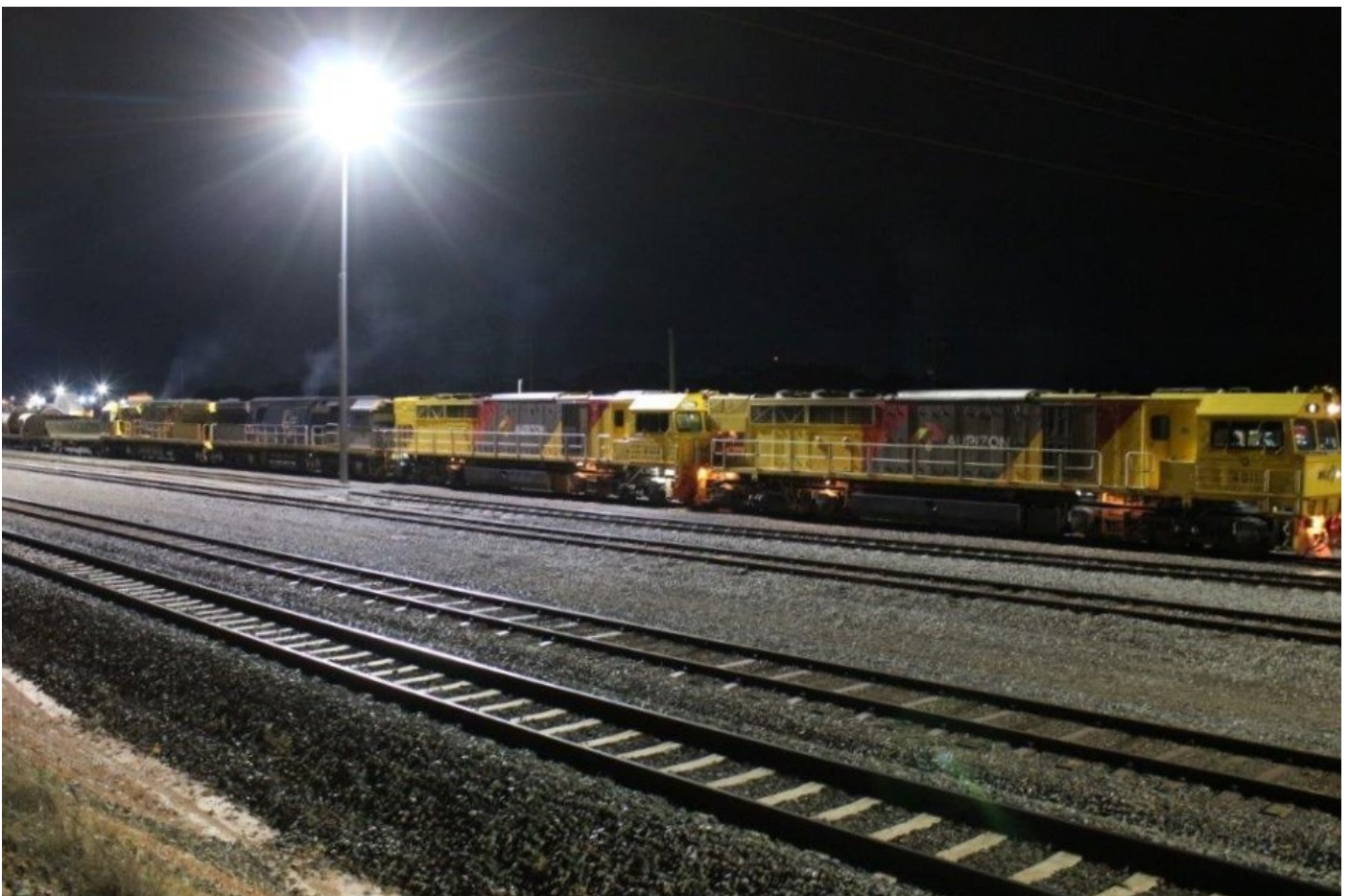
Qs 4011 & Q4008, CF4405 & ACB4404 prepare to depart West Kal on 1426 to Kwinana, 31/5.