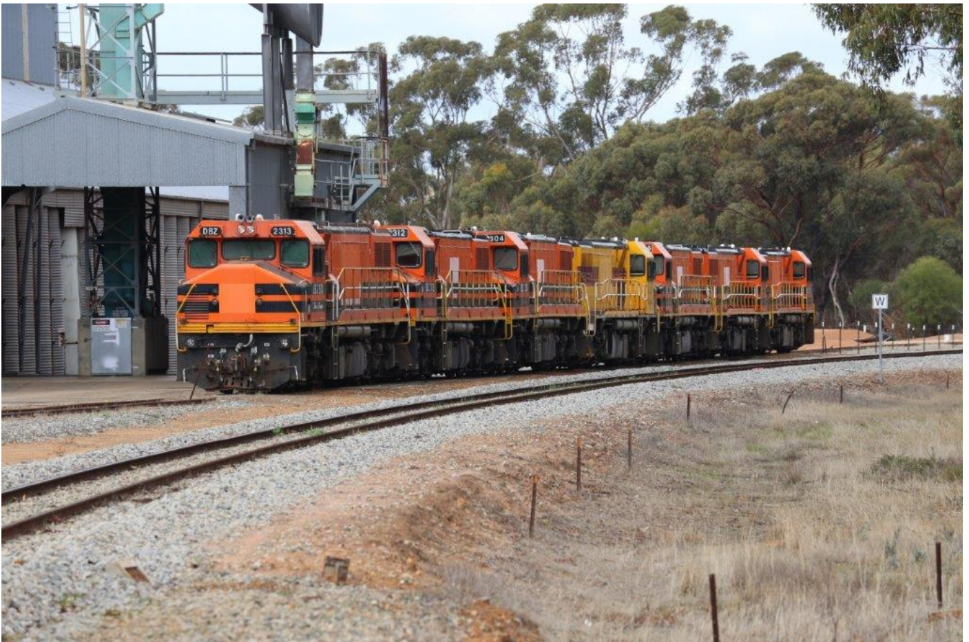
Stored DBZs at CBH Beverley, 31 st May.