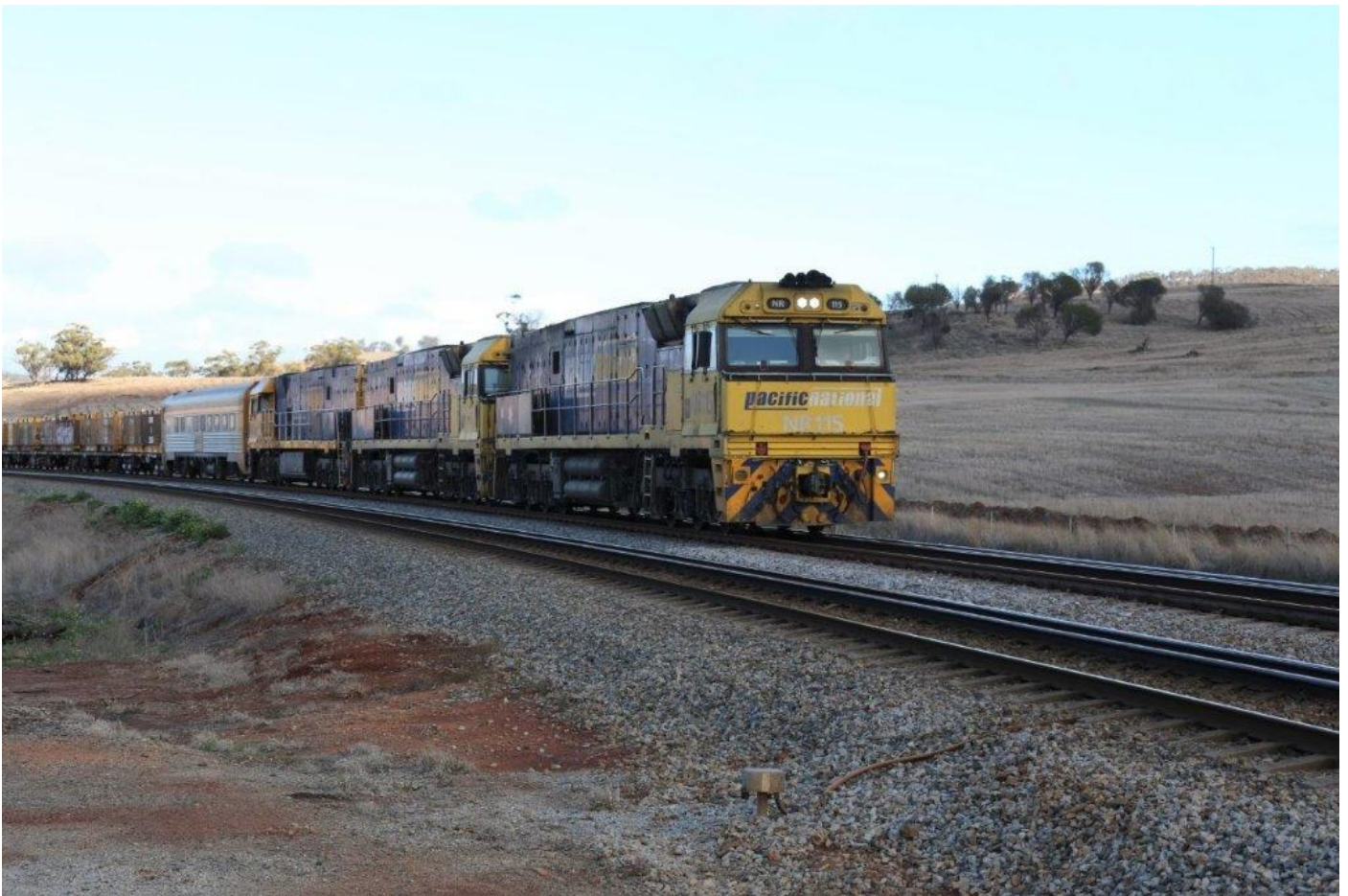
5MP2 approaches Racecourse Road crossing, Toodyay, 31 st May.