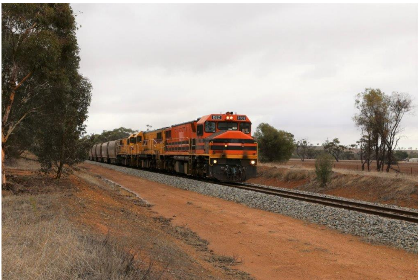
Triple DBZs 2302, 2305 & 2301 with 1K03 at Burgess, 31 st May.