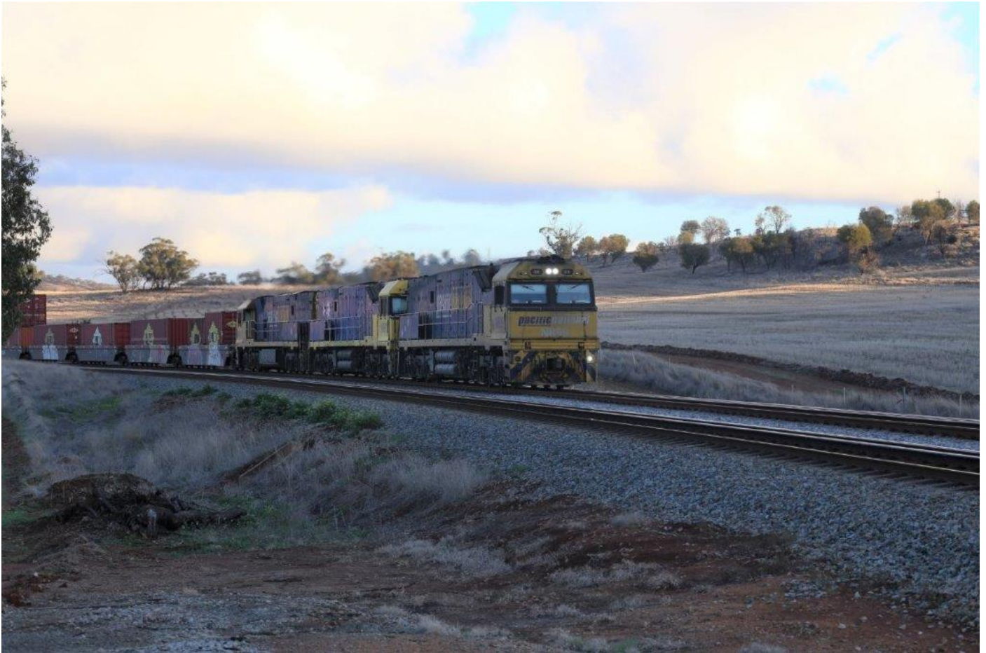
6SP5 rolls towards Toodyay, led by NRs 99, 81 & 50, 31 st May.