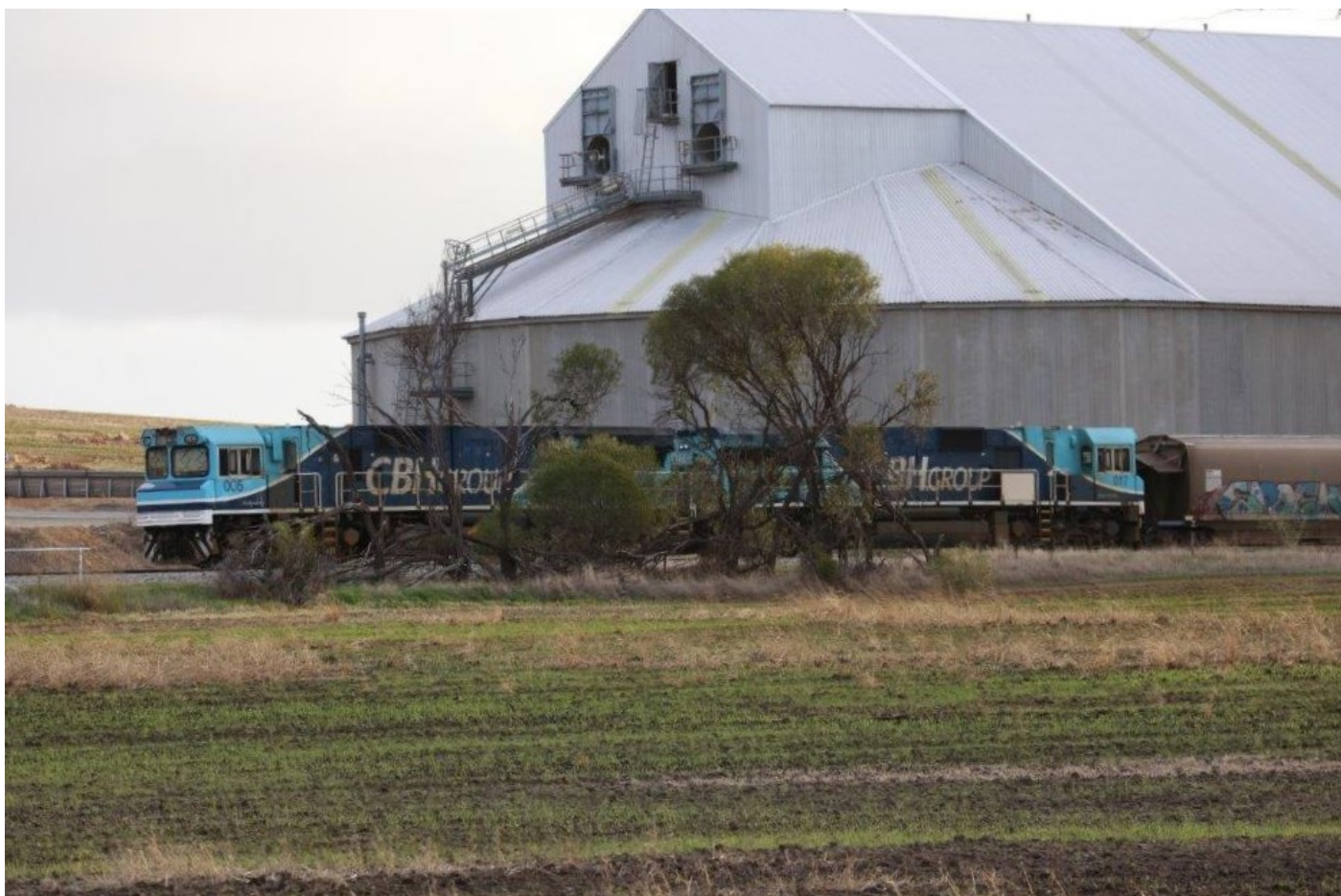
CBH York plays host to CBHs 005 & 017 on 7K05, 30 th May.