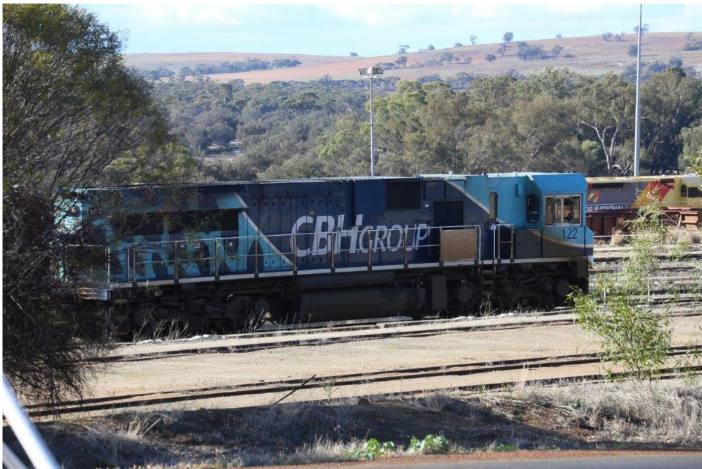
CBH122 on 7S53 empty grain at Avon Yard, 31 st May. LZ3106 is stabled in the background.