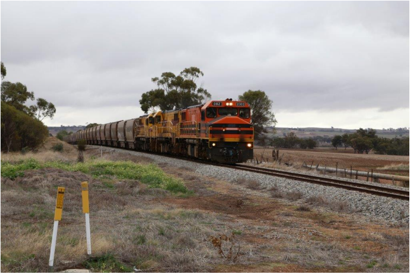
1K03 rolls through Spencers Brook – York Rd crossing (above) and South St crossing, York (below), behind DBZs 2302, 2305 & 2301, 31 st May.