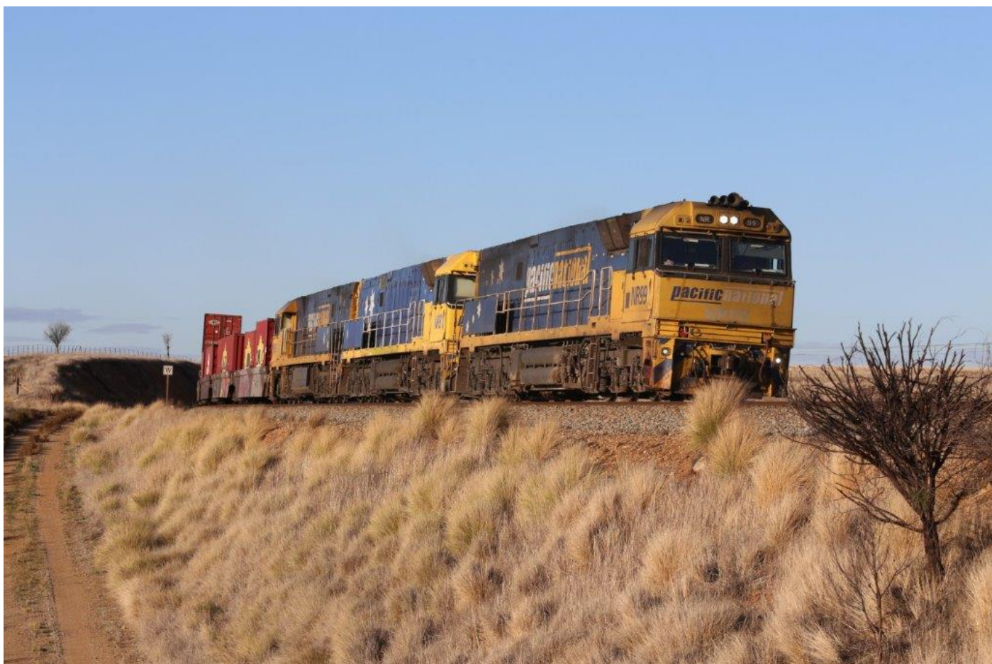
6SP5 powers away from Grass Valley, led by NRs 99, 81 & 50, 31 st May.