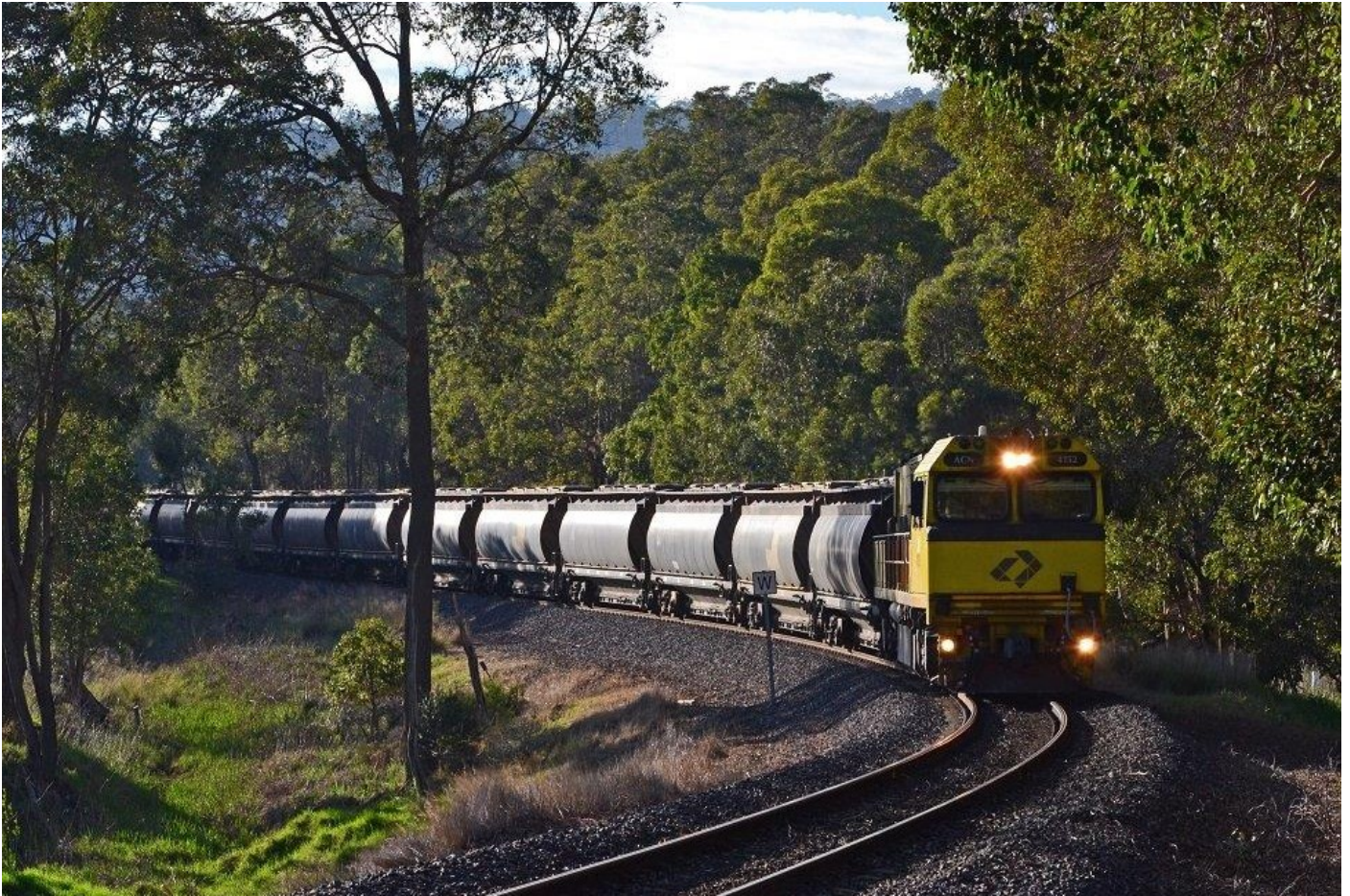
ACN4152 approaches Brunswick Junction with 6842 alumina to Bunbury, 5 th June.