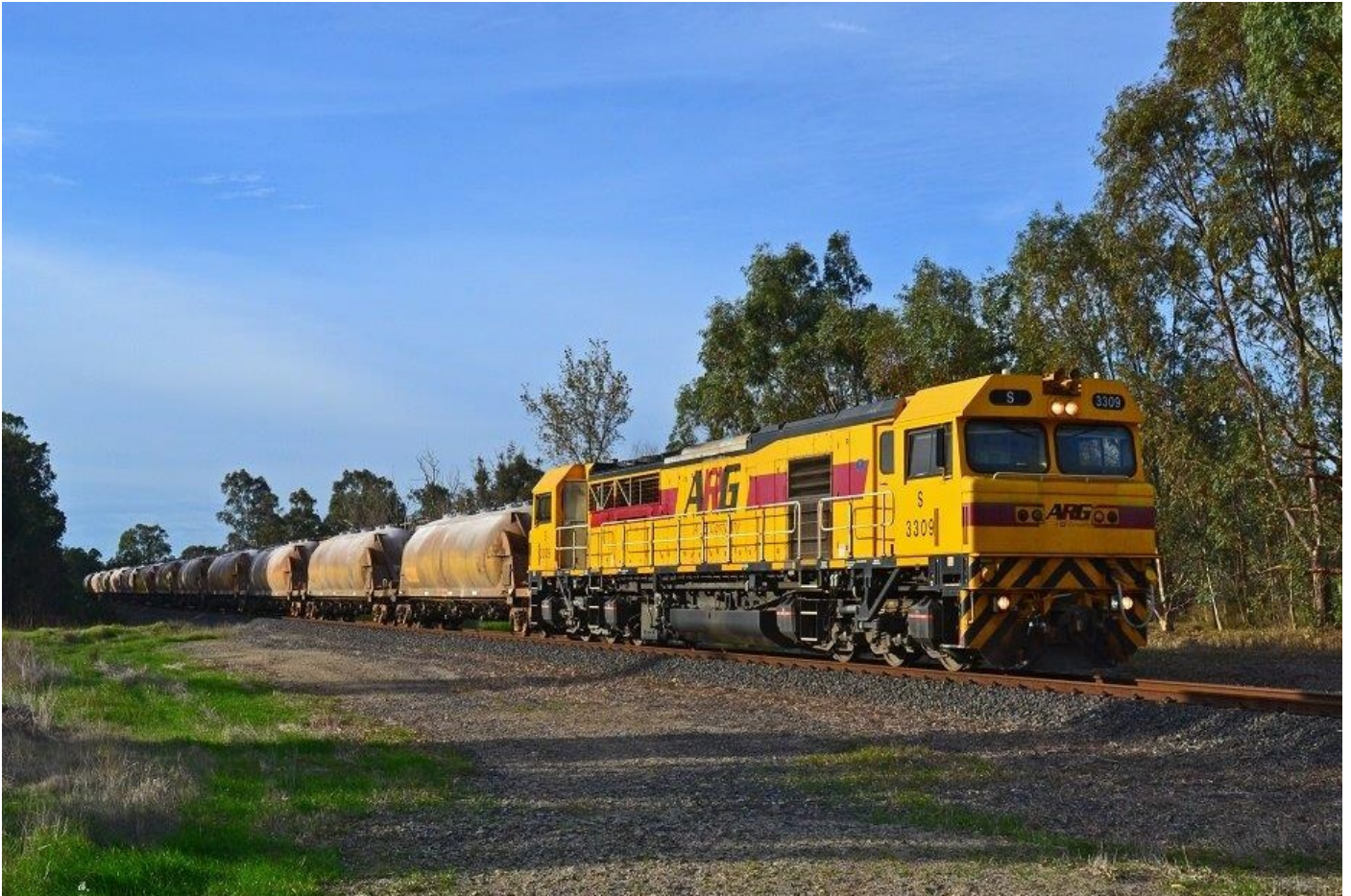
6271 Cockburn to Hamilton lime at Bengier, led by S3309, 5 th June.