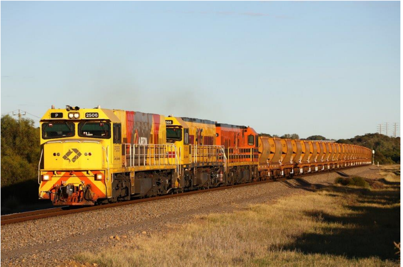
Ps 2506, 2508 & 2503 lead 6720 empty Mt Gibson ore west of Narngulu, 5 th June.