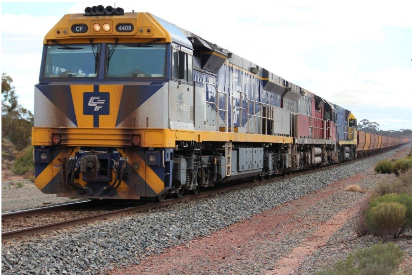
The only CF to ever lead a Kooly ore: CF4408, MRL003 & NR81 on 1MR1 near Hampton, 14/6.