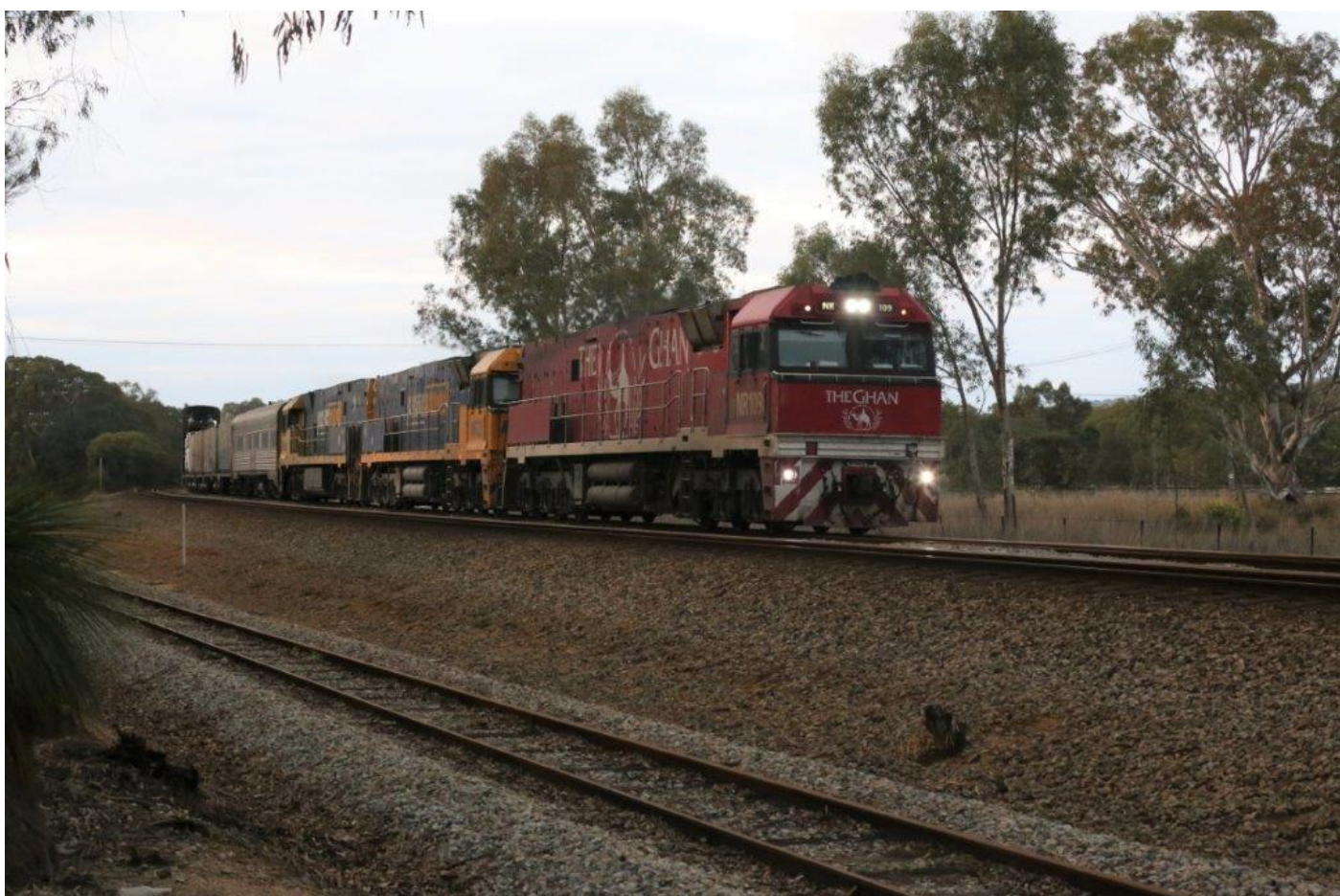
NRs 109, 121 & 118 head a late 6MP5 through Millendon Junction, 1 st June.