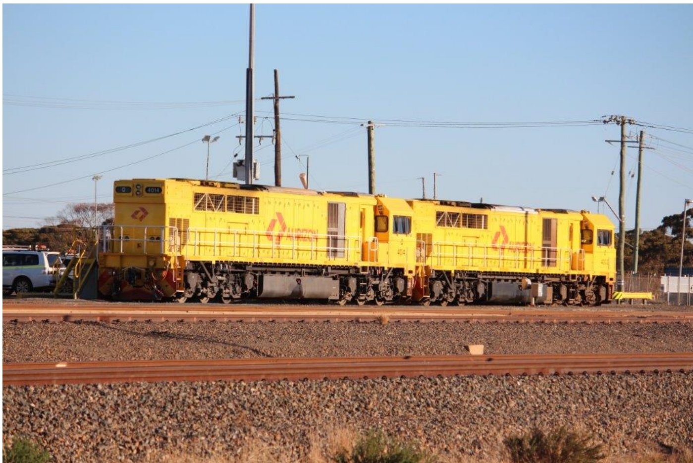
Two of the three corporate-liveried Qs together: 4014 & 4003, West Kalgoorlie, 16 th June.