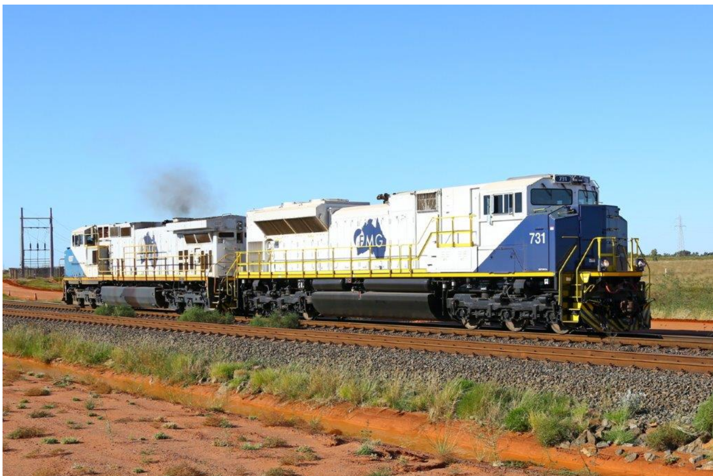
New 731 leads aging 007 from the port back to Kanyirri Yard service shops, 16 th June.