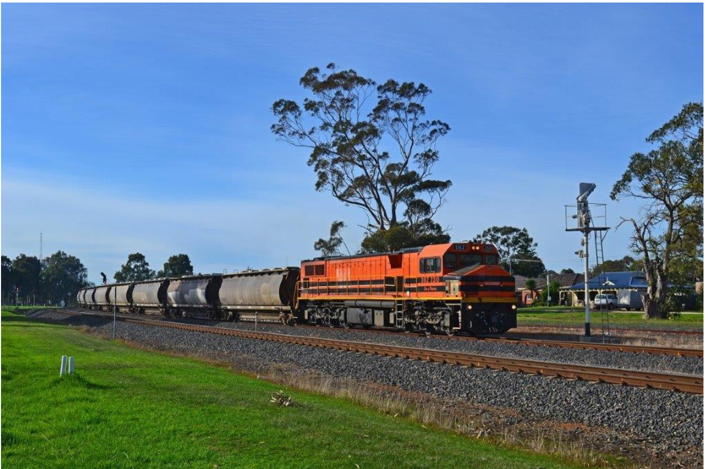
DBZ2310 leads an alumina rake through Brunswick Junction, 5 th June.