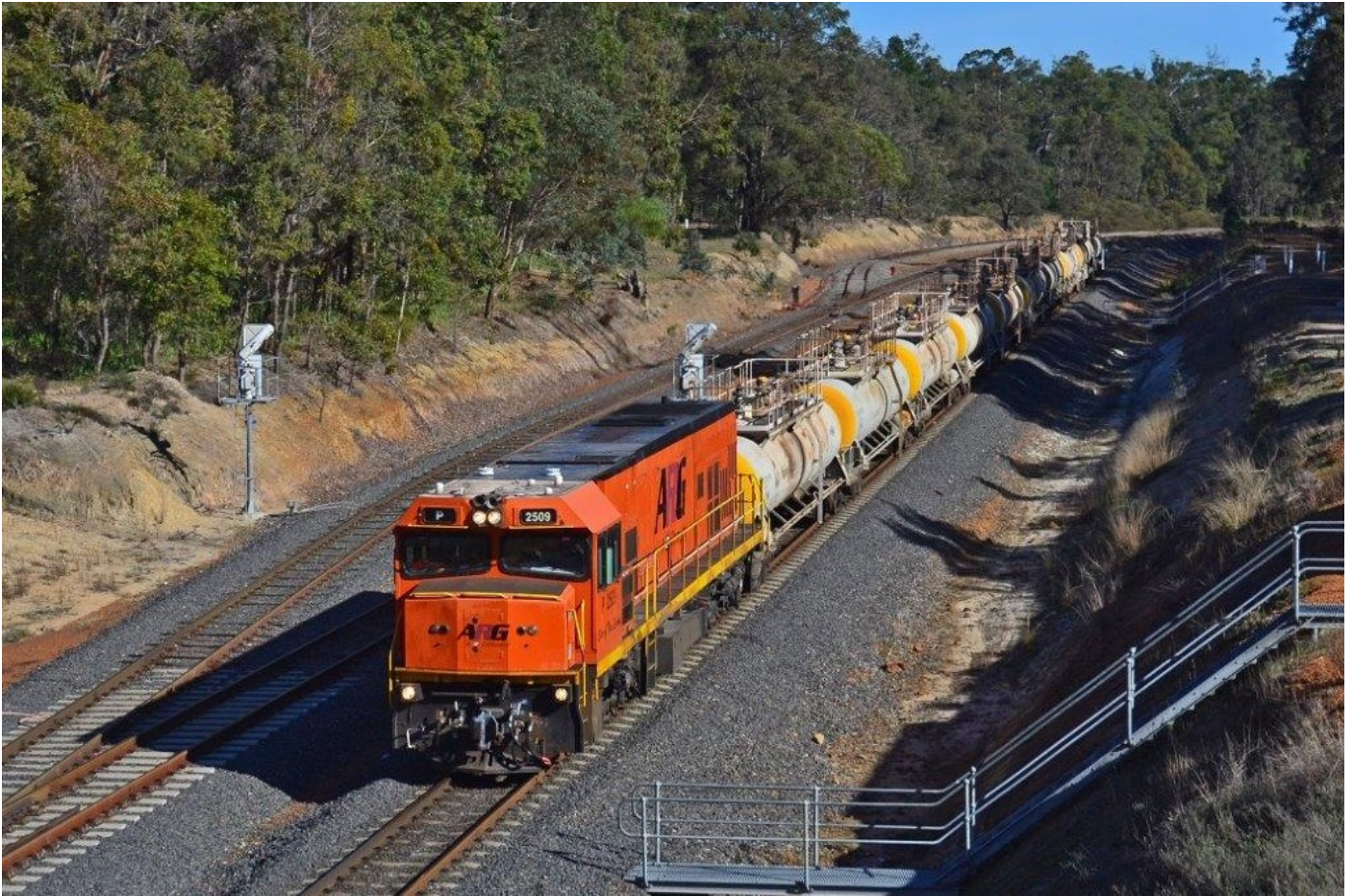
3853 caustic soda passes through Worsley Junction behind P2509, 5 th June.