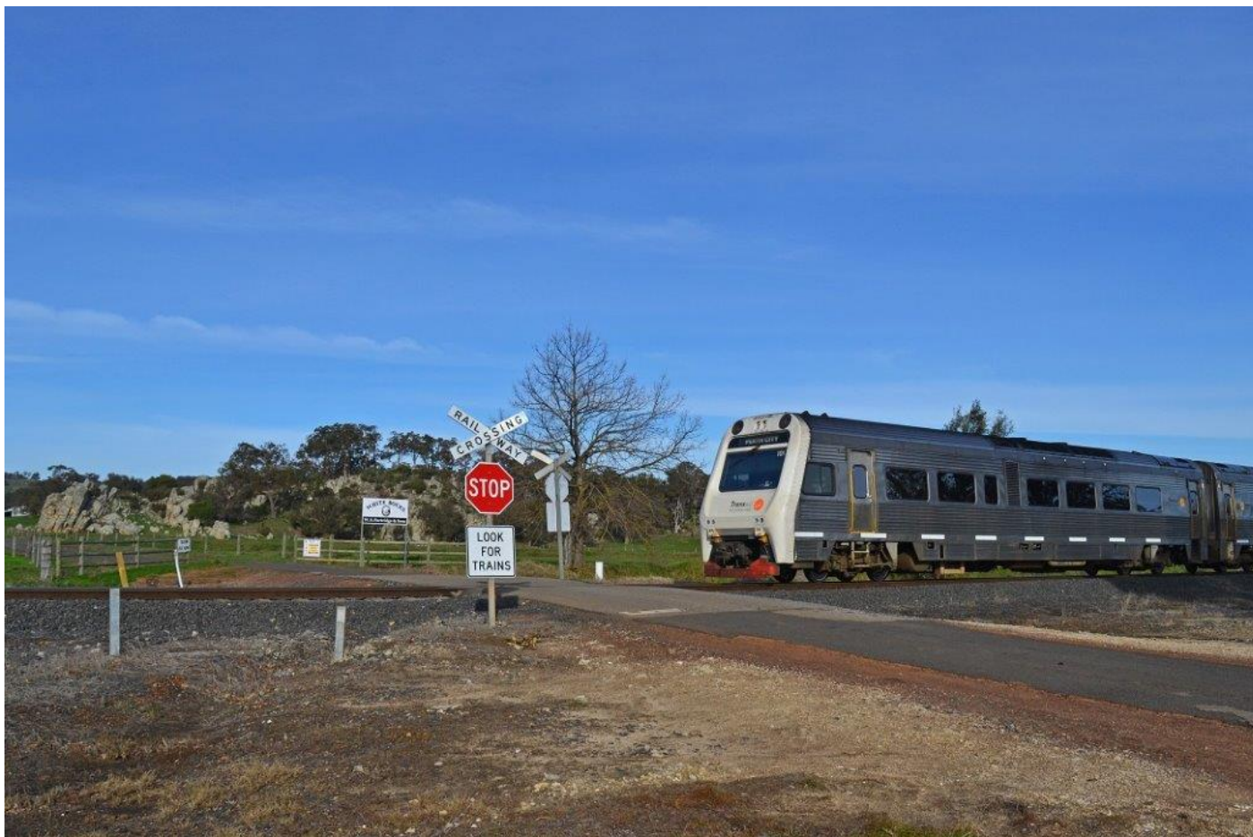
The Up Australind passes White Rocks Farm just north of Brunswick Junction, 5 th June.