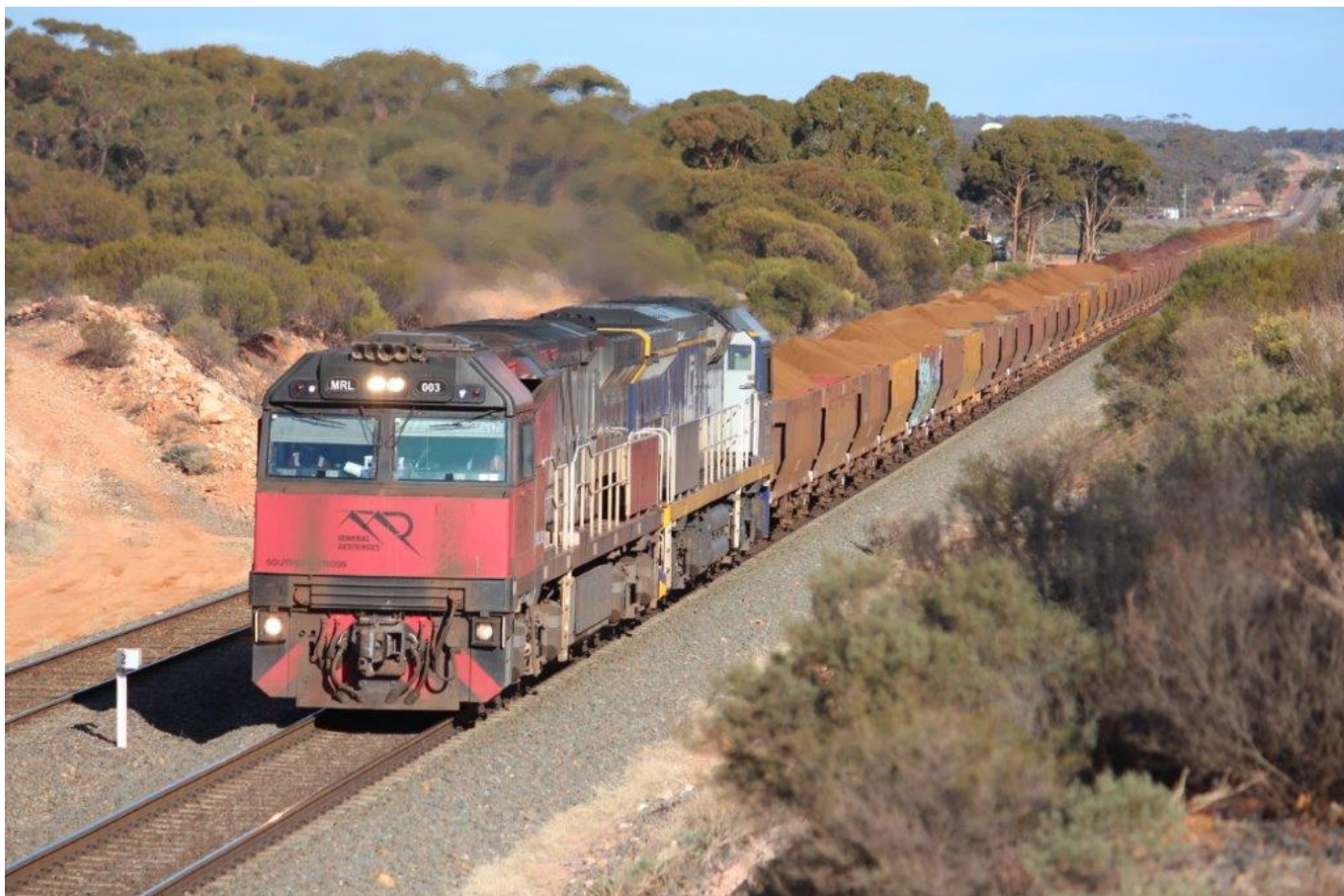
1MR1 approaches West Kalgoorlie behind MRL003 & CF4408, 14 th June.