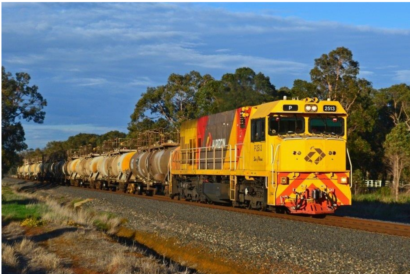
P2513 leads 6922 caustic near Benger, 5 th June.