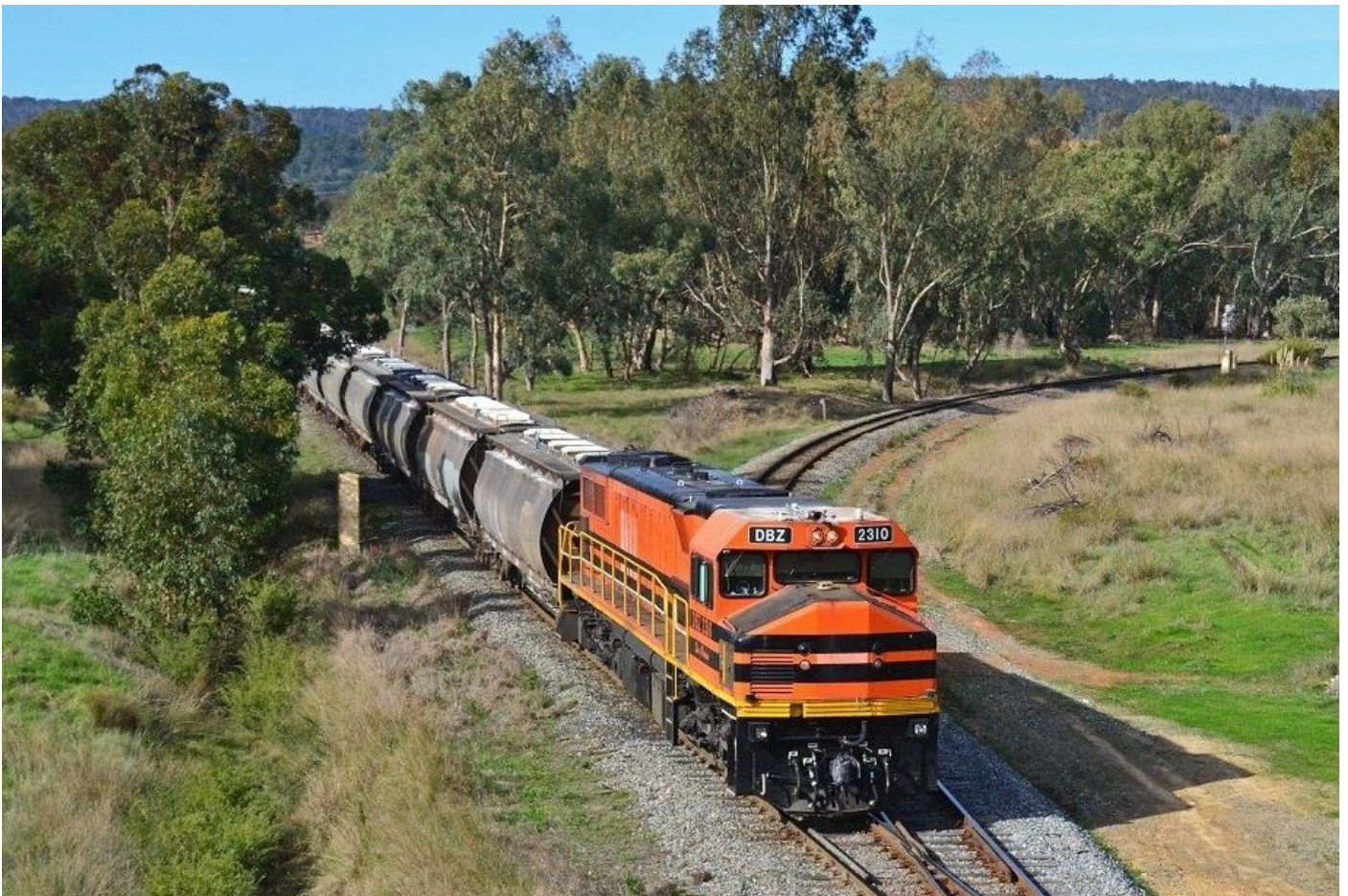
DBZ2310 departs Yalup Brook on 6865 loaded alumina, 5 th June.