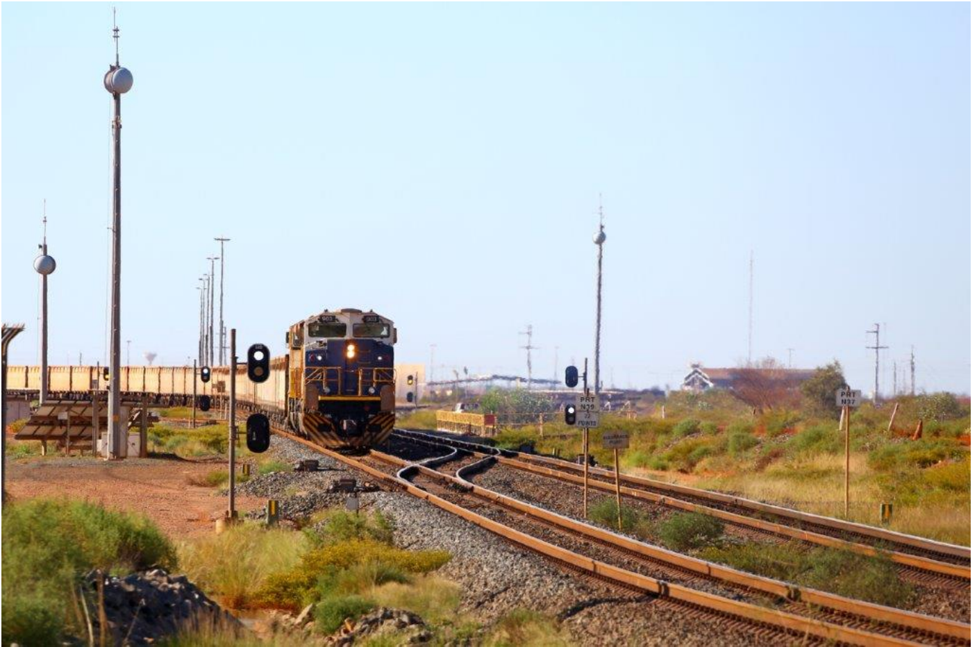
Repowered 903 leads empties away from the port; centre is FMG conveyor, right is BHP Boodarie service shed, 16/6.