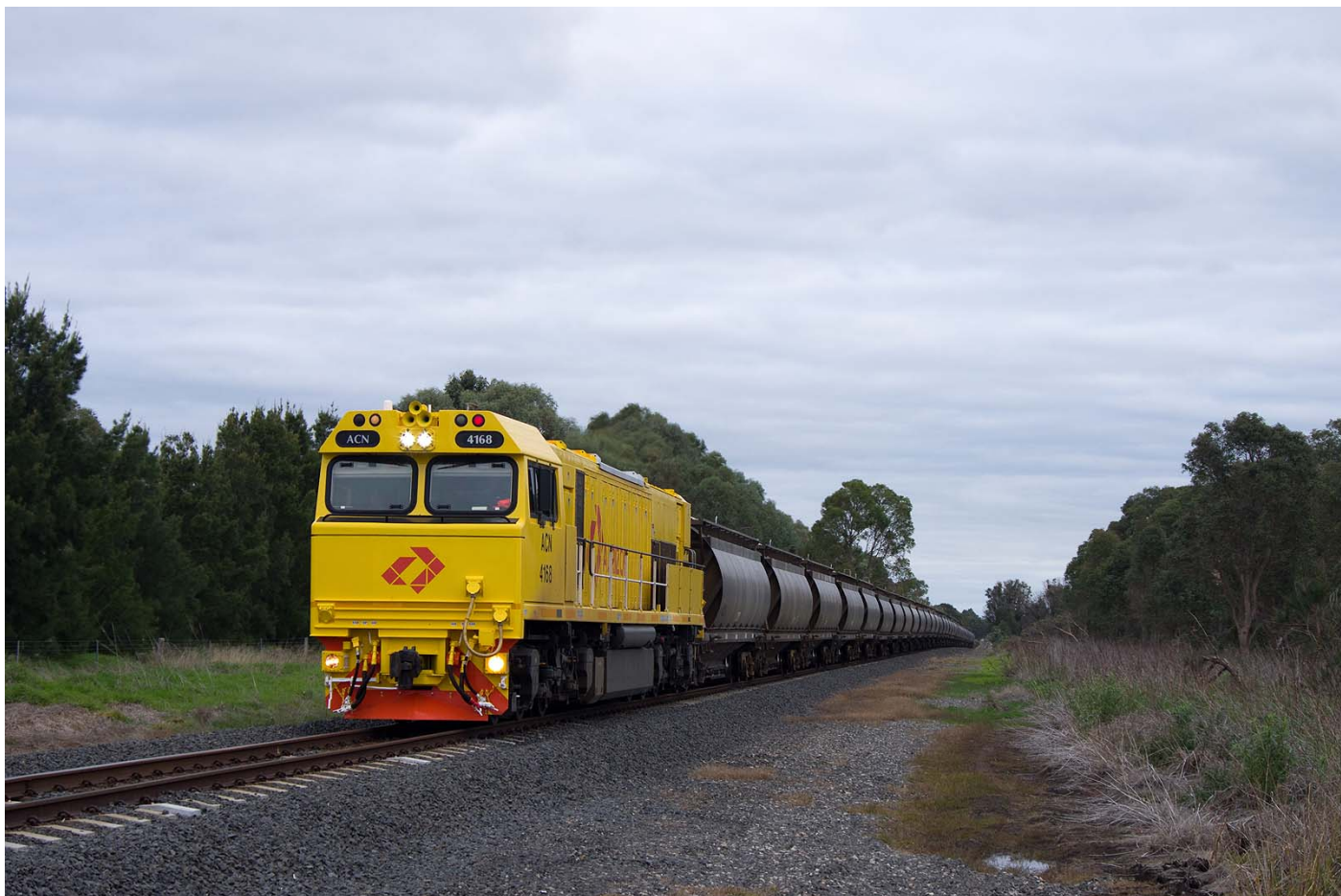
2876 passes through Wokalup behind freshly overhauled ACN4168, 1 st June.