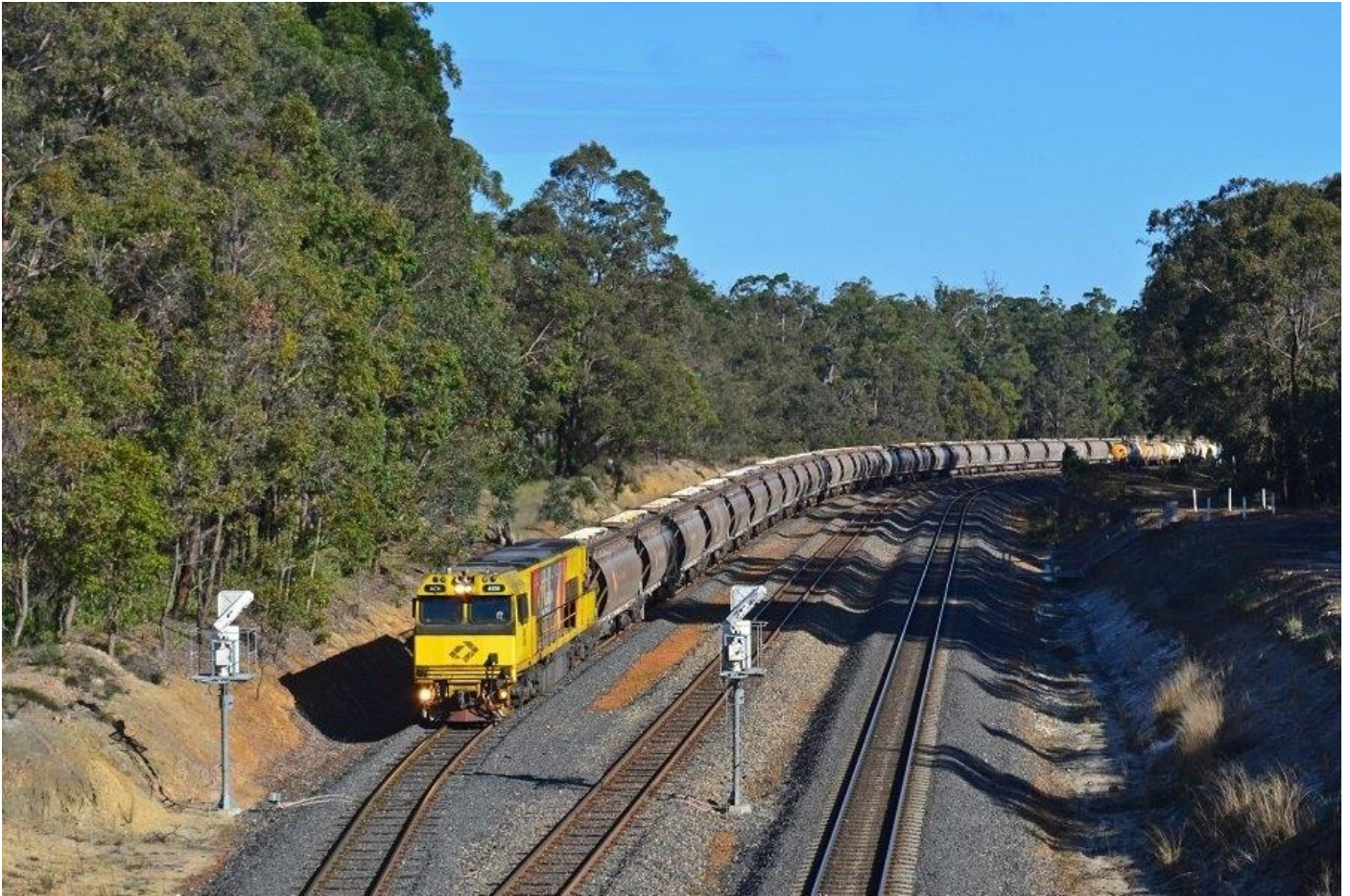
6831 empty alumina at Worsley Junction behind ACN4150, 5 th June.