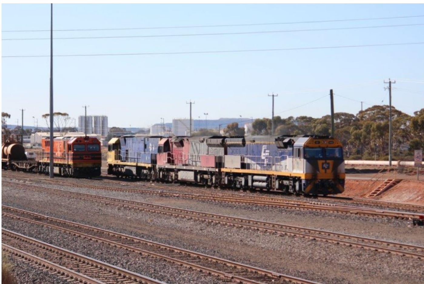
CF4408 & MRL003 collect NR81 at West Kal as Q4005 waits on 1405 empty acid, 14/6.