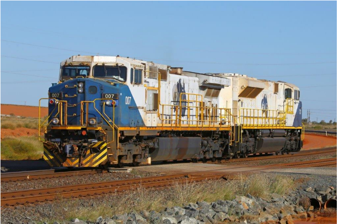
GE C44-9W 007 features modified handrails, cab roof repair and a rail sensor unit behind the bogie, 26 th June.