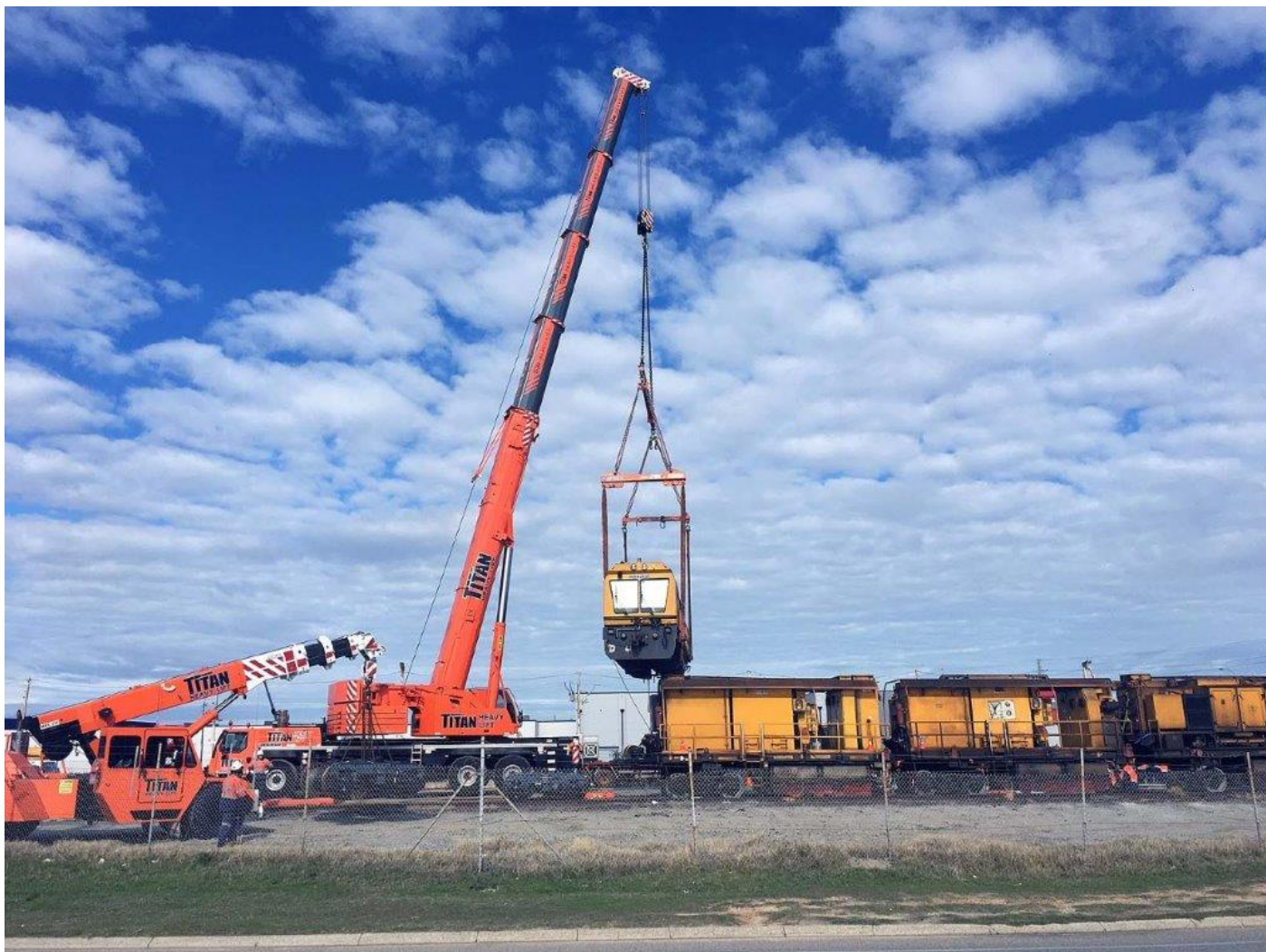
The Speno rail grinder undergoes gauge change at Bellevue, 4 th June.