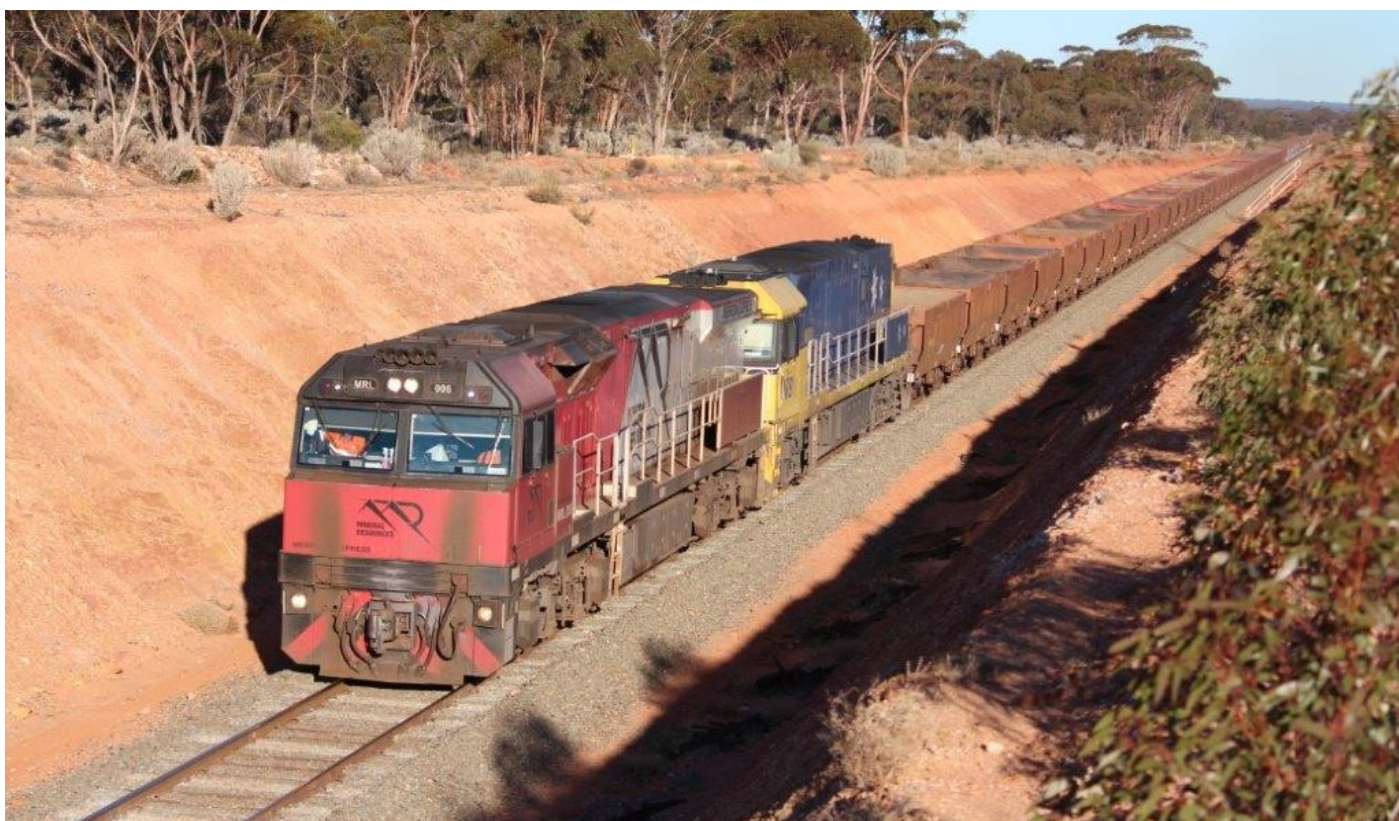
MRL006 & NR81 with a short 5042 empty ore approaching Binduli, 4 th June.