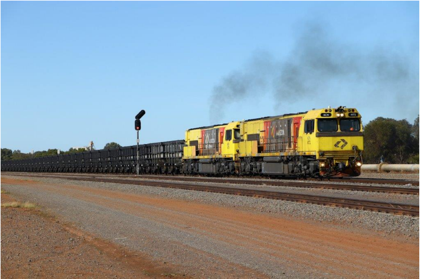
ACNs 4172 & 4170 depart Narngulu on 1761 loaded Karara ore, 1 st June.