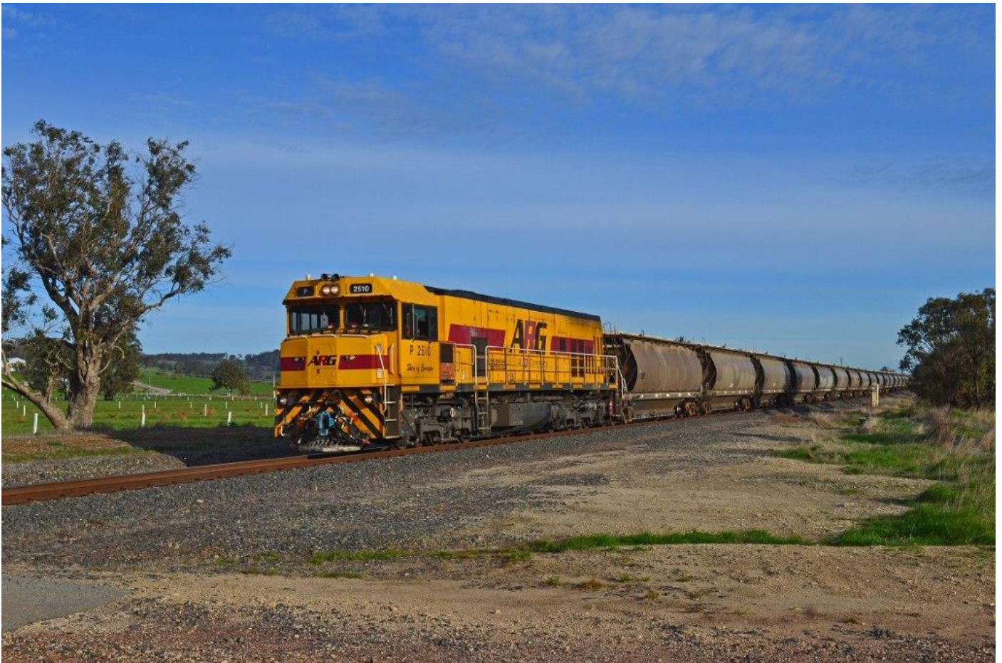
P2510 just north of Bengier with 6876 empty alumina to Calcine, 5 th June.