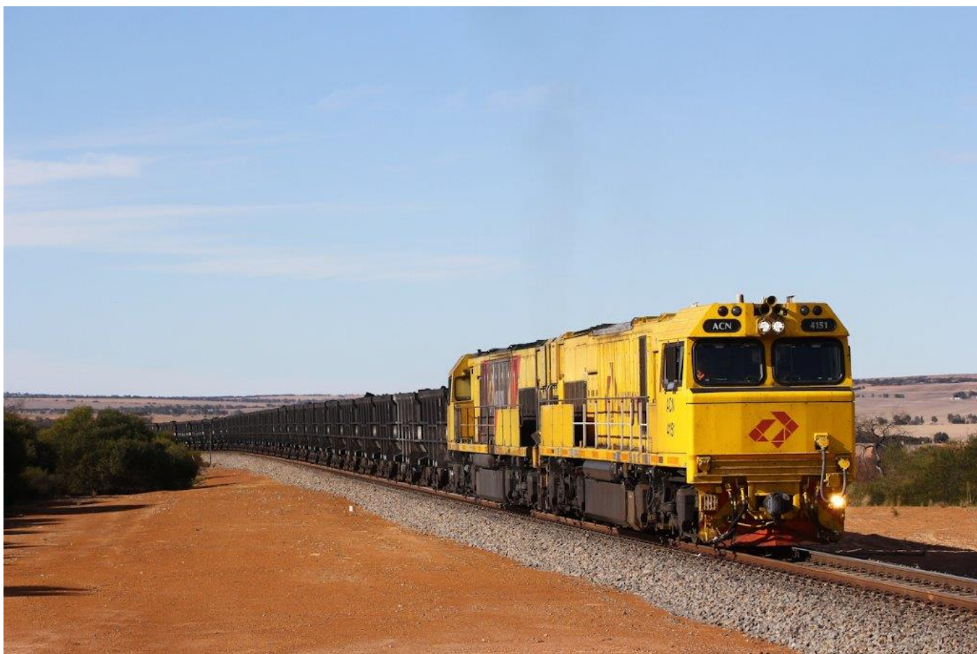
ACNs 4151 & 4169 haul 1763 loaded Karara ore upgrade at Wicherina, 1 st June.