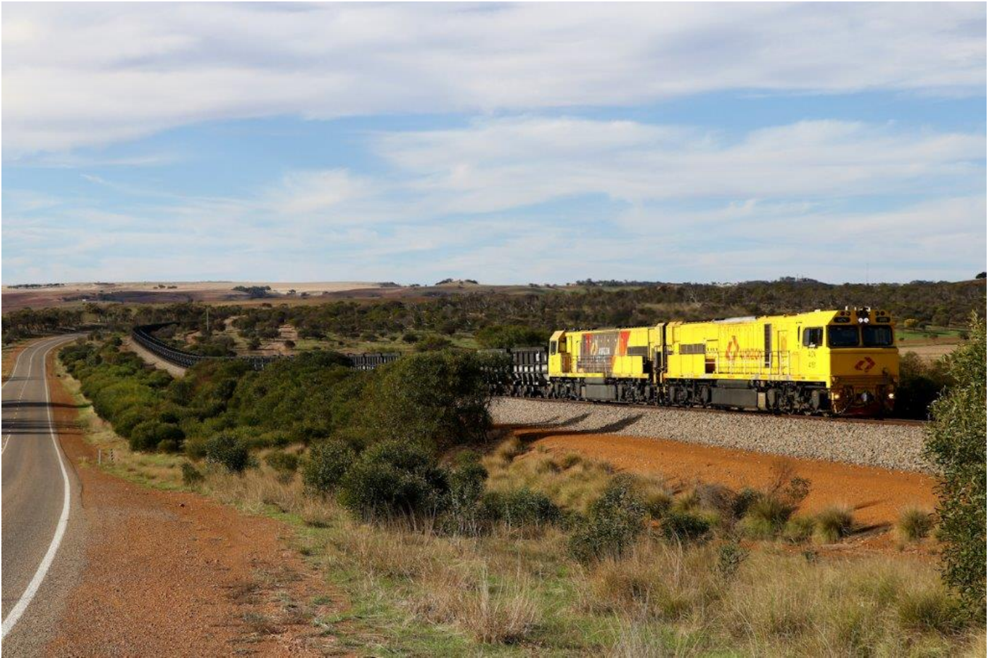
1763 loaded Karara ore climbs near Moonyoonooka, powered by ACNs 4151 & 4169, 1 st June.