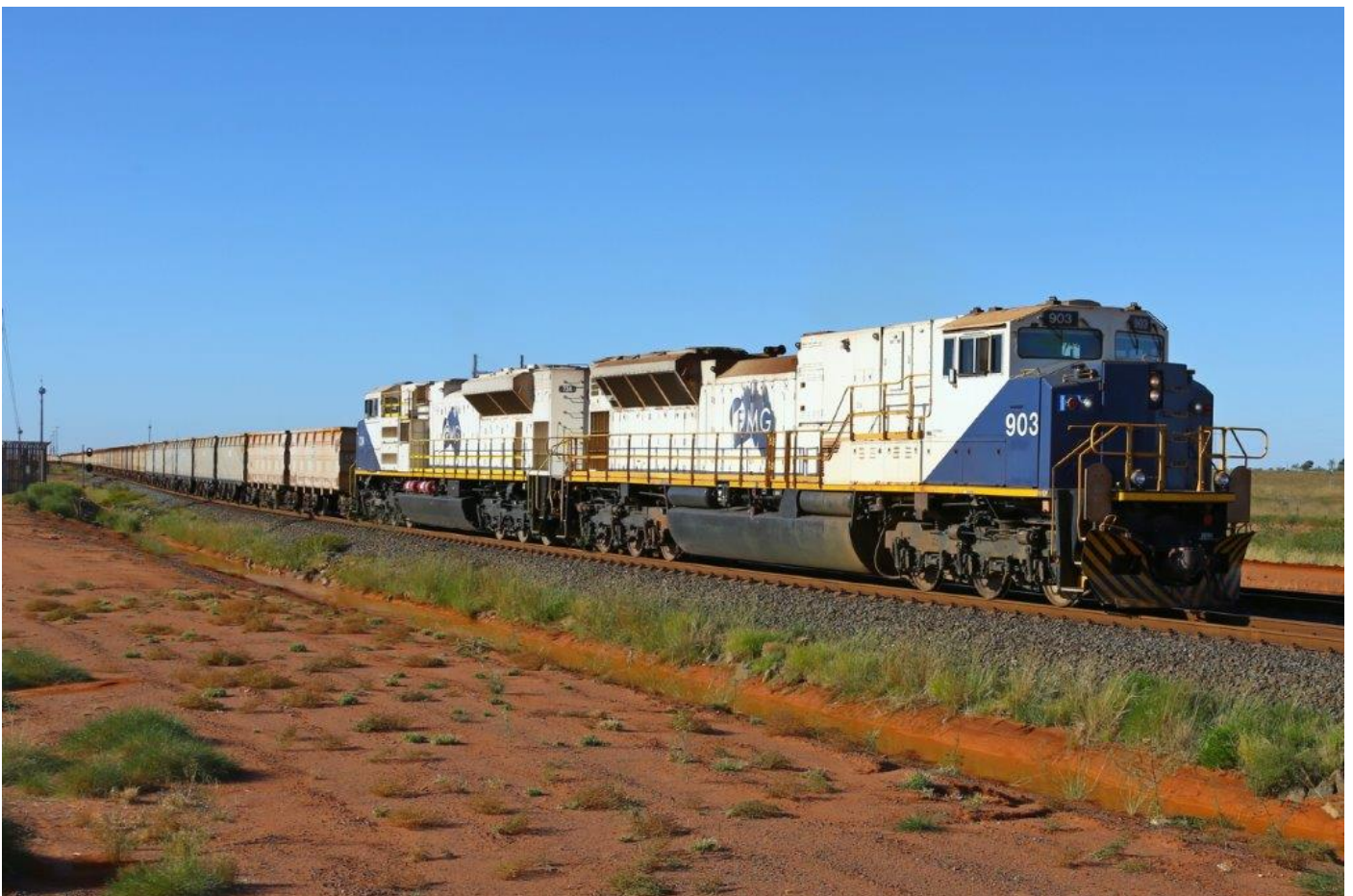
903 leads new 724 and empties away from the port, 16 th June.