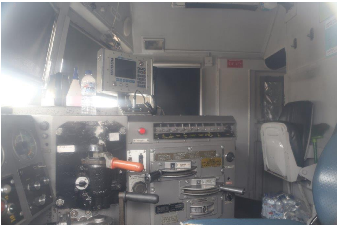
Inside the #2 end cab of G511 at Grass Valley, through the driver's side window, 1 st June.