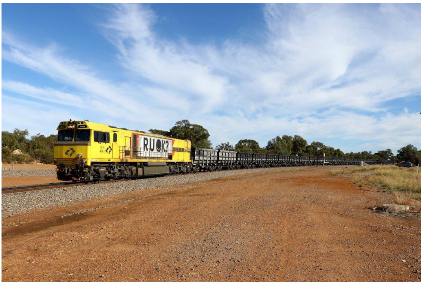
ACN4143 on 1762 empty Karara transfer to Narngulu East passing Narngulu, 1 st June.