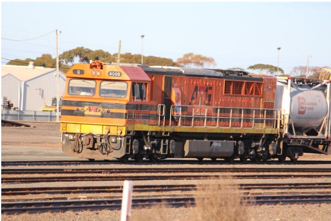
Recently reactivated Q4005 with 1C71 Parkeston shuttle, West Kalgoorlie, 14 th June.