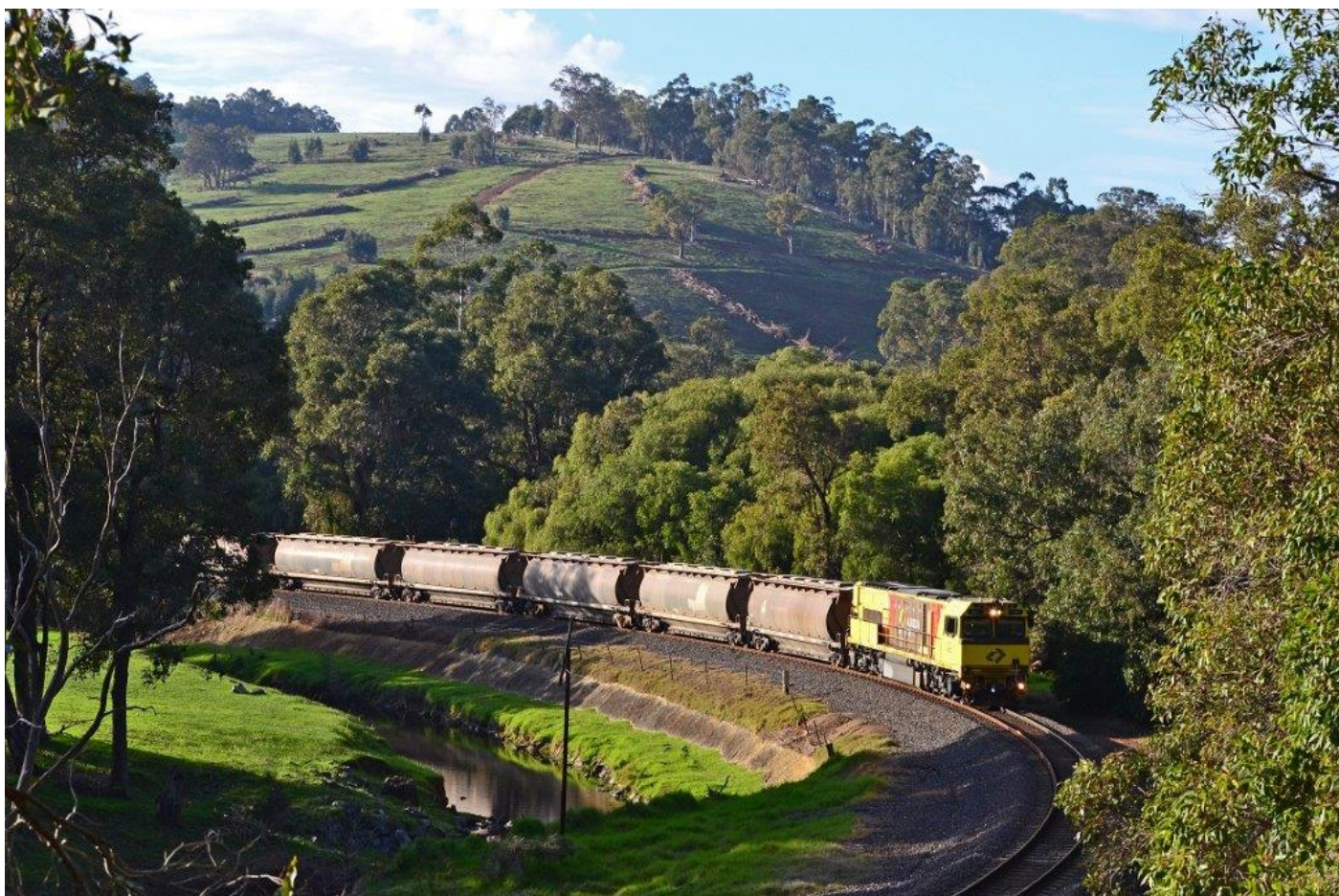
6842 alumina from Hamilton to Bunbury, led by ACN4152 between Beela and Brunswick Jn, 5 th June.