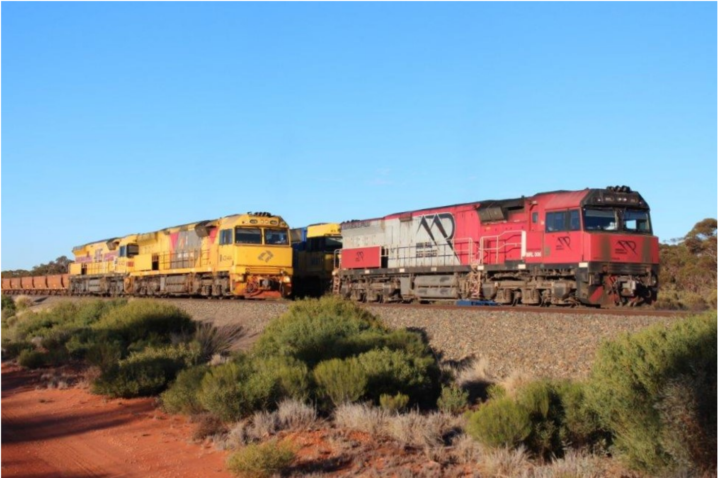
Following workshops attention in Perth, ACB4404 & AC4303 stand beside NRL006 & NR81 at Binduli, 4 th June, then are added into the consist for transfer to Esperance via Koolyanobbing.