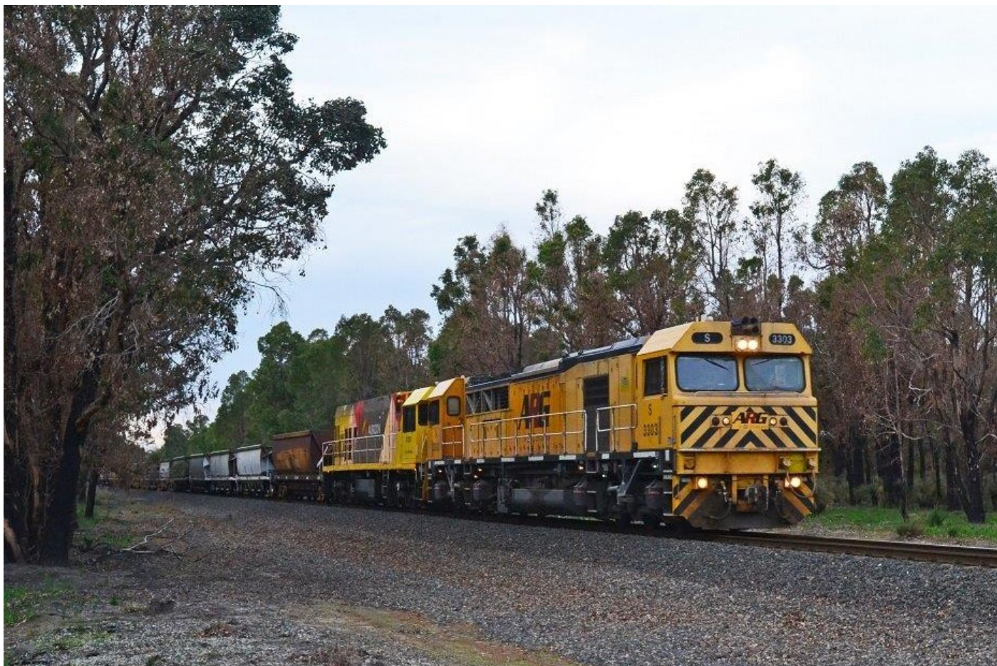
S3303 (added at Kwinana) & P2517 on 6253, Soundcem to Collie, near Yalup Brook, 5 th May.