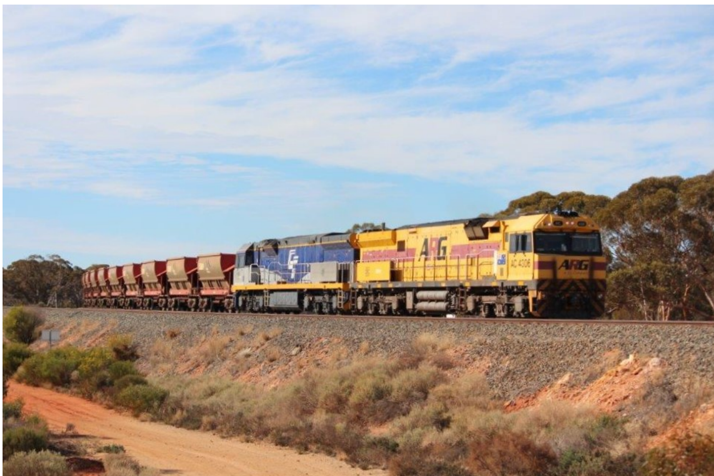
Aurizon's 1040 empty ore rounds Binduli triangle behind AC4306 & CF4408, 7 th June.