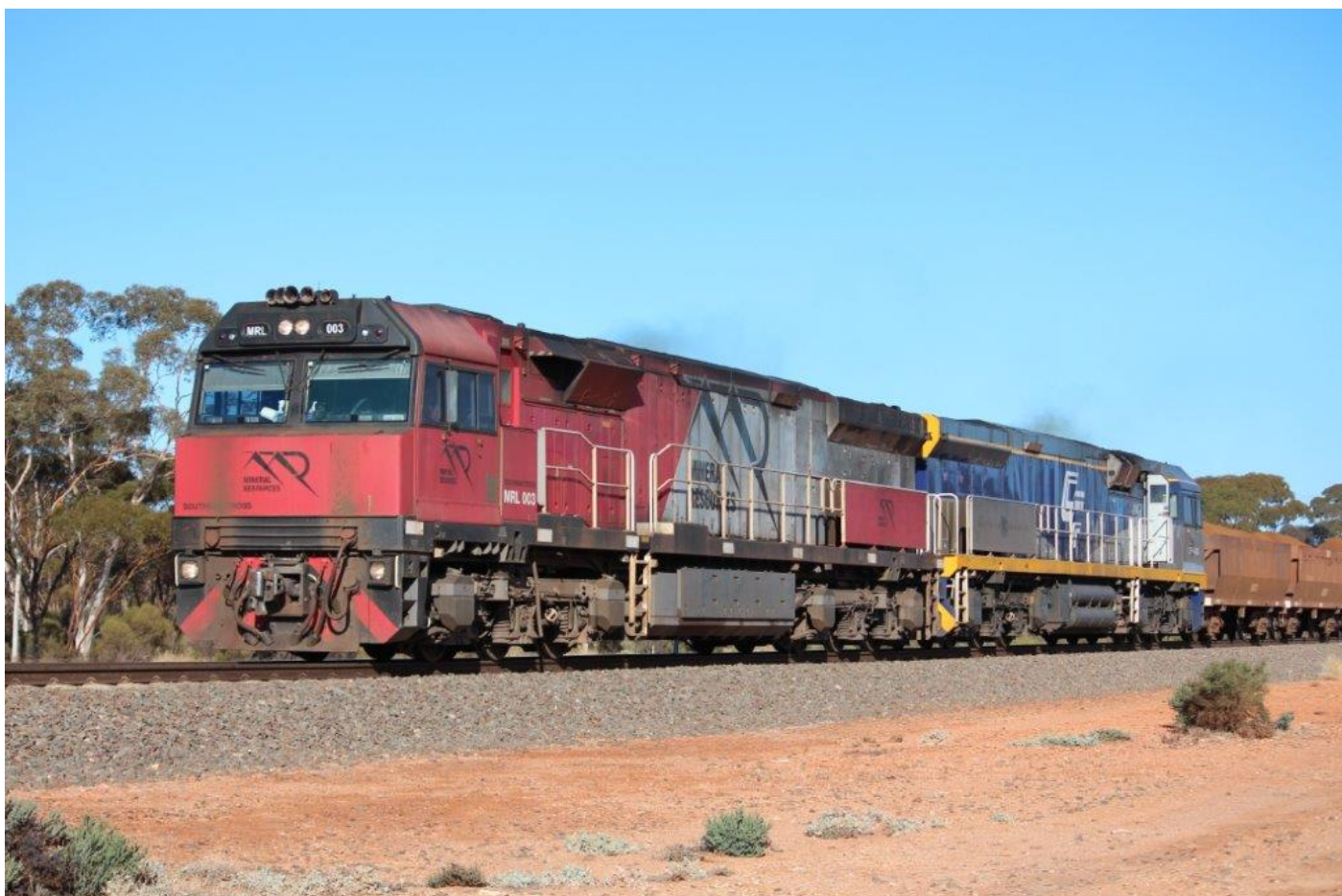
MRL003 & CF4408 pass through Binduli on 1MR1, 14 th June.