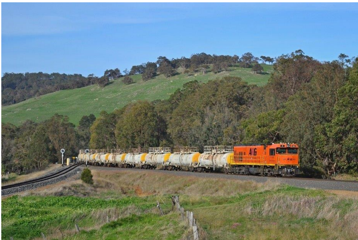
P2509 leads 6854 Hamilton-Bunbury empty caustic through Brunswick Junction, 5 th June. Page 16 of 26