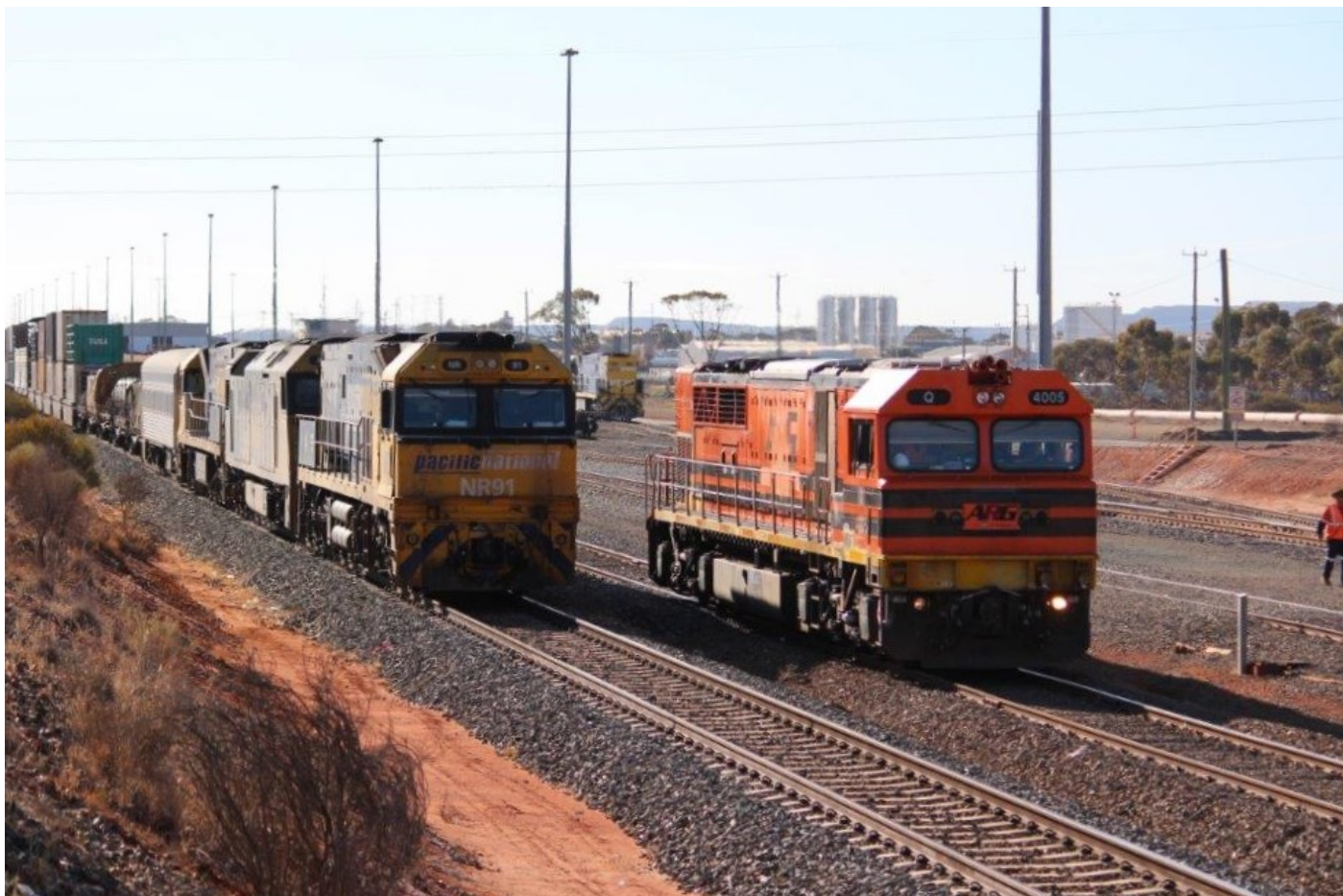
1C72 light engine Q4005 passes NR91, AN1 & NR43 on 6MP4, West Kalgoorlie, 14 th June.