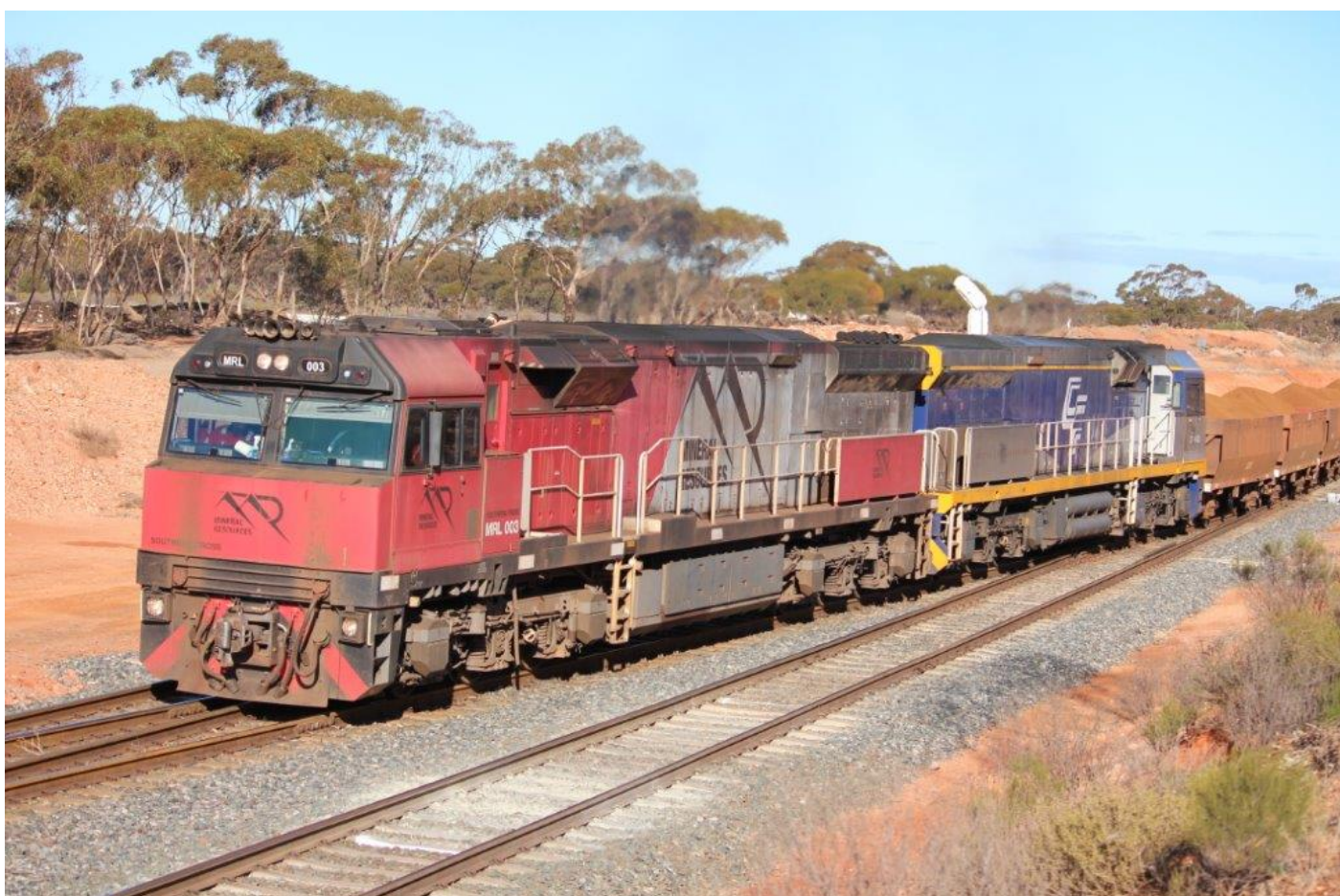
MRL003 & CF4408 cross over to enter West Kalgoorlie yard, 14 th June.