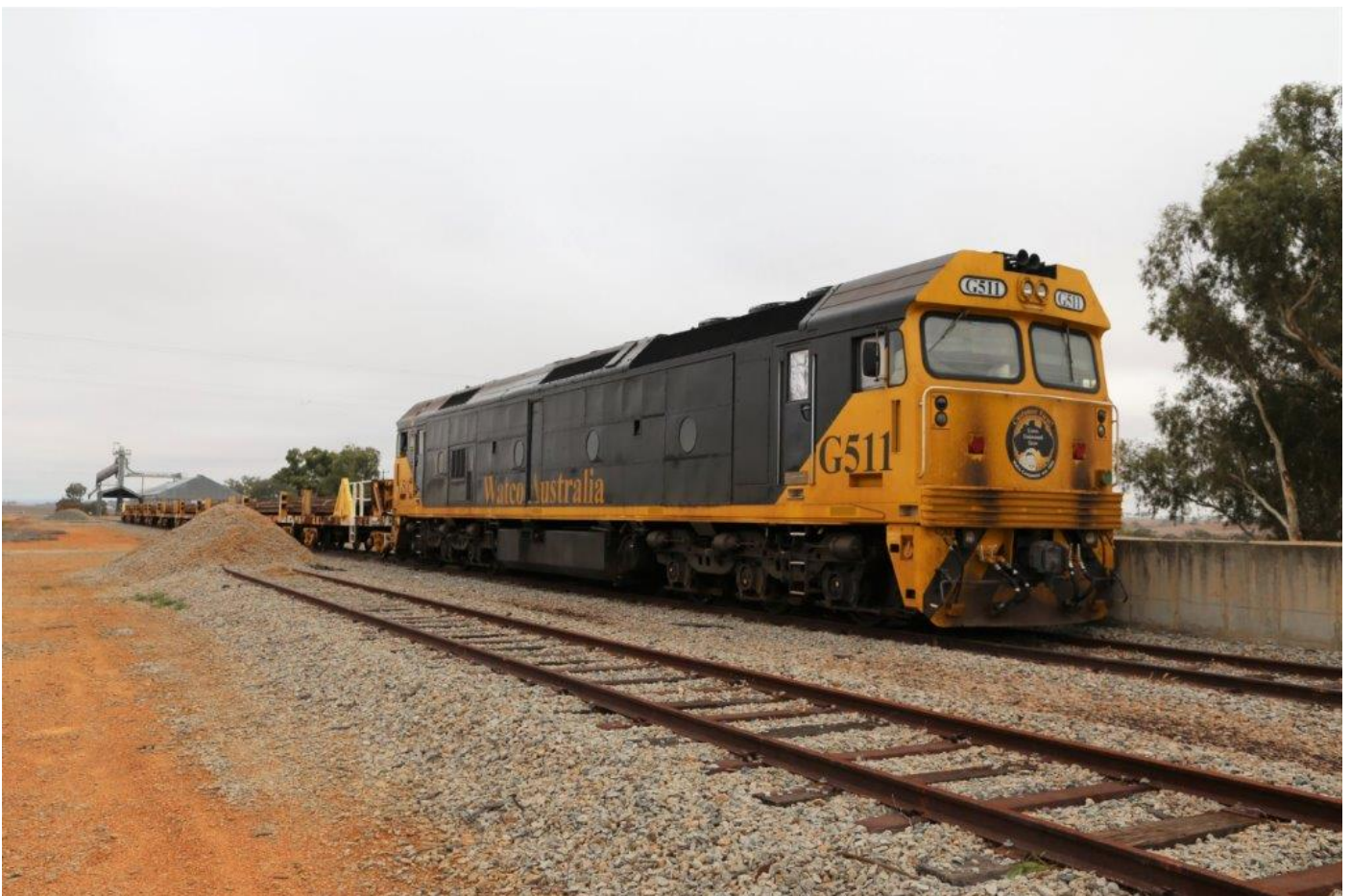
G511 stabled on a rail train at Grass Valley, 1 st June.