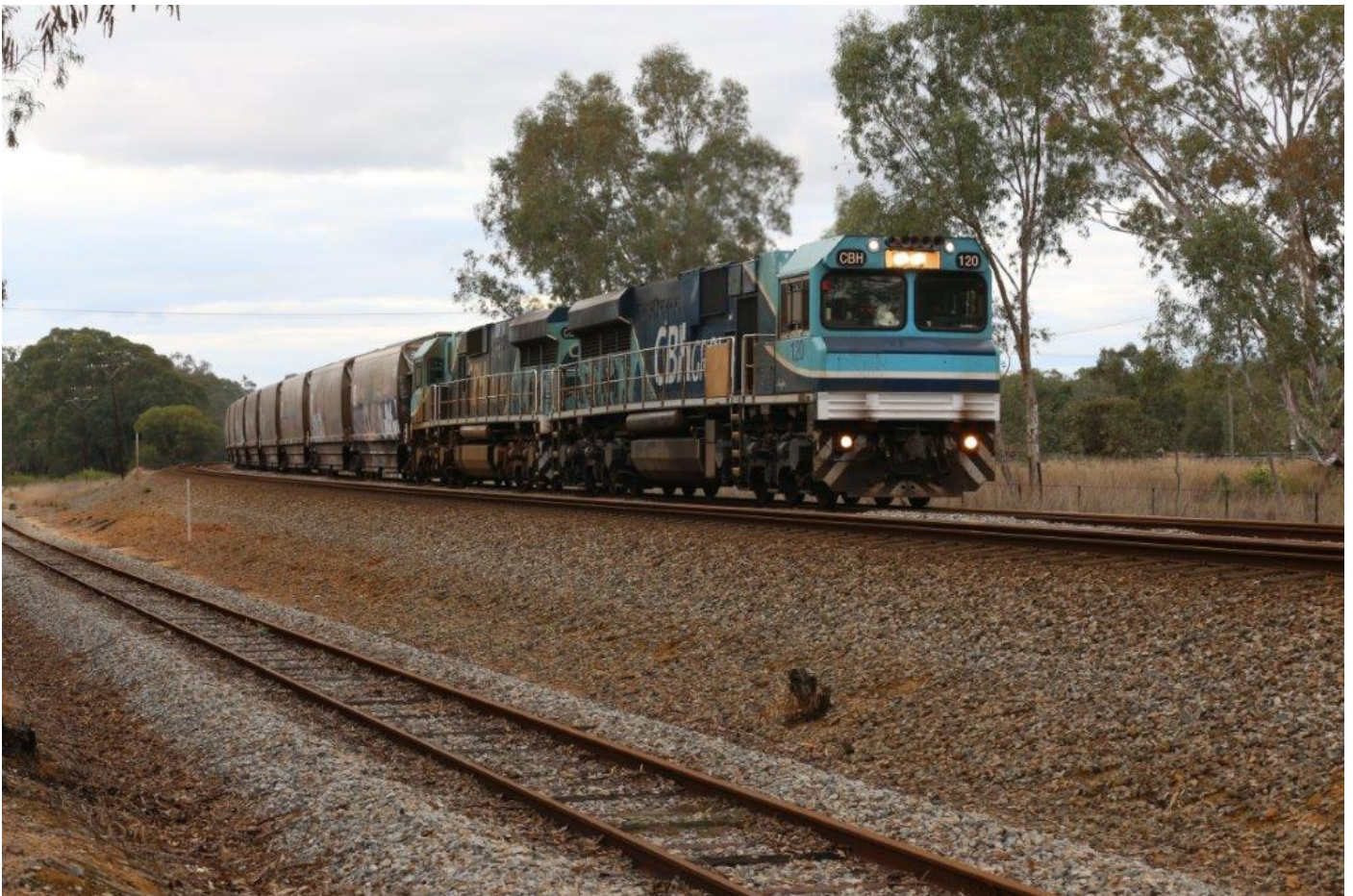
CBHs 120 & 118 run through Millendon Junction with 2S56, 1 st July.