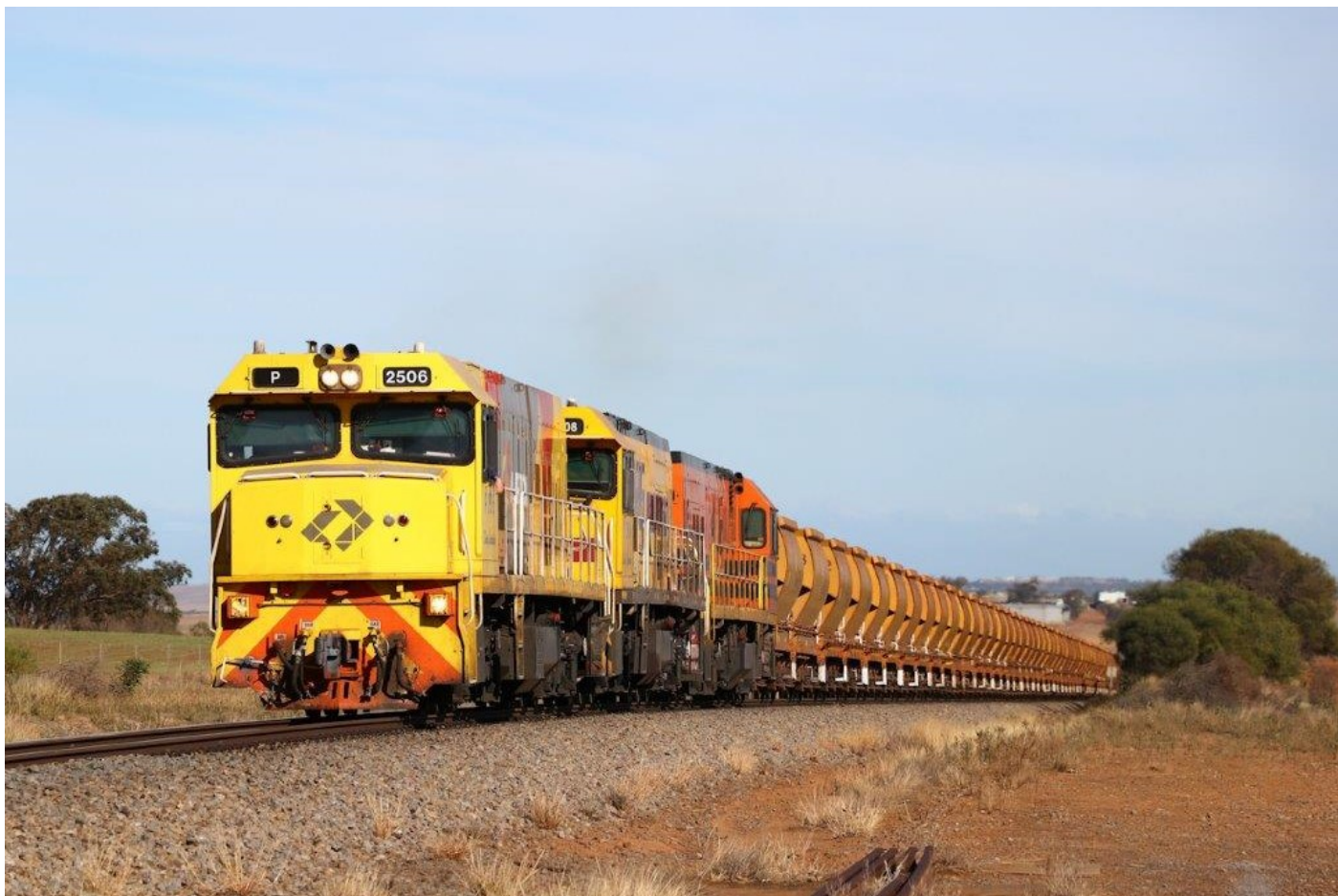
Ps 2506, 2508 & 2503 pass through Moonyoonooka with 1720 Mt Gibson empty ore, 1 st June.