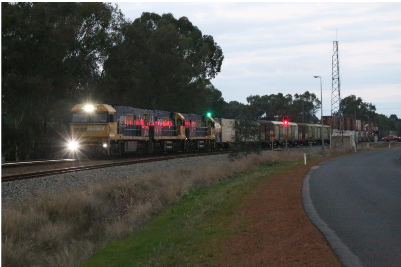
With in-line fuelling, NRs 92, 91 & 90 lead 2PM5 through Millendon Junction, 1 st June.