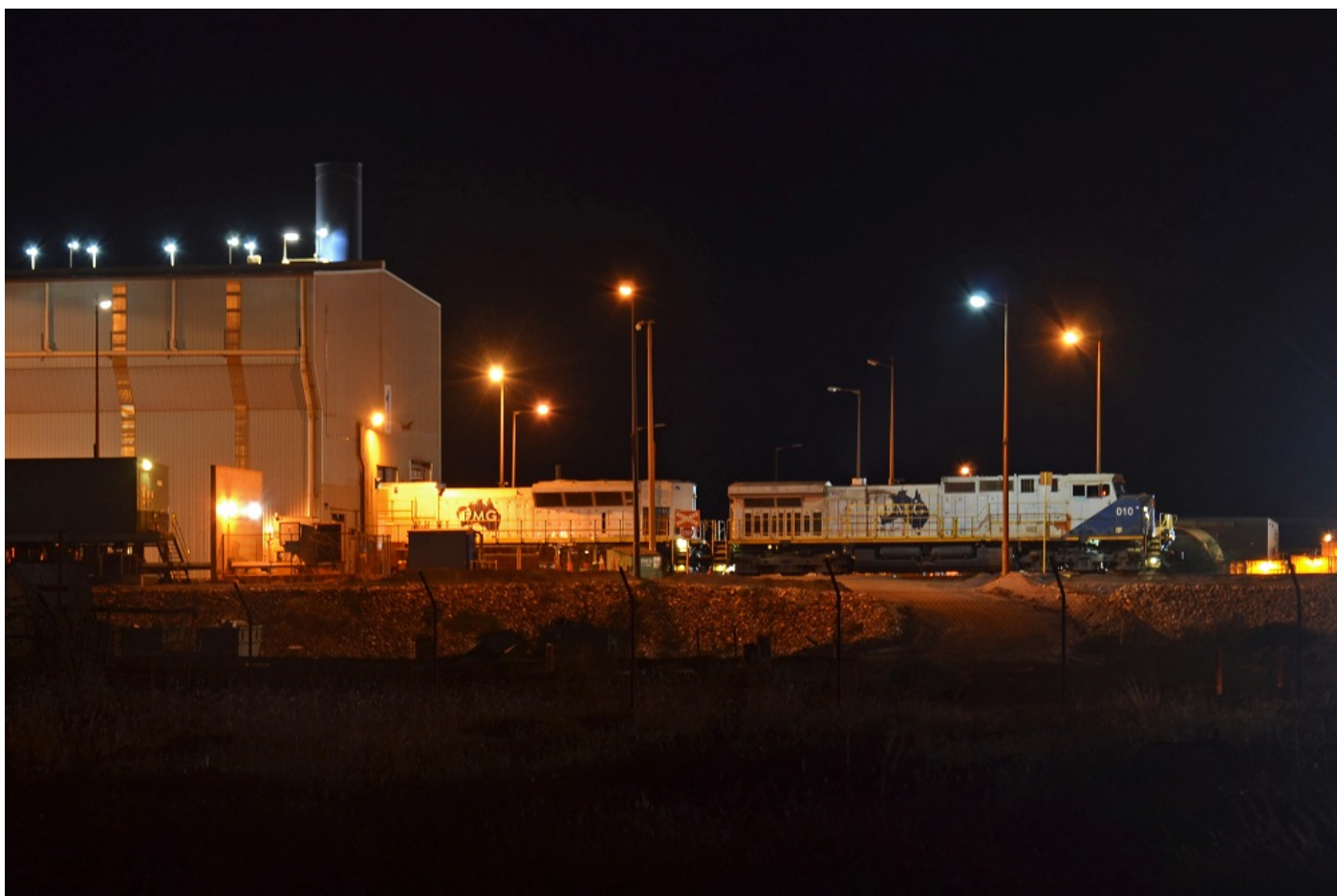
010 and an SD70 spot FMG's car dumper 1, 2 nd June.