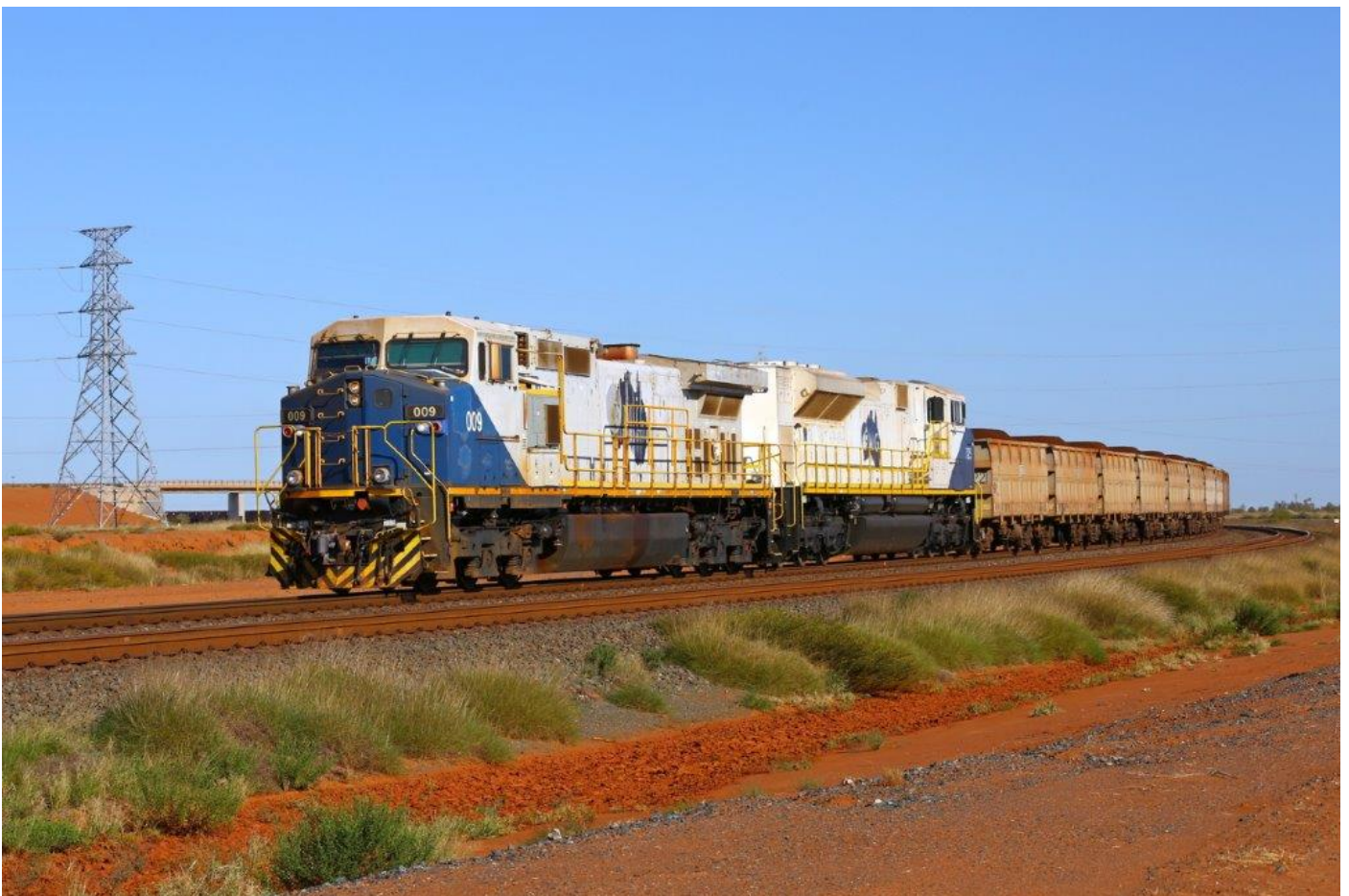
A loaded train led through the 5km curve by 009 (handrail mods) and new 725, 16/6. Page 24 of 26