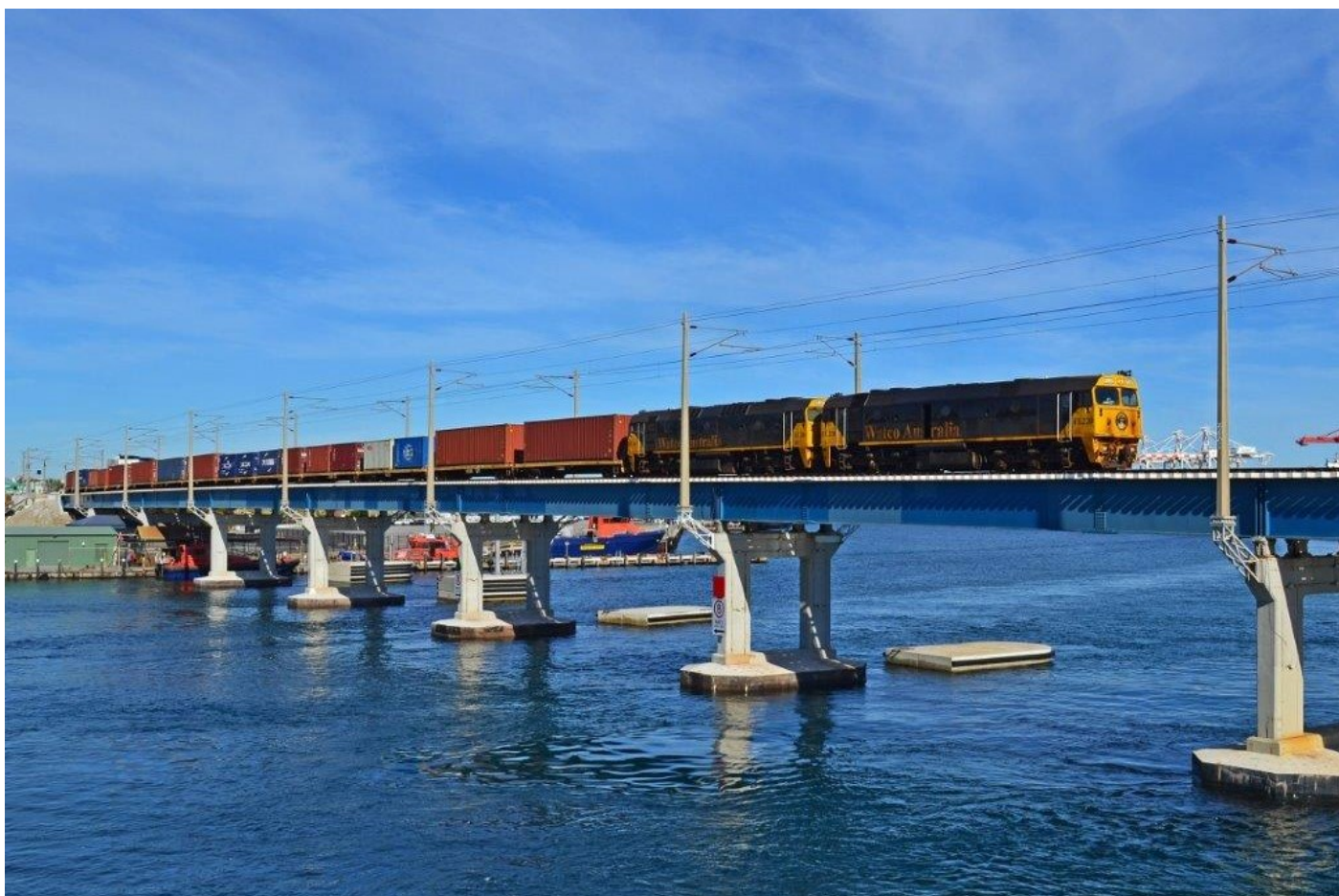
The ILS shuttle to Fremantle crosses the Swan River behind FL220 & HL203, 8 th June.