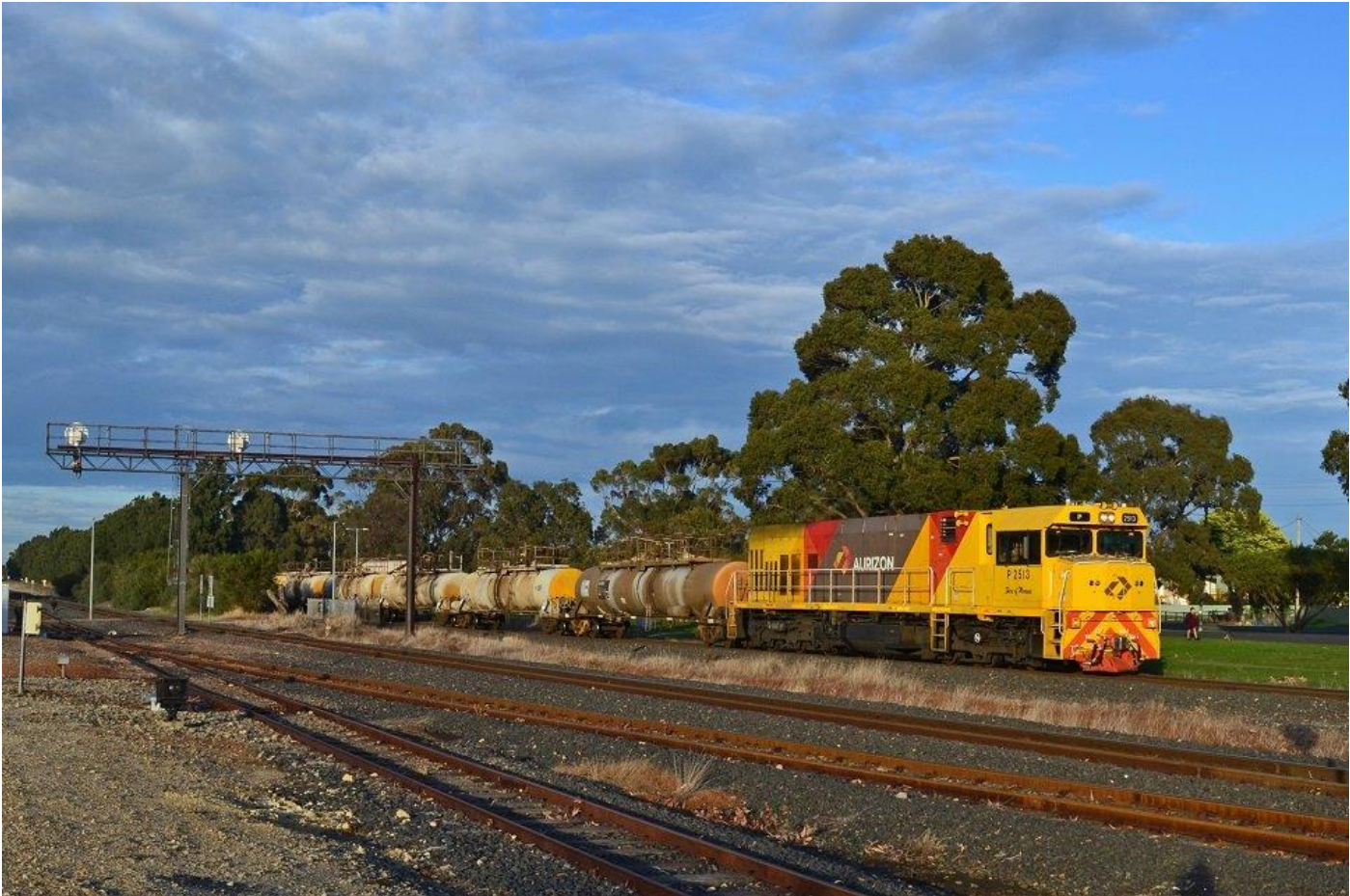
6922 Bunbury to Yalup Brook caustic is led through Brunswick Junction by P2513, 5 th June.