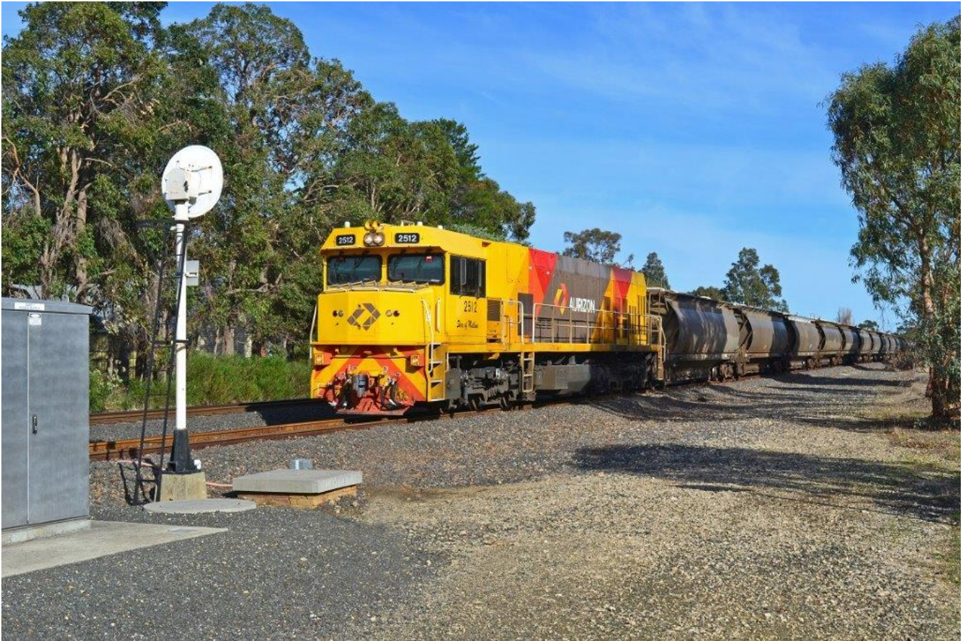
P-less 2512 departs Benger Loop with 6866 empty alumina to Yalup Brook, 5 th June.