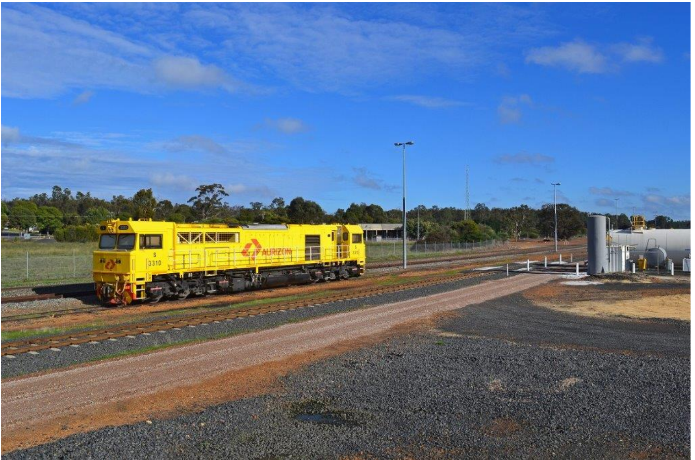
S3310 stabled at West Collie, 5 th June.