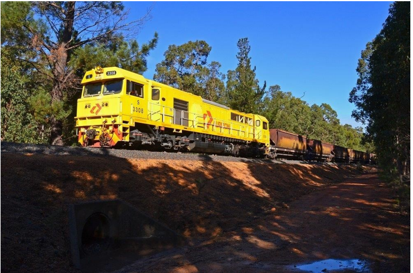
S3308 approaches Hamilton refinery with 6592 coal, 5 th June.