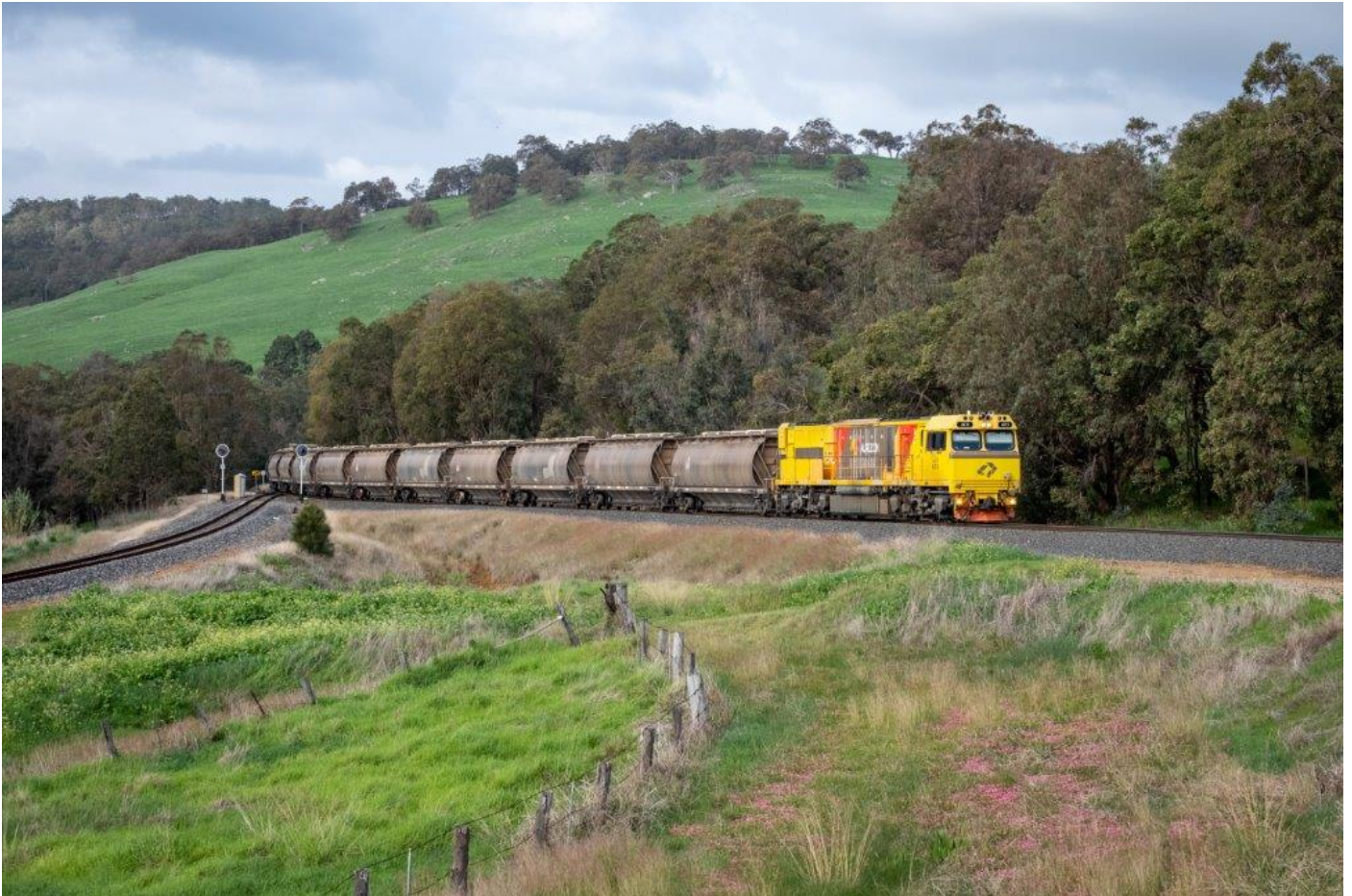
ACN4173 enters the triangle at Brunswick Junction with loaded alumina hoppers, 28 th June.