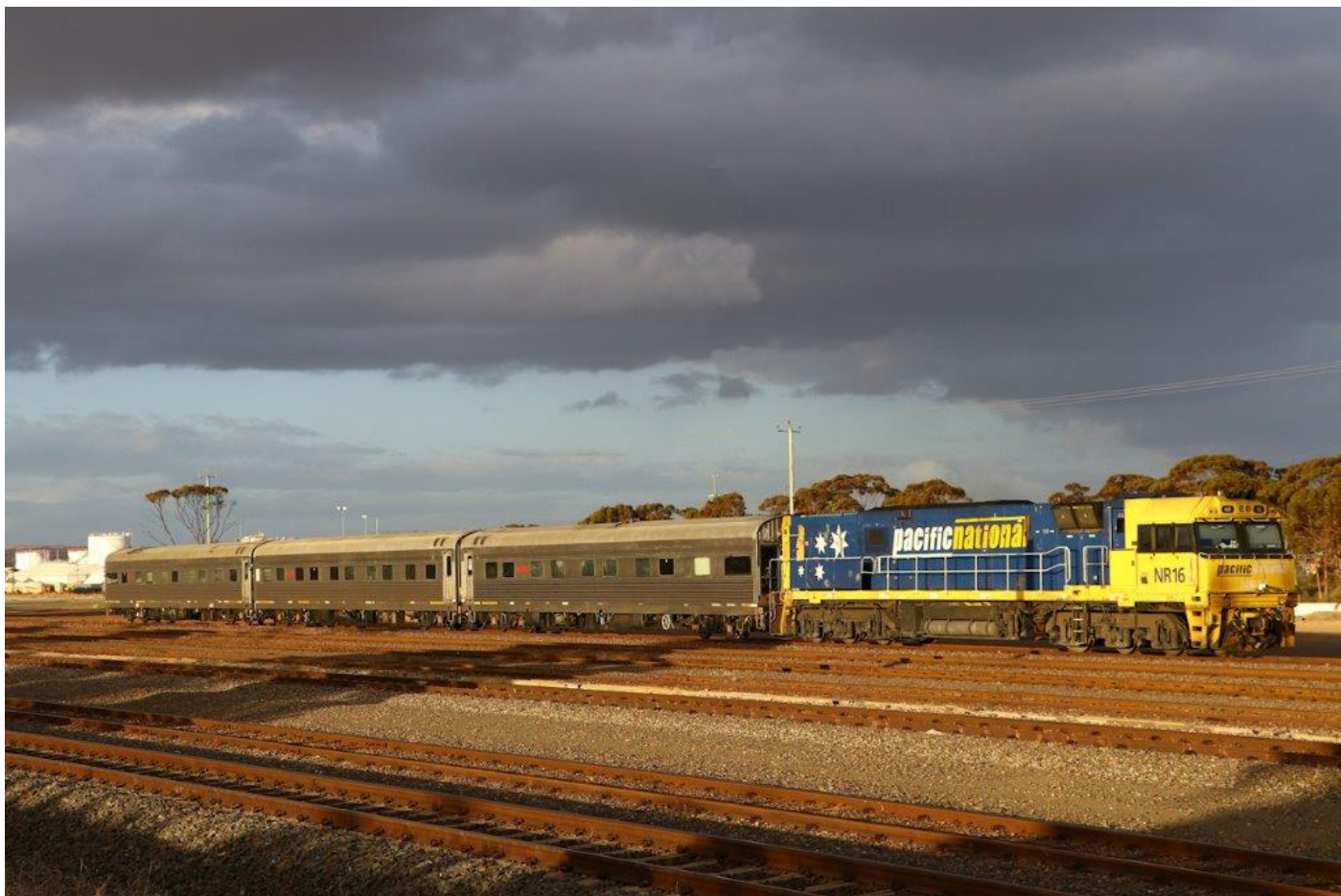
NR16 stabled on the AK cars at West Kal, 29 th June.