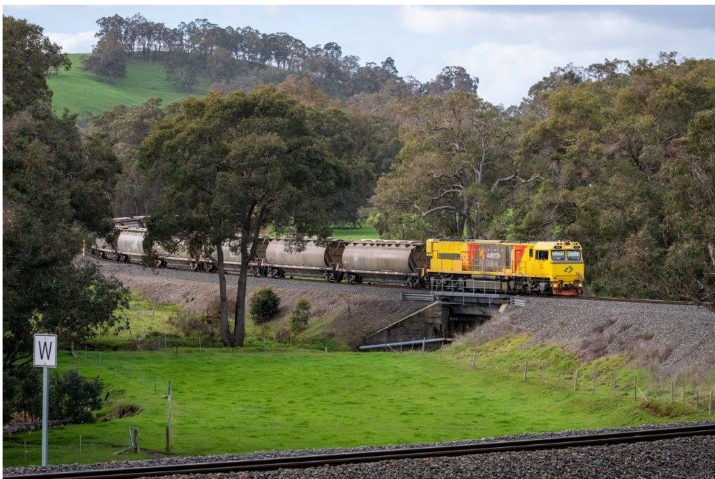
ACN4173 hauls a load of alumina between Beela and Brunswick Junction, 28 th June.