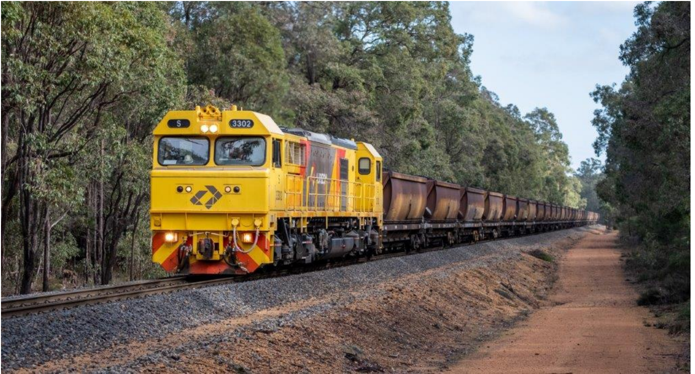
S3302 runs a bauxite train along the branch to Worsley Alumina refinery, Hamilton, 28 th June.

Page 2: ACN4173 drops down the grade at Beela with a rake of alumina hoppers on 28 th June.