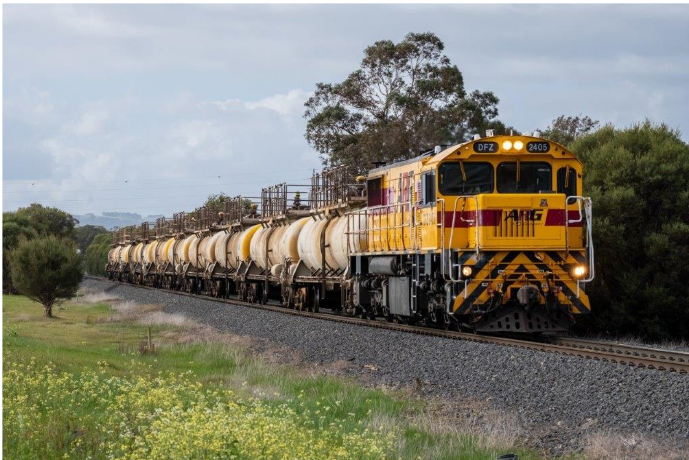
DFZ2405 leads caustic tanks through Waterloo (above) and Roelands (below), 28 th June. This loco was originally built in 1980 as QR's 2465, rebuilt as 2372 in 2001, then transferred to WA in 2007.