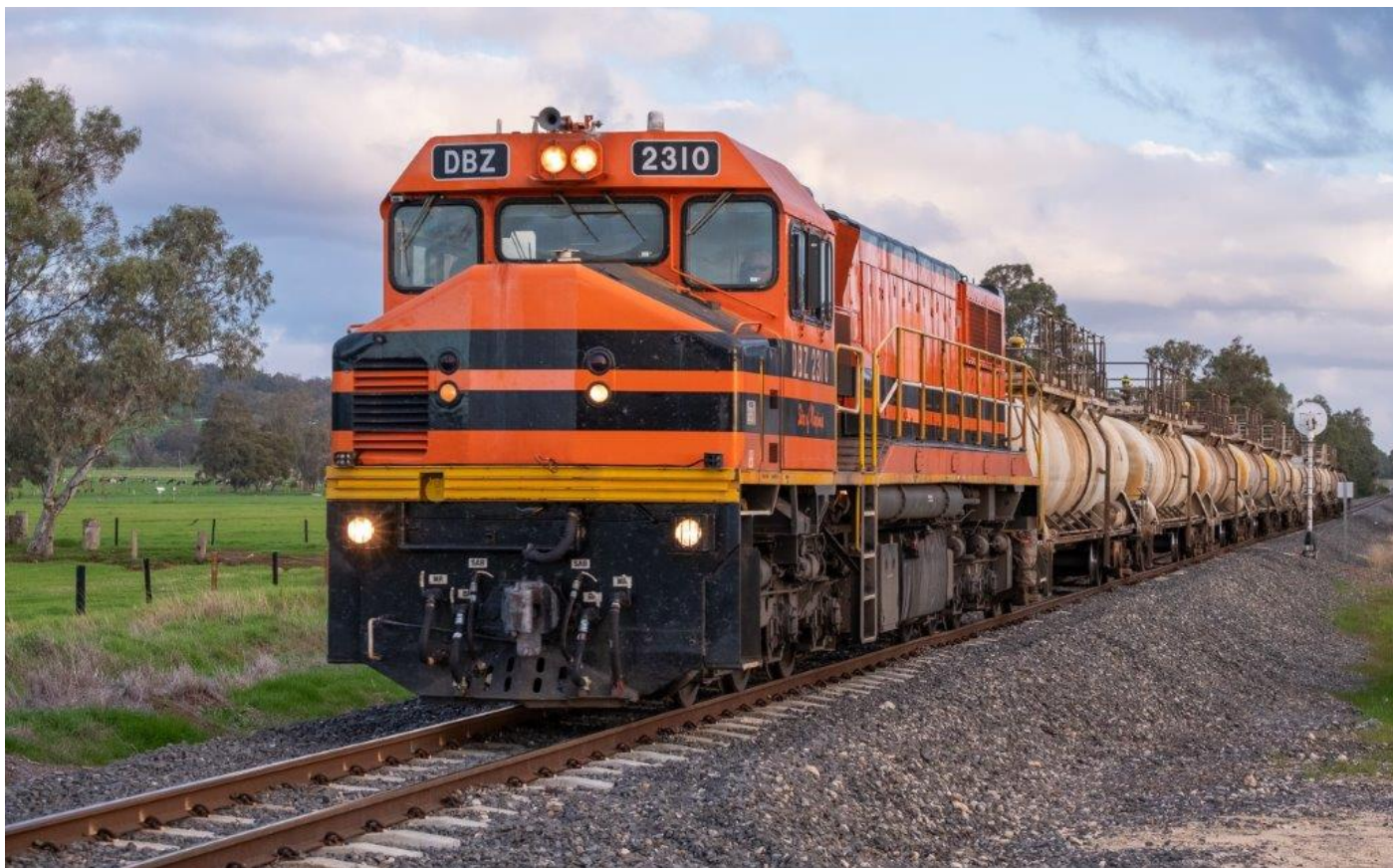
DBZ2310 passes through Harvey (above) and Cookemup (below) with a rake of caustic tanks, 28 th June.