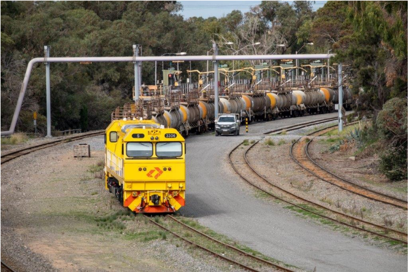
S3306 loads caustic tanks at Alcoa's Kwinana terminal, 29 th June.