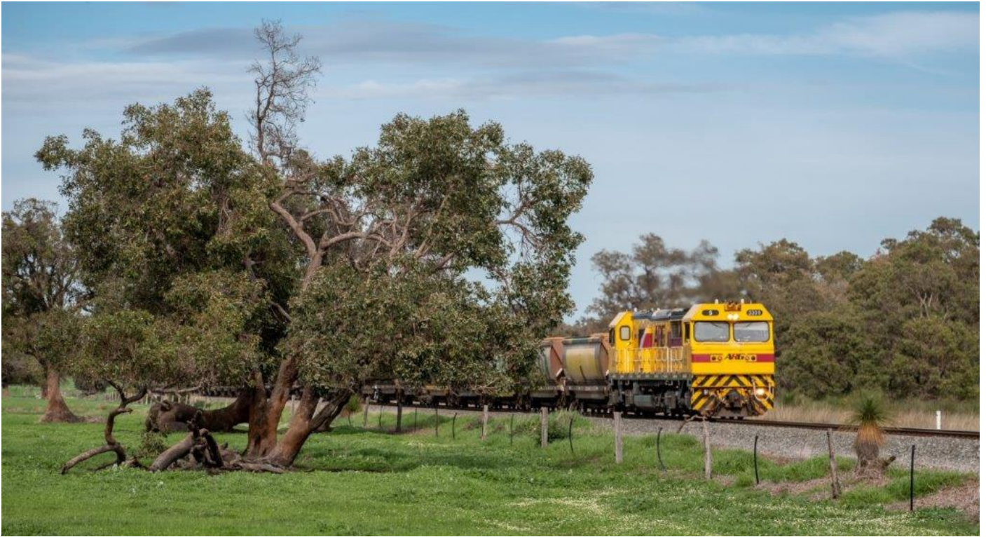
A bauxite train runs through Serpentine, 29 th June.