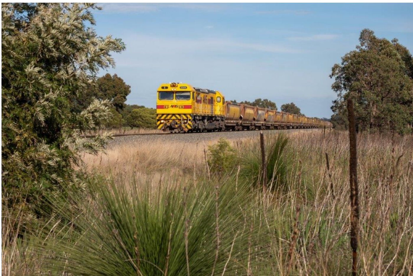
An S class works a bauxite rake through North Dandalup, 29 th June.