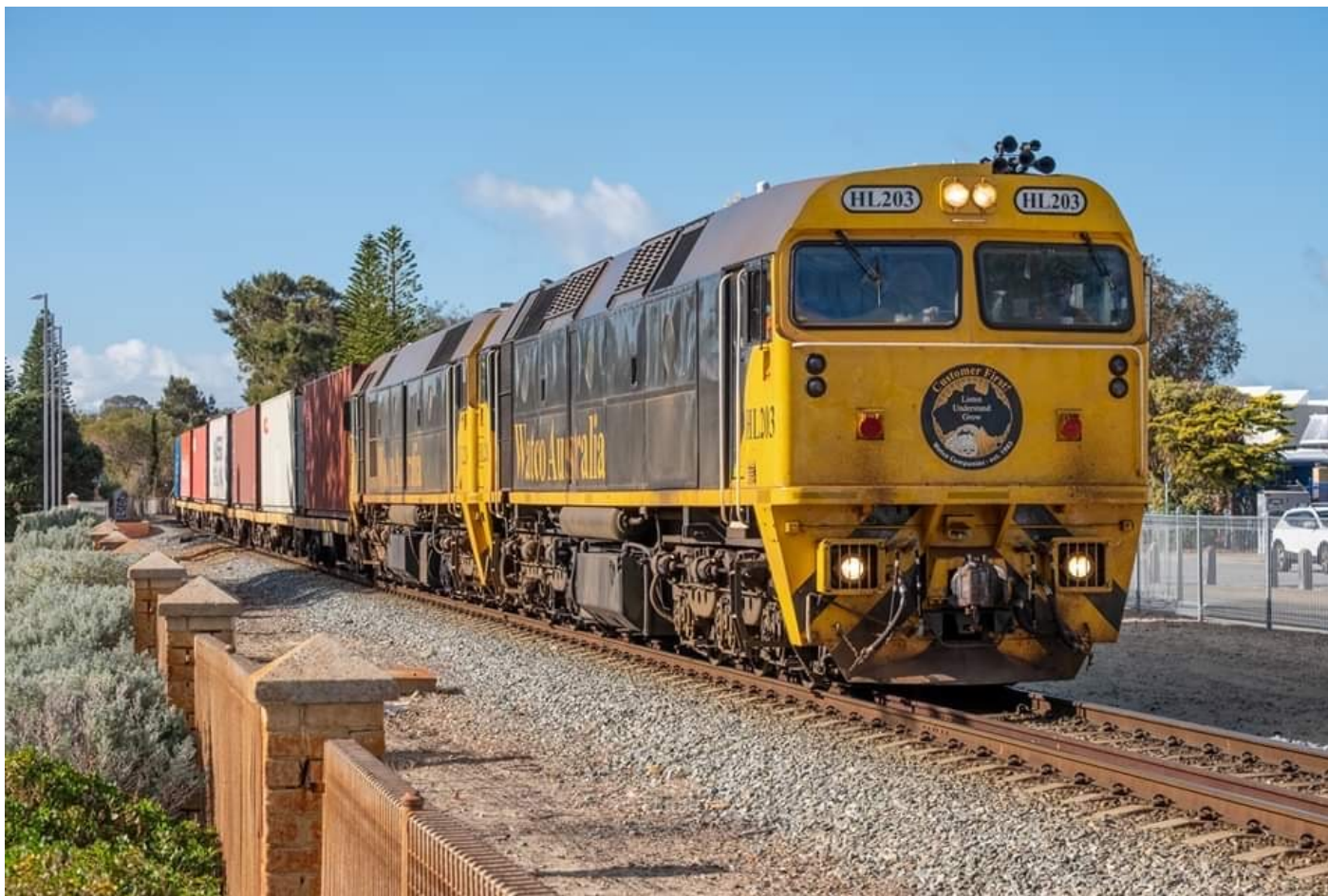
HL203 & FL220 pas through Fremantle with another container shuttle, 30 th June.