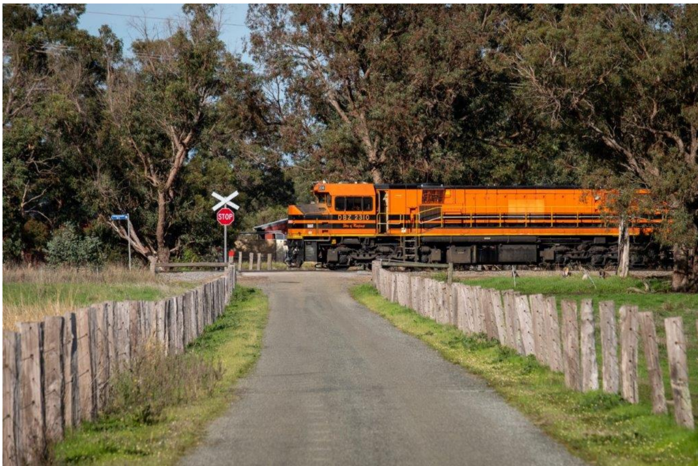
DBZ2310 rolls along the Pinjarra branch with tanks ex Bunbury, 29 th June.