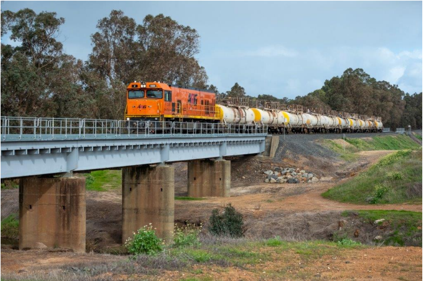
P2509 crosses the Collie River bridge at Burekup (above) then approaches Beela (below) with a caustic rake, 28 th June.