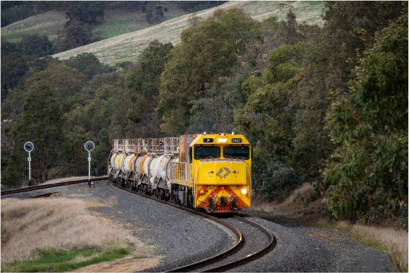
P2507 leads a caustic train through the triangle at Brunswick Junction, 28 th June.