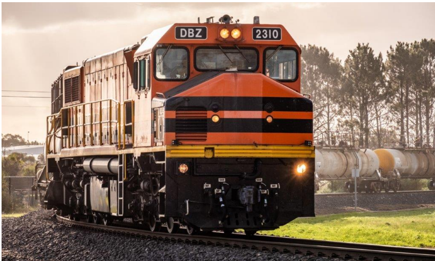
DBZ2310 departs Bunbury with caustic tanks, 28 th June.