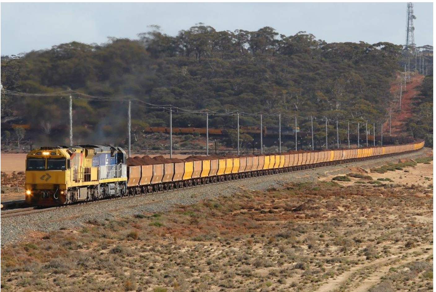
ACC6032 & CF4405 skirt the shore of Lake Cowan with DPU CF4407 & AC4303 on 2031 loaded ore, 29 th June.