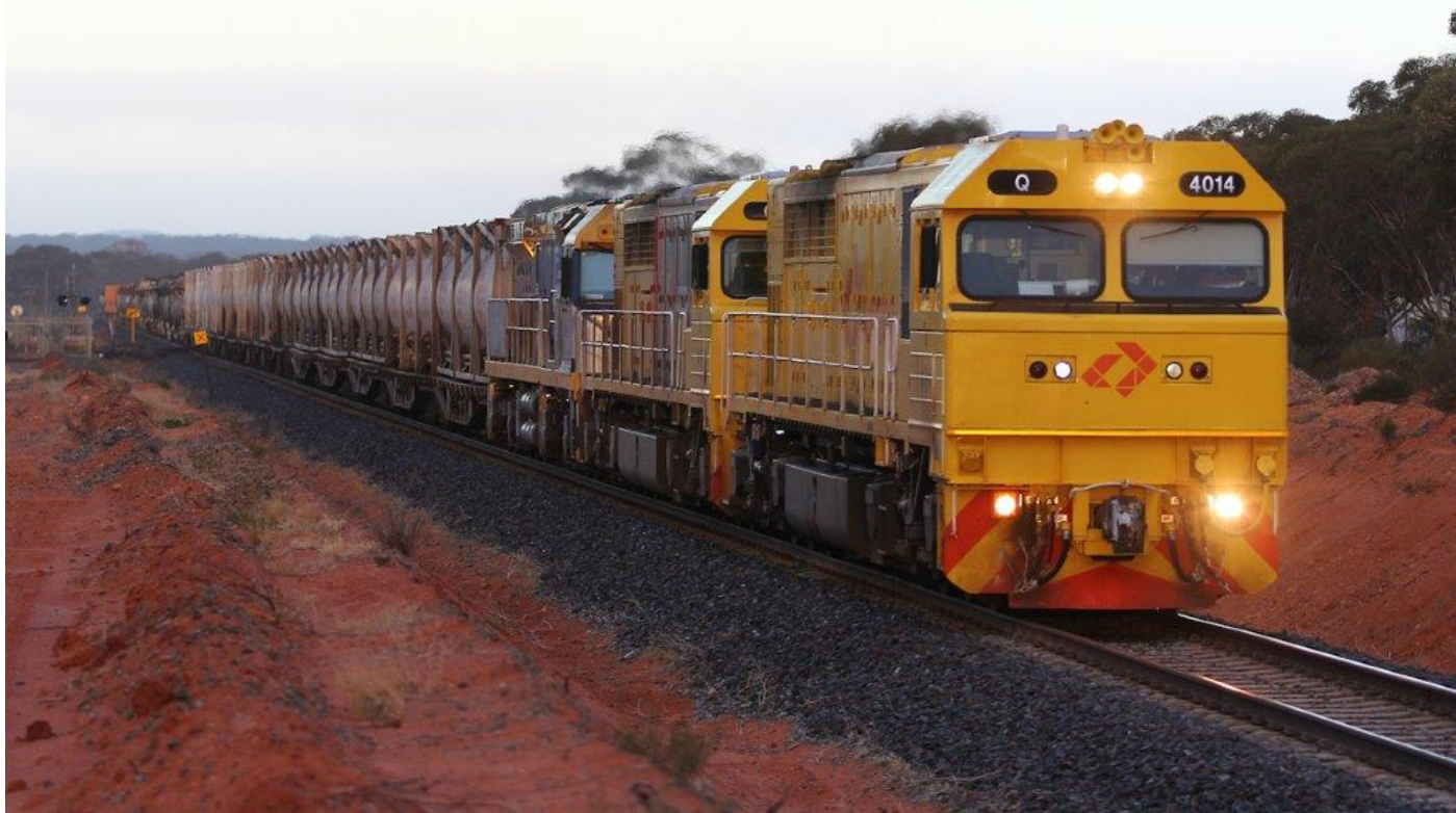
Qs 4014 & 4009 return CF4406 to West Kal ex Bassendean workshops on 2025, 30 th June.