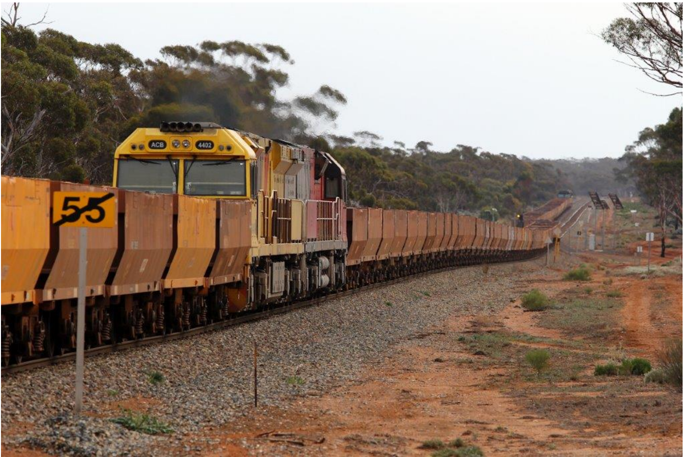
DPU on 1040 through Norseman are MRL001 & ACB4402, 29 th June.