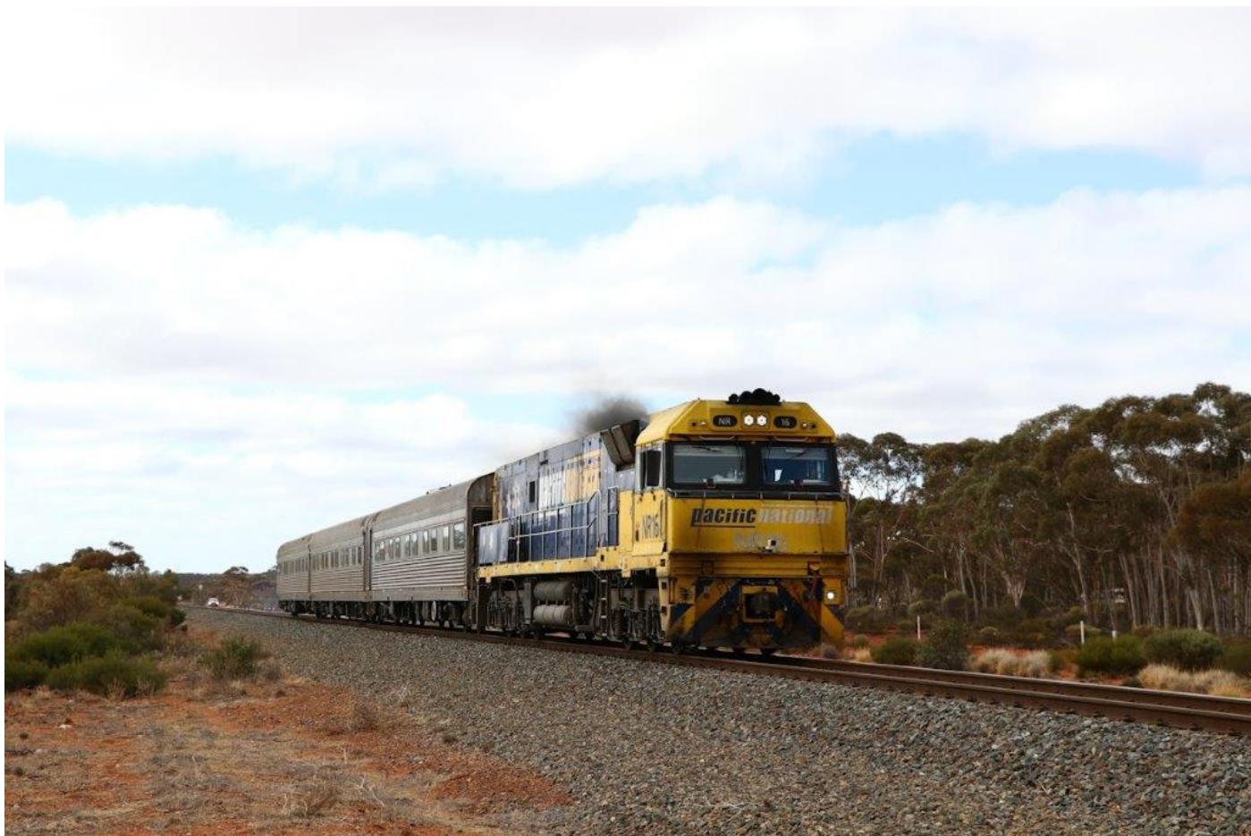
NR16 hurries 3AK3 track inspection train through Binduli to Perth, 30 th June.