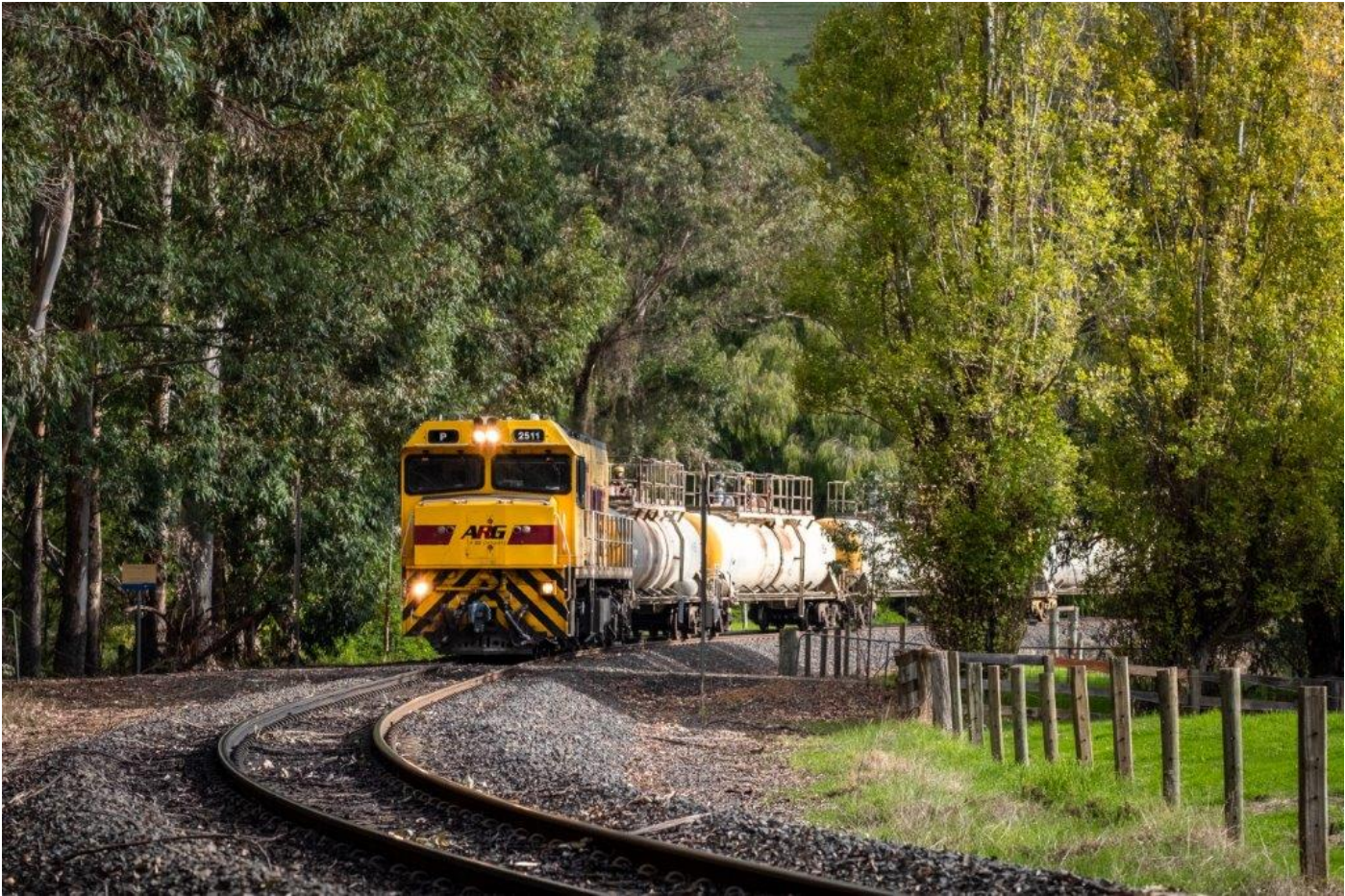
P2511 approaches Beela with a rake of caustic tanks, 28 th June.