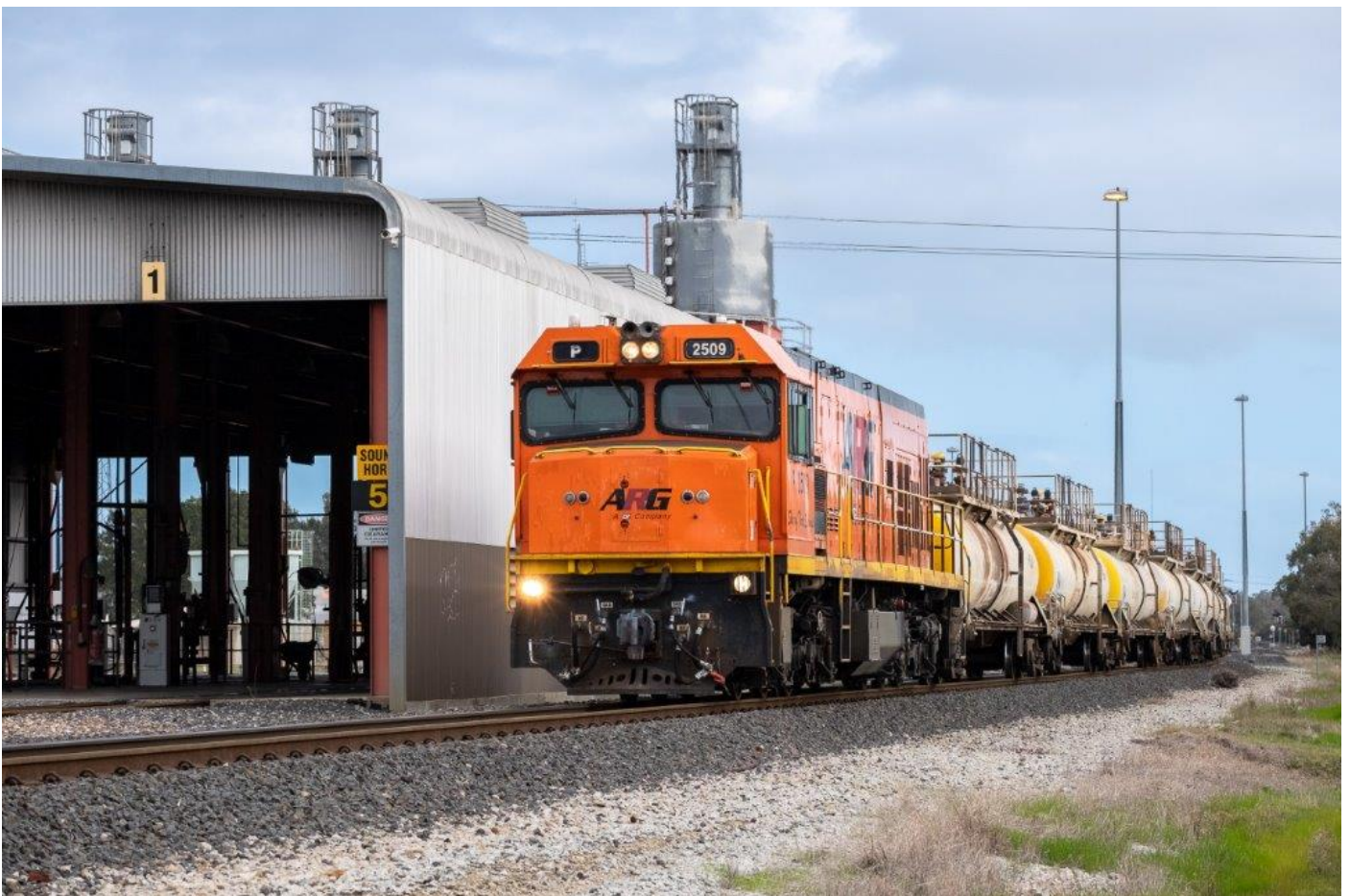
The loco servicing facilities at Picton East are empty as P2509 races past, 28 th June.