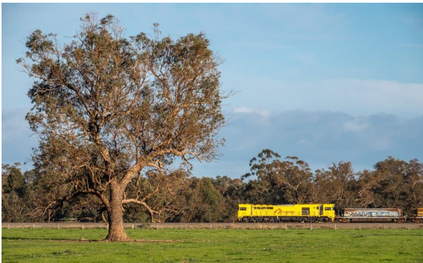
S3310 approaches Pinjarra with bauxite hoppers, 29 th June.