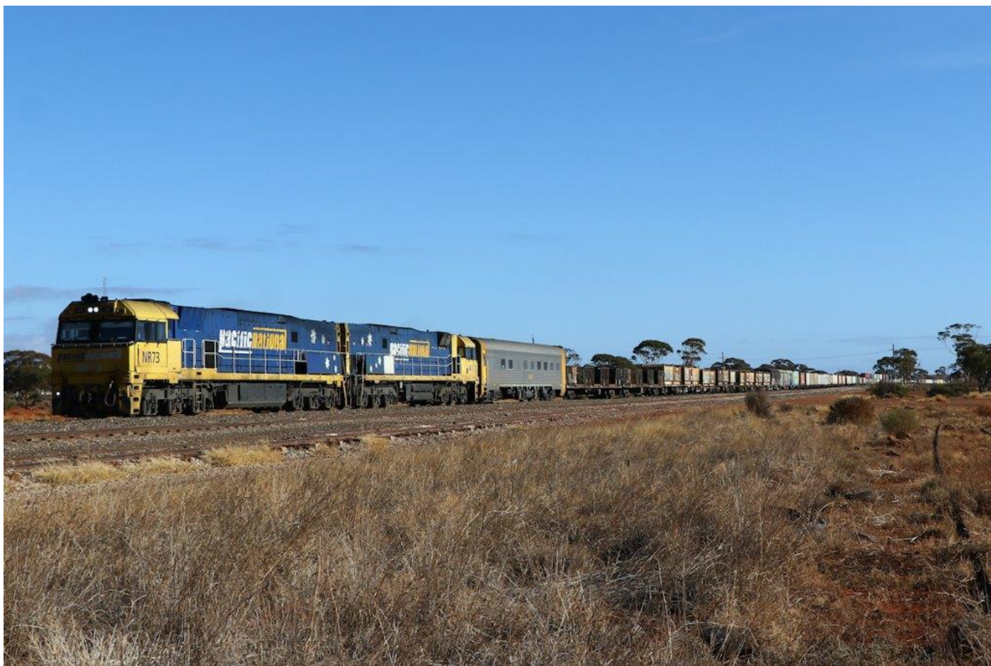
Late 2PM5 arrives at Parkeston behind NRs 73 & 17, 30 th June. Note empty steel wagons at front of consist.