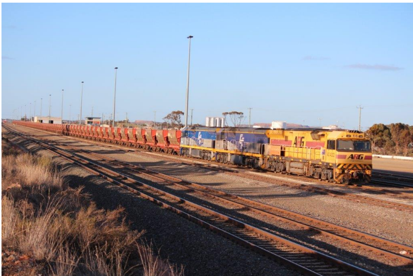
AC4302, CF4408 & CF4406 on 3MR2, West Kalgoorlie – CF4406 was added here, 30 th June.