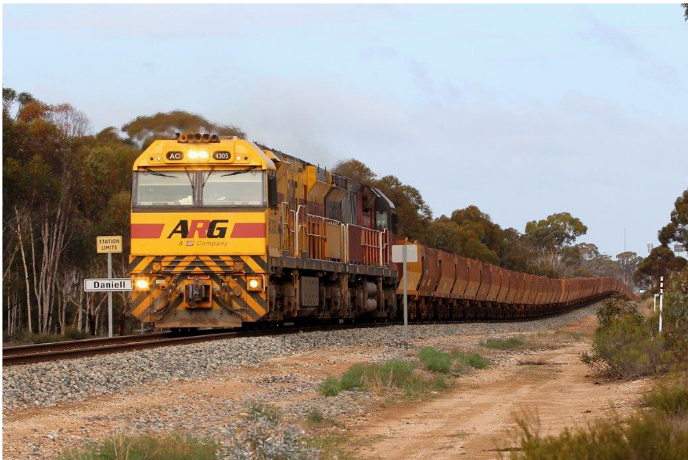
AC4305 & MRL003 clear Daniell (above) and ease through Norseman (below) with 2040 empty ore, 29 th June.