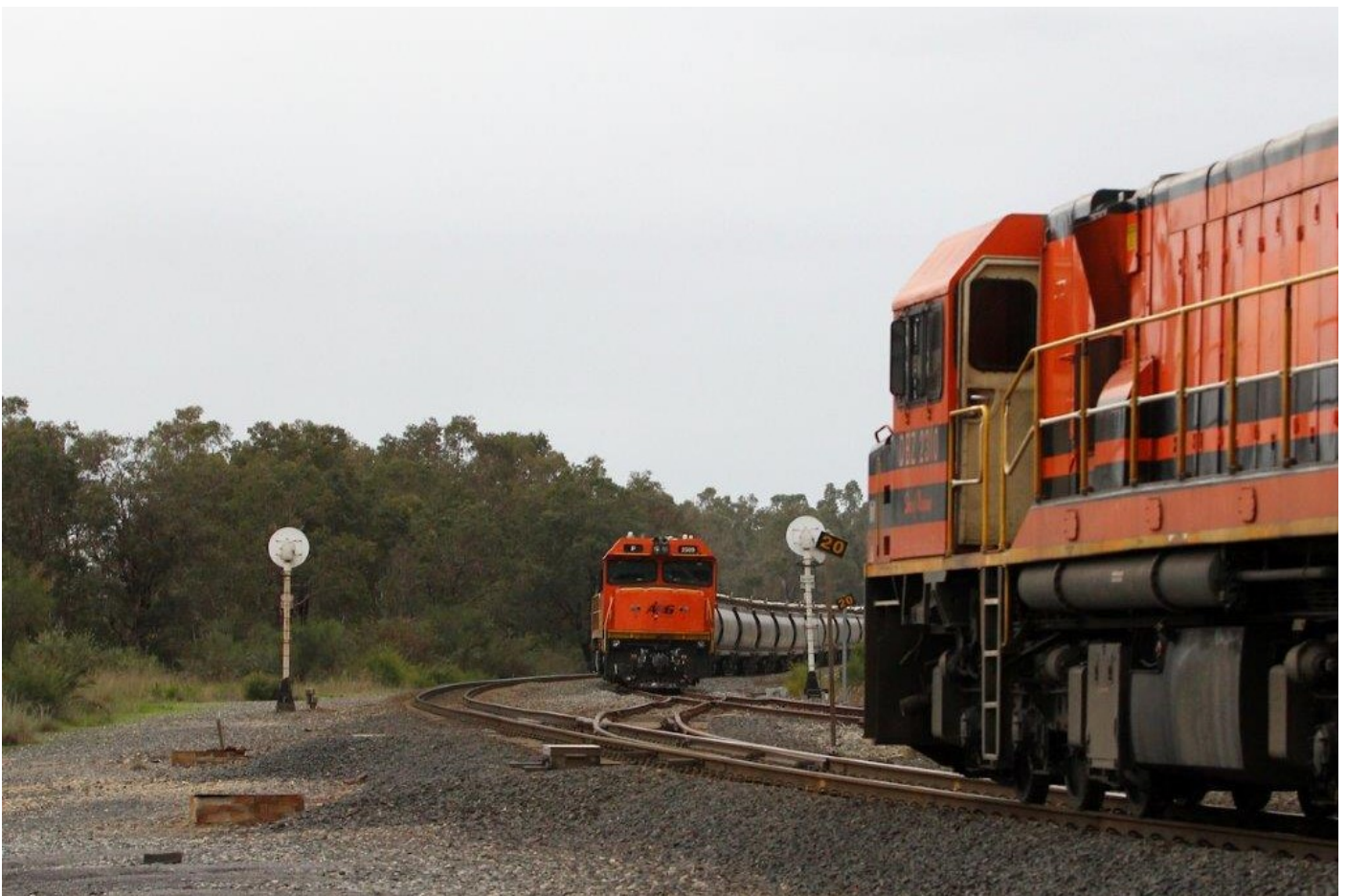
DBZ2310 on 3876 empty alumina crosses P2509 on 3867 loaded alumina at Yarloop, 28/7.