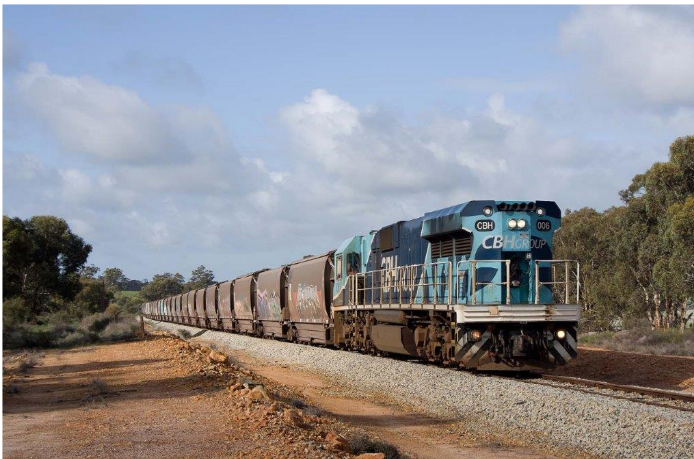
CBH006 on 4K13 grain at Yerecoin, 8 th July.