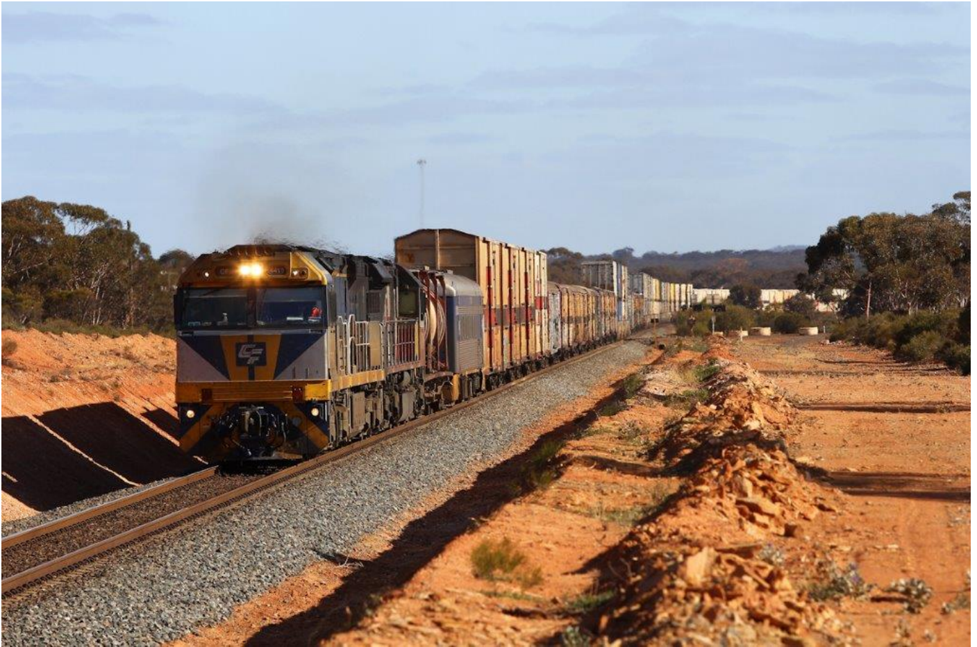
CF4410 & SCT009 cross Kundana Rd, near Kurrawang, with 3PG1, 1 st July.