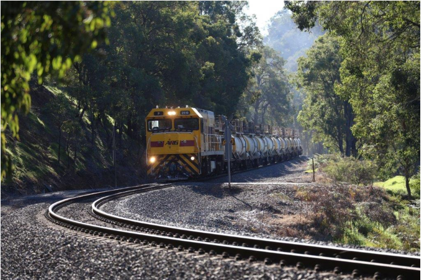
7623 caustic races along behind P2510, 11 th July.