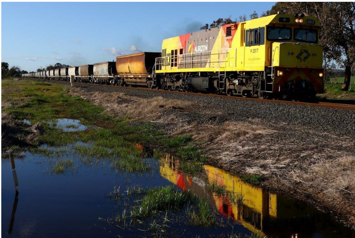
P2517 reflects as it leads 6253 empty Cockburn Cement coal train to Collie at Wokalup, 24 th July.