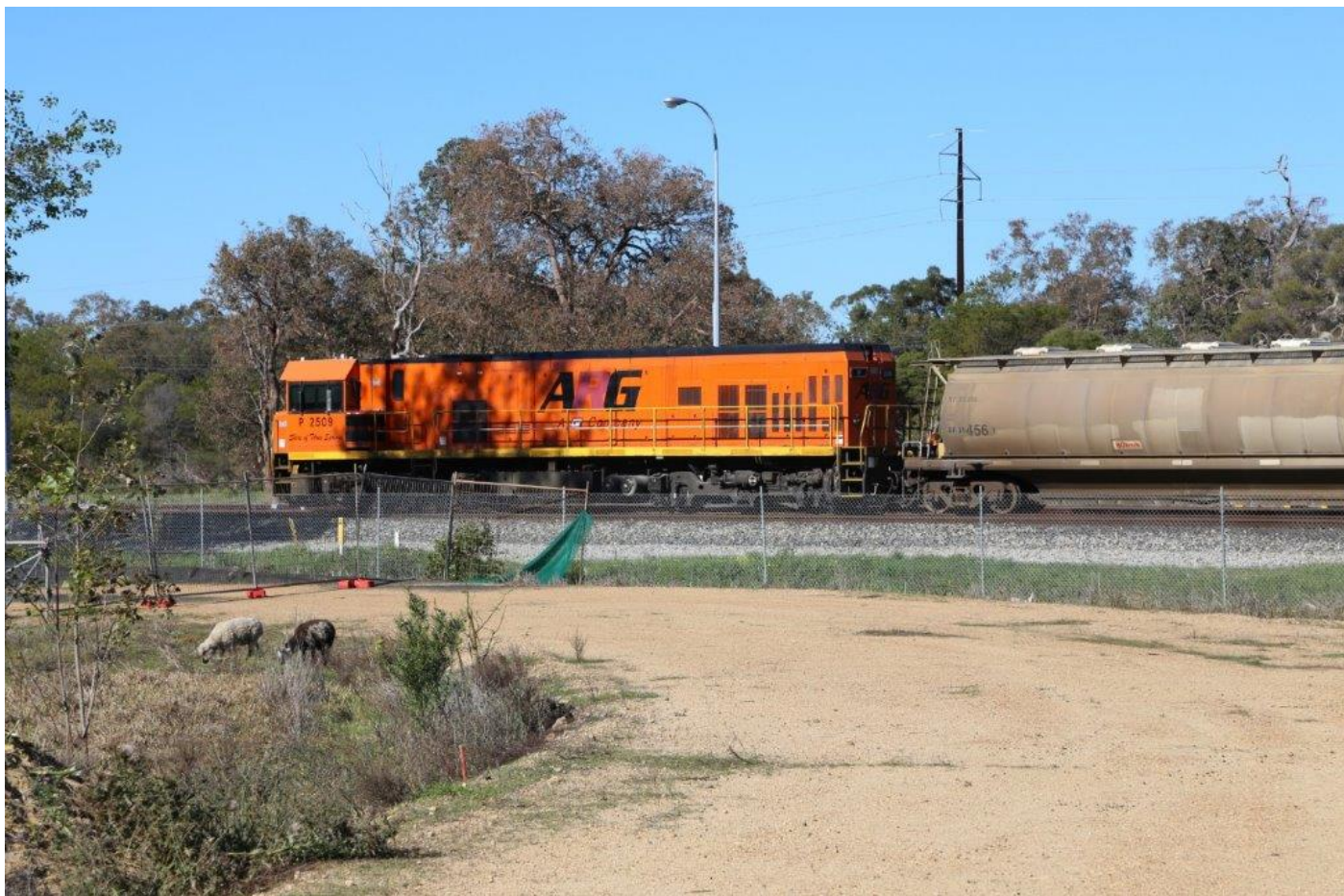
P2509 stabled in Picton yard on an alumina rake while the grass gets mown, 11 th July.