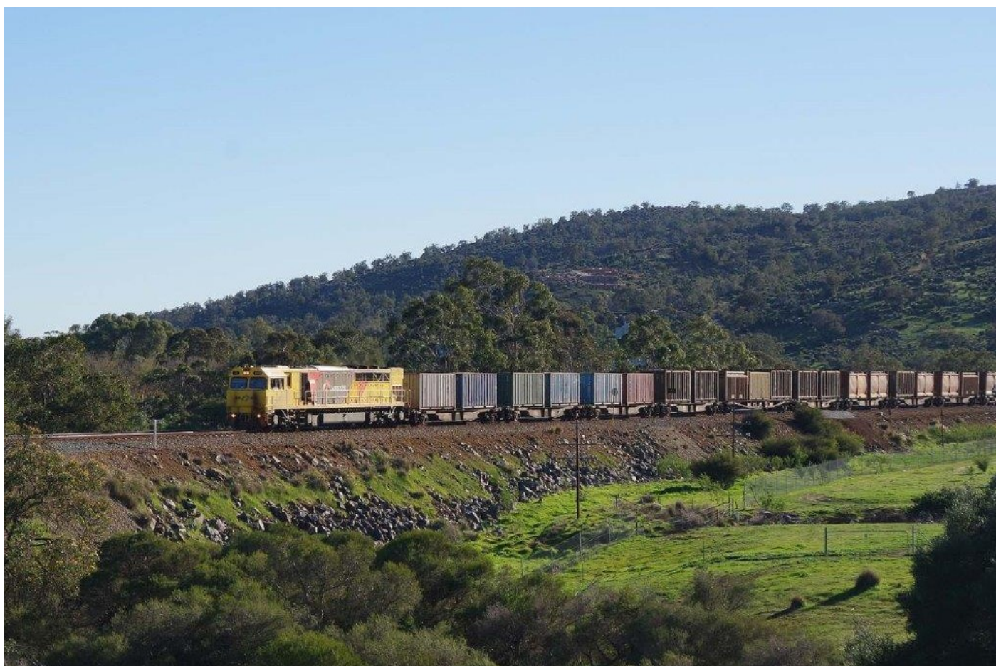
6430 empty sulphur train from Malcolm passes through Brigadoon behind Q4007, 11 th July.