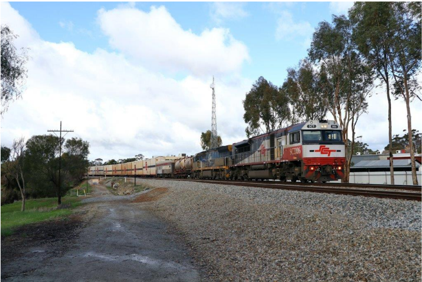
SCT006 & CF4410 pass through Northam with 3MP9, 17 th July.