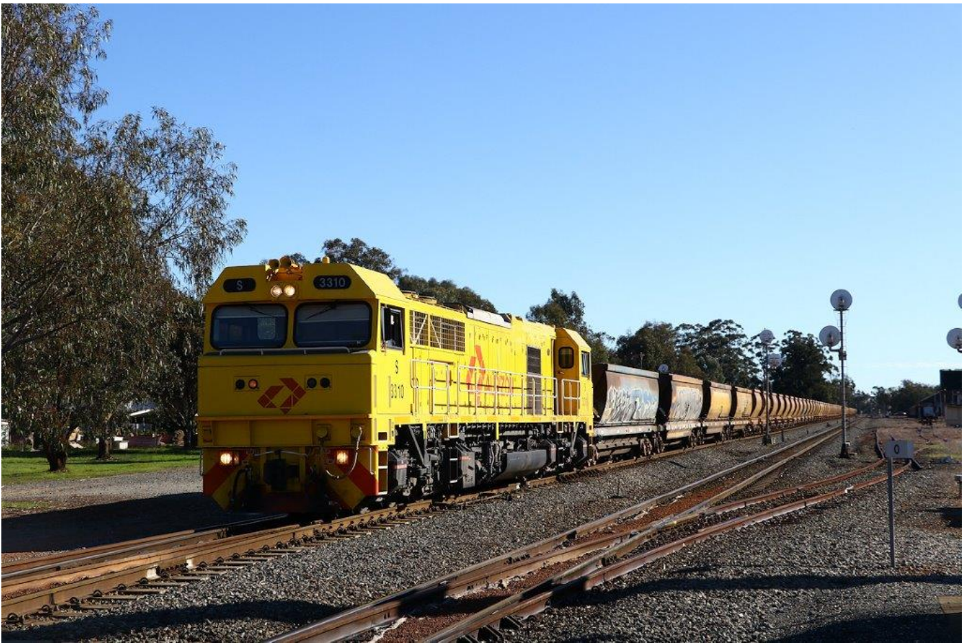
S3310 pauses at Pinjarra with 1935 empty bauxite, 26 th July.