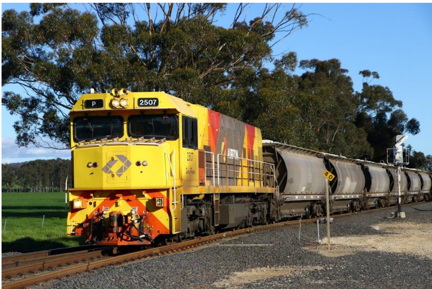
P2507 arrives at Benger with 6876 empty alumina to Calcine (Pinjarra), 24 th July.