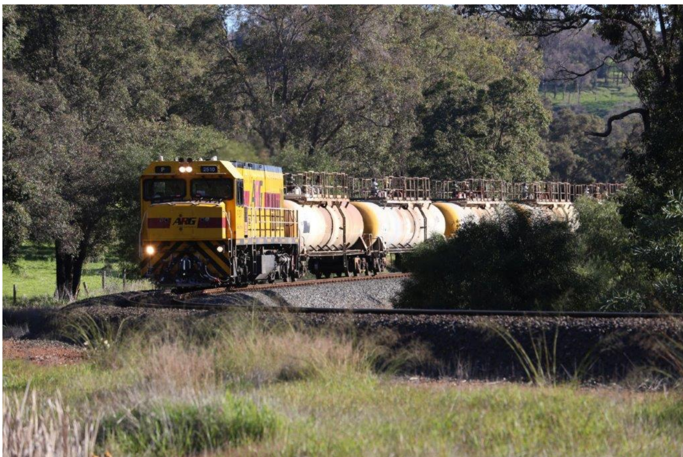
P2510 leads 7623 caustic, Brunswick Junction, 11 th July.