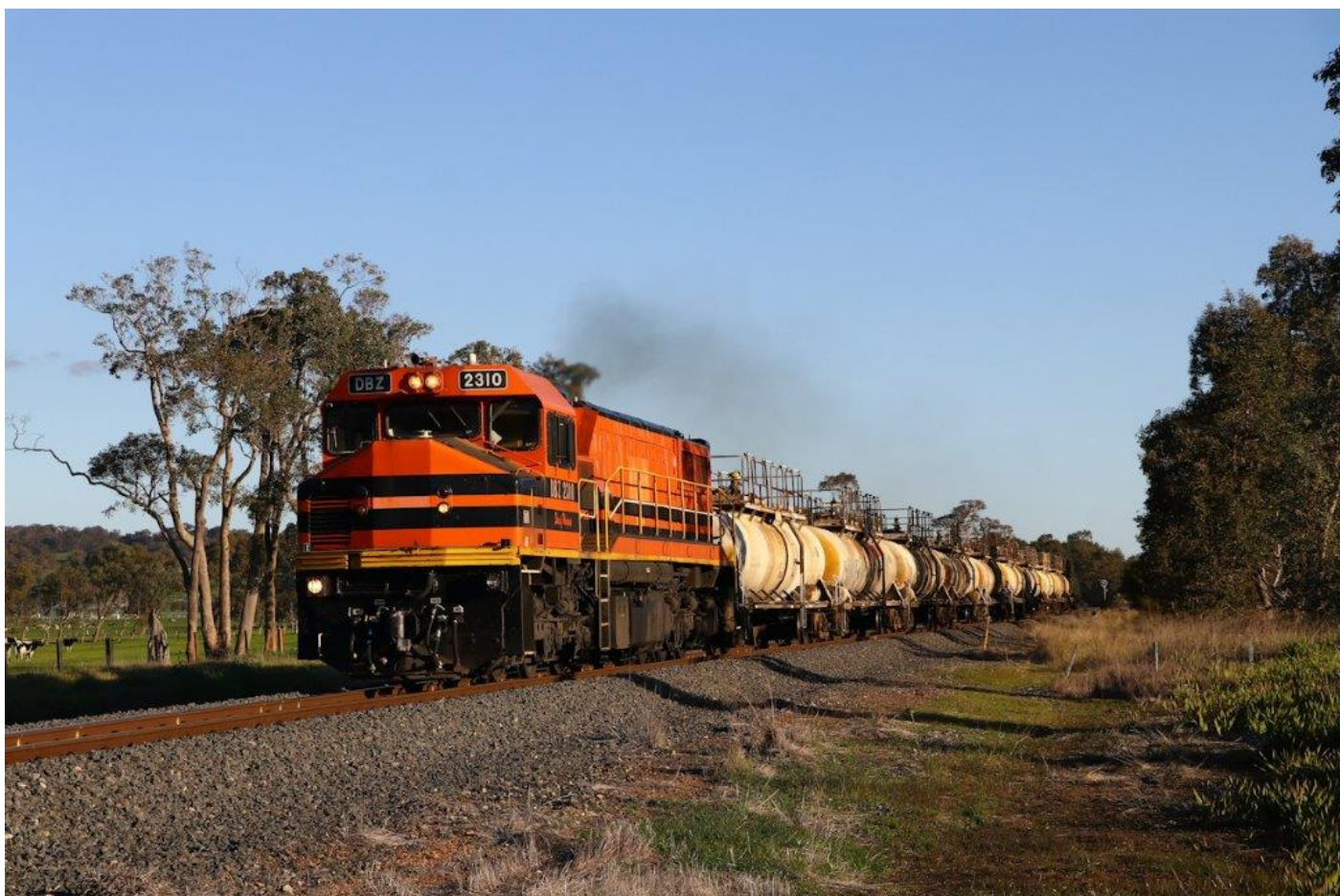
6924 loaded caustic passes through Wokalup behind DBZ2310, 24 th July.