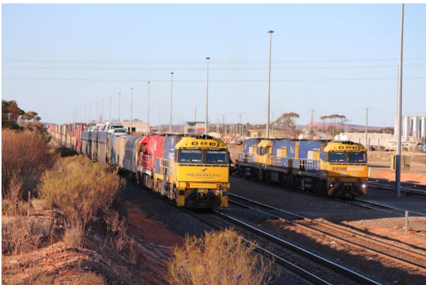
NRs 29 & 74 on 3MP5 pause beside NRs 120, 44 & 112 on 5445 empty fuel, West Kal, 2 nd July.