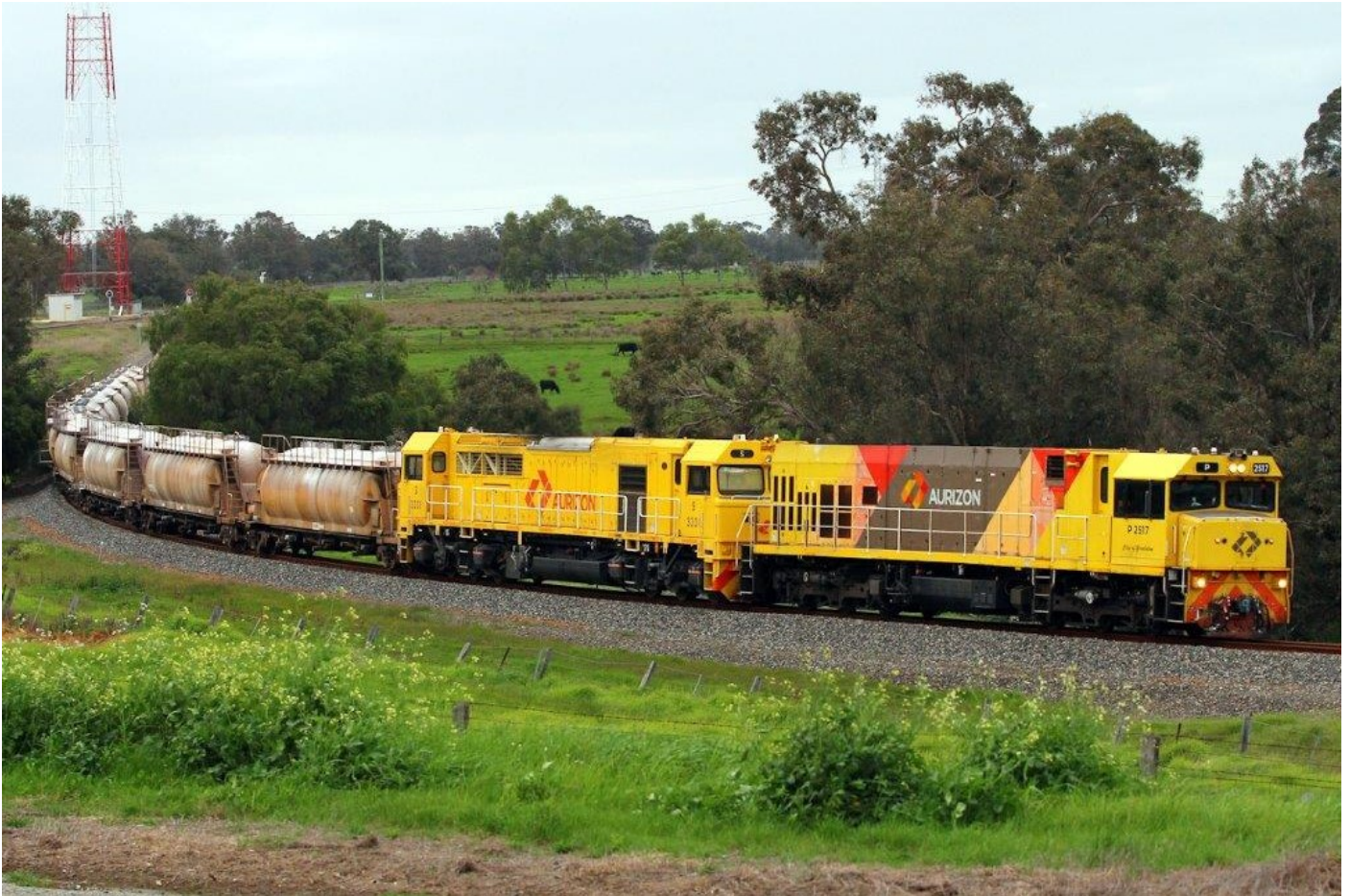
P2517 & S3301 lead 3271 Worsley lime around the triangle at Brunswick East to Hamilton, 28 th July.