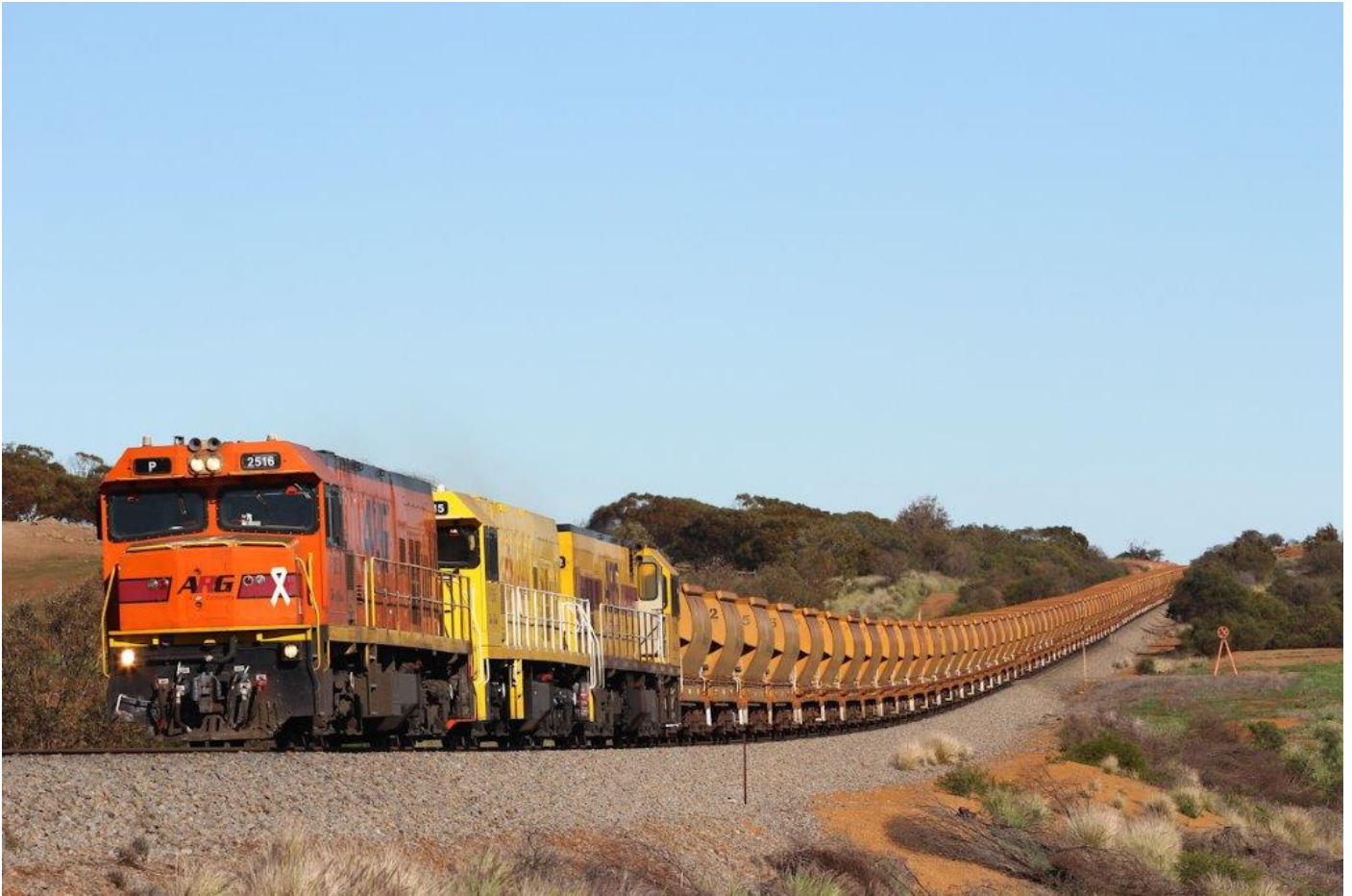
Ps 2516, 2515 & 2502 approach Bringoo on 7720 empty Mt Gibson ore to Perenjori, 11 th July.