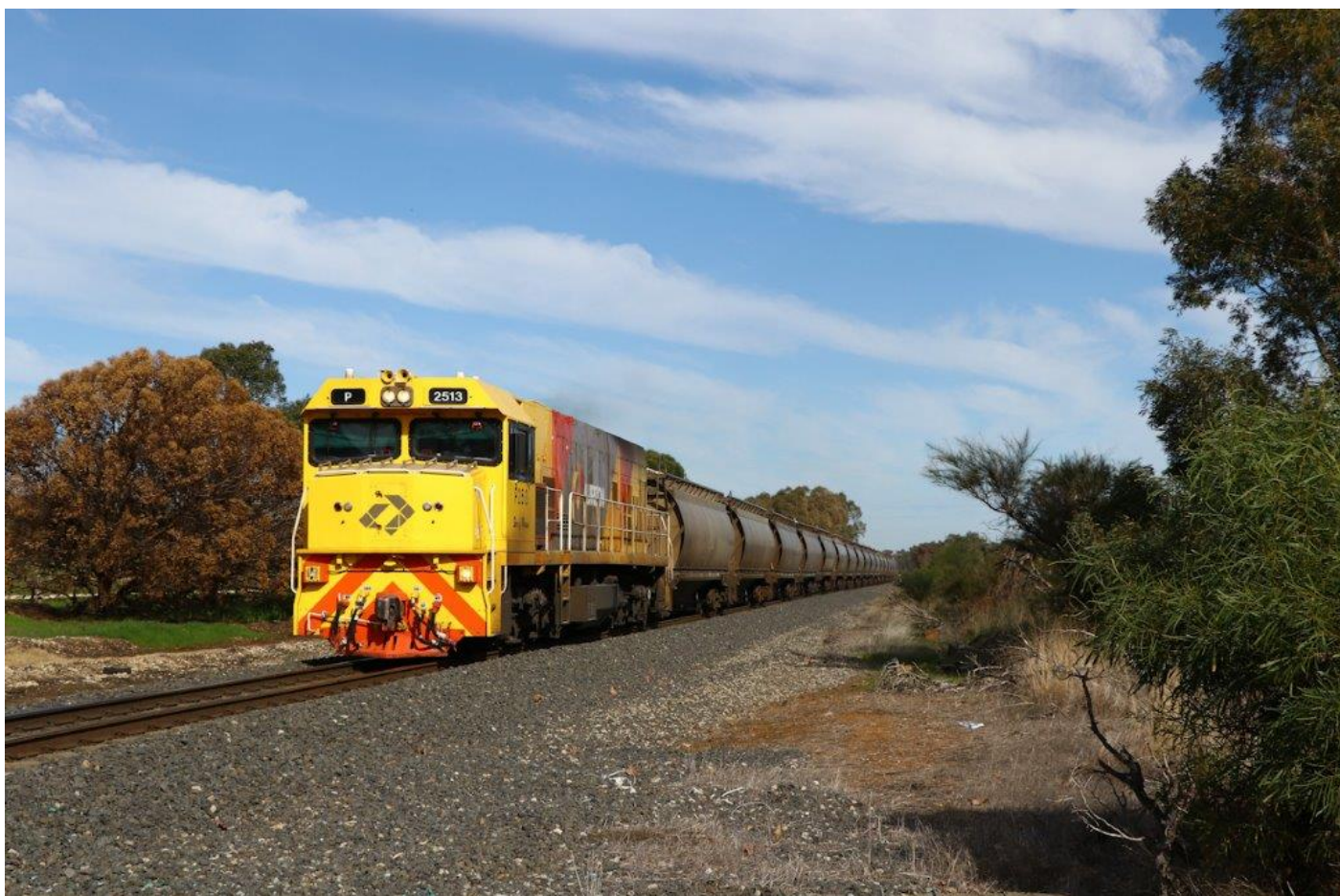
P2513 hauls 7866 into Brunswick Junction to collect another load of alumina at Yalup Brook, 4 th July.