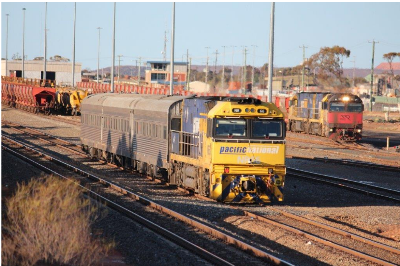
NR66 & AK cars ex Leonora; MRL003, NRs 24 & 113 shunt hoppers, West Kalgoorlie, 7 th July.