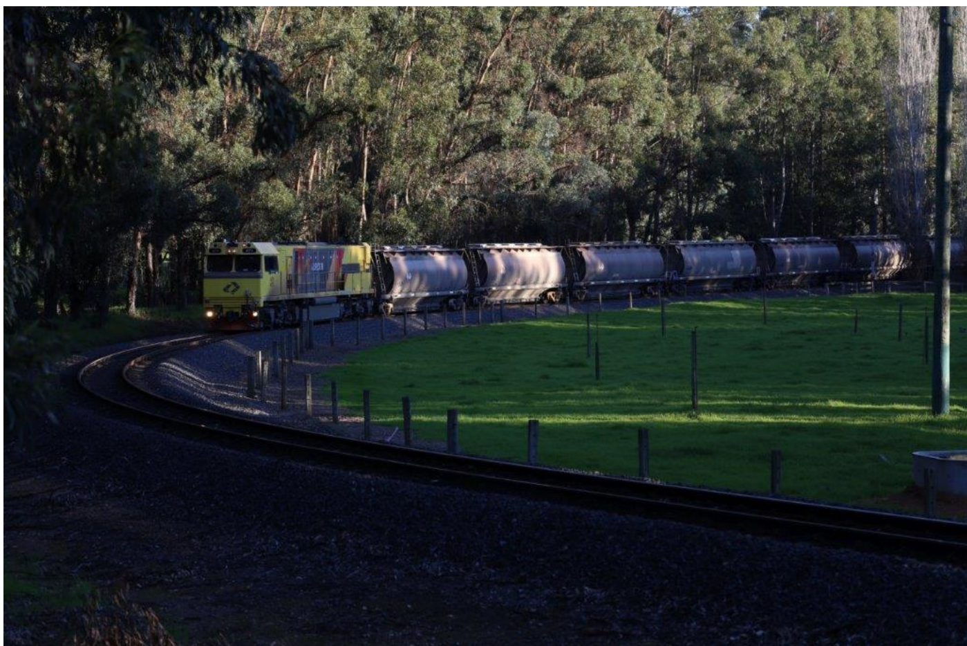
7833 alumina trails ACN4173, 11 th July.