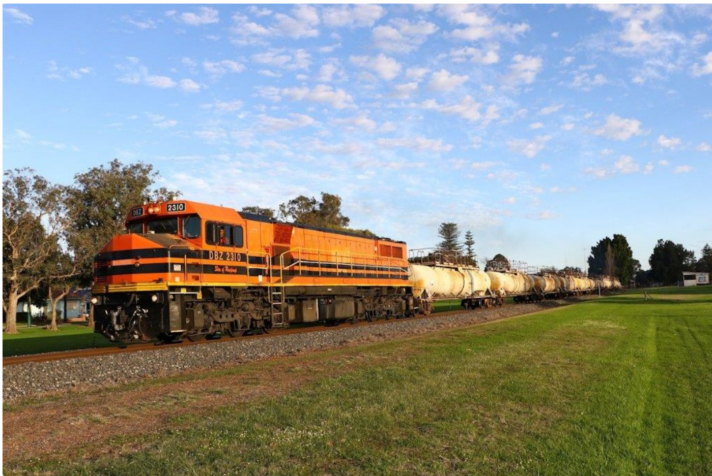
DBZ2310 returns through Harvey with 7904 loaded caustic to Calcine (Alcoa Pinjarra) - see page 10, 4 th July.