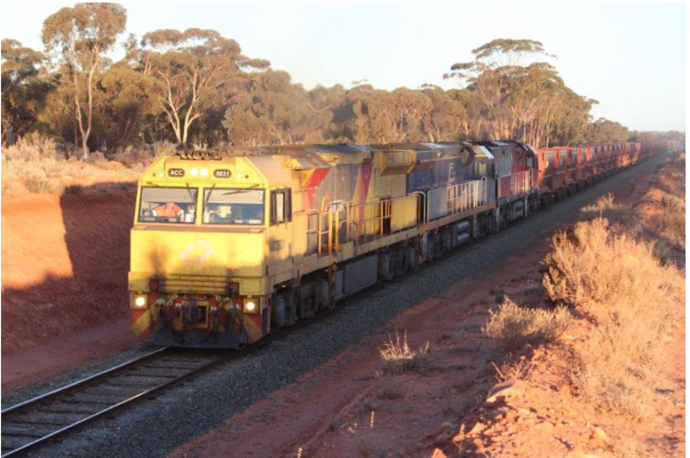
ACC6031, CF4407 (to detach) & MRL004 approach Binduli with 5042 empty ore, 2 nd July. MRL001 & AC4302 were two-thirds of the way back along the train.