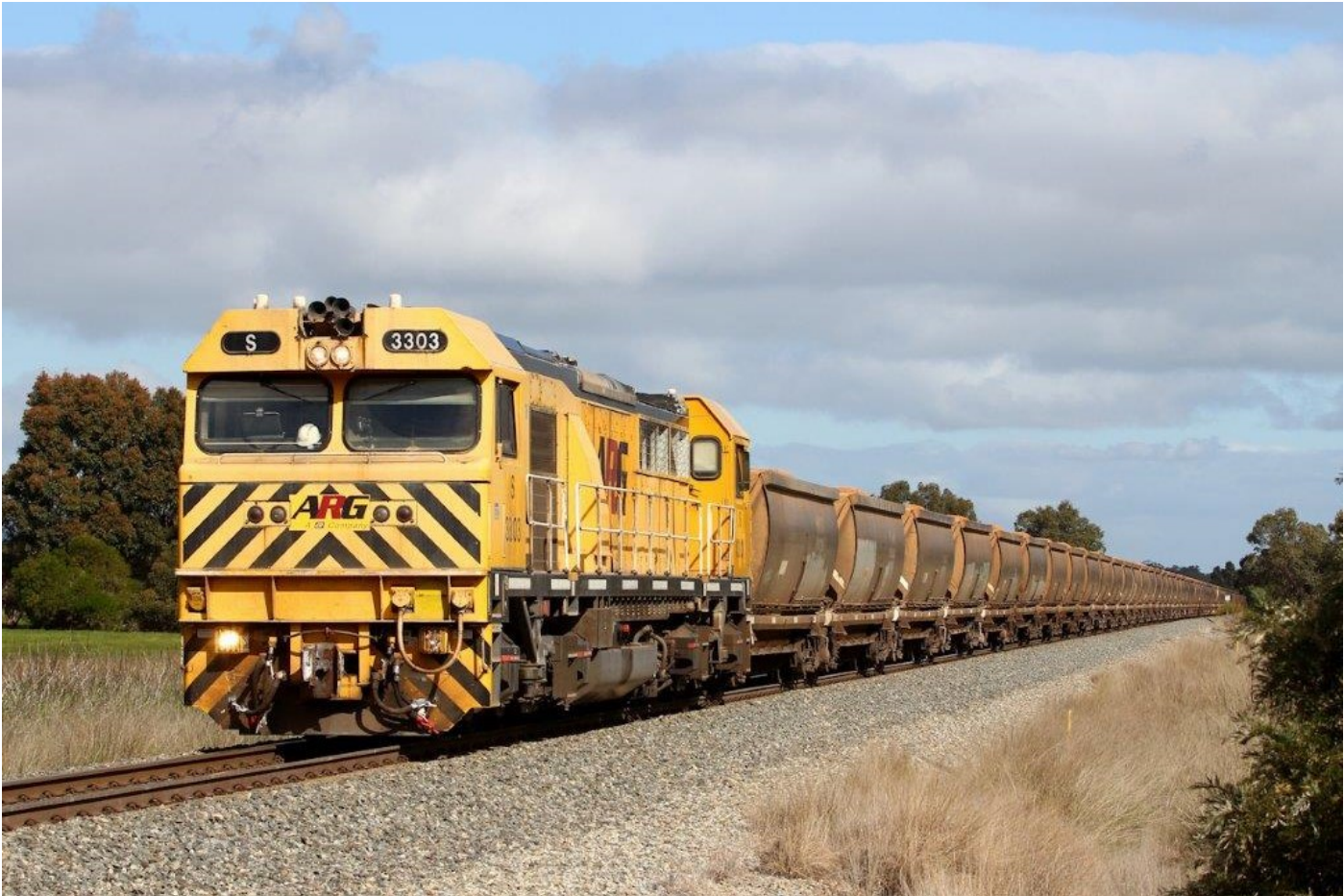
S3303 approaches North Dandalup with 3970 loaded bauxite, 28 th July.