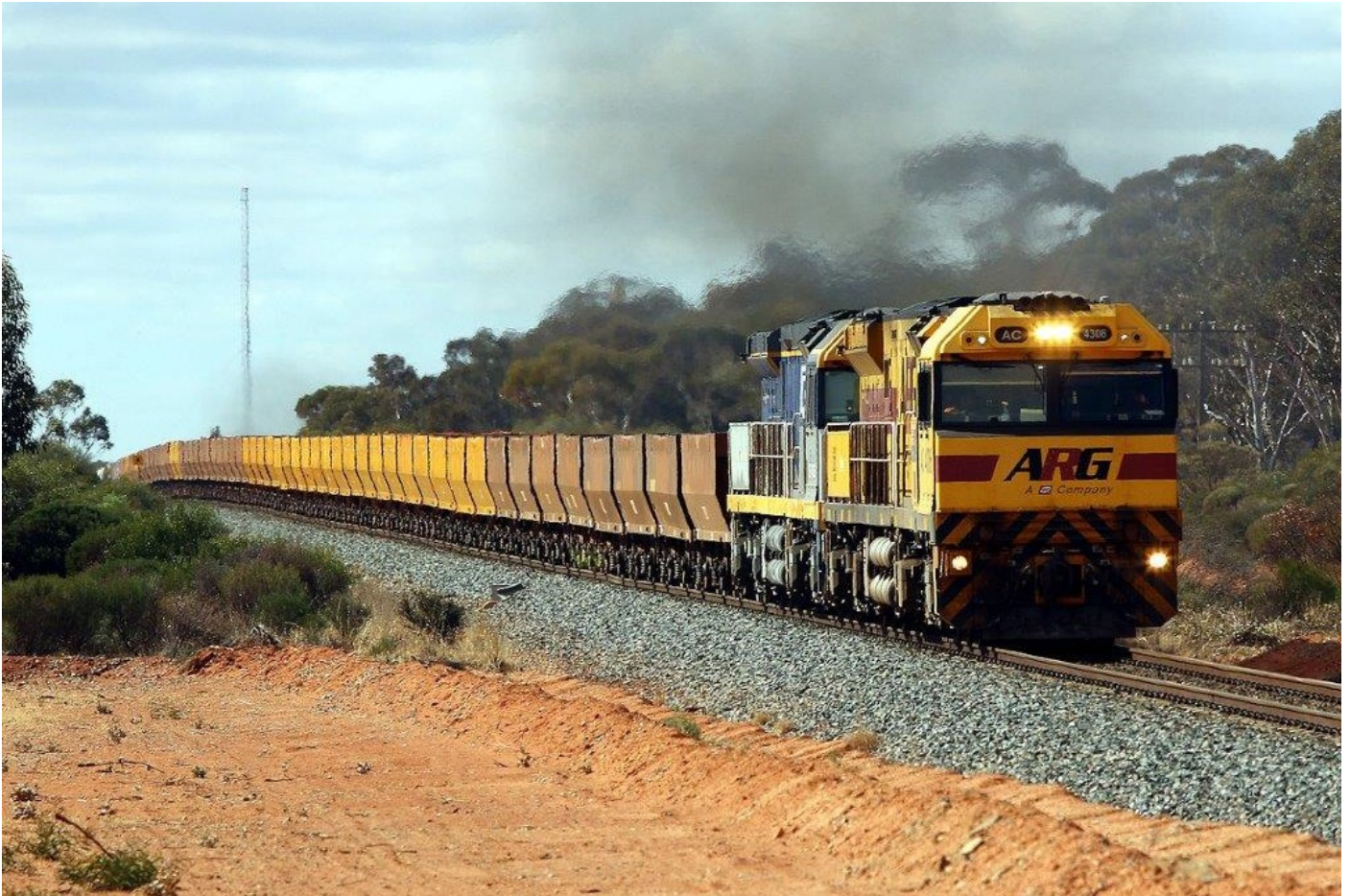
Aurizon-crewed 5040 empty ore approaches Kundana Rd, Kurrawang East, led by AC4306 & CF4406 with DPU MRL006 & AC4301, 2 nd July. Kooly loco pairings are almost always back to back nowadays.