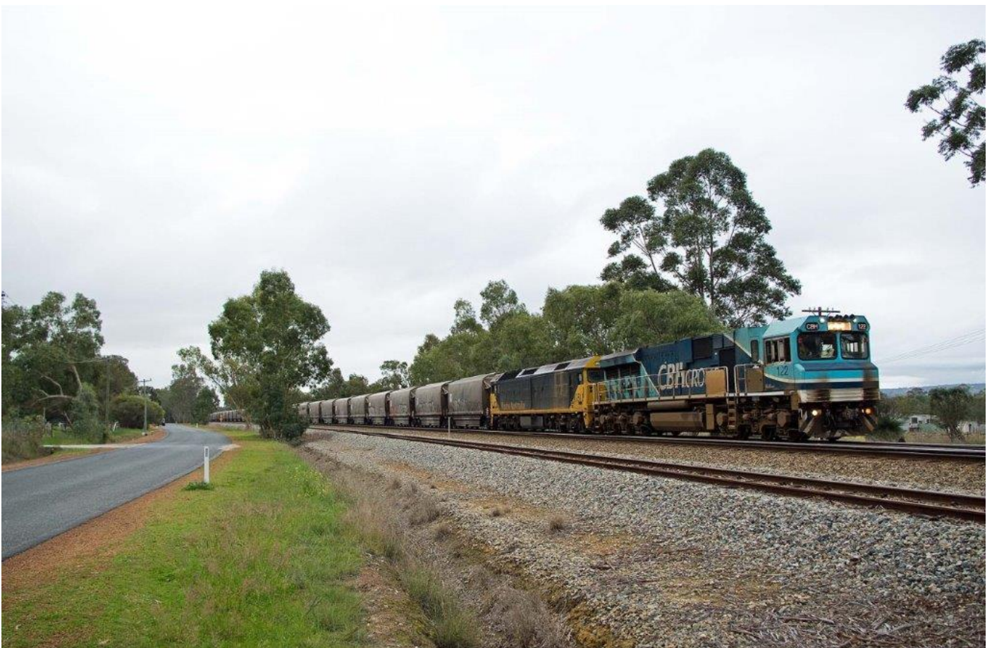
CBH122 & G511 work 1S56 grain through Millendon Junction, 26 th July.