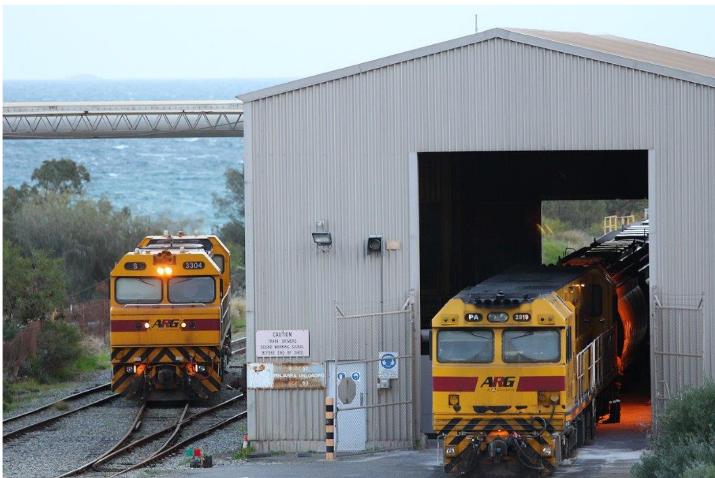
PA2819 unloads alumina while S3304 switches tracks, Alcoa terminal, Kwinana, 6 th July.