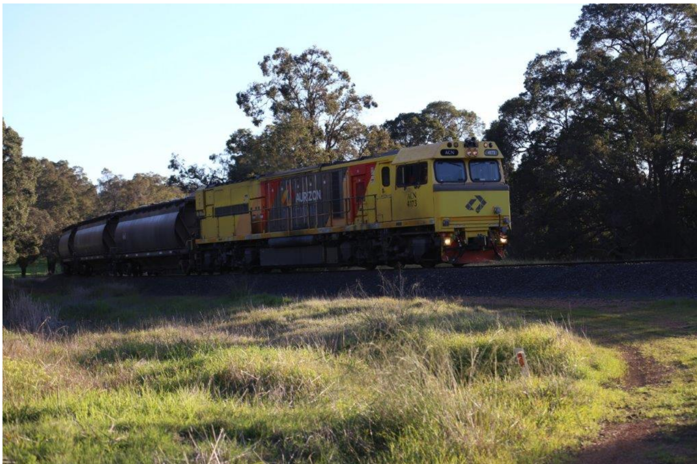
ACN4173 works 7833 alumina through Brunswick Junction, 11 th July.