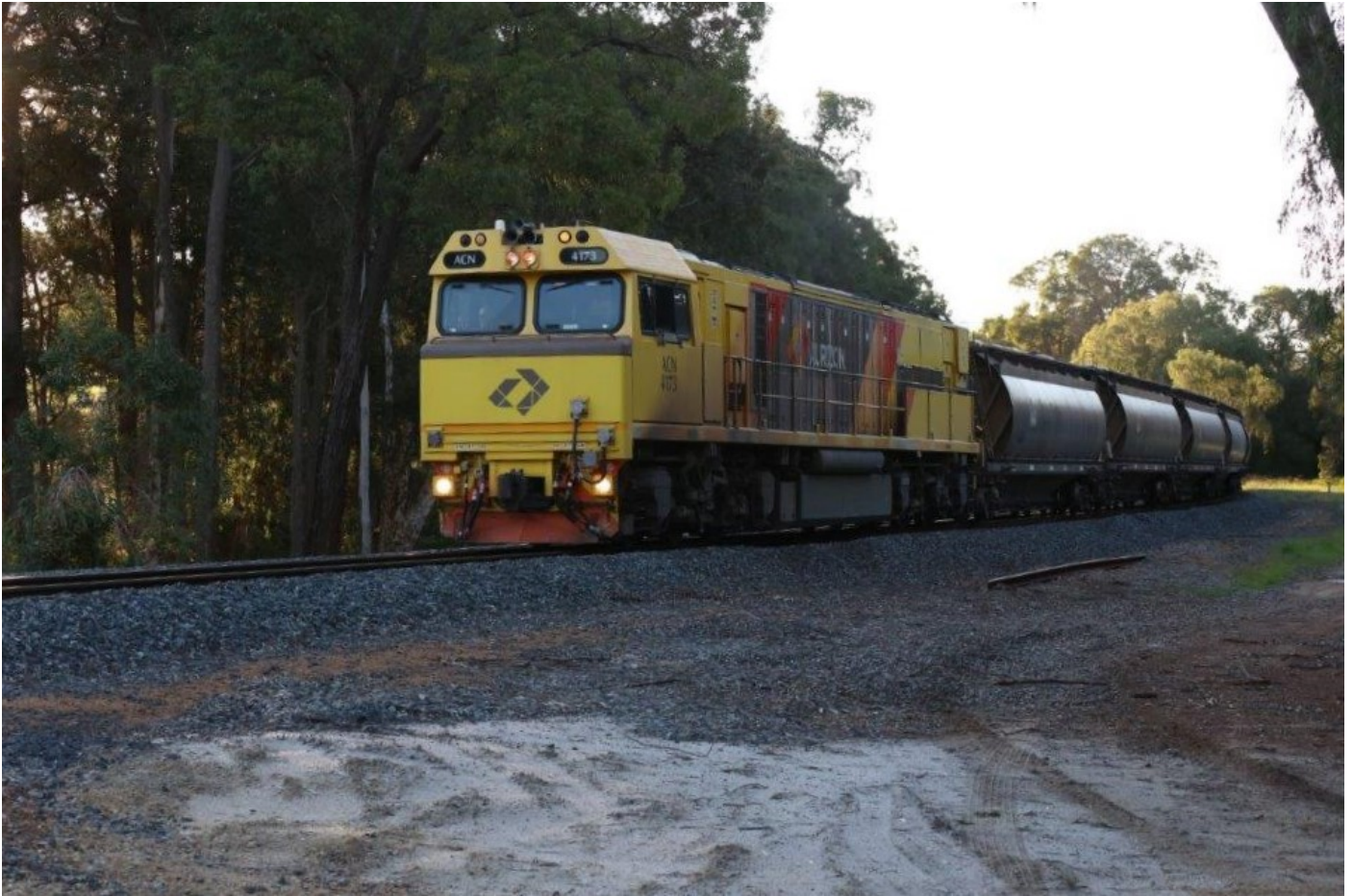
ACN4173 approaches Beela with 7833 alumina, 11 th July.