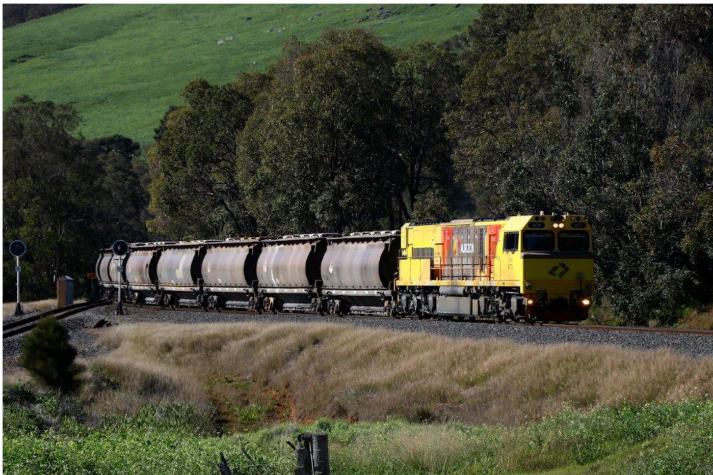
ACN4173 leads 6832 loaded alumina from Hamilton through Brunswick East, 24 th July.