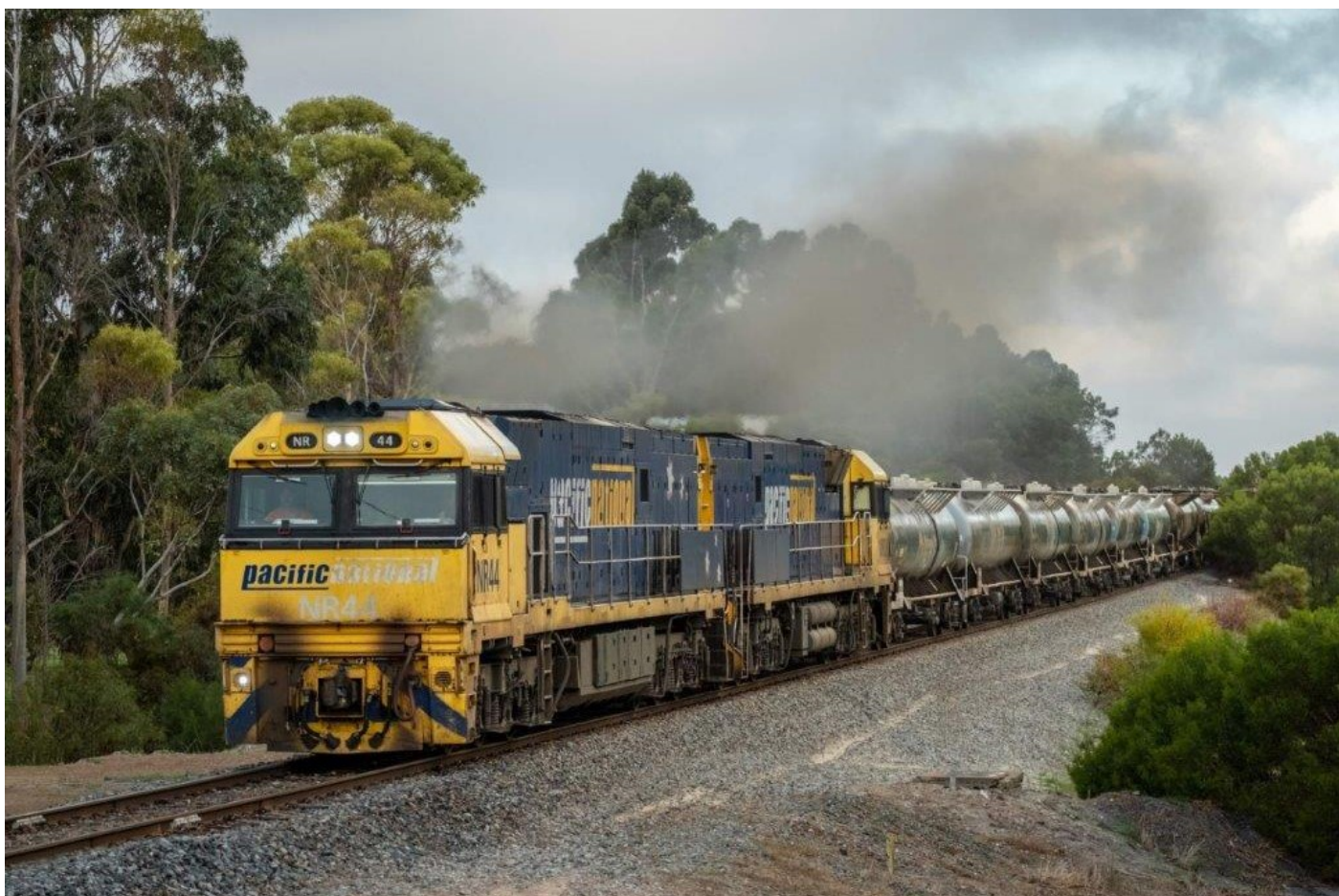
Smoky NRs 44 & 120 lead 4446 fuel away from Esperance, 8 th July.