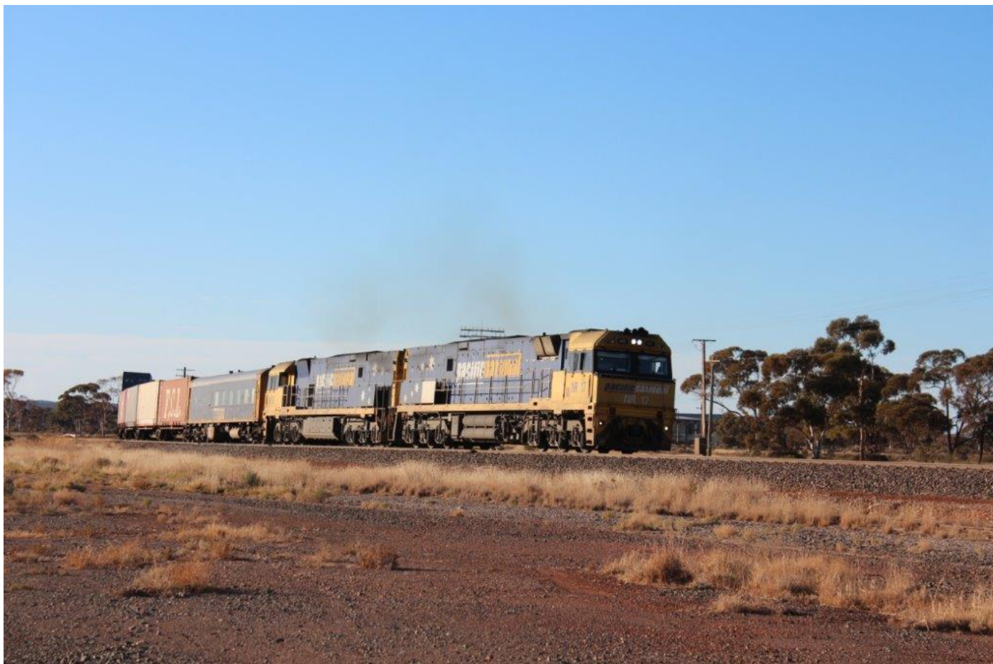
NRs 17 & 73 depart Parkeston with 6MP4, 5 th July.