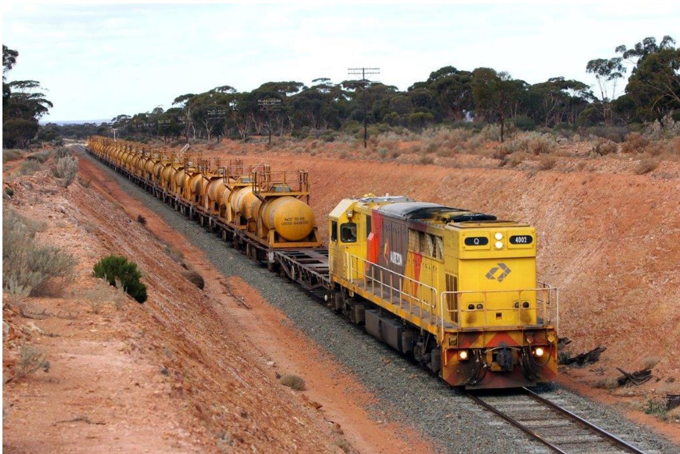
Q4002 approaches Binduli with 5406 acid shuttle from Hampton, 2 nd July.