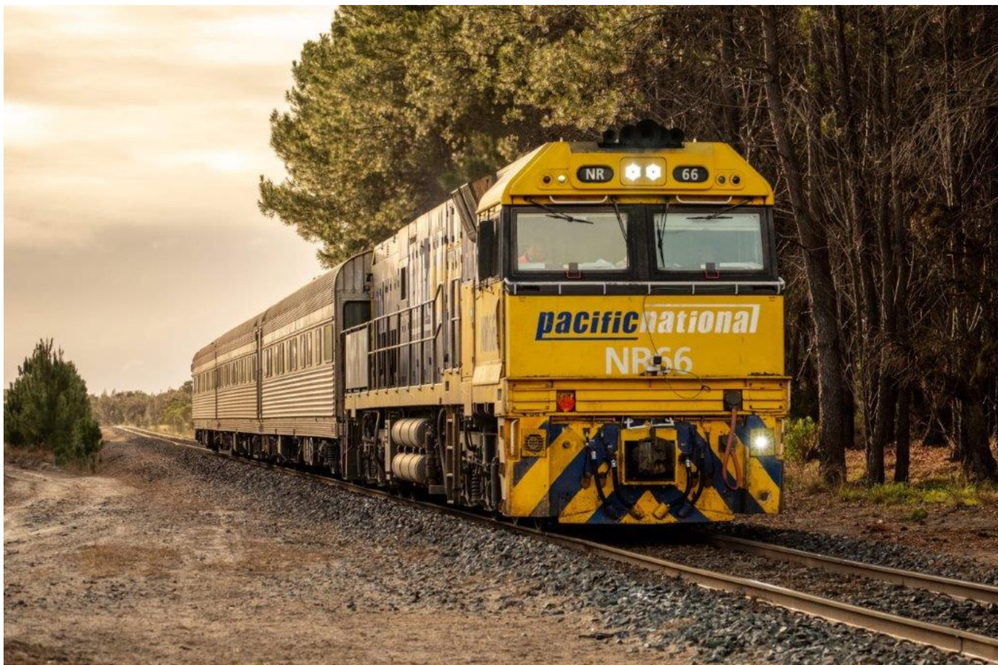
NR16 leads the AK cars through Gibson on approach to Esperance, 8 th July.