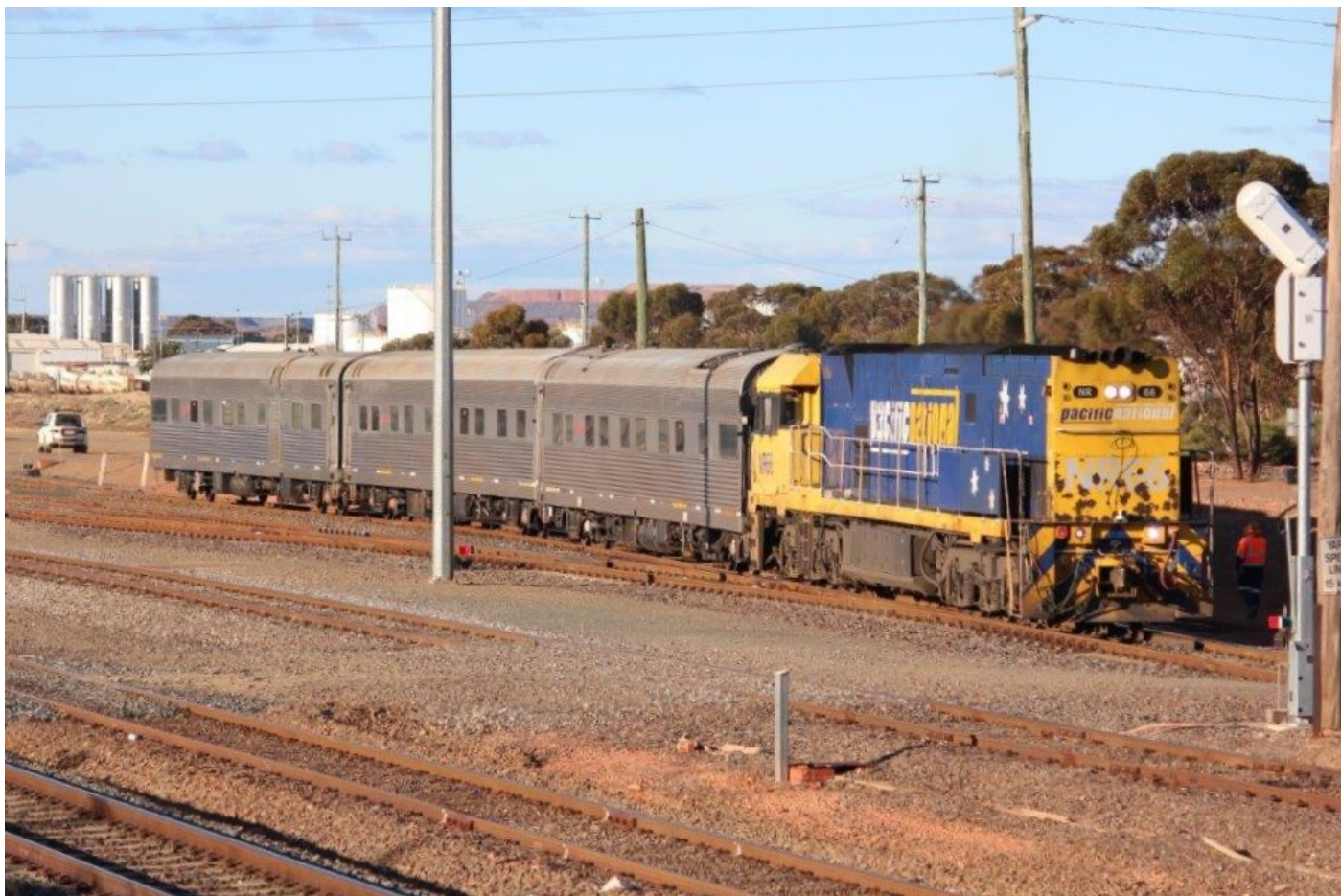
NR66 shunts the AK cars, West Kal, 9 th July. They departed for Darwin the next morning.