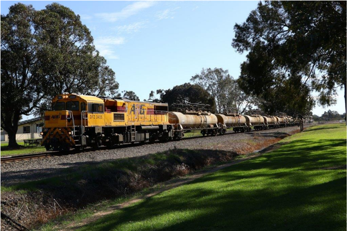
2923 empty caustic passes through Yarloop behind DFZ2405, 27 th July.