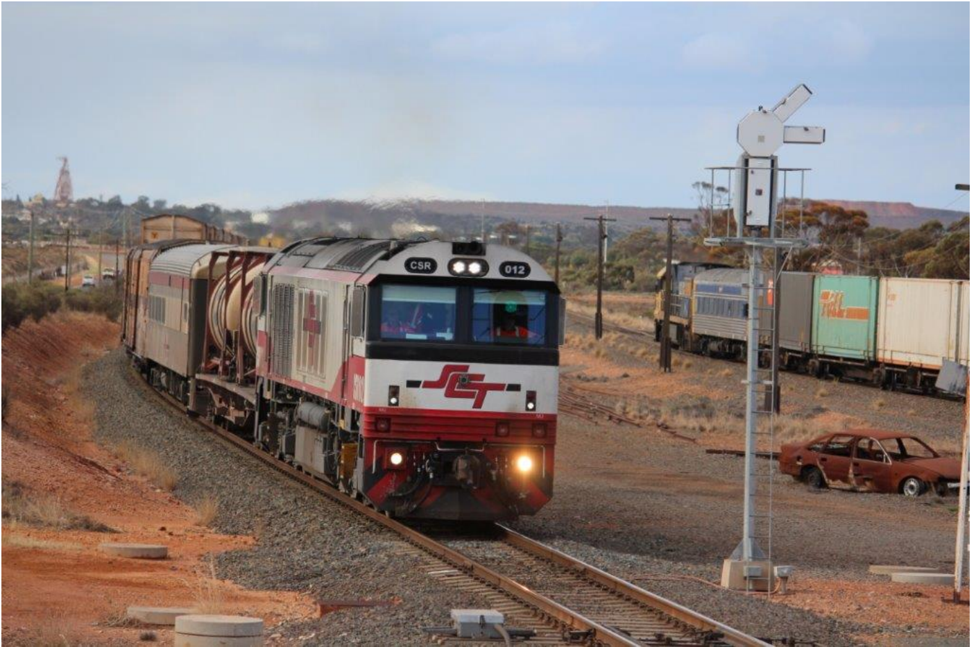
Extra service 2AP9 with solo CSR012 enters West Kal yard as NR77 shunts 3PM4, 14 th July.