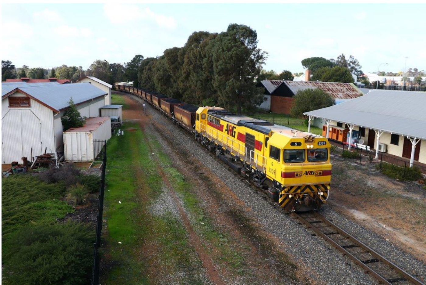
S3309 leads 5590 loaded Worsley coal through Collie en route to Hamilton Refinery, 23 rd July.