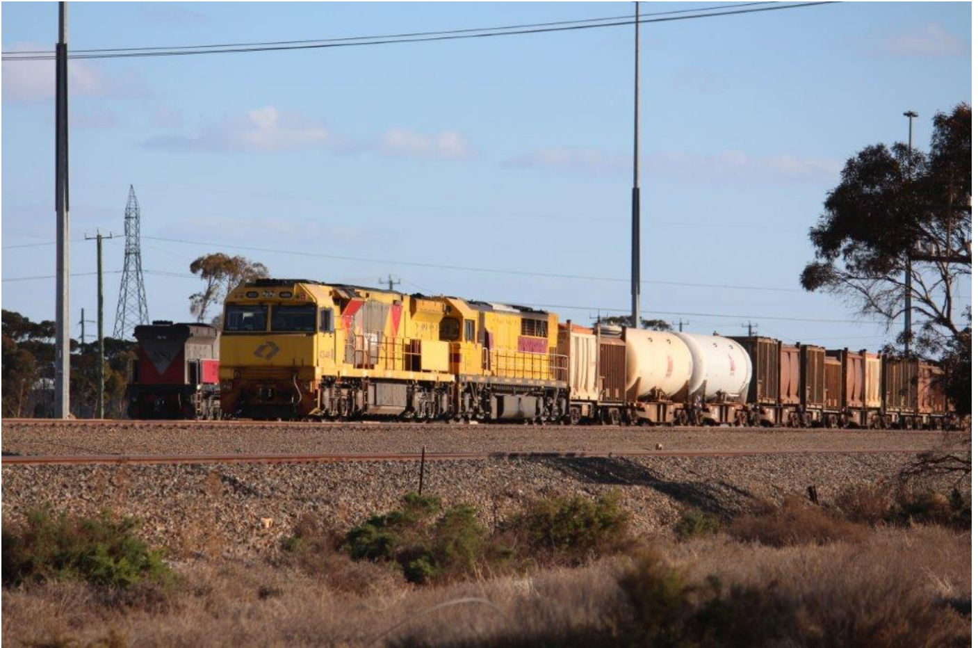
ACB4406 & Q4013 stabled on late-arrived 029 sulphur alongside MRL005, West Kal, 23 rd July.