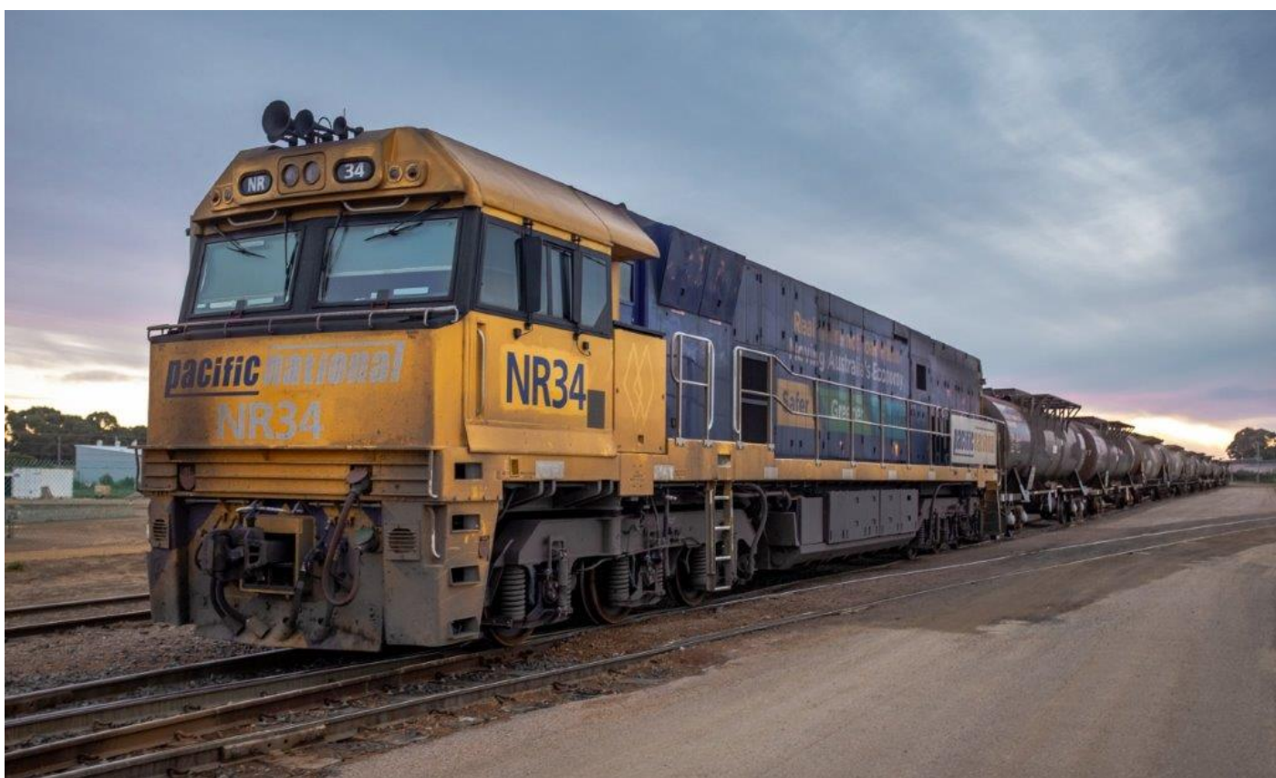
NR34 shunts the Viva fuel siding at Esperance, 21 st July.