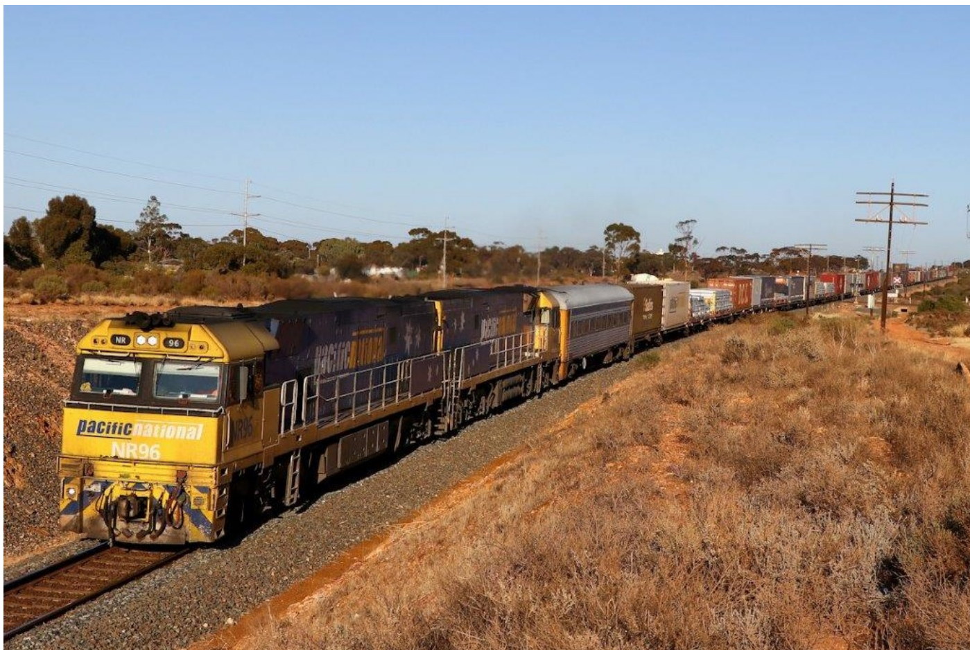
NRs 96 & 46 depart West Kalgoorlie with 4PM6, 2 nd July.