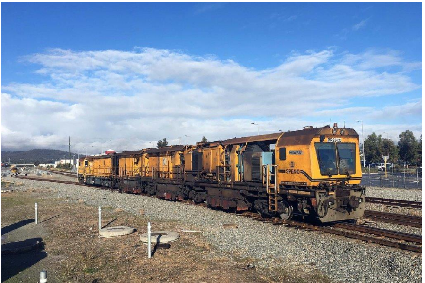
Speno rail grinder RRS2430 stands at Midland, 13 th July.