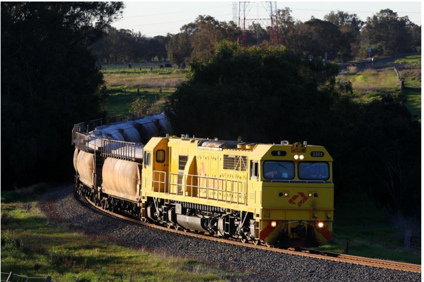
S3301 works 6271 loaded Worsley Alumina lime train to Hamilton around the triangle at Brunswick East, 24 th July.