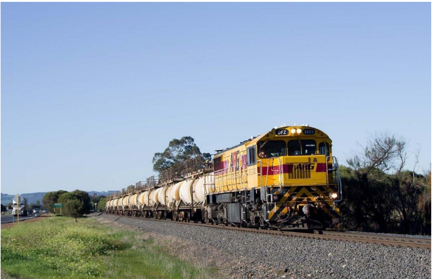
Former Queensland Railways unit DFZ2405 leads 6903 caustic near Picton, 3 rd July.