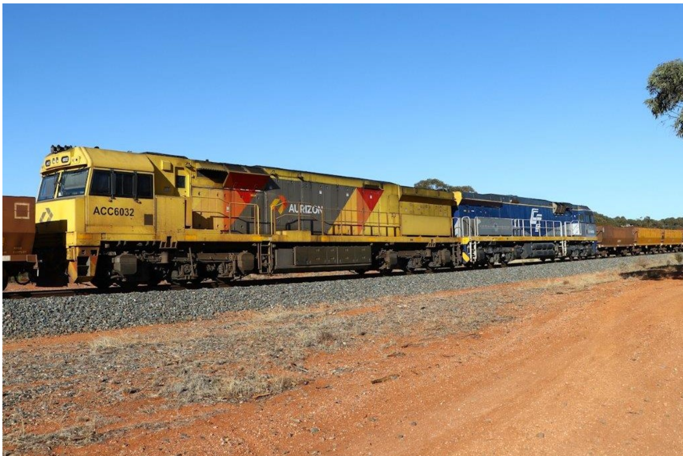
Distributed power on Aurizon's 5041 was ACC6032 & CF4405, Binduli, 2 nd July.