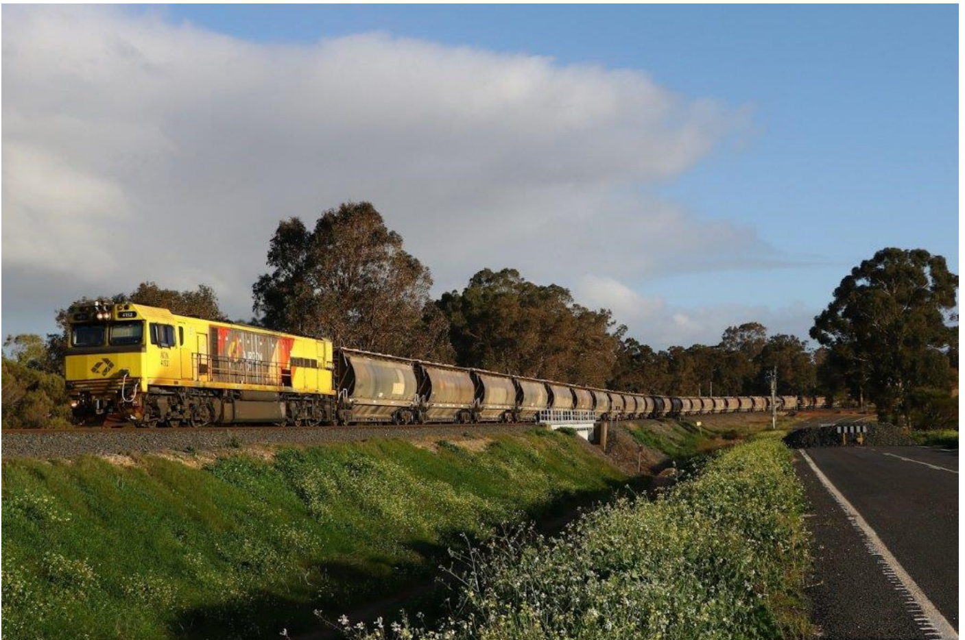
ACN4152 on 5833 empty alumina from Bunbury Port to Hamilton Refinery, Roelands, 23 rd July.