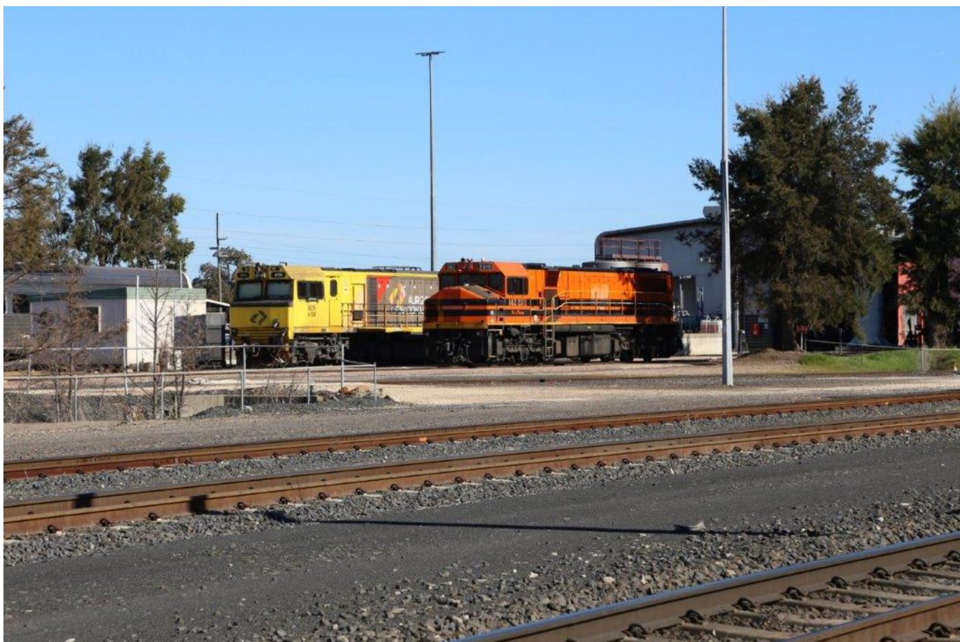
ACN4150 & DBZ2310 are stabled at Picton depot, 11 th July.