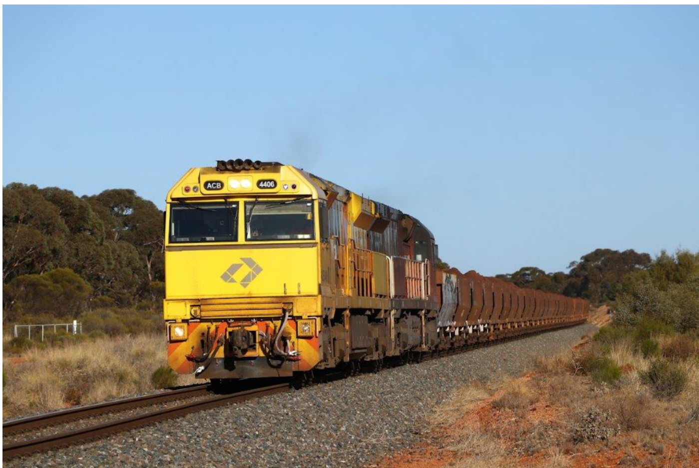
Aurizon's 5041 loaded ore approaches Binduli behind ACB4406 & MRL005, 2 nd July.