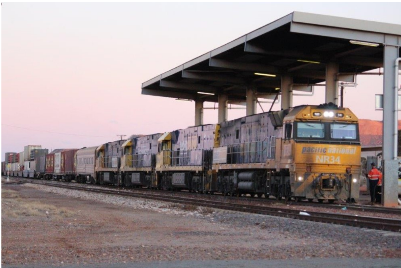
NRs 34, 98, 86 & 14 on 5MP5 have arrived at Parkeston at sunset, 18 th July.