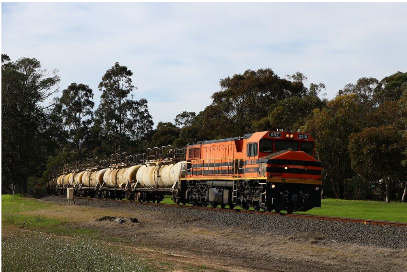
DBZ2310 passes through Burekup with 7923 empty caustic to Bunbury Port, 4 th July.