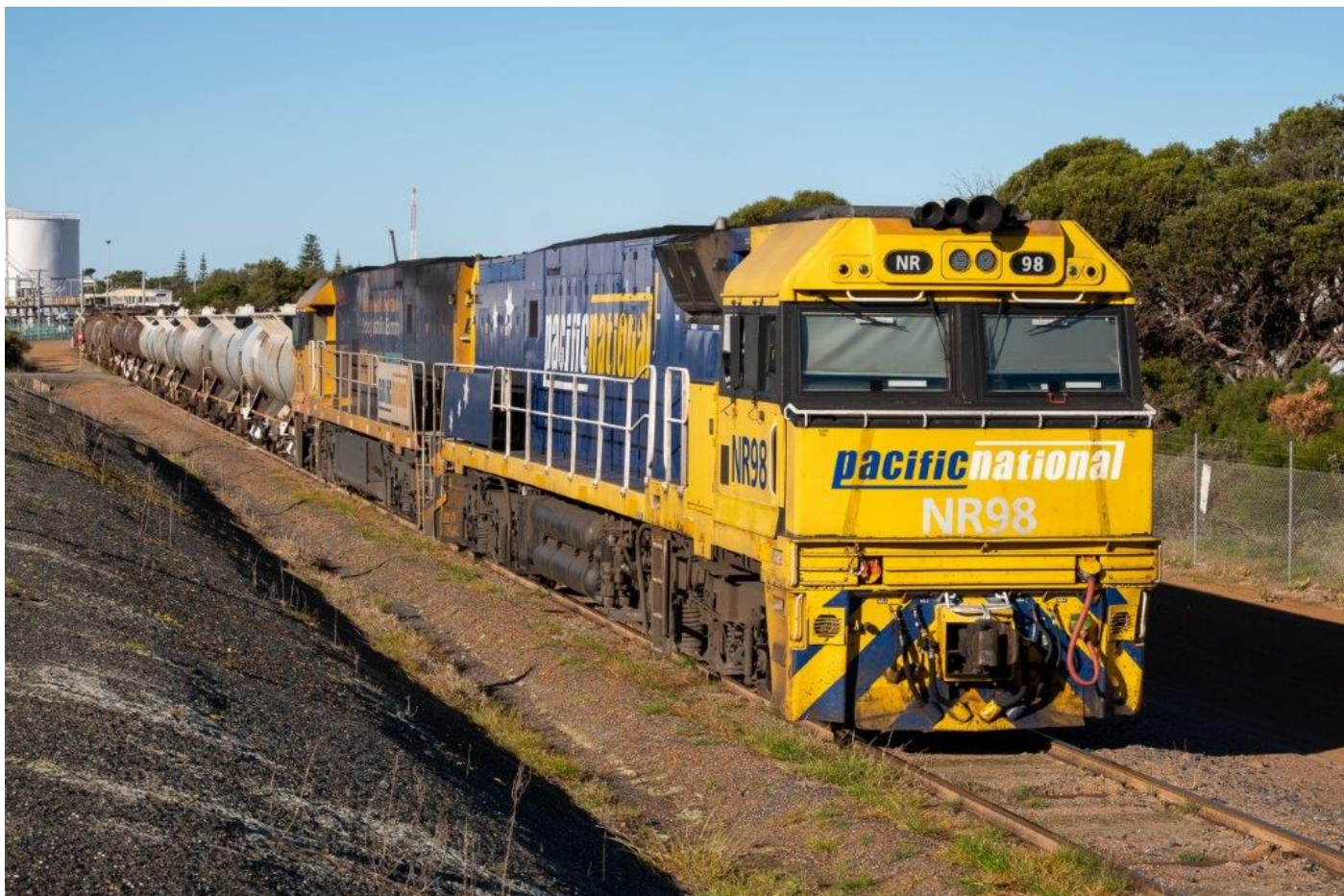
NRs 98 & 34 wait to depart the Viva siding at Esperance with 4446 fuel for West Kal, 22 nd July.