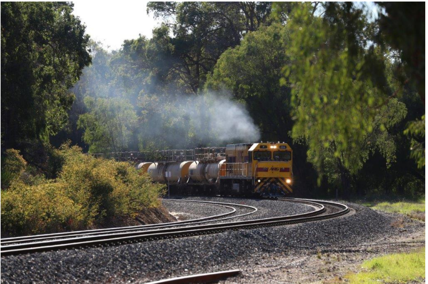
P2510 blows out the cobwebs as it hauls 7623 caustic near Beela, 11 th July.