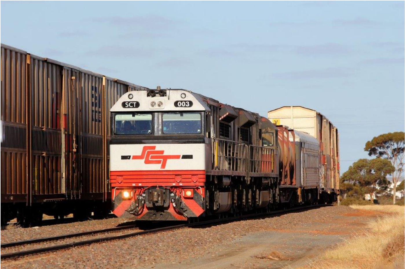
SCTs 003 & 005 on 2MP9 cross 3PG1 at Parkeston, 1 st July.