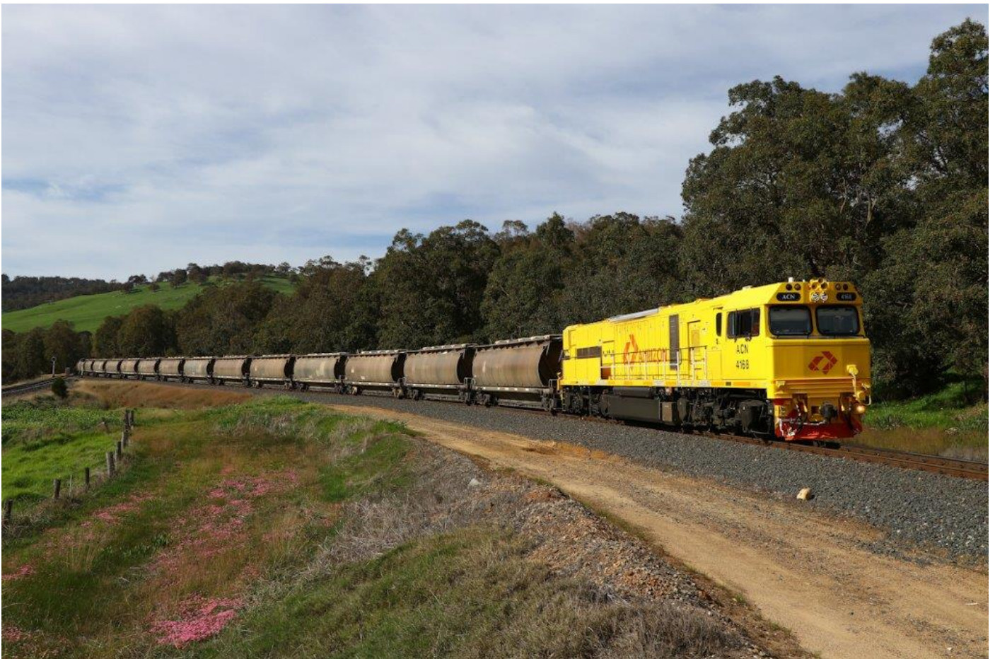
7842 loaded Worsley alumina to Bunbury passes through Brunswick Junction behind fresh repaint ACN4168, 4 th July.