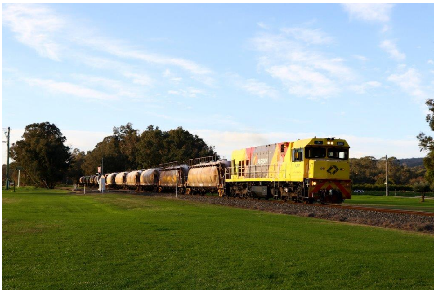
P2517 runs 7271 loaded lime to Hamilton arrives at Harvey, 4 th July.