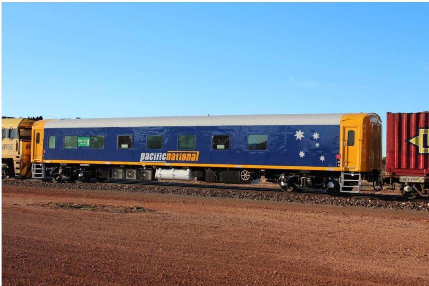
Stored two years ago, BRS222 has now been refurbished and returned to service, 5MP5, Parkeston, 4 th July.