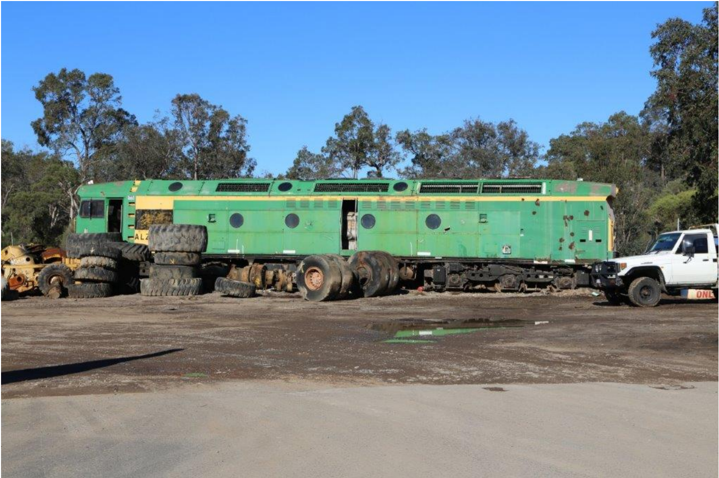
ALZ3208 lives on in the scrap yard of J&P group, Bunbury, 11 th July.