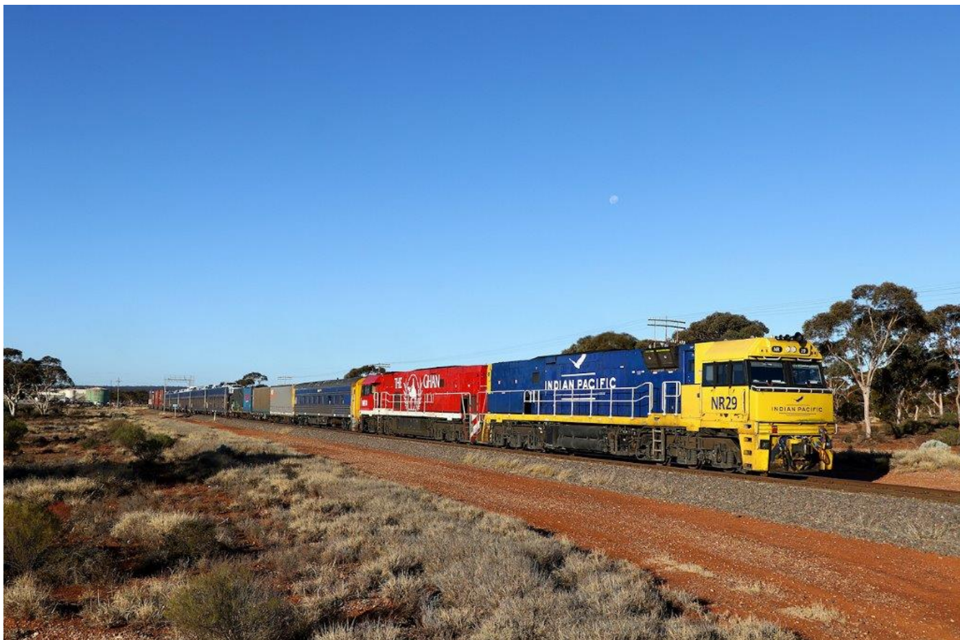
Passenger units NR29 (IP) and 74 (Ghan) get away from Parkeston with 3MP5, 2 nd July.