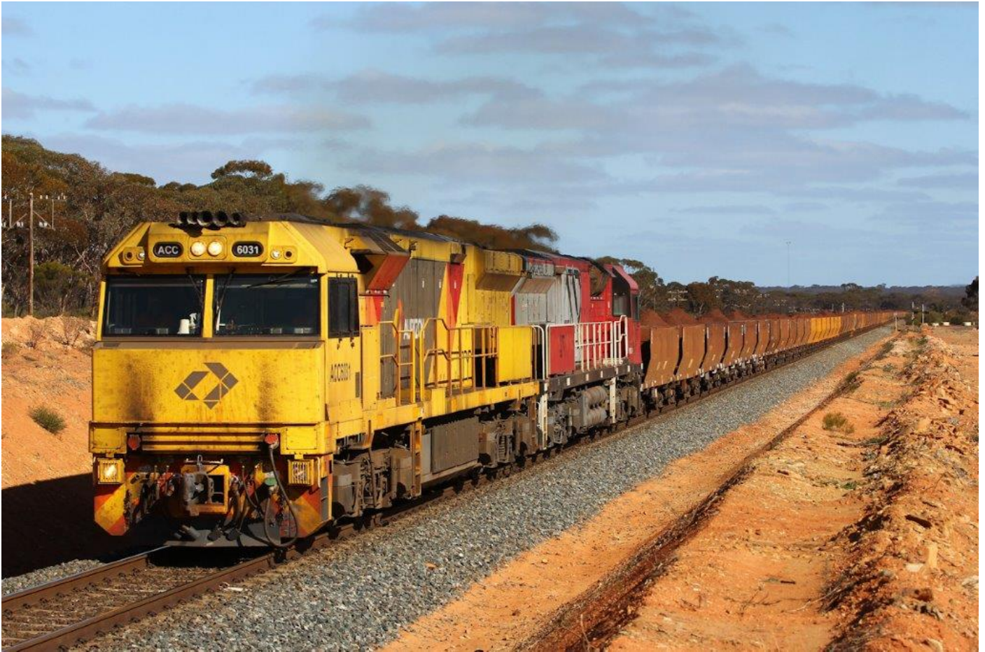
ACC6031 & MRL004 (above) lead Aurizon-crewed 4041 ore across Kundana Road just east of Kurrawang, 1 st July, with DPU AC4303 & MRL001 (below).