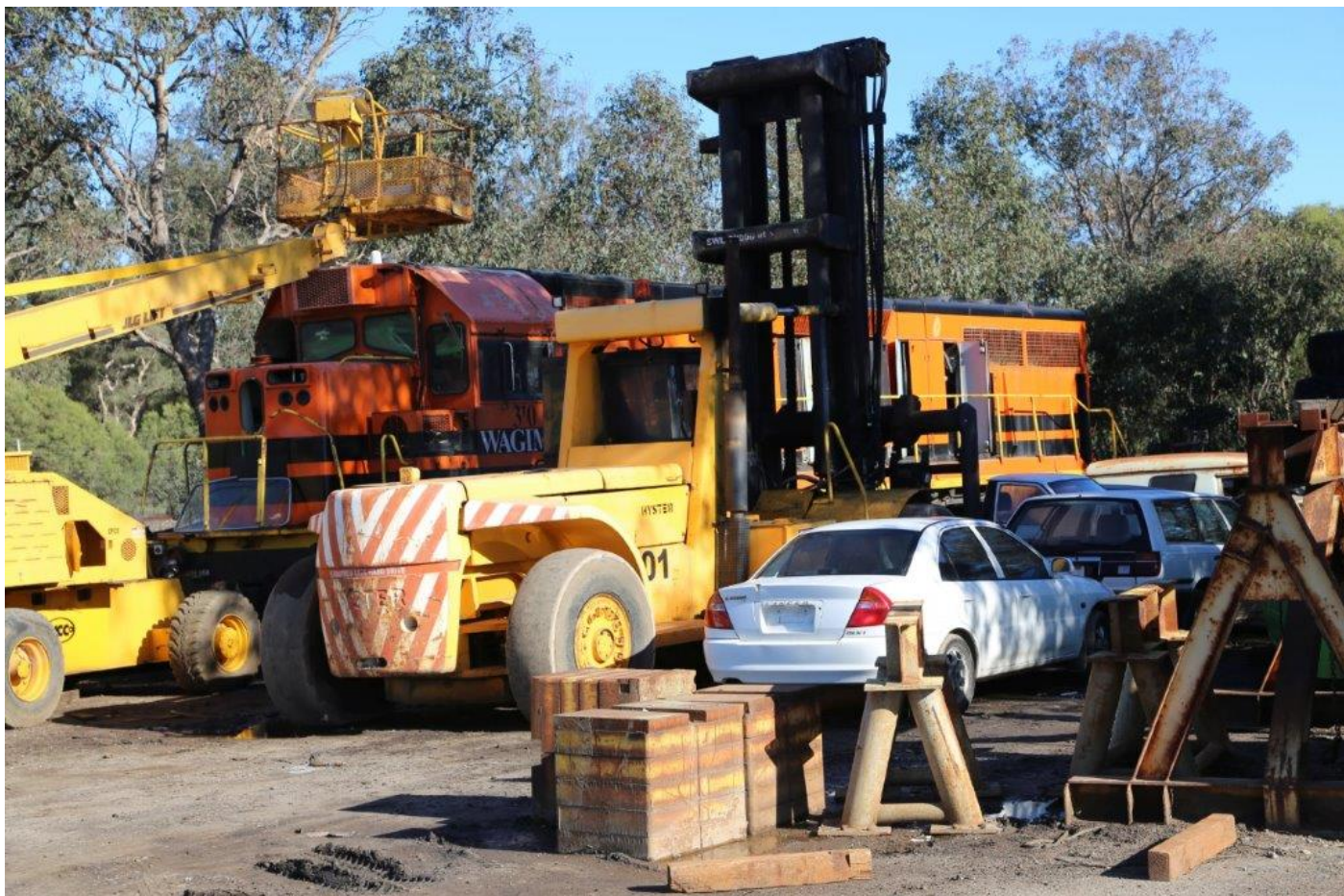
L3102 (former L257) still exists more than a decade after withdrawal in J&P's Paradise Yard, Bunbury, 11 th July.