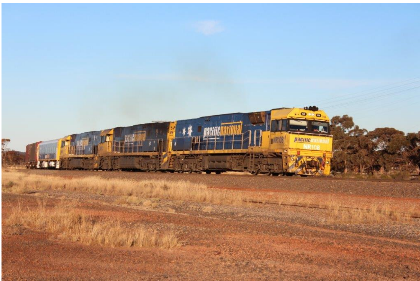
NRs 108, 82 & 66 depart Parkeston with 5MP5, 4 th July.