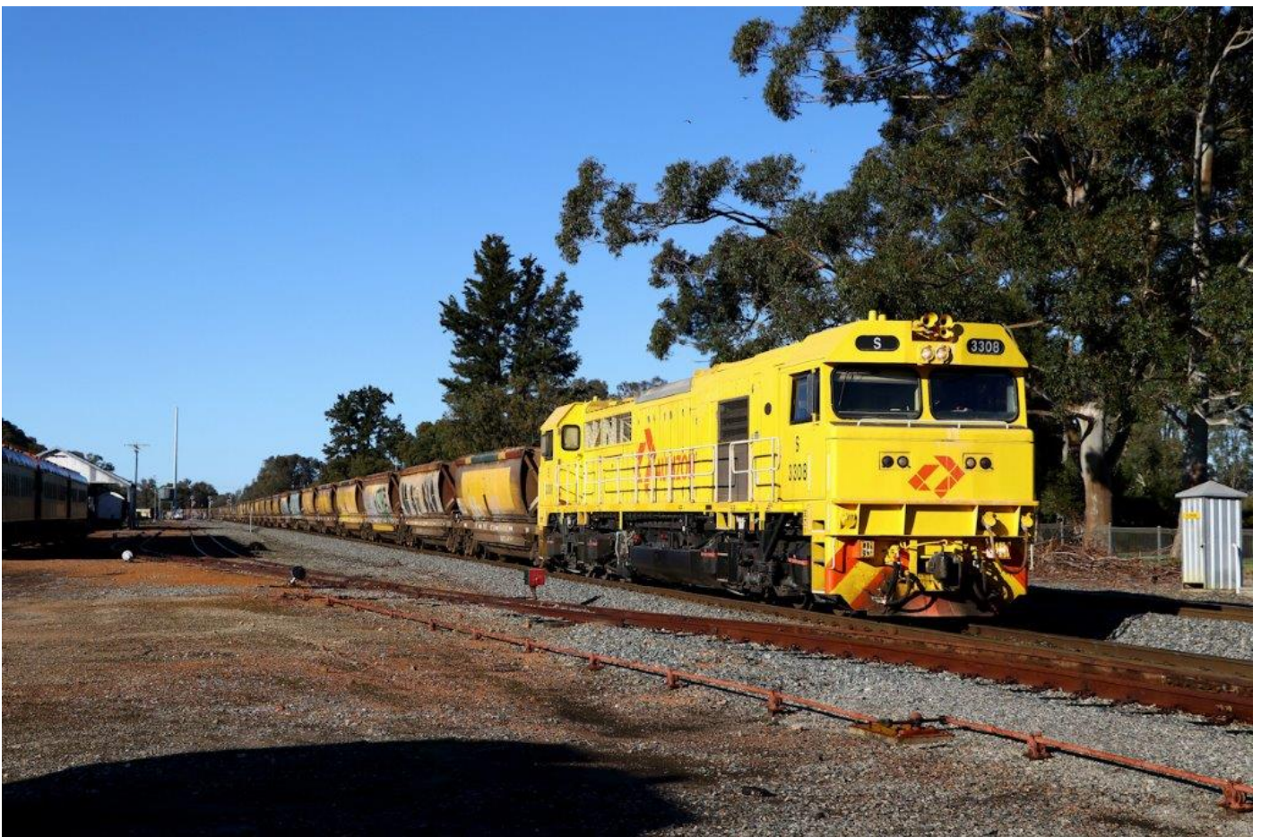
1968 loaded bauxite arrives at Pinjarra behind S3308, 26 th July.