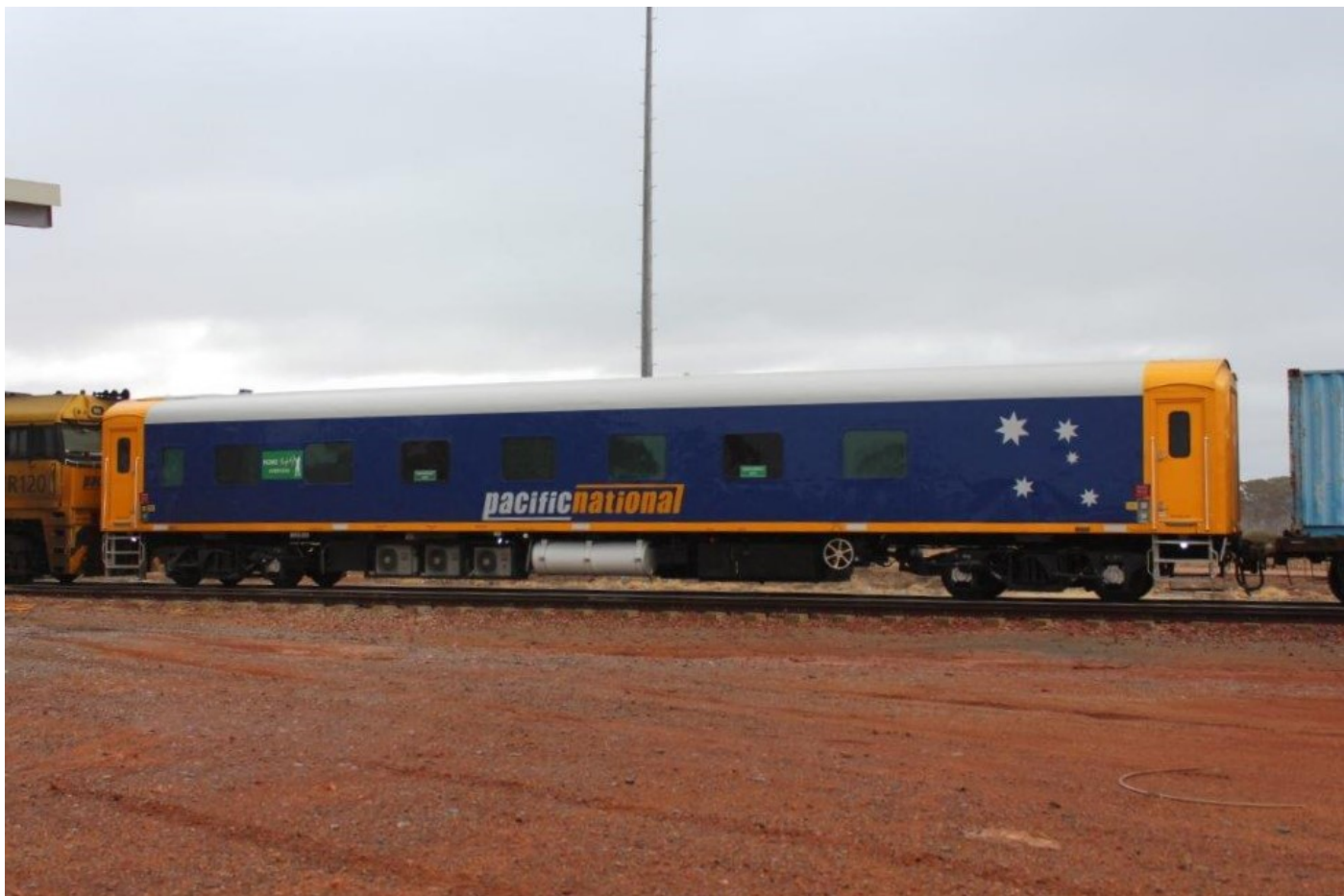
BRS221 has followed BRS222 through refurbishment and repaint – Parkeston, 16 th August.