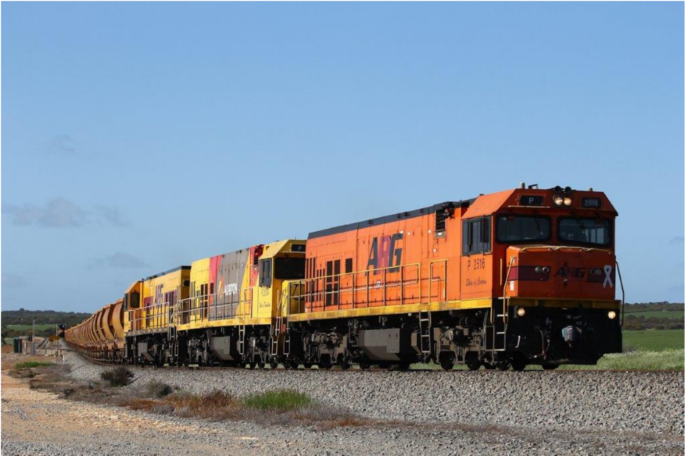
7721 loaded Mt Gibson ore departs Monger behind Ps 2516, 2504 & 2514, 29 th August.