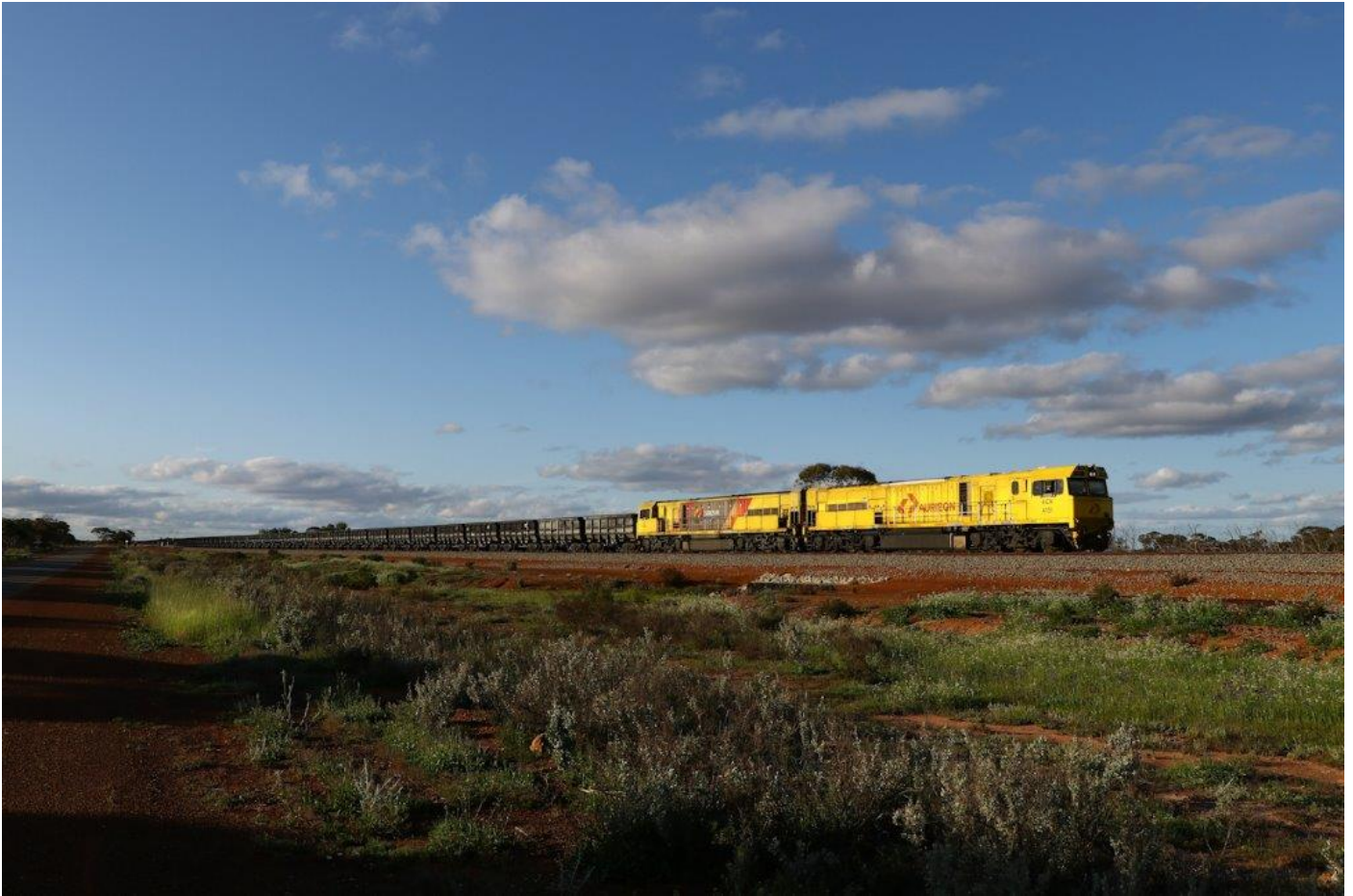
ACNs 4151 & 4142 haul 1762 empty Karara ore near Bell, 23 rd August.