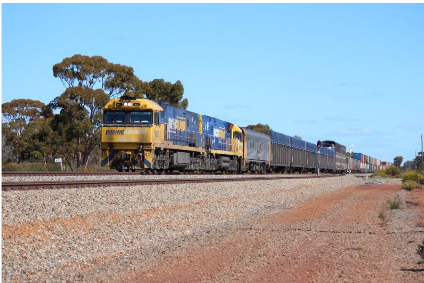
NRs 50 & 89 on 6PM6 slow for the weighbridge ahead, Bonnie Vale, 29 th August.