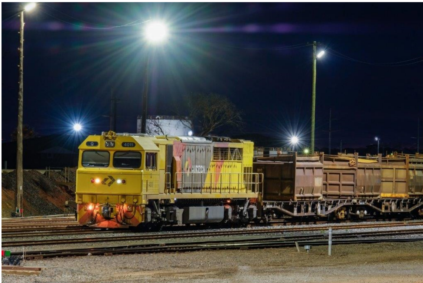
Q4011 rests between shunting duties, West Kalgoorlie, 22 nd August.