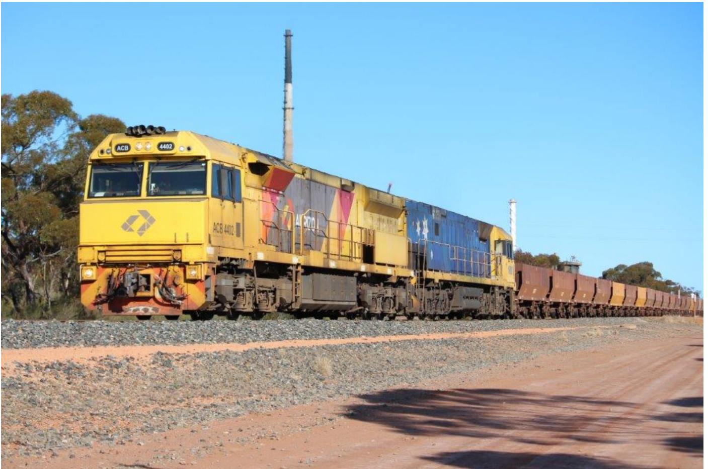
7030 empty ore departs Hampton, led by ACB4402 & NR81, 29 th August.