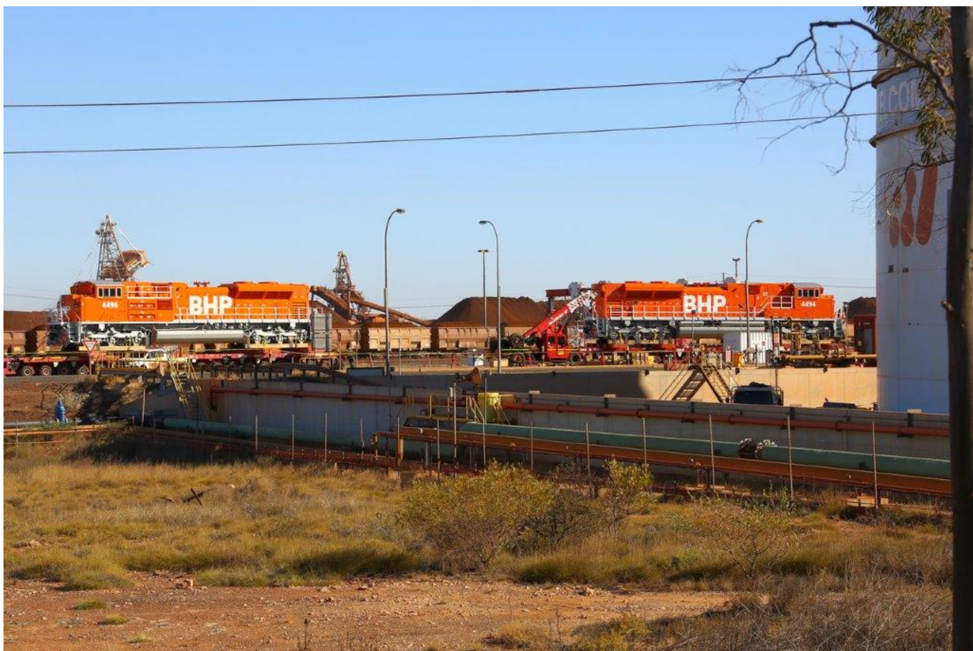
4496 & 4494 on the self-propelled modular transporters at Nelson Point, 23 rd August.