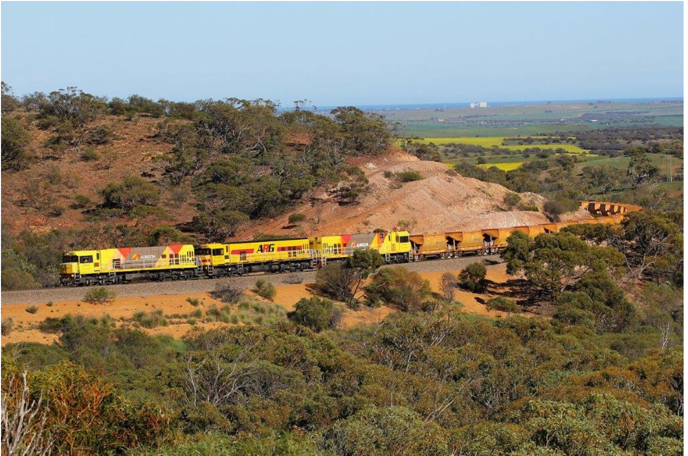
7720 empty Mt Gibson ore climbs through Bringoo behind Ps 2505, 2508 & 2506, 8 th August.