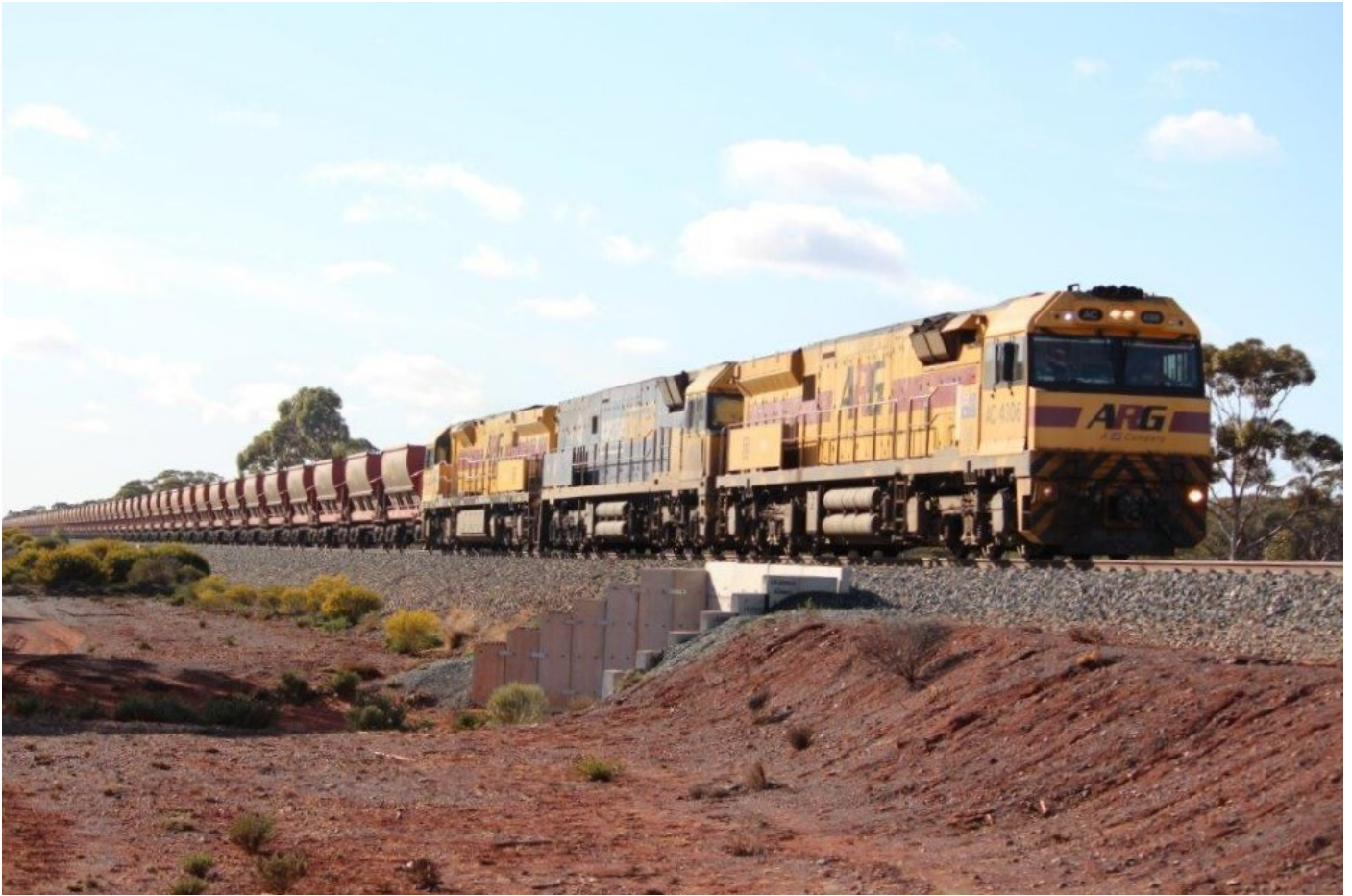
AC4306, NR71 & AC4301 approach Bonnie Vale with 6044 empty ore, 29 th August.