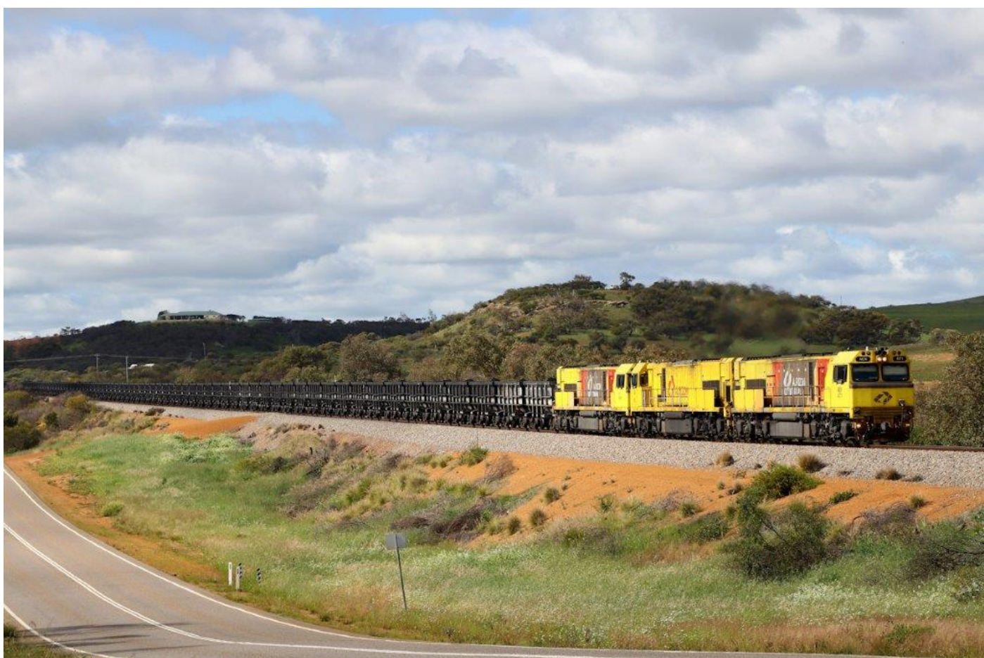
6761 loaded Karara ore is led through Bringo by ACNs 4171, 4151 & 4149, 14 th August.