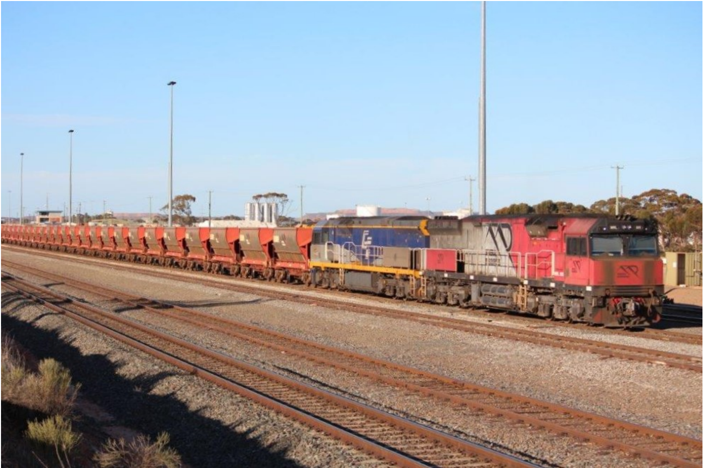
MRL005 & CF4407 and MHPY rake, 19/8, at West Kal for two weeks, no room at Esperance.