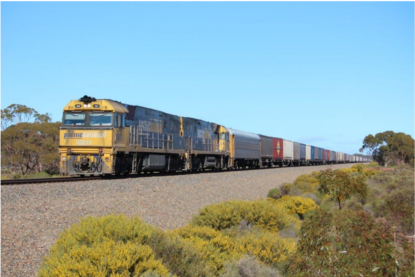
6PM7 midway between Bonnie Vale and West Kalgoorlie, NRs 11 & 117, 29 th August.