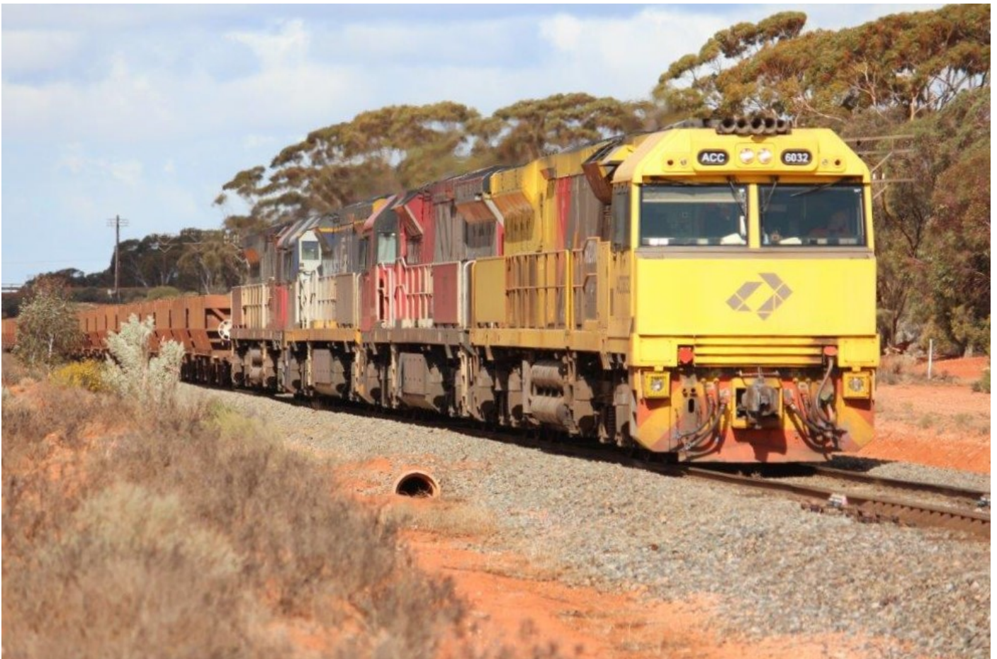
1040 empty ore at Binduli, 16 th August. ACC6032, MRL004 & CF4408 will detach MRL003.