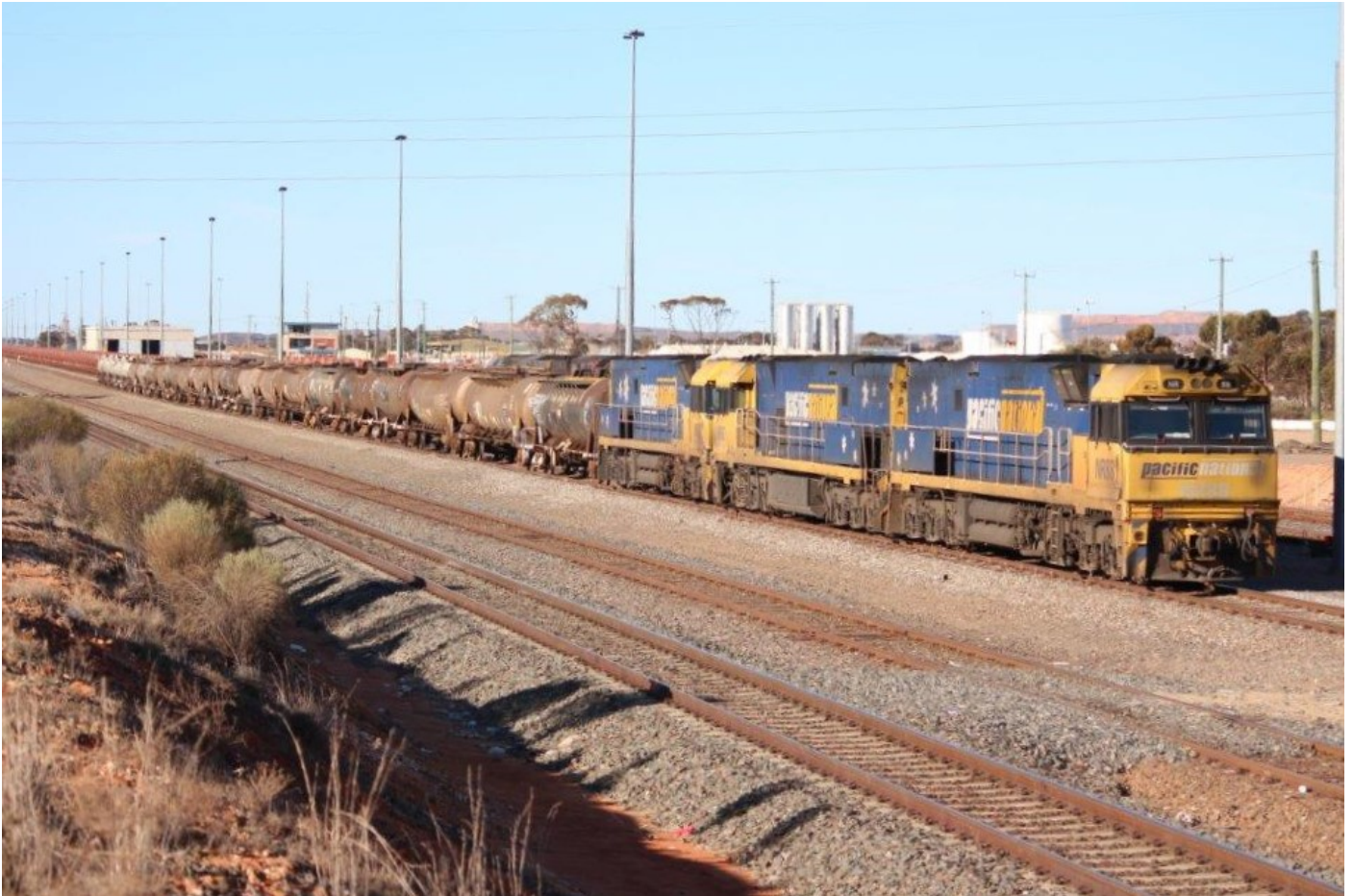
NRs 88, 87 & 71 on 5445 empty fuel for Esperance, NR71 to Kooly ore work, 20/8.