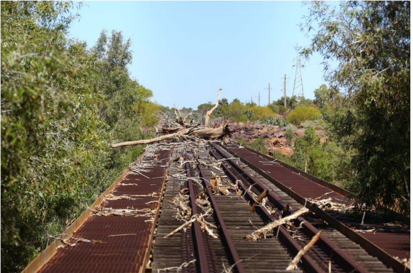
Looking west across the De Grey River bridge on the disused Yarrie line, 13 th August.