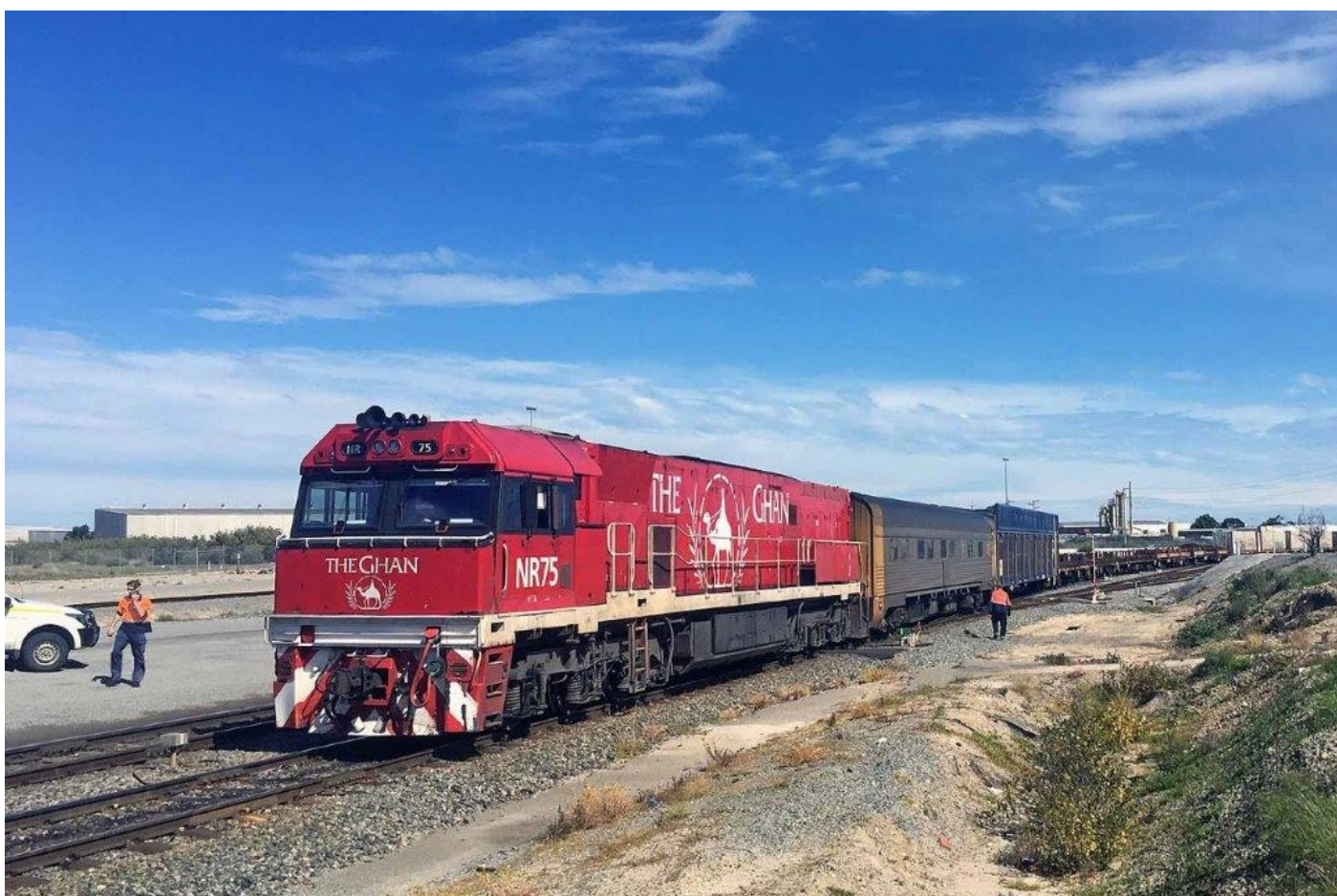
NR75 prepares to depart Kewdale with 7PX4, 15 th August.