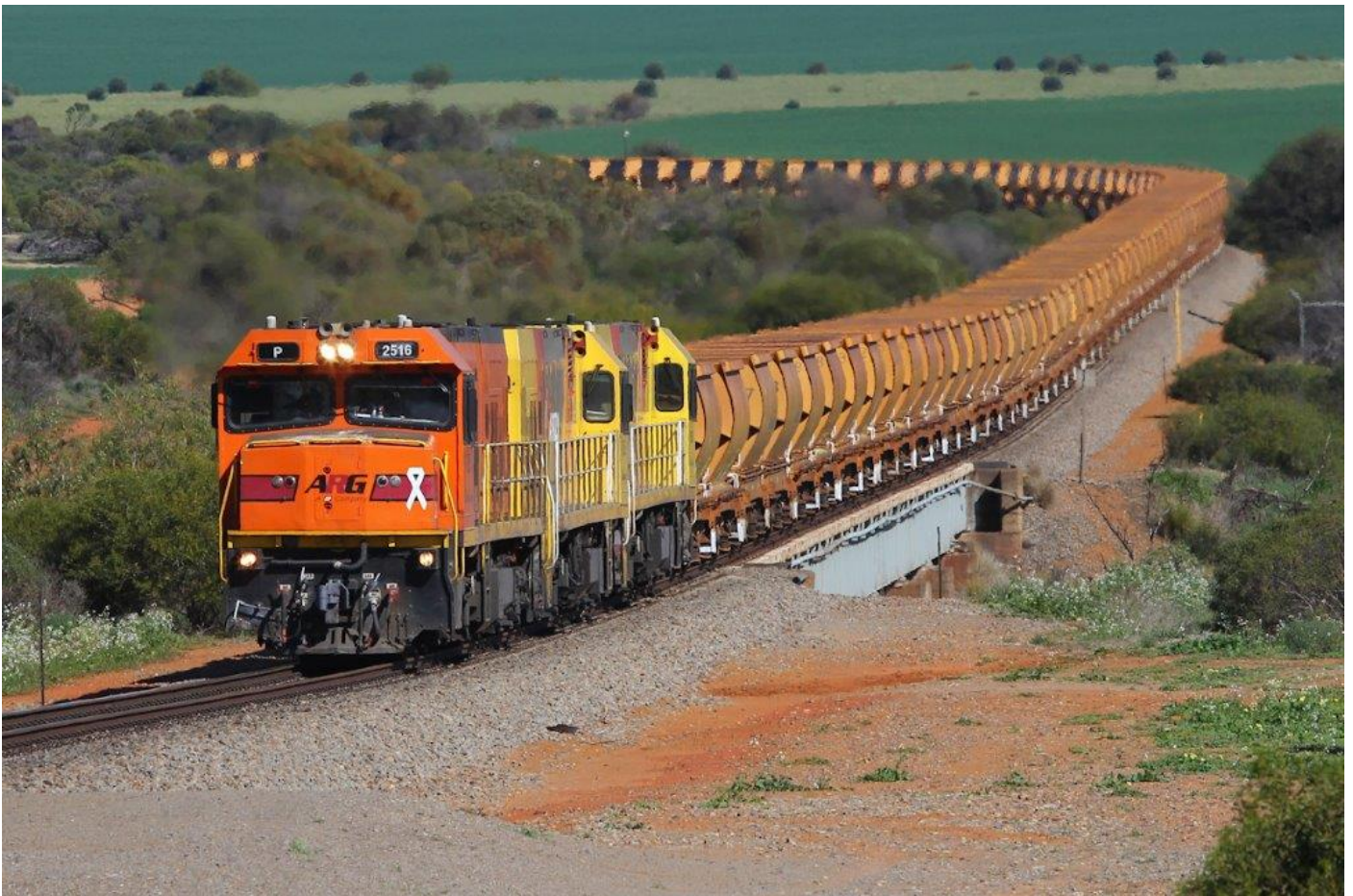
1720 empty Mt Gibson ore crosses the Greenough River at Eradu, behind Ps 2516, 2506 & 2505, 2 nd August.