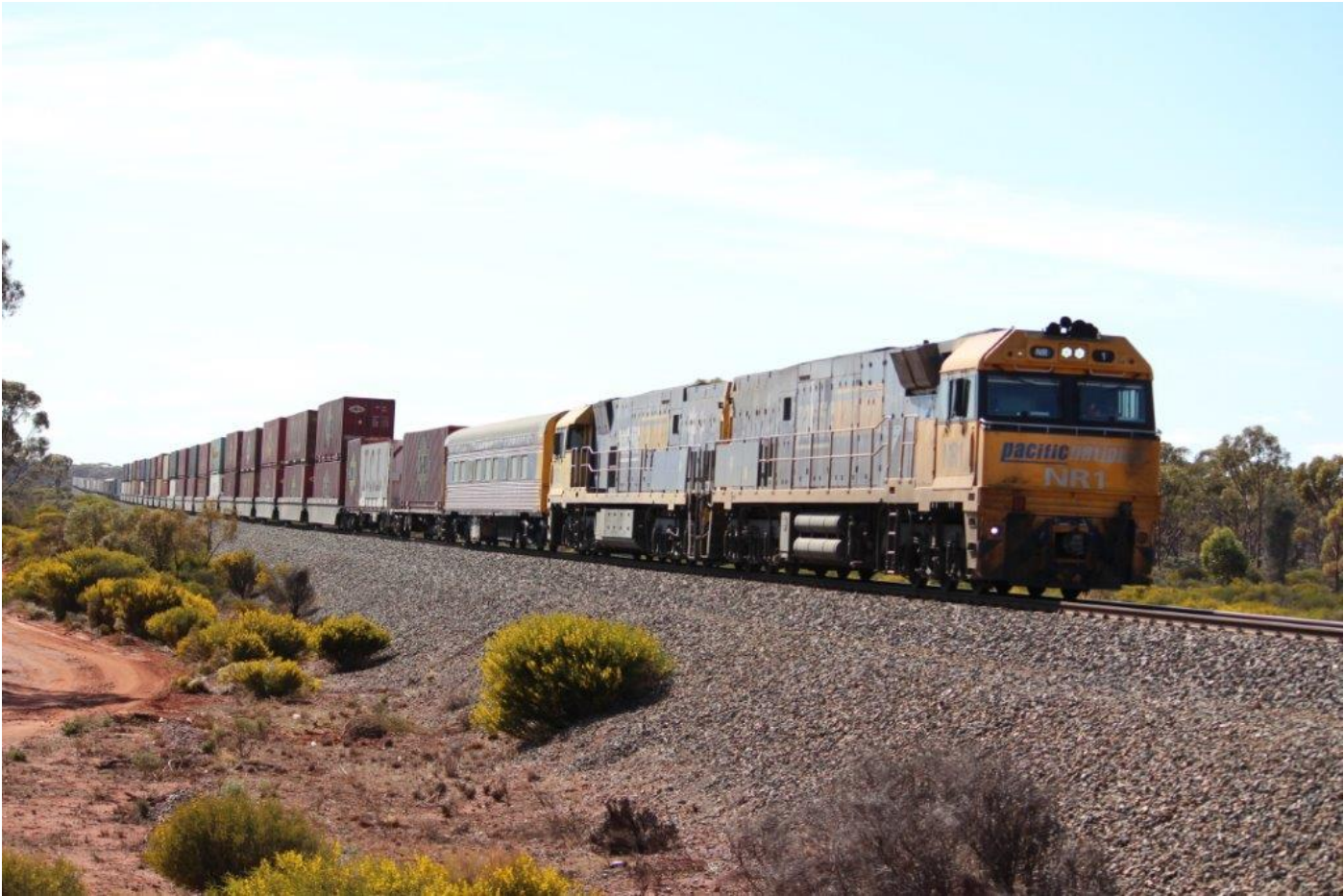
NRs 1 & 21 lead 5SP5 between West Kal and Bonnie Vale, 29 th August.