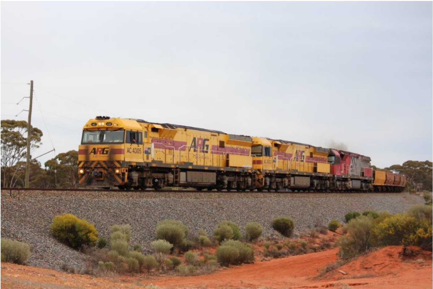
ACs 4305 & 4303 with MRL004 arrive at Binduli with 7043 loaded ore, 22 nd August.