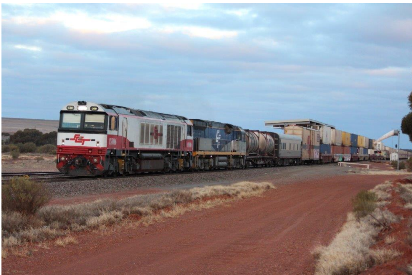
Extra service 2AP9 arrives at Parkeston near sunset, led by CSR006 & CF4410, 18 th August.