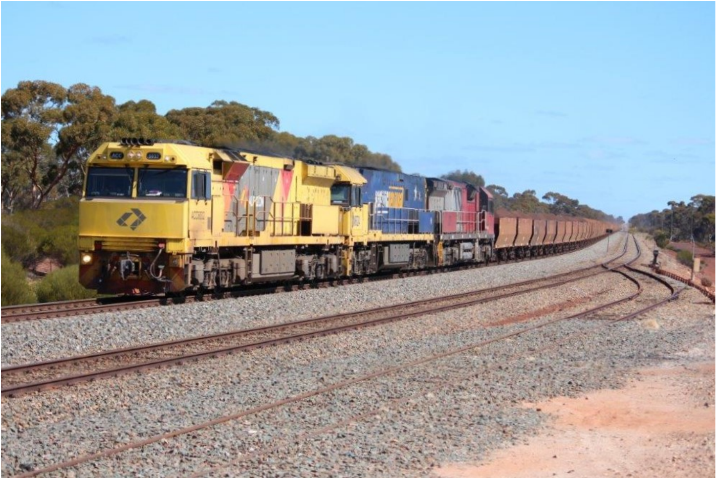
ACC6032, NR24 & MRL006 run along Bonnie Vale main with 7043 ore, 29 th August.