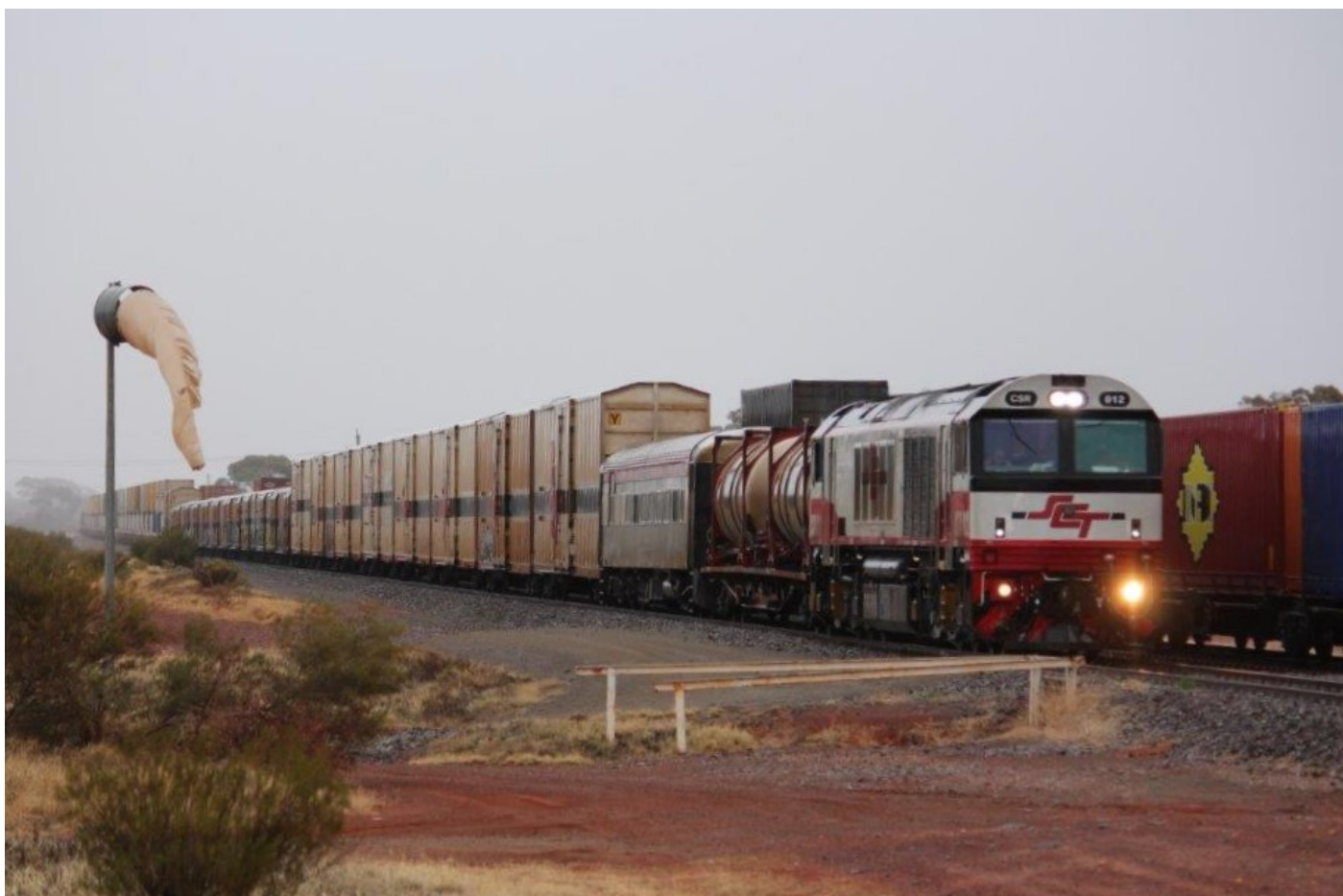
Solo CSR012 leads extra service 7PA9 through drizzle at Parkeston, 16 th August.