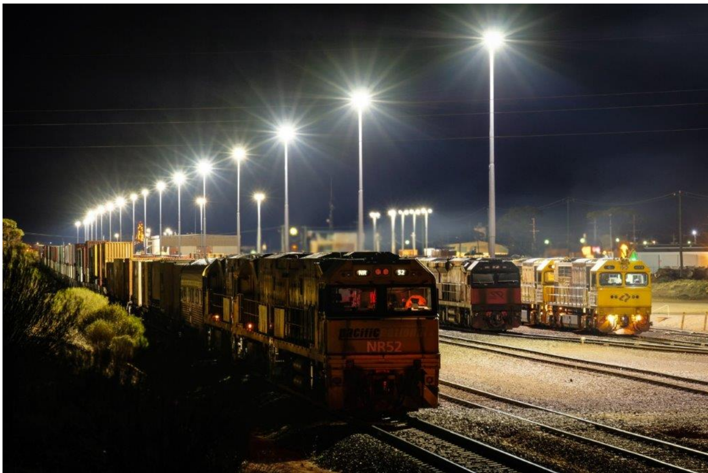
NRs 52, 121 & 68, 5MP5 on main; MRL005 & CF4407 stabled; Qs 4009 & 4003, 7426; West Kalgoorlie, 22 nd August.