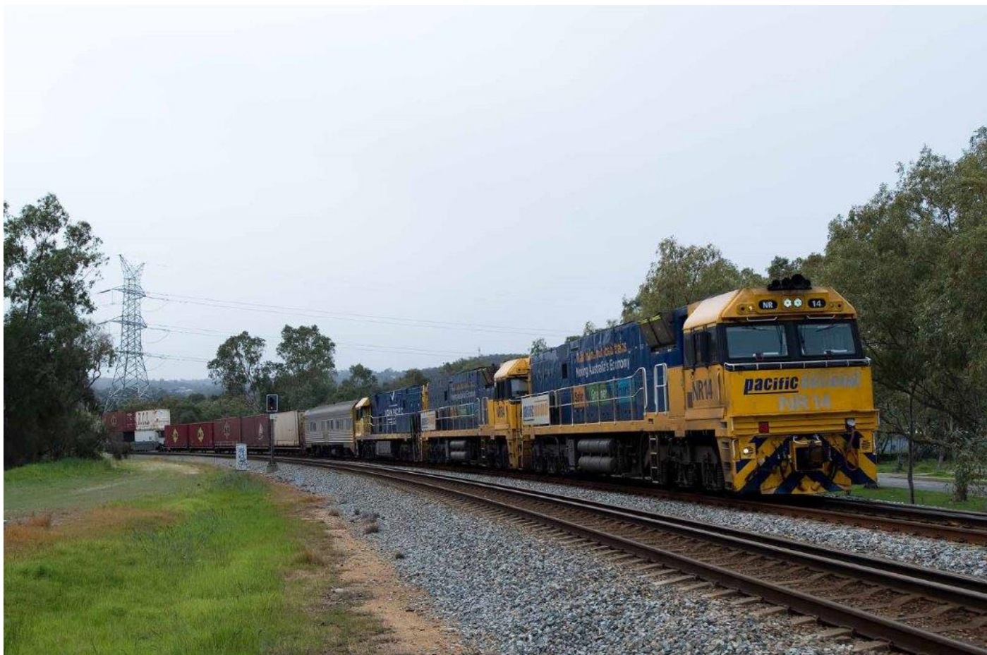
Rail advertising NRs 14 & 84 lead Indian Pacific NR26 on 6MP5, Bellevue, 17 th August.