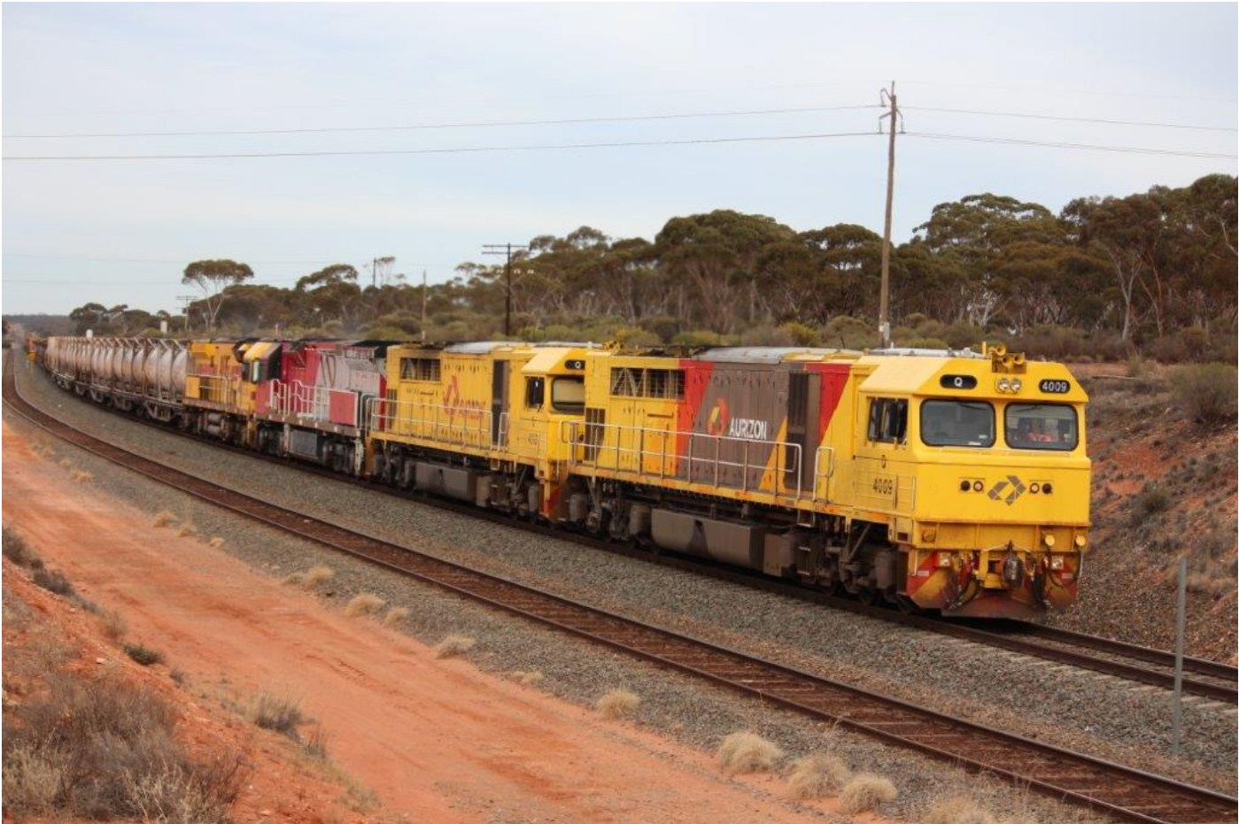
6025 ex Perth approaches West Kal, 22 nd August. Qs 4009 & 4003 haul MRL002 & AC4301 back from workshops. Page 12 of 26