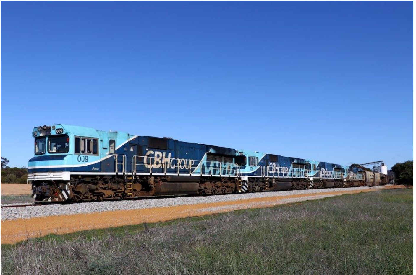
CBHs 009, 025, 011 & 006 load 6K05 grain at Brookton, 1 st August.