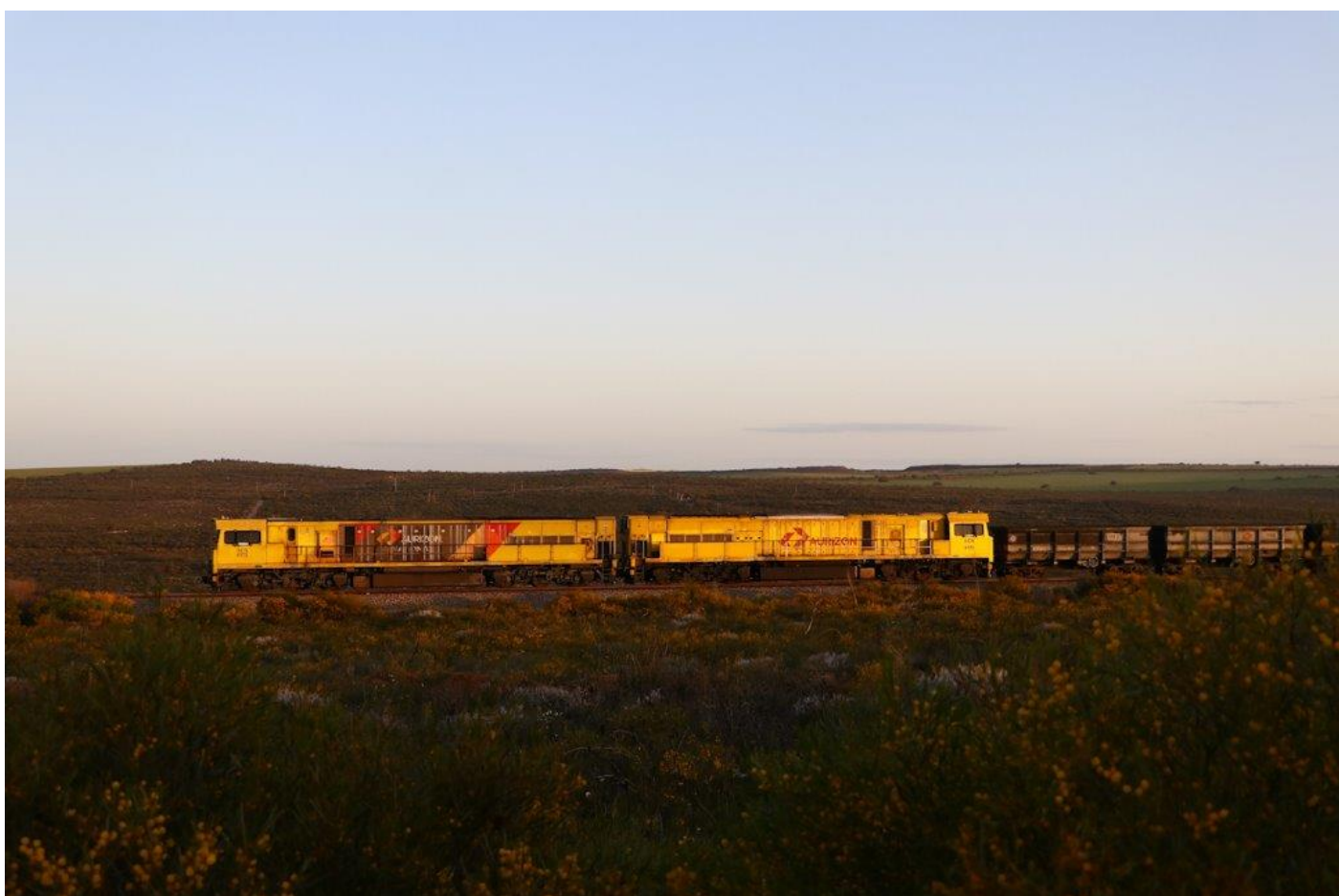
The evening sun gleams on ACNs 4172 & 4151 on 7764 empty Karara ore, Wicherina, 29 th August.