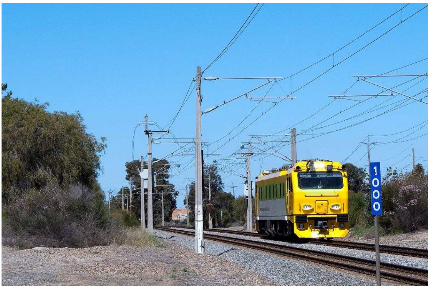
Track recorder car IDV001 at Oats St, 27 th August.