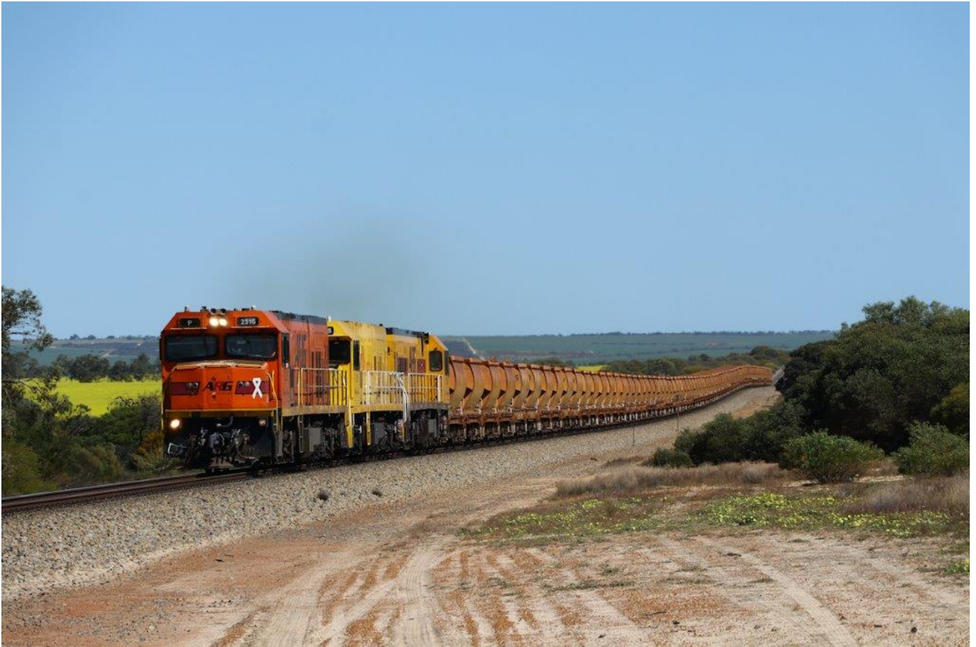
Ps 2516, 2515 & 2508 blast through Ambania with 1720 empty Mt Gibson ore, 30 th August.