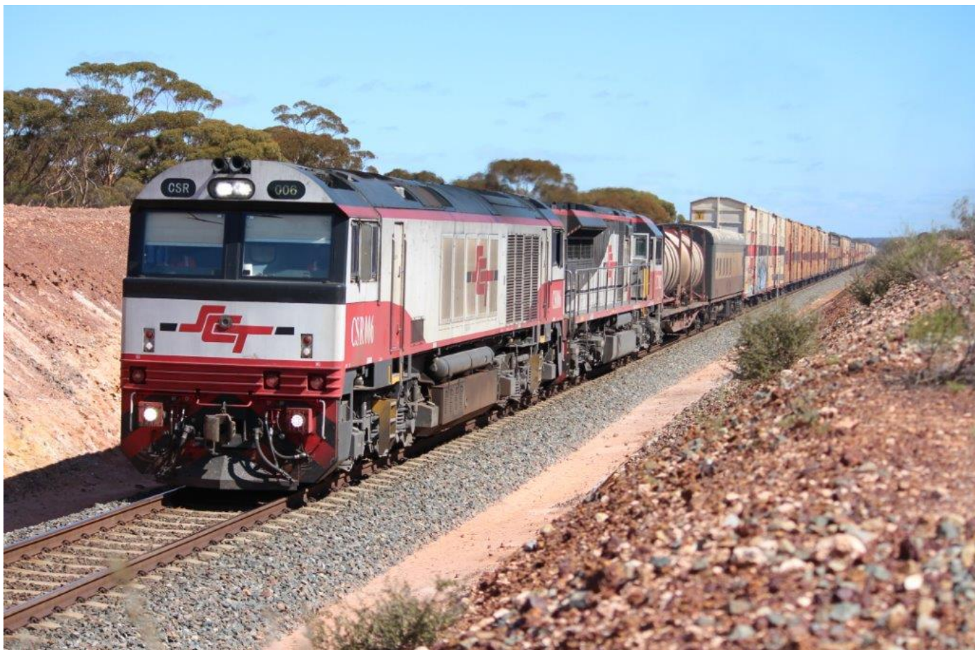
CSR006 & SCT003 accelerate 6PM9 away from the Bonnie Vale weighbridge, 29 th August.