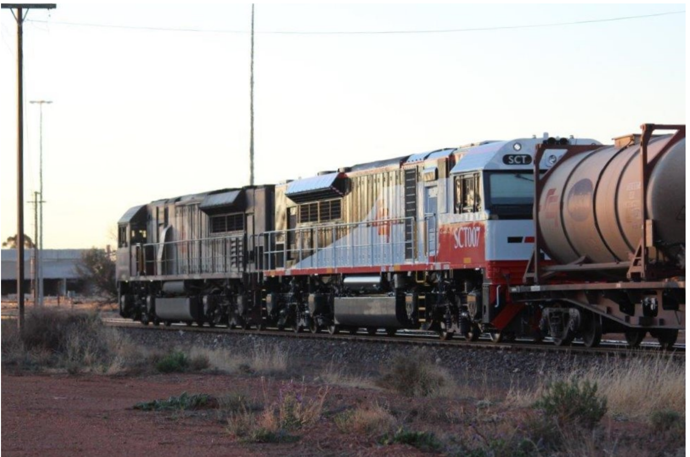
Freshly overhauled SCT007 trails SCT010 into Parkeston with 5MP9, 8 th August.