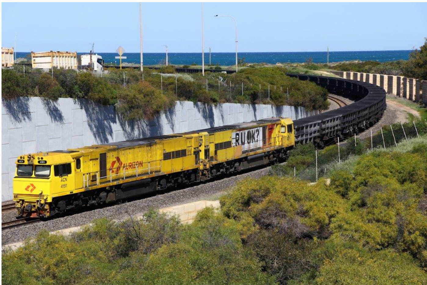
4764 empty Karara ore departs Geraldton Port with ACNs 4143 & 4151 on the rear, 26 th August.