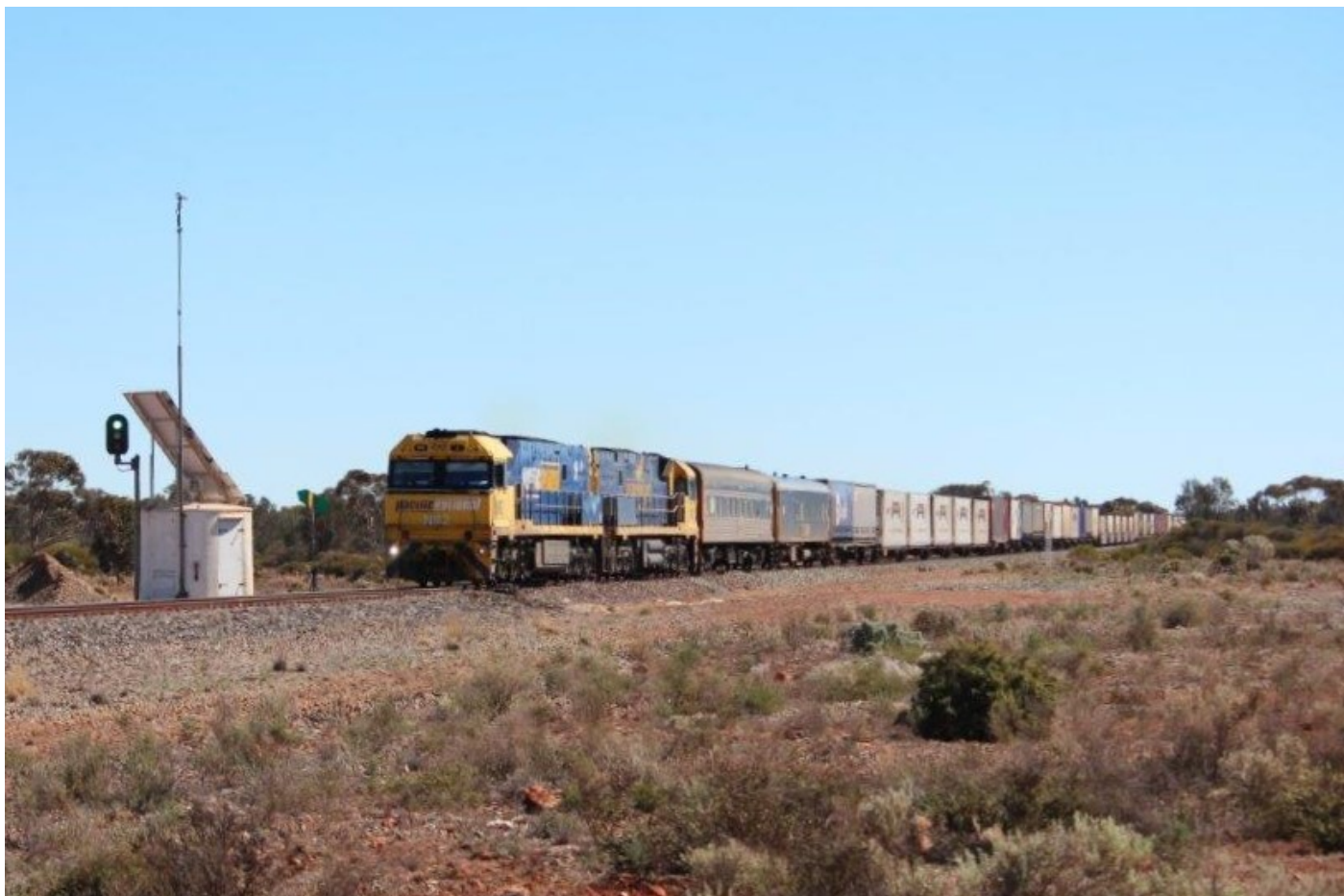
The silence at Golden Ridge is disturbed by NRs 2 & 28 on 6PM7, 15 th August.