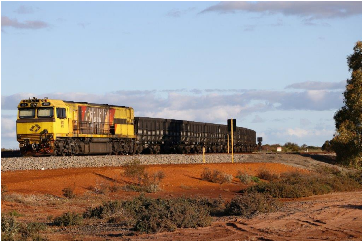
ACN4170 is the rear DPU on 1762 empty Karara ore, Tilley Junction, 23 rd August.