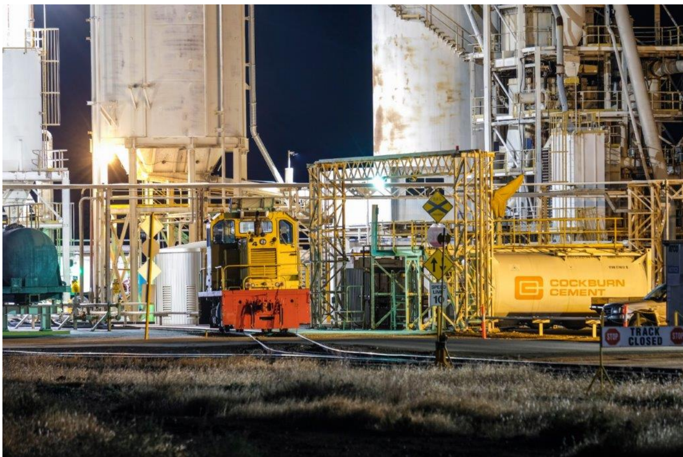
Former BHP49 sleeps at Cockburn Cement's Parkeston plant, 22 nd August.