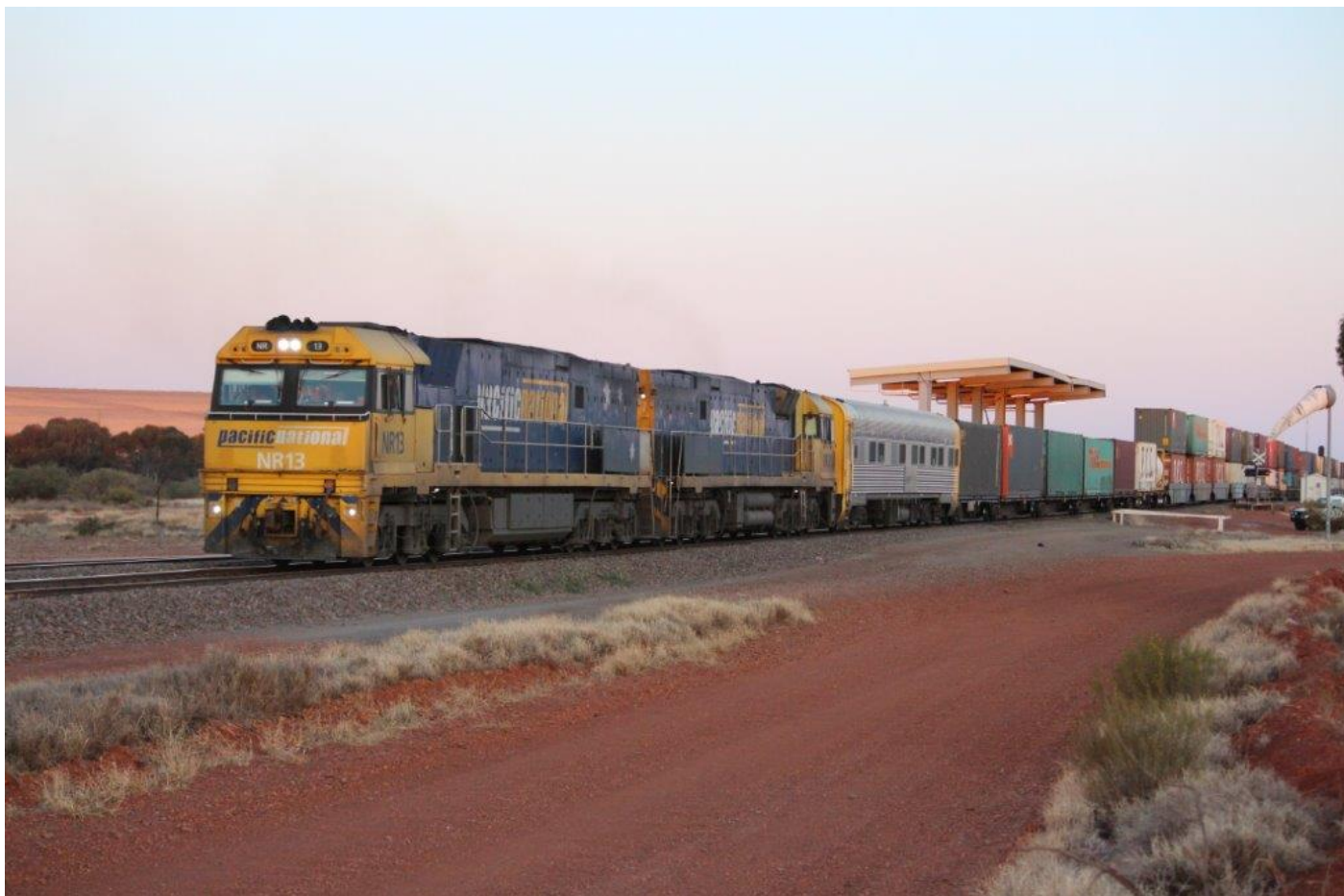
The sun is setting as 5MP5 arrives at Parkeston, led by NRs 13 & 120, 29 th August.