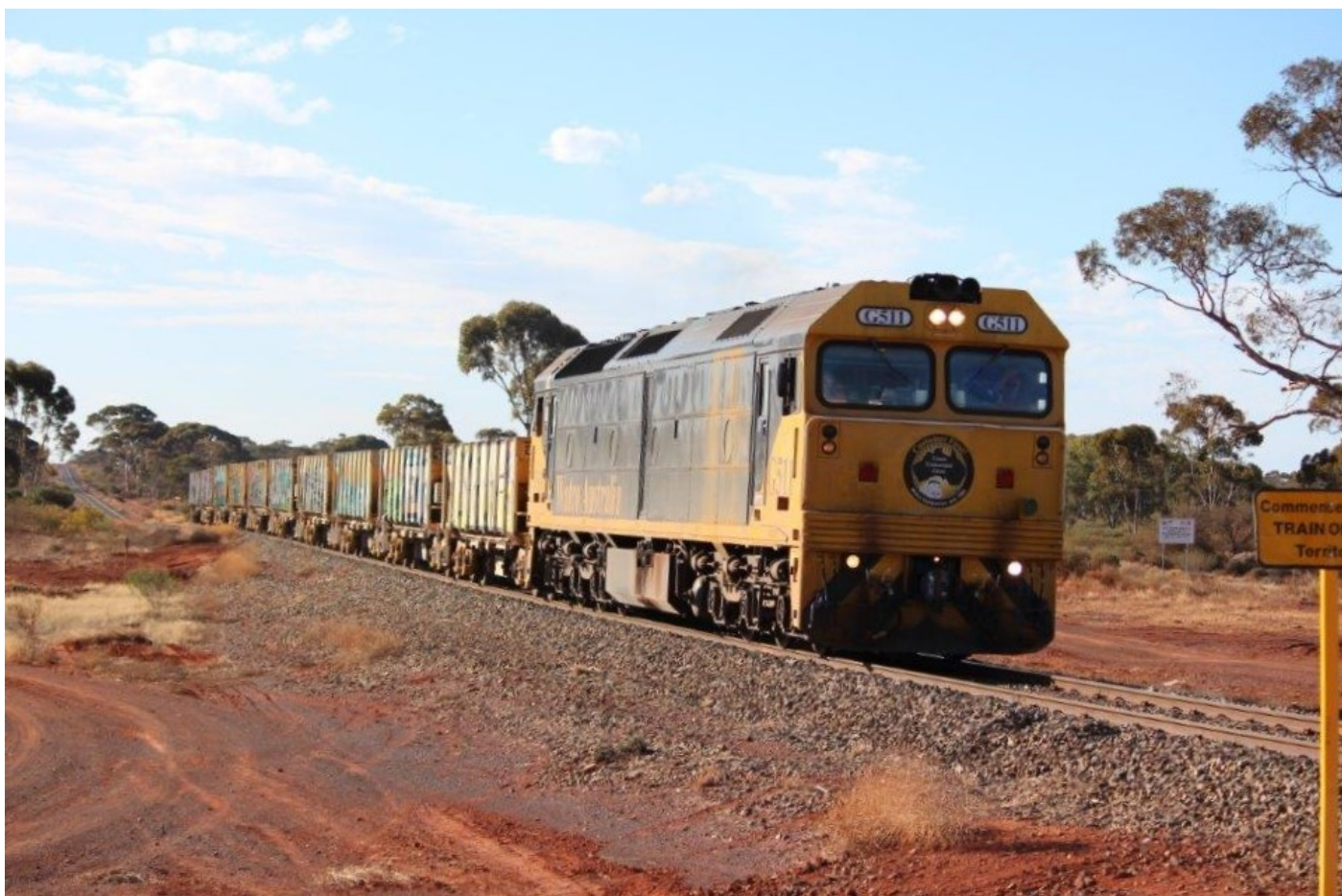
6BT1 approaches the outskirts of Kalgoorlie on the Leonora line, 28 th August.