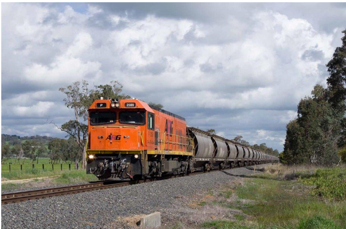
P2509 leads 7866 through Wokalup, 22 nd August.