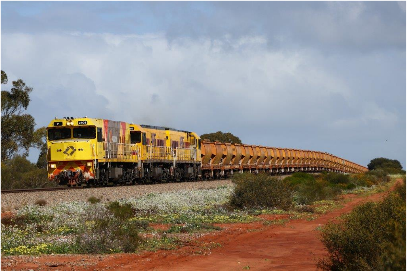
Ps 2505, 2508 & 2502 crest a grade at Tenindewa with 1720 empty Mt Gibson ore, 16 th August.