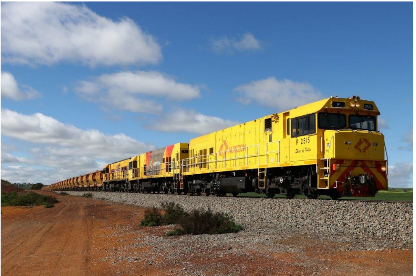
Ps 2515, 2504 & 2502 on 4721 loaded Mt Gibson ore at Moonyoonooka, 5 th August.