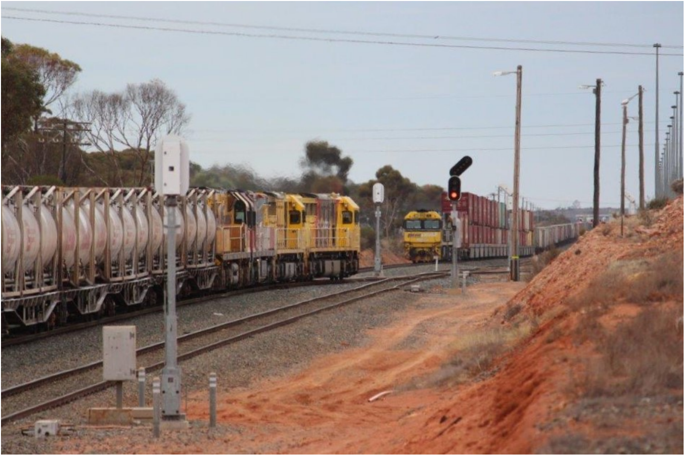
7025 enters West Kal yard as 5SP5 (NRs 78 & 40) arrives on the main line, 22 nd August.