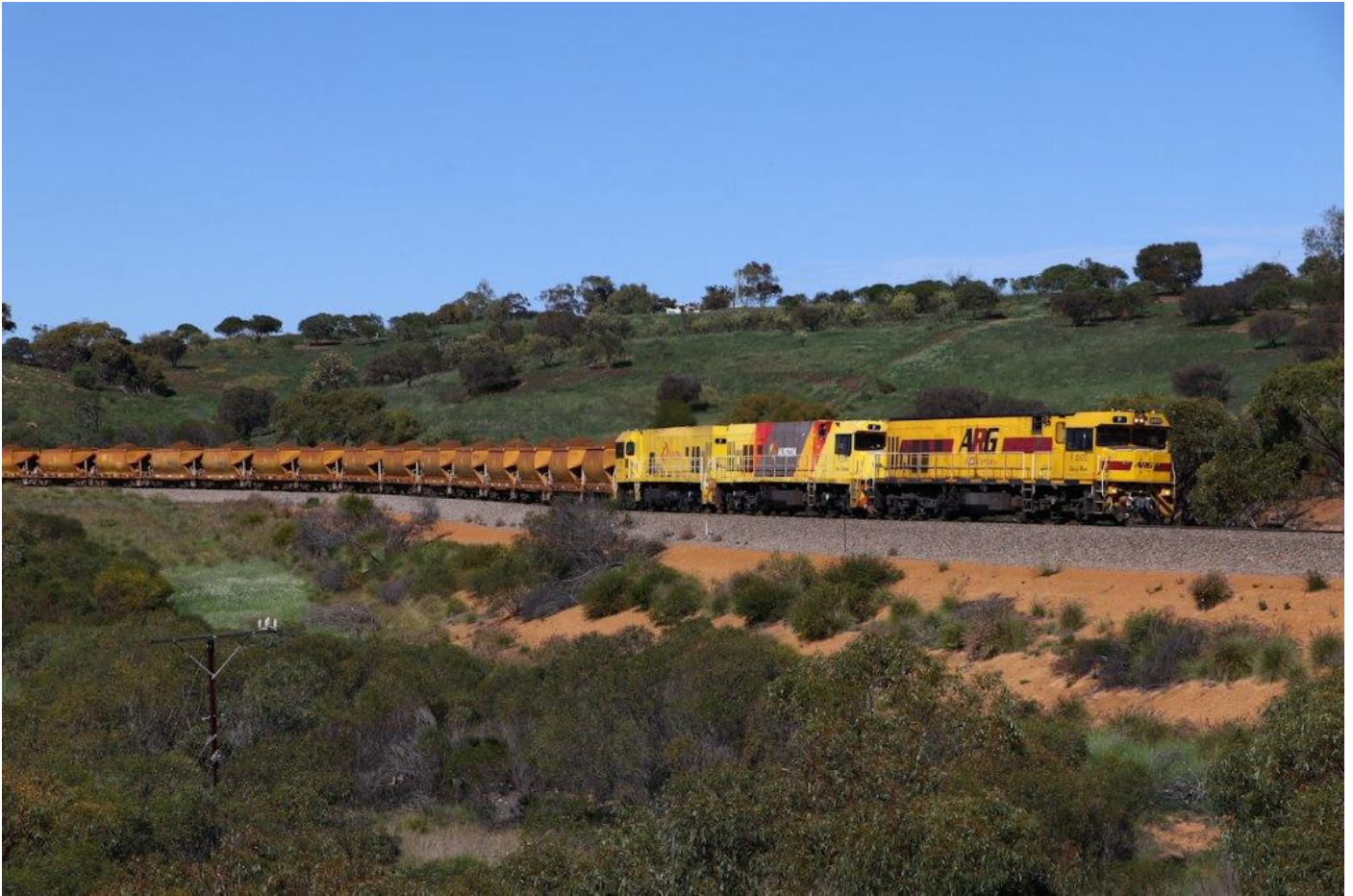
Ps 2502, 2504 & 2515 haul 1721 loaded Mt Gibson ore through Bringo, 2 nd August.