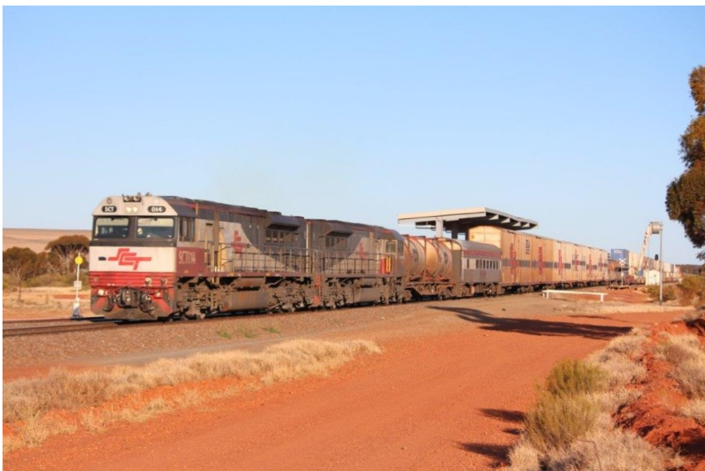
A late 5MP9 is led into Parkeston by SCTs 014 & 001, 29 th August.