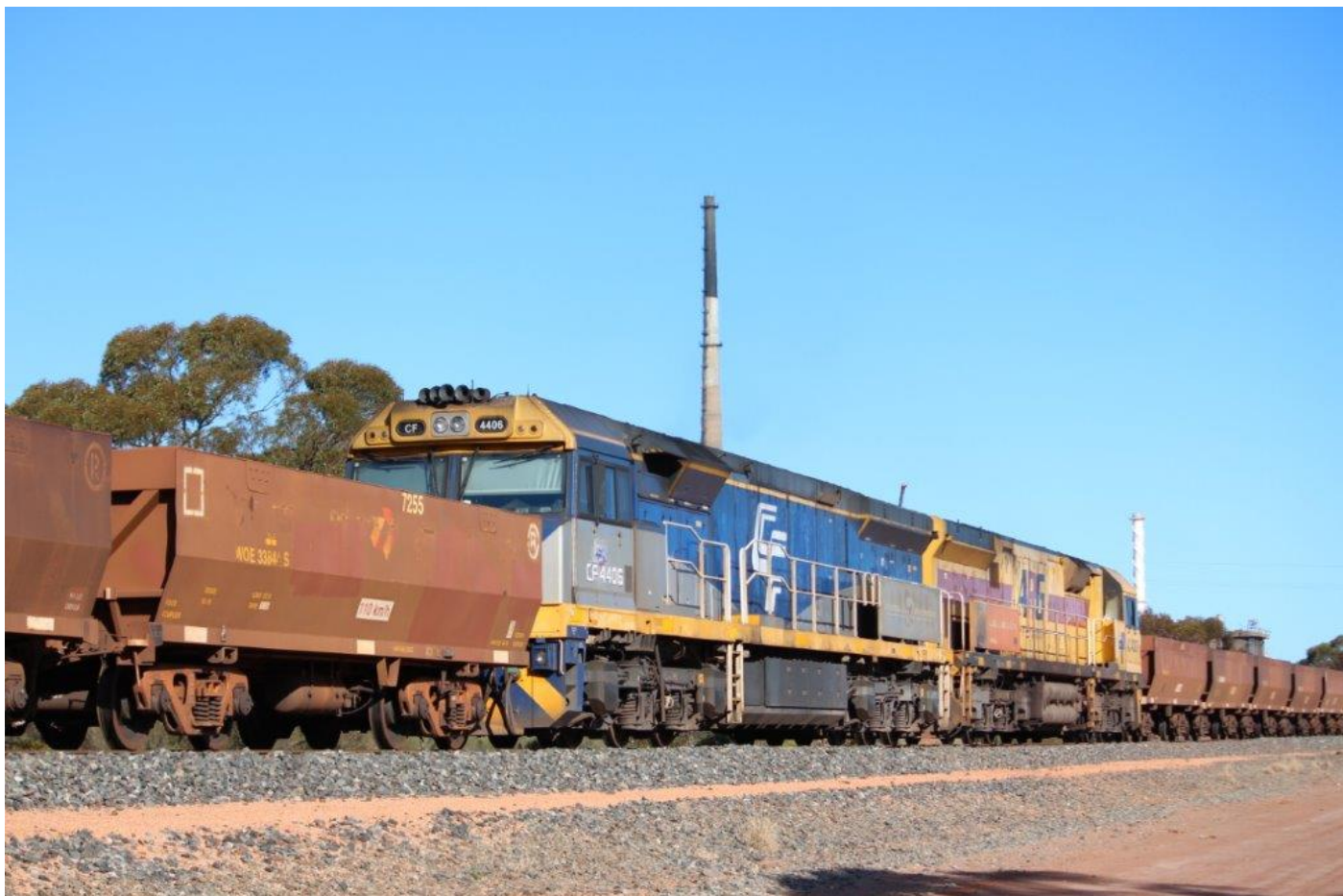
DPU on 7030 are CF4406 & AC4307, Hampton, 29 th August.