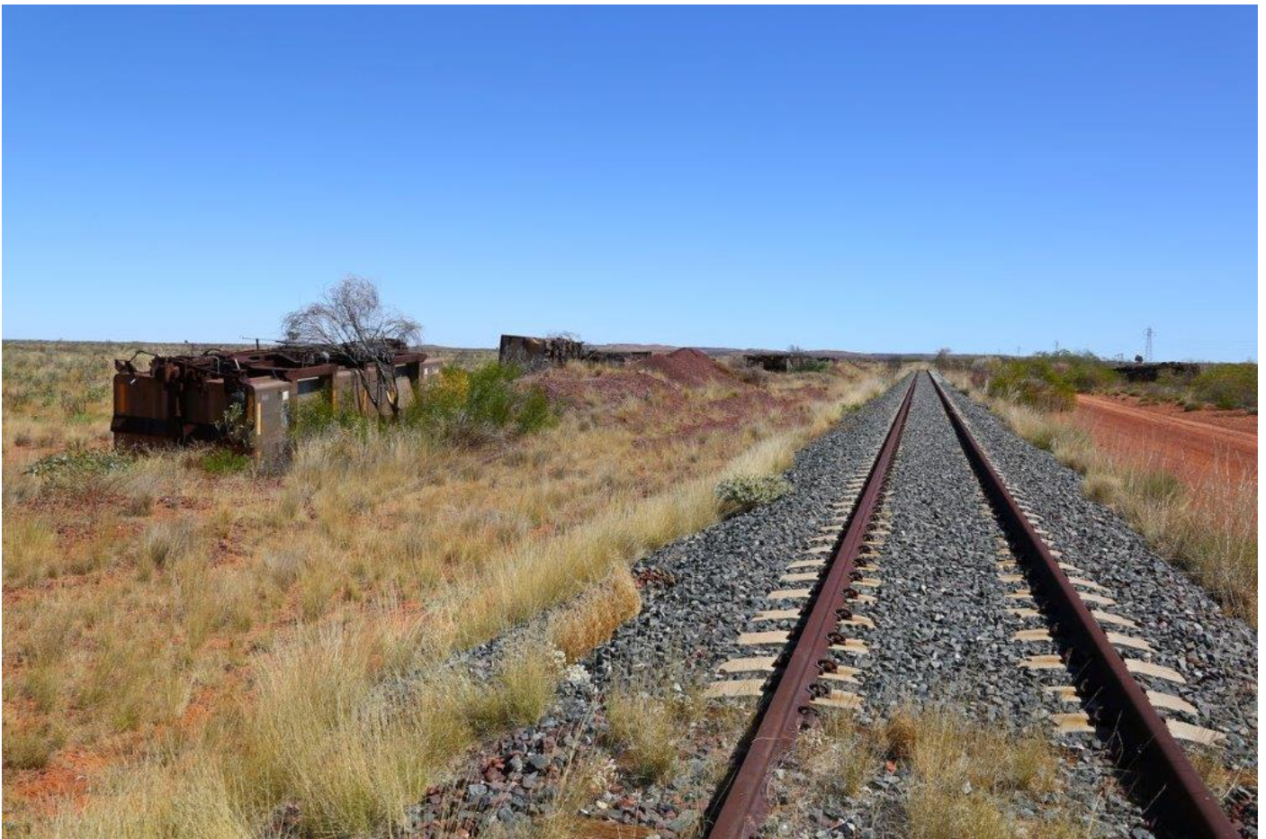
Derailed hoppers abandoned beside the Yarrie line, between Goldsworthy and Taplin sidings, 13 th August.