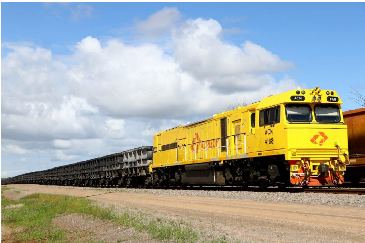
ACN4168 stands on an empty Karara ore rake at Narngulu, 13 th August.