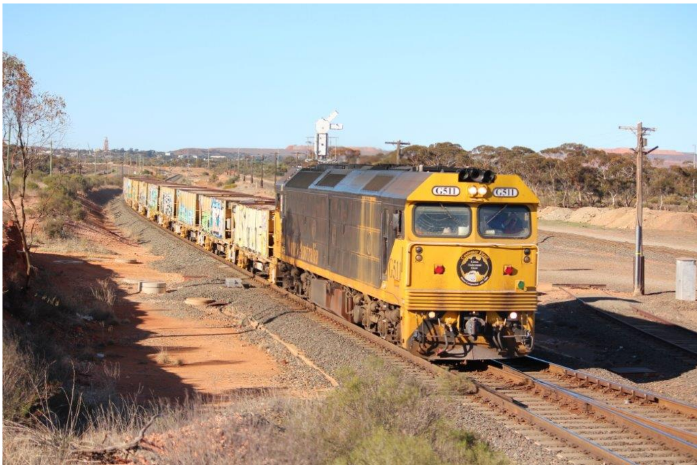
G511 enters West Kalgoorlie yard with 5BT1 after ballasting near Doney on the Leonora line, 27 th August.