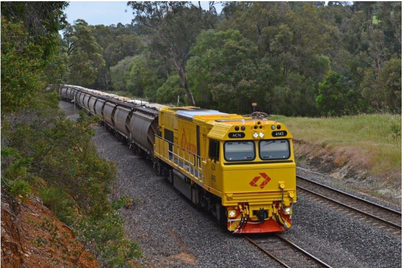
ACN4145 arrives on Beela loop with an empty alumina rake, 31 st October.