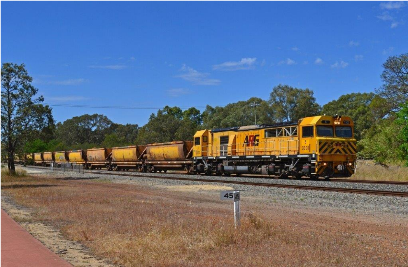
S3303 hauls an empty bauxite train through Mundijong, 30 th October.