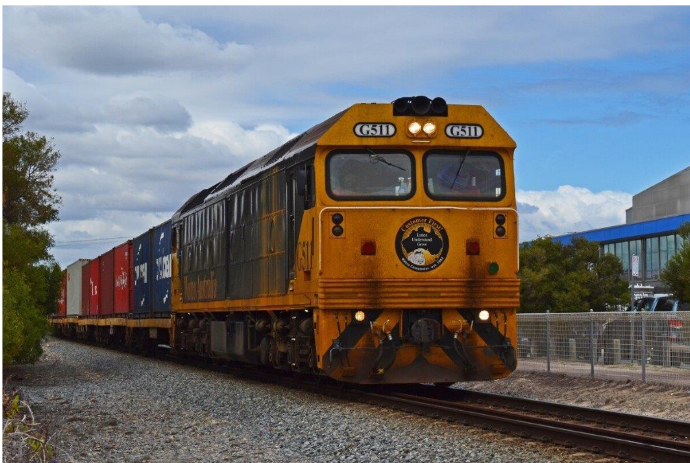
The ILS shuttle near Fremantle South behind G511, 9 th October.