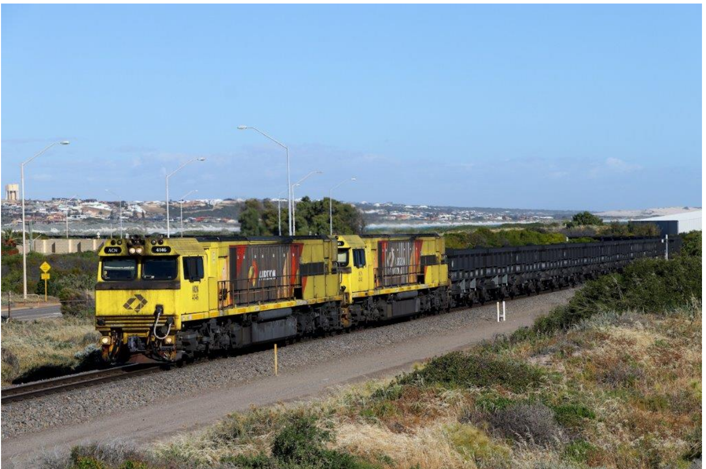
7763 loaded Karara ore with ACNs 4146 & 4141, Separation Point, 3 rd October.