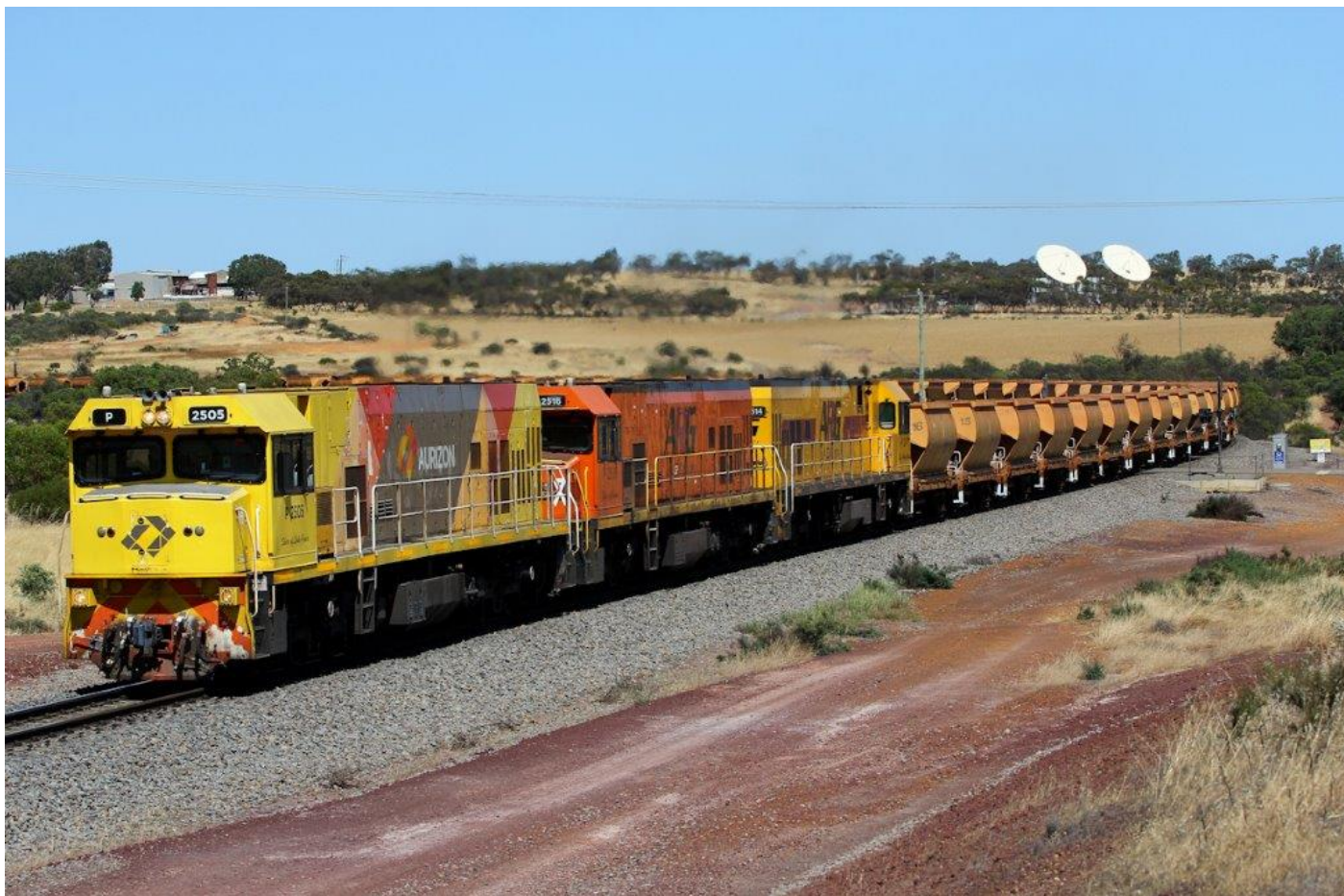
Ps 2505, 2516 & 2514 lead 7720 empty Mt Gibson ore, Moonyoonooka, 24 th October.