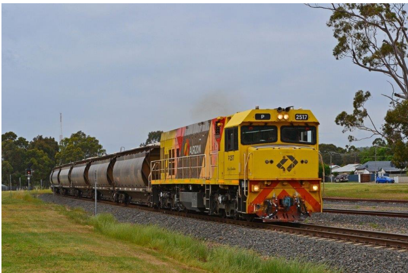
P2517 at Brunswick Junction with 7864 Yarloop to Bunbury alumina, 31 st October.