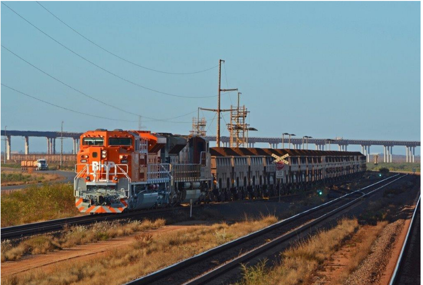
New 4493 leads 4442 towards the dumpers at Finucane Island, 17 th October.