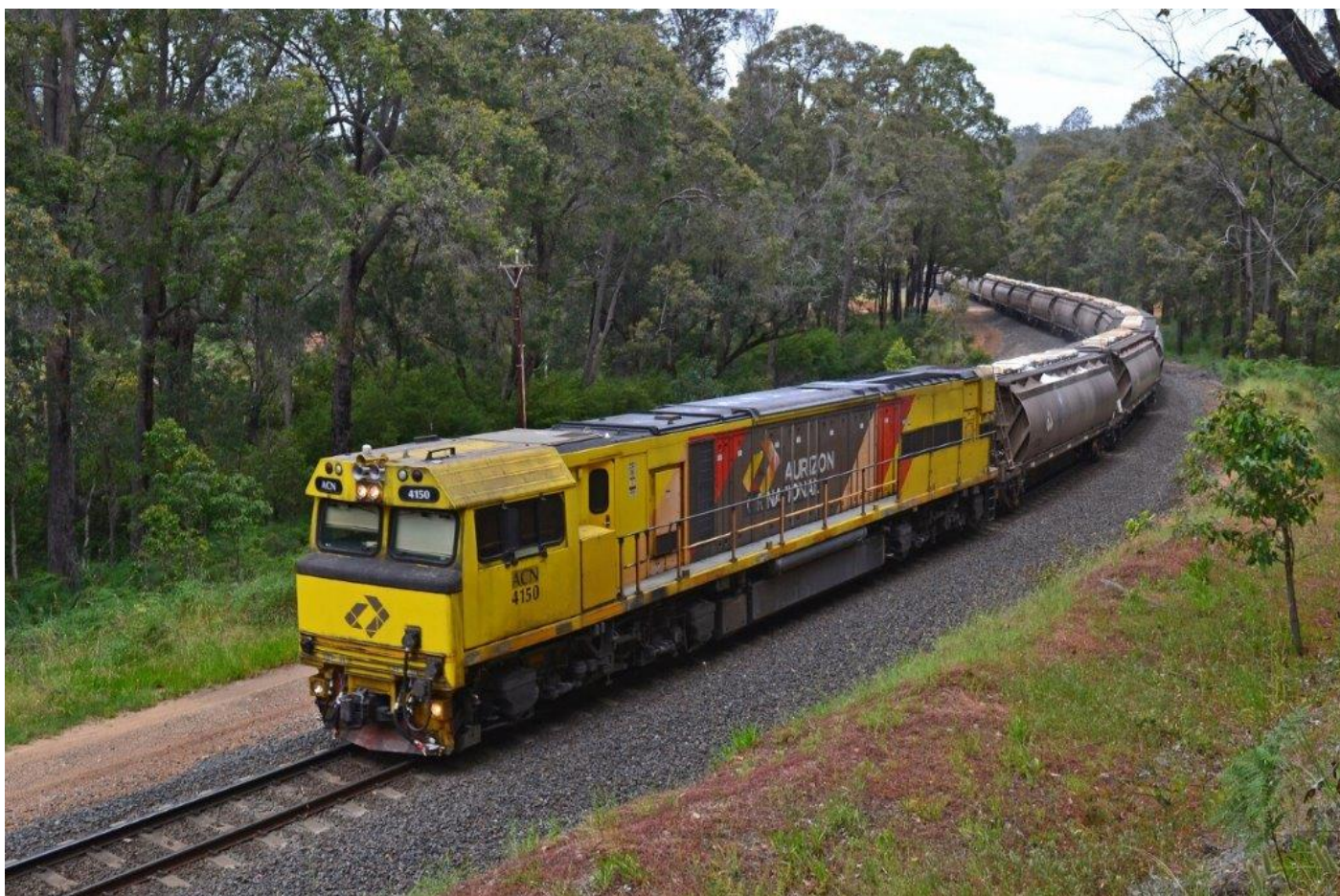
7832 alumina is led near Beela by ACN4150, 31 st October.