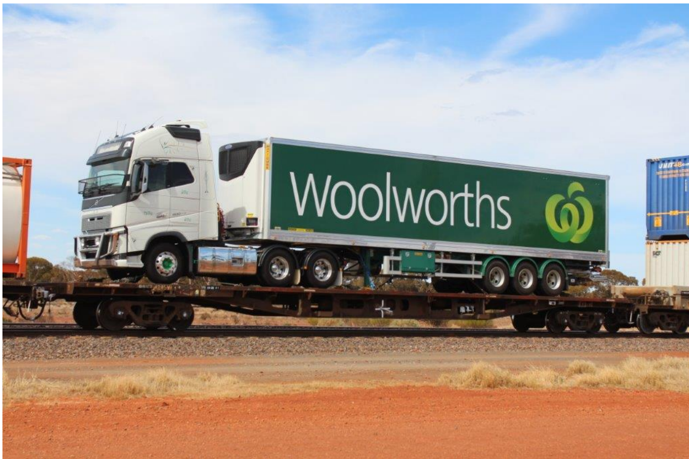
Memories of trains several decades earlier: a refrigerated truck on 5MP9, 10 th October.