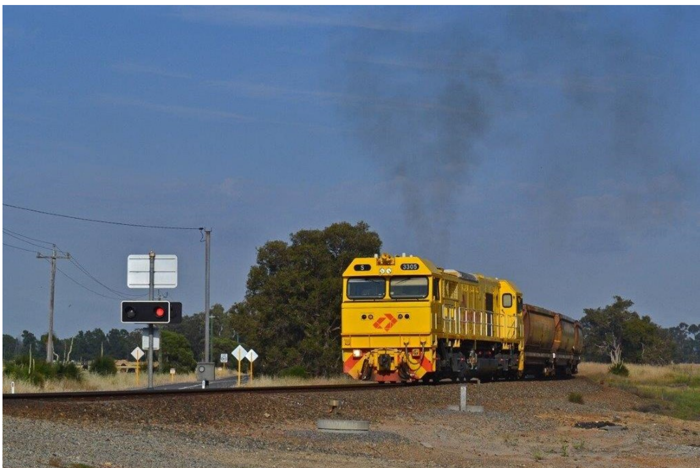
An empty bauxite rake passes through Mundijong Junction behind S3305, 31 st October.