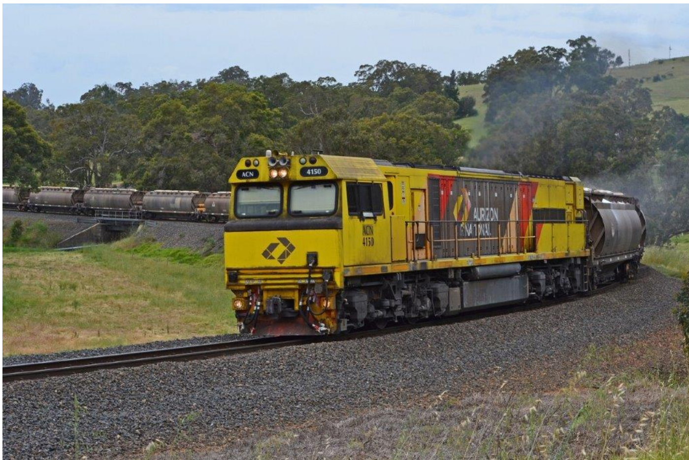
ACN4150 hauls 7832 alumina between Beela and Brunswick Junction, 31 st October.