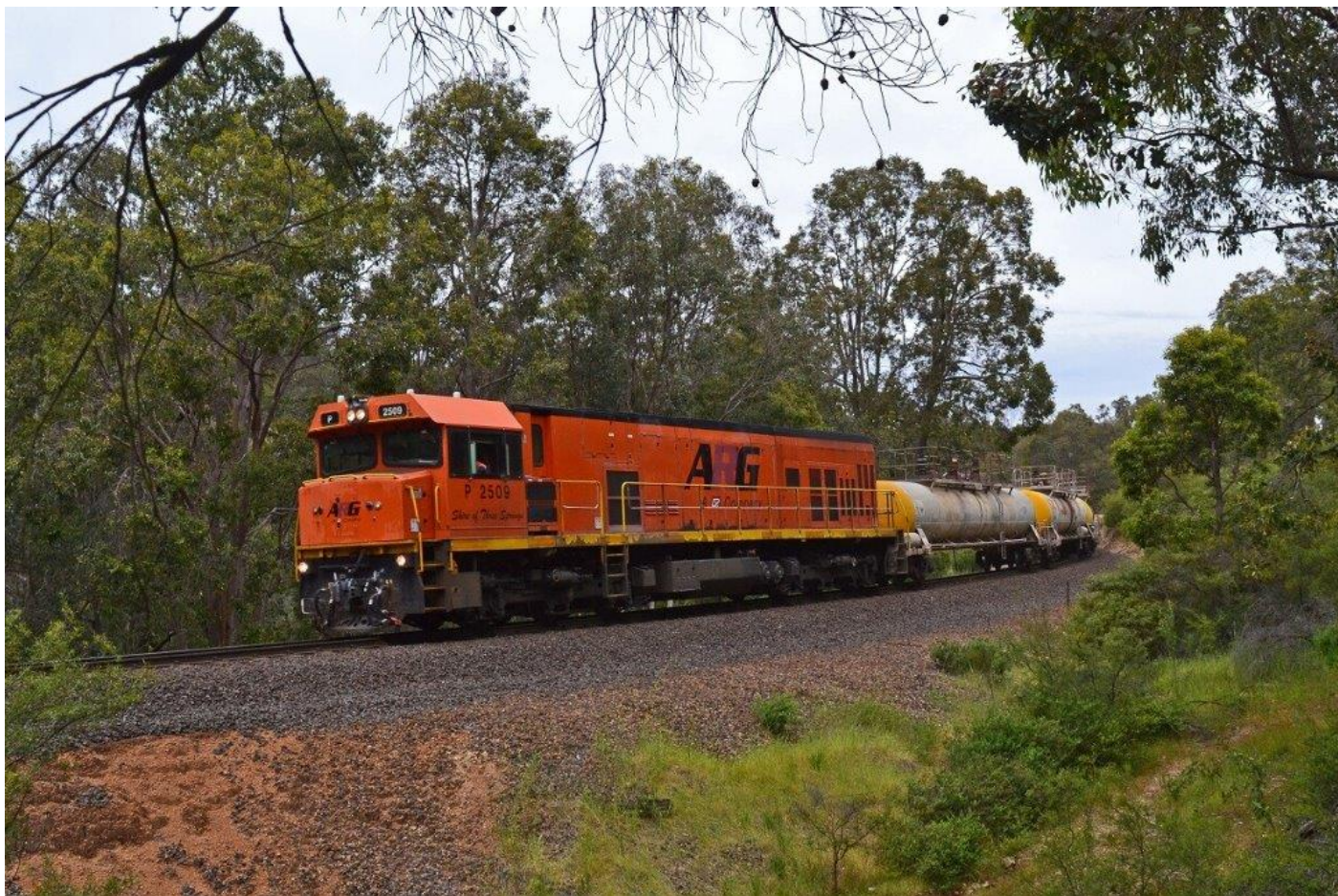
P2509 leads 7854 caustic tanks through Beela, 31 st October.