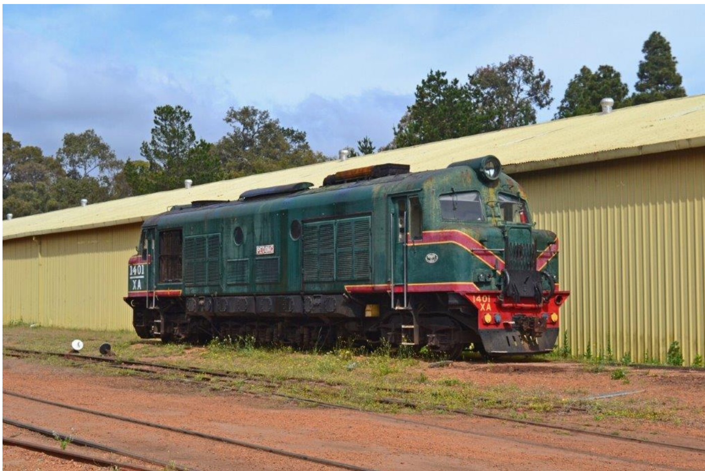
Preserved XA1401 stabled at Dwellingup, 31 st October.