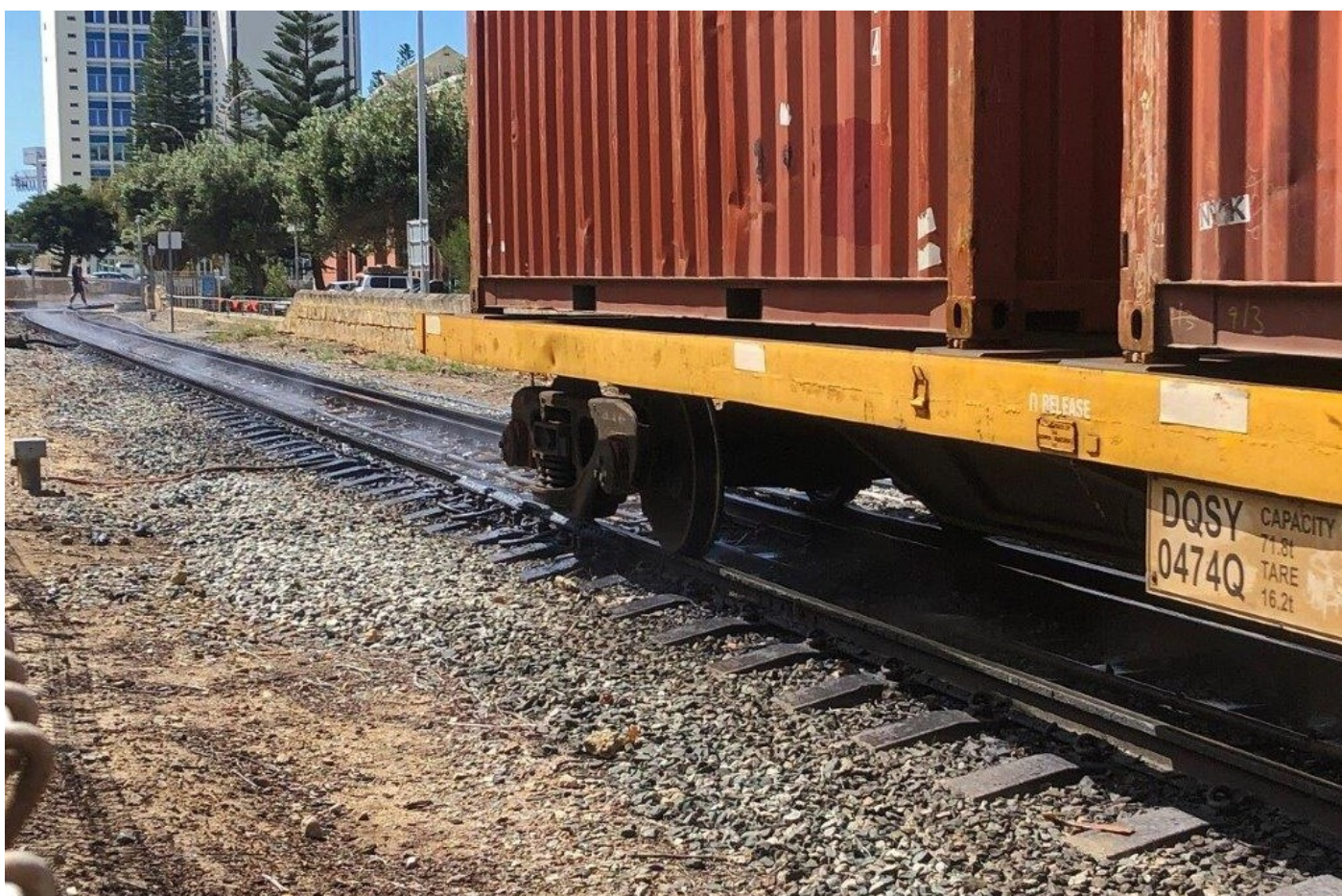
Water sprays for noise reduction, Fremantle, 8 th October.