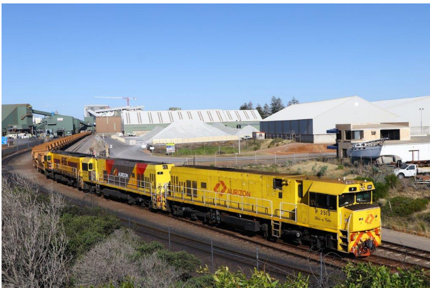
6722 empty Mt Gibson ore waits to depart Geraldton Port behind Ps 2515, 2506 & 2508, 23/10.