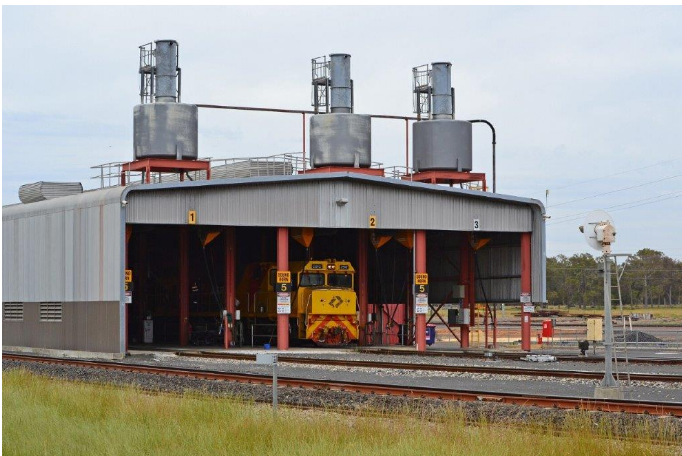
P2512 sits in the Picton Junction prep shed with a loaded alumina rake, 31 st October.