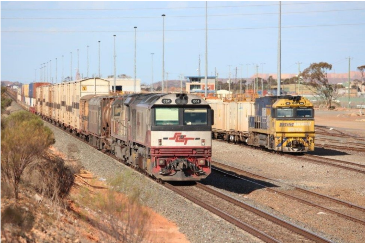
CSR004 & SCT015, 1MP9; NR106, 1MP2; stabled 24hrs due to derailment near Kooly, 28/10.