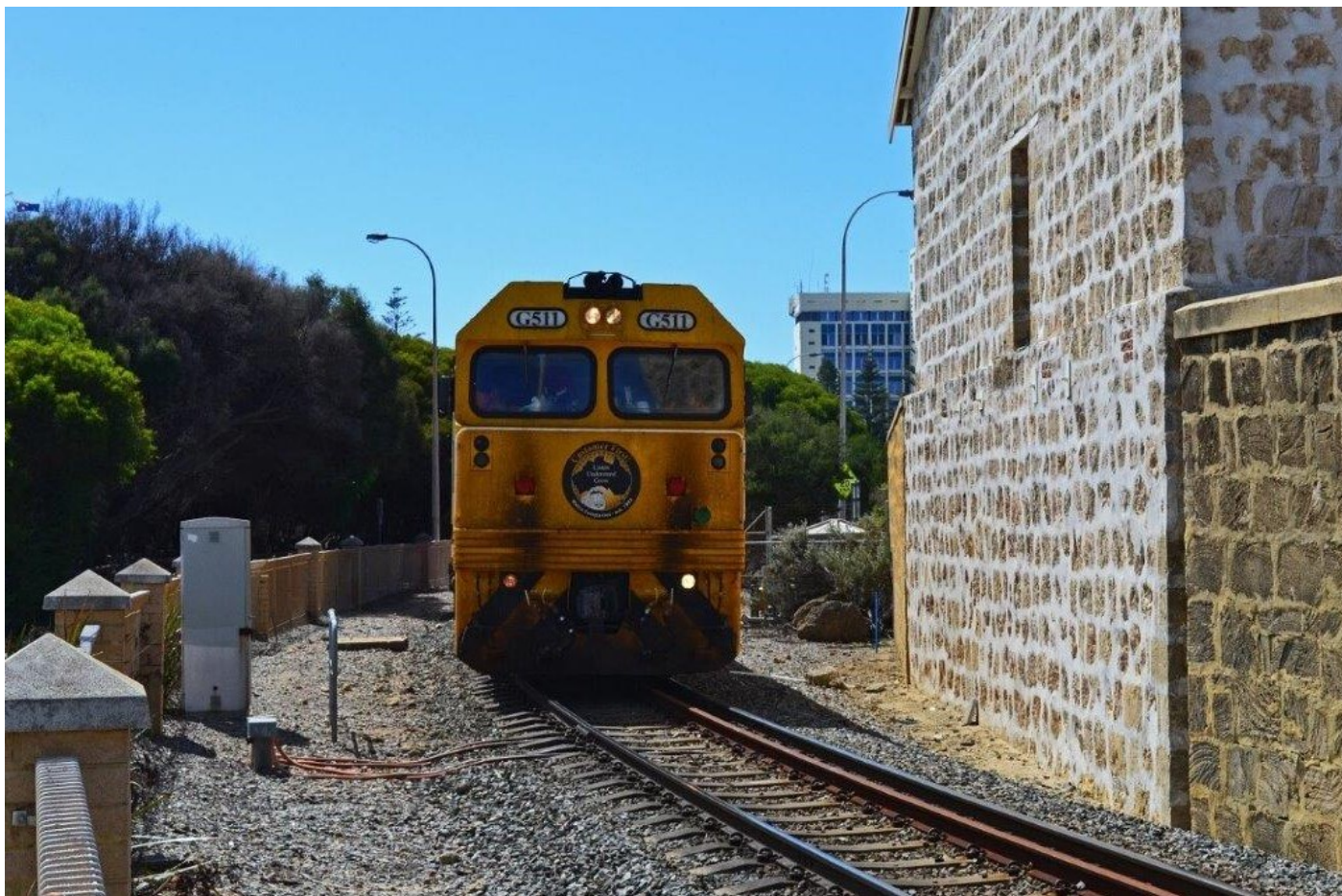
G511 on the ILS shuttle passes the Maritime Museum, Fremantle, 8 th October.