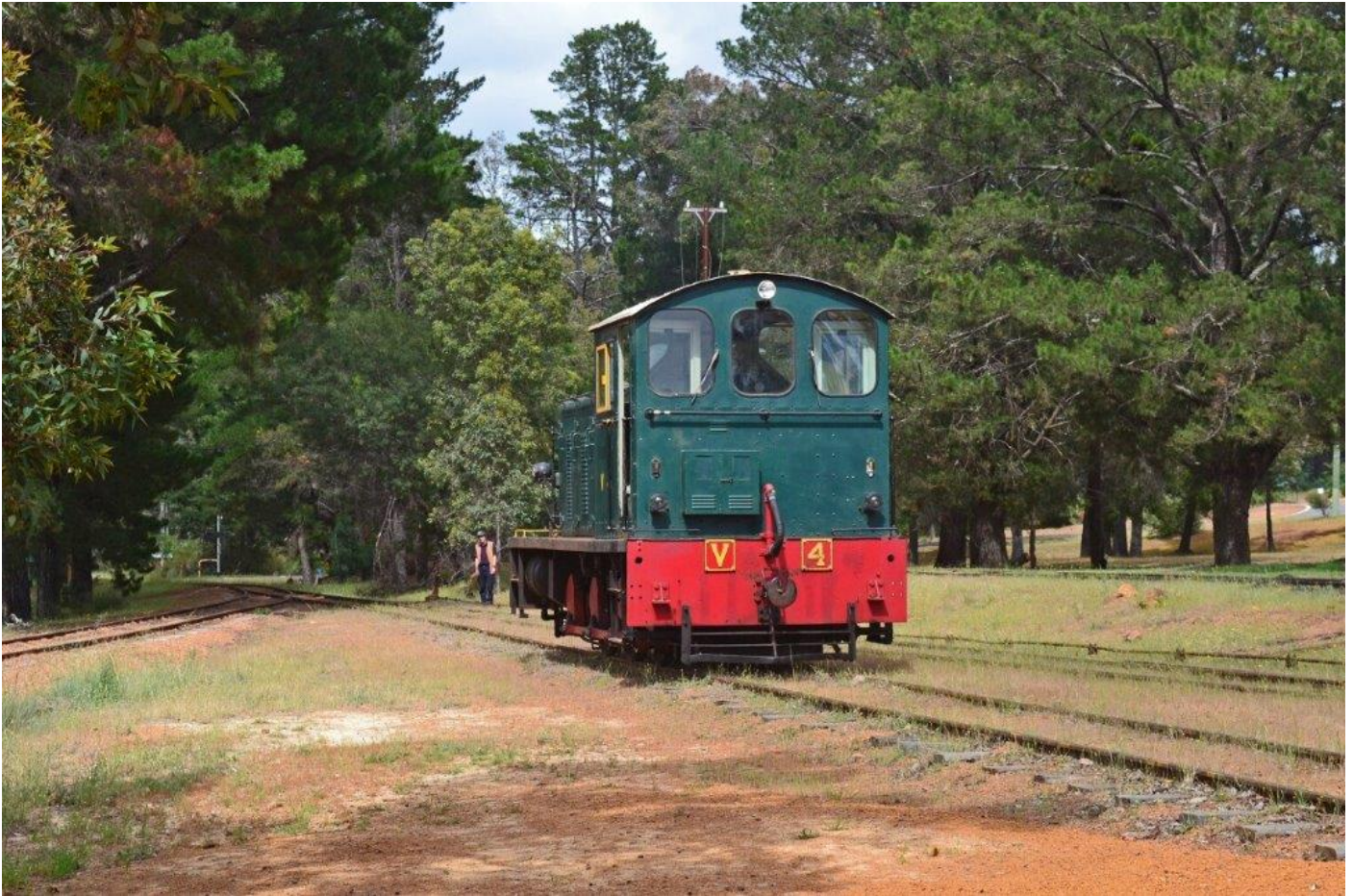
V4 runs around The Forest Train at Dwellingup, 31 st October.