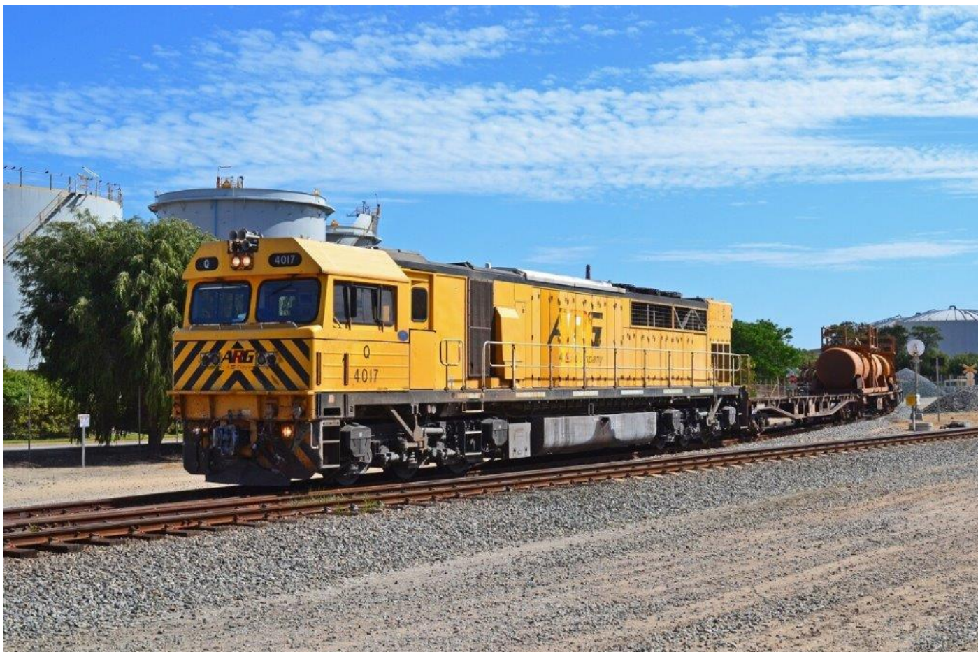
Q4017 pulls an empty acid rake out of Coogee acid terminal, Kwinana, 30 th October.