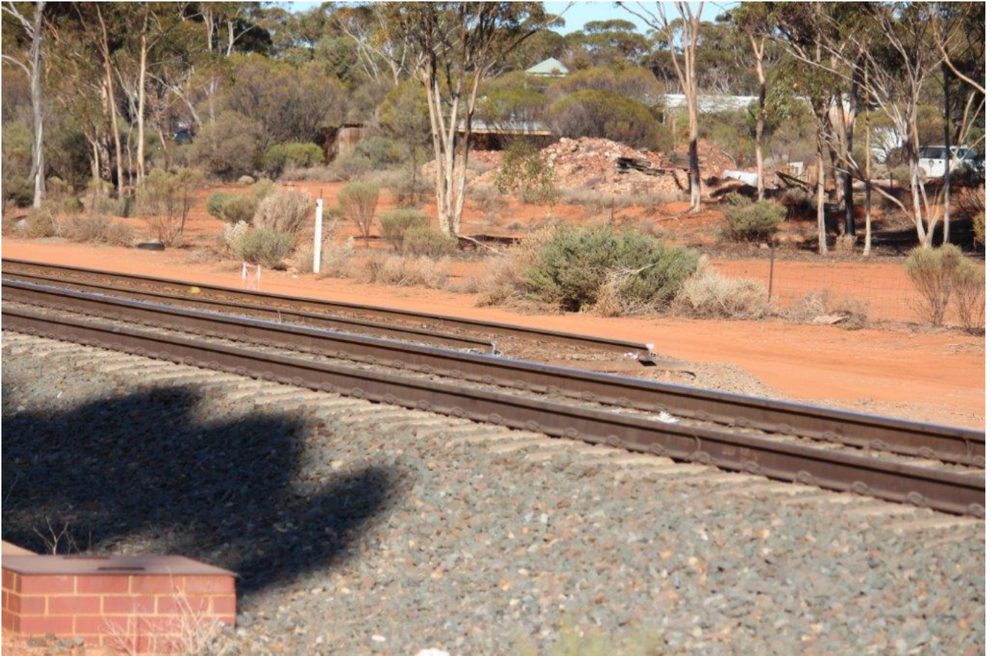
In late October, the east leg and south junction of Binduli triangle was cut, removed and rebuilt with concrete sleepers (previously all wooden) and new rails. 29 th October.