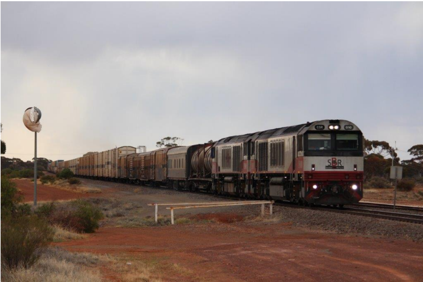
CSRs 010 & 006 depart Parkeston with 6PM9, 31/10. CSR006 later failed near Immarna.