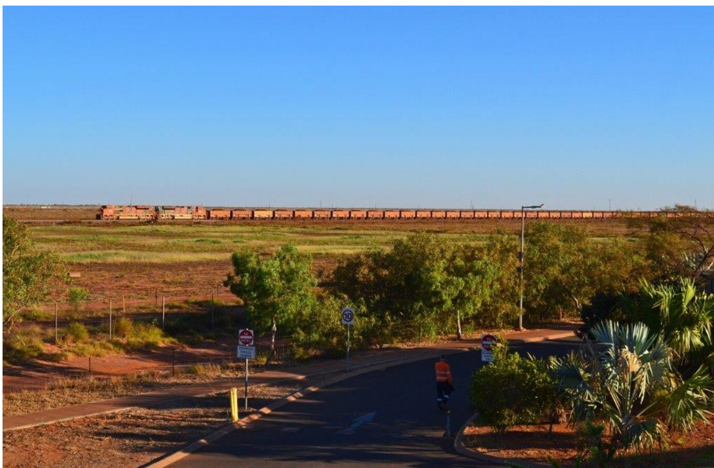
4459 & 4375 (4324 & 4476 DPU) run a loaded ore past The Haven camp, 16 th October.