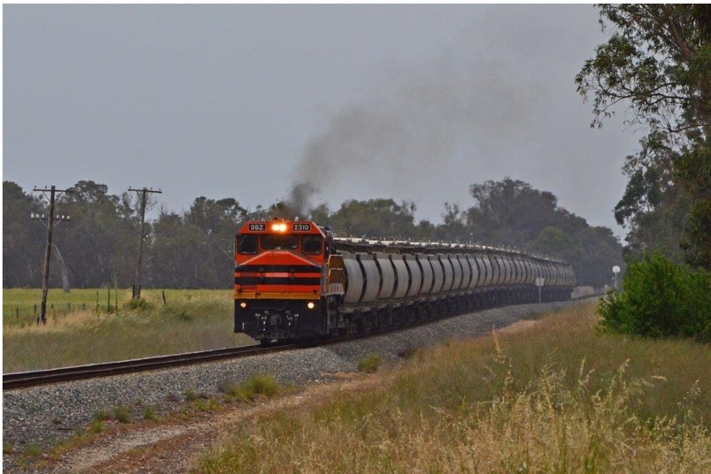
DBZ2310 works hard just south of Pinjarra with 7874 alumina from Calcine, 31 st October.