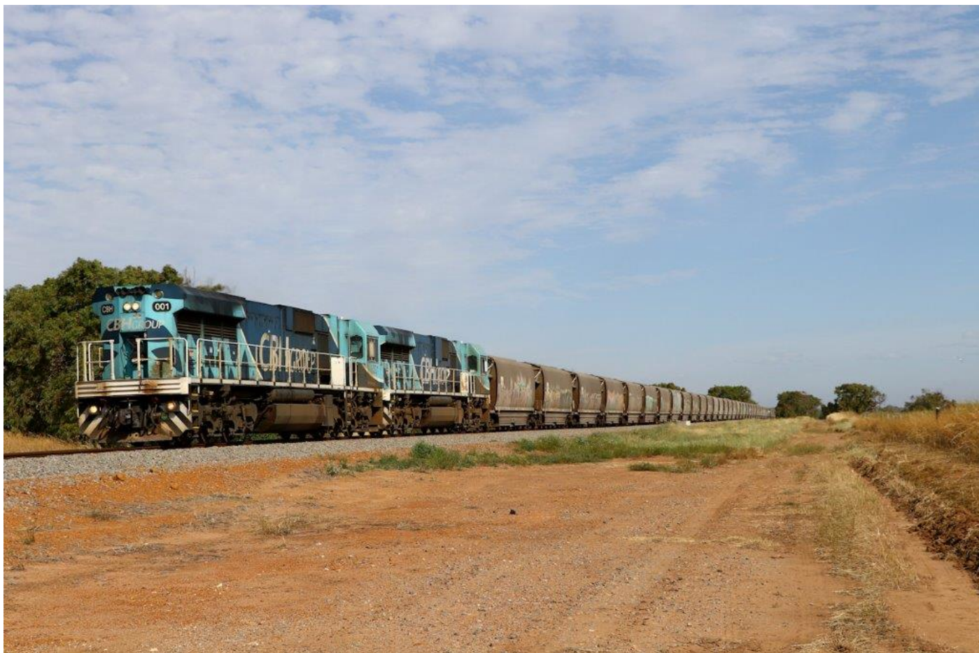
CBHs 001 & 002, north of Walkaway with 6G51 grain to Geraldton Port, 16 th October.