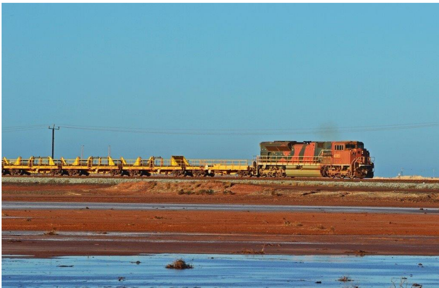
4335 leads an empty rail rake across the salt flats en route to Flashbutt, 21 st October.