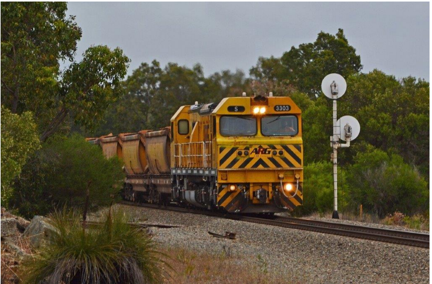
S3303 passes the Up Home at Mundijong with 7972 loaded bauxite, 31 st October.