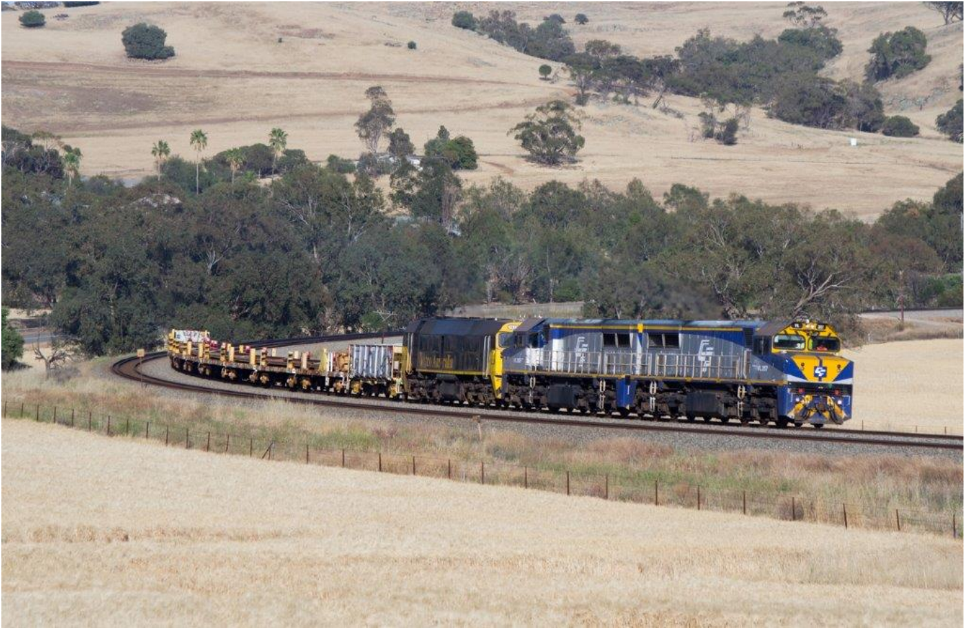
VLs 357 & 361 lead FL220 on 4RT1 rail train to Hampton past Avon Yard, 28 th October.