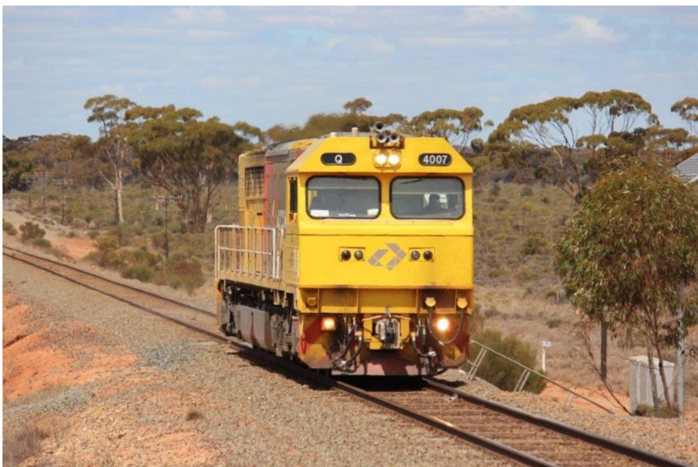
After the acid shunt at Hampton, Q4007 returns to West Kal as 7406, 7km peg, 24/10.