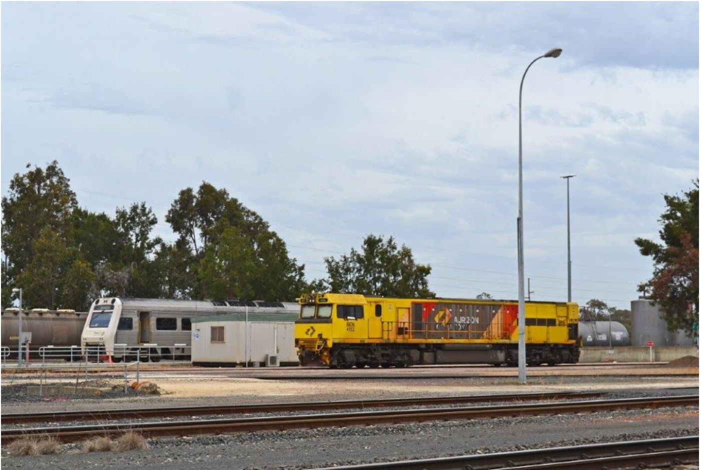
ACN4152 and the Australind at Picton Junction loco depot, 31 st October.