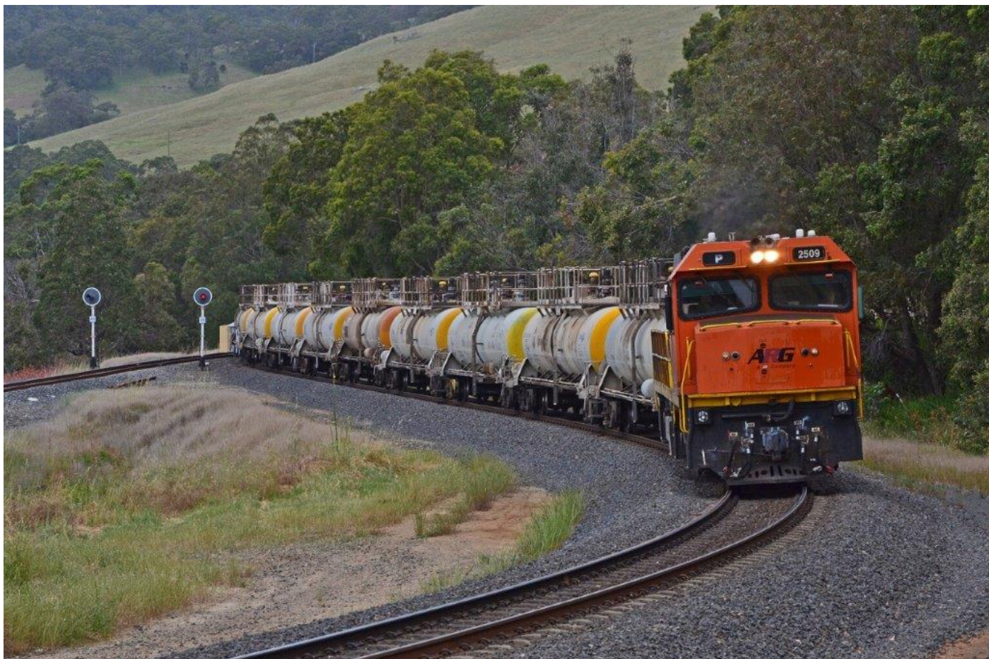
7854 caustic soda tanks behind P2509 at Brunswick Junction, 31 st October.