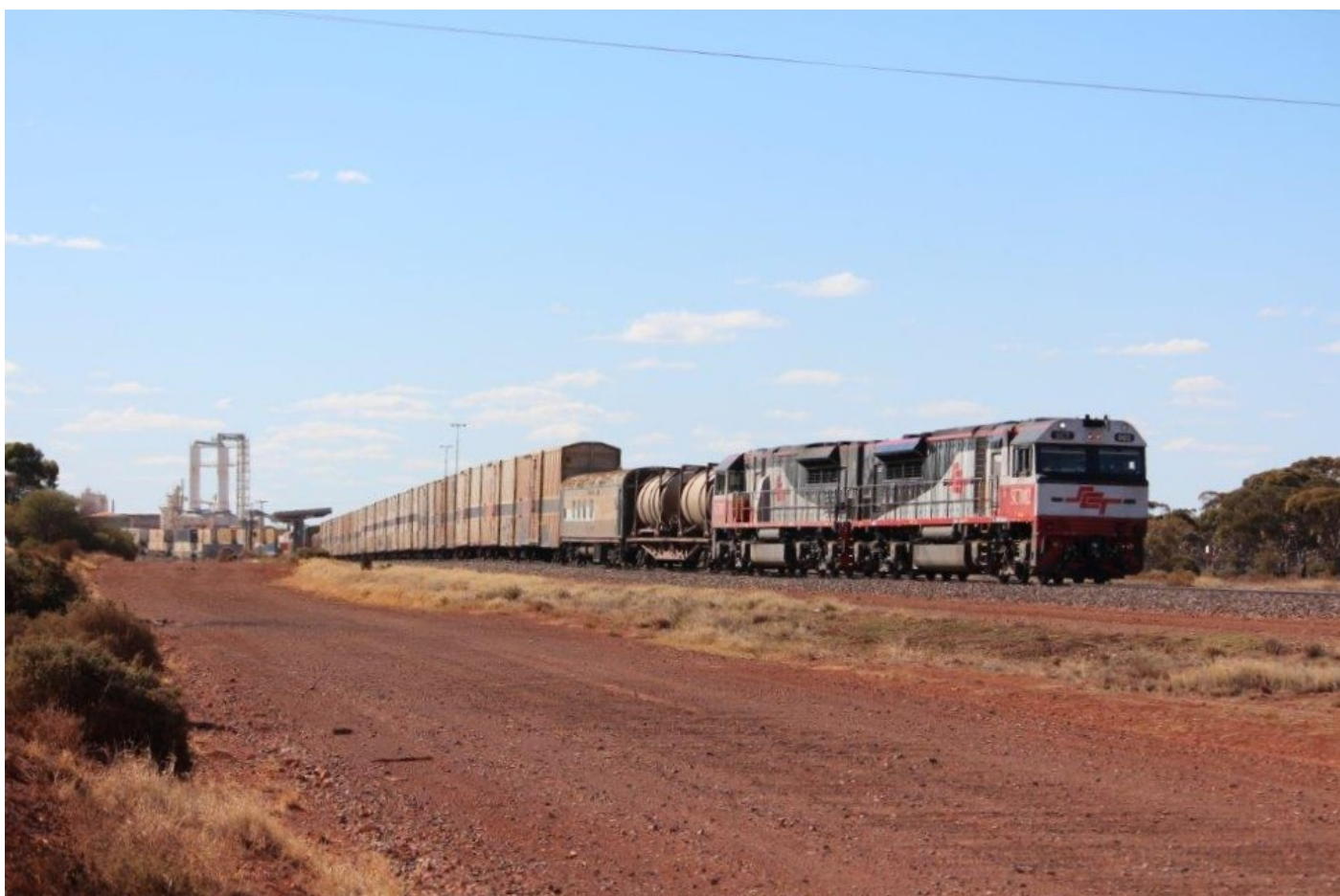
Clean SCT002 leads SCT007 on 6PM9, Parkeston, 24 th October.