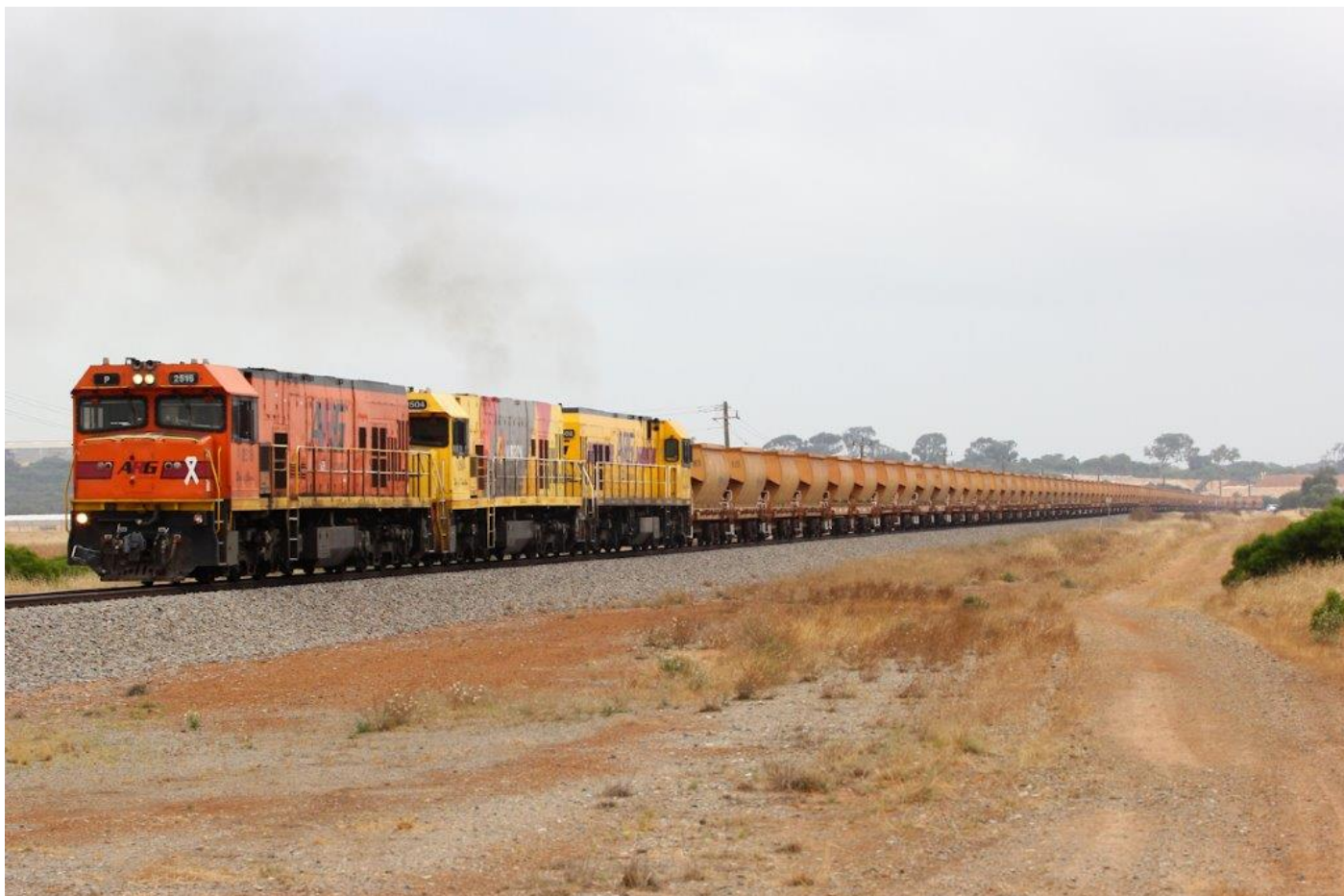
Ps 2516, 2504 & 2502 lead 7720 empty Mt Gibson ore through Narngulu East, 31 st October.