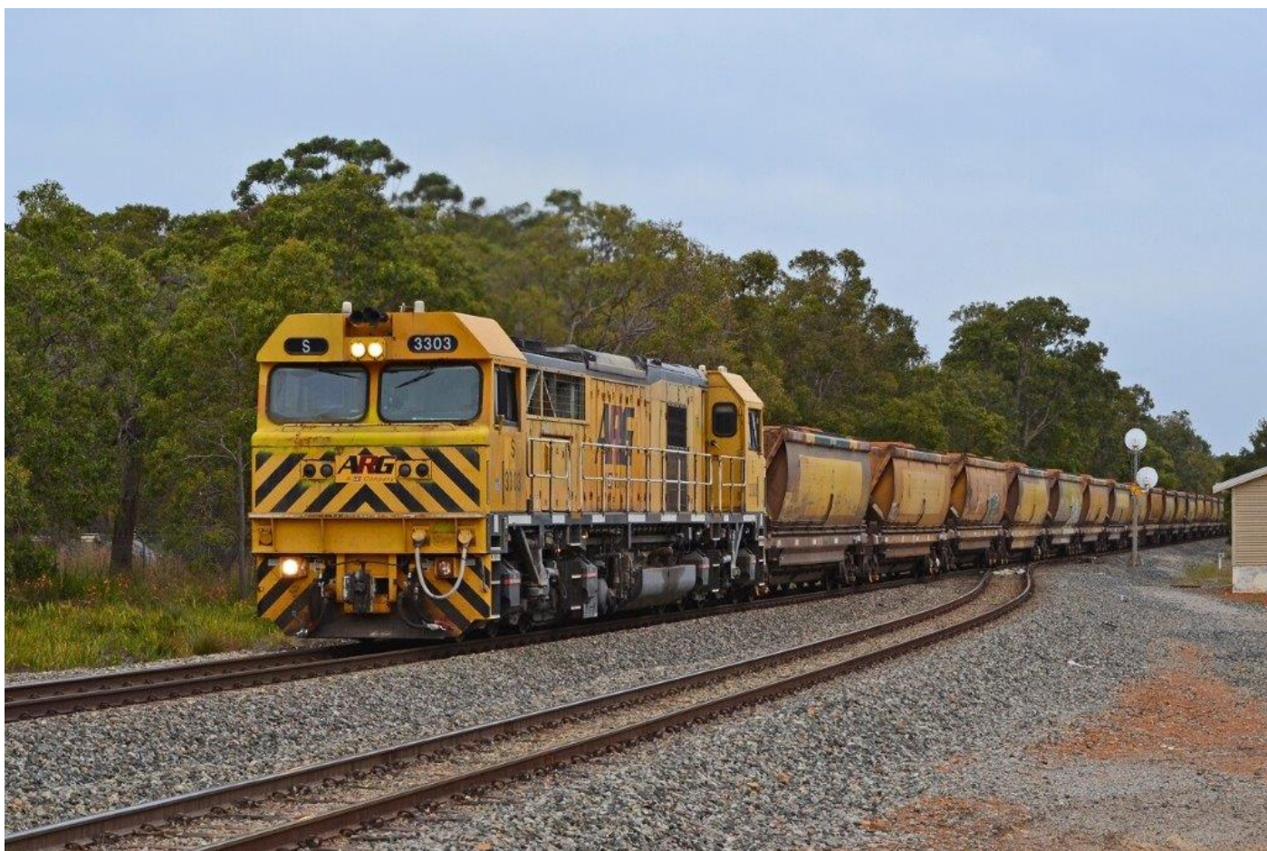
7972 loaded bauxite behind S3303 at Keysbrook, 31 st October.