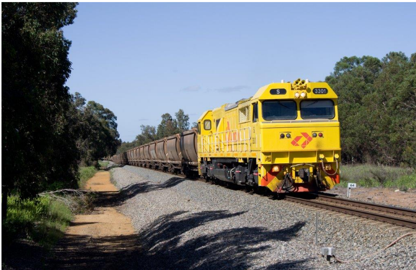
S3301 leads 2968 bauxite through Keysbrook, 5 th October.