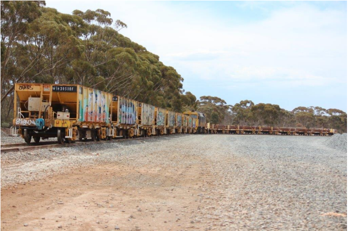
FL220 stabled between ballast and rail rakes, Hampton ballast siding, 18 th October.