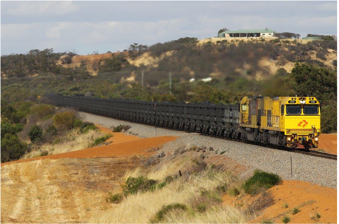
ACNs 4151 & 4170 lead 7763 loaded Karara ore through Bringo (above) and approach the unloader at Geraldton Port (below) as Ps 2515, 2506 & 2502 depart with 7722 empty Mt Gibson, 17 th October.