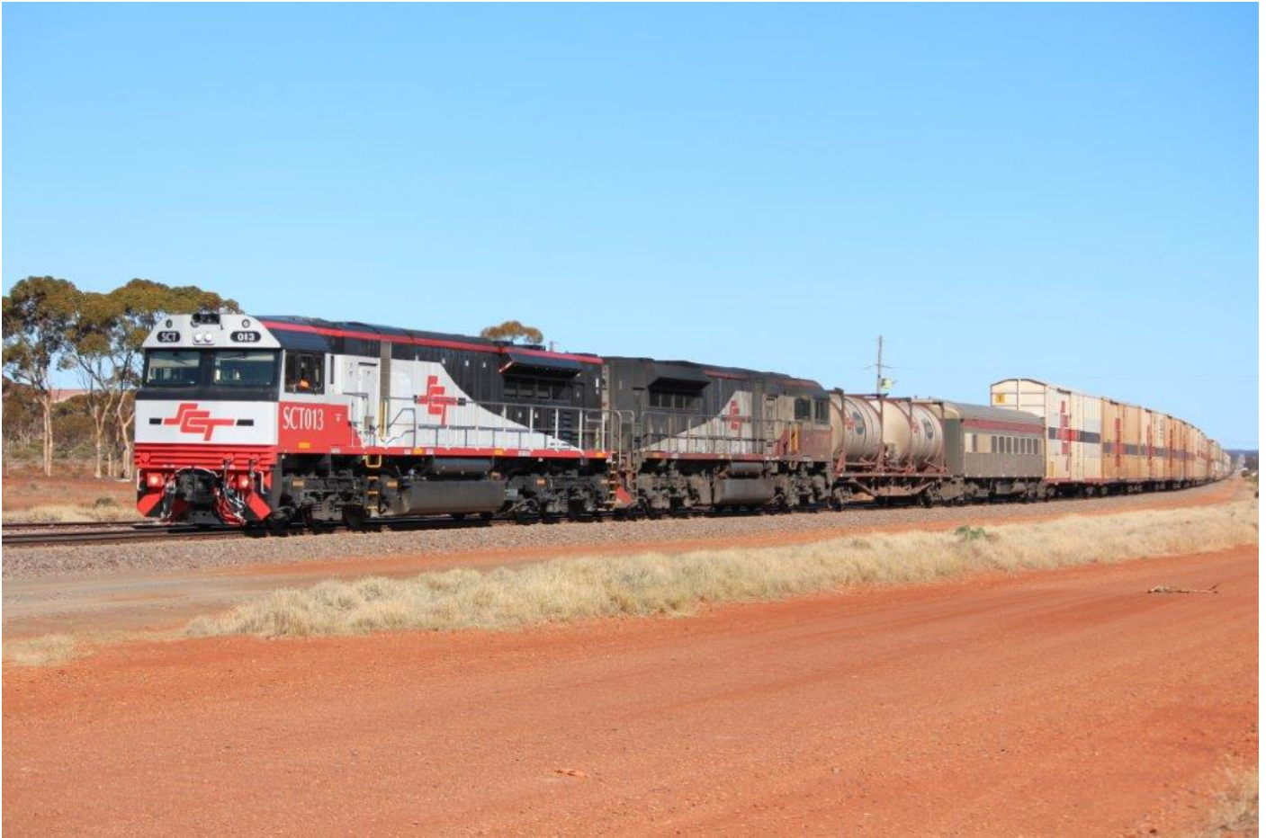
Freshly overhauled SCT007 leads SCT005 on 6MP9, Parkeston, 25 th October.