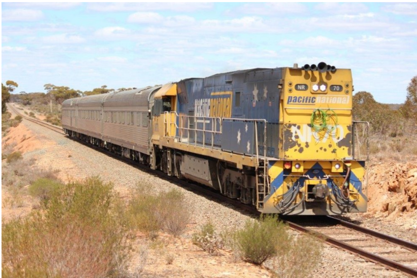
7AK2 from Esperance passes the 7km peg near Binduli, led by NR70, 24 th October.