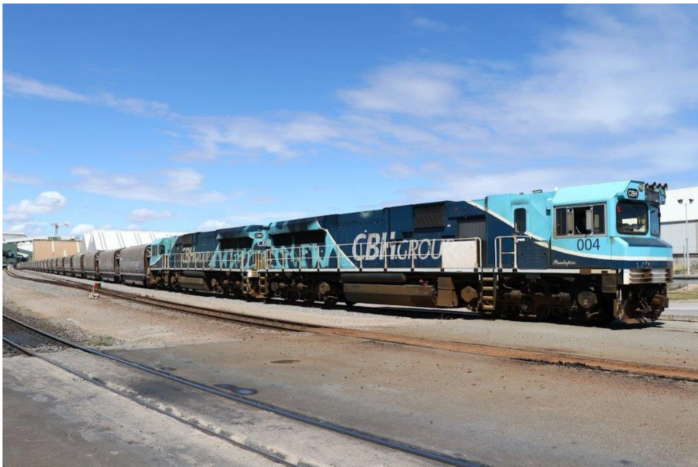
5G58 loaded grain to Kwinana waits at Geraldton Port behind CBHs 004 & 008, 8 th October.