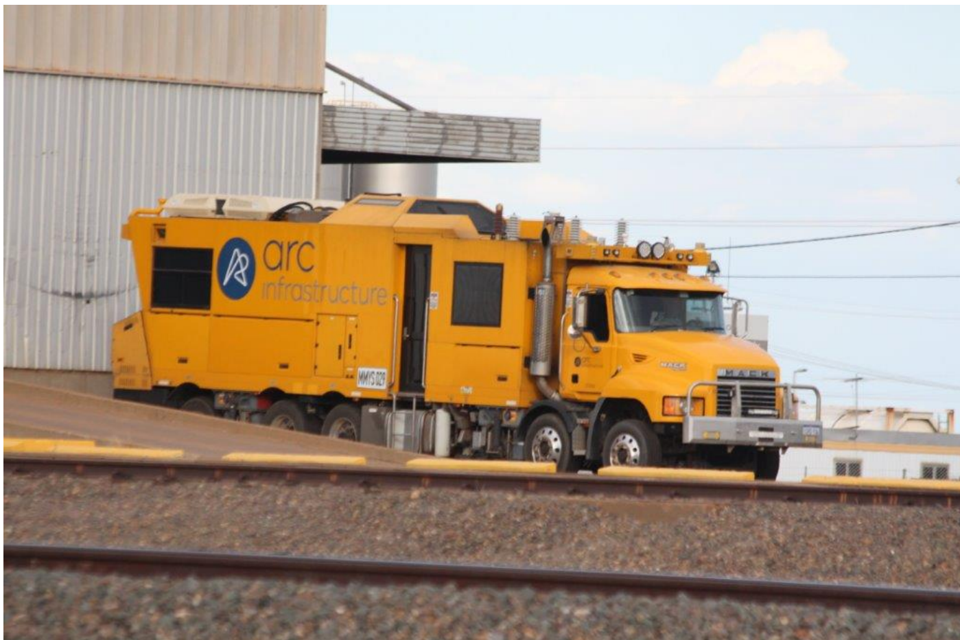
MMYS029, ARC's road/rail ultrasonic rail testing vehicle, West Kalgoorlie, 21 st October.