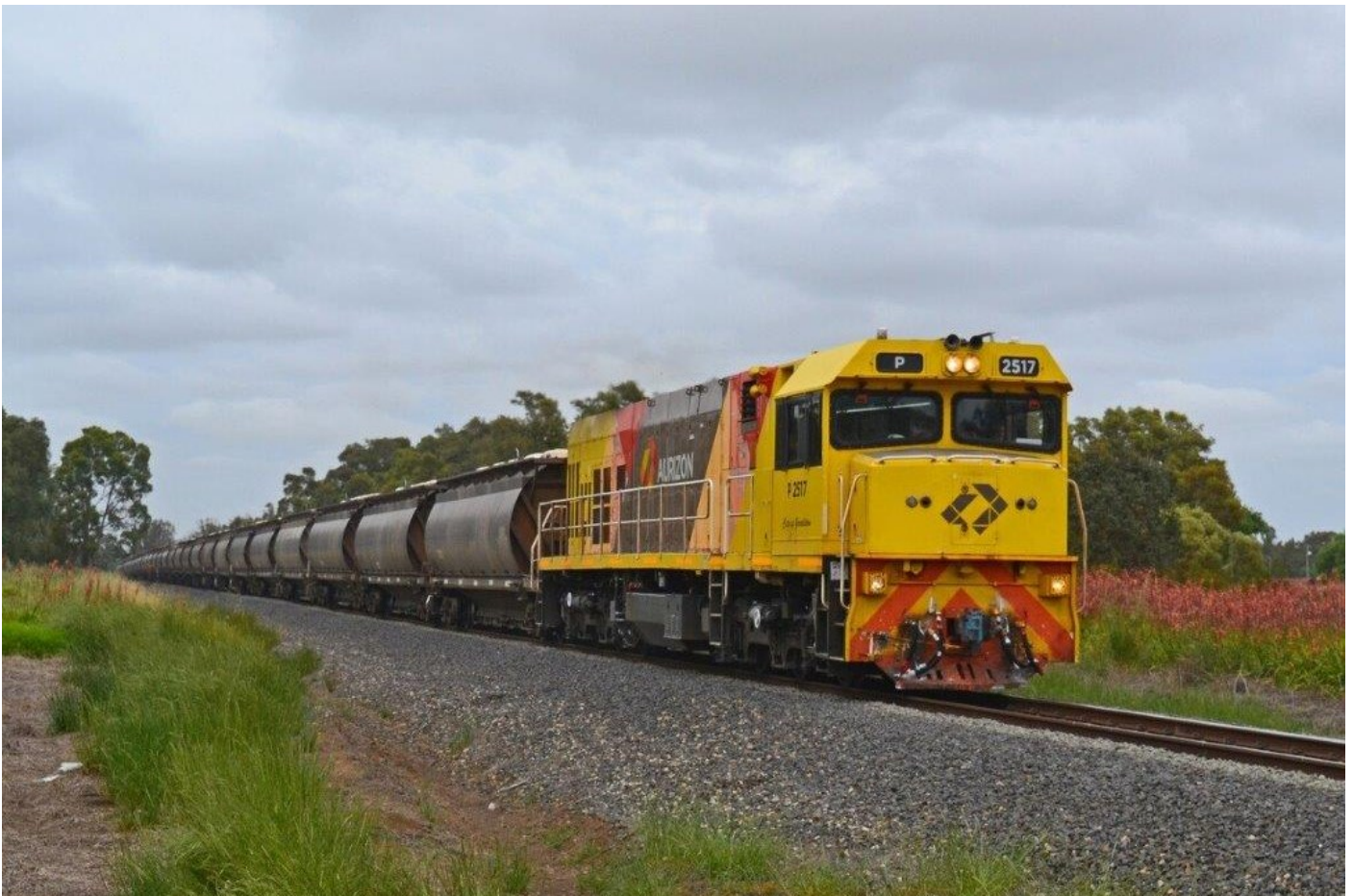
P2517 near Harvey with 7863 alumina to Yarloop, 31 st October.