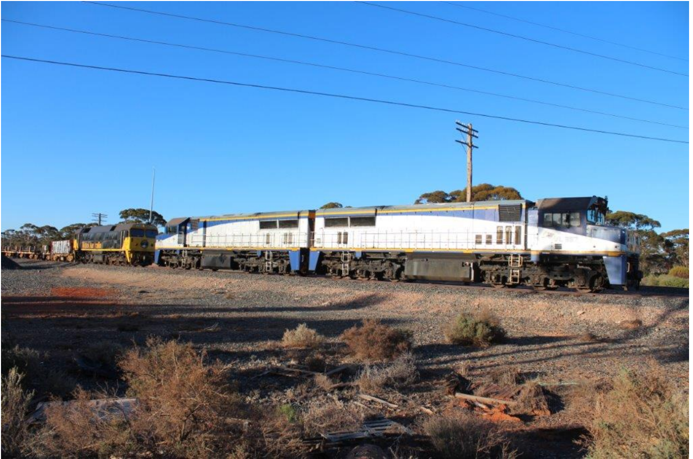
VLs 357 & 361 stabled with FL220 and railset on rail loop, Hampton ballast siding, 29/10.