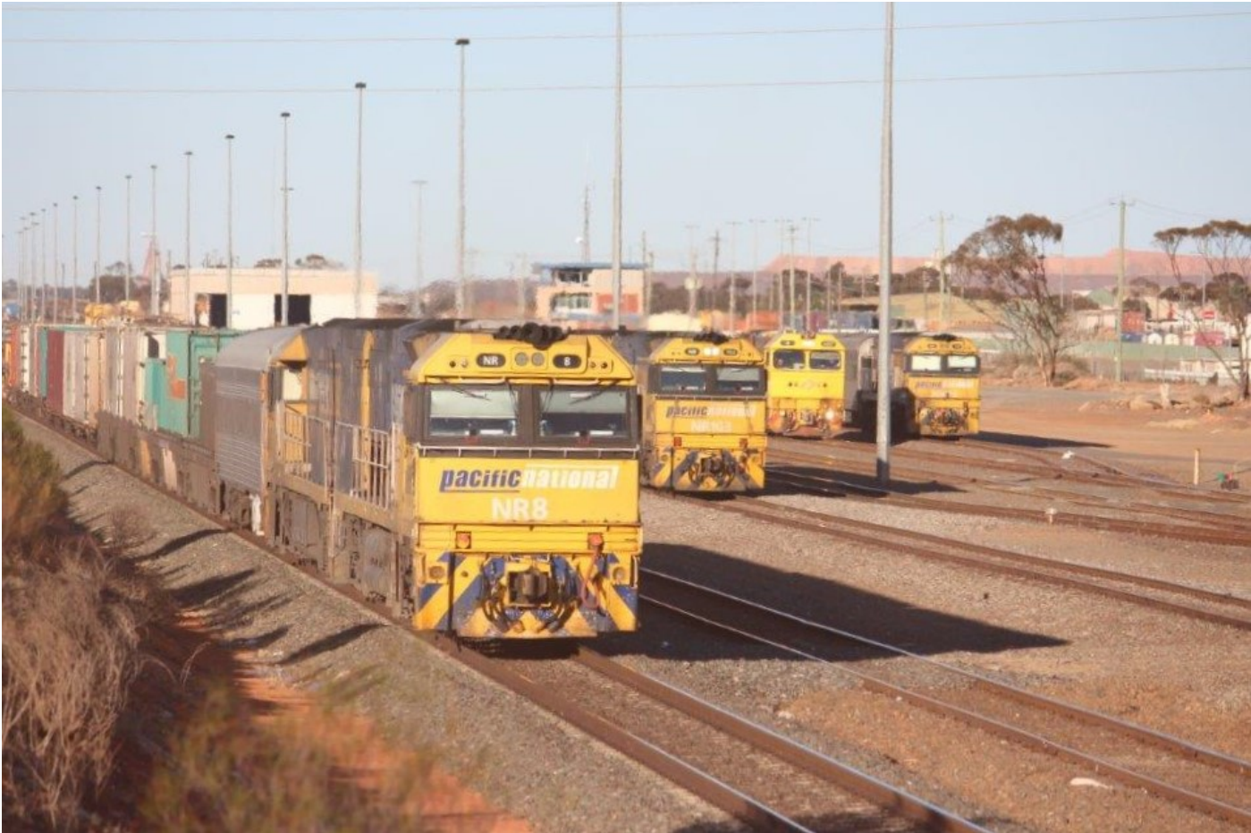
NRs 8 & 7, 7MP5; NRs 103 & 27, 2445; Q4007, 2407 L/E to Hampton; NR113, AK cars; West Kalgoorlie, 26/10.