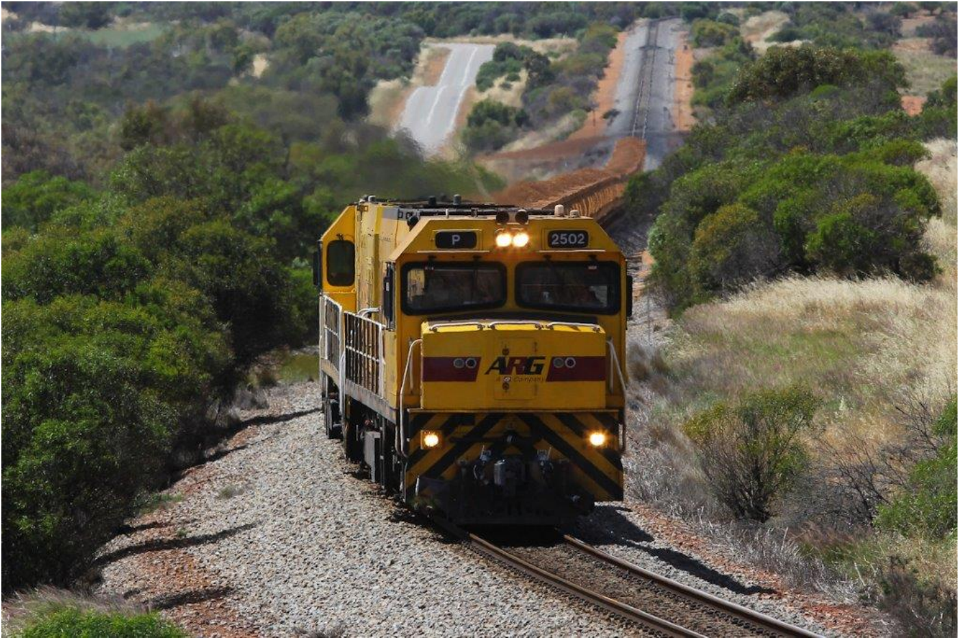
Ps 2502, 2515 & 2514 pass Old Grants with 7721 loaded Mt Gibson ore, 3 rd October.