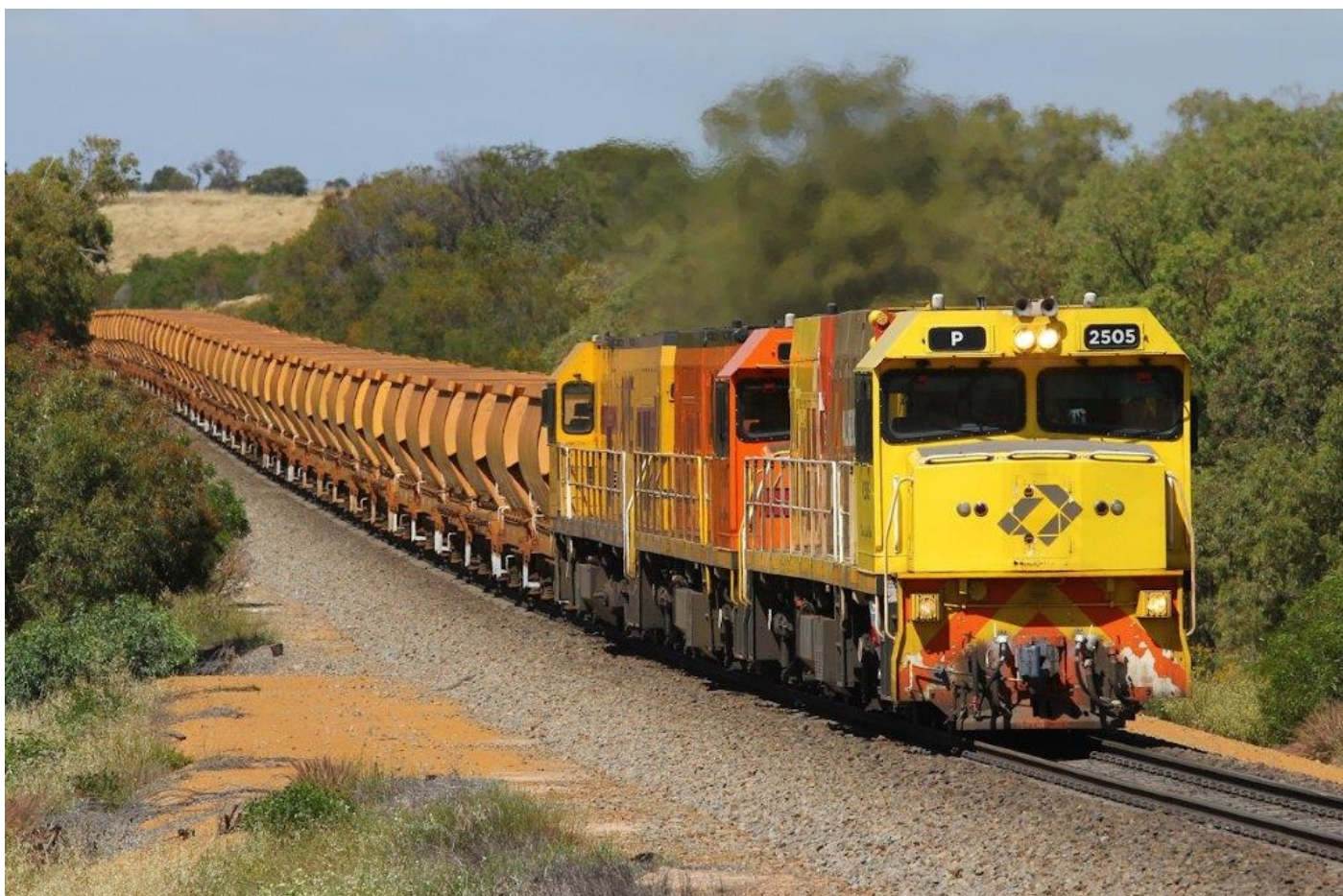
Ps 2505, 2516 & 2514 pass through Bringo with 1720 empty Mt Gibson, 11 th October.