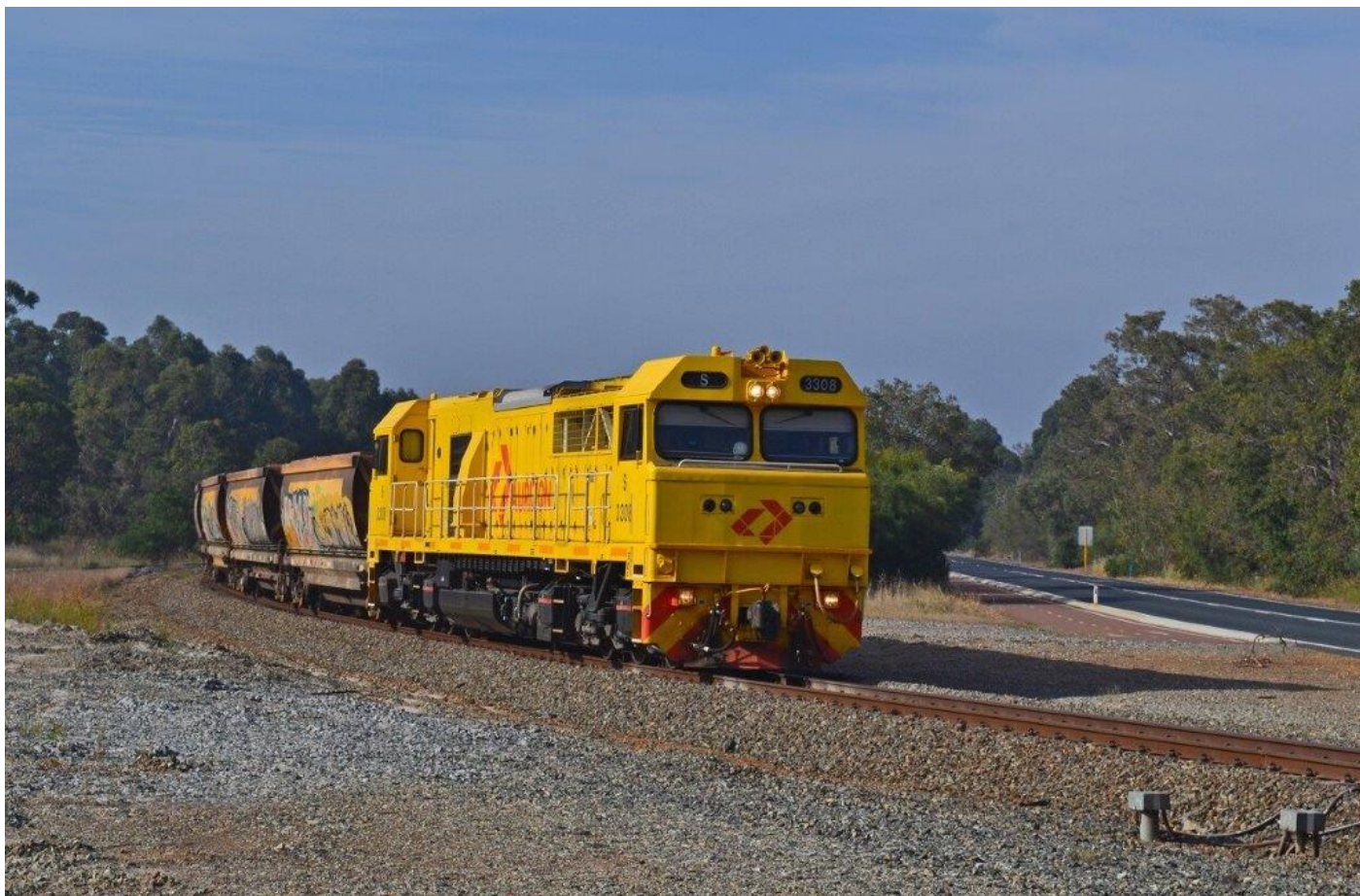
S3308 brings 7966 loaded bauxite through Mundijong Junction, 31 st October.