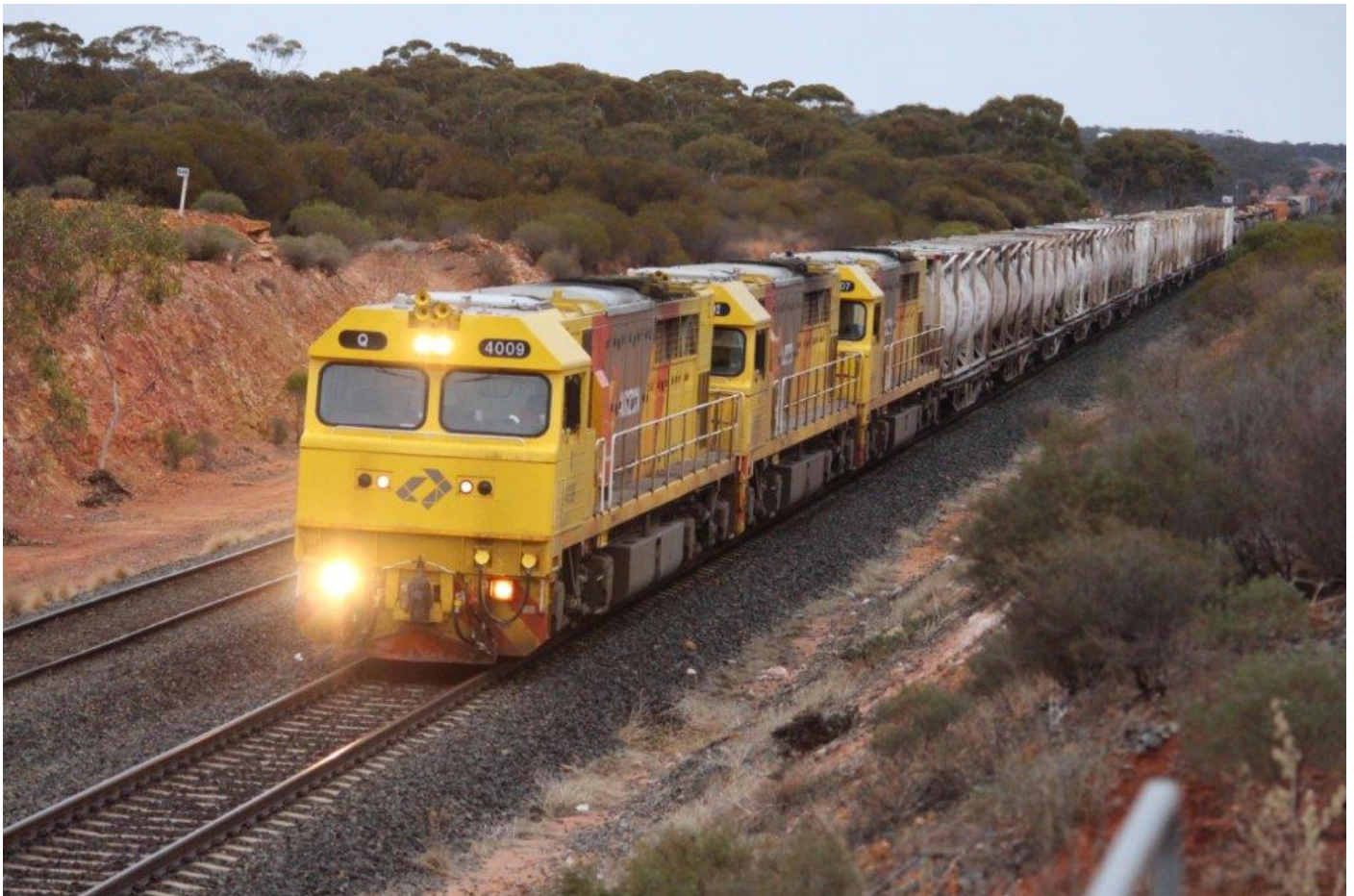
Triple Qs 4009, 4002 & 4007 on 6025 approach West Kalgoorlie yard, 3 rd October.