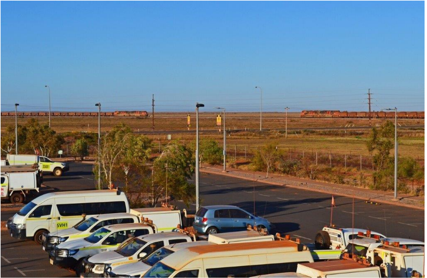
4459 & 4375 with a loaded ore cross 4376 & 4439 on a single empty rake, The Haven camp, 16 th October.