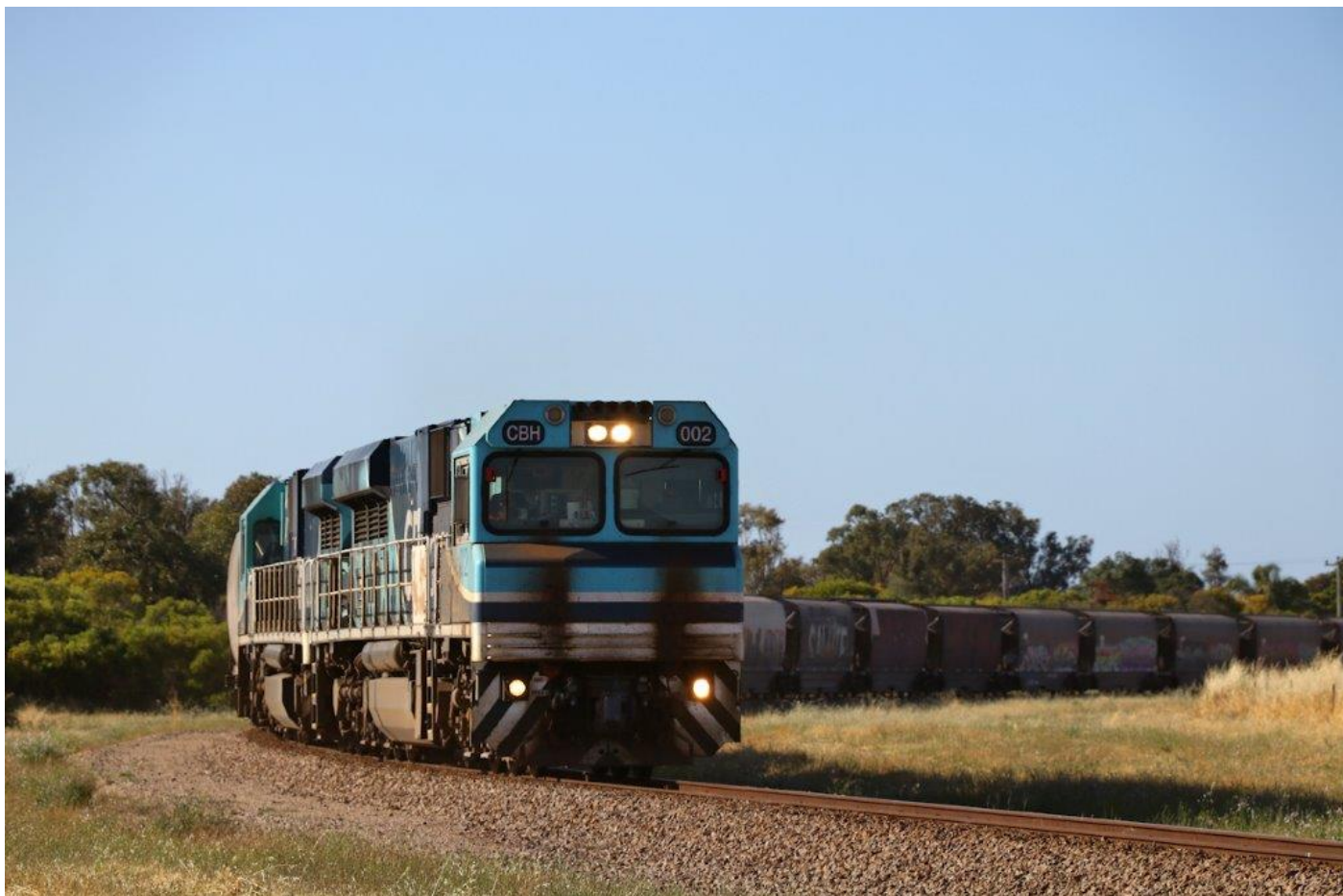
CBHs 002 & 011 roll away from Walkaway with 6G51 empty grain, 9 th October.