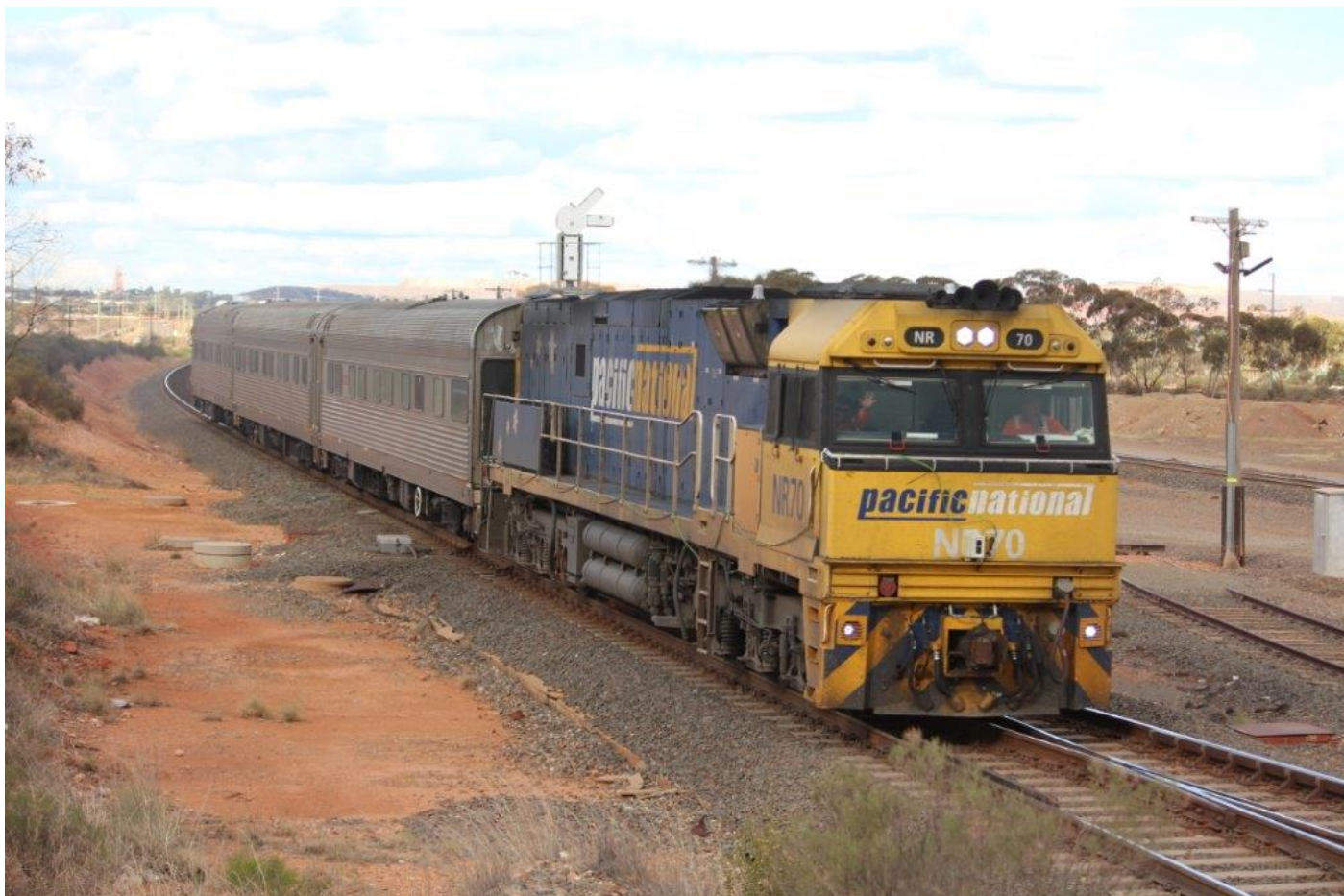
NR70 brings 7AK2 from Parkeston into West Kalgoorlie, 22 nd October.