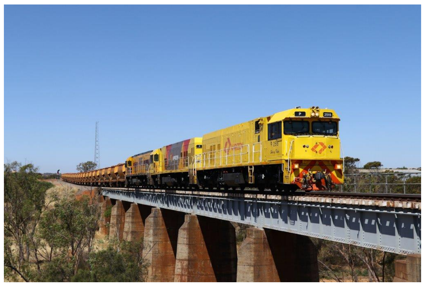
Ps 2515, 2504 & 2508 cross Greenough River, Eradu, with 5721 loaded Mt Gibson ore, 26/11.