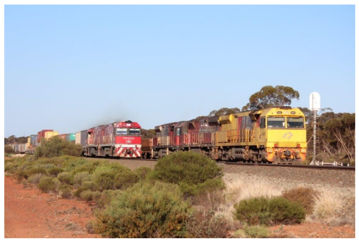
So much red – NRs 74 & 75, 7MP7; ACC6031, MRLs 006 & 001, 5042; Binduli, 26<sup>th</sup> November.