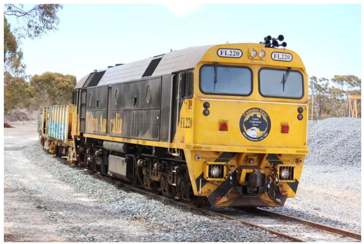
FL220 and ballast rake stabled on ballast siding, Hampton, 15<sup>th</sup> November.

An extremely rare NR-led ore: NR12, CF4408, AC4301, CF4405 on 1MR1 midway Binduli-Hampton, 15<sup>th</sup> November.