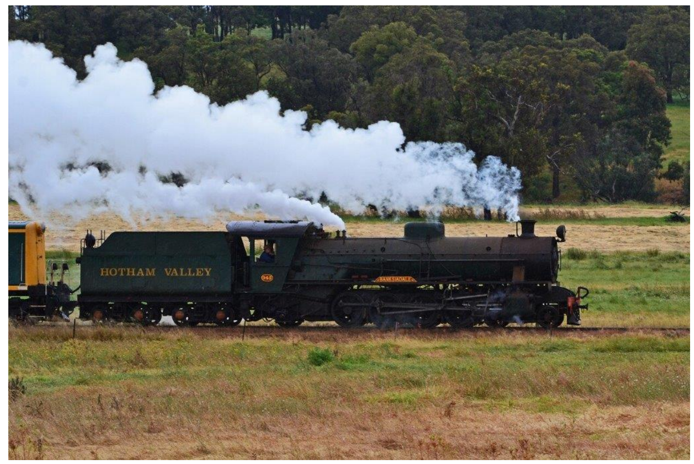
Page 3 of 30