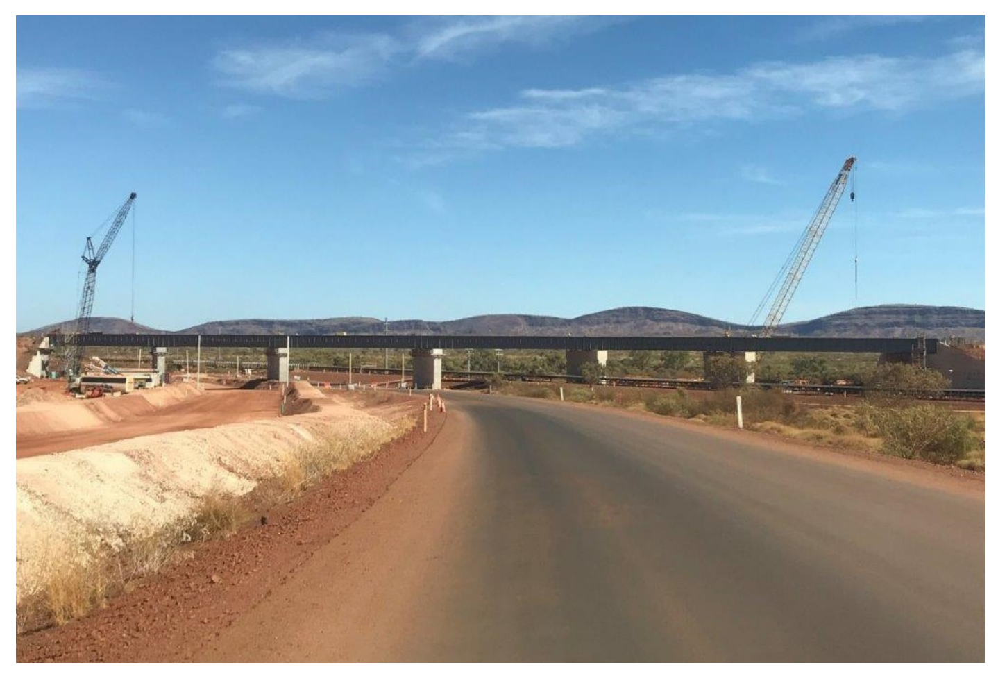
FMG's new bridge crosses over the Rio Tinto conveyor from Silvergrass, Brockman mine, 19/11.