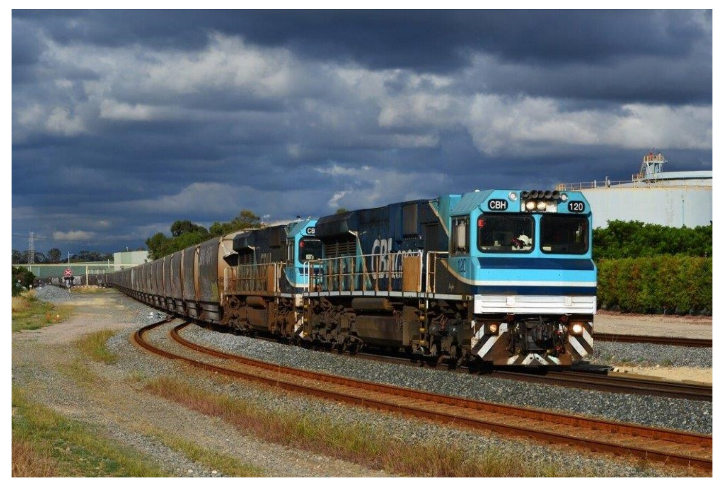
CBHs 120 & 118 bring 2S56 from Forrestfield into Kwinana, 2<sup>nd</sup> November.