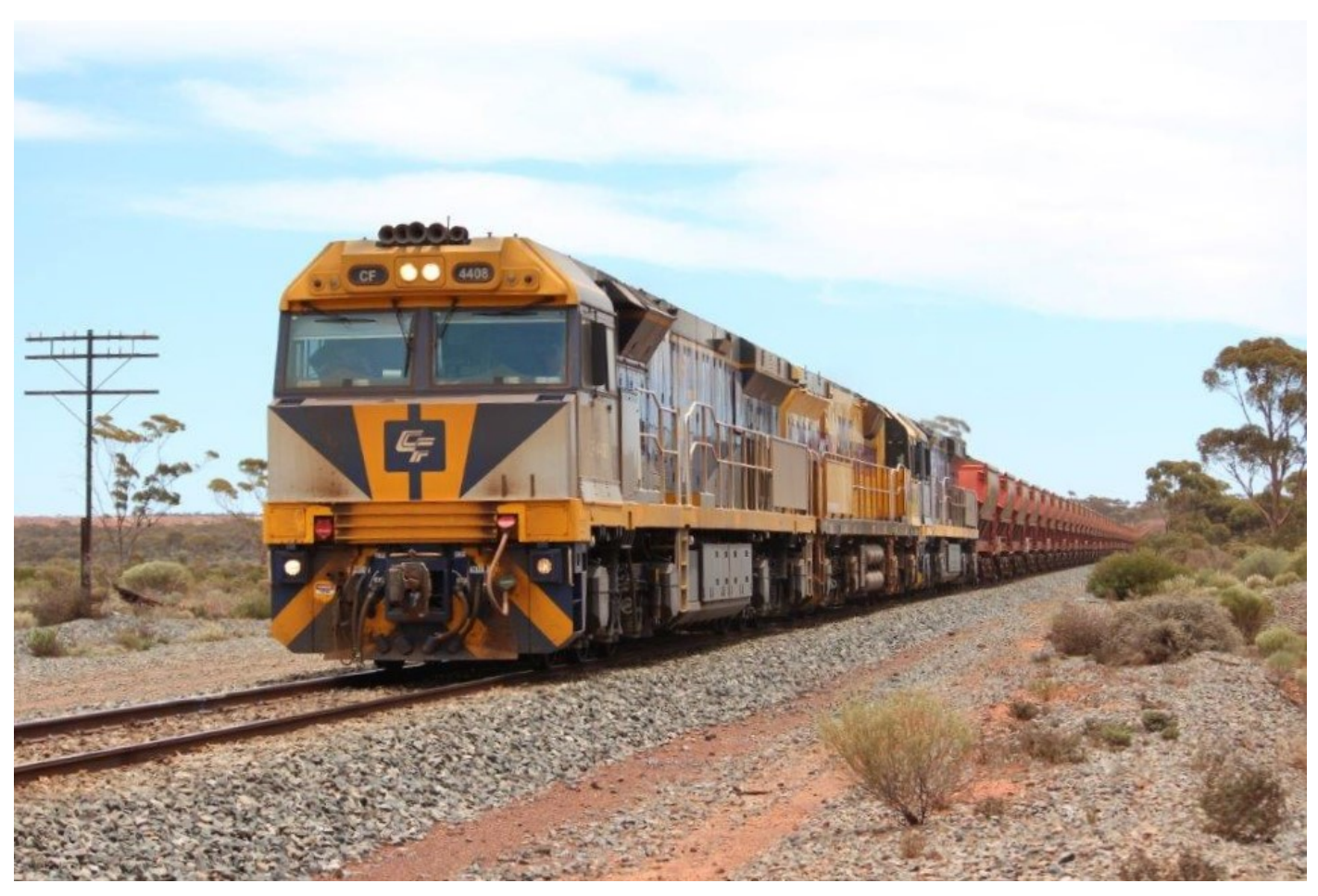
Only the second time a CF has led a Kooly ore – CF4408, AC4305 & CF4406, 1MR1, near Hampton, 22<sup>nd</sup> November.