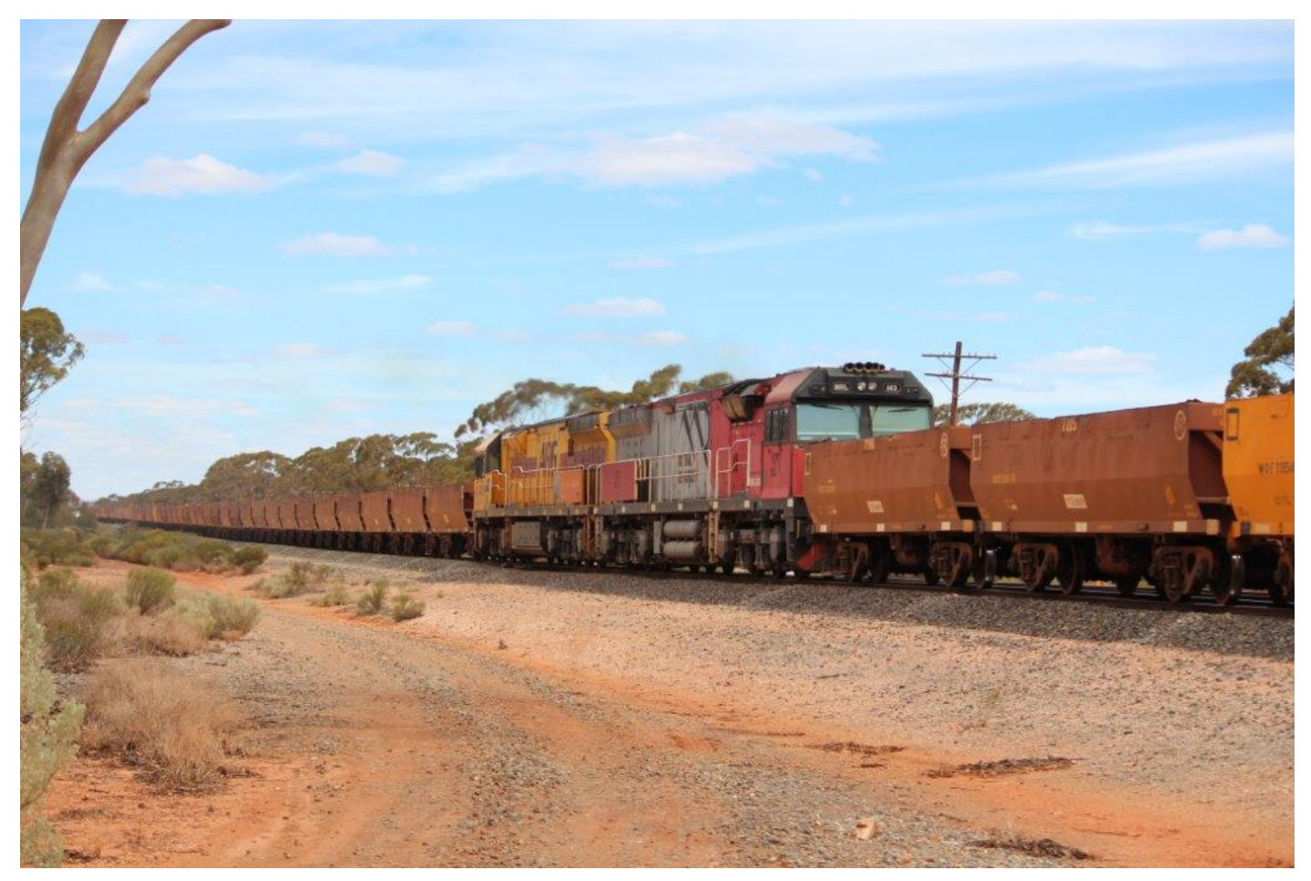
Aurizon-crewed 1040 empty ore's DPU are MRL003 & AC4302, Hampton, 15<sup>th</sup> November.