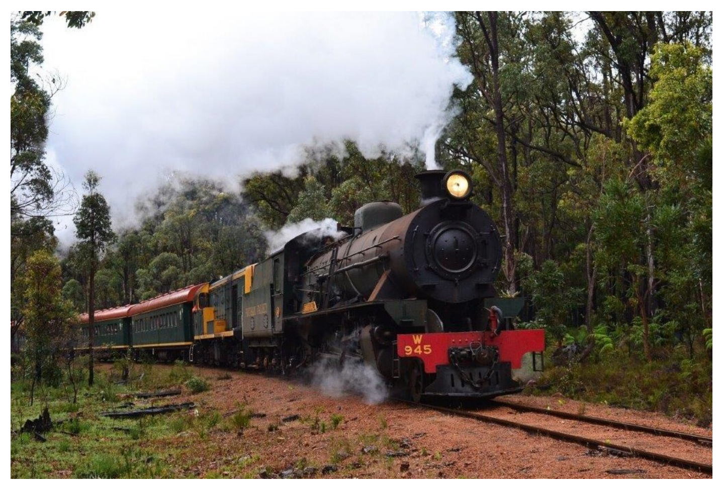
W945 leads F40 on another Hotham Valley passenger run, then returns with the English Electric diesel trailing, 1<sup>st</sup> November.