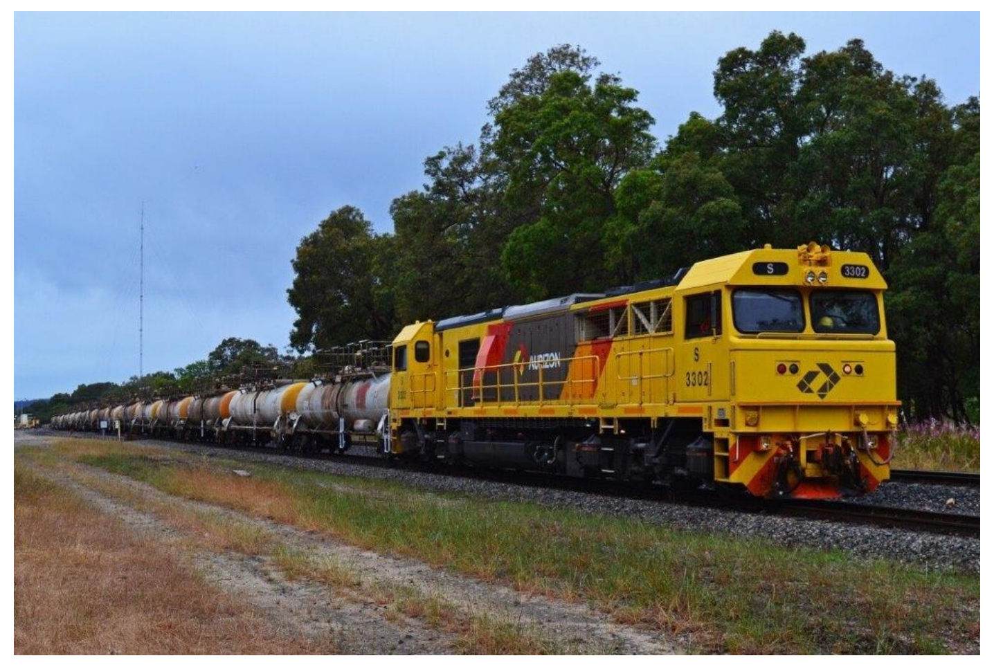
S3302 runs a caustic train through Mundijong, 1<sup>st</sup> November.