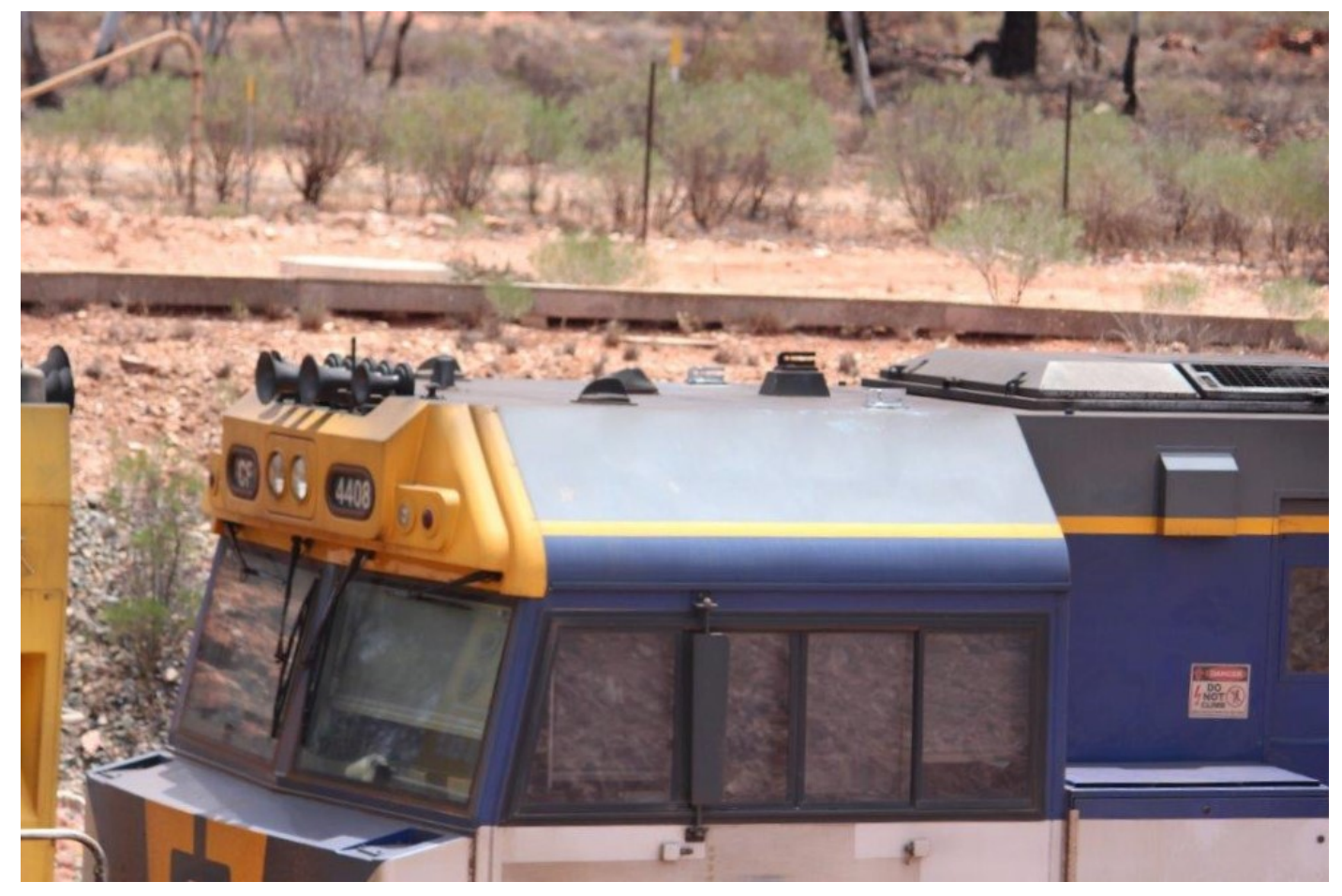
The two new small antennae on the roof of CF4408 are part of the newly-installed distributed power unit, 15/11.