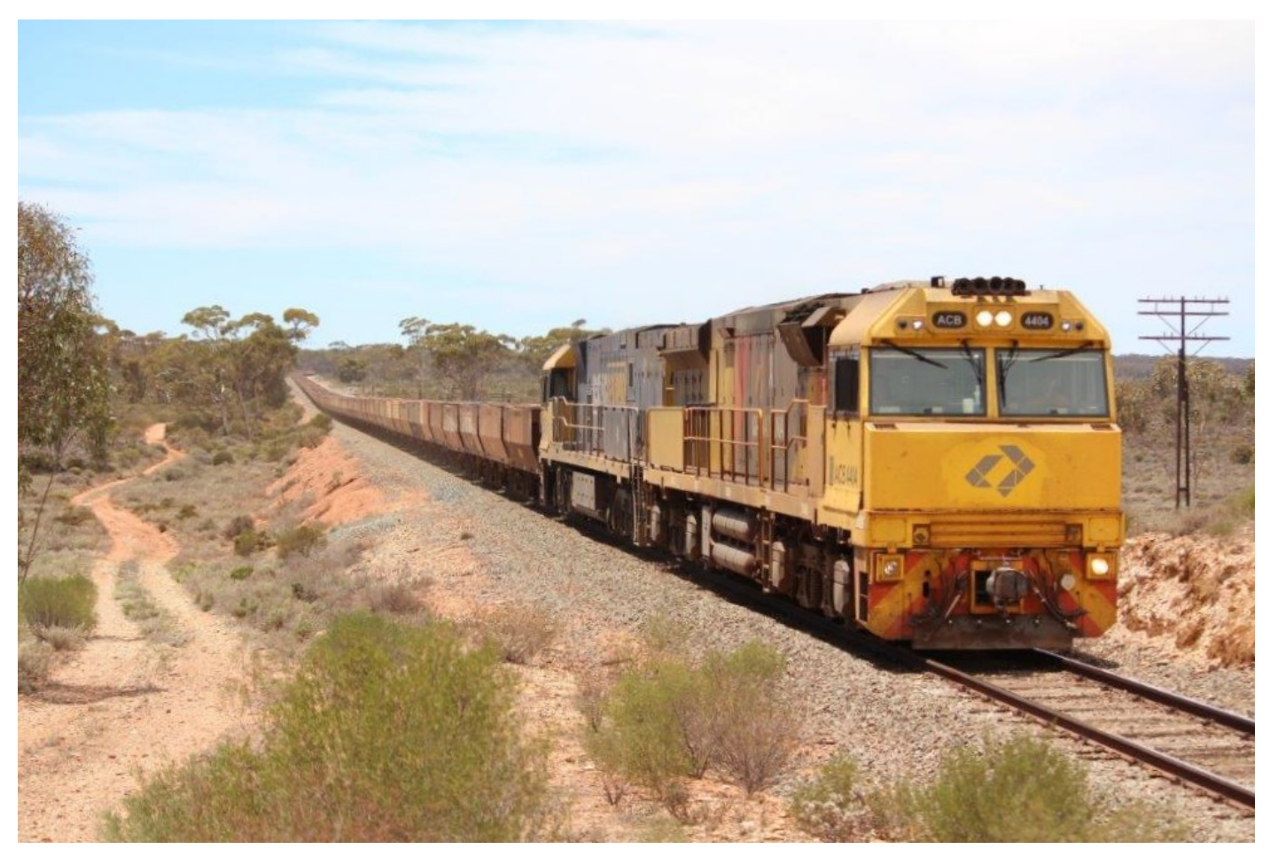
ACB4404 & NR76 (above) with DPU CF4405 & AC4301 (below) on 1040 empty ore, halfway between Hampton and Binduli, 22<sup>nd</sup> November.