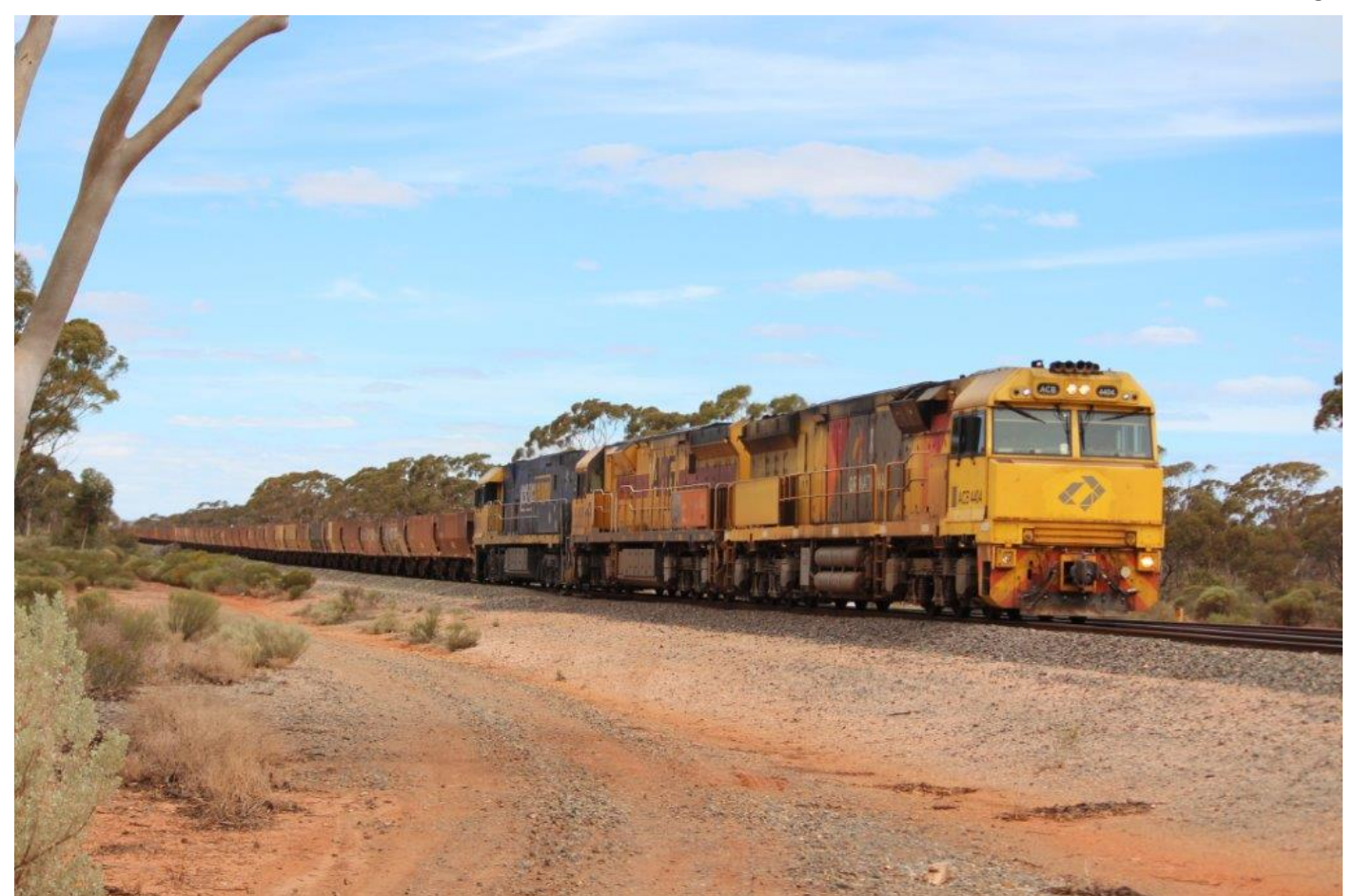
ACB4404, AC4307 (to remove at Binduli for service) & NR76 depart Hampton on 1040, 5/11. Page 18 of 30