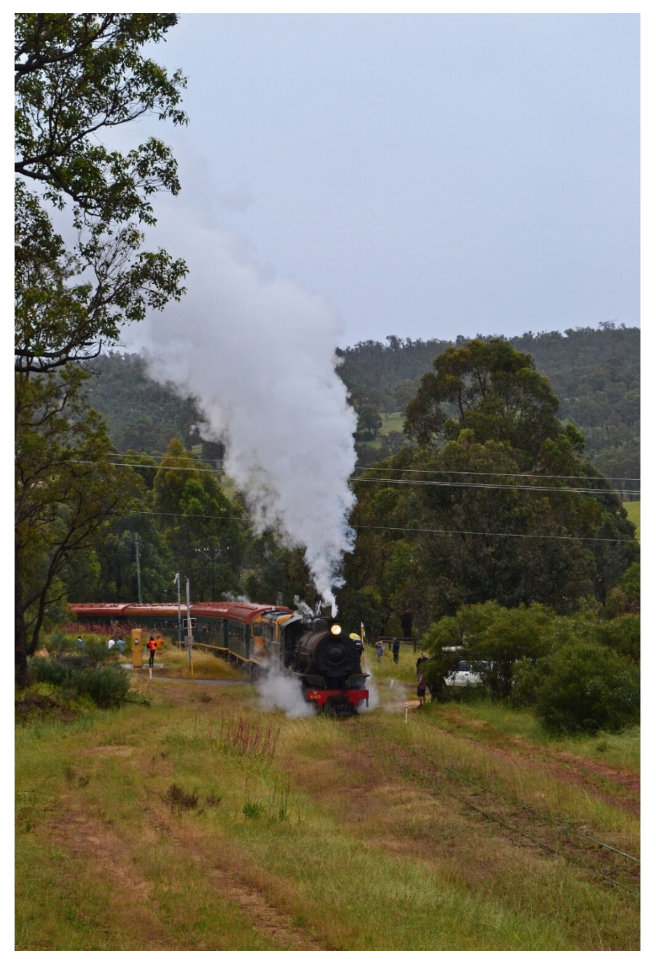
W945 and F40 on a Hotham Valley service on a wet \mathbf{1}^{st} November. Page \mathbf{4} of \mathbf{30}