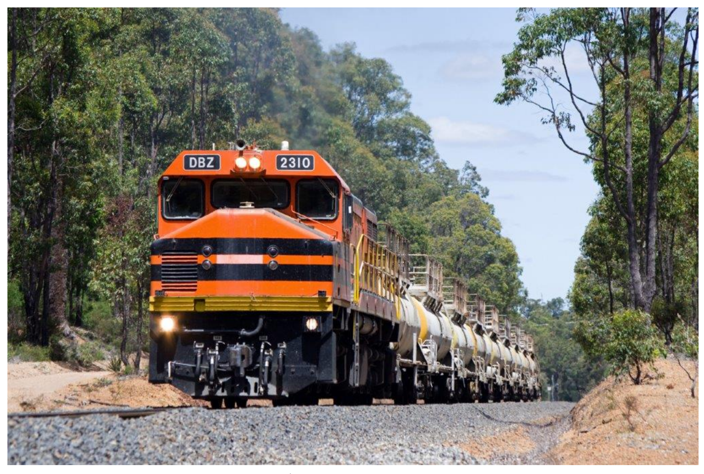
DBZ2310 runs 7853 caustic soda at Worsley, 28<sup>th</sup> November.