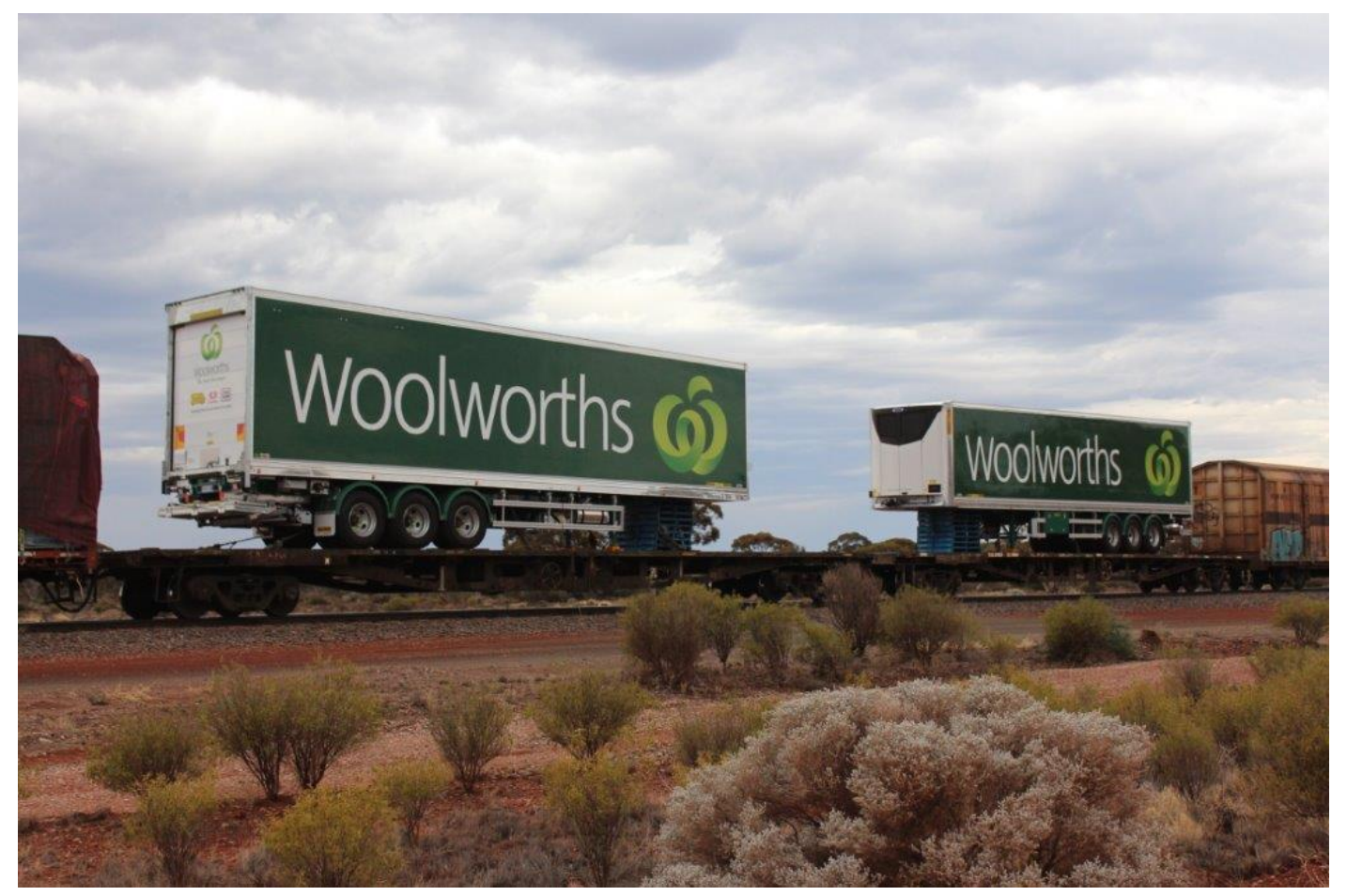
Two new Woolworths refrigerated trailers aboard 6MP9, 1<sup>st</sup> November. Page 7 of 30