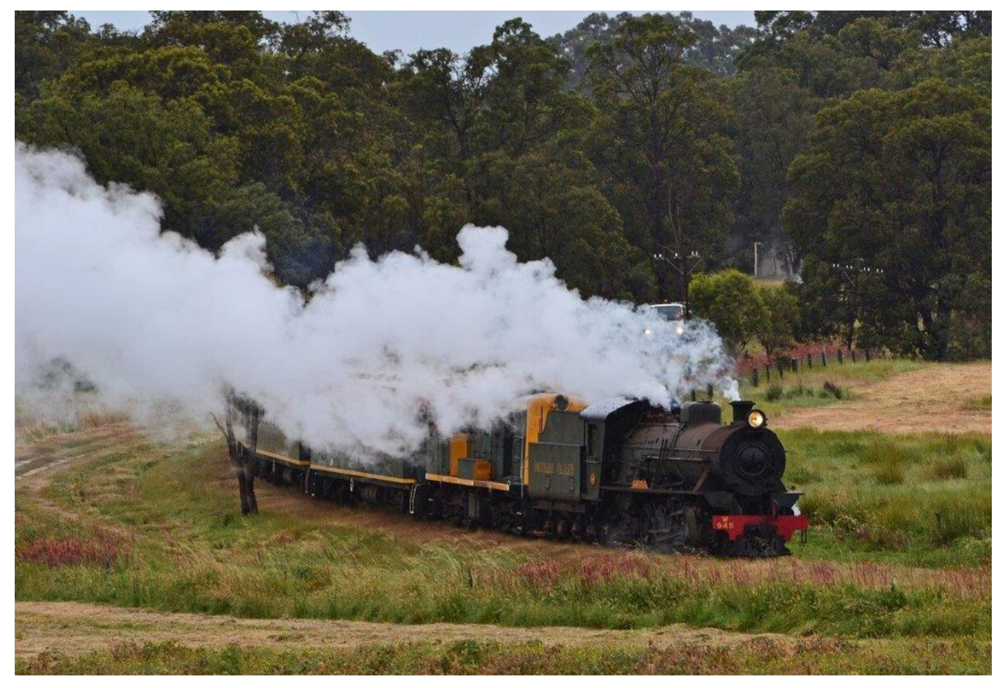
W945 (with F40 as backup) hauls a Hotham Valley service on the final steam run of the season, 1<sup>st</sup> November. These trains run from Dwellingup into the Darling Ranges forest.