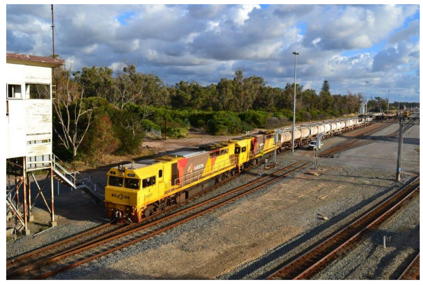
Qs 4007 & 4006 ease 2025 Kalgoorlie freight out of Kwinana, 2<sup>nd</sup> November. Page 9 of 30