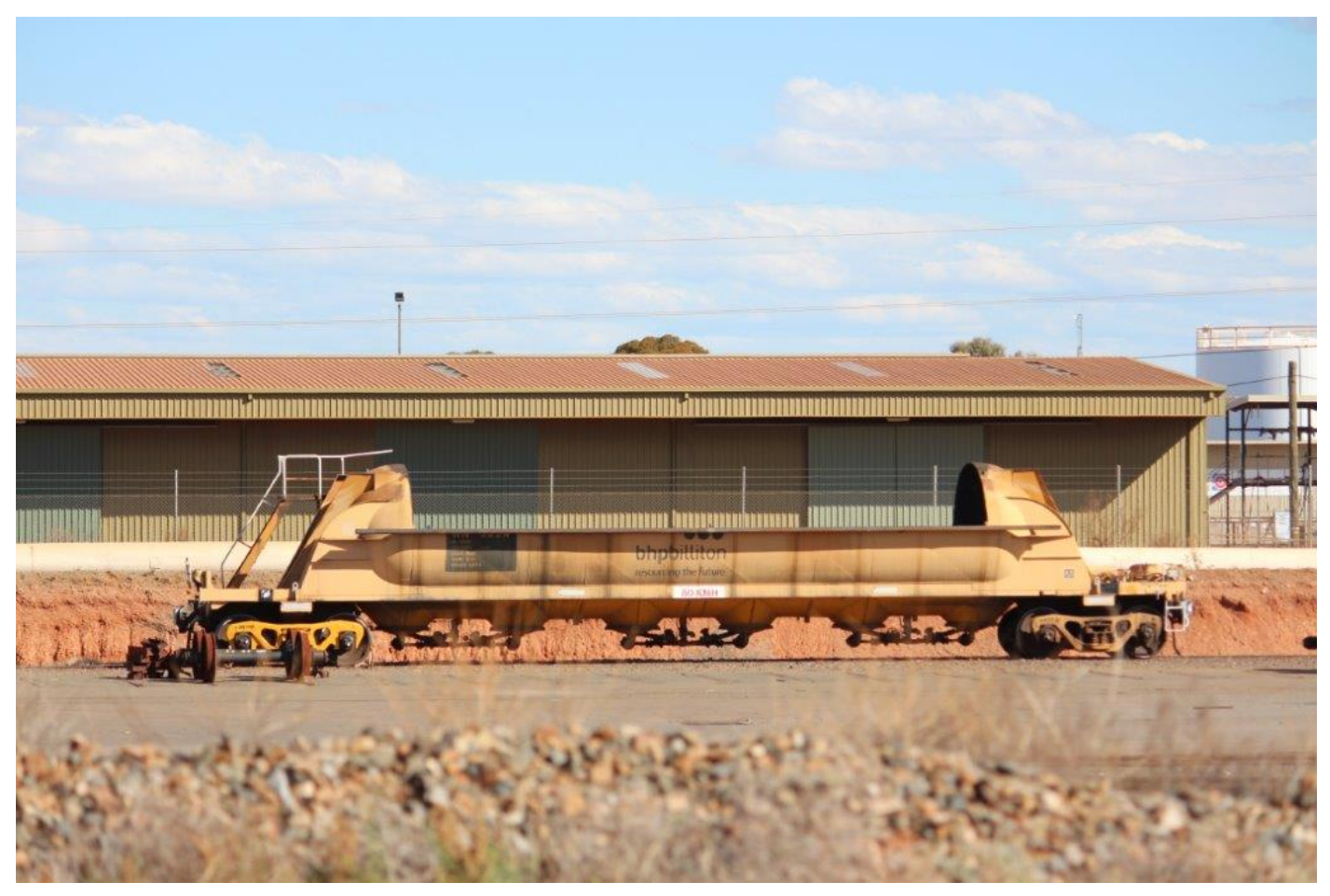
WN529 buckled upper portion during unload, awaits construction of a new top, West Kalgoorlie, 13<sup>th</sup> November.