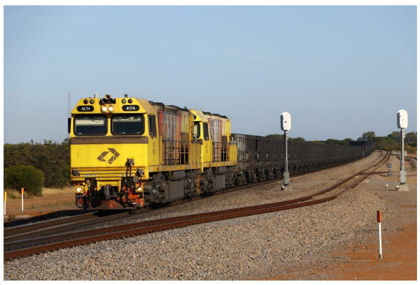
ACNs 4174 & 4141 pass through Northern Gully on 7763 loaded Karara ore, 21<sup>st</sup> November.