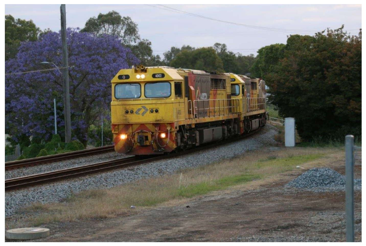
1025 Kalgoorlie freight is led through Woodbridge by Qs 4002 & 4001, 15<sup>th</sup> November.