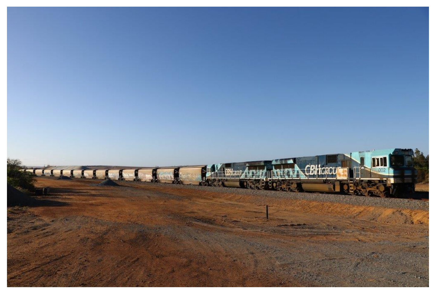
CBHs 002 & 001 stabled at Mingenew with an empty grain rake, 15<sup>th</sup> November.