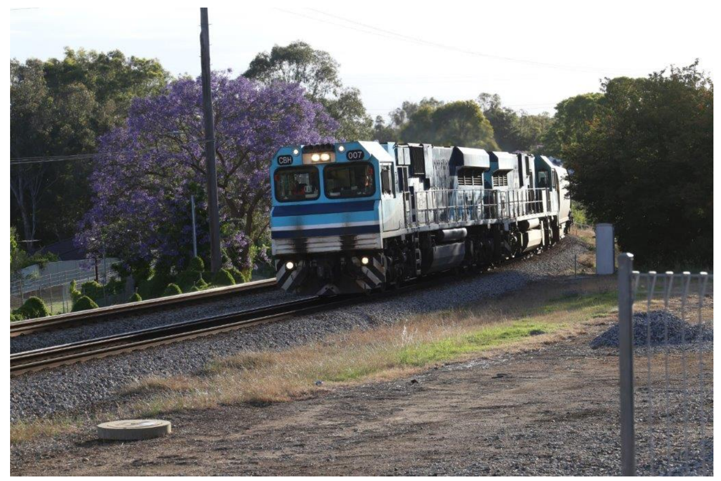
CBHs 007 & 010 power 1K63 empty grain through Woodbridge, 15<sup>th</sup> November.