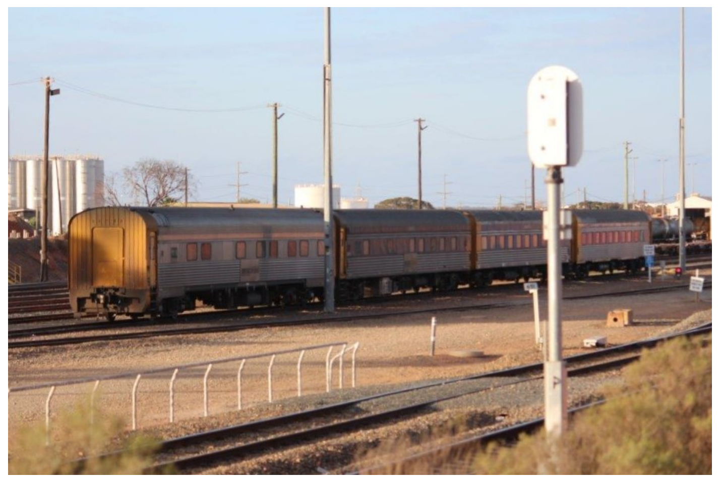
Coaches RZAY944 and former Overland RZEYs 2, 1 & 3 await their next use, West Kal, 25/11.