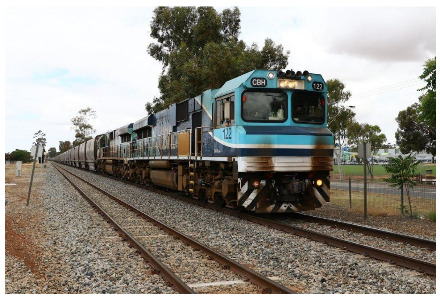
Standard gauge CBHs 122 & 118 on 3S58 loaded grain, Northam, 10<sup>th</sup> November.