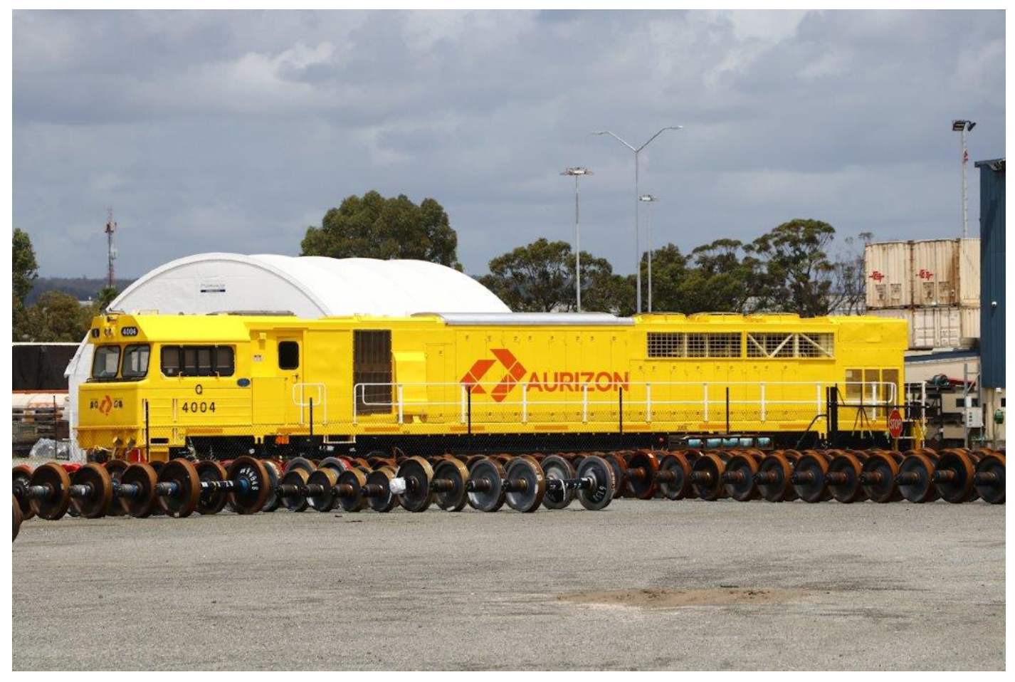
After several failures, Q4004 awaits attention at Gemco Forrestfield, 15<sup>th</sup> November.