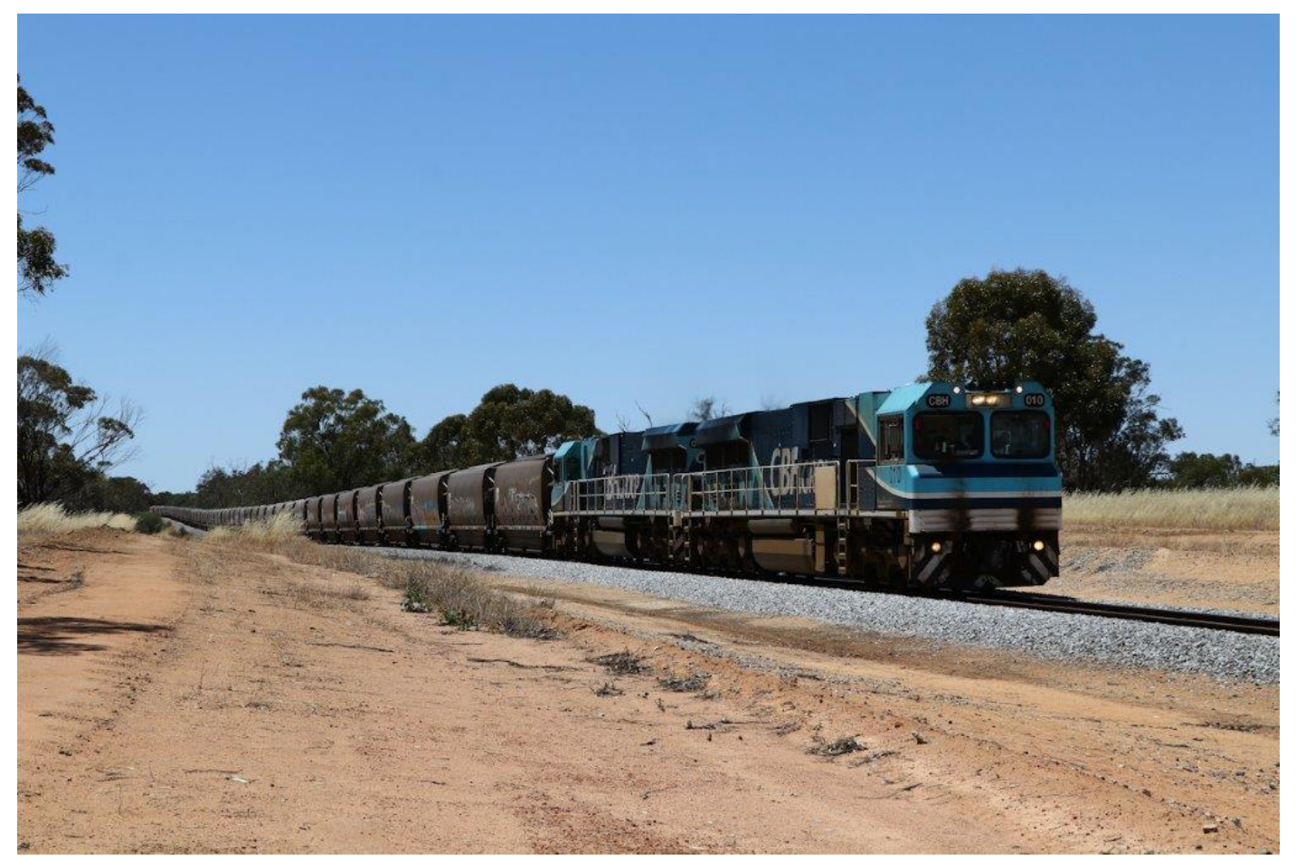
CBHs 10 & 11 work 5K05 empty grain north of Brookton, 12<sup>th</sup> November. Page 14 of 30