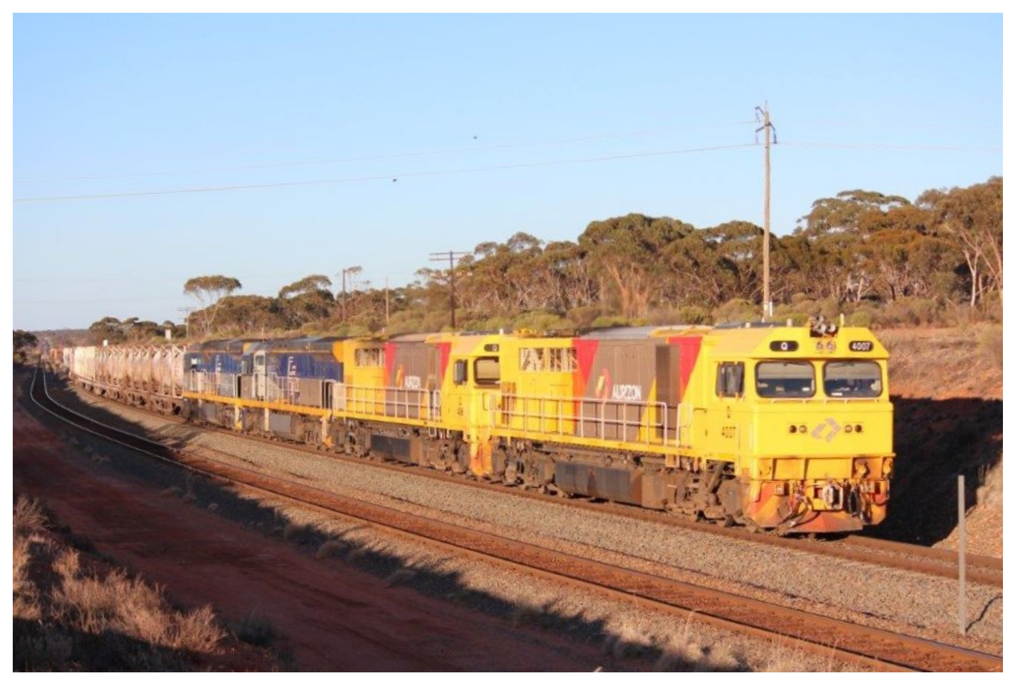
Qs 4007 & 4006 haul CFs 4408 & 4405 ex DP install on 4025 approaching West Kal, 12/11.