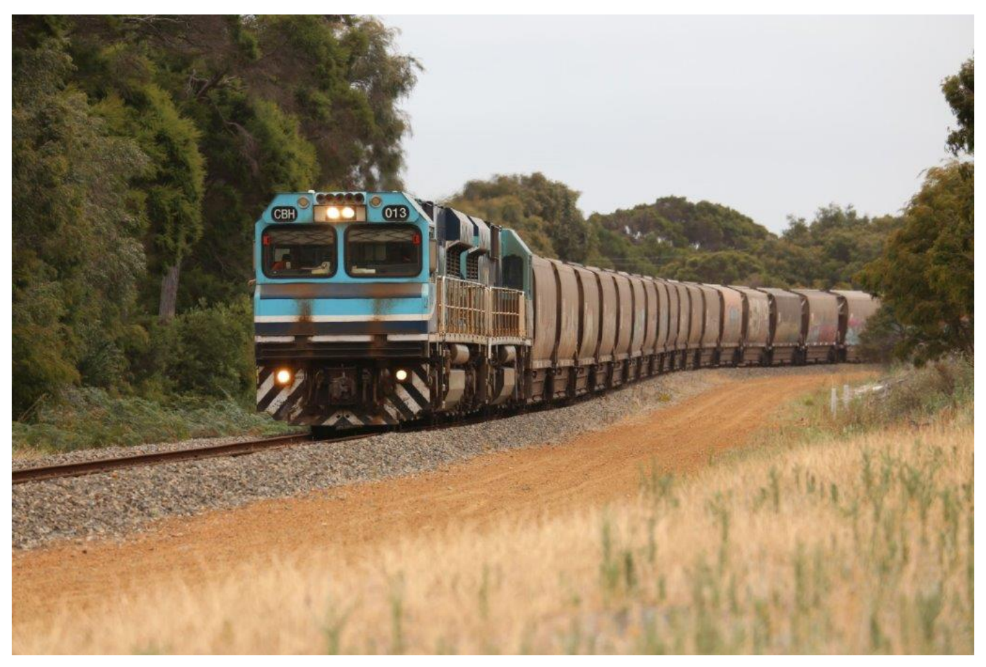
CBHs 013 & 013 haul 4A73 loaded grain to Albany near Cuthbert (above), and approaching Gledhow (below), 30<sup>th</sup> December.