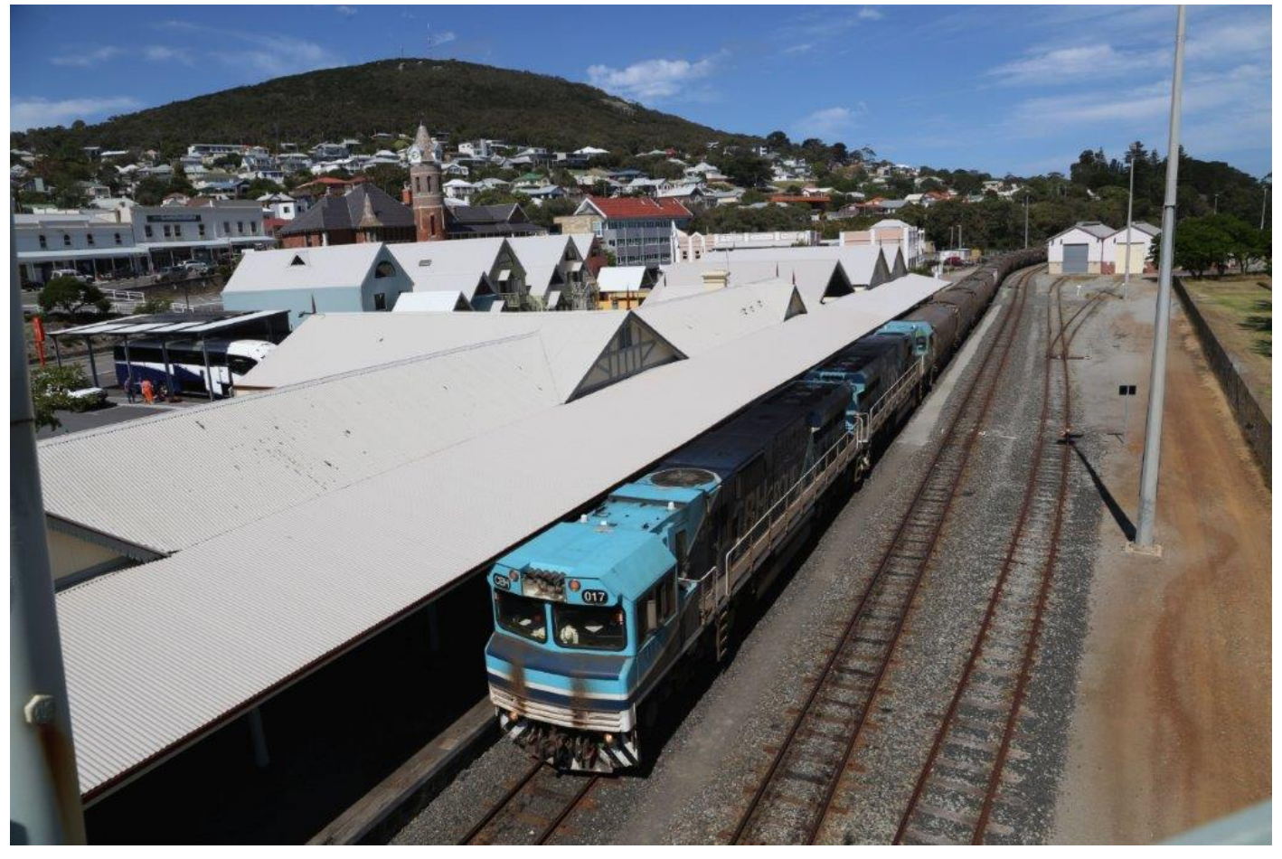
After unloading, CBHs 017 & 013 head back to Cranbrook for another load of grain. 3A74 empty hoppers passes Albany station (above), and Mt Elphinstone (below), 29<sup>th</sup> December.