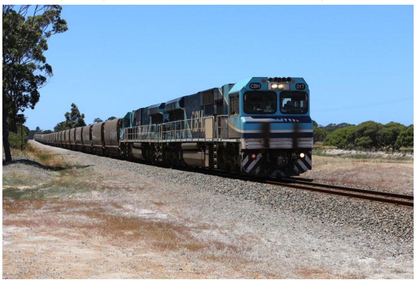
Page 4 of 11