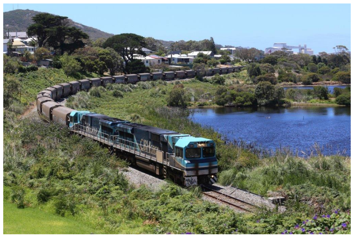
2A74 empty grain approaches Small Park, Mt Melville (above), and Old School Rd, Cuthbert (below), 28<sup>th</sup> December. CBHs 017 & 013 provide the power.