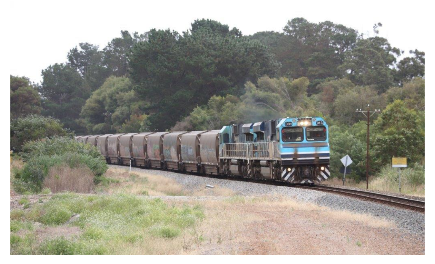
Page 10 of 11