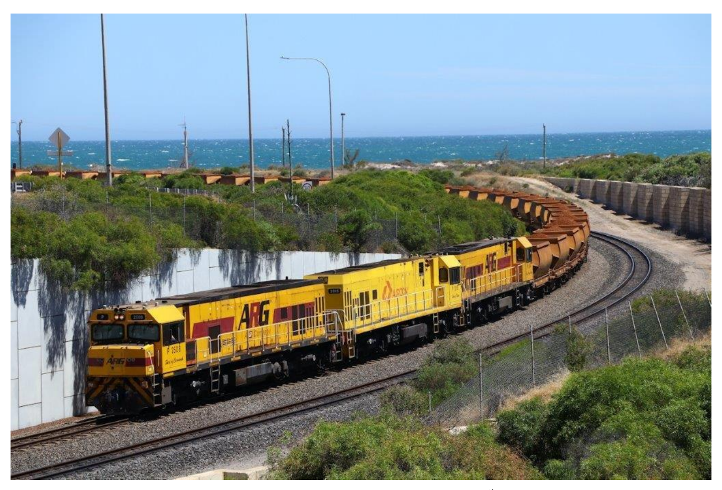
Ps 2508, 2515 & 2514, final 721 loaded Mt Gibson ore: 2721, Geraldton port, 28<sup>th</sup> December.