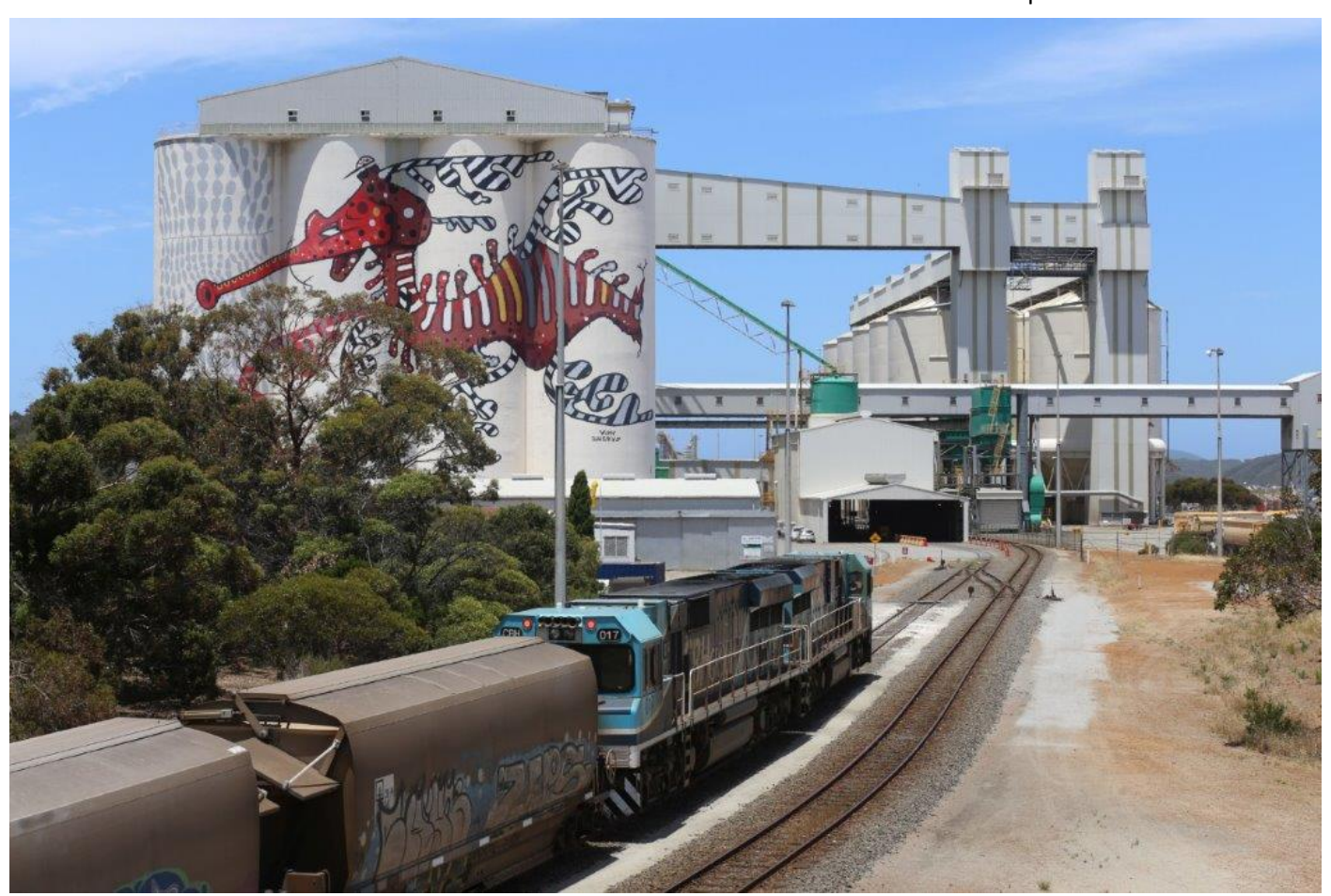
Page 7 of 11