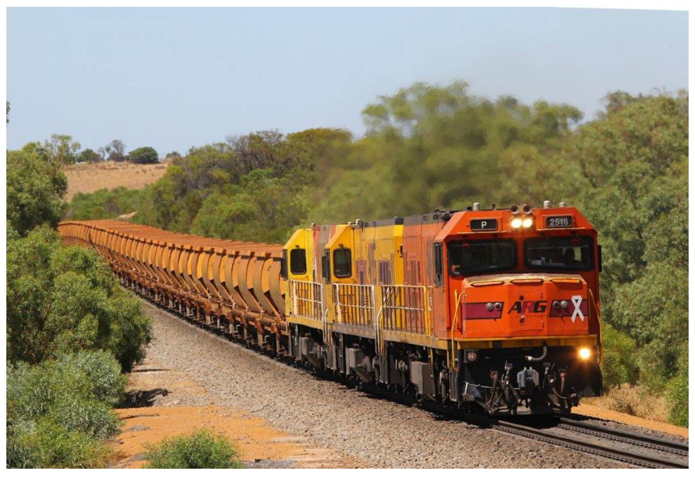
Ps 2516, 2502 & 2505 on 1720 empty Mt Gibson, Bringo East, 27^{th} December.