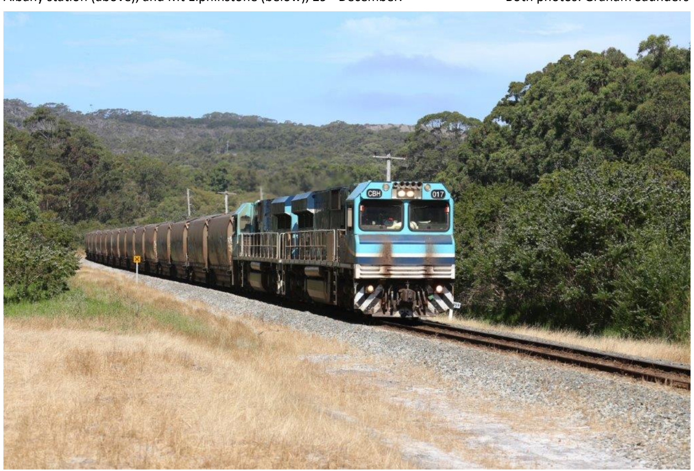
Page 8 of 11