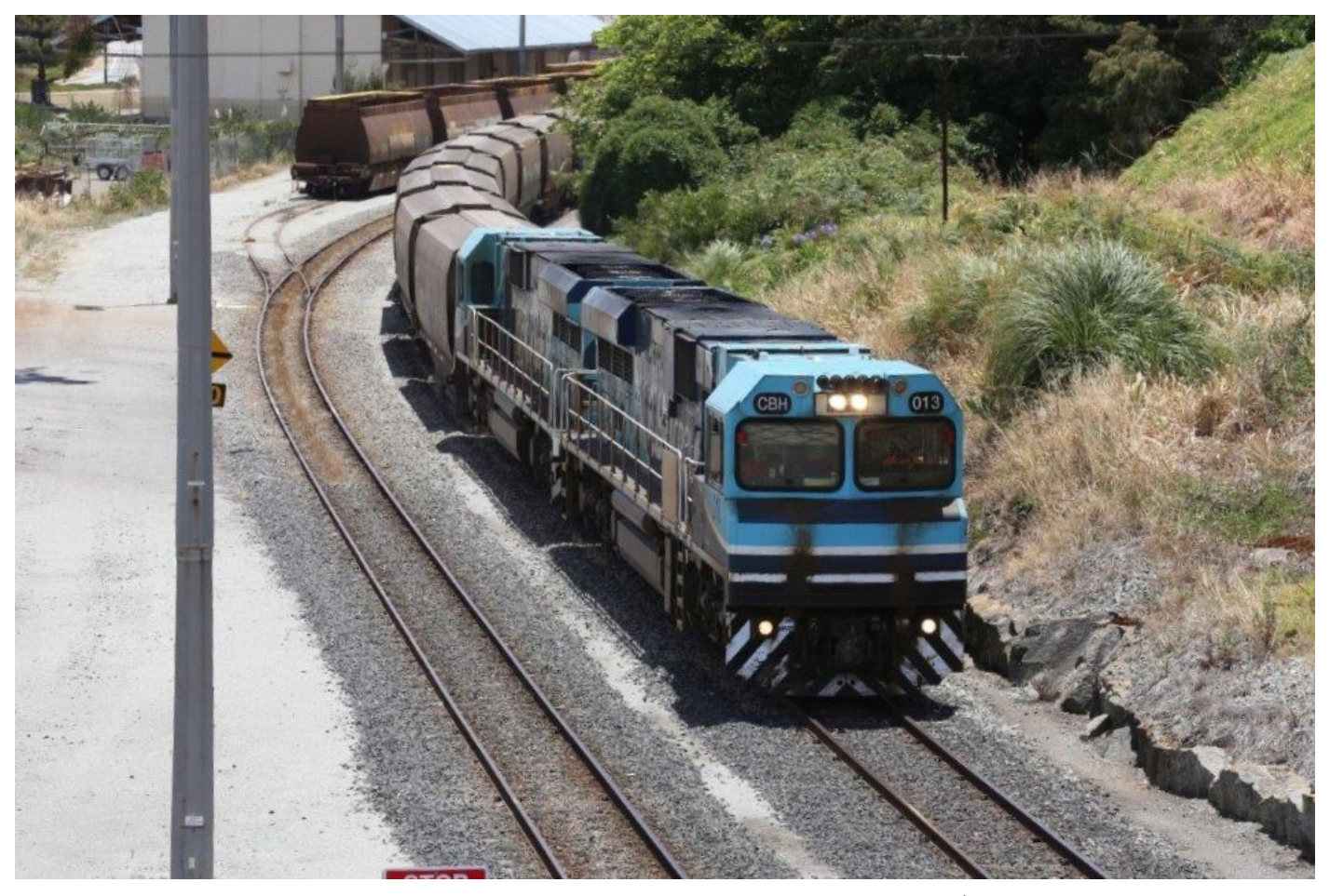
3A73 approaches Albany's CBH facility (above and below), led by CBHs 013 & 017, 29<sup>th</sup> December.