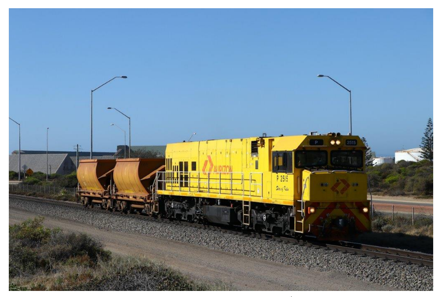
P2515 and two empty hoppers between Separation Point and Beachlands, 29<sup>th</sup> December.