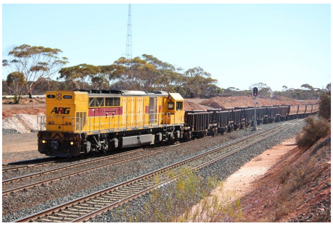
Q4013 enters West Kalgoorlie yard on Christmas Eve 2020, 24/12, hauling train 5111, 66 WOC/WOD/WOE hoppers retrieved from storage in Avon Yard and reactivated for Kooly-Esperance ore traffic.

NUMBER 12_2 A free monthly photo e-Mag of railway happenings in WA during December 2020