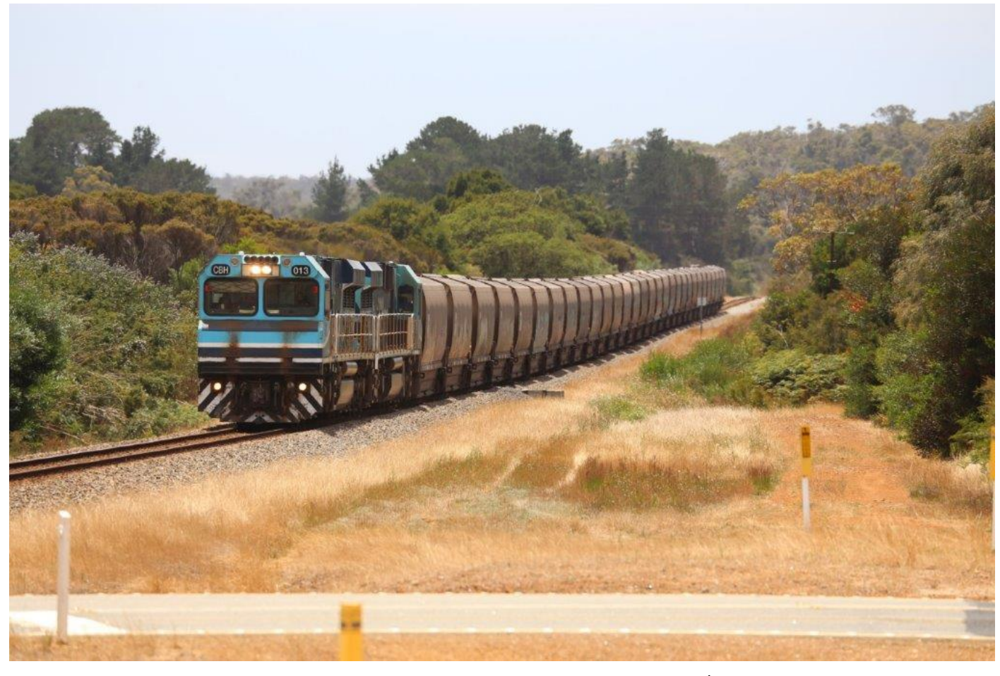
CBHs 013 & 017, 3A73 grain to Albany approaches South Coast Hwy, Marbelup, 29/12.