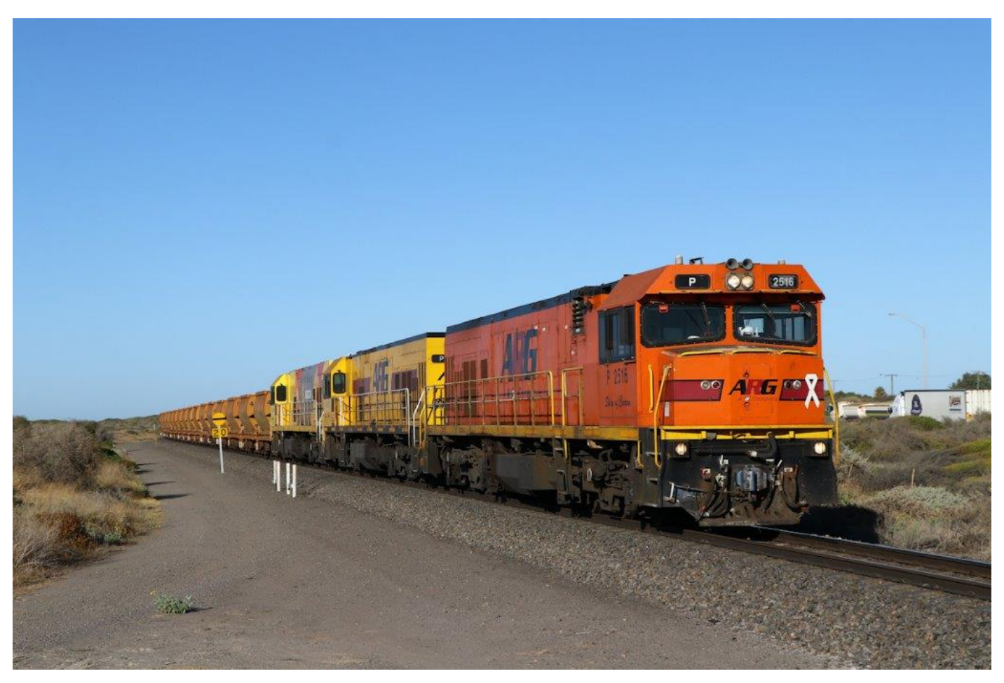
3720 empty Mt Gibson ore to stable at Narngulu; Mahomets Flats; Ps 2516, 2502 & 2505, 29/12.