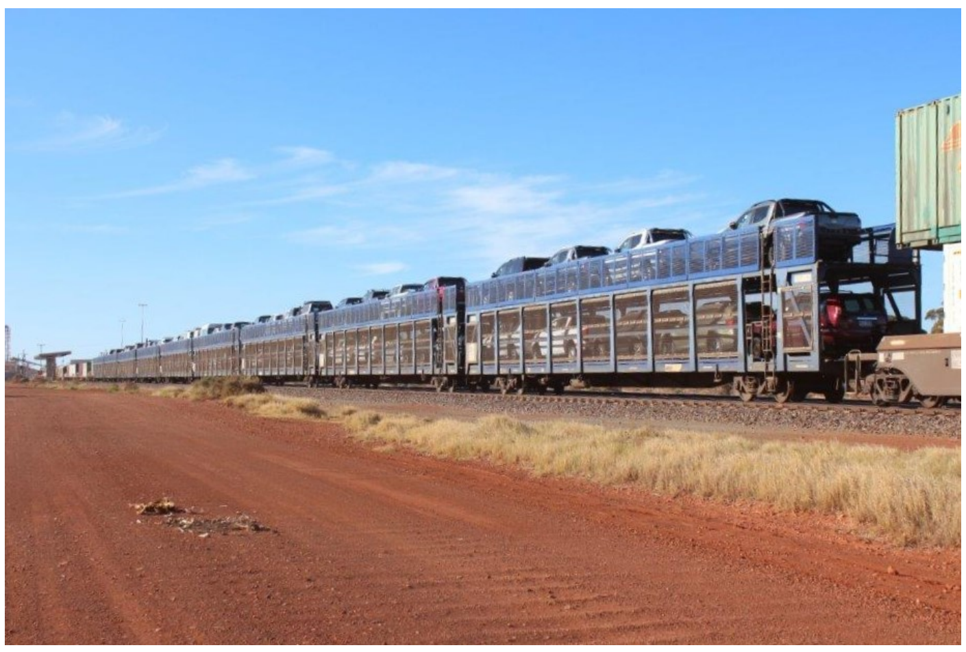
Almost like a decade ago! Nine RMOY car carrier wagons on 7MP5, 28<sup>th</sup> December. Page 5 of 11