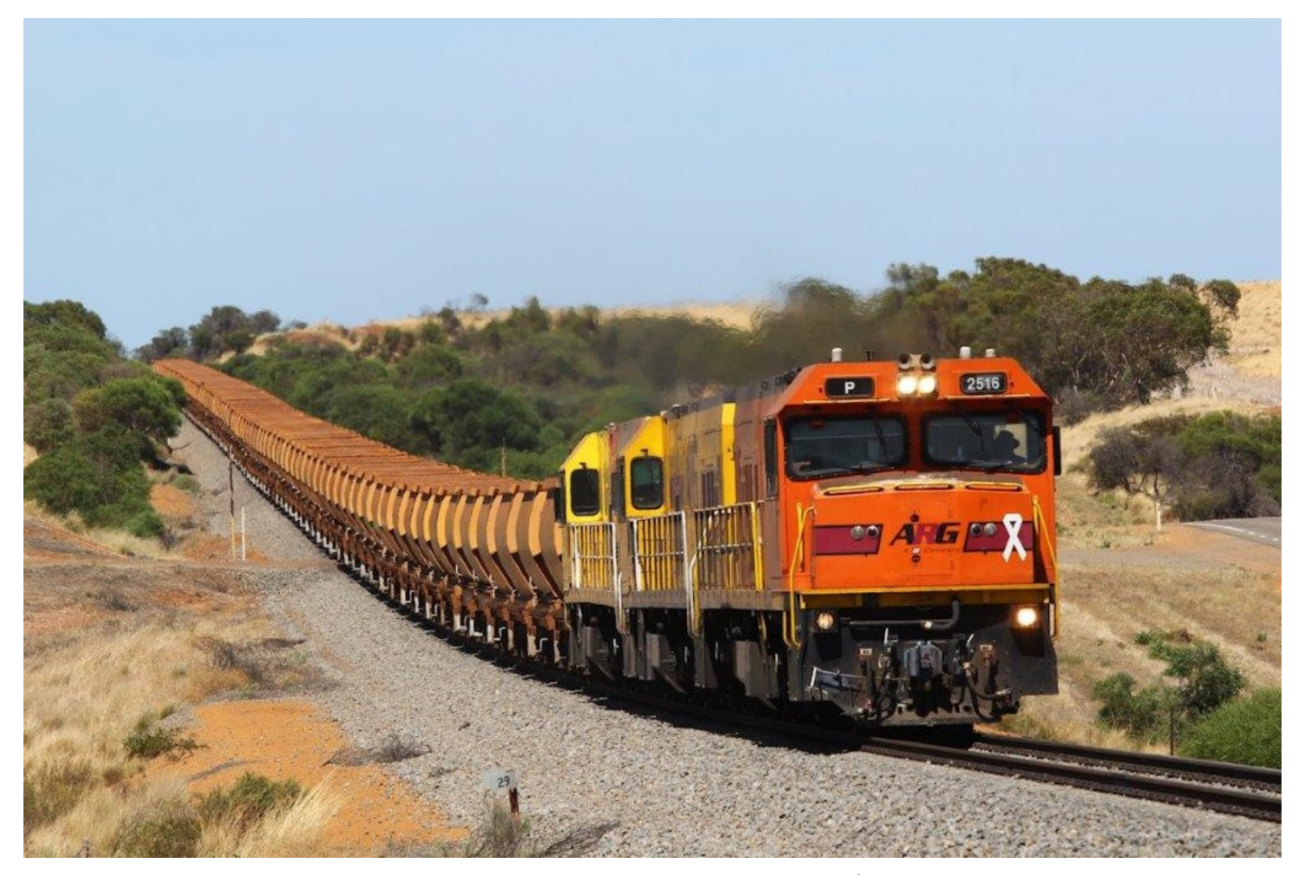
The final 720, 2720 empty Mt Gibson, Bringo West, Ps 2516, 2502 & 2505, 28<sup>th</sup> December.