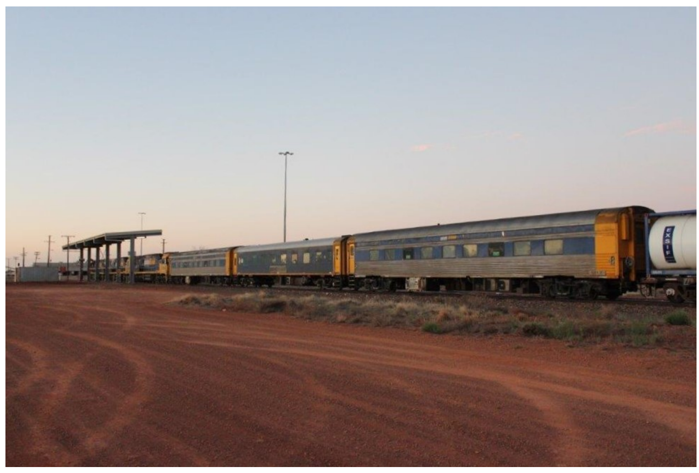
The usual coach balance on 1MP2 sees three behind NRs 76, 10 & 13, 29^{th} December.