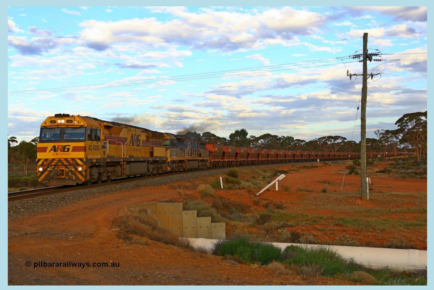
At Binduli 4032 empty ore train powers around the west leg behind AC 4303 and CF 4406 'Kiwi' with mid-train units AC class leader AC 4301 and CF 4408 'Mentor'. CF 4406 has been in the Pilbara previously. The AC's are AC43aci, the CF's are AC44aci.