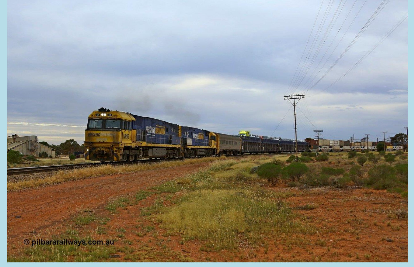
Page 10 of 14 Extra North 002

Above: Parkeston and SCT service 4PM9 gets underway behind SCT 004 and SCT 010 after crossing 3MP5. Below: PN train 3MP5 departs Parkeston behind NR 99 and NR 100 with RZBY 910 and 4 ROMY waggons.