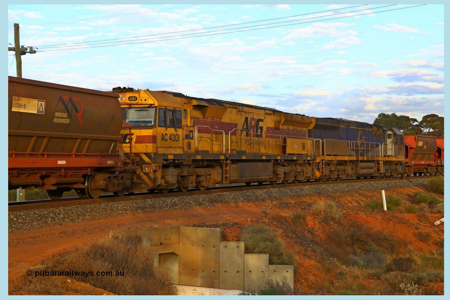
Page 3 of 14 Extra North 002