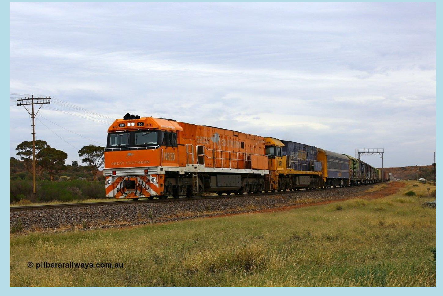
Page 5 of 14 Extra North 002

Two views of 4PM6 with NR 30 'Great Southern' and NR class leader NR 1 with crew coach RZDY 103. Waiting line clear at West Kalgoorlie above and going through the gauge check at Parkeston below.