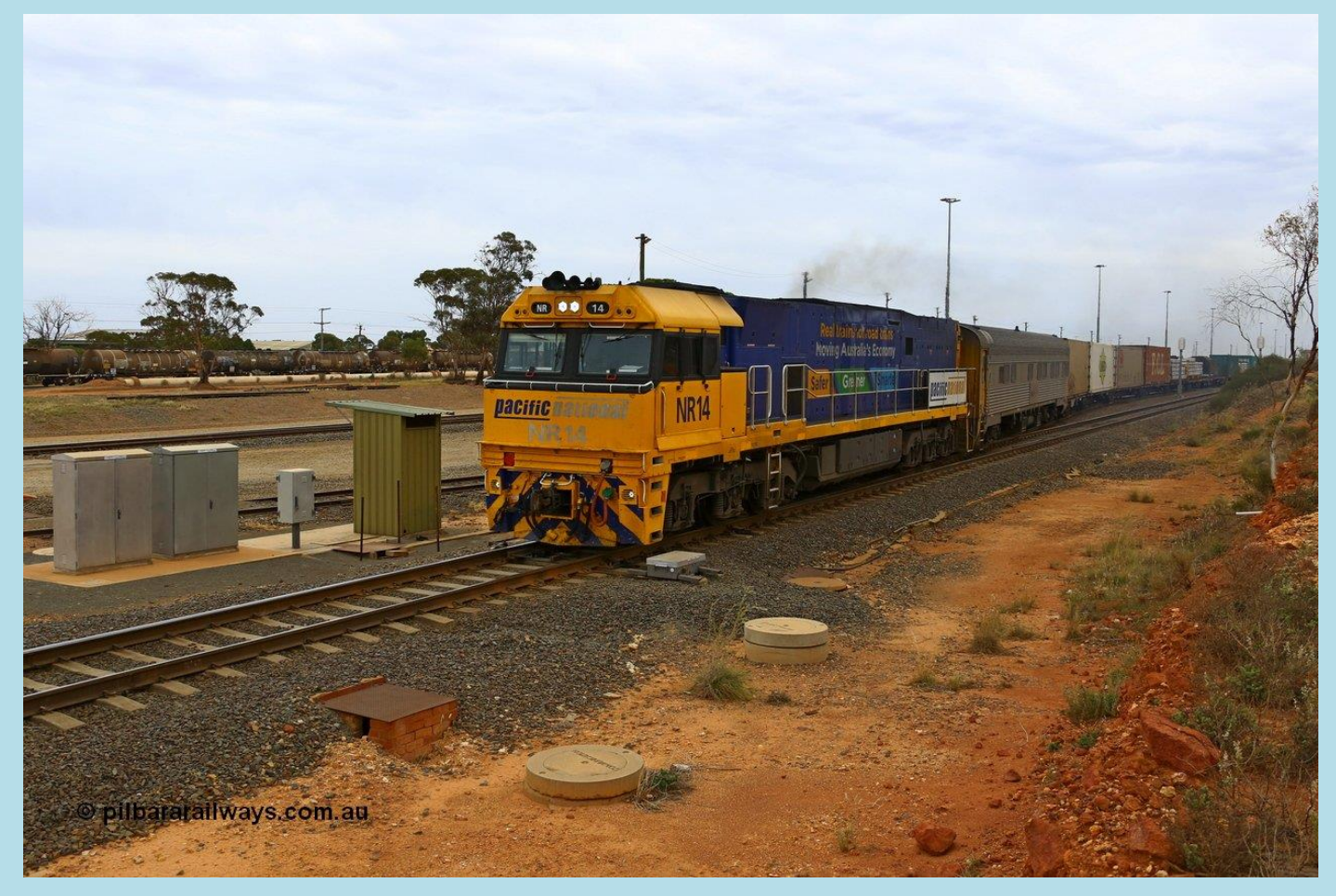
Page 7 of 14 Extra North 002