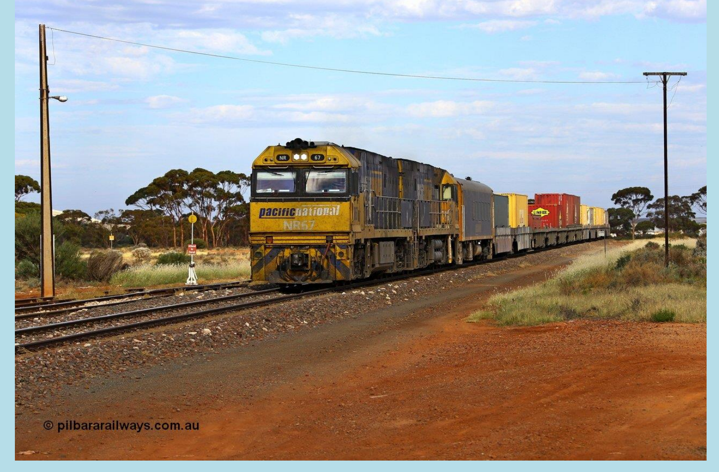
Page 2 of 14 Extra North 002

Parkeston, Q 4007 arrived as 4C73 from West Kalgoorlie and waits to collect the Cockburn cement loading. Below 2MP5 intermodal arrives passing the 1777 km behind NR 67 and NR 88 with BRS 221 crew coach.