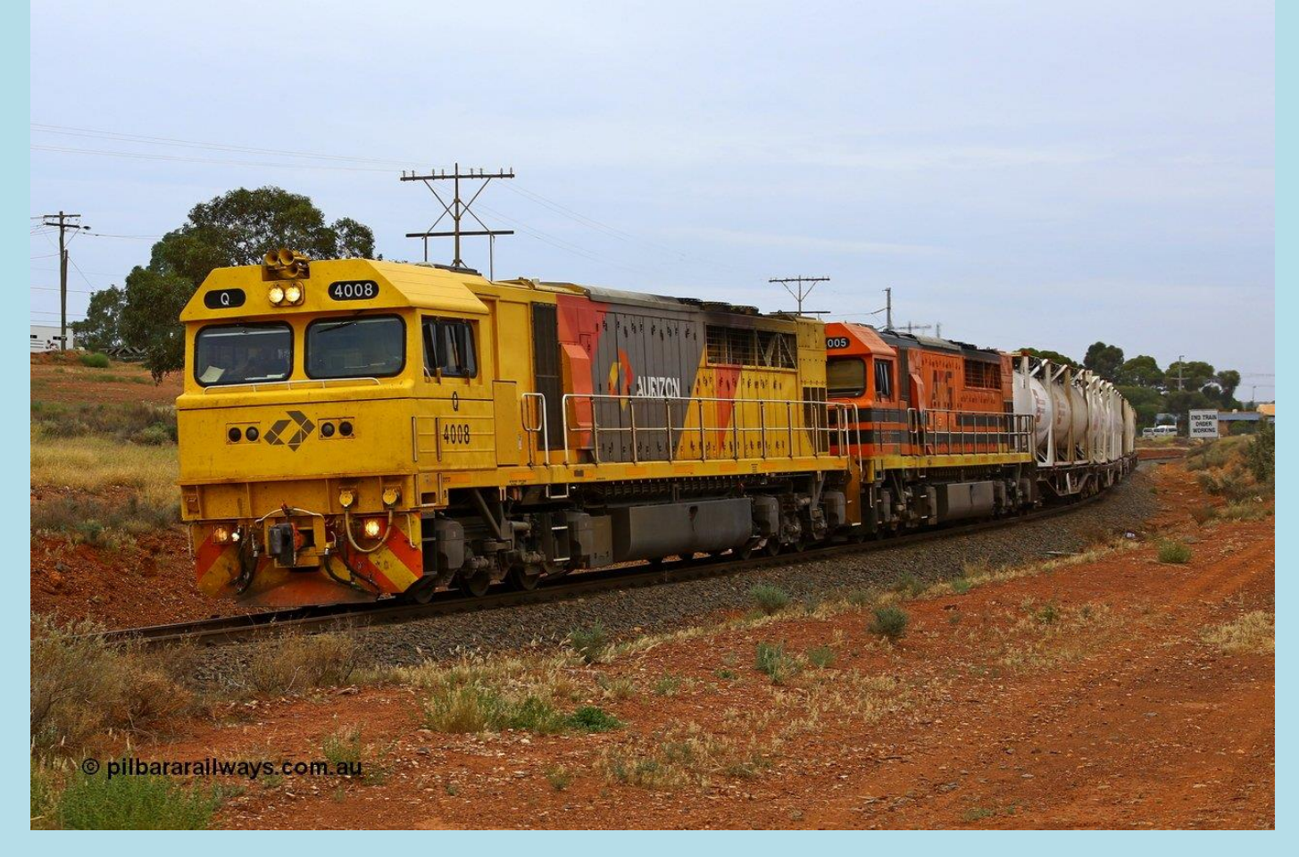
Page 4 of 14 Extra North 002