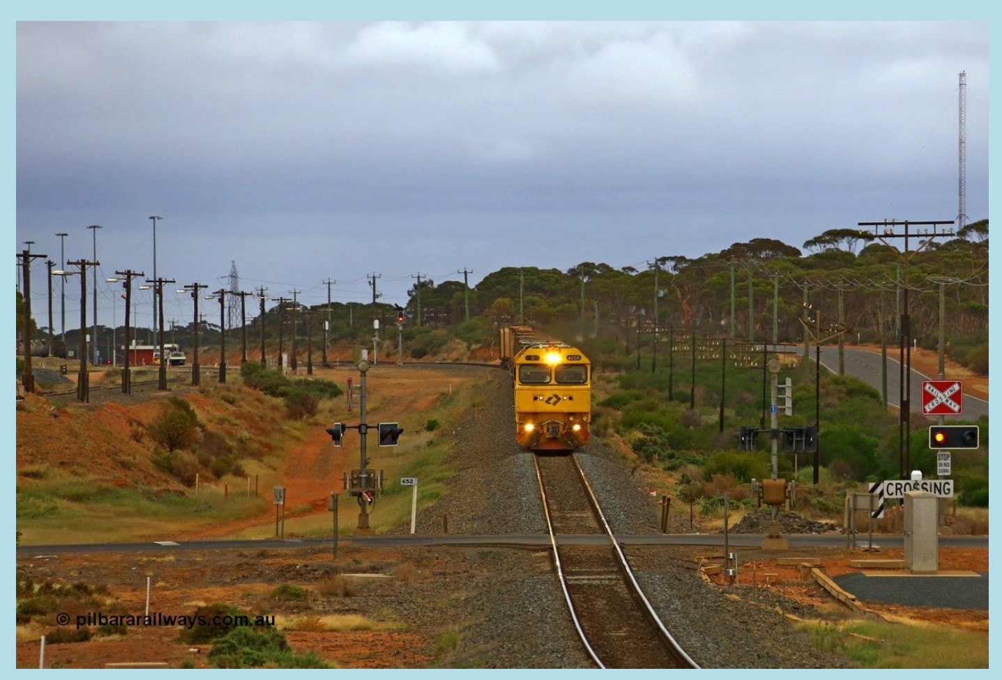
On the 9<sup>th</sup> April 2021 Malcolm bound 5029 Murrin Murrin freighter gets away from West Kalgoorlie at Gateacre Drive behind the pairing of Q 4006 and Q 4019 with 35 vehicles for 2745 tonnes and 595 metres.