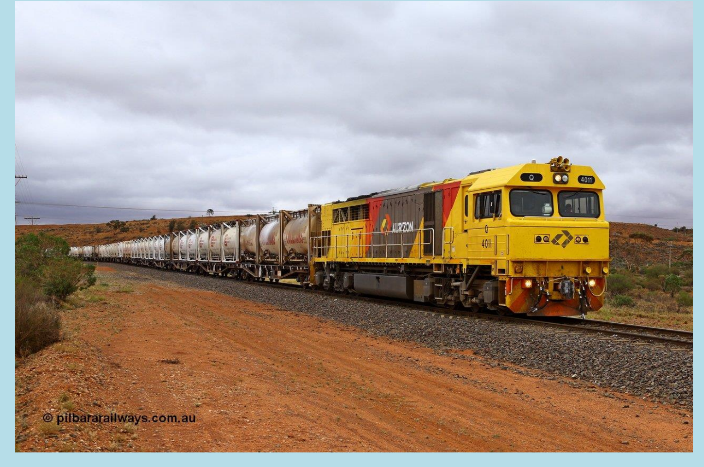
Page 13 of 14 Extra North 002

Binduli loaded iron ore 6033 mid-train units CF 4407 'Rainbird' and ACC 6031, 107 waggons back with 53 waggons behind. On approach to Parkeston is Q 4011 leading 6C71 cement and lime shunt at Yarri Road.