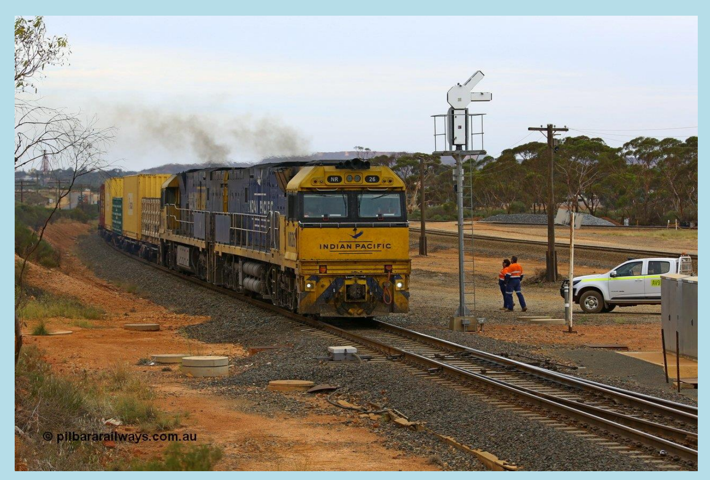
West Kalgoorlie, PN priority service 4MP7 behind NR 26 and NR 63 with 38 vehicles for 3244 t and 1760 m in length. Below 4PM4 with solo NR 14 and RZAY 985 with 46 vehicles for 1670 t and 1043 m.