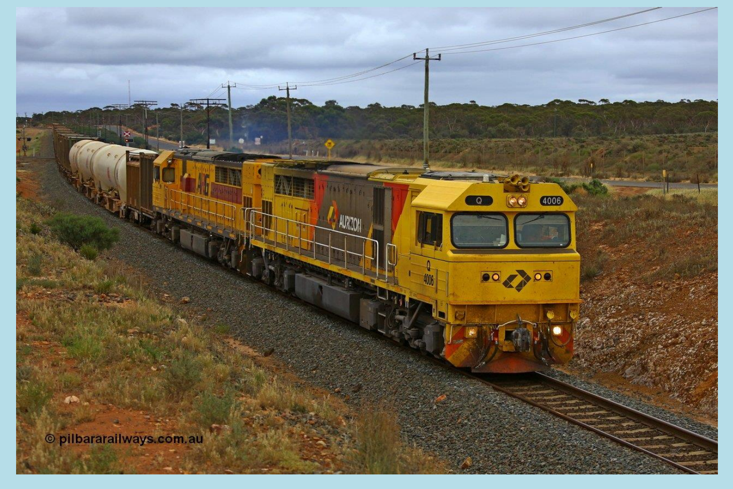
Page 11 of 14 Extra North 002