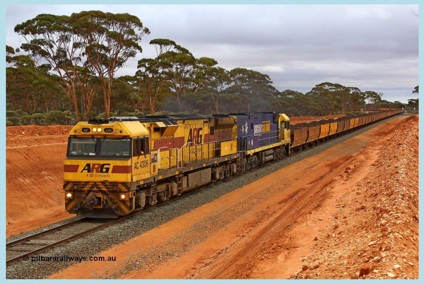
Page 12 of 14 Extra North 002 - copyright remains with the photographer.

Kalgoorlie freighter 5025 arrives at West Kal with Q 4009 and Q 4011, load is still 62 vehicles even though the acid and nickel are now with Watco. Below Binduli loaded ore train 6033 with AC 4306 and NR 71.