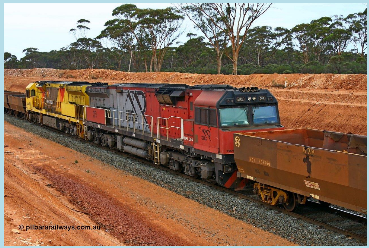
Page 6 of 14 Extra North 002

At Binduli with the Lefroy Bridge in the background sees empty ore train 5040 arriving behind AC 4307 and MRL 006 'Merredin Express' and mid-train units MRL 004 'Polaris Express' and ACB 4404 with 160 waggons.