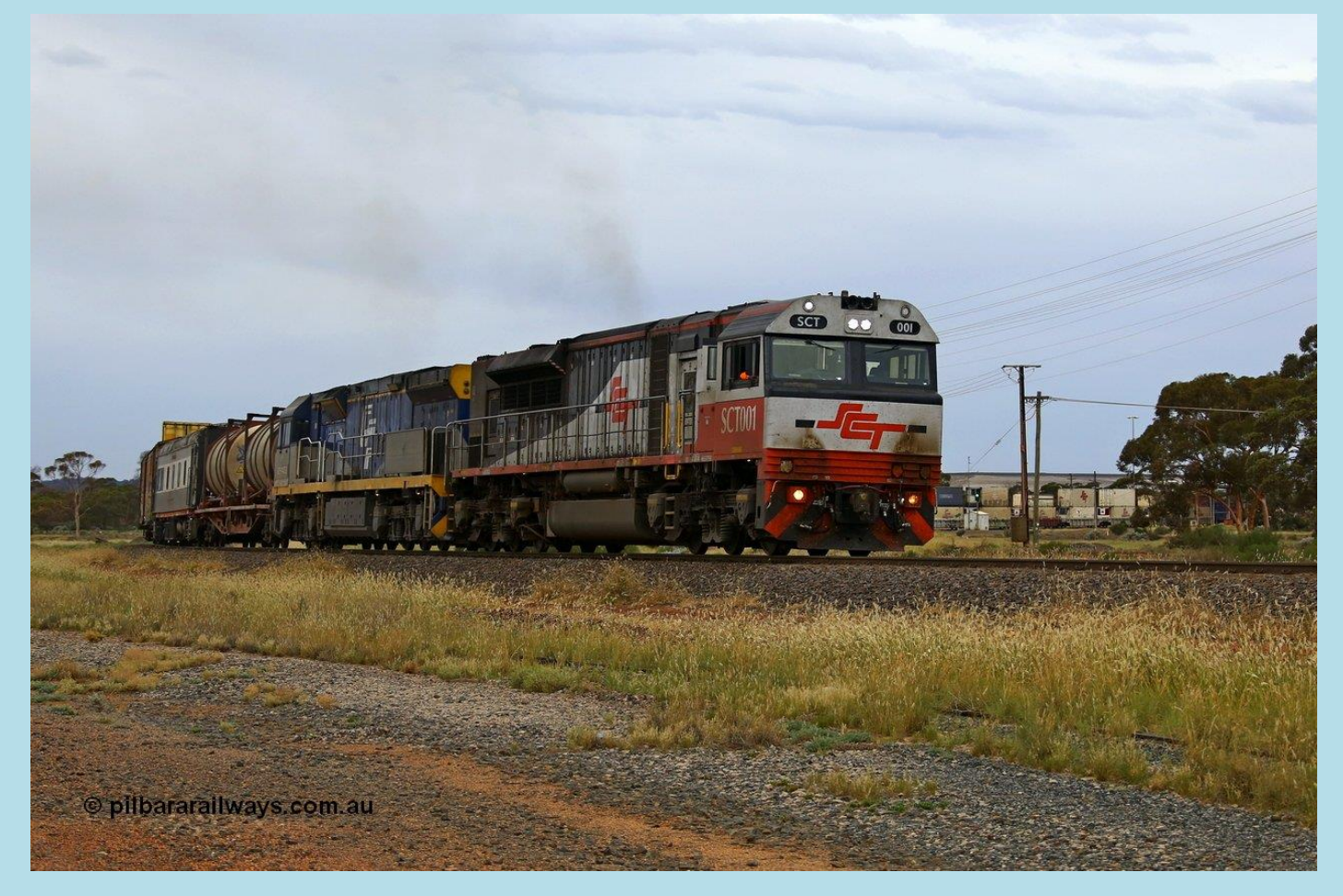
Page 8 of 14 Extra North 002

Two views of SCT train 3MP9, SCT class leader SCT 001 with lease unit CF 4403 'Even Stevens' and PSDS 2280 'Peterborough Boys' crew coach departs Parkeston for Perth with 70 vehicles for 5613 t and 1795 m.