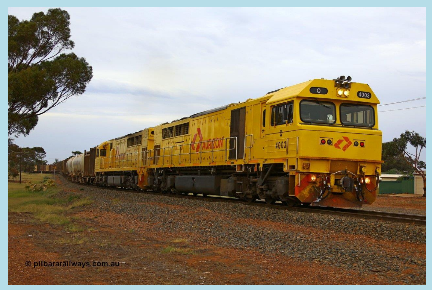
On the 8<sup>th</sup> April 2021 Q 4003 and Q 4016 lead Malcolm freighter 4029 as it parallels St Albans Rd on the Leonora line. Below Q 4008 and Q 4005 lead 5C71 Cockburn Cement shunt to Parkeston at Sutherland St.